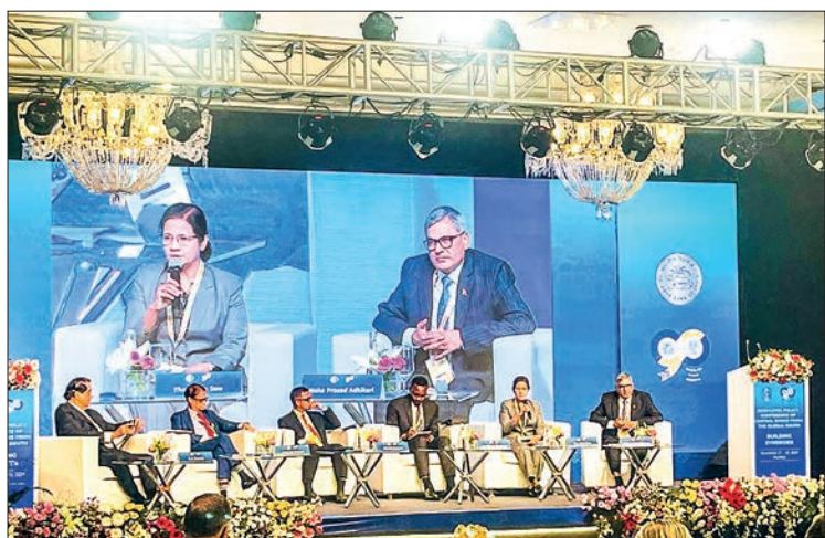
Central Bank of Myanmar Governor Daw Than Than Swe participates in the High-Level Policy Conference of Central Banks from the Global South organized by the Reserve Bank of India in Mumbai from 20 to 22 November.

THE Myanmar delegation led by the Central Bank of Myanmar Governor attended the