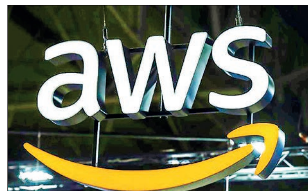
AWS cloud computing unit at Amazon will work with Anthropic on chips and systems to optimize training of artificial intelligence.

"We'll keep pushing the boundaries of what customers can achieve with generative AI technologies." — AFP