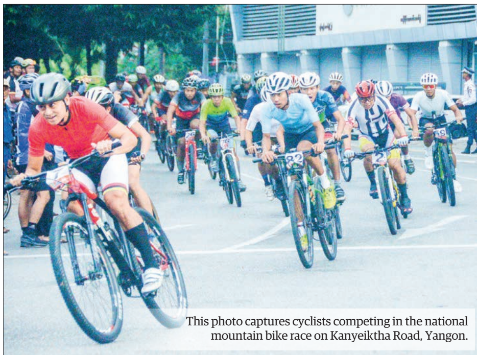
This photo captures cyclists competing in the national mountain bike race on Kanyeiktha Road, Yangon.

The first-place winner received K500,000, while the second and third were awarded K300,000 and K200,000, respectively. Cyclists who placed fourth and fifth received K150,000 and K100,000, while participants finishing from sixth to tenth each received K50,000.