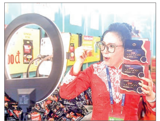
A staff member promotes Vietnamese coffee products via livestreaming during the 19 th China-ASEAN Expo at the Nanning International Convention and Exhibition Centre in Nanning, south China's Guangxi Zhuang Autonomous Region, 19 September 2022.

He said Vietnam looked to transform wholesale and retail sale from physical stores to digital stores in order to earn higher values and increase efficiency. — Xinhua