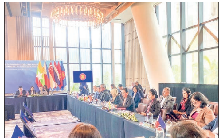
The 18 th Meeting of High-Level Task Force on ASEAN Community's Post-2025 Vision in progress in Singapore on 19-23 November 2024.

The 18 th HLTF-ACV Meeting was co-chaired by Eminent Persons (EP) of Lao PDR and Malaysia, as the permanent shepherd Member State, and attended by Eminent Persons, High-Level Representatives and officials from the ASEAN Member States, representatives from Timor-Leste as well as ASEAN Deputy Secretary-General for APSC and officials from the ASEAN Secretariat.