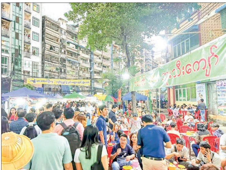
Yangonites enjoying the hustle and bustle of the Yegyaw festival on 22 November.

Yegyaw festival was last held in 2019 before the COVID-19 pandemic, and it resumed for the first time in 2024. Locals stated that streets in their wards were overcrowded again with visitors on 22 November. Yegyaw Funfair and Night Bazaar, one of the most popular and crowded festivals in Yangon, used to be held every year during the Thadingyut holidays. — MT/ZN