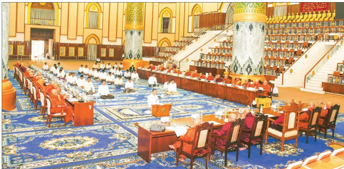
The second-day session of the 18 th plenary meeting of the Eighth 47-member State Sangha Maha Nayaka Committee in progress in Yangon yesterday.

State Sangha Maha Nayaka Committee Chairman Dr