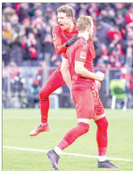
Harry Kane (R) of Bayern Munich celebrates his third goal with teammate Thomas Mueller during the German first division Bundesliga football match between Bayern Munich and FC Augsburg in Munich, Germany, 22 November 2024.