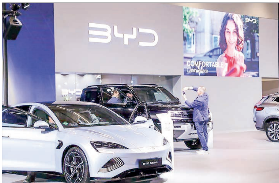
People take pictures at the booth of BYD at the Automechanika in Frankfurt, Germany, 11 September 2024.