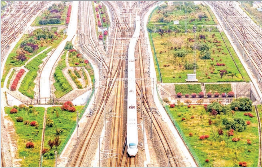
A high-speed train leaves Nanjing South Railway Station in Nanjing, Jiangsu province, on 7 August 2020.