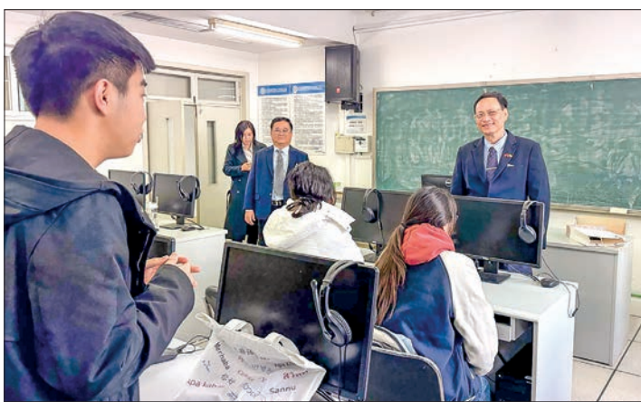
Deputy Minister Dr Zaw Myint encourages students who were taking Myanmar language courses during Tianjin Foreign Studies University tour on 22 November.

The delegation then visited the special exhibition at the conference. In the afternoon, they attended a seminar titled “Integrating Work