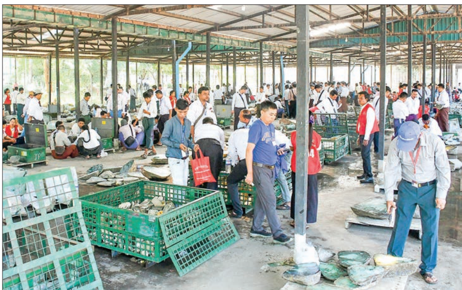
Gem merchants seen viewing and evaluating gem stones at the 2024 Mid-Year Myanmar Gems Emporium yesterday.

THE 2024 Mid-Year Myanmar Gems Emporium entered its sixth day yesterday. Held at the Maniyadana Jade Hall in Nay Pyi Taw, the event attracted both local and international gem traders. Throughout the day, the traders explored the diverse range of jade sets on display.