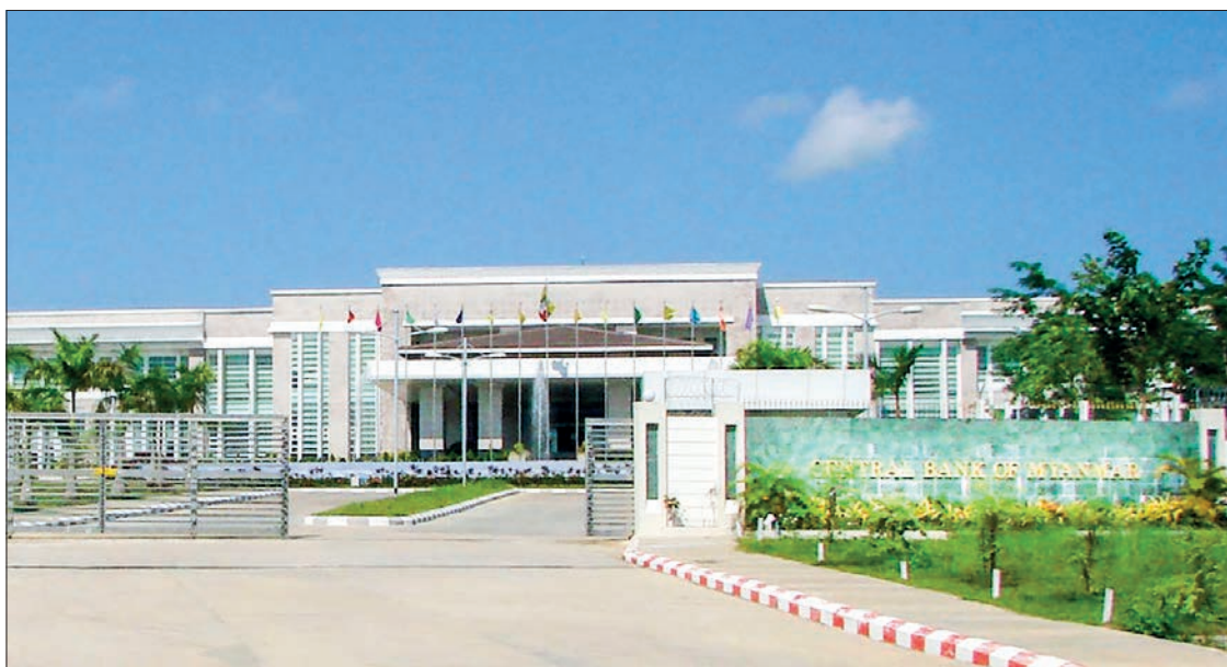
The general view of the Central Bank of Myanmar in Nay Pyi Taw.

It sold over 800,000 yuan on 11 November, over 2.17 million