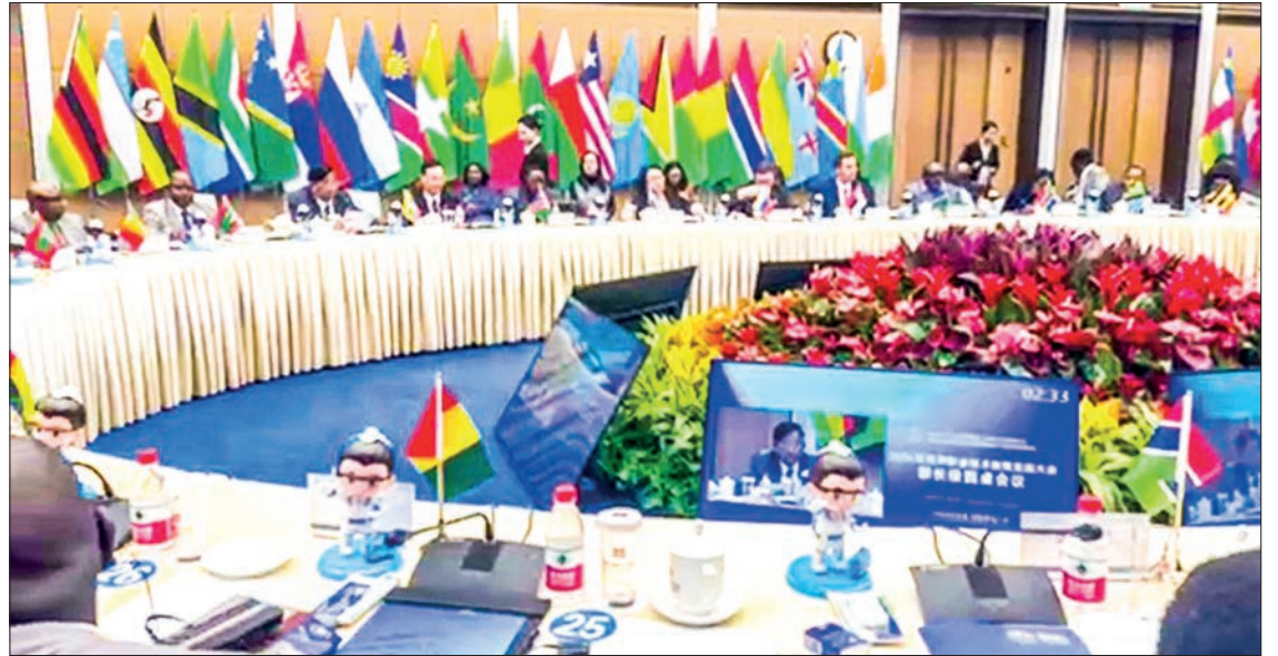
The Myanmar delegation led by Union Minister Dr Charlie Than attends a ministerial-level roundtable discussion.

Union Minister Dr Charlie Than then attended a ministerial-level roundtable discussion, which focused on the collaboration between 13 ministries in