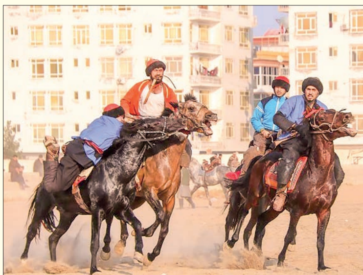
Afghan horse riders compete in a Buzkashi game in Balkh province, Afghanistan, 22 November 2024.