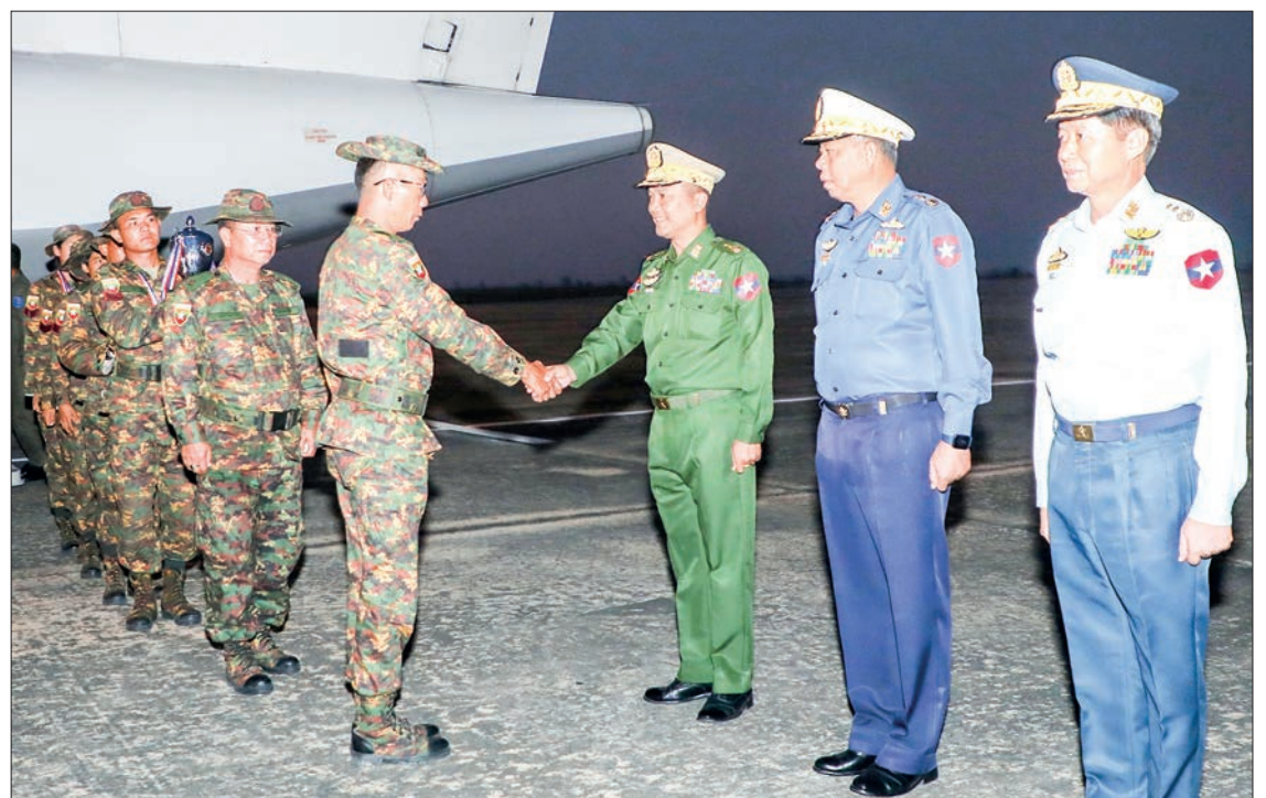
The Myanmar military shooting team being welcomed back at Nay Pyi Taw airport yesterday.

The team excelled in individual competitions, earning one silver and six bronze medals. In