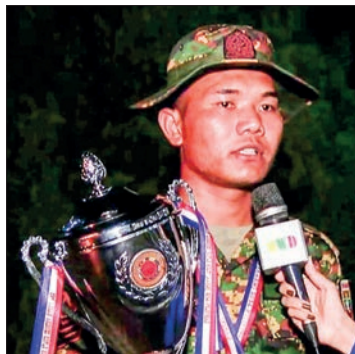
A contestant who won two gold medals.