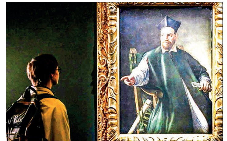
'Portrait of Maffeo Barberini' by Italian master Caravaggio goes on display to the public for the first time.

Displayed at the Barberini Palace, which houses several of Caravaggio's works, this portrait is rare, with only a handful of Caravaggio's portraits known. — AFP