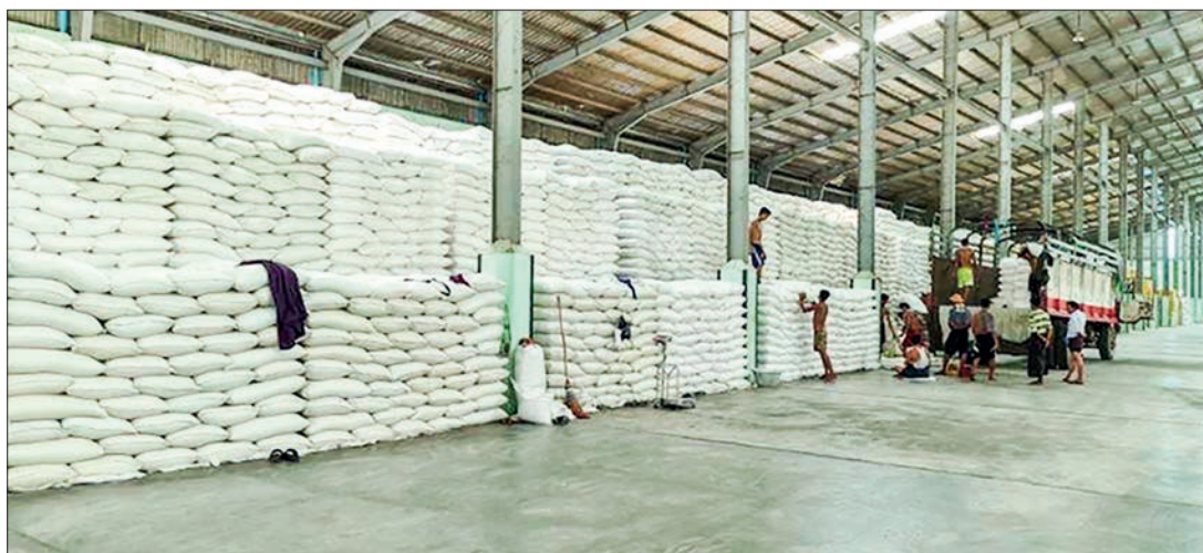
Workers meticulously organize rice bags in a warehouse.

Patrons can enjoy a special registration price of 15,000 rupees. Nonmembers can contact IPGA for the patronship and individuals can enquire about details of the events through www.ipga.co.in or thepulseconclave@ipga.co.in . Myanmar businesspeople can contact the Myanmar Trade Promotion Organization at 067 408622 or email event.td.myantrade@gmail.com . — NN/KK