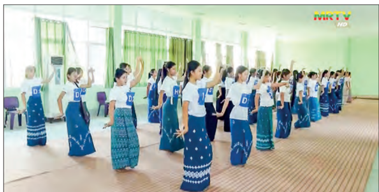
This photo showcases students from the National University of Arts and Culture (Yangon) practising dance for the Fifth National Sports Festival 2024.