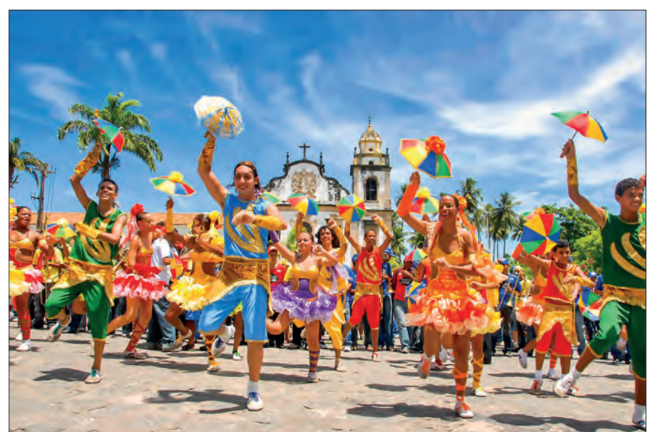
In Brazil, school children showcased a vibrant cultural performance, celebrating the country's rich traditions and heritage.

TV BRICS noted that the student community activists from MGIMO will assist in preparing for the event. — ANI