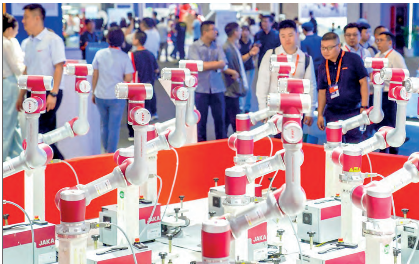
Visitors admire robots on display at the China International Industry Fair in Shanghai.