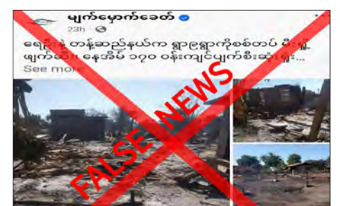
This screenshot validates misinformation.

The official confirmed that security forces were committed to protecting civilian lives, homes, and property. The real threat came from terrorists who had taken refuge in the villages, obstructing peace efforts and stability. These insurgents have reportedly been attacking civilian structures like schools and homes to disrupt peace and security in the region. Malicious media outlets, the statement added, are spreading false information to cover up the terrorists violent activities and mislead the public regarding the actions of security forces. — MNA/KZL