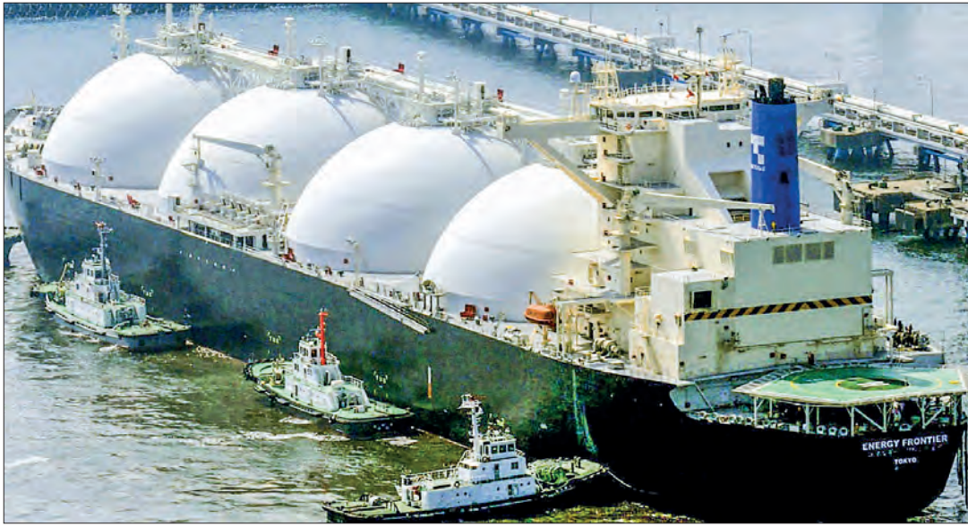
Sakhalin-2 is a major liquefied natural gas (LNG) project located on Sakhalin Island in the Russian Far East. It involves the extraction of natural gas and oil from offshore fields and the liquefaction of this gas for export.