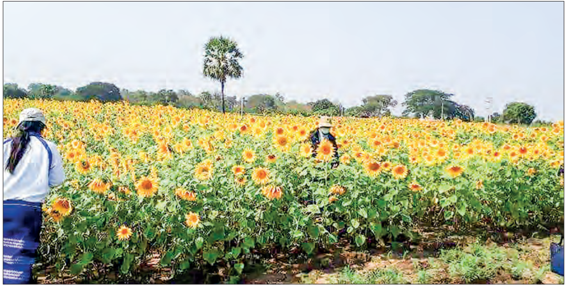
The staff from the township agriculture department is conducting awareness activities for the sunflower growers to improve sunflower yield and cultivate good quality sunflower seeds under the GAP farming system.

The department aims to achieve 500 acres of sunflower in Homalin District, 150 in Kani, 200 in Naga, 8,000 in Mawlaik, 3,300 in Tamu, 71,570 in Kalay, 31,300 in Monywa, 83,650 in Yinmabin, 6,500 in Shwebo, 15,250 in YeU, 4,280 in Kanbalu, 61,500 in Sagaing, 27,700 in Katha and 13,100 in Kawlin, totalling 327,000 acres. — District (IPRD)/KK