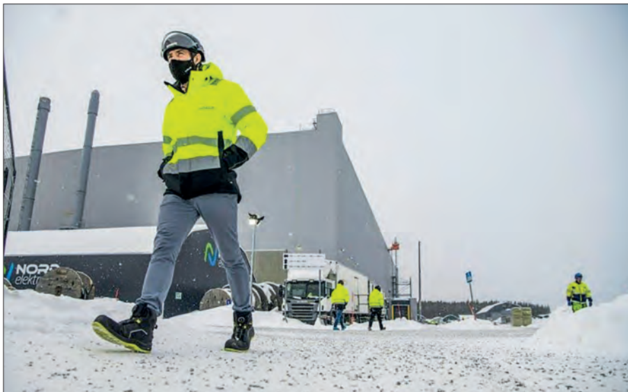
Northvolt said in September it was slashing 1,600 jobs — a quarter of its staff — and suspending the expansion of its site, as it struggled with strained finances and a slowdown in demand.

"By enabling the company to restructure its debt, appropriately scale the business to current customer needs and secure a sustainable foundation for continued operation, these Chapter 11 filings will help Northvolt to implement the decisions made as part