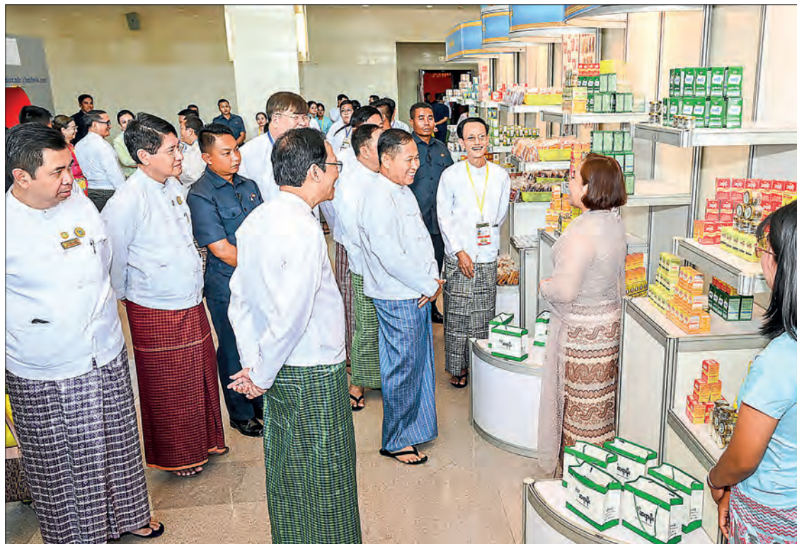
State Administration Council Vice-Chair Deputy Prime Minister Vice-Senior General Soe Win tours the booth and exhibition at yesterday's event.

At the ceremony, a video message was sent by SAC Chairman Prime Minister Senior