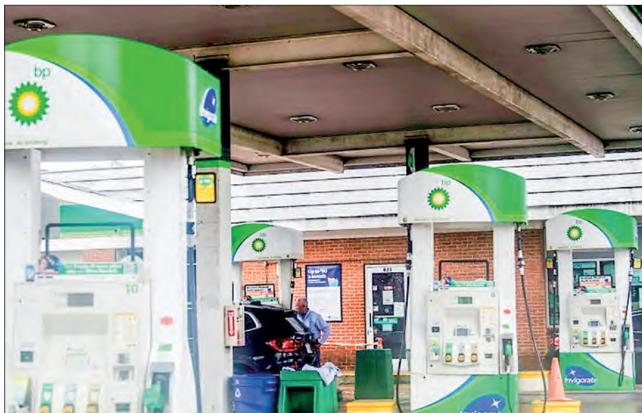
BP has pledged to achieve net-zero emissions by 2050.

"This project not only unlocks a fantastic gas resource, it also represents an Indonesian first through the use of CCUS to maximize gas recovery," Auchincloss said. — AFP