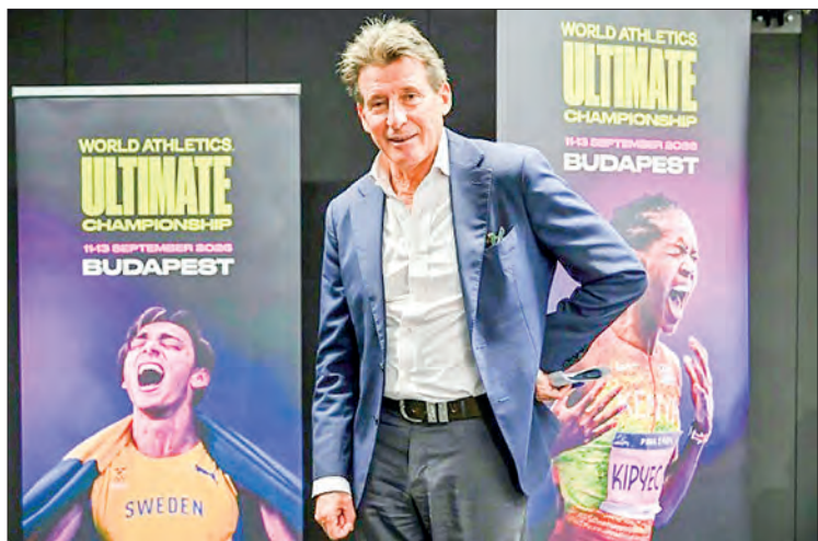
World Athletics President Sebastian Coe says the Ultimate Championship will be 'high-octane' entertainment.

"We want to bring our fans athletics like they have never seen it before — with the best of the best athletes in our sport competing head-to-head in a passion-fuelled, high octane, festival of sport, with sound, light and innovation." — AFP