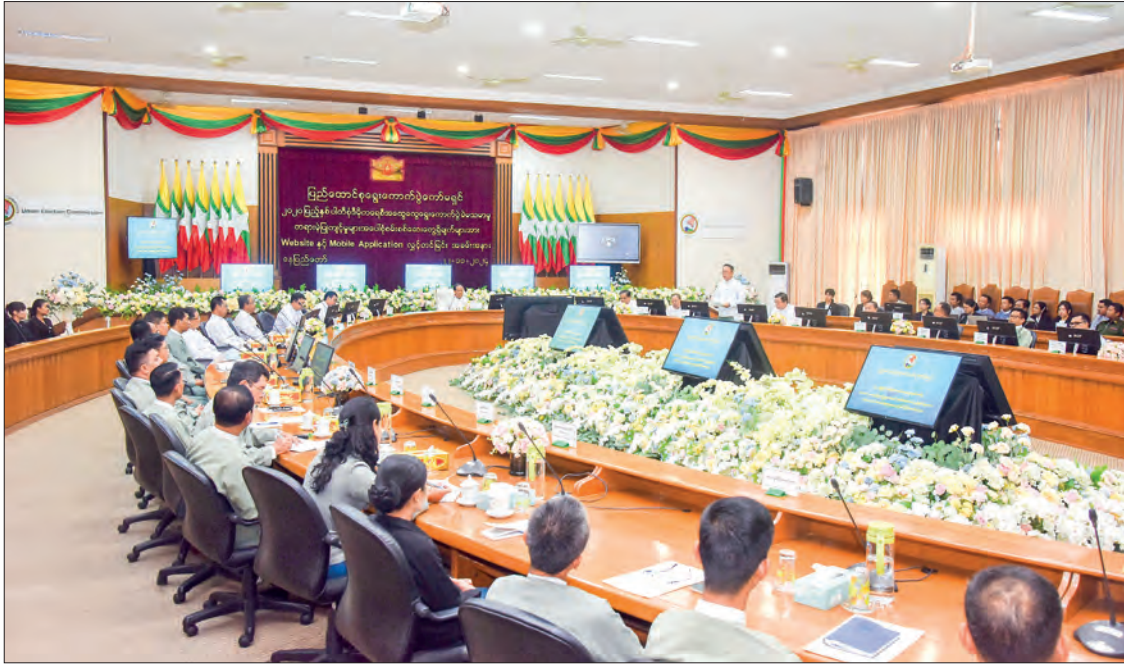
The ceremony to unveil the website and mobile application in progress yesterday.

THE ceremony to launch the website and mobile application presenting findings on fraud and illegal practices from the 2020 Multiparty Democracy