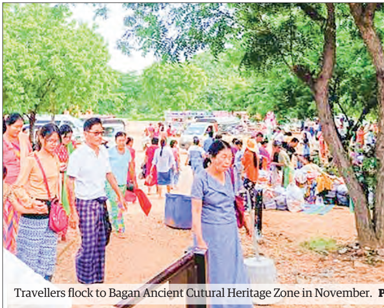
Travellers flock to Bagan Ancient Cultural Heritage Zone in November.

The Bagan Ancient Cultural Zone is now ready with the festivals of Nadaw and Pyatho expecting a surge in the arrivals of local and foreign travellers. — Nyein Thu (MNA)/KTZH