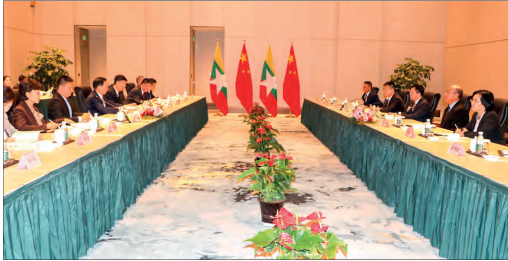
The meeting between Union Minister U Myint Kyaing and Chinese Vice-Minister Public Security Mr Xu Ganlu in progress on 21 November.

UNION Minister for Immigration and Population U Myint Kyaing, accompanied by Myanmar Consul-General U Thwin Htet Lin, received Mr Xu Ganlu, Vice-Minister of the Ministry of Public Security of China, at Shang Shui Ballroom of Double Tree Hilton Hotel in Kunming, Yunnan Province, on 21 November.