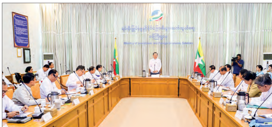
The 2/2024 meeting of the ASEAN Economic Community (AEC) 2025 Implementation Committees in progress, led by Union Minister Dr Kan Zaw.

Twenty-two working committees were established for the effective implementation of the ASEAN Economic Community (AEC) 2025, which was led by deputy ministers and permanent secretaries from the relevant ministries. — MIFER