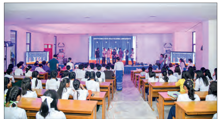
The second-day programme in action at Naypyitaw State Polytechnic University yesterday.

In the morning, Dr Myo Thein Kyaw, Union Minister for the Ministry of Science and Technology and Chairman of the Engineering Education Centennial Celebration Steering Committee, observed the ongoing Engineering Battle Competition alongside officials, students,