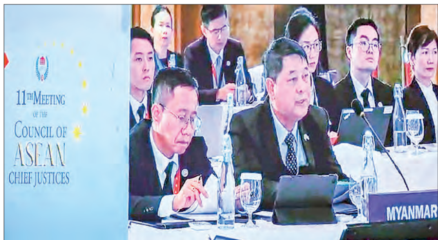
Myanmar's Chief Justice of the Union U Tha Htay (R) is pictured during CACJ Meeting in Cebu, the Philippines, on 19-20 November 2024.