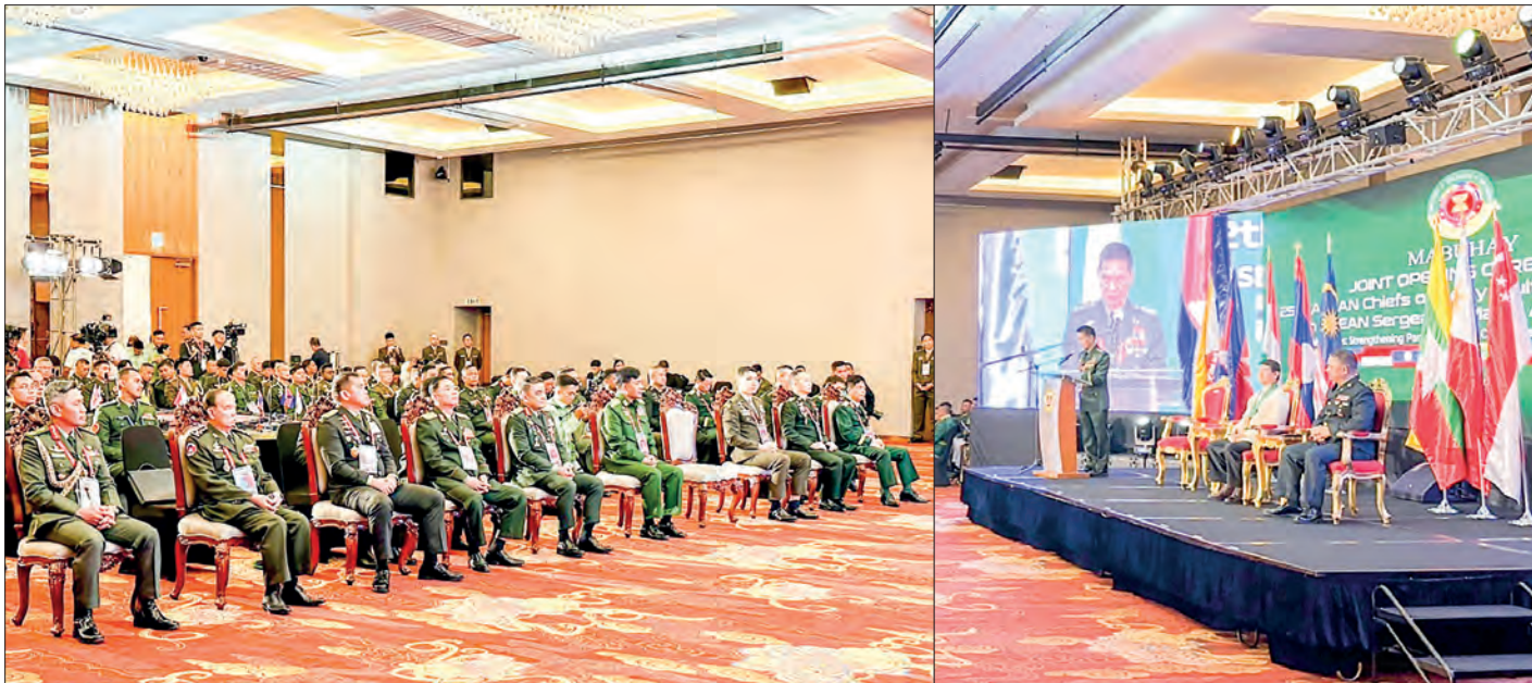
Chief of the General Staff (Army, Navy, and Air) General Maung Maung Aye speaks on the occasion of the 25 th ASEAN Chiefs of Army Multilateral Meeting in the Philippines on 21 November 2024.

ON behalf of State Administration Council Vice-Chairman Deputy Commander-in-Chief of Defence Services