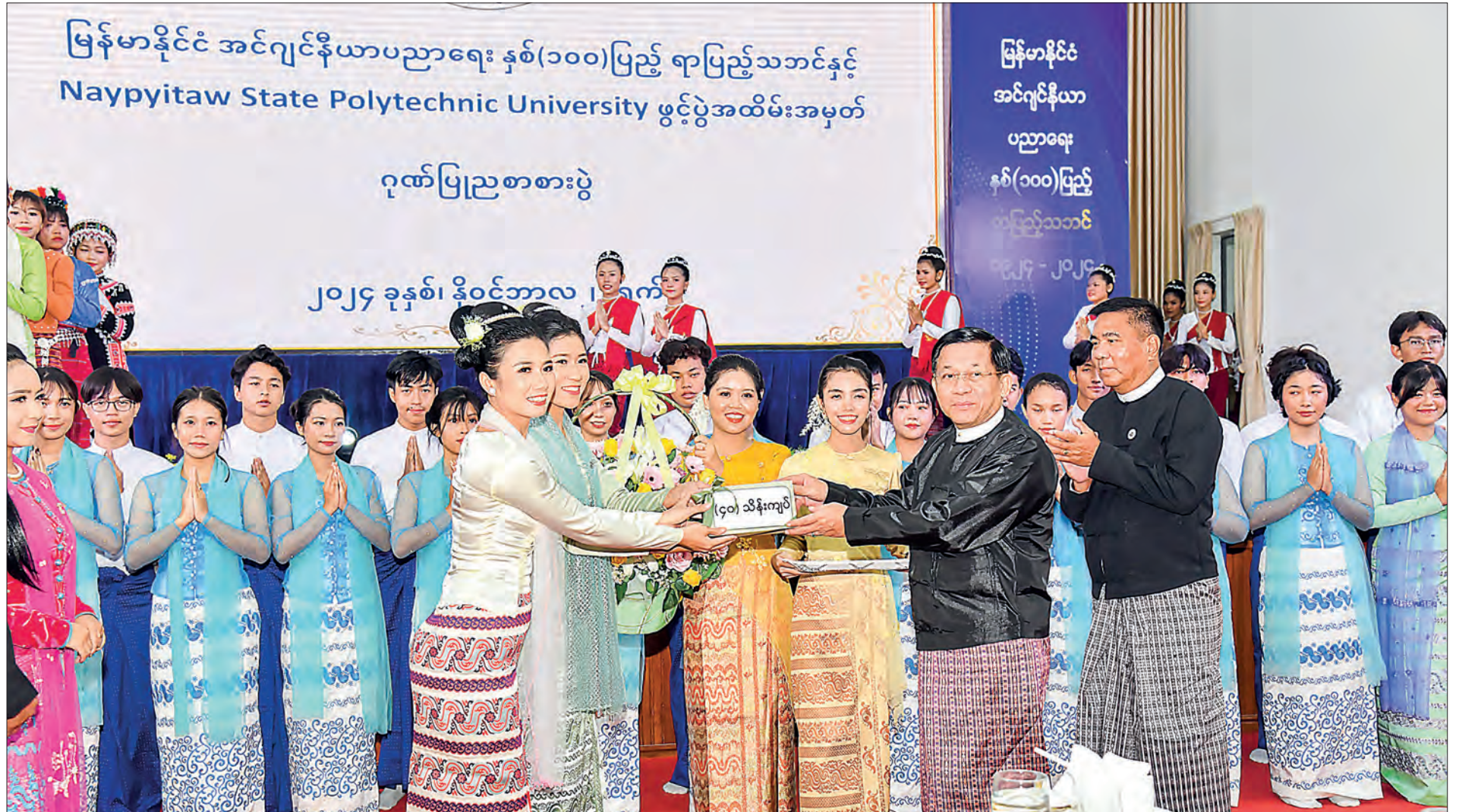
State Administration Council Chairman Prime Minister Senior General Min Aung Hlaing presents cash awards to traditional dance performers and artistes during yesterday's dinner event.