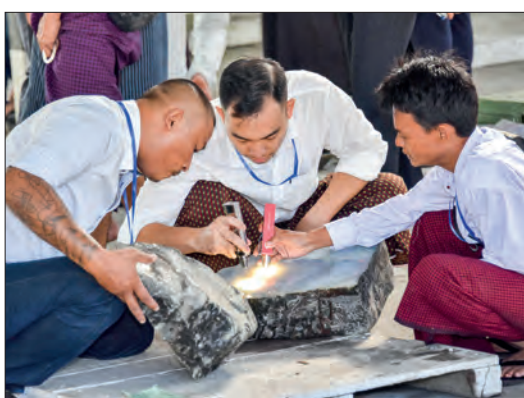
Gem merchants evaluate jade stones at yesterday's emporium.

The 2024 Mid-Year Myanmar Gems Emporium is scheduled to run from 18 to 27 November. A total of 208 pearl lots, 62 gem sets,