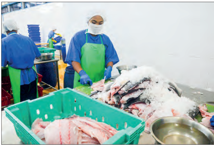
Workers diligently process fisheries products.

Myanmar steadily exports seafood to 40 countries including China, Thailand, Bangladesh and Japan through maritime and border trade channels. Myanmar Fisheries Federation and Fisheries Department joined hands to bolster fisheries ex-