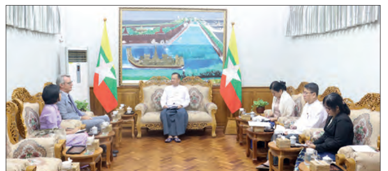
The new WFP Country Director and Representative to Myanmar calls on Union Minister Dr Kan Zaw yesterday.

and 613 jade lots have been sold to local and international merchants. The remaining jade lots will be sold through the open tender system. A total of 2,240 jade lots from Group C are being sold through the open tender system to promote MSME entrepreneurs, and only local gem traders are allowed to purchase using Myanmar currency. — MNA/TRKM