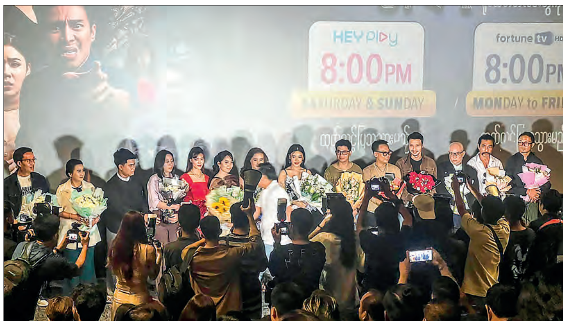
This photo depicts the press show of the TV series 'Atta Lun'.