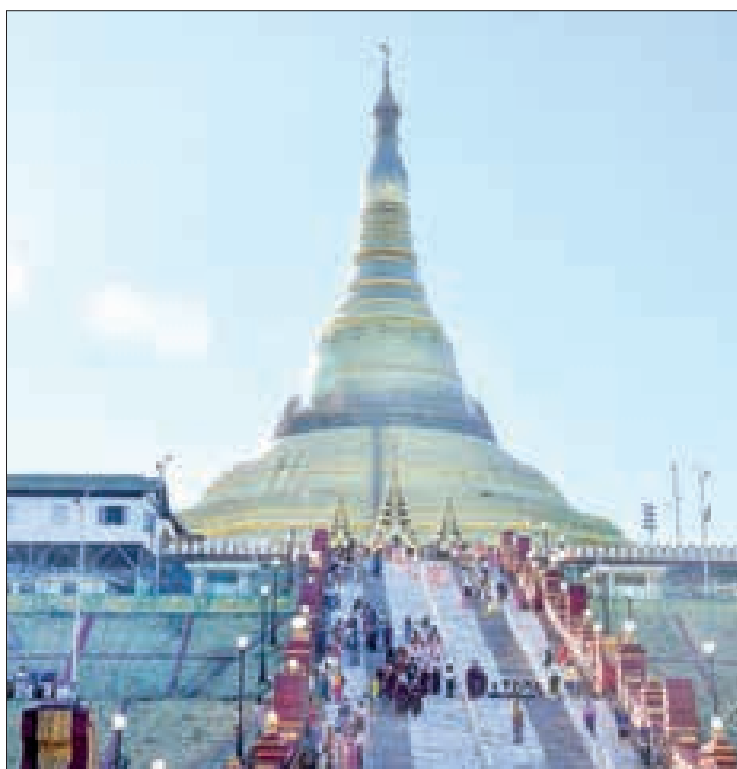
Devotees are seen at the Uppatasanti Pagoda.

Since the Tazaungdine festival falls on a public holiday, many people from surrounding areas visit the pagodas and shrines in Nay Pyi Taw. Pop-