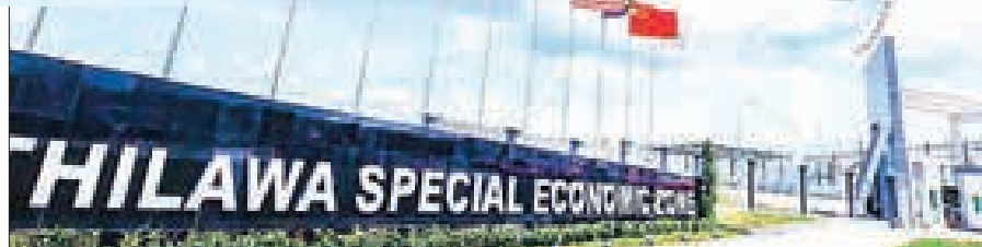
A general view of the entrance to the Thilawa Special Economic Zone.

The Myanmar Investment Commission gave the green light to 33 foreign projects from seven countries (China,