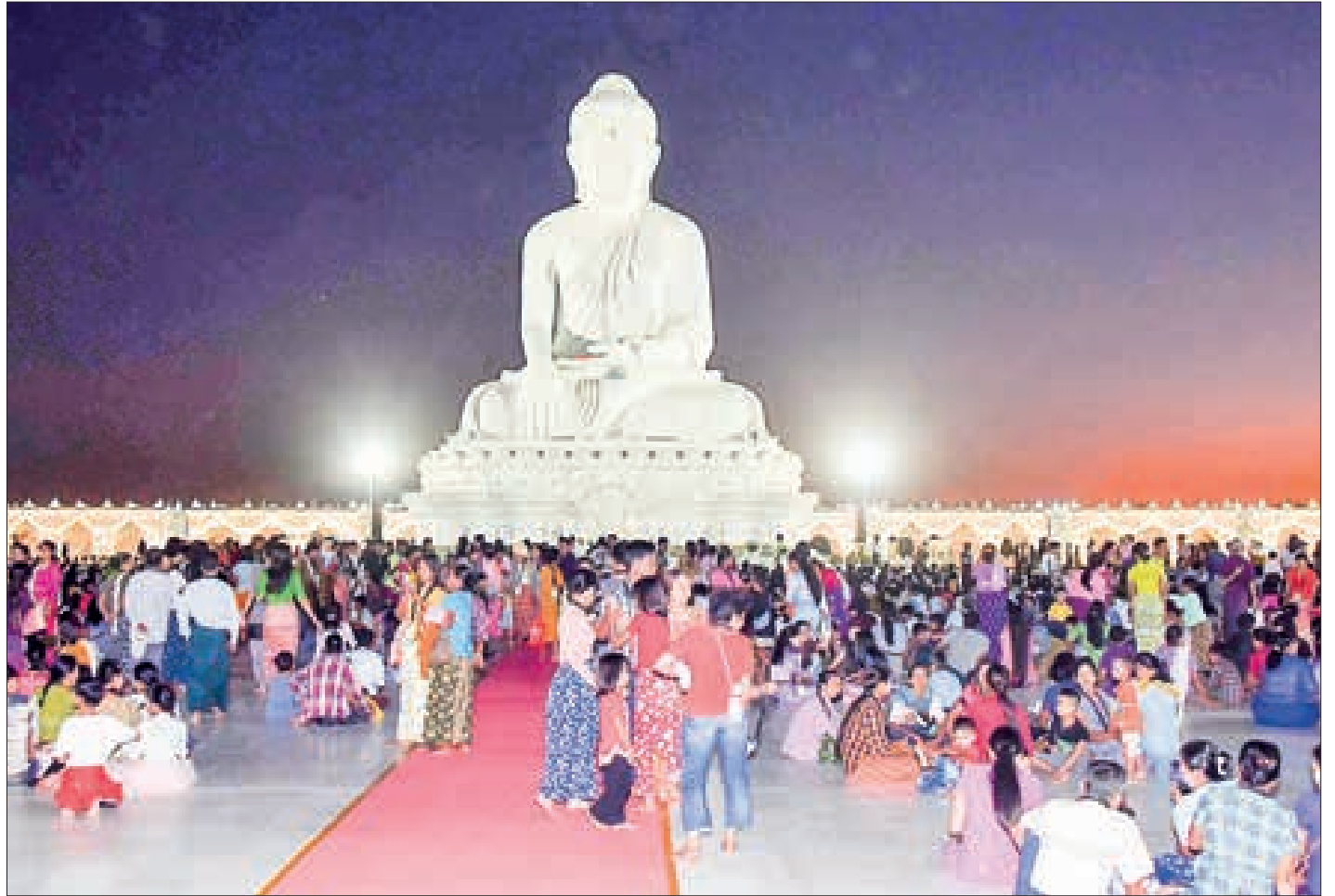
Photos depict pagoda-goes and festival-goers on pilgrimage to the Maravijaya Buddha Image (above) and enjoying festivities (below) on the Full Moon of Tazaungmone.