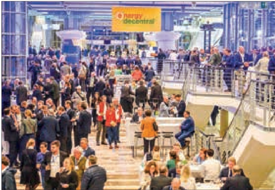
This image depicts attendees of the Energy Decentral 2024 Official Opening Tour.