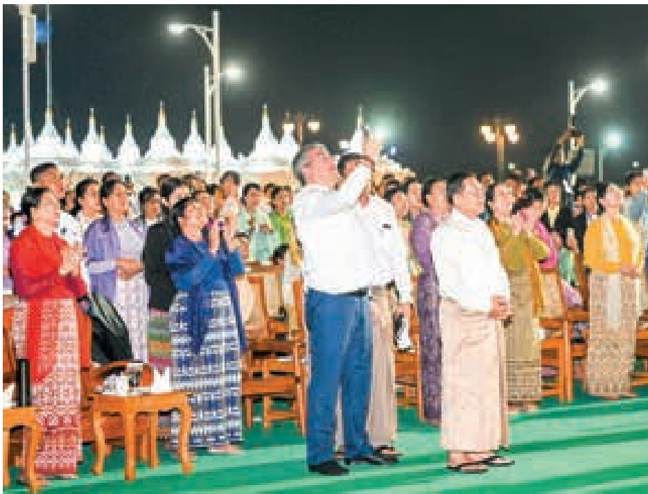
The Senior General and Buryatia Republic Chair from Russia watch the ascent of a hot-air balloon in honour of the latter.

Office of the Commander-in-Chief and their wives, the commander of Nay Pyi Taw Command and officials, contestants from regions and states including Nay Pyi Taw Council Area in the hot-air balloon contest and lotus robe-weaving contest together with pilgrim monks and people.