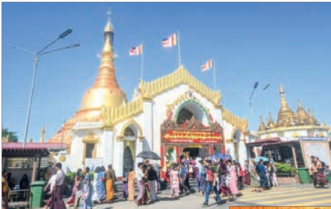
Photos showcase devotees and worshippers on pilgrimage to Yangon's prominent pagodas on the Full Moon of Tazaungmone.

Following this, the chief minister and officials offered golden robes to the precious Buddha image on the upper terrace of