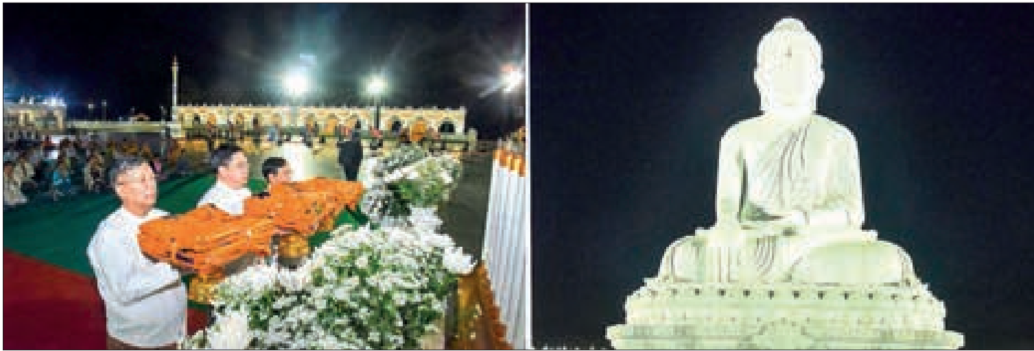
SAC Members, Union Ministers and dignitaries attend the ceremony to offer golden robes to the Maravijaya Buddha Image.

THE grand offering ceremony of golden robes to the revered Maravijaya Buddha Image was held for the second time yesterday morning at the auspicious time in Buddha Park, Dekkinathiri Township, Nay Pyi Taw Union Territory.