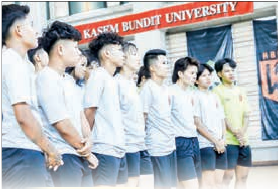
Photos showcase the Myanmar national women's futsal team training in Thailand for the tournament.

Coaches and captains from the Philippines, Indonesia, Myanmar, Thailand and Vietnam attended the press conference and answered questions from the media.