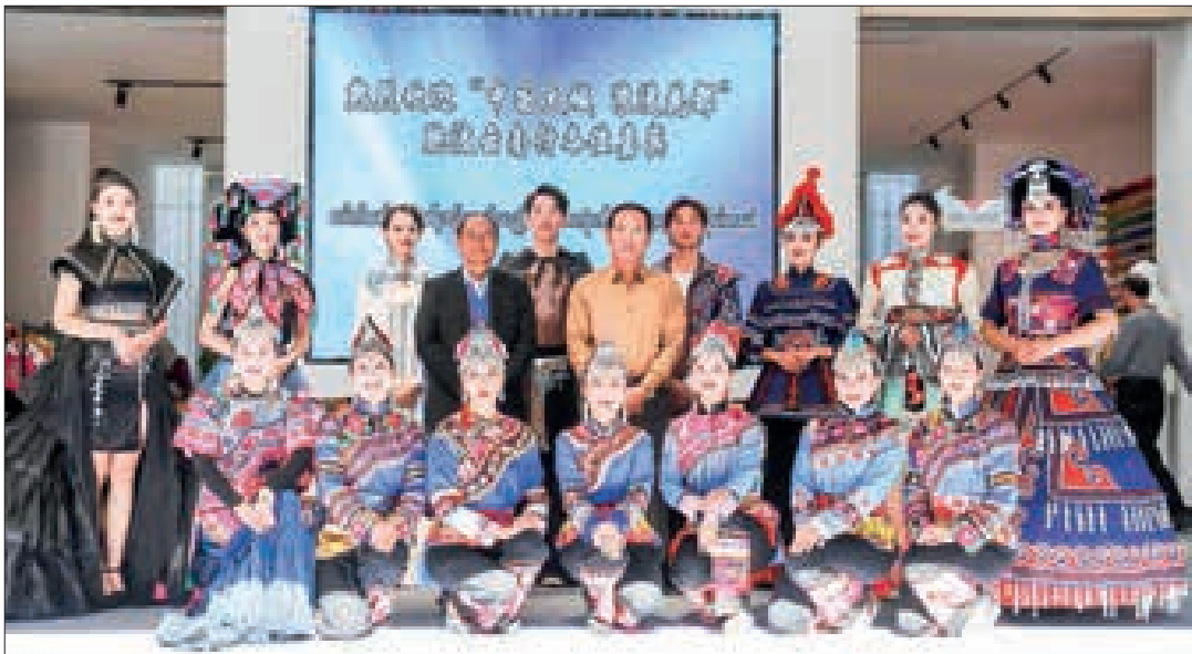
The commemorative group photo of the China-Myanmar Cultural Exchange Week and fourth Twin City Media Forum in Kunming, Yunnan Province, China, on 11-15 November.

(Excerpt from the speech given by Chairman of the State Administration Council Prime Minister Senior General Min Aung Hlaing at the ceremony of presenting awards to outstanding students who passed the matriculation examination 2024 with distinctions in all subjects on 22 July 2024)