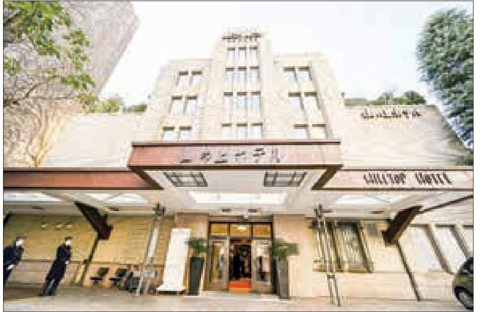
File photo taken in February 2024 shows the Hilltop Hotel in Tokyo's Chiyoda Ward, which has been closed due to its run-down condition. PHOTO: KYODO

"Although its reopening date is undetermined, we'd like to pass it on as a new symbol of the university while maintaining the building's exterior," a university official said. — Kyodo