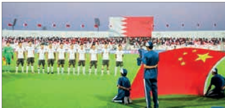
Team China line up for national anthem before the 2026 FIFA World Cup Asian Qualifiers Group C match between China and Bahrain in Riffa, Bahrain, 14 November 2024.

The home side had a penalty appeal in the 58 th minute when Mohamed Marhoon