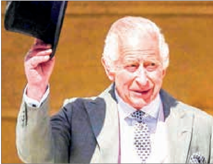
King Charles III turns 76 while undergoing cancer treatment, but remains dedicated to his royal duties.