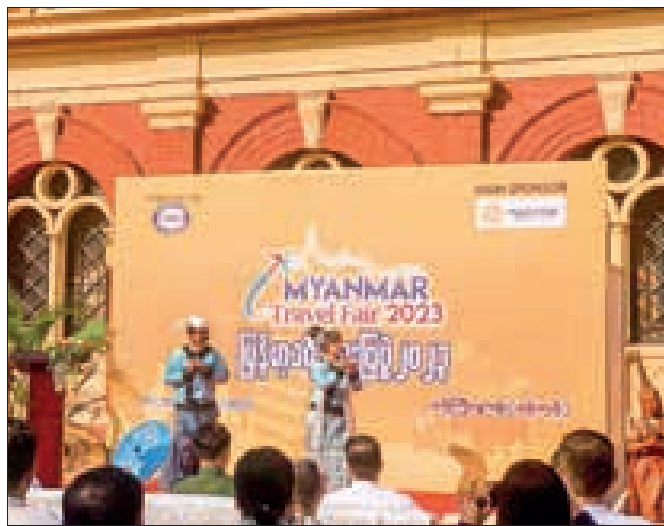
This photo depicts the Myanmar Tourism Exhibition 2023.

The Union of Myanmar Travel Association (UMTA), a sister association of the MTF, plans to hold a travel