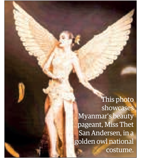
This photo showcases Myanmar’s beauty pageant, Miss Thet San Andersen, in a golden owl national costume.

ernment officials, heads and diplomats of the foreign embassies in Germany, officials of the livestock and energy sector and representatives attended the opening ceremony. — ASH/KK