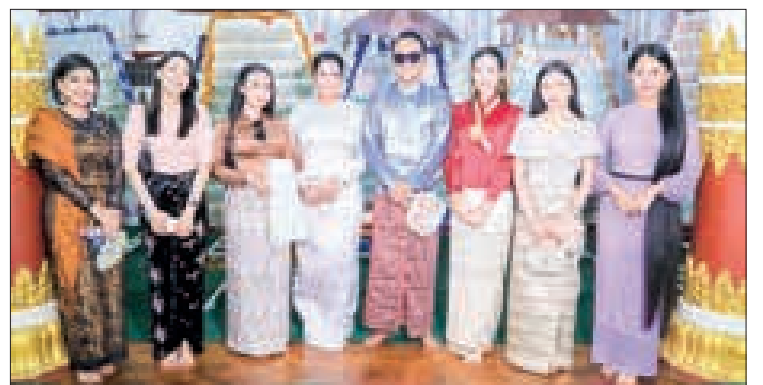
This photo depicts the 20 th communal Maha Kathina offering ceremony of MMPO.