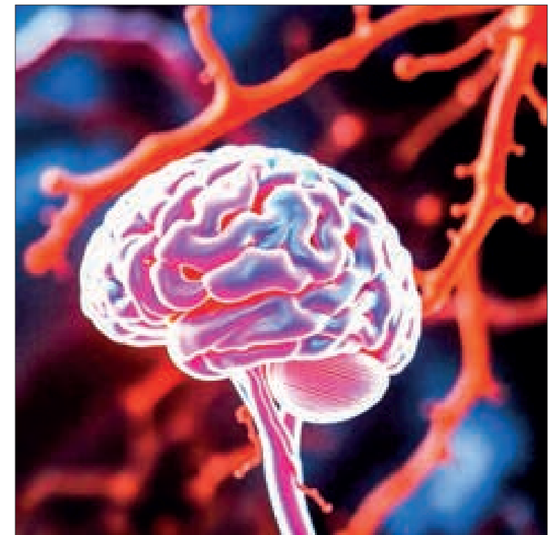
Multiple Sclerosis (MS) is an autoimmune disease where the immune system damages myelin, impairing nerve function and causing neurological symptoms.

The study utilized an experimental autoimmune encephalomyelitis (EAE) model, which mimics the inflammatory processes seen in MS. This animal model is commonly used in MS research to test potential therapeutic approaches. In the study, the researchers fed mice a diet high in palm oil and observed the effects on their disease progression. The results showed that a