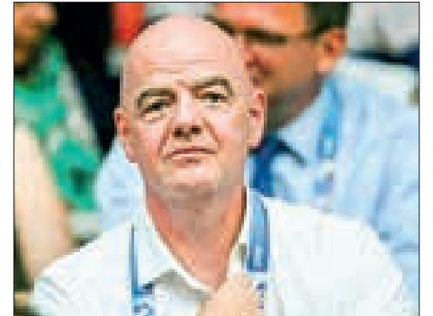
The expanded Club World Cup is the brainchild of FIFA president Gianni Infantino.

Myanmar will compete with the host Philippines on 16 November at 5:30 pm, Vietnam on 17 November at 2:30 pm, Thailand on 18 November at 5:30 pm, and Indonesia on 19 November at 2:30 pm Myanmar standard time. — Htun Htun/ZN