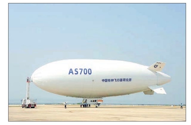
This photo taken on 29 December 2022 shows a prototype of China's independently-developed AS700 civil manned airship in Jingmen, central China's Hubei Province.

ance of 10 hours. Its designed maximum speed is 100 kilometres per hour, and it can carry up to 10 people, including a pilot. — Xinhua