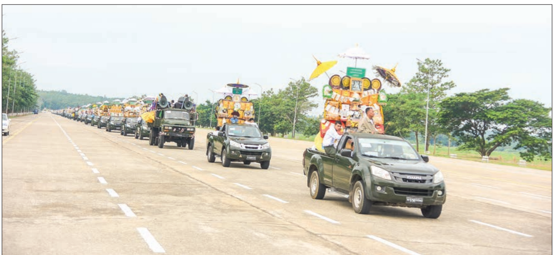
A procession of donated Kathina trees heading to Uppatasanti Pagoda at yesterday's event.

At the ceremony, Tatmadaw members and families from the offices and departments of the Office of the Commander-in-Chief (Army, Navy and Air) donated offerings worth K136,293,395 and cash K106,985,010. These offerings were conveyed to relevant monasteries by car.