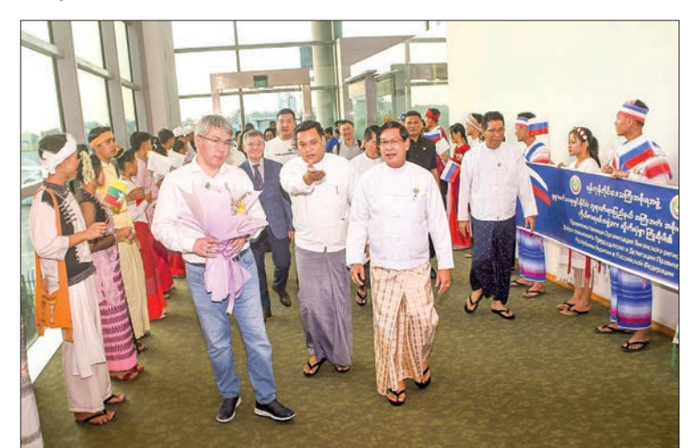
A welcome event for the Russian Buryatia delegation in progress at Yangon International Airport yesterday.

In the evening, the Yangon Region chief minister hosted a dinner in honour of the delegation at the Lotte Hotel. — MNA/ KZL