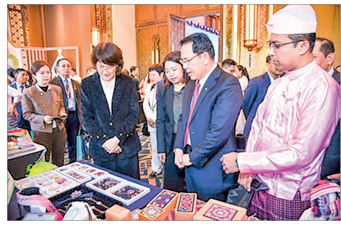
The Myanmar delegation led by Union Minister U Maung Maung Ohn (2<sup>nd</sup> R) views round the display booths during the opening event of the China-Myanmar Cultural Exchange Week in Kunming, China.

He then mentioned the efforts of the Head of State to