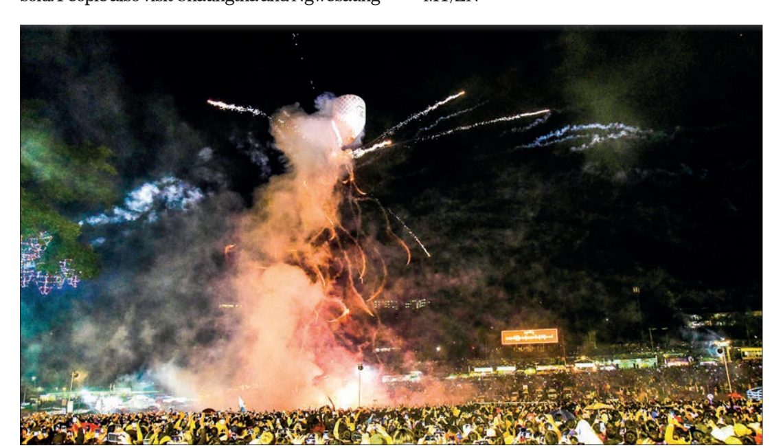
A crowd of festival-goers enjoy the Taunggyi Tazaungdine.

During this Thadingyut, many domestic tourists reportedly visited Nay Pyi Taw, Mandalay, Bago, Kyaiktiyo, Bagan-NyaungU, Hpa-an, and beaches such as Chaungtha and Ngwesaung. — MT/ZN