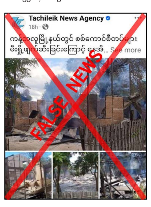
This screenshot validates misinformation.

Subversive media outlets spread misinformation, covering up their terror acts and misleading the people about security forces. — MNA/KTZH