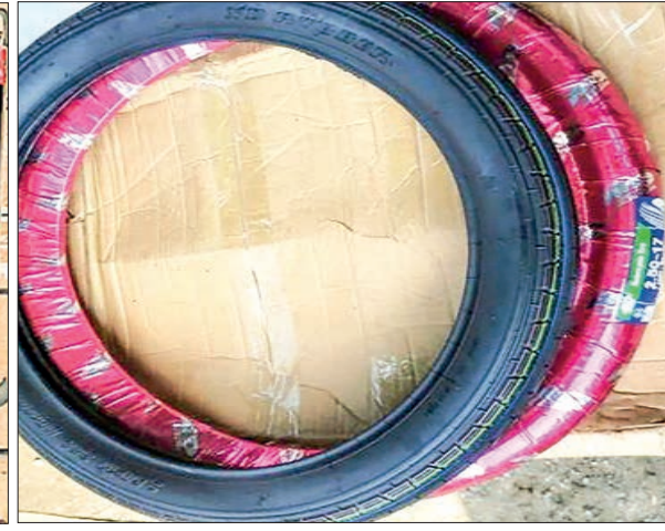
Confiscated illegal goods in Mandalay Region.

UNDER the supervision of the Illegal Trade Eradication Steering Committee, efforts to combat illicit trade continue to be effectively carried out by the