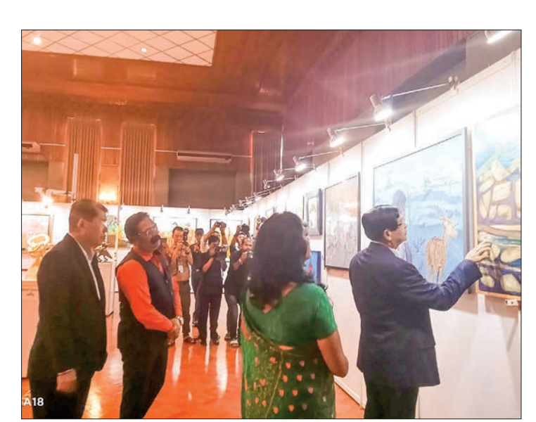
A glimpse of the Ramayana painting exhibition.

THE Indian Embassy in Myanmar has announced a painting exhibition featuring artworks on the Ramayana, organized by the Indian Council for Cultural Relations (ICCR). The exhibition is open at the National Mu-