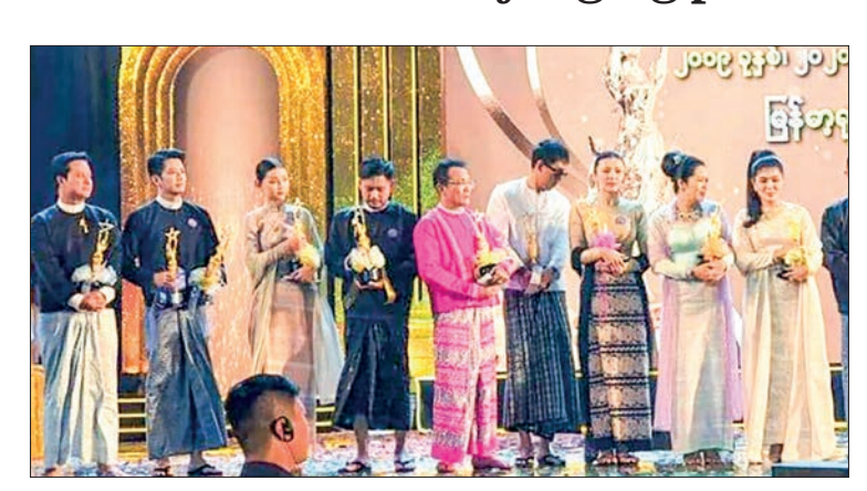
This photo showcases the winners of the Myanmar Film Academy Award ceremony in the previous year.

THE Myanmar Motion Pictures Organization (MMPO) has announced that the 2024 Myanmar Film Academy Awards ceremony will be held in Nay Pyi Taw in February 2025. Experts will be carefully selected to serve on the judging panel to ensure a fair and professional evaluation process.