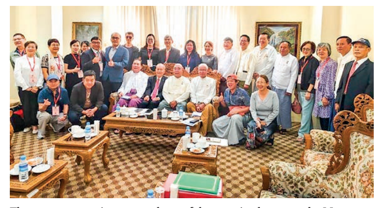
The commemorative group photo of the meeting between the Macau-Myanmar Friendship Association and Myanmar-China Friendship Association yesterday.

The chairman of the Macau-Myanmar Friendship Association then mentioned that their organization focuses on health, education, and cultural initiatives, with business leaders engaged in areas such as IT and pharmaceuticals. He invited Myanmar students to study in Macau, adding that the association would offer necessary support and assistance. — MNA/KZL