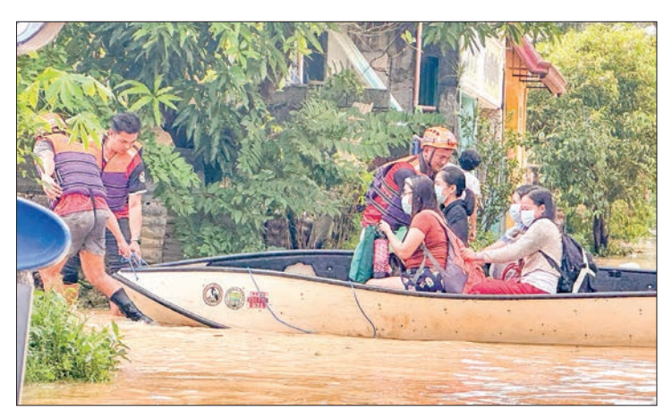
Rescuers ferry stranded residents from their flooded houses at a village in Ilagan town, Isabela province on 12 November 2024, a day after Typhoon Toraji hit the province.

"It's looking like it will follow the track of (Yinxing)," civil defence chief Rueli Rapsing of Cagayan province told AFP, referring to a typhoon that struck the northern tip of the country