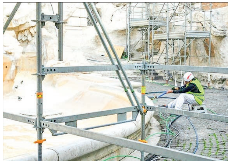
The current work involves removing limestone deposits on the fountain's facade, which can turn black with time. PHOTO: AFP

Yet, she found walking over the fountain "kind of weird." The renovation, sponsored by Fendi, includes cleaning limestone deposits and restoring the stonework. — AFP