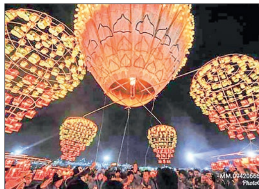
Taunggyi Thazaungdine Hot-air Balloons Festival last year.

ACCORDING to the Association of Southern Shan State Traditional Hot-Air Balloon Professionals, the Taunggyi Thazaungdine Hot-Air Balloon Festival Competition will now take place from 11 to 17 November at Awarar Balloon Field in Taunggyi City, Southern Shan State, due to recent changes in the weather.