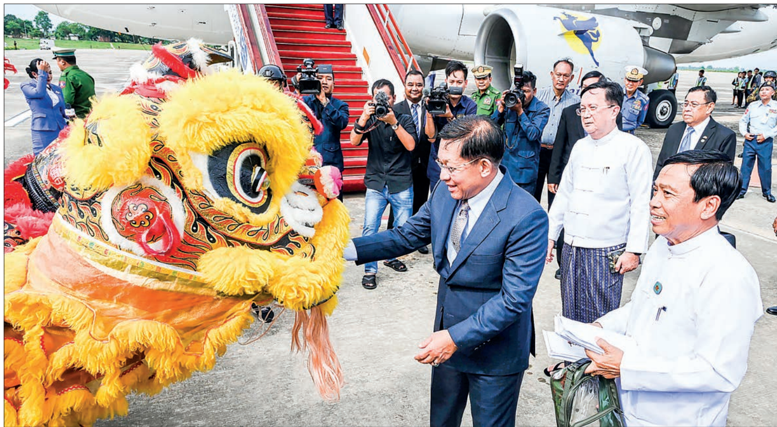
Senior General Min Aung Hlaing being welcomed back by Chinese traditional dragon and lion dance troupes at the Tatmadaw Airport in Nay Pyi Taw on 10 November 2024.

The delegation led by the Senior General arrived back at