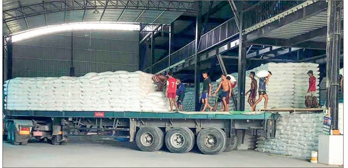
Bags of rice being unloaded from the truck into the warehouse.

In financial year 2024-2025, from April to October, Myanmar earned US$ 647 million from the export of 1,362,630 tonnes of rice and broken rice – US$55 million from 111,862 tonnes in April, US$36 million from 71,279.5 tonnes in May, US$84 million from 162,325.75 tonnes in June, US$82 million from 16,544.3