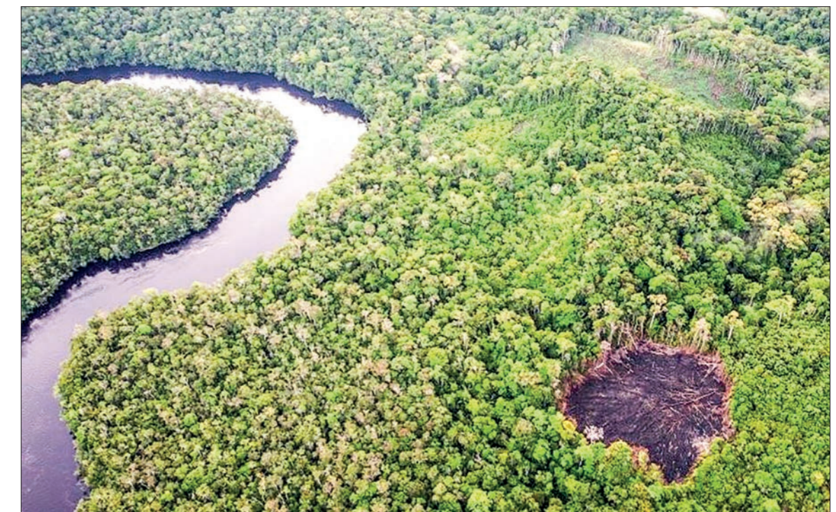
New UN rules would give local communities more power to object to carbon credit projects.

'New benchmark' The voluntary market, for its part, is eagerly awaiting a UN