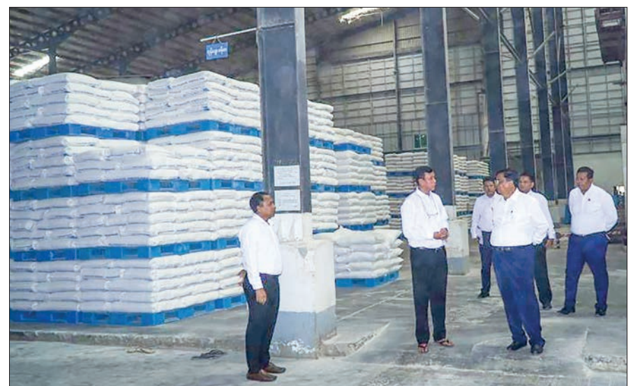
Union Minister for Industry Dr Charlie Than views around the advanced Donpyan flour mill in the Mandalay Industrial Zone in Pyigyidagun Township on 9 November 2024.

To standardize the quality levels of domestic industrial zones, inspections must be based on Customs oversight, and connectivity with