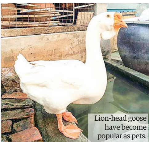
Lion-head geese have become popular as pets.

Lion-head geese reproduce three times a year and from seven to nine eggs a birth and fewer sometimes. Price increased slightly this year compared to last year. "Our customers are from all classes but especially those who can breed them in wide spaces and buy them as pets. Some are enthusiastic breeders," he said.