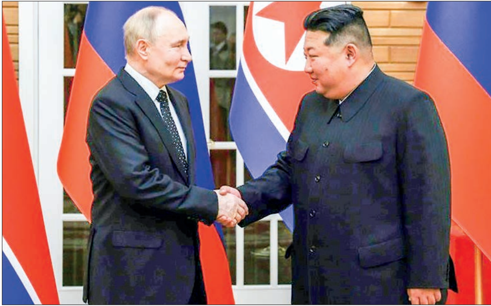
Russian leader Vladimir Putin and North Korean leader Kim Jong Un signed a strategic partnership agreement in June.

Putin ratified a treaty with North Korea promising mutual military assistance in case of attack.