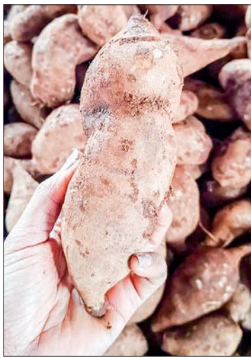
Yacon has gained popularity on internet.

Yacon became popular on internet this year and price has been higher compared to last year. The consumption of yacon has now developed. "Yacon has gained popularity on Facebook and TikTok this year, so the consumption has developed. Price has been high this year. "The number of yacon sellers have begun larger and so does the number of buyers," said an official from Zaw Lwin Oo fruits wholesale trading centre in Naungtaya.