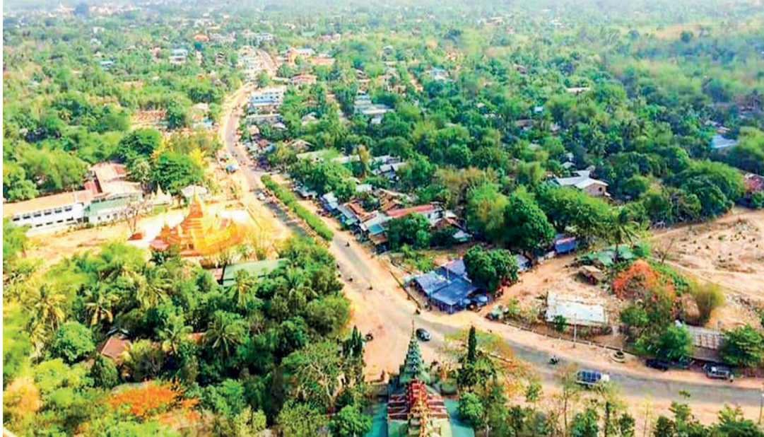
An aerial view of Twantay downtown wards.