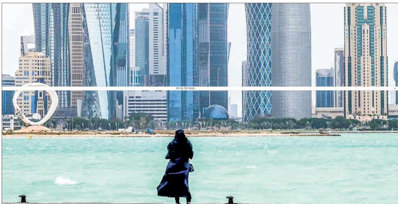
Qatar has long hosted Hamas’ political office in Doha.

Previous ceasefire efforts, mediated by Qatar and Egypt in November, had seen both sides release hostages and prisoners, but those negotiations ultimately faltered. — ANI