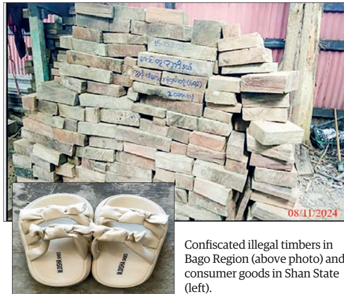
Confiscated illegal timbers in Bago Region (above photo) and consumer goods in Shan State (left).

UNDER the supervision of the Illegal Trade Eradication Steering Committee, efforts to prevent and prosecute illegal trade continue effectively in accordance with the law.