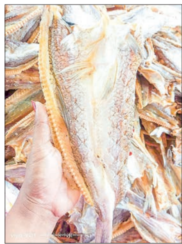
Photo shows dried snakehead fish from Maungmakan beach.

Yangon and Mawlamyine are buying dried Indian Anchovy. There are a lot of orders from Thailand for dried snakehead fish and croakers. Next week, dried Frigate Tuna will be in season in Maungmakan, so they will buy directly from warehouses. Seawater-dried fish will be plenty from this season,” he said.