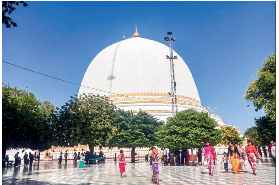
This photo showcases the Kaunghmudaw Pagoda in Sagaing Region packed with pilgrims.

Among tourists entering Sagaing Region, 50 foreigners from India, Bangladesh, Vietnam, Malaysia, Mexico, and Australia seek religious med-