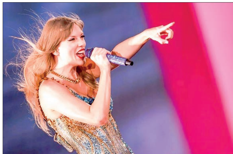
US singer-songwriter Taylor Swift is a top contender.