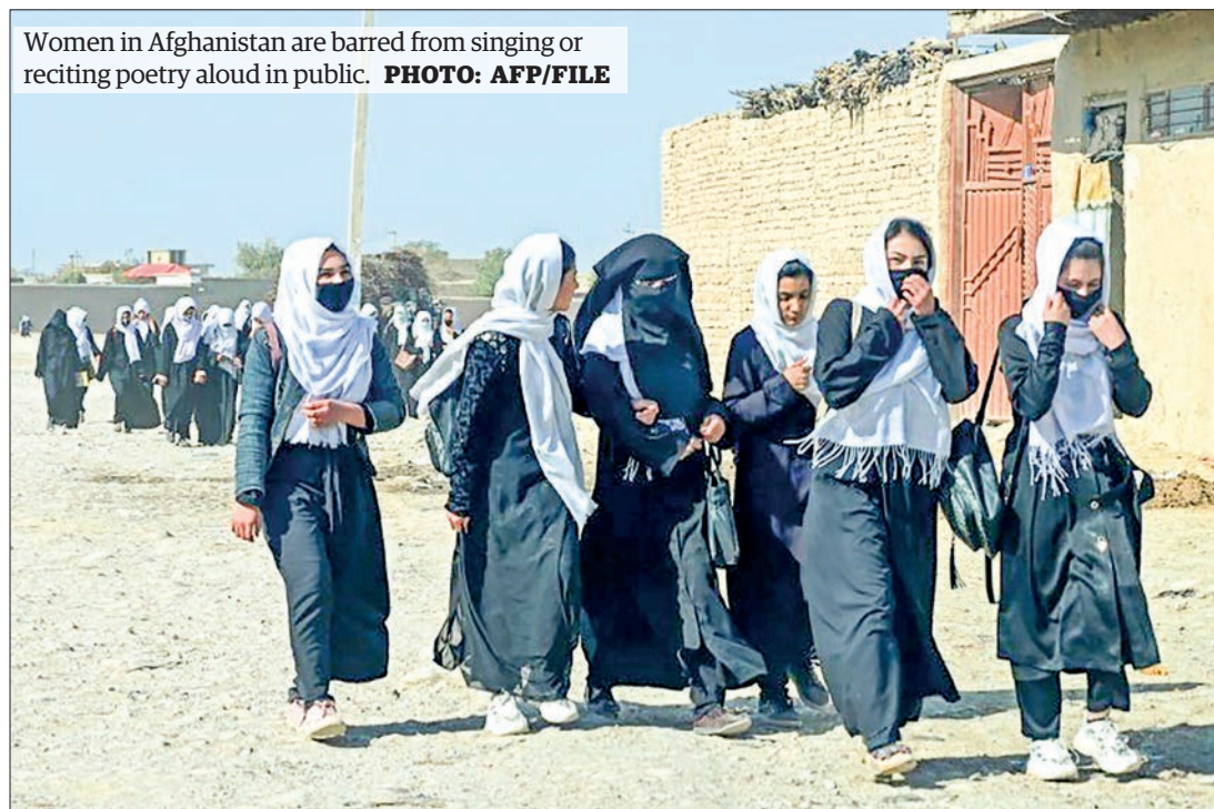
Women in Afghanistan are barred from singing or reciting poetry aloud in public.

The Taliban's morality ministry stated that women in Afghanistan are not banned from speaking to each other, countering recent media claims.