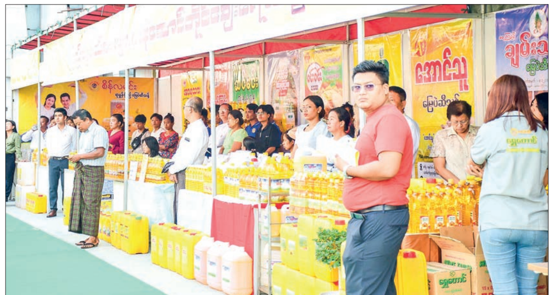
The Tazaungdine market fair for edible oil sale is being held at the UMFCCI in Yangon.

The association held the first market fair of oil millers at UMFCCI on 3 and 4 August this year as part of marking the 5 th Anniversary of MEOMA. The second fair took place at the same venue on 12 and 13 October. The third fair was held at the promotion area of Yadanabon Super Centre in Mandalay on 2 and 3 November. — ASH/TMT