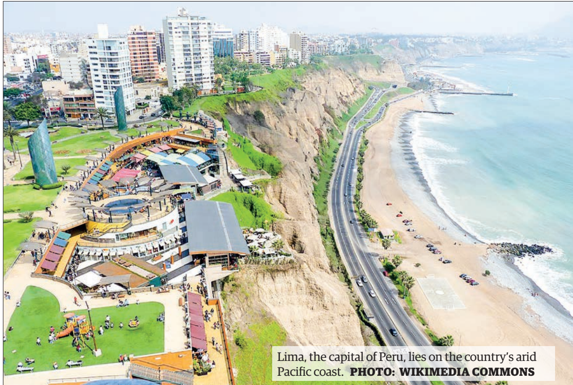
Lima, the capital of Peru, lies on the country's arid Pacific coast.

The meeting led to the launch of a Spanish-language version of the Belt and Road Portal and the inauguration of the Latin America Liaison Office of the Belt and Road Economic Information Association.