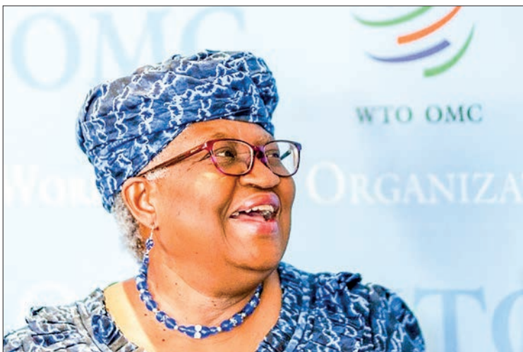
Okonjo-Iweala said her team was working around the clock to draft agreements for the talks.

NGOZI Okonjo-Iweala, the first woman and first African to head the World Trade Organization, is uncontested in seeking another term, the group's chair announced on Saturday.