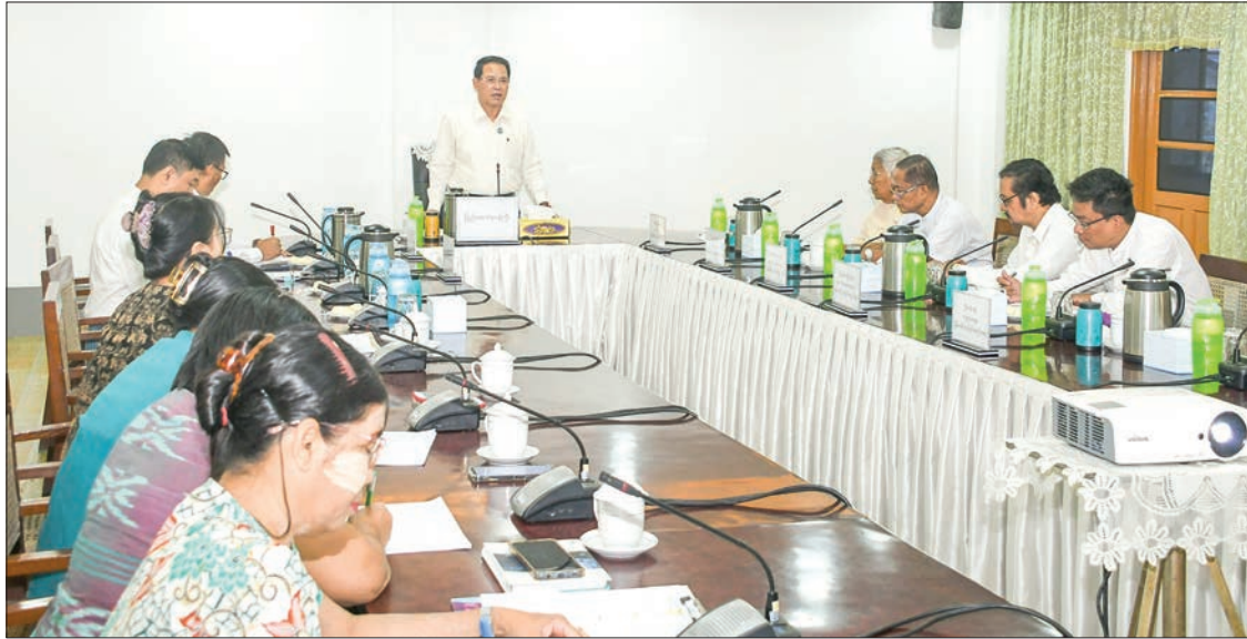
Union Minister for Information U Maung Maung Ohn addresses the coordination meeting for the successful organization of the 2024 Myanmar Motion Picture Academy Award ceremony, in Yangon yesterday.

The Union minister also warned that assigning such individuals to the evaluation committee could lead to unintended bias or misjudgments, and stated that the Ministry of