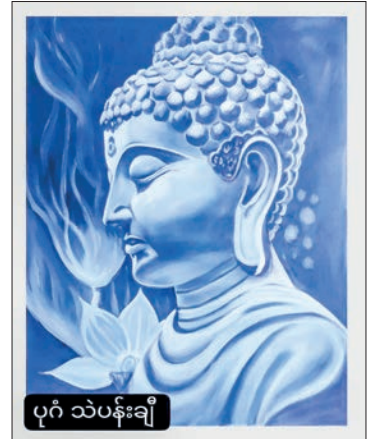
A Buddha image in sand painting

"Sand painting is a product of Bagan. The visitor arrival was large during Thadingyut and the sale was good. We can sell pretty well during festive days. At present, we have to rely on domestic market so new designs which can give the taste that Myanmar people enjoy, have been produced for Tazaungdine. Pilgrims like sand painting which is 100 per cent handicraft and used for decoration at home and office," said a sand painting workshop owner in Bagan.