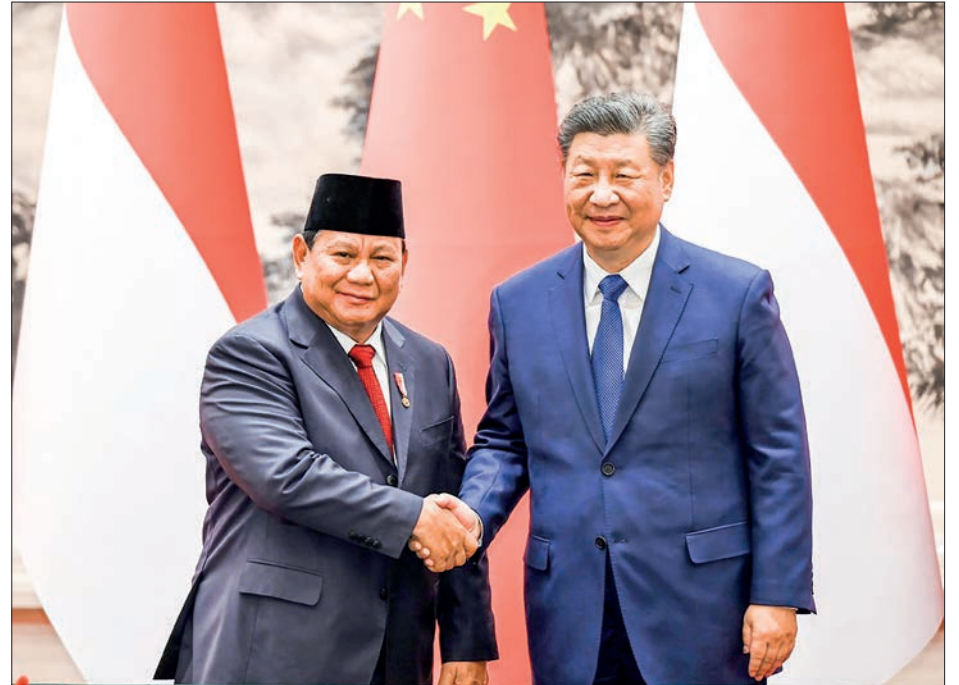
Chinese President Xi Jinping (right) holds talks with Indonesian President Prabowo Subianto in Beijing on Saturday.

“China is willing to work with the new Indonesian government to build on past achievements, promote building a community with a shared future with regional and global influence, and continue to write a new chapter of seeking self-improvement via solidarity, and boosting coordination and mutually beneficial and win-win cooperation among major developing countries,” said Xi. — Xinhua