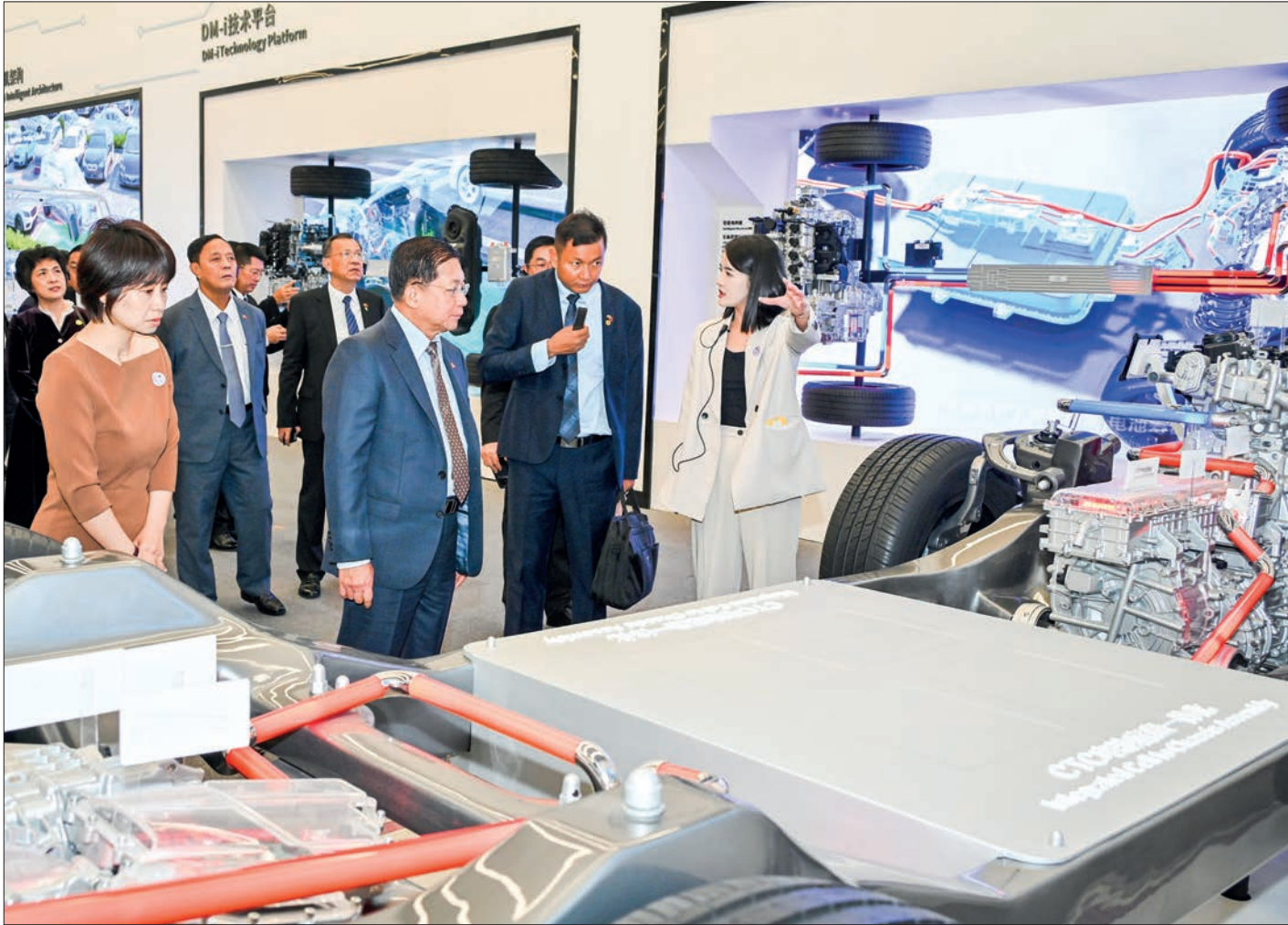
SAC Chairman Prime Minister Senior General Min Aung Hlaing views round production process of BYD-U9 model manufactured by BYD automobile manufacturing company in Shenzhen City, China, yesterday.

usage, securing medals for efforts not to interrupt the communication linkages at the emergency periods and smooth and swift process of communication systems at the gala ceremonies, innovation of communication equipment with the use of developing technologies, and distribution of these devices to the markets. The Senior General asked what he wanted to know and held discussions.