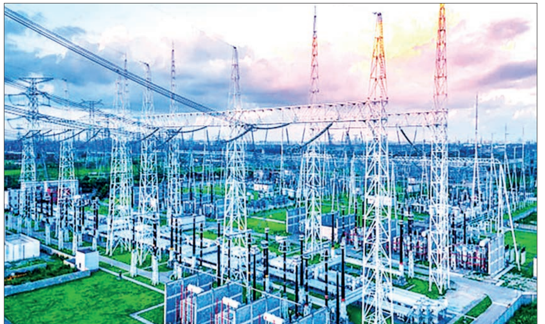
India signed the Host Country Agreement for the BIMSTEC Energy Centre in Bengaluru, enhancing regional energy cooperation.

INDIA signed the Host Country Agreement for establishing the BIMSTEC Energy Centre in Bengaluru, for enhanced energy cooperation in the Bay of Bengal and littoral region, including through inter-grid connectivity.