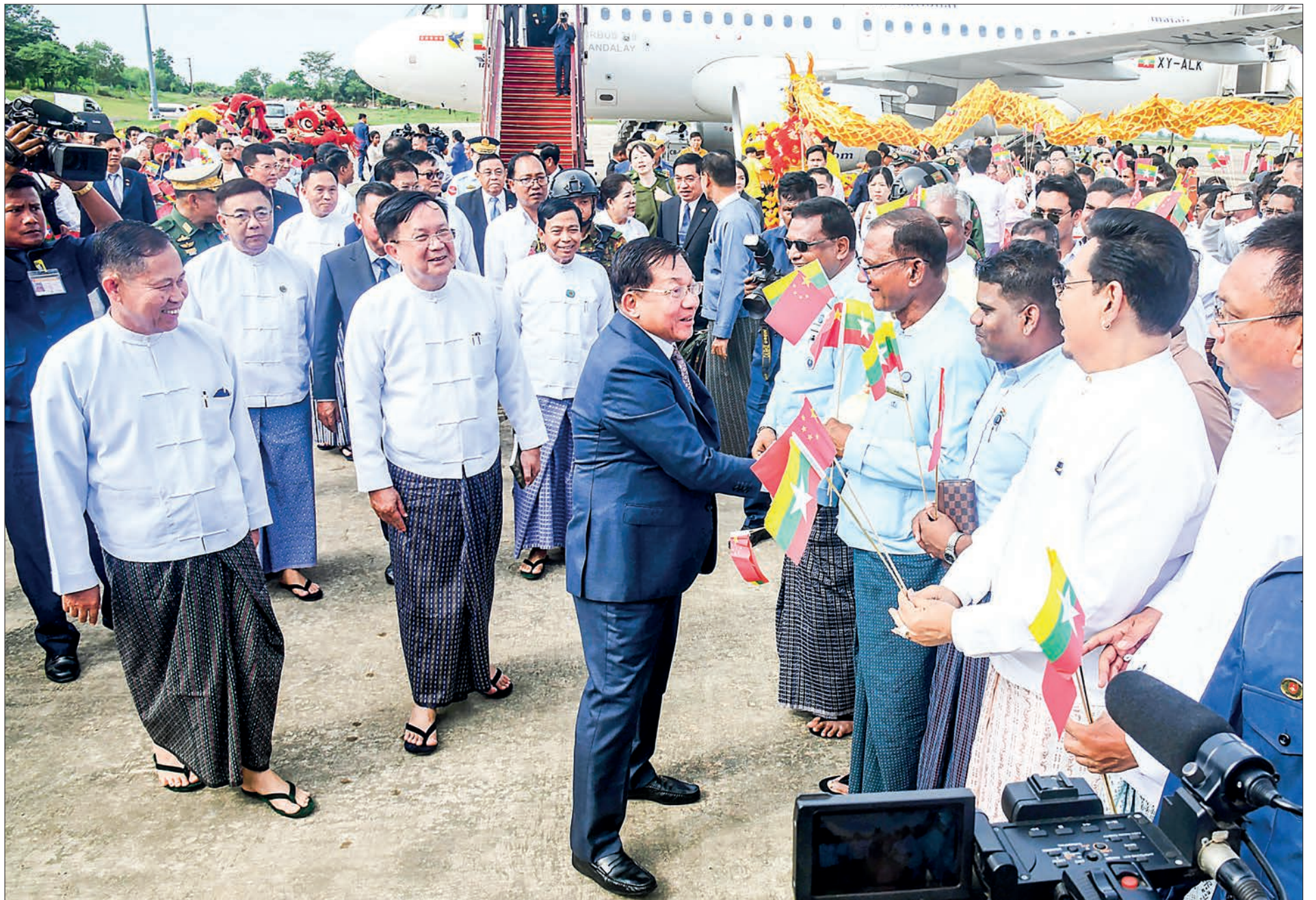
Chairman of the State Administration Council Prime Minister Senior General Min Aung Hlaing who attended the summits including the 8 th Greater Mekong Subregion Summit in the People's Republic of China tumultuously welcomed back by the people at the Tatmadaw Airport in Nay Pyi Taw on 10 November 2024.

T he Myanmar high-level delegation led by Chairman of the State Administration Council Prime Minister Senior General Min Aung Hlaing who attended the summits including the 8 th Greater Me-