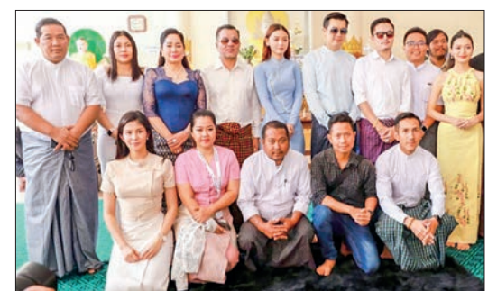
Photo of first shot ceremony of ‘Pinlehmar Sabeltwe Pyo Khae Tel’.

The plot is set in Yangon, and filming is