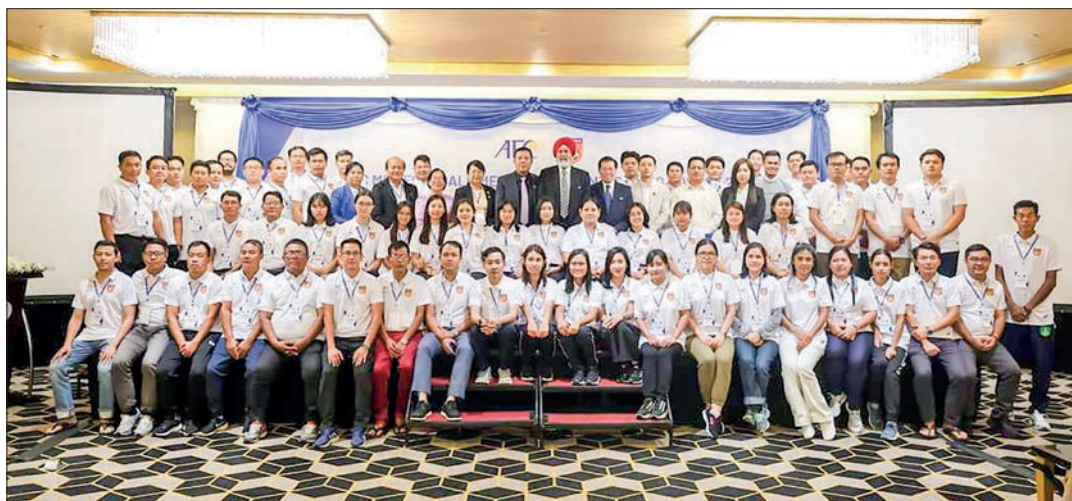
This photo showcases the AFC Football Medicine and Anti-Doping Course opening ceremony and the documentary group photo.