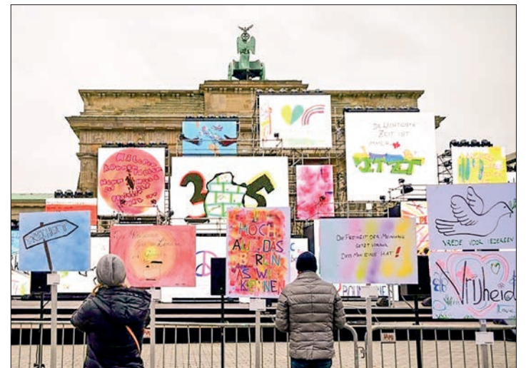
Artworks on the theme of freedom stand in front of the Brandenburg Gate in Berlin.