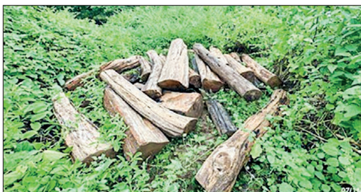
Confiscated illegal timbers in Bago Region.

UNDER the supervision of the Illegal Trade Eradication Steering Committee, efforts to combat illicit trade are continued effectively by the law.