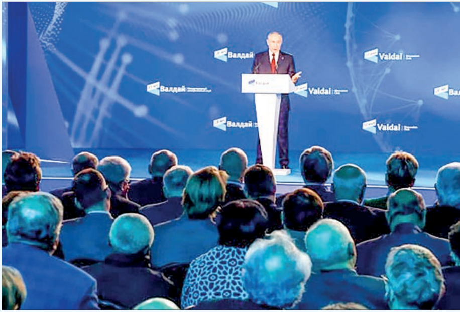
Vladimir Putin took part in the plenary session of the 21st annual meeting of the Valdai International Discussion Club.