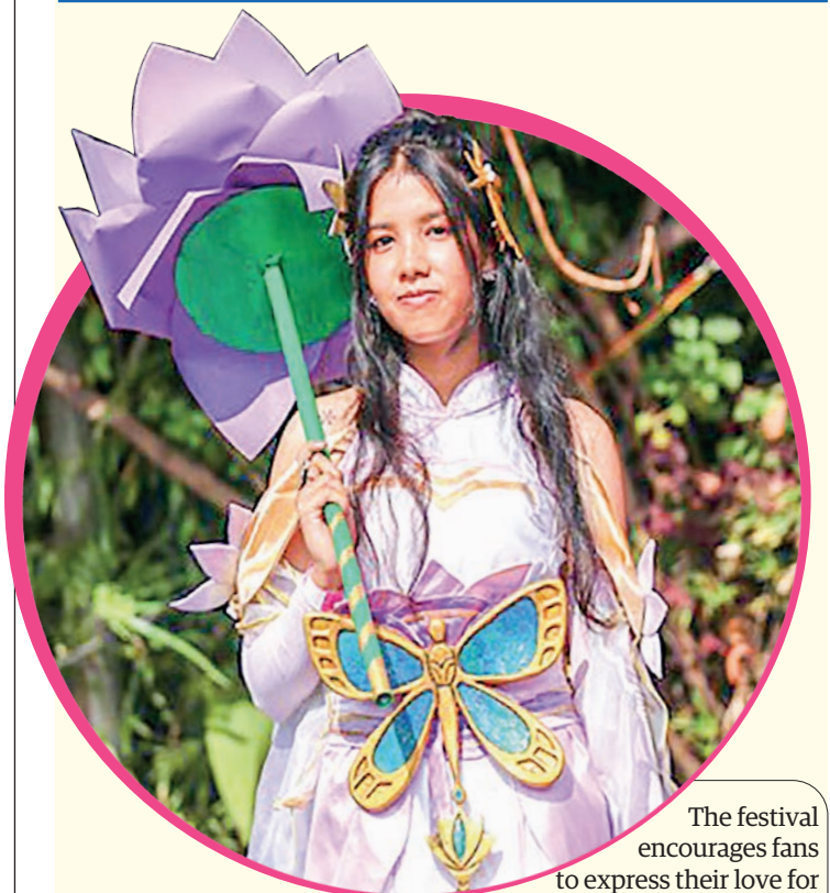
The festival encourages fans to express their love for anime through creative costumes and performances.

The festival now attracts thousands of participants and spectators, making it a key event for anime and pop culture fans in Nepal.