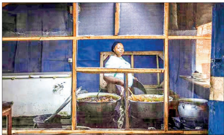
A woman poses for a photograph as she cooks in Iseyin, Oyo state, Nigeria, on 1 November 2024.

MORE than 33 million Nigerians face hunger next year, the number rising sharply as soaring food prices exacerbate the effects of conflict and climate change, according to a report Friday.