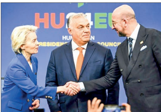
EU leaders stressed the need for 'decisive action' to overhaul the European economy after talks in Budapest.

EU leaders on Friday pledged to overhaul the bloc's economy with radical changes recommended in a landmark report, in reforms that