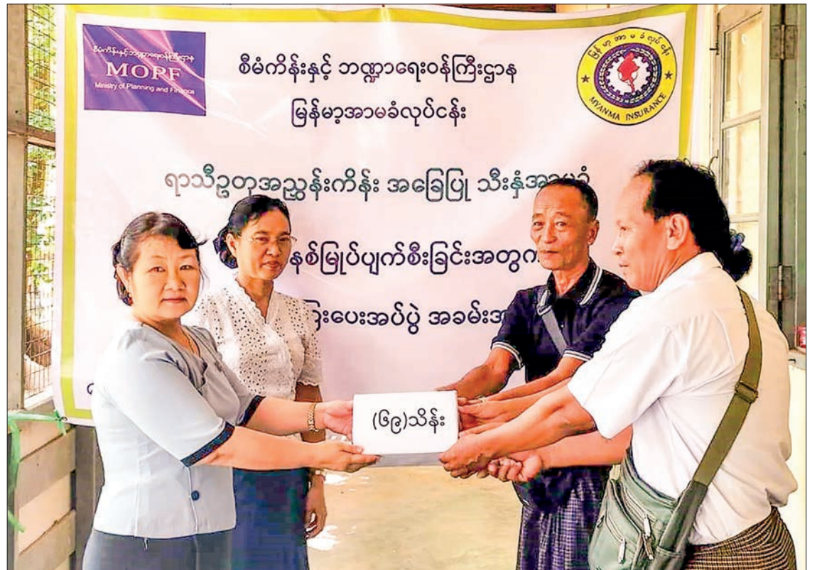
Farmers from Hmawby Township receive compensation from an official of Myanma Insurance during an event of Myanma Insurance providing weather-based insurance due to excess rainfall in Hmawby, Yangon Region, on 5 November 2024.

Myanma Insurance paid out K4.02 billion to the insured farmers in six townships as Thayawady, Letpadan, Minhla, Moenyo, Gyobingauk and Okpo in Bago Region on 6 October and K5.745 billion to the insured farmers in nine townships such as Hinthada, Laymyethna, Zalun, Kyangin, Myanaung, Ingapu, Kyonpyaw and Kyaunggon in Ayeyawady Region on 23 October due to excess rainfall. — NN/KK