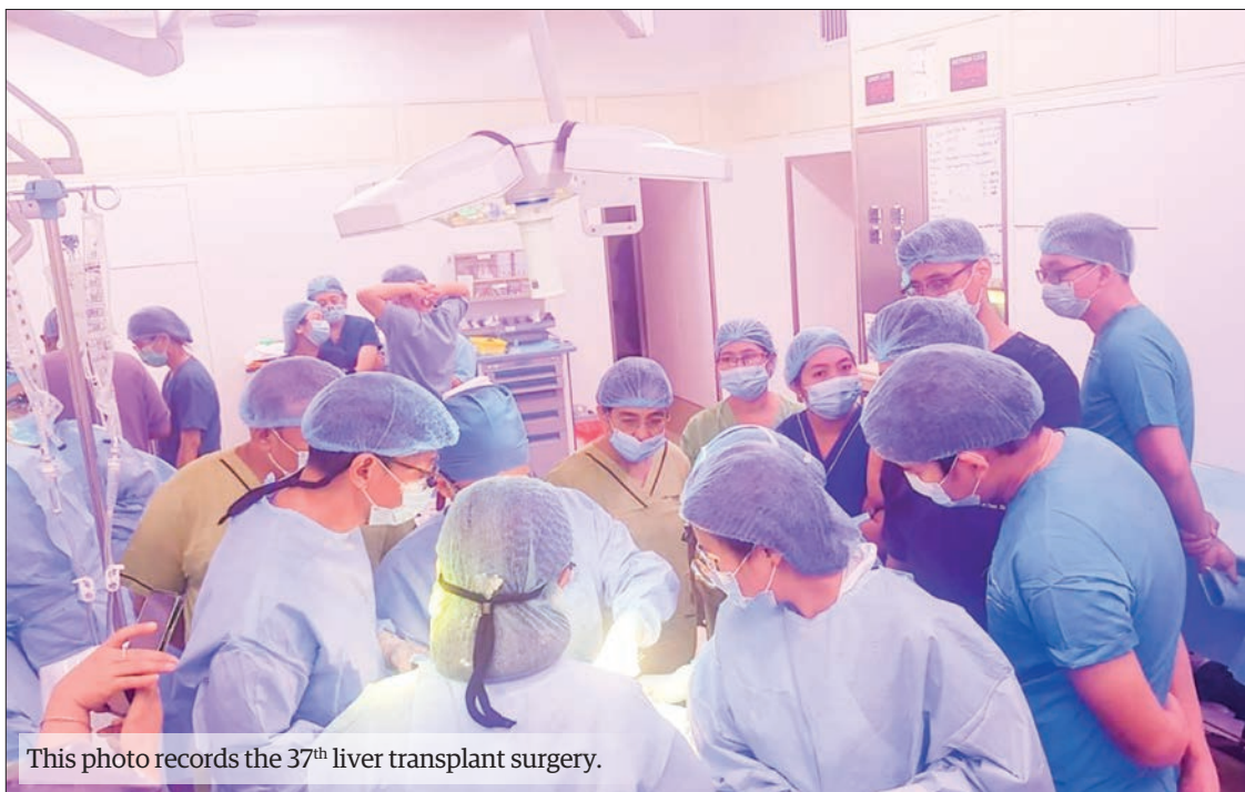
This photo records the 37 th liver transplant surgery.

THE 36 th and 37 th liver transplant surgeries were performed at the Speciality Hospital (500-bed) in Yangon on 7 and 8 November, according to the Ministry of Health.