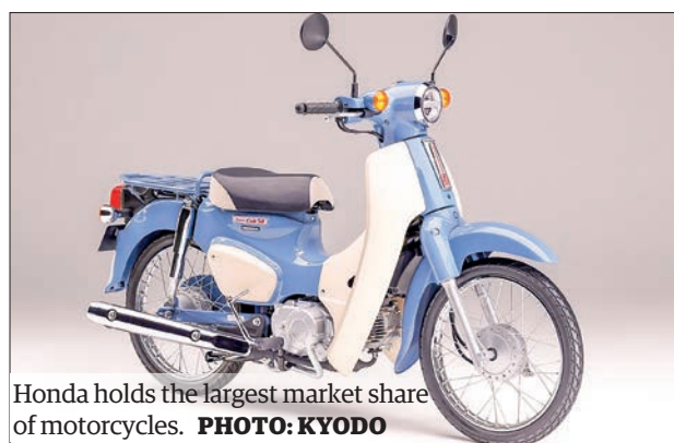
Honda holds the largest market share of motorcycles.

per Cub 110" motorcycle with a 110 cc engine will continue. Honda, which holds the largest market share of motorcycles with 50 cc or smaller engines, has decided it would be difficult to keep the motorbikes at an affordable price point should the company implement changes necessary to have it comply with new regulations scheduled to take effect in November 2025. — Kyodo