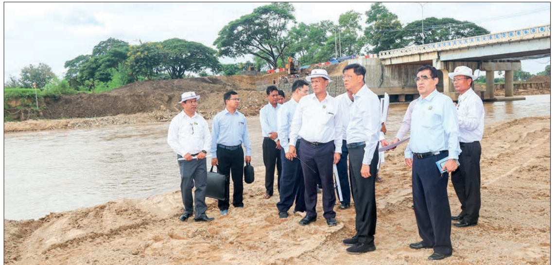
SAC Member Deputy Prime Minister MoTC Union Minister General Mya Tun Oo inspects the progress of emergency temporary protection work at the Ooyin Bridge on Sinthay Creek in Nay Pyi Taw yesterday.

Creek along the Yangon-Mandalay Expressway at milepost 245/7, as well as sand dredging activities and the construction of retaining walls. They also observed the construction of retaining walls and the placement of concrete fins along Sinthay Creek to prevent erosion near Intha Village in Zeyathiri Township. The Union Minister instructed the relevant officials to adhere to the annual work plan, ensuring construction is completed in time, to the specified quality, and with proper attention to safety standards. — MNA/TKO