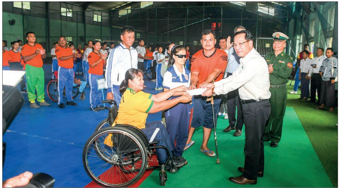
Union Minister for Information U Maung Maung Ohn presents cash assistance to para-athletes from six regions and states yesterday.

ed to the Myanmar Motion Pictures Organization and enjoyed the Chinlone dance performance in which six male chinlone players, two female chinlone players from the Myanmar Traditional Chinlone Federation, and six artistes from the Myanmar Motion Pictures Organization performed. Myanmar Motion Pictures Organization and Myanmar