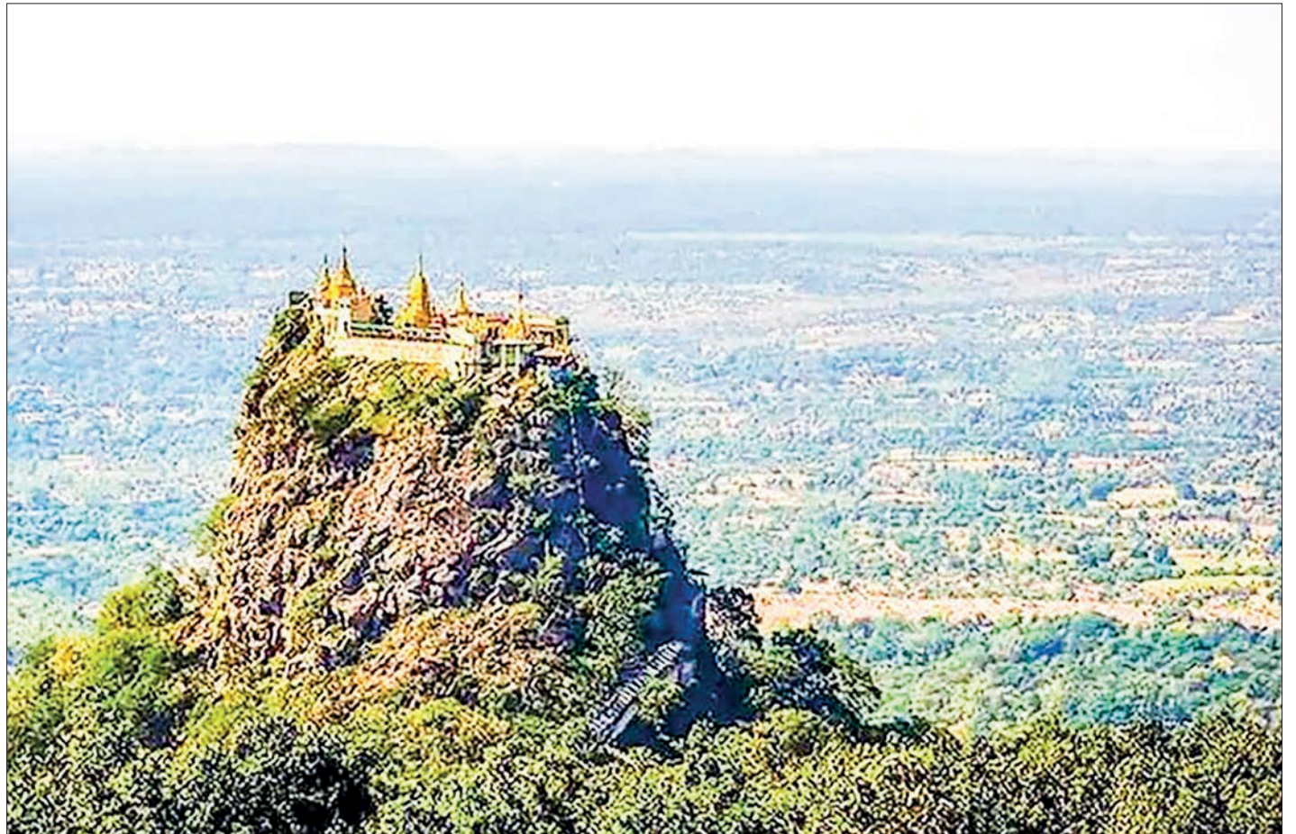
An aerial panoramic view of Mount Popa and its surrounding areas, including the Mount Popa National Geopark.

Mya Bayin Sugar Mill raises sugarcane purchase price this season