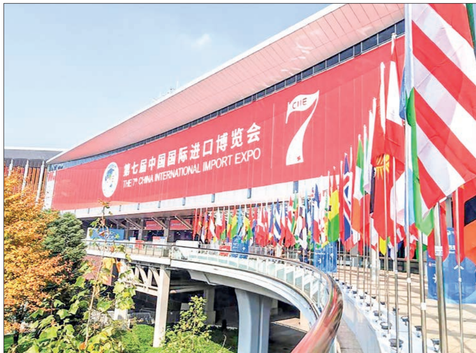
This photo shows the National Exhibition and Convention Centre (Shanghai), the main venue for the 7 th China International Import Expo (CIIE), in east China's Shanghai, 4 November 2024.