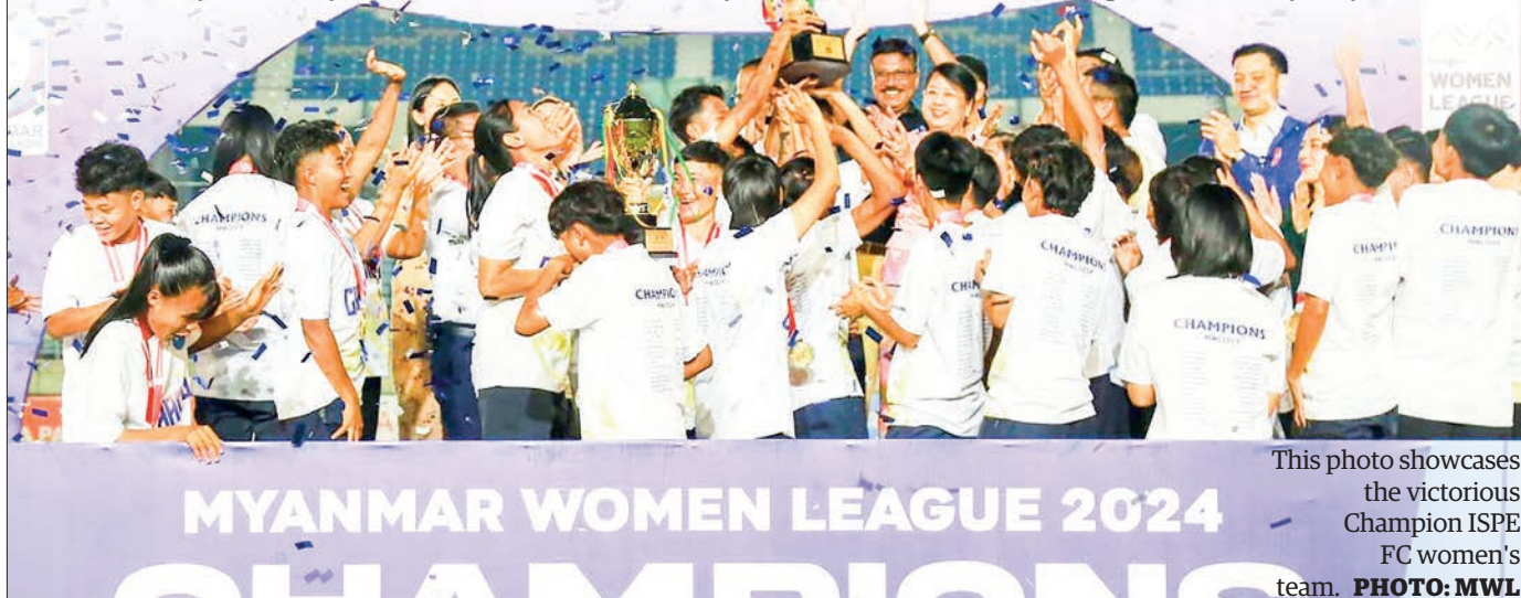
This photo showcases the victorious Champion ISPE FC women's team.

At the end of the season, ISPE FC secured the title with 48 points, while Yangon United placed second with 40 points, and Ayeyawady took third with 27 points.