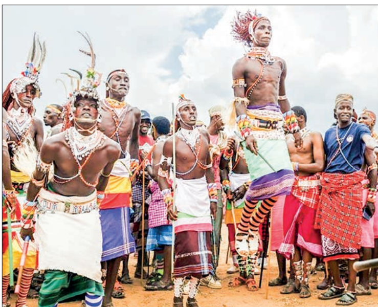
Morans (traditional warriors) of the Samburu community were among performers at the Maa Festival.

The Maa Festival celebrates tradition, resilience, and cultural fusion