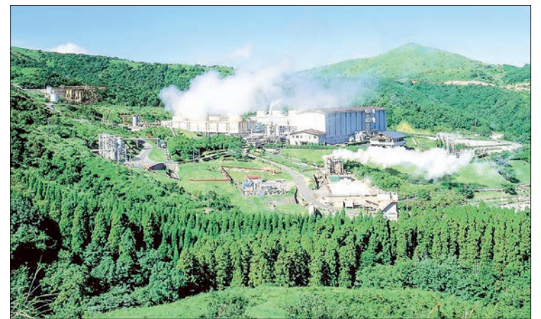
Photo shows Hatchobaru Geothermal Power Plant in Oita Prefecture.

Prime Minister Shigeru Ishiba is keen to promote the development of geothermal power plants as he sees it benefitting local economies, given that many geothermal resources are in rural areas. — Kyodo