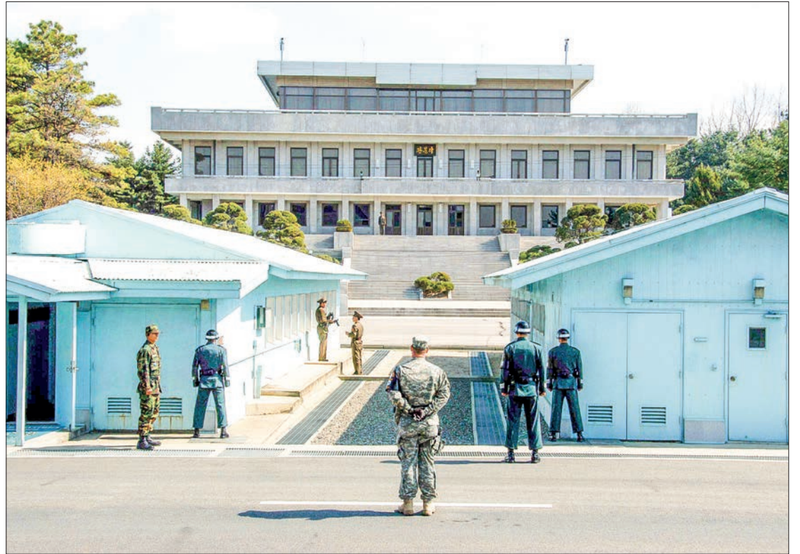
The jamming allegations come after the North test-fired what it said was its most advanced and powerful solid-fuel ICBM missile.

"We strongly urge North Korea to immediately cease its GPS provocations and warn that it will be held responsible for any subsequent issues arising from this," they said in the statement. — AFP