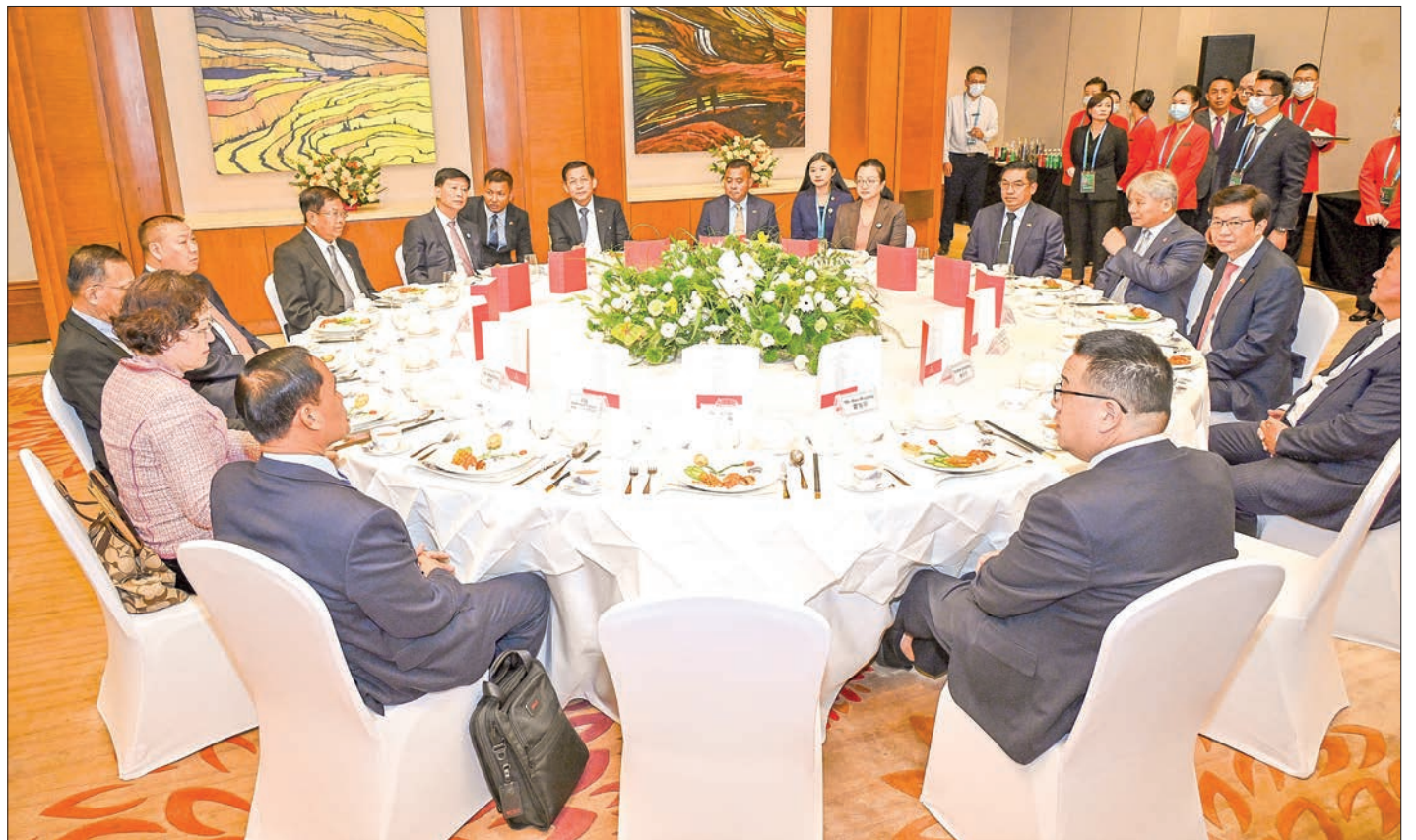
Senior General Min Aung Hlaing and dignitaries dine at a UMFCCI-hosted lunch in Kunming, China, yesterday.

The Chinese businesspeople raised questions regarding potential investments in Myanmar, conditions to create