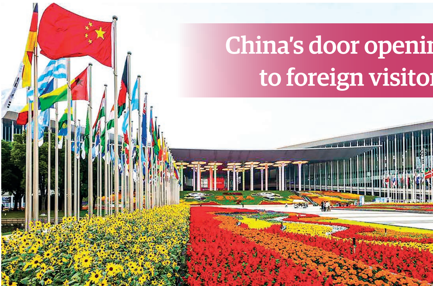
This photo shows a view of the National Exhibition and Convention Centre (Shanghai), the main venue for the 7 th China International Import Expo (CIIE), in east China's Shanghai, 4 November 2024.

even wider to foreign visitors, investors and business doers.