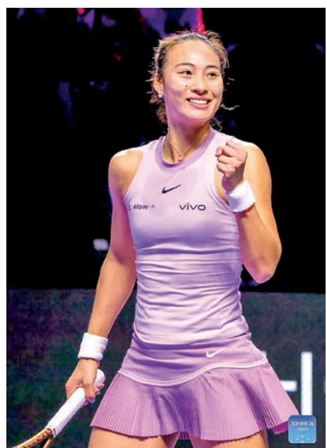
Zheng Qinwen of China reacts after winning the round robin match against Elena Rybakina of Kazakhstan at WTA Finals tennis tournament in Riyadh, Saudi Arabia, 4 November 2024.

In another match, top seed Aryna Sabalenka defeated Italy's Jasmine Paolini 6-3, 7-5 in one hour and 30 minutes, securing her second group-stage win and guaranteeing her place in the semifinals. — Xinhua