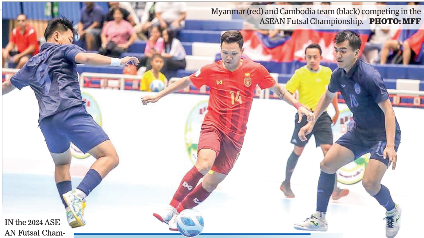
Myanmar (red) and Cambodia team (black) competing in the ASEAN Futsal Championship.

IN the 2024 ASEAN Futsal Championship, team Myanmar claimed their first victory on the fourth day of group matches, held yesterday in Thailand. Myanmar achieved a narrow 5-4 win over Cambodia, marking a hard-fought success.