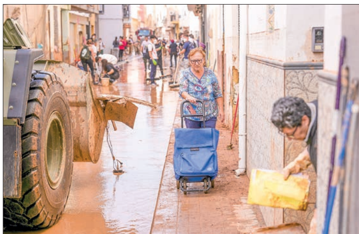
A woman wheels a shopping cart down the street as people work to clear mud and debris in Aldaia, in the region of Valencia, eastern Spain, on 5 November 2024, following devastating floods.

Maribel Albalat, mayor of the ground-zero town of Paiporta, told public broadcaster TVE they were doing "better, but not well" with many streets still inaccessible and residents struggling to get a phone signal. — AFP