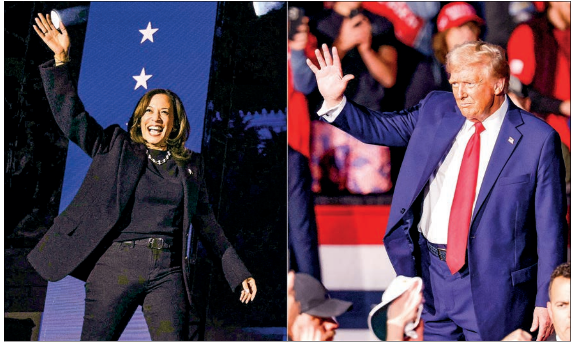
This combination of pictures created on 4 November 2024 shows US Vice-President and Democratic presidential candidate Kamala Harris (L) arrives to speak during a campaign rally on the Benjamin Franklin Parkway in Philadelphia, Pennsylvania, on 4 November 2024, and former US President and Republican presidential candidate Donald Trump (R) waves as he leaves after speaking at his last campaign rally at Van Andel Arena in Grand Rapids, Michigan, on 5 November 2024.

Polling stations opened from 6:00 am (1100 GMT) in states including Virginia, North