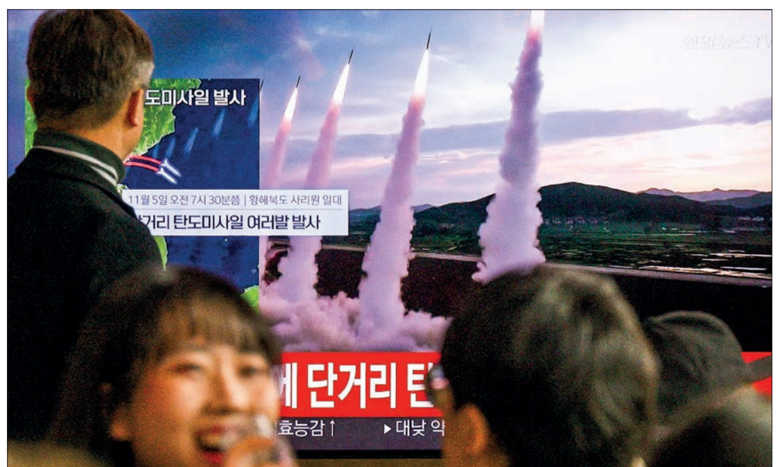
A man watches a television showing a news broadcast with file footage of a North Korean missile test, at a railway station in Seoul on 5 November 2024.

Last week, North Korea launched its latest intercontinental ballistic missile, the Hwasong-19. — SPUTNIK