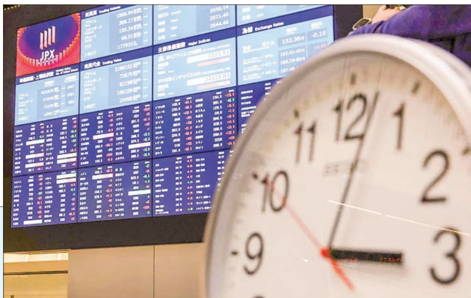
Photo taken on 5 November 2024 captures a financial data screen at the Tokyo Stock Exchange showing trading continuing past 3 pm after the bourse extended its closing time by 30 minutes to 3:30 pm, the first extension in 70 years.

The trading volume on the top-tier Prime Market stood at around 1.9 billion shares on Tuesday, less than Friday's roughly 2.0 billion stocks, JPX data showed. — Kyodo