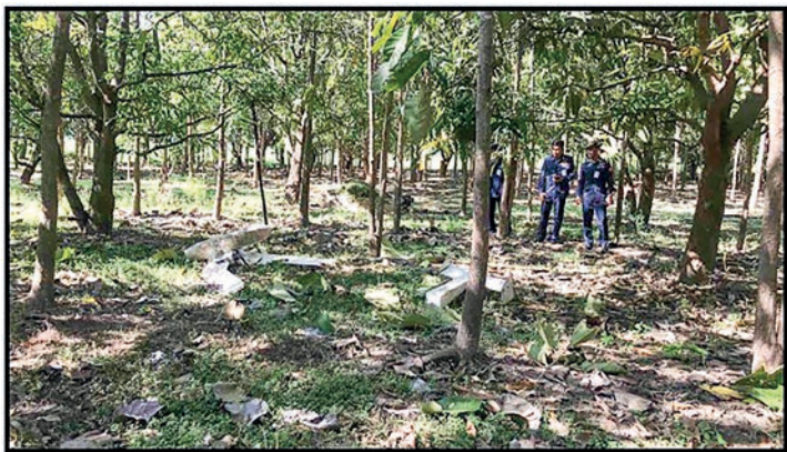
This photo reveals the successful interception of terrorist drones in Nay Pyi Taw Council Area.

ACCORDING to reports, terrorists attempted to test-launch several locally-made fixed-wing drones into Lewe Township in the Nay Pyi Taw Council Area yesterday morning.