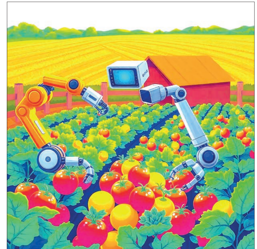
This technology ensures higher quality produce reaches consumers. ILLUSTRATION: IMAGES FOR VISUAL REPRESENTATION/ UNSPLASH

picked and then immediately cooled, for example, so a quick temperature measurement must match that speed.