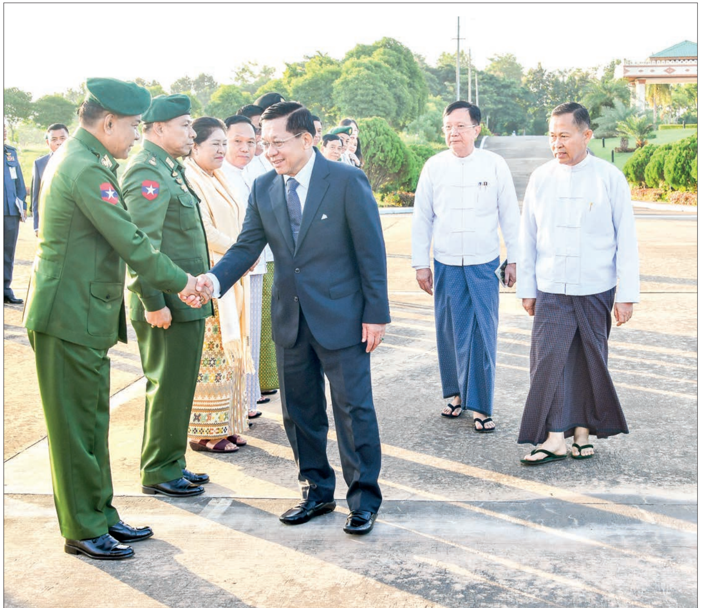
State Administration Council Chairman Prime Minister Senior General Min Aung Hlaing is pictured yesterday with dignitaries at Nay Pyi Taw Military Airport before departing for China to attend the 8 th GMS Summit and related summits.

During the trip, they will attend high-level meetings, hold discussions