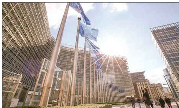
This photo taken on 4 October 2024 shows the European Commission building in Brussels, Belgium.

The Commission will now "carefully assess whether the measures adopted for iPadOS are effective in complying with the DMA", adding the assessment will also be based on the input of interested shareholders. The Commission will take formal enforcement action as foreseen in the DMA in case it would conclude that Apple's solutions are not compliant with the DMA, according to the statement. — Xinhua