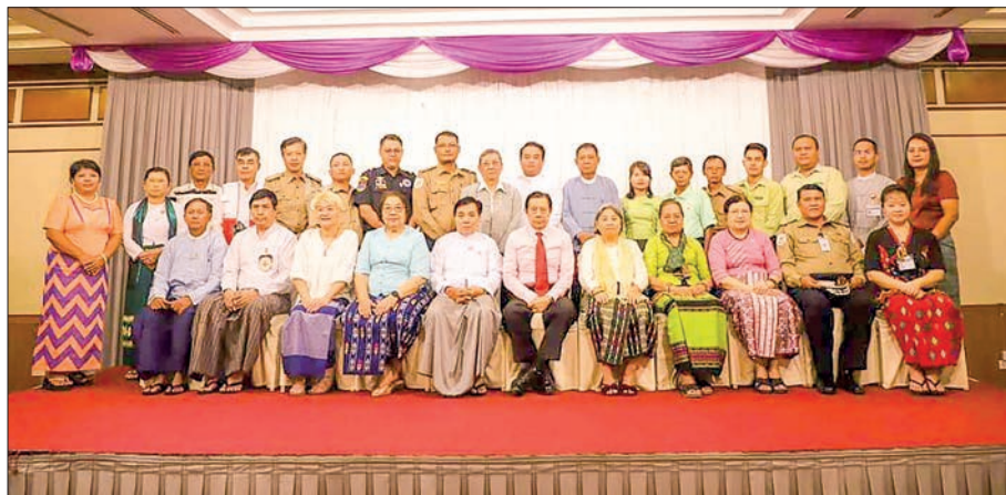
This image showcases the workshop participants.

ACCORDING to the Myanmar Red Cross Society, a workshop to raise awareness about Red Cross activities is being held from 4 to 6 November at the Summit Parkview Hotel in Dagon Township, Yangon Region.