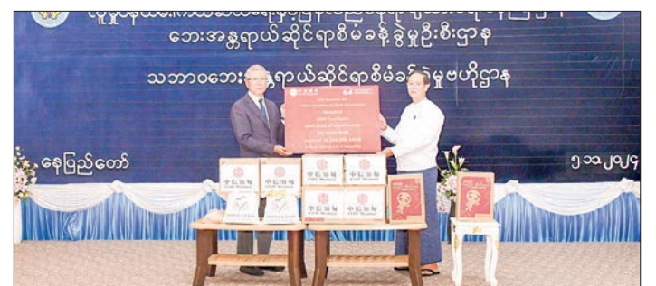
Deputy Minister U Soe Kyi receives the Chinese donations yesterday.

Donated items included rice, beans, instant noodles, and stationeries, and donors personally provided these items to flood-hit villages in Nay Pyi Taw.