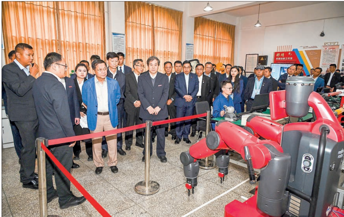
SAC Chairman Prime Minister Senior General Min Aung Hlaing is seen during his observation tours in Kunming, China, yesterday.

The delegation then visited the college's Electromechanical Training Centre, where they observed advanced machinery