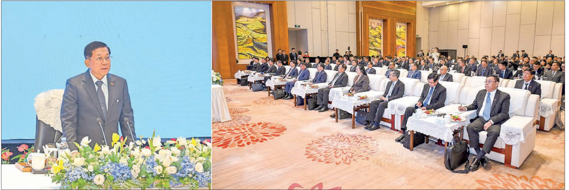
SAC Chair PM Senior General Min Aung Hlaing addresses the gathering of China-Myanmar business leaders at HUALUXE Kunming Hotel yesterday.

STATE Administration Council Chairman Prime Minister Senior-General Min Aung Hlaing addressed the gathering of China-Myanmar business leaders at HUALUXE Kunming Hotel in Kunming, People's Republic of China, yesterday.