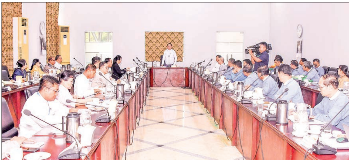
Union Minister U Khin Maung Yi presides over the meeting of the Myanmar Gems Emporium Central Committee yesterday.

UNION Minister for Natural Resources and Environmental Conservation U Khin Maung Yi, who is also the Patron of the Myanmar Gems Emporium Central Committee, attended the committee meeting in Nay Pyi Taw