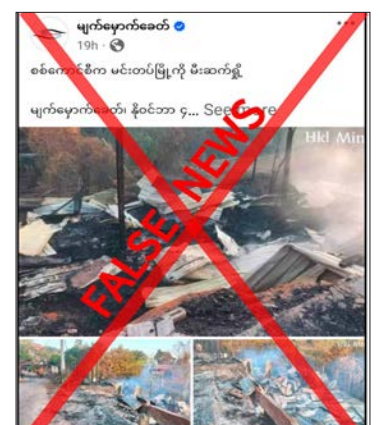
This screenshot validates misinformation.

cated reports to spur fear among residents in Mindat intentionally and to discourage locals from returning to the area. — MNA/KZL