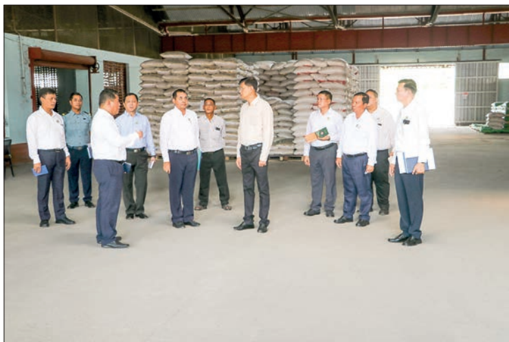
Deputy Prime Minister MoTC Union Minister General Mya Tun Oo inspects port facilities and warehouses in Yangon yesterday.

The Myanma Port Authority Chief Engineer presented