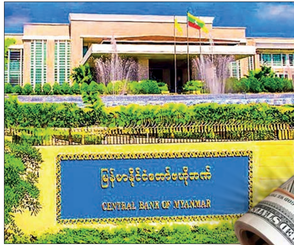
The facade of the Central Bank of Myanmar in Nay Pyi Taw.

THE Central Bank of Myanmar (CBM) sold US$15 million, 1.5 million yuan and 100.8 million Thai baht on 4 November.