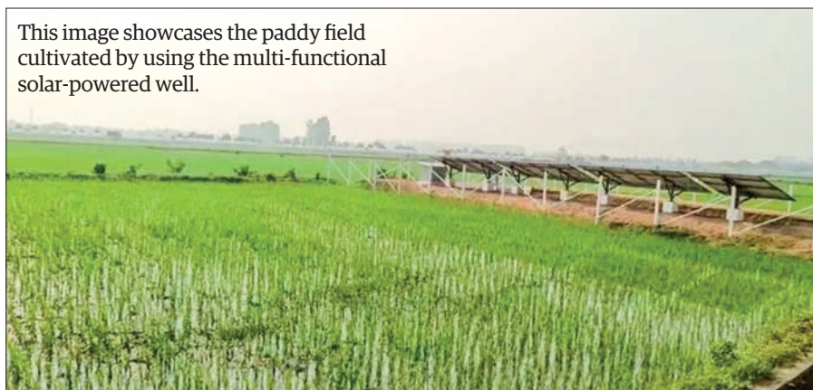
This image showcases the paddy field cultivated by using the multi-functional solar-powered well.

tance, we harvested 3,000 baskets of rice this summer, which could bring in over K51 million, more than we earned last year".