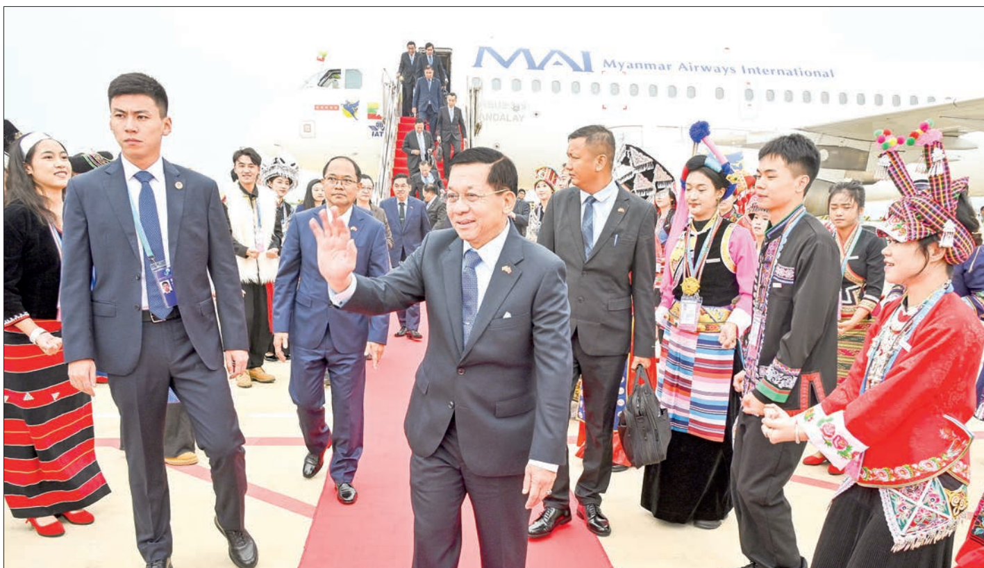
A warm welcome ceremony was held at Kunming International Airport for the official visit of State Administration Council Chairman Prime Minister Senior General Min Aung Hlaing to the People's Republic of China yesterday.