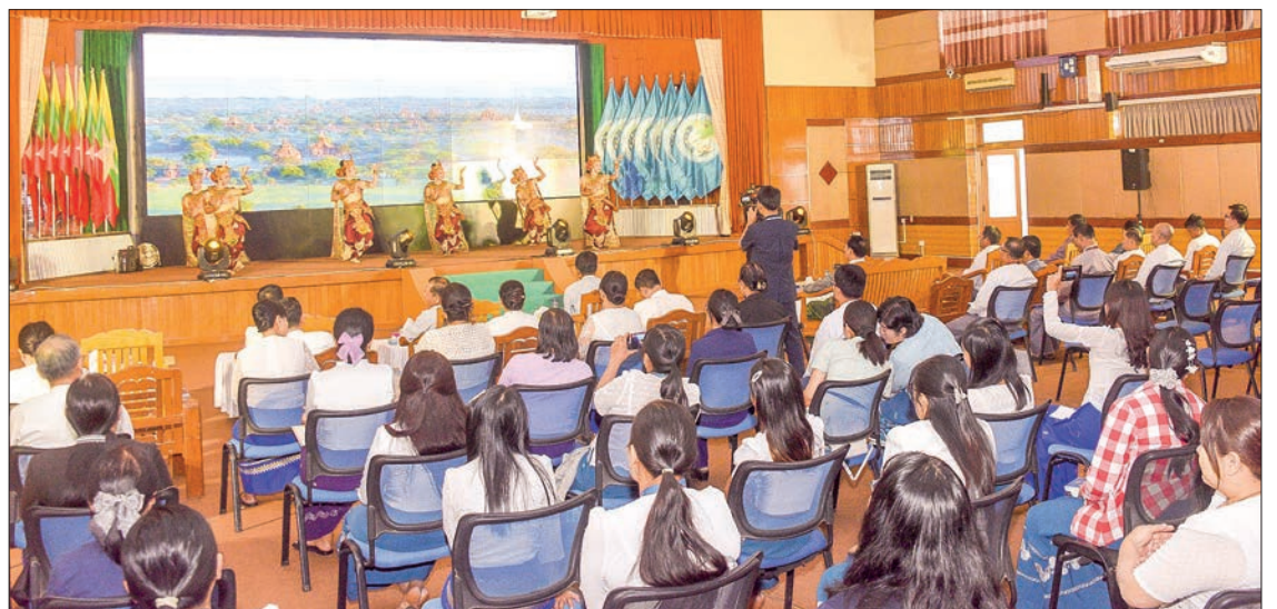
Staff from the MRTV and the Ministry of Religious Affairs and Culture present their performances in full address.

A total of 41 staff from the Ministry of Information, Ministry of Religious Affairs and Culture, Ministry of Agriculture, Livestock and Irrigation, Minis-