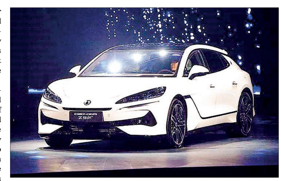
A DENZA vehicle is on display in Bangkok, Thailand, 1 November 2024.

Narit noted that the debut of the DENZA brand not only reflects the confidence of international brands in the Thai market, but will also