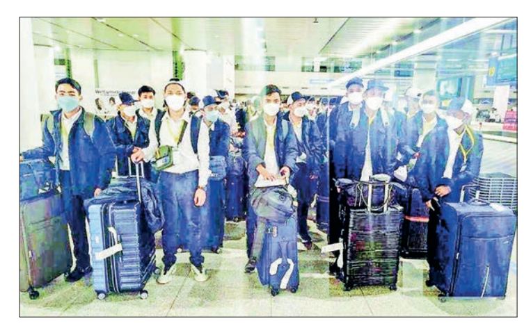
Myanmar workers sent to Japan seen at the launge of the airport.

MORE than 430 Japanese companies will recruit around 1,400 Myanmar workers, according to a statement on demand letters issued by the Myanmar Embassy to Japan.