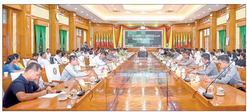
A meeting between Kachin State government officials and hotel and lodge operators from Myitkyina in progress in Myitkyina, Kachin State yesterday.

During the meeting, Chief Minister U Khet Htein Nan emphasized that hotel, motel, and lodging business owners must adhere to the stipulated procedures and pay their taxes to the State. He noted that the licences issued to these businesses include a set of regulations and codes of conduct that the owners must follow. Furthermore, the Chief Minister urged business owners to strive for high-quality service and maintain a good reputation for their es-