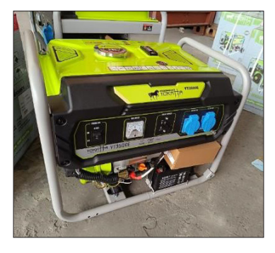
Confiscated illegal generator at Myanmar Industrial Port on 31 October.

EFFORTS to combat illegal trade, supervised by the Illegal Trade Eradication Steering Committee, are being made effectively in accordance with the law.