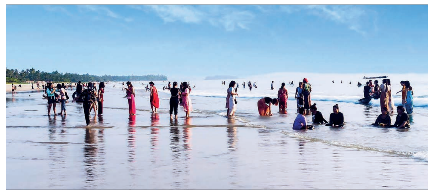
Locals visiting Ngwetaung Beach during September 2024.

"During January 2024, there were 35,455 domestic visitors; in February, the number was 36,555; in March, it was 38,955; in April, there were 48,955; in May, we had 54,555; in June, the number was 17,455; in July, we saw 15,455 visitors; and in August, there were 14,155 domestic tourists. Even during the rainy season, tourists are present and continually coming to relax at Ngwetaung Beach," said