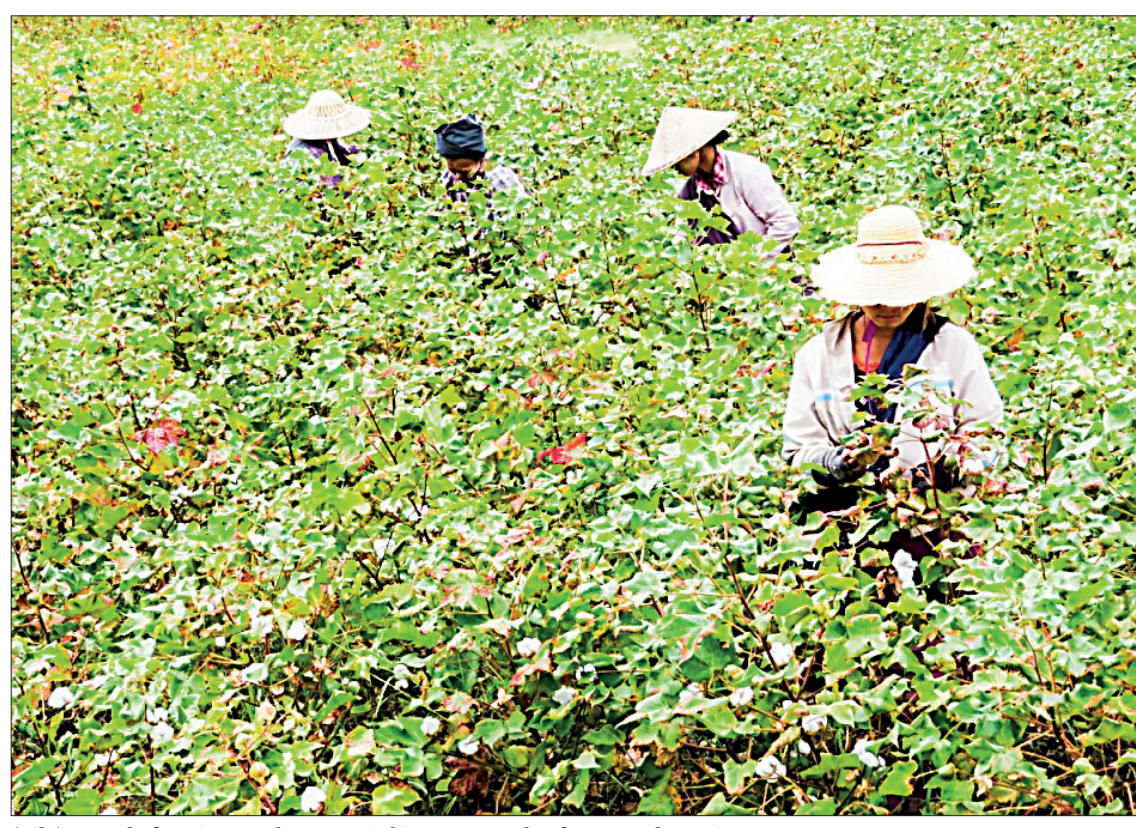
(File) Female farming workers are picking out wools of cotton plantations.

Japanese companies to recruit around 1,400 Myanmar workers