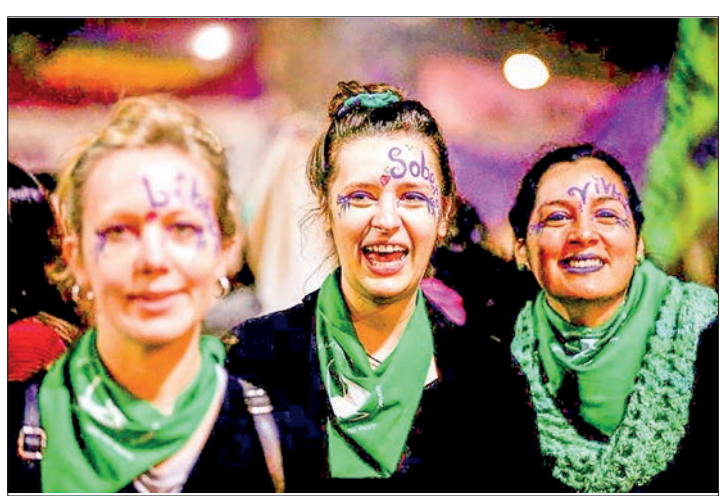
Protesters in Buenos Aires sported the green and purple favoured by women's rights groups in Argentina.

In a festive mood despite their serious message, demonstrators decried budget cuts they said affected HIV treatment and reproductive rights, denounced what they said was a hostile attitude from the government, and demanded passage of a comprehensive anti-discrimination