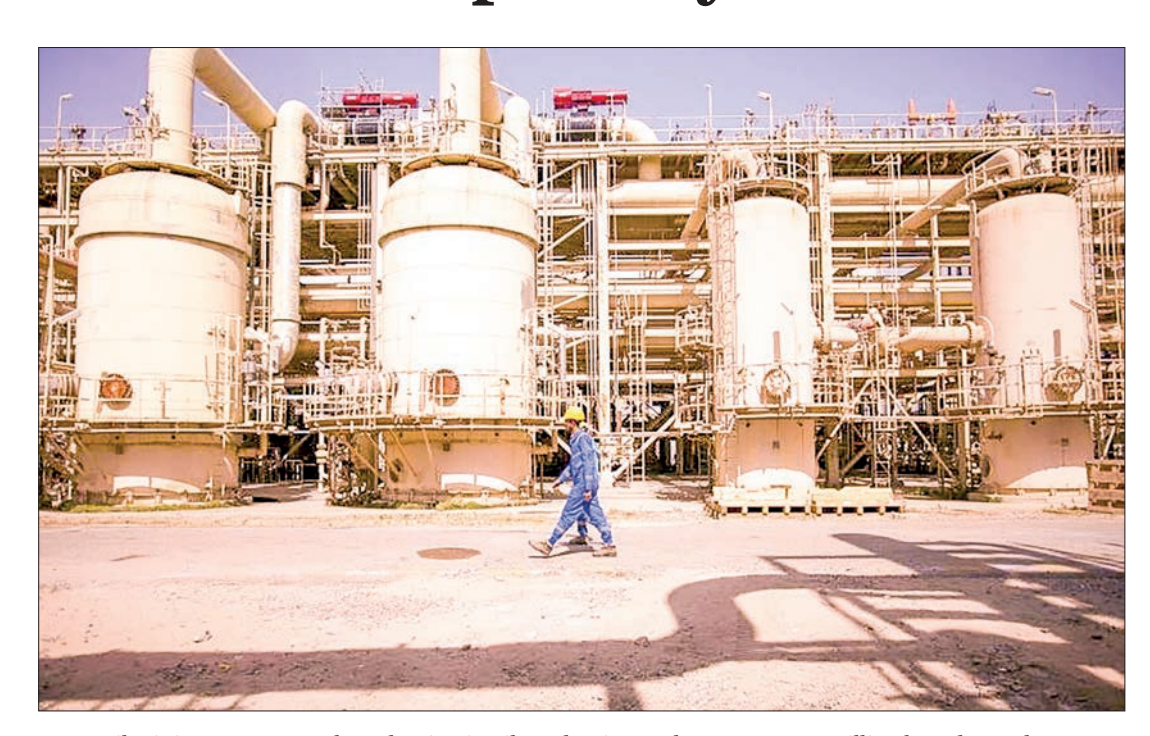
Iraq's Oil Ministry announced a reduction in oil production and exports to 3.3 million barrels per day to comply with OPEC+ agreements.

IRAQ'S Oil Ministry said Friday that the country has reduced its oil production and cut its crude exports to 3.3 million barrels per day, in line with its commitment to the OPEC+ agreement on output cuts.