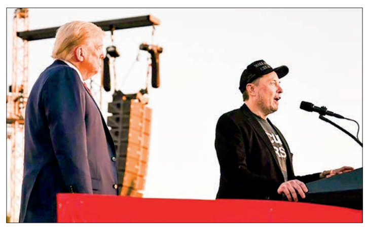
Elon Musk speaks on stage as he joins Donald Trump during a campaign rally.

IN a surprising development Trump's most prominent supin the upcoming election, Elon porter, significantly influencing