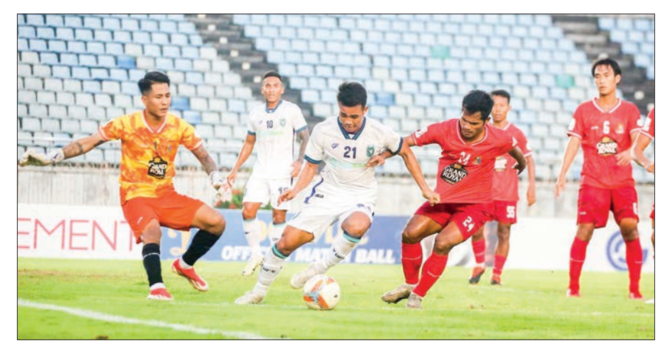
Hanthawady United and Yangon United in action during the match.

THE MNL Fixture (13) kicked off yesterday at Thuwunna Youth Training Centre, where Hanthawady United and Yangon United played to a 2-2 tie.