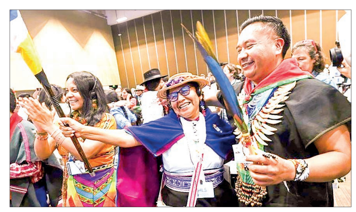
Representatives of Indigenous peoples broke out in cheers and chants as 196 countries agreed on a 'subsidiary body' dedicated to Indigenous representation.

The world's largest nature protection conference in Cali, Colombia, established a permanent body to represent Indigenous peoples under the UN biodiversity convention.