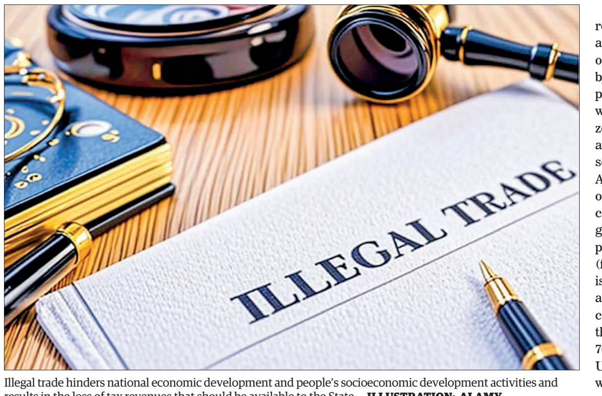
results in the loss of tax revenues that should be available to the State.

produced by the domestic micro, small and medium enterprises due to the lack of fair competition in the market is a major threat to the long-term survival of domestic manufacturing enterprises. The increase in illegal trade has led to high commodity prices, financial instability, and national security, as well as affecting law and order. Illegal trade must be effectively prevented as a national duty. Regarding unlawful trade, in the World Illegal Trade Index released in 2018, Myanmar ranked 82<sup>nd</sup> out of 84 countries with only 23 points. The Global Illegal Trade Status Index is known to be measured by four indicators such as government policy, supply and demand, transparent trade, and customs procedures. Regarding the increase in the global illegal trade situation due to Myanmar's illegal trade, the "Steering Committee on Countering Illegal Trade" was re-organized in December 2021, aiming to coordinate with the relevant departments in order to promote inter-departmental cooperation at the national level