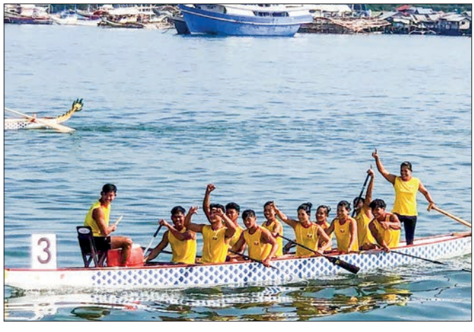
Activity of team Myanmar seen celebrating victory for the mixed 500-metre 10-oar race.

Myanmar's dragon boat athletes participated in races from 24 October to 3 November in Yichang, China, and Puerto Princesa, the Philippines, finishing with a total of six gold and three silver medals. They are set to compete again at