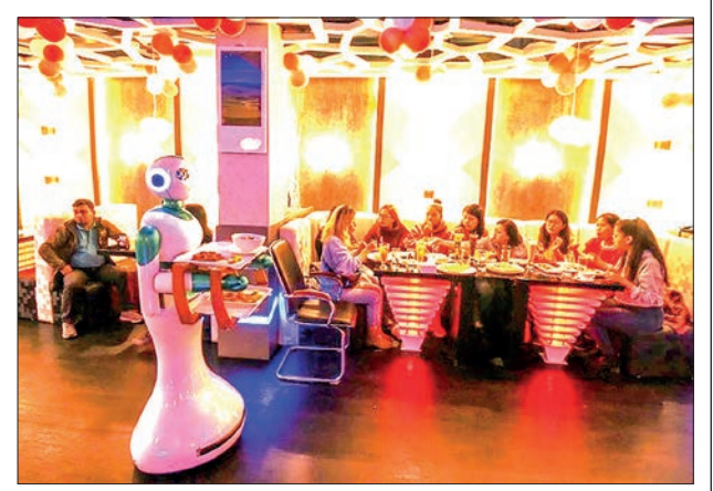
At Naulo restaurant in Kathmandu, robots efficiently serve customers, adding a modern twist to the dining experience.

The tourism sector emerged as a leading recipient of foreign investment, capturing 64 per cent of the total commitments. This was followed by the services sector at 24 per cent, manufacturing at 7 per cent, agriculture at 4 per cent, and information technology at 1 per cent, reported the Kathmandu Post. — ANI