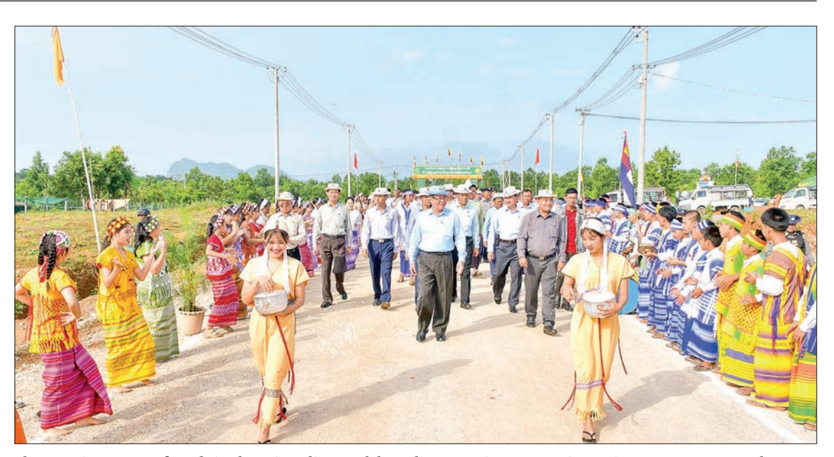
The opening event of roads in the Mizan livestock breeding zone in progress in Kayin State on 2 November 2024.

In his speech, the chief minister highlighted the two major breeding industries – pig and goat breeding in the Mizan Livestock Breeding Zone, and the benefits of interconnected roads in the zone, ensuring the emergence of a focal livestock breeding zone that transports products to market at affordable costs.