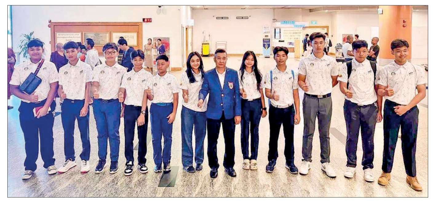
Myanmar youth golfers depart for the 15<sup>th</sup> Singha Thailand Junior World Golf Championships 2024 on 29 October.

THE 15<sup>th</sup> Singha Thailand Junior World Golf Championships 2024 will take place from 30 October to 3 November in Thailand, and the Myanmar youth golf team is set to participate. On the morning of 29 October, the team departed from Yangon.