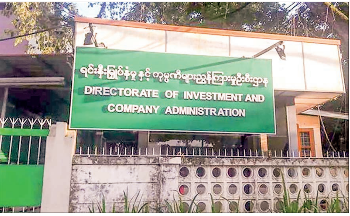
The office of the Directorate of Investment Company Administration (DICA) in Yangon.

A total of 6,400 companies also failed to submit the AR in 2023. The registration and re-registration of companies on the MyCO website commenced on 1 August 2018, in keeping with