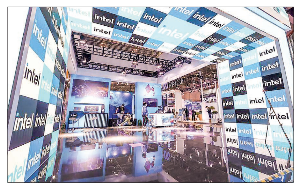
Workers set up the exhibition booth of Intel Corporation in preparation for the fifth China International Import Expo (CIIE) in east China's Shanghai, 2 November 2022.

US chip giant Intel on Monday announced the expansion of its packaging and testing base in southwestern China to boost local supply chain efficiency and better serve Chinese clients.