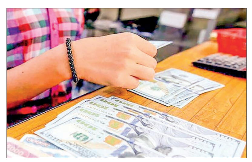
A counter staff is pictured counting greenback notes at the money exchange outlet.

THE Central Bank of Myanmar foreign exchange trading plat-