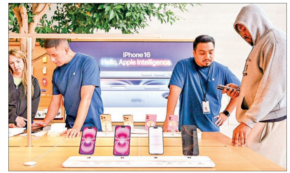
The new Apple iPhone 16 models on display upon release on 20 September 2024 at the Apple Store at The Grove in Los Angeles, California. PHOTO: AFP

The powers of Apple Intelligence are for now only available in US English. — AFP