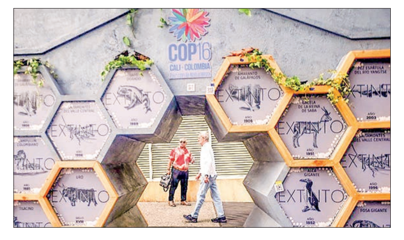
People pass by an exhibition of extinct species at the Green Zone of the COP16 summit in Cali, Colombia, on 28 October 2024. The COP16 biodiversity summit in Cali, Colombia, enters its second week Monday to assess, and ramp up, progress towards achieving 23 targets agreed in Canada two years ago to halt and reverse nature destruction by 2030.

"This leaves a land area roughly the size of Brazil and Australia combined, and at sea an area larger than the Indian Ocean, to be designated by 2030 in order to meet the global target," said the Protected Planet Report. — AFP