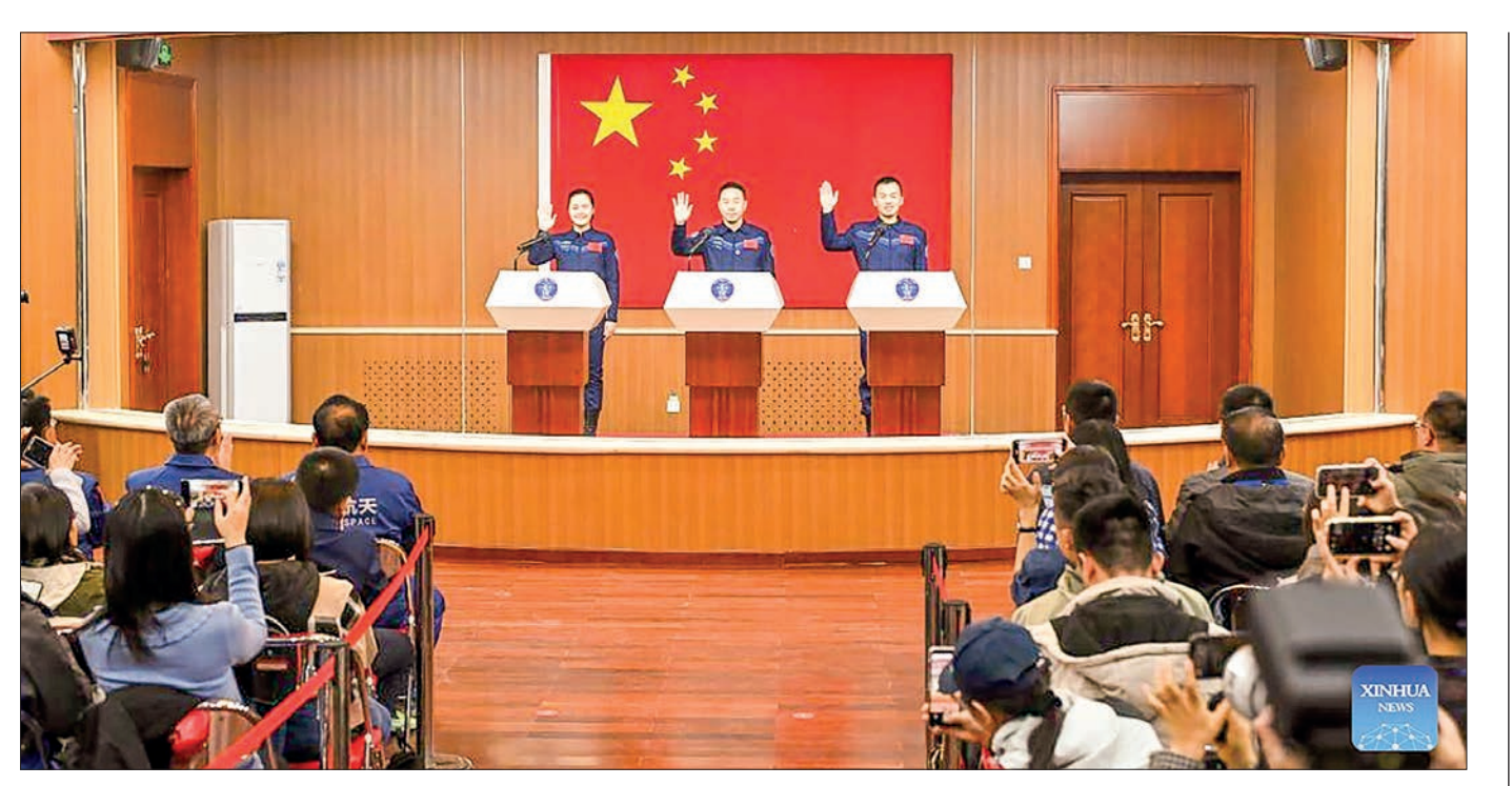
Chinese astronauts Cai Xuzhe, Song Lingdong and Wang Haoze, who will carry out the Shenzhou-19 spaceflight mission, meet the press at the Jiuquan Satellite Launch Centre in northwest China, 29 October 2024.

China's leading science institution launches international programme on synthetic cells PAGE 14