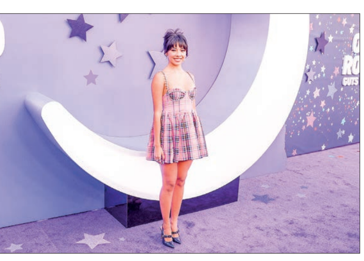
US singer Remi Wolf attends the world premiere of "Here" during AFI Fest at the TCL Chinese Theatre in Hollywood on 25 October 2024.

But rather than just relying on makeup, filmmakers teamed up with AI studio Metaphysic on