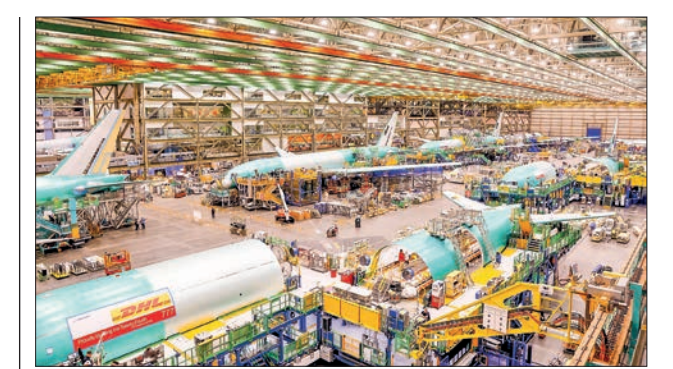
(FILES) This general view shows Boeing 777 freighters and 777X as they are assembled at the Everett Production Facility in Everett, Washington on 26 June 2024. Boeing on 28 October 2024, announced a stock offering expected to raise up to US$19 billion, saying proceeds will go towards repaying debt and investing in its subsidiaries.

Labour leaders have vowed to put up fierce resistance, setting the stage for what Bild newspaper called a "hot winter" of strike action at Volkswa-