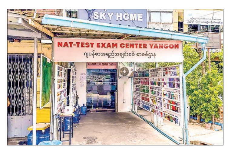
The Nat-Test Exam Centre in Yangon.

CERTIFICATES and result scores of the Nat-Test that took place on 6 October have been available as of 28 October, Nat-Test Centre, Yangon announced.