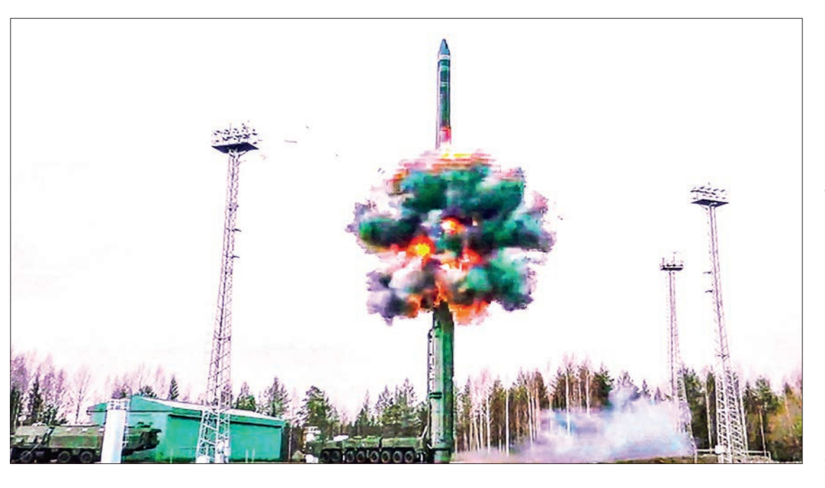
This grab from a handout footage released by the Russian Defence Ministry press service on 29 October 2024, shows the launch of a Yars intercontinental ballistic missile during drills of the strategic deterrence forces.

Chief of the General Staff Valery Gerasimov reported to the president on the procedure for conducting the drill.