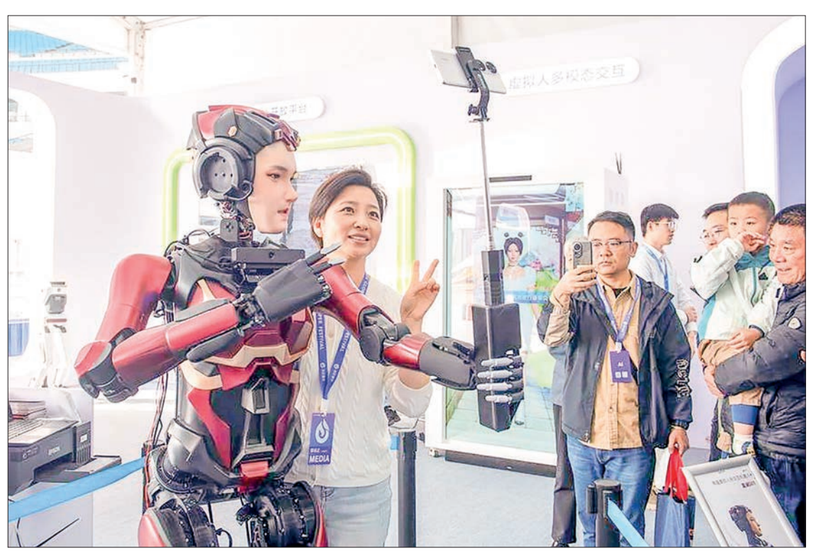
A humanoid robot takes selfies with a visitor at the 7<sup>th</sup> World Voice Expo in Hefei, east China's Anhui Province, 24 October 2024.

At the 7<sup>th</sup> World Voice Expo in Hefei, a humanoid robot quickly identified and handed a visitor a coffee bottle, showcasing advancements in AI-powered robotics by iFLYTEK, which supports numerous robotics enterprises and developers across China.