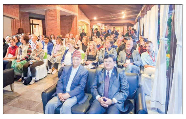
Myanmar Ambassador to Nepal U Myo Myint Maung attending the United Nations Day Celebration in Nepal.

tended the GLOMUS Festival on 20 October, hosted by the Nepal Music Centre and the GLO-MUS Network, which included music and dance performances promoting unity through cultural exchange. The festival was also attended by Nepal's Minister for Culture, Tourism, and Civil Aviation, as well as foreign mission heads and international musicians in Kathmandu. -ASH/TMT