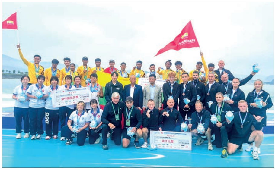
The Myanmar rowing team is seen after receiving the gold medal in China.

fourth-place position. The competition will now head to the 2024 ICF Dragon competed \, in \, eight \, events, finishing \, with \quad pants \, \, from \, \, China, \, Europe, \, Asia, \, and \, five gold and two silver medals, and a ASEAN countries. The Myanmar team