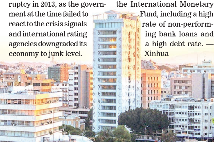
Nicosia, the island's financial hub.

Cyprus' downward ratings trend started at the beginning of the 2008 world economic crisis and finally led to a bankruptcy in 2013, as the govern-