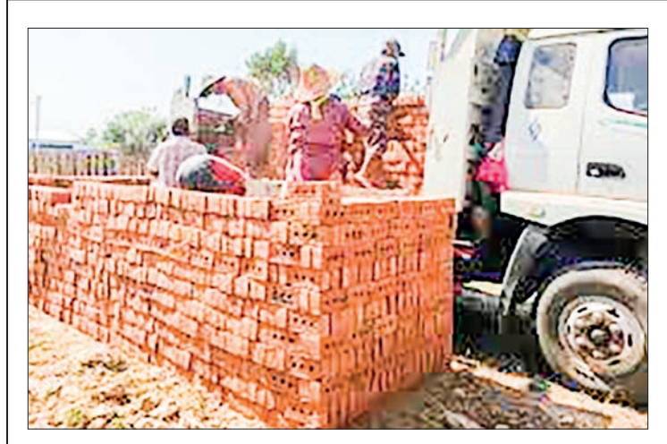
Workers are loading bricks at a brick trading.

Pwintbyu Township in the Magway Region has the most irrigated farmland among all townships in the region and is the leading producer of rice annually. During this year's rainy season, farmers in the township exceeded their planting target, cultivating a total of 69,999 acres of paddy, surpassing the initial target of 69,944 acres, according to the Pwintbyu Township Agriculture Department. — Hlaing Win Lay (Pwintbyu Myay)/TRKM