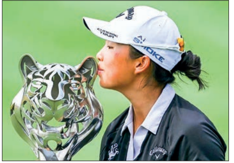
China's Yin Ruoning kisses the trophy after winning the LPGA Maybank Championship golf tournament at the Kuala Lumpur Golf and Country Club.

WORLD number four Yin Ruoning shot a superb final-round 65 to win her second tournament in three weeks at the US LPGA Tour's Maybank Championship in Malaysia on Sunday.