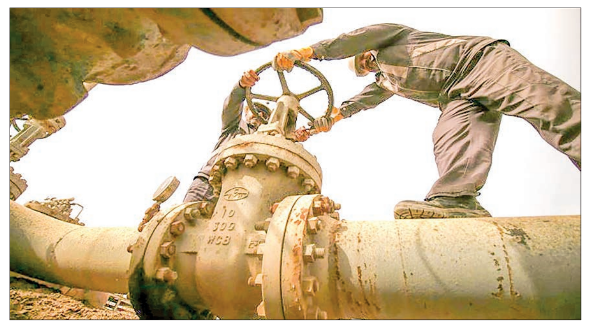
Heavy monsoon impacted diesel demand, decreasing nearly 2 per cent year-over-year. In contrast, gasoline demand grew by 3 per cent year-over-year, though it declined compared to the previous month.

"Looking ahead to Q4, we estimate India's oil demand to grow by 3.5-4 per cent year over year. We forecast an annual demand increase of 50,000-55,000 b/d for both gasoline and diesel in Q4, although the northeast monsoon rains may slightly