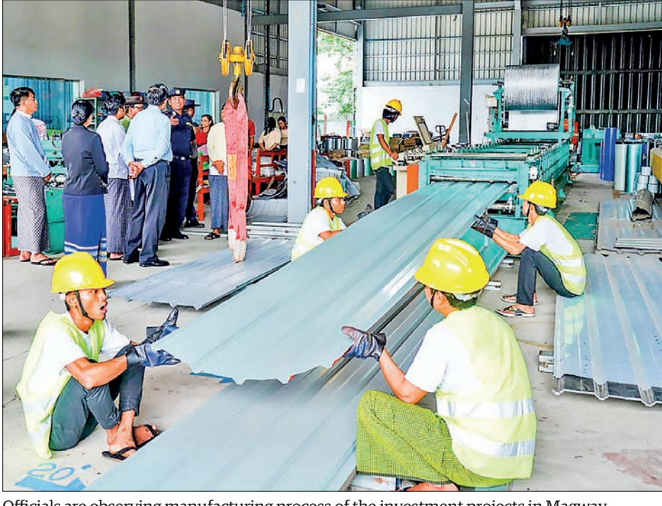
Officials are observing manufacturing process of the investment projects in Magway Industrial Zone.

An officer from the Magway Region Government stated, "In the first six months of the 2024-2025 financial year, the Magway Region Investment Committee approved six new investment projects. Among these, two projects of Myanmar citizens have a combined investment value exceeding K20 billion, while the remaining four