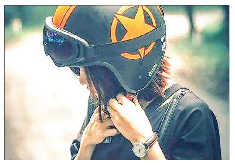
Consumers can verify a helmet manufacturer's BIS licence through the BIS Care App or by visiting the BIS website.

"This poses a severe risk to public safety and has been linked to numerous fatalities in road accidents. There is an urgent need to tackle this issue head-on. The Government calls for strict enforcement against manufacturers operating without BIS licenses or