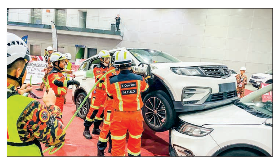
Myanmar participant competing in the rescue skills competition.

team. Prior to the competition, the team was under training using ten old vehicles to simulate real-life scenarios.