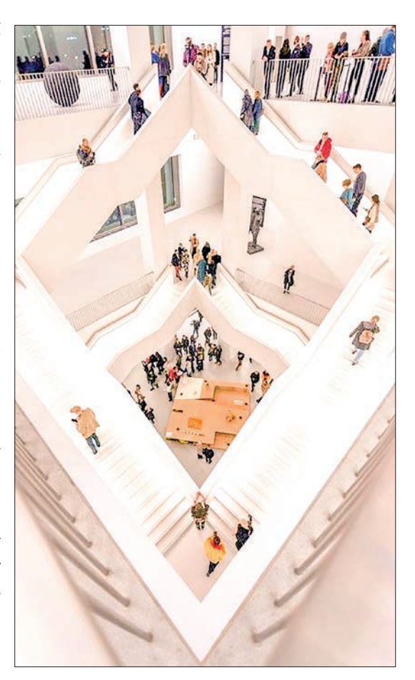
The new building of Warsaw Museum of Modern Art is seen over the street with the Soviet era Palace of Culture and Warsaw's downtown skyline in background in the Polish capital of Warsaw on 25 October 2024.

Architect Phifer described the site choice as courageous, envisioning the museum as a gagement, transforming the historical legacy