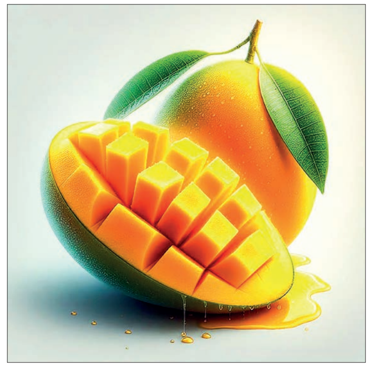
Key fruits such as mango, litchi, and guava have been particularly affected by climate change.