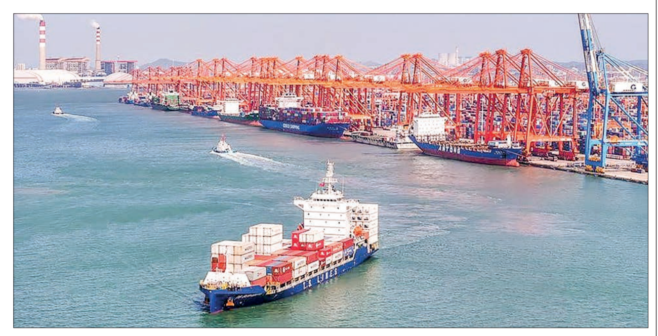
An aerial drone photo taken on 24 October 2024 shows a container ship carrying new energy vehicle (NEV) parts at the Qinzhou Port in Qinzhou, south China's Guangxi Zhuang Autonomous Region.

Qinzhou Port has experienced a 70-fold rise in new-energy vehicle parts exports over five years, shipping 11,370 TEU containers in 2023.