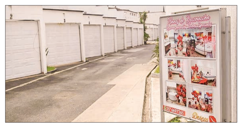
The Deseos Motel in Cali is one of several to host delegates to the COP16 biodiversity summit. Private parking bays lead directly to the rooms. PHOTO: AFP

The facility now offers daily rates of 150,000 Colombian pesos (approximately $35) and breakfast service to accommodate guests. With features like Jacuzzis and "kama sutra" loungers, the motel presents a stark contrast to typical hotel settings, showcasing the unexpected accommodations delegates encountered during the bustling summit. — AFP