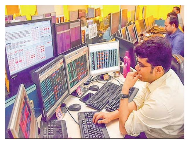
October derivatives expiry may heighten volatility, while upcoming auto sales data will offer additional insights. PHOTO: ANI

ers say that the upcoming expiry of October derivatives contracts is