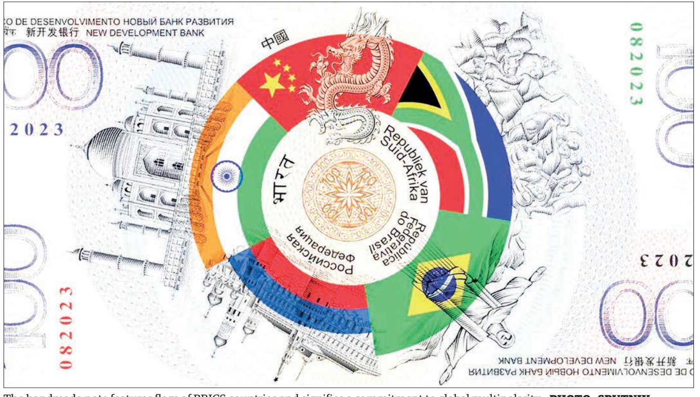
The handmade note features flags of BRICS countries and signifies a commitment to global multipolarity.

The circular flag arrangement on the BRICS banknote symbolizes equality among member states, representing an emerging multipolar world and security against counterfeiting.