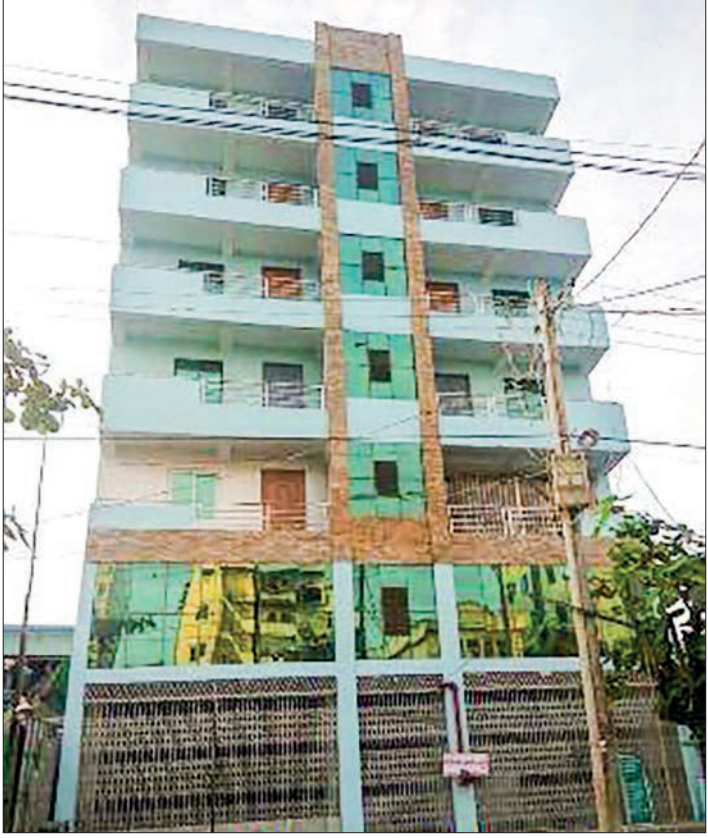
An apartment advertisement for sale in North Okkalapa Township was seen

There are more people renting in those areas. Wards with good neighbourhoods such as Wazira, Thanda, Nweni and Eaindra have more rents and sales," he said. — Thit Taw/ZN