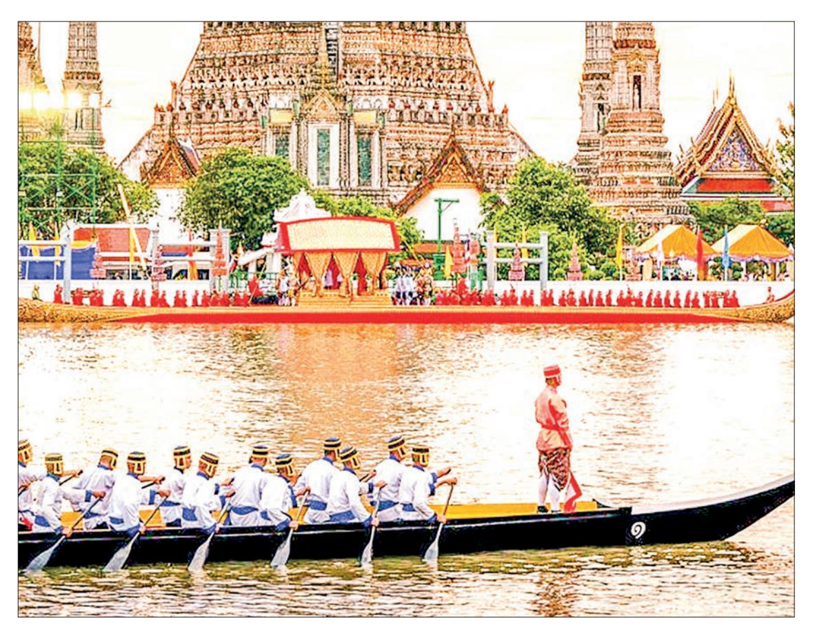
Thousands of well-wishers lined Bangkok's Chao Phraya river Sunday to watch King Maha Vajiralongkorn ride a glittering royal barge procession.

Thousands of well-wishers gathered along the Chao Phraya River in Bangkok on Sunday to celebrate King Maha Vajiralongkorn's 72<sup>nd</sup> birthday