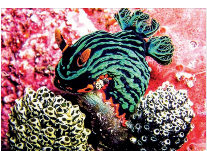
The Coral Triangle, known as the "Amazon of the seas," spans over 10 million square kilometers across several Southeast Asian countries.

The Coral Triangle, home to three-quarters of the world's