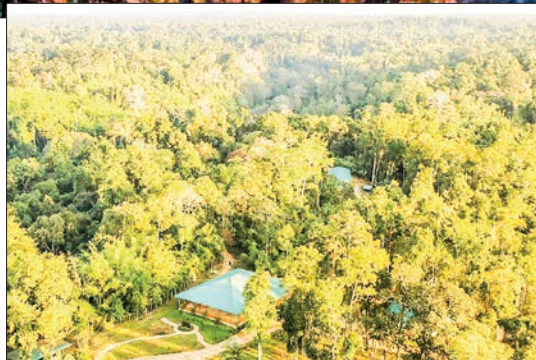
The forest in Myanmar.

ASEAN countries, and we are also working with Korea to develop the Khakaborazi National Park. The glaciers melt due to high temperatures, and the evaporation causes storms. Due