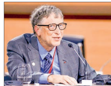
Bill Gates is an American billionaire, software developer, and philanthropist, best known as the co-founder of Microsoft Corporation.

US billionaire Bill Gates has quietly donated $50 million to a nonprofit supporting Vice-President Kamala Harris's presidential run, The New York Times