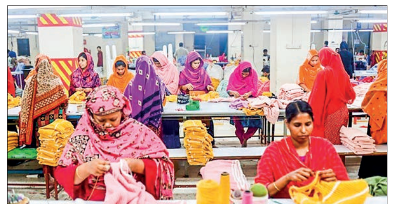
This decline is attributed to domestic political turmoil, labour unrest, and high inflation in Europe, which have negatively affected demand.

The impact from months of turmoil on business operations included work order cancellations and postponement of factory visits by representatives of international clothing retailers and brands, according to the report. — Xinhua