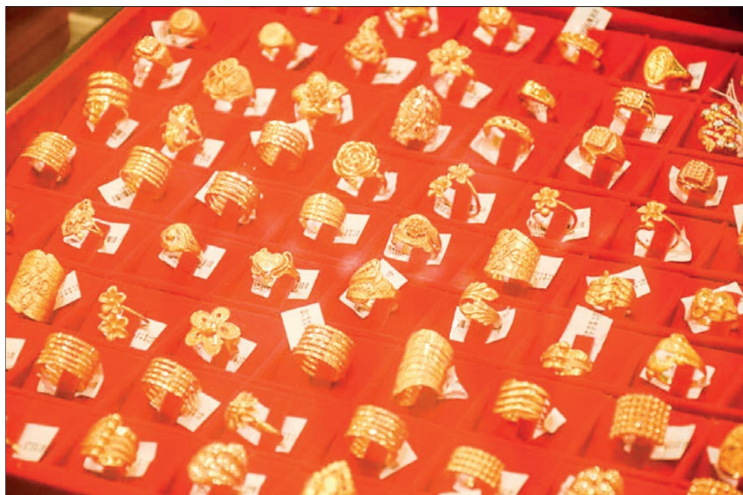
Gold ornaments are displayed for sales at one gold outlet in Yangon.

YANGON Region Gold Entrepreneurs Association (YEA) alerted gold shops in Yangon Region to enhance security measures on 22 October 2024.