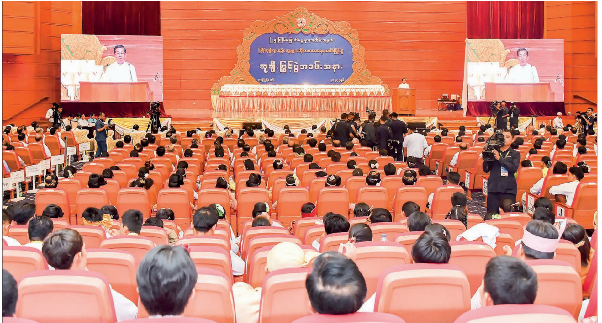
State Administration Council Chairman Prime Minister Senior General Min Aung Hlaing addresses the award-presentation ceremony of the 25 th Anniversary Myanmar Traditional Cultural Performing Arts Competition yesterday.