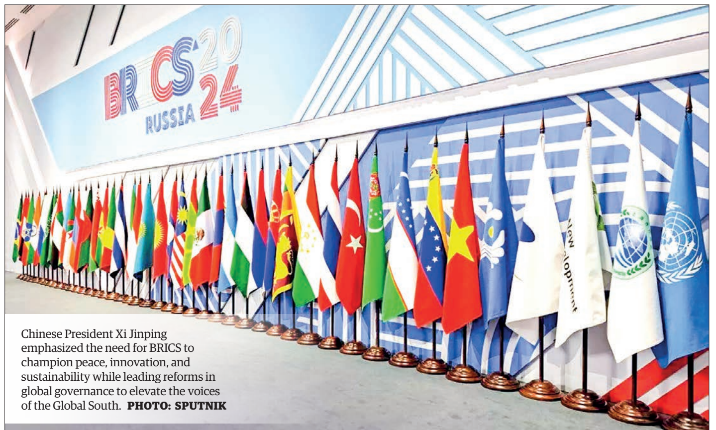
Chinese President Xi Jinping emphasized the need for BRICS to champion peace, innovation, and sustainability while leading reforms in global governance to elevate the voices of the Global South.

At the 16 th BRICS Summit, Chinese President Xi Jinping urged member nations to unite for high-quality development and expand their cooperation.