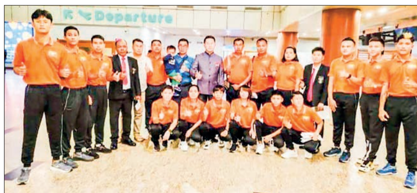
The Myanmar national Sepak Takraw team is seen before departing for China.

Teams from Myanmar, China, Thailand, Cambodia, Laos, and Vietnam will compete in the tournament.