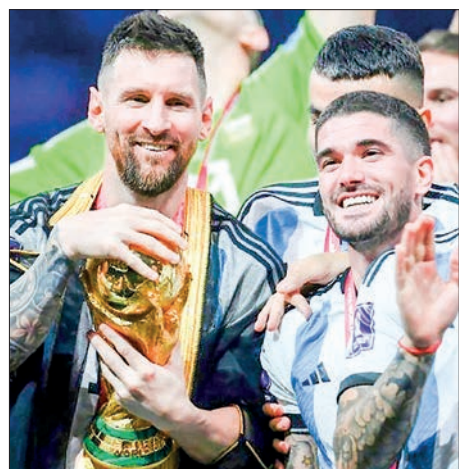
Lionel Messi holds the trophy after Argentina beat France on penalties in last year's World Cup final in Doha.

or ten African countries (and regions) participating in the World Cup," said Infantino, noting that the increase is to be made in line with FIFA's expanded World Cup format.