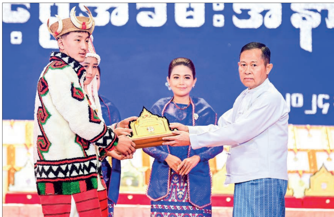
SAC Vice-Chair Deputy PM Vice-Senior General Soe Win presents an honorary awards to the ethnic traditional cultural troupe yesterday.

sic song) female amateur (first grade) contest.