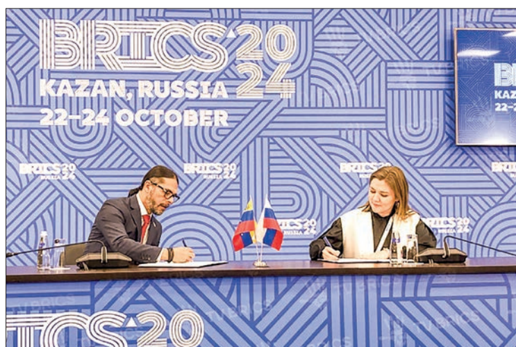
This agreement reflects Venezuela's desire to strengthen ties with BRICS nations and promote its perspectives on global issues through the platform provided by BRICS TV.

"Mr Gates's donation went specifically to Future Forward's nonprofit arm, Future Forward USA Action, which as a 501(c)(4) 'dark money' organization does not disclose its donors, according to the people briefed. So any contribution by Mr Gates will never appear on any public filing," the media clarified. — SPUTNIK