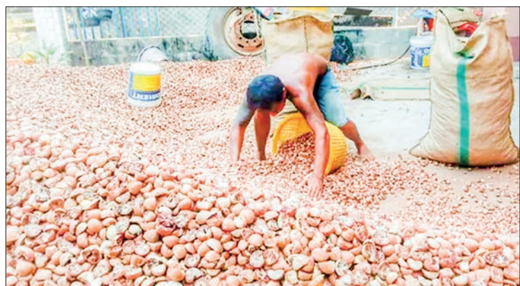
This file photo shows a worker cleaning the dried betel nuts.

Areca palm business thrives well in moist soil, yet soaking wet with overwatering is bad for them. They are commonly found in Ayeyawady, Bago, and Taninthayi regions, as well as the Mon, Kayin, Kachin, and Rakhine states.