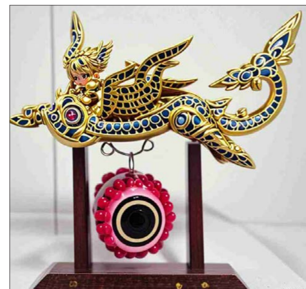
ပတ်စာခွာ ဖျာသိမ်း / pá sa khwa hpja thein:/

“Caught in the crossfire” Meaning: To become involved in a conflict between two other parties. Example: She didn't mean to take sides; she just got caught in the crossfire.