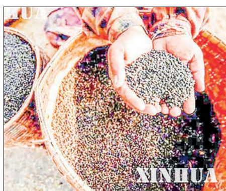
A vendor shows black grams at the market.

India primarily imports pigeon peas from countries in East Africa, such as