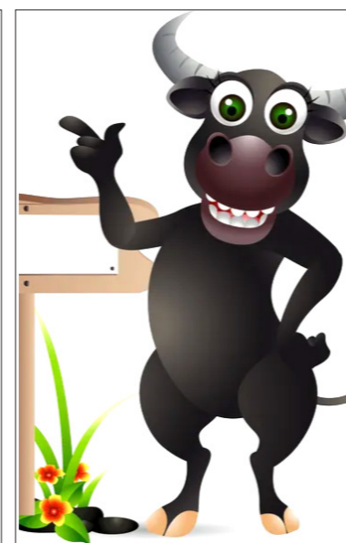
ခွာရာတိုင်း / hkwar rar tine /