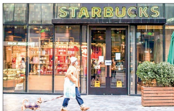
Starbucks is an American multinational coffee company and coffeehouse chain, renowned for its specialty coffee drinks, including espresso, lattes, and cold brews.

The company said such results were driven by “softness in North America’s revenues in the quarter,” specifically a six per cent decline in US comparable store sales, driven by a 10 per cent decline in comparable transactions — but partially offset by a four per cent increase in average transactions. — AFP