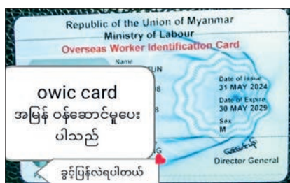
An online advertisement on OWIC services.

"Housemaids who try to go abroad unofficially are often cheated. So I would like to suggest they follow the government's rules and try to go