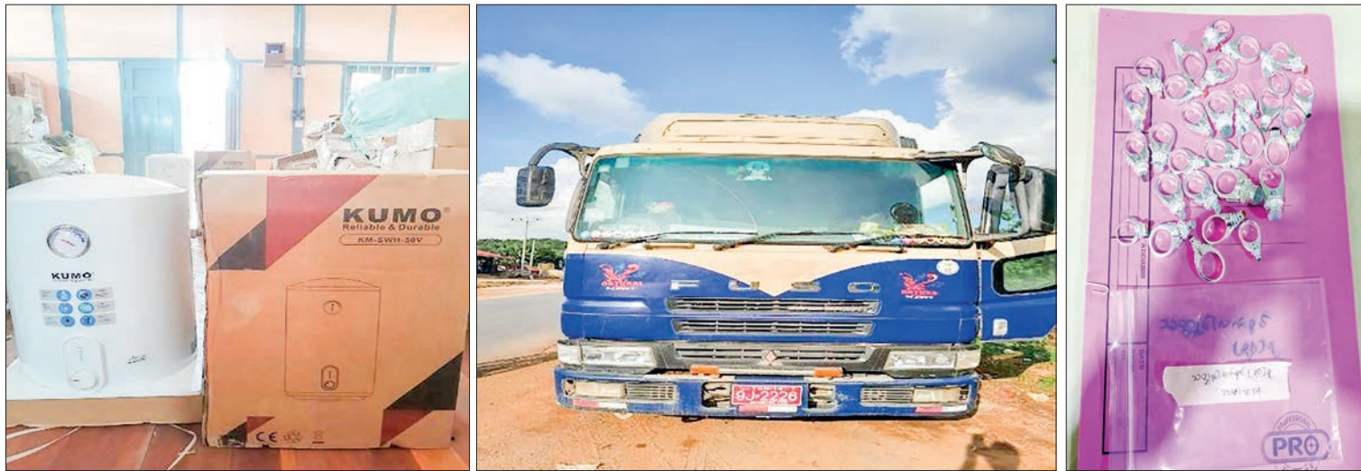
Illegal personal goods, industrial materials and vehicles being confiscated in Shan State.

EFFORTS to combat illegal trade, overseen by the Illegal Trade Eradication Steering Committee, are being carried out effectively following the law.