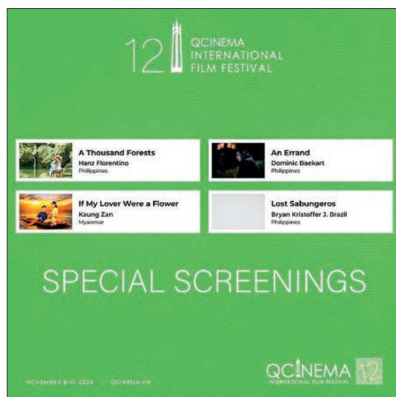
This image shows the names of the films selected to be screened at the Philippines Film Festival, their directors, and their countries.

During the screening of the film, it received many positive reactions from the audience. — Htet Oo Maung/ZN