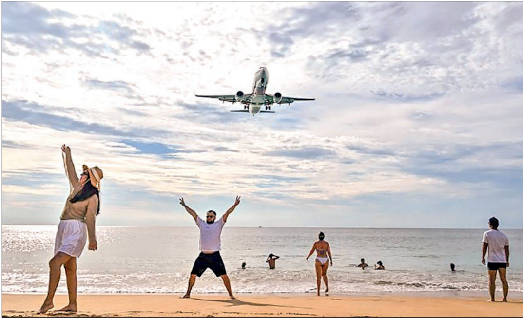
The initiative, proposed by Thailand, aims to enhance cross-border travel among six Southeast Asian countries.