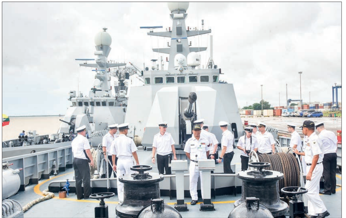
Myanmar and Russian naval officers seen before departing for Maritime Security Exercise yesterday.

THE opening ceremony of the second Myanmar-Russia joint security naval exercise was held at Thiri Maha Zeya Kyaw Htin Hall of the Naval Training Command on 22 October.