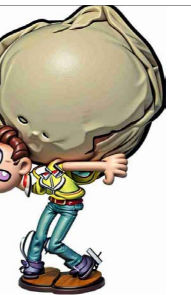
ပတ်ထမ်းတွေ / paat htam twae/

When a small buffalo intends to confront a giant buffalo, it examines its own hoof marks in comparison to those of the larger animal.