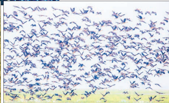
Waterfowl seen in Myanmar's ASEAN Heritage Site.

to the storm initiated in the Bay of Bengal and the South China Sea, the areas with weak conservation can encounter landslides and flooding. Myanmar needs to keep conserving the forests like Htamathi Wildlife Sanctuary," said U Aung Khine Soe, director of the Environmental Conservation Department.