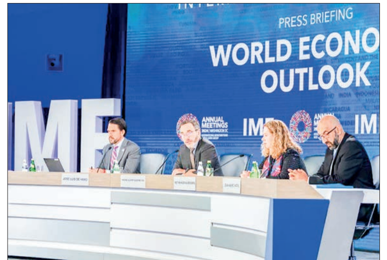
IMF Chief Economist Pierre-Olivier Gourinchas (2 nd L) speaks at a press conference in Washington, DC, the United States, on 22 October 2024.

In response to a question from Xinhua, IMF Chief Economist Pierre-Olivier Gourinchas said at a press conference that rising geopolitical tensions are “something that we are very concerned about”, noting that there are two dimensions of the impact. — Xinhua