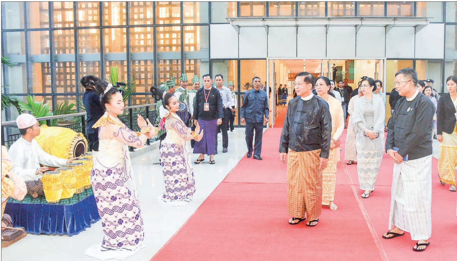
SAC Chair Premier Senior General Min Aung Hlaing and wife Daw Kyu Kyu Hla attend the honorary dinner yesterday.