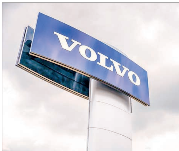
Volvo Cars said it expects to see minimal sales growth in the fourth quarter.

“As a result of this, we now anticipate full-