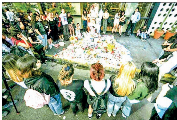
Fans have paid tribute to British singer Liam Payne in front of the hotel where he died in Buenos Aires.

An “improvised aluminum pipe to ingest drugs” was also found in the room, ABC reported. — AFP