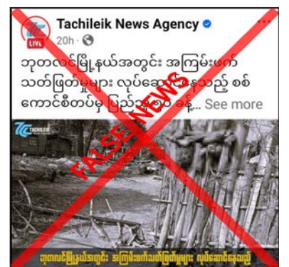
This screenshot validates fake news.

Subversive media outlets intentionally spread fake news to mislead the people about security forces, to cover terror attacks of terrorists, to instil fear among the public and to jeopardize the State's stability. — MNA/KTZH