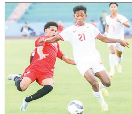
Myanmar and Yemen teams are in action during the game.

Myanmar is placed in the same Group as Yemen, Vietnam, and Kyrgyzstan. The team will face host Vietnam in their second group match on 25 October. — Ko Nyi Lay/KZL