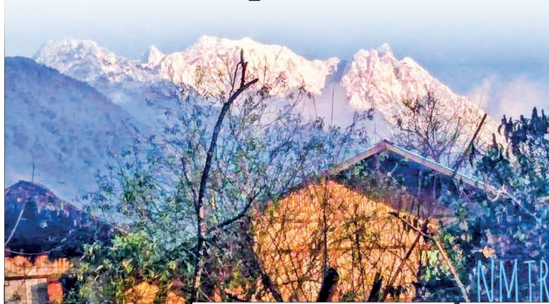
Myanmar land contributing to global environmental conservation.

"Myanmar is working with the relevant countries for environmental conservation. It needs global cooperation to succeed. The country aims to grab 30 per cent of forest coverage and 10 per cent of protected land area. Fine environmental conservation can reduce natural disasters, and so we conduct forest plantation and environmental conservation yearly. The country possesses ice-capped mountains among