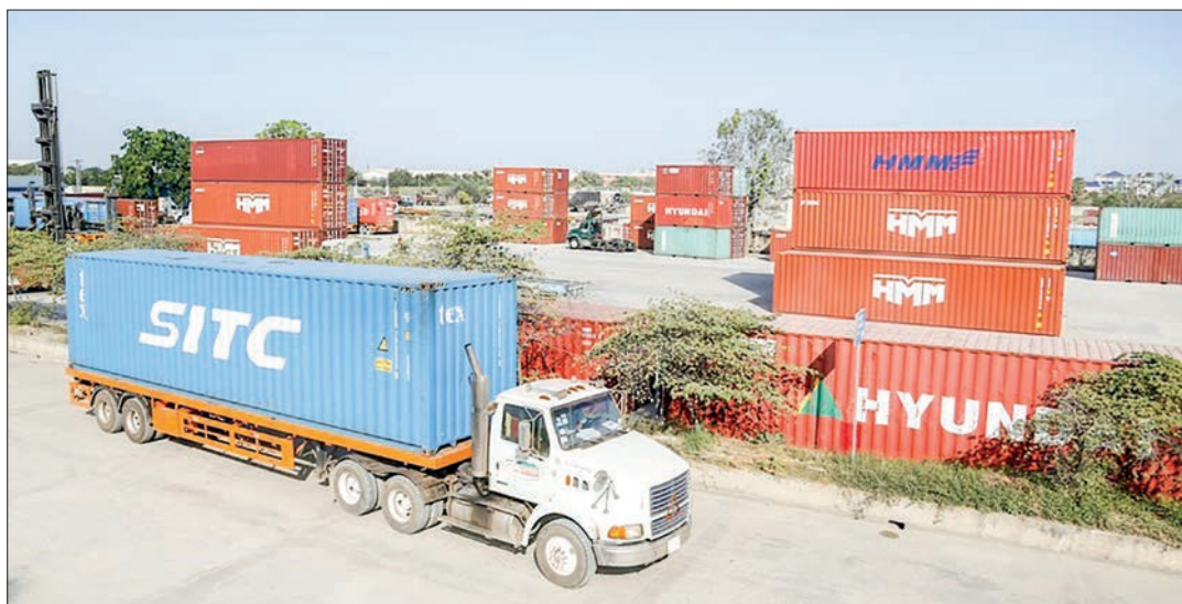
A lorry drives out of the Hong Leng Huor Dry Port on the western suburb of Phnom Penh, Cambodia, on 13 January 2022.

CAMBODIA'S trade with Regional Comprehensive Economic Partnership (RCEP) countries hit US$25.54 billion in the first nine months of 2024, up 17.1 per cent over the same period last year, a report said on Tuesday.