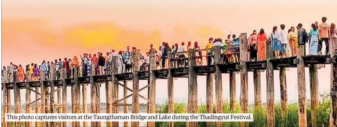
This photo captures visitors at the Taungthaman Bridge and Lake during the Thadingyut Festival.

ACCORDING to U Soe Win, secretary of the bridge maintenance team, Taungthaman Bridge and Taungthaman Lake in Mandalay Region attracted over 100,000 visitors, both local and international, during the Thadingyut holiday. This popular destination draws many tourists from Myanmar and abroad, especially from Thailand, Vietnam, and Korea.