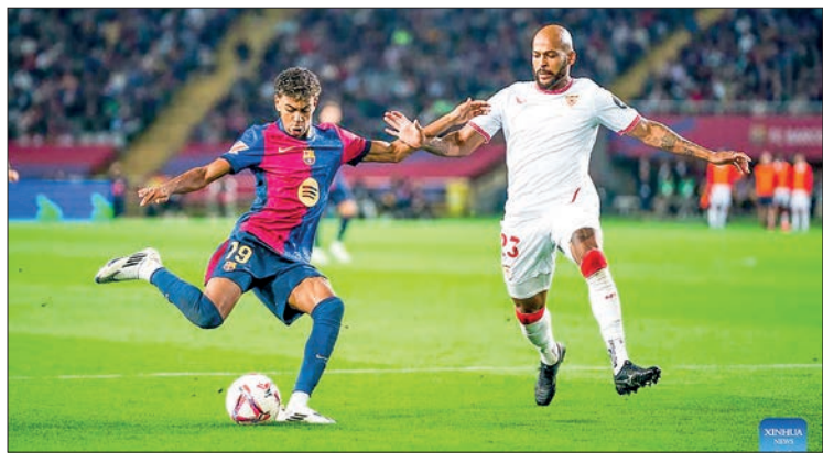
Lamine Yamal (L) of FC Barcelona vies with Marcao of Sevilla FC during the La Liga football match between FC Barcelona and Sevilla FC in Barcelona, Spain, on 20 October 2024.

FC Barcelona will go into next week's 'Clasico' away to Real Madrid with a three-point lead at the top of La Liga after a 5-1 win at home to Sevilla on Sunday night.