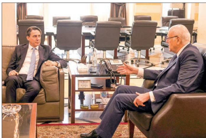
Lebanon’s caretaker Prime Minister Najib Mikati meets US special envoy Amos Hochstein in Beirut on 21 October 2024.

VISITING US envoy Amos Hochstein said Monday the basis of a ceasefire between Israel and Hezbollah was a 2006 United Nations resolution but that it would require full implementation.