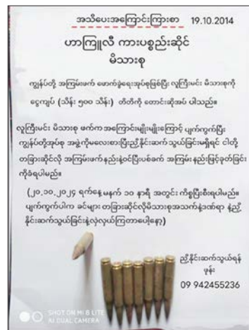
Photos of threats made to businesspeople for extortion.

pects as quickly as possible. The public can also secretly report to officials about offenders' hiding places and activities, and whistle-blowers and those who help arrest perpetrators will be covertly rewarded. — MNA/KTZH