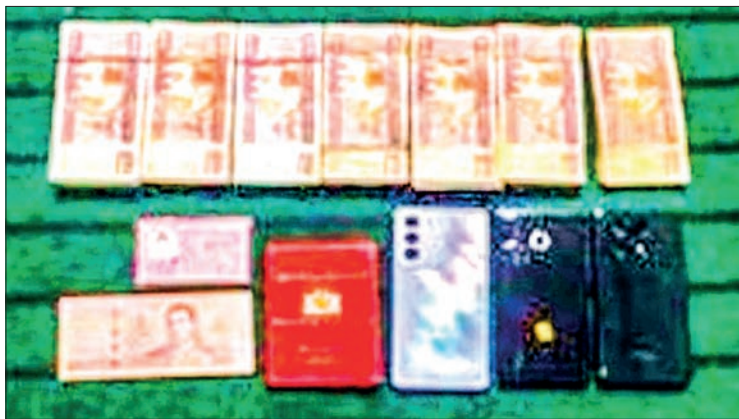
Seized cash and related items.

win, one from Nawngkhio and eight from Mandalay, totalling 27 businesspeople. He bought a YGN-13 9Q/9165 Soueast vehicle at K40 million and his house at K140 million in Moekyopyit vil-