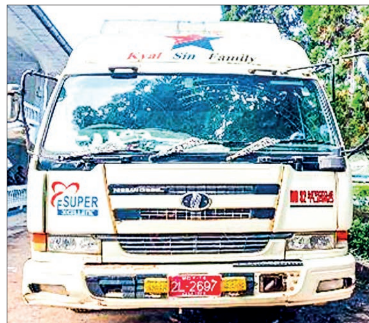
Photos show confiscated illegal items and a lorry.

Kengtung detour. The action was carried out under the Forest Law