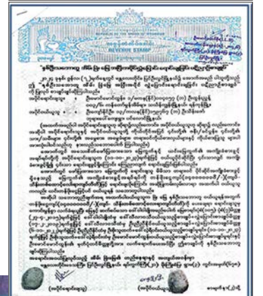
Agreement for purchasing a house.