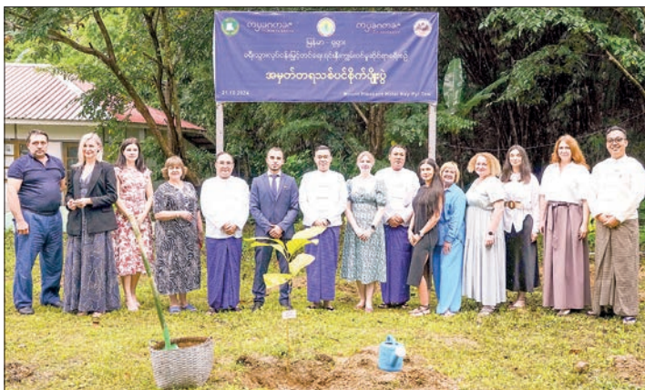
The commemorative group photo of the Myanmar-Russian FAM Trip at the tree-growing event yesterday.

During the meeting, he discussed the plans to arrange proper tours to facilitate the Russian tourists as the dry season will start soon in Myanmar, widely present the destinations of Myanmar via famous Russian news media in addition to Facebook pages, and exchange information regarding sports and adventurous trips with the