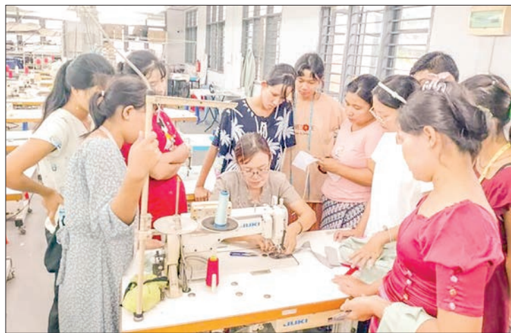
Trainees are pictured during a practical session.

Those who wish to attend the training can enrol through the contact numbers of MGHRDC at 09 940858350, 09 450723262, 09 9403912570, 09 784085794 and 09 952802635. — NN/KK