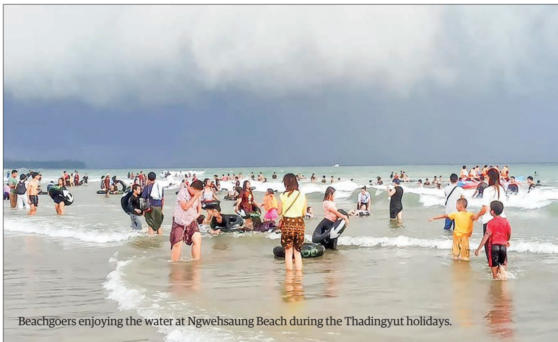
Beachgoers enjoying the water at Ngwehsaung Beach during the Thadingyut holidays.

the Directorate of Hotels and Tourism under the Ministry of Hotels and Tourism has been conducting hospitality training, foreign languages courses and work coordination meetings on the recreational quality of Ngwehsaung Beach, together with related departments, hoteliers engaged in the Ngwehsaung hotel zone and relevant institutions. — Kyaw Lin Oo (IPRD)/KK