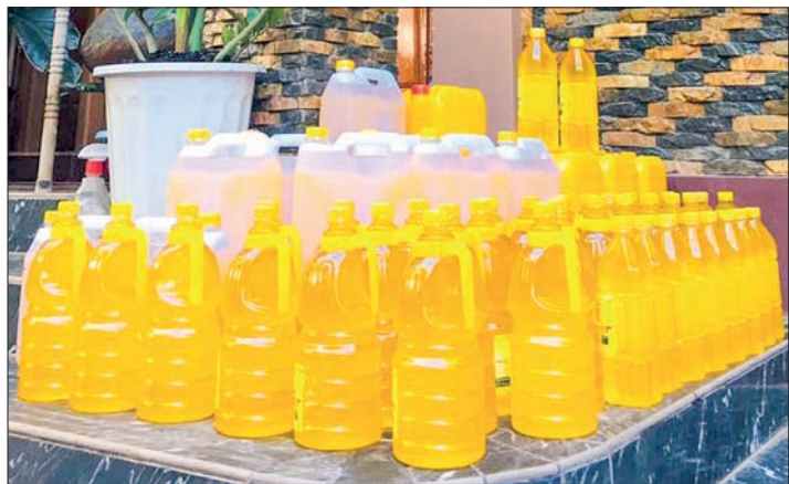
Palm oil plastic bottles for sale in the market.

THE wholesale reference rate of palm oil for the Yangon market continued to slip at K6,265 per viss this week ending 27 October, according to the Supervisory Committee on edible oil import and distribution.