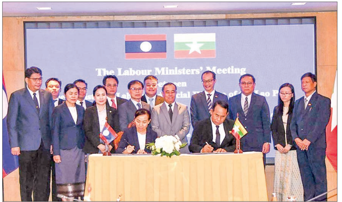
Laos and Myanmar Ministers sign a Memorandum of Understanding for labour cooperation yesterday in Laos.

Then, during the sharing session on Myanmar labour affairs and socioeconomic development, the Union minister explained the priority given to State stability and development while conducting democratic transition processes in Myanmar, efforts to promote agriculture, manufacturing and