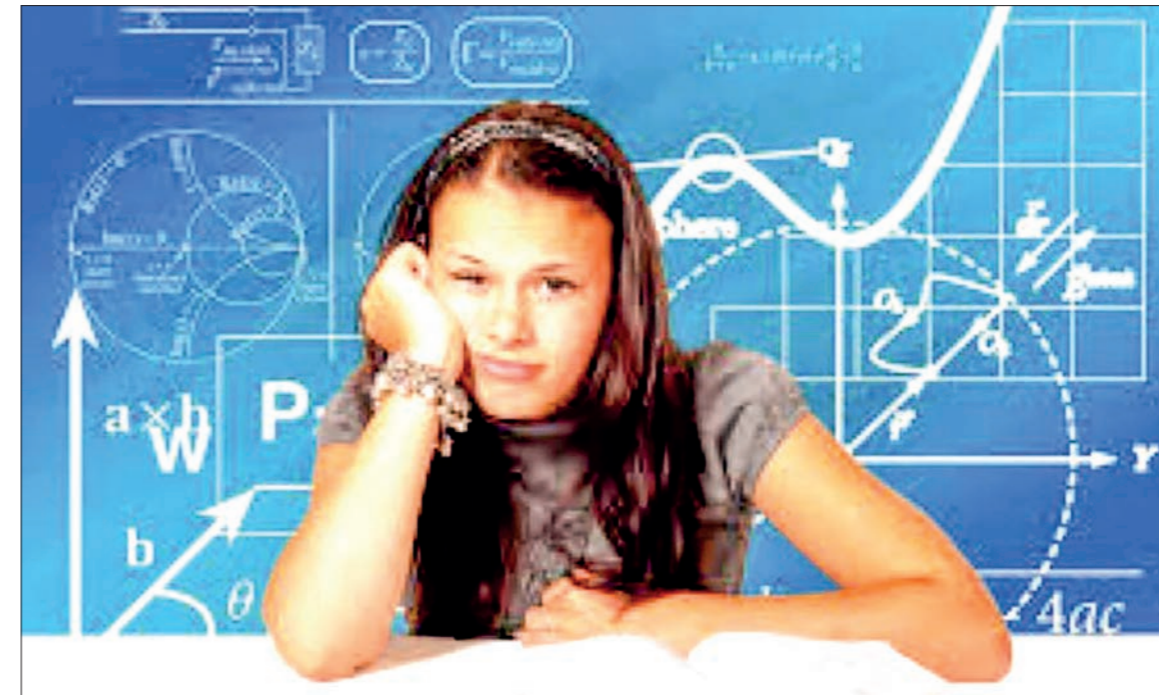
Successful participation in learning activities demands mastery of academic, social, and thinking skills, including observation, comparison, concept development, and hypothesis formulation, ensuring a comprehensive educational experience.

If students are to take part successfully in learning activities, they will need to master a wide range of skills that will help them learn. Such skills fall into three categories, namely academic skills, social skills, and thinking skills. Academic skills include reading, viewing, listening, outlining, note-taking, caption-writing, making charts, reading and interpreting maps, diagramming, tabulating, constructing timelines, and asking relevant questions. For instance, on reading and interpreting maps, finding places on a map, determining distance on a map, using a map to locate places, using simple terms of direction, using a map key and scale, interpreting the information found on different