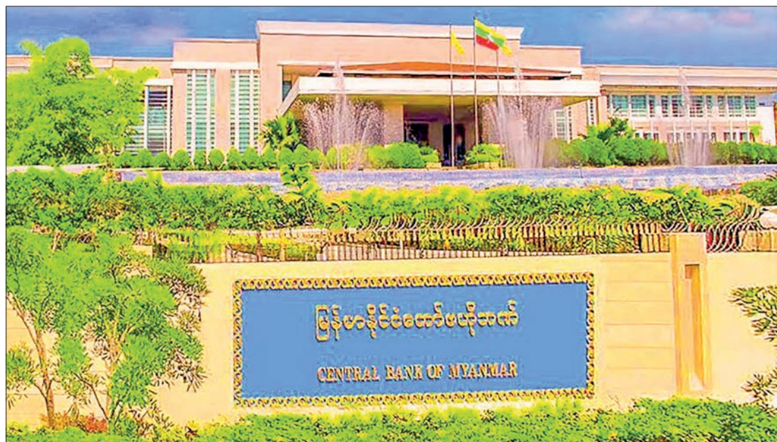
The head office of the Central Bank of Myanmar (CBM) in Nay Pyi Taw.

CBM aims to curb the instability in the foreign exchange market and the currency devaluation. According to CBM's noti-