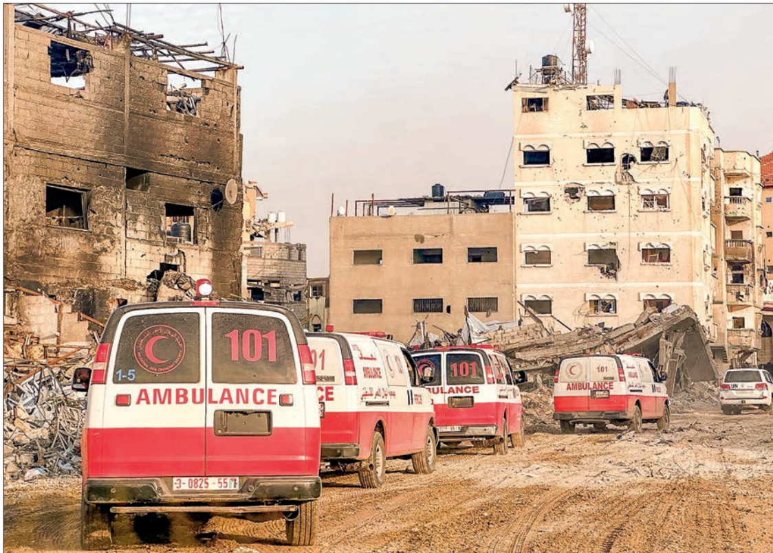
This handout photograph taken on 18 February 2024 by the World Health Organization (WHO) shows a convoy of ambulances during a WHO, UN humanitarian agency OCHA and Palestinian Red Crescent mission to evacuate patients from Nasser hospital in Khan Yunis in the southern Gaza Strip, amid ongoing fighting between Israel and the Palestinian militant group Hamas.

UP to 1,000 women and children needing medical care will shortly be evacuated from Gaza to Europe, the head of the World Health Organization's Europe branch said in comments published on Monday.