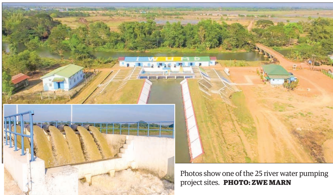
Photos show one of the 25 river water pumping project sites.

A total of 25 river water pumping projects successfully provide water to 24,518 acres of farmland in Yangon Region. The plantation of paddy and edible oil crops is expanded in Yangon Region, and the Agriculture Department replanted the damaged monsoon paddy by cooperating with the farmers to meet the estimated acres by overcoming the flooding under the guidance of the government. Moreover, the Irrigation and Water Utilization