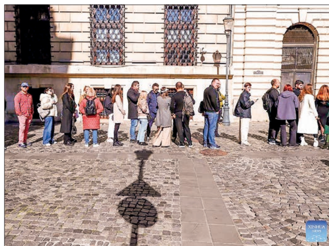
Moldovan citizens living in Romania line up to cast votes outside a polling station in Bucharest, Romania, 20 October 2024.

MOLDOVAN voters went to the polls Sunday for the country's presidential election and a referendum on joining the European Union (EU).