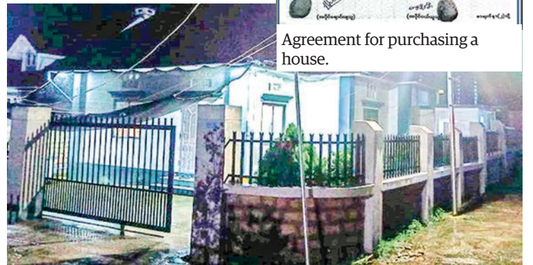
The offender used extorted money from businesspeople to buy a house.