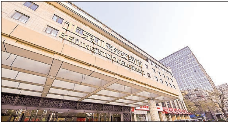
File photo shows an exterior view of the Beijing Stock Exchange in Beijing, capital of China.

CHINA will intensify its support for the listing of high-quality innovative small and medium-sized enterprises (SMEs) on the Beijing Stock Exchange and the “new third board”, a financing platform designed for SMEs.