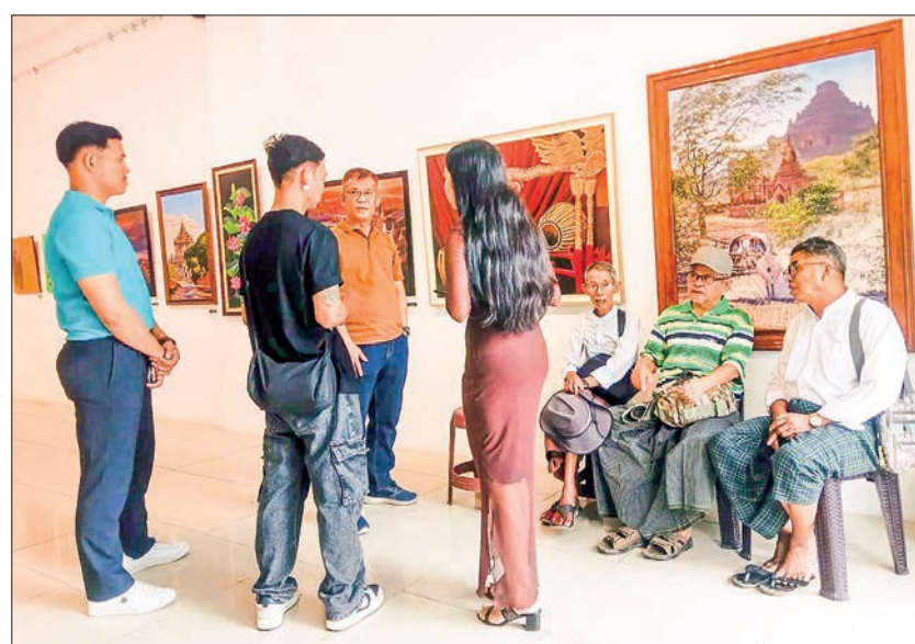
This photo showcases the audience enjoying the ‘Sweet October’ art exhibition.

ACCORDING to Izana Art Gallery, it is hosting a group art exhibition titled ‘Sweet October’, featuring the works of eleven artists from 19 to 23 October.