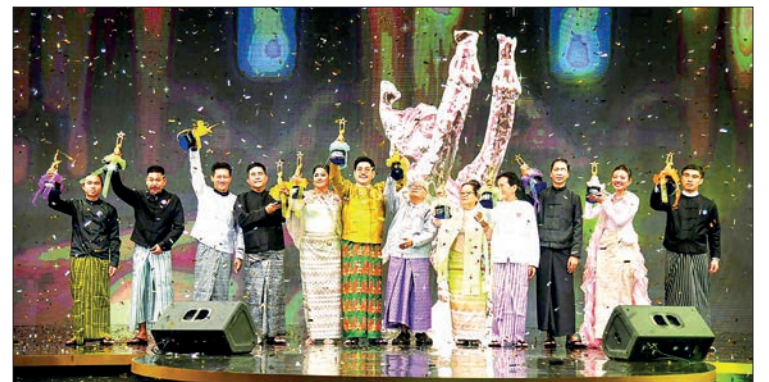
The Myanmar Academy Awarding Ceremony being celebrated in the previous year.

in Myanmar during Russia's winter, payment system and health insurance for Russian tourists, and proper assistance to facilitate the visit of Russian travellers to Myanmar. — MNA/KTZH