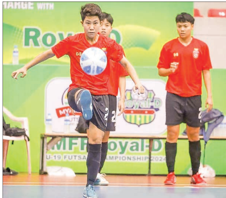
Players of Myanmar women's futsal team is under training.