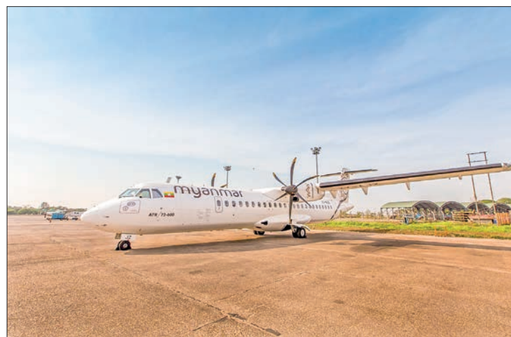
An aircraft of the Myanmar National Airlines (MNA) fleet.

These flights will be operated using ATR 72-600 aircraft. Ticket prices are set at K160,000 for the Yangon-Pathein route, K280,000 for Pathein to NyaungU, K200,000 for Mandalay to NyaungU, and K290,000 for the Yangon-NyaungU route. — Arkar Lin/TRKM