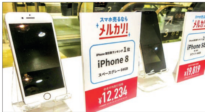
Photo taken in September 2023 in Tokyo shows used smartphones sold by flea market app operator Mercari Inc.

SALES of used smartphones in Japan are expected to hit an all-time high in fiscal 2024, as rising prices of new devices drive consumers towards more affordable options, a Tokyo-based research company said.