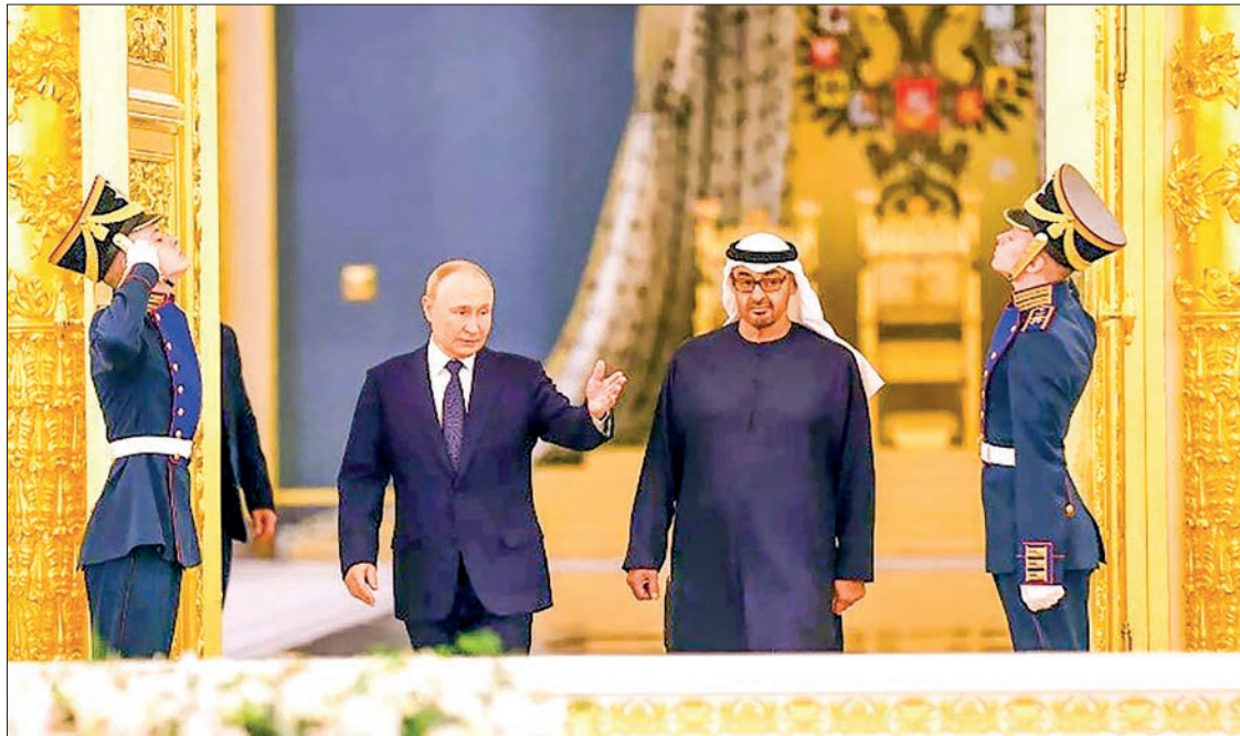
Russian President Vladimir Putin and United Arab Emirates President Sheikh Mohamed bin Zayed Al Nahyan arrive for a meeting at the Kremlin in Moscow, Russia.

efforts to further increase trade with Russia, which has exceeded $11 billion in 2023, Mohamed bin Zayed Al Nahyan said.