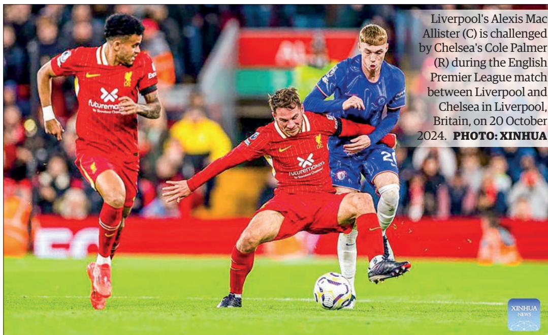
Liverpool's Alexis Mac Allister (C) is challenged by Chelsea's Cole Palmer (R) during the English Premier League match between Liverpool and Chelsea in Liverpool, Britain, on 20 October 2024.

Arsenal slipped up on Saturday when they were beaten 2-0 away to Bournemouth in a game affected by William Saliba's red card for a professional foul after 30 minutes. — Xinhua