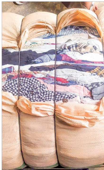
This image captures garments in thrift bags.

BALES of second-hand clothes are selling as well-wishers buy and donate clothes for the flood-affected people,