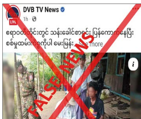
This screenshot validates fake news.

Consequently, this news is a deliberate fabrication by malicious media outlets for undermining public support through baseless accusations motivated by jealousy and hatred. — MNA/TRKM