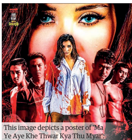
This image depicts a poster of ‘Ma Ye Aye Khe Thwar Kya Thu Myar’.