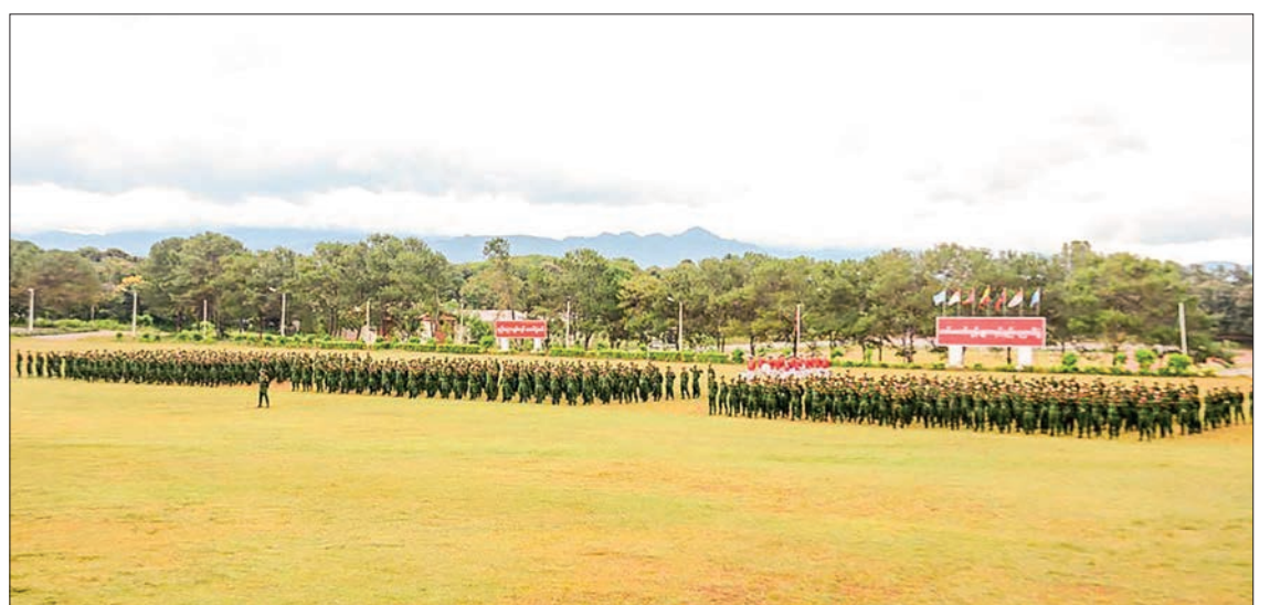
This picture shows newly conscripted trainees lining up for the opening of People's Military Service Training Course No 6 yesterday.

The People's Military Service Law, which was enacted on 10 February 2024, established these military training courses to support our three main national causes: Non-disintegration of the Union, Non-disintegration of national solidarity, and Perpetuation of sovereignty. The first intake commenced on 8 April 2024, and the sixth intake is now underway. Those who have completed the People's Military Training are currently serving in various military units, fulfilling their responsibilities for national defence and security. — MNA/TMT