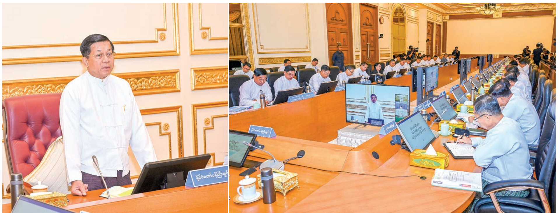
State Administration Council Chairman Prime Minister Senior General Min Aung Hlaing addresses the seventh meeting of the Union government yesterday.

Ministries and state and regional chief ministers have to report on measures in border regions to the Union government in time to seek directives and aid from the State.