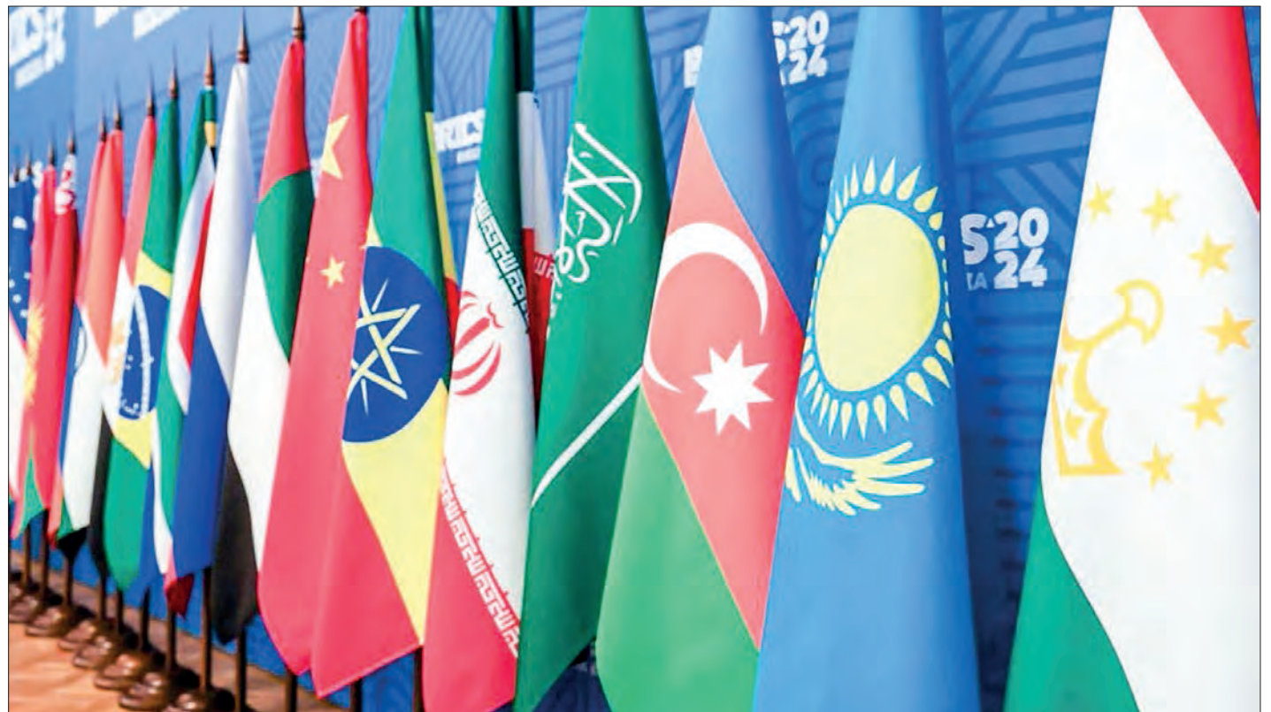
The BRICS Summit is the highlight of Russia's Chairship of BRICS in 2024.

Chinese officials emphasize BRICS' commitment to multilateralism and its role as a stabilizing force in global affairs.