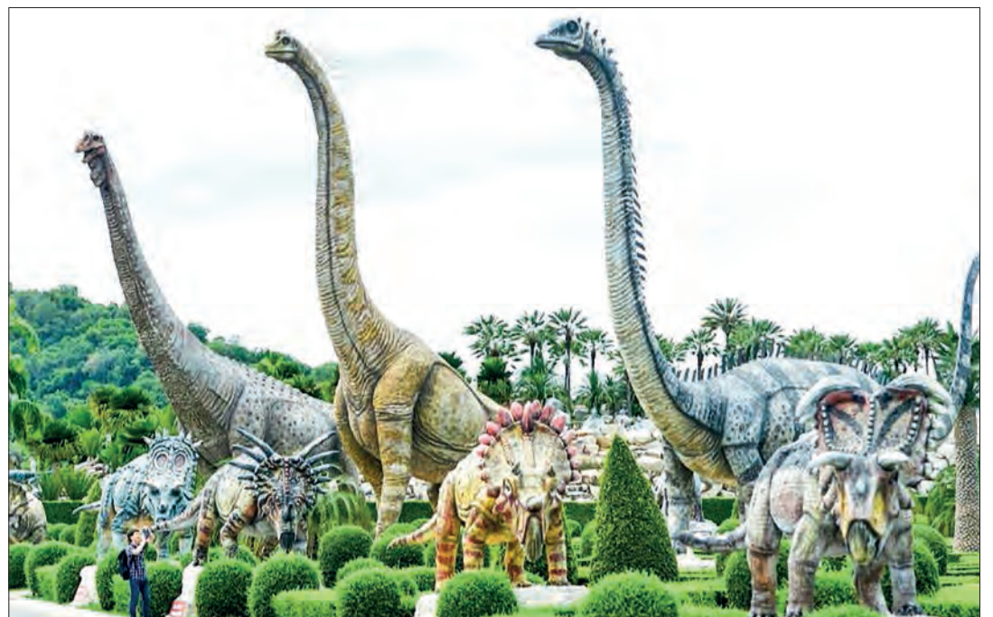
Thailand's economy is projected to grow 2.7 per cent in 2024 and 2.9 per cent in 2025, driven by tourism, private consumption, and improved exports. Foreign tourists visit the Nong Nooch Tropical Garden in Pattaya, Thailand, 17 July 2024.

THAILAND'S central bank slashed its key interest rate by 25 basis points on Wednesday, marking the first cut in more than four years and a move long encouraged by the government to shore up a sluggish economy.