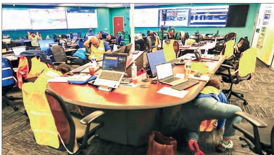
People practise Drop, Cover and Hold On during an earthquake preparedness drill in Los Angeles County, California, the United States, on 17 October 2024.