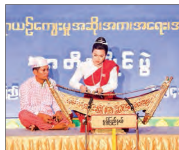
A xylophone contestant.