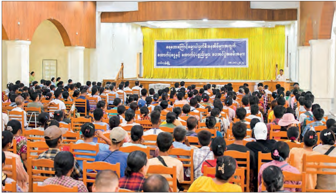
The handover ceremony to provide cash assistance and relief supplies in progress yesterday in Tatkon.

THE Vice-Chairperson 2 of the National Disaster Management Committee Union Minister for Social Welfare, Relief and Rsettlement Dr Soe Win, along with Nay Pyi Taw Council members, attended a ceremony yesterday morning at the Aung San Hall in Tatkon, Nay Pyi Taw, where