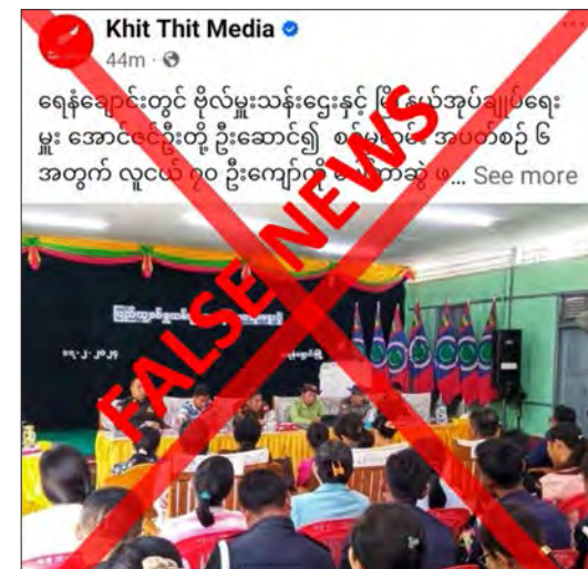
This screenshot validates false news.

Regarding the news, a relevant official stated that it was false. Security forces conducted security measures in the town, checking various locations and patrolling in cooperation with the responsible public. The conscription law is effective under the legal framework. The false claims circulated by subversive media outlets aim to mislead the public and sow anxiety. These misleading reports deliberately spread propaganda to disrupt peace and stability in the town. — MNA/TRKM