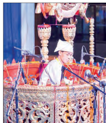
A traditional orchestra contestant.