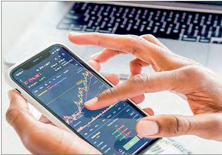
The stock market closed sharply lower on Thursday, with the BSE Sensex dropping 494.75 points and the NSE Nifty falling 221.45 points amid a broad-based selloff.

Analysts note ongoing concerns over India's economic outlook, suggesting that while caution is advised, the market correction may present buying opportunities in select outperforming stocks.