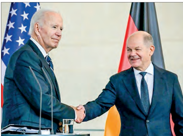
US President Joe Biden meets German Chancellor Olaf Scholz.

"Senators have this night voted to impeach the deputy president of the Republic of Kenya," Senate Speaker Amason Kingi announced. "Senators found him guilty on five out of 11 grounds brought against him by the National Assembly. Effectively, Gachagua ceases to hold office." — Xinhua