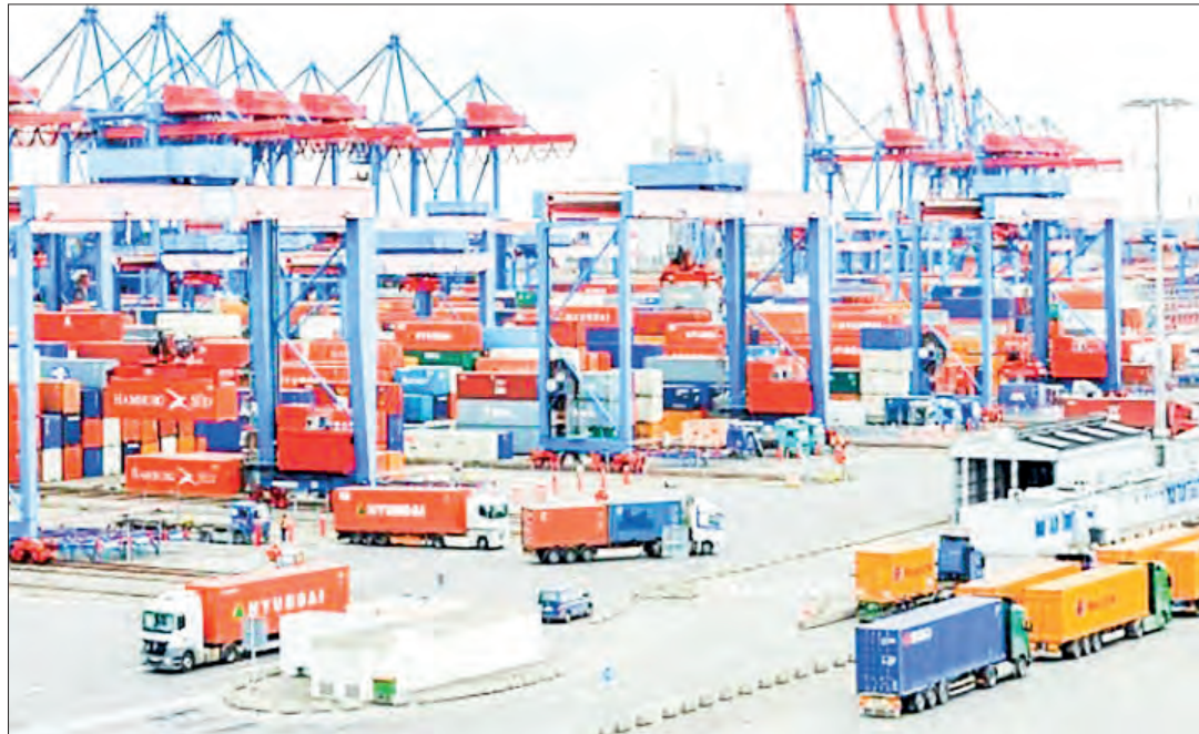
A panoramic view of the bustling container terminal at Yangon Port along the Yangon River.

A total of 464 container vessels arrived at the Yangon Port in the past nine months (Jan-Sept) 2024, the Myanma Port Authority announced.