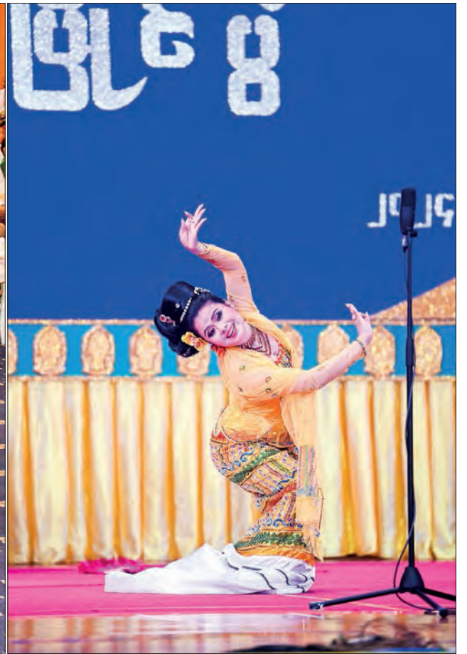
State Administration Council Chairman Prime Minister Senior General Min Aung Hlaing, wife Daw Kyu Kyu Hla, and dignitaries view the female dancing contest yesterday in Nay Pyi Taw.