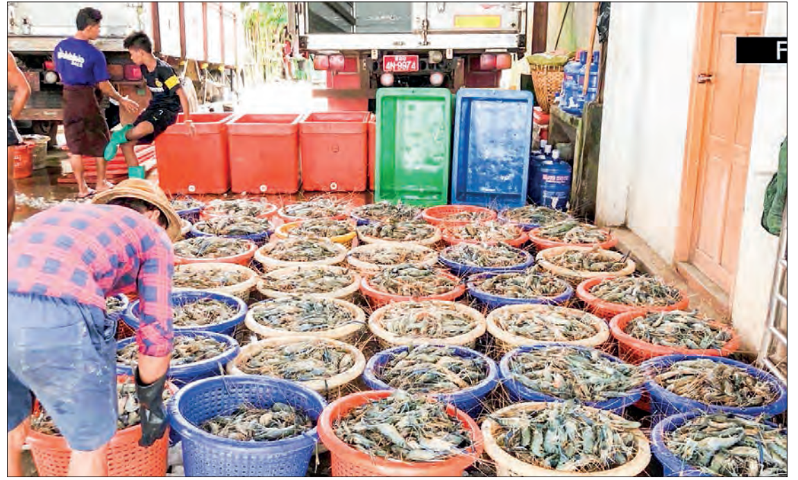
Myanmar's seafood products are processed at a cold storage facility.

The Fisheries Department is endeavouring to ensure sustainable exports depending on market climate and meet the criteria of the respective importing countries, along