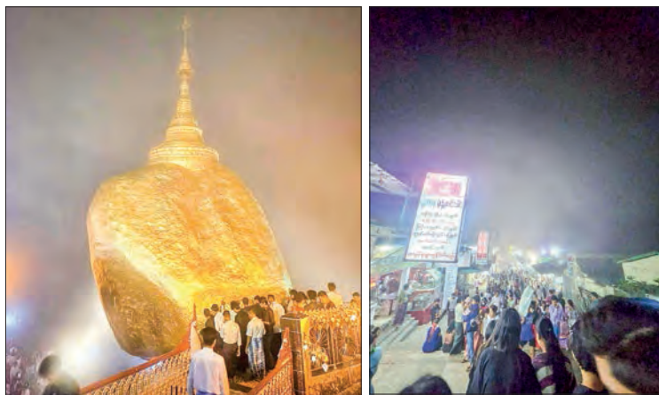
Kyauktiyo Pagoda and pilgrims.