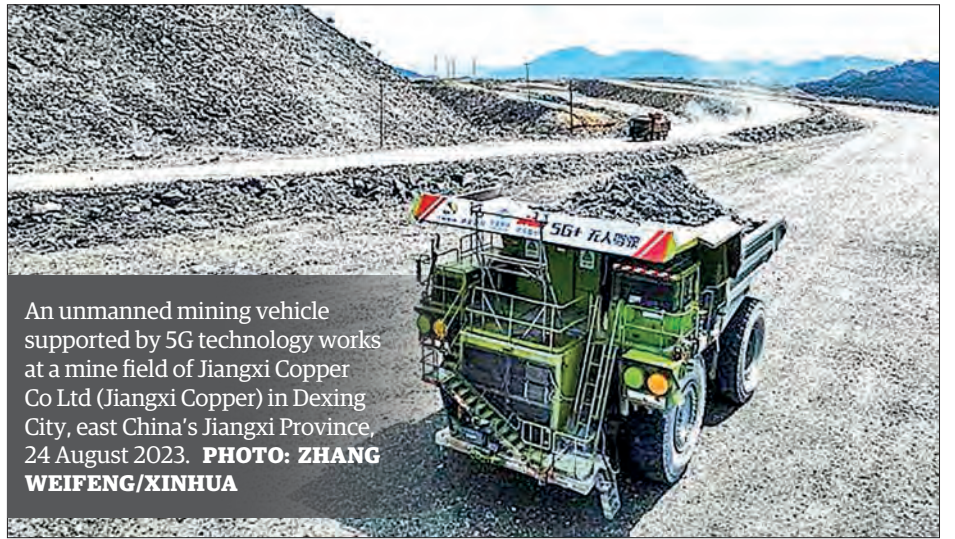
An unmanned mining vehicle supported by 5G technology works at a mine field of Jiangxi Copper Co Ltd (Jiangxi Copper) in Dexing City, east China's Jiangxi Province, 24 August 2023.

In terms of the non-oil-gas mineral exploration, significant progress had been achieved in coal, copper, gold, lithium and phosphorite. The four-day conference and exhibition will conclude on Friday. — Xinhua