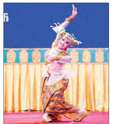
A dance contestant from Mandalay Region.