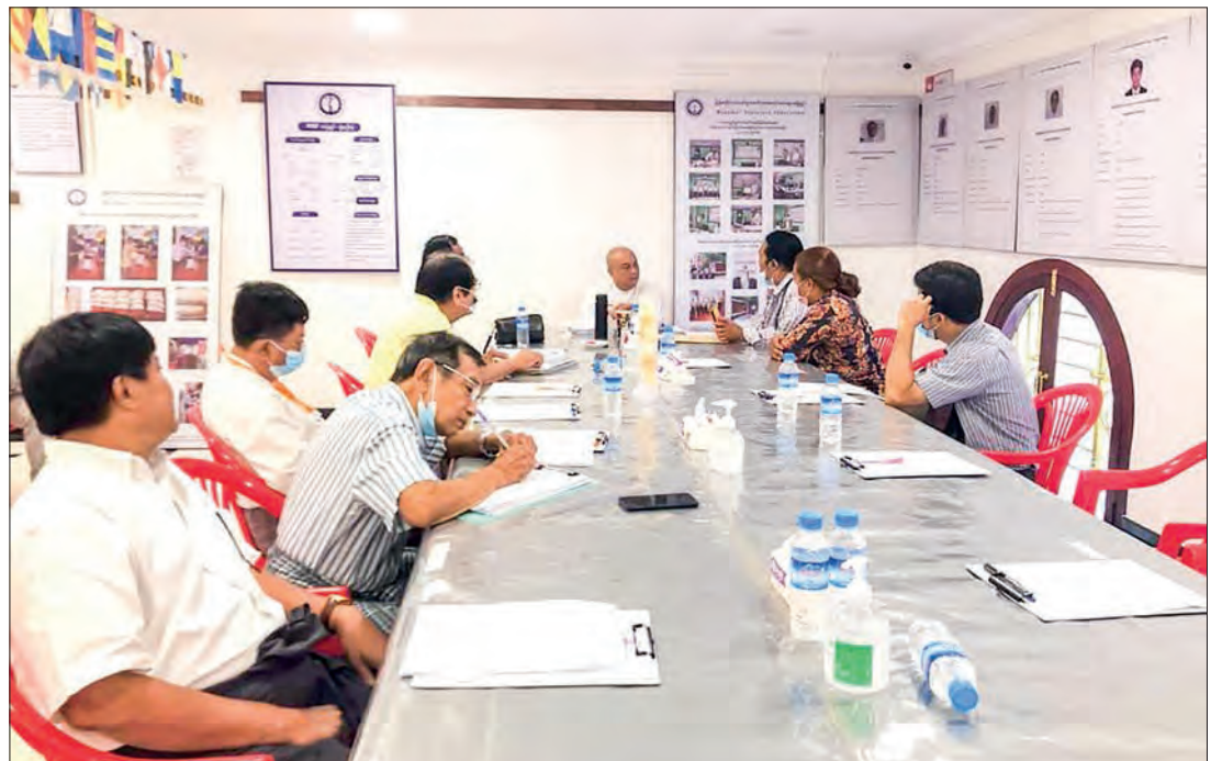
Seafarers and families engage in consultation on their difficulties.

A poll is underway to reduce the difficulties that seafarers and their families encounter, according to the Myanmar Seafarers Federation (MSF).