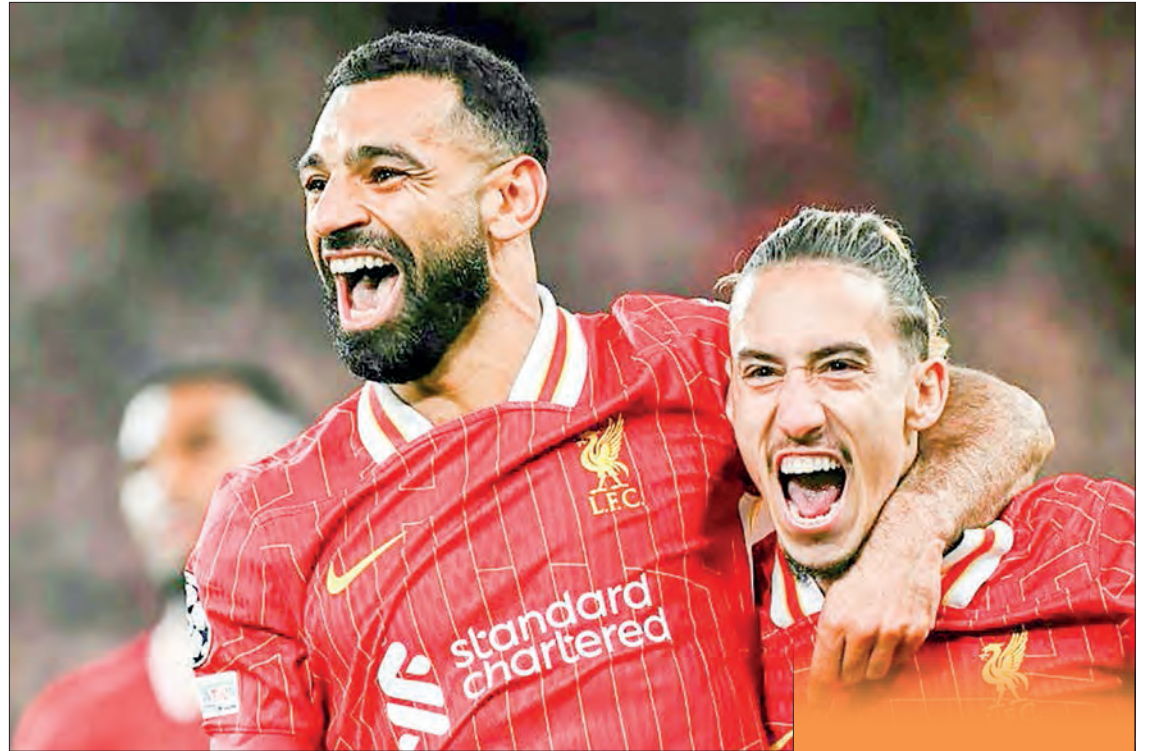
Liverpool face a test of their title credentials against Chelsea.