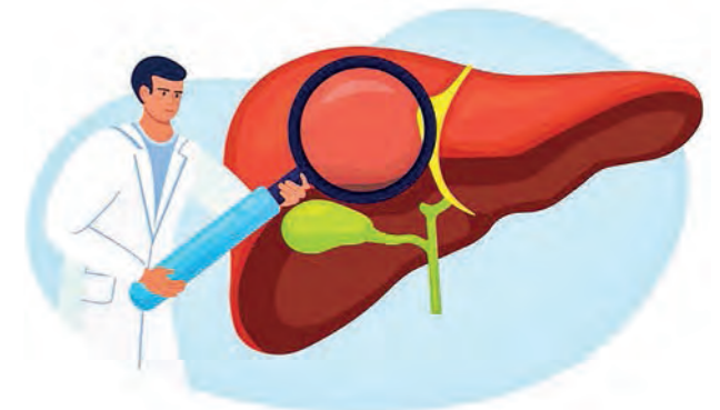
A study reveals p62 and NBR1's opposing roles in liver cancer immunity, offering potential biomarkers and therapeutic targets for immunotherapy.