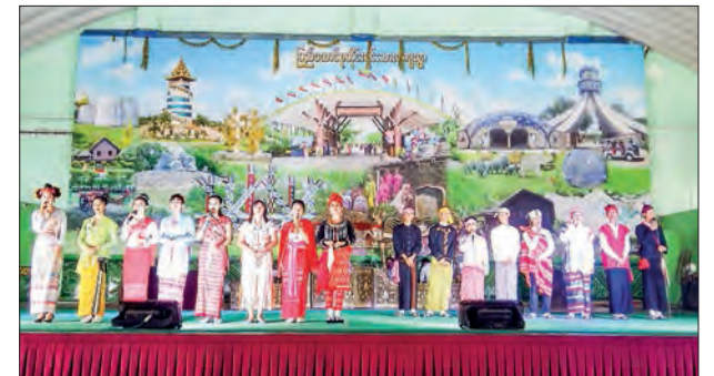
Ethnic performances at the National Races Village (Yangon).

Domestic visitors flock to Bagan during the Thadingyut Festival (16-18 October). The serene beauty of the sacred temples illuminated with candlelight on the full moon day of Thadingyut gave a breathtaking night view of the historic landmark. About 100 horse carts provided service near Thatbyinnyu and Ananda temples. The number of visitor arrivals surged more than expected, creating local jobs. — Thitsa (MNA)/KK