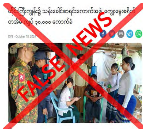
This screenshot reveals fake claims.

MALICIOUS media outlets falsely reported that money was collected in certain villages of Hainggyikyun, Ngaputaw Township in Pathein District to provide food and entertainment for census enumerators.