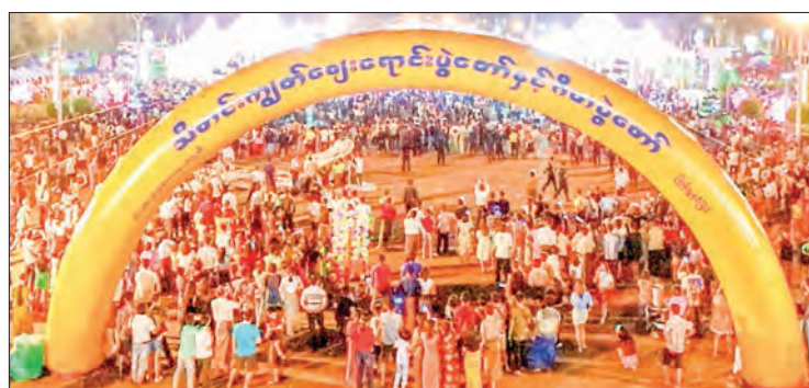
Visitors shop at the Thadingyut Market Fair in Yangon.

giene and proper organization. Satuditha meals and cold drinks were served three times daily during the festival.