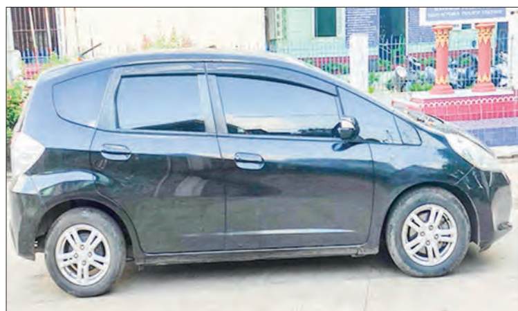
Confiscated an unregistered vehicle in Bago Region.

The Illegal Trade Eradication Steering Committee reported 17 arrests on 17 and 18 October, resulting in the seizure of illegal goods valued at approximately K1.803 billion. — MNA/MKKS