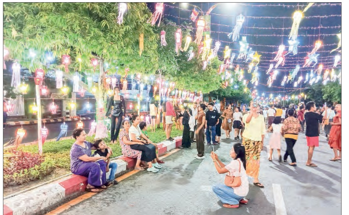
This photo captures pagodas and stupas being packed with pilgrims offering lights in Mandalay.

Famous pagodas and sites in Mandalay reportedly received an impressive turnout of visitors and pilgrims during the Thadingyut Festival, which coincides with a long holiday. — MNA/TRKM