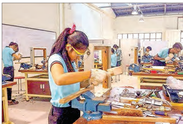
Students are seen engaging in practical sessions at the School of Industrial Training and Education (SITE).

Those who passed the matriculation exam or ITC or GTHS (BT, MT) or AGTI (Civil) can attend a Certificate course in Woodworking Technology, while those who passed the matricula-