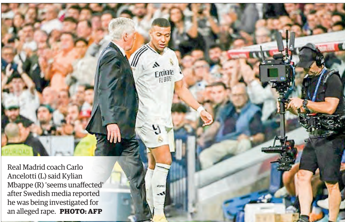
Real Madrid coach Carlo Ancelotti (L) said Kylian Mbappe (R) 'seems unaffected' after Swedish media reported he was being investigated for an alleged rape.

The fact Liverpool and Manchester City play on Saturday allows Arsenal the chance to go top if they win on their visit to Bournemouth. — Xinhua