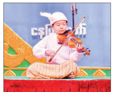
A violin contestant.