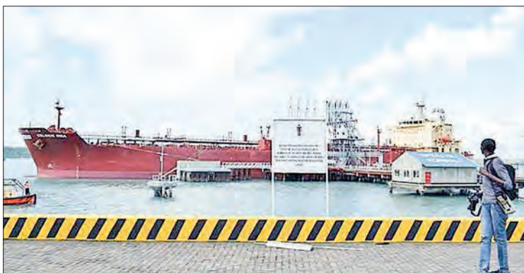
Photo taken on 26 August 2019 shows the MV Celsius Riga, the ship carrying the Kenyan crude oil at the Mombasa Port in Mombasa, Kenya.