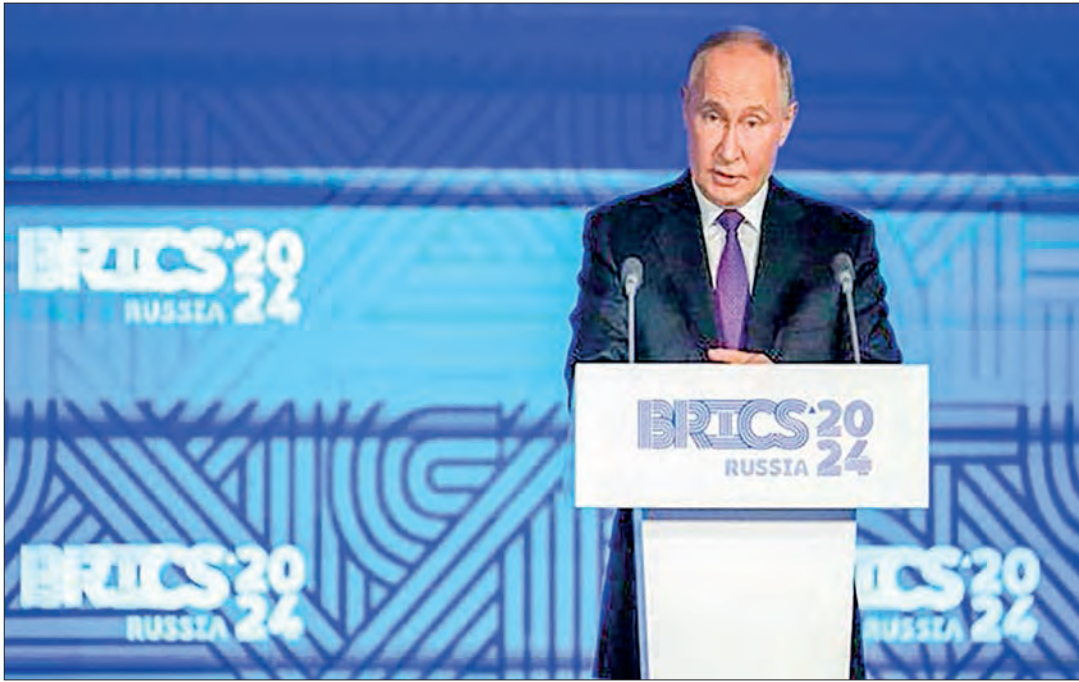
Putin emphasized that the economic role of BRICS is significant and is expected to grow in the future.