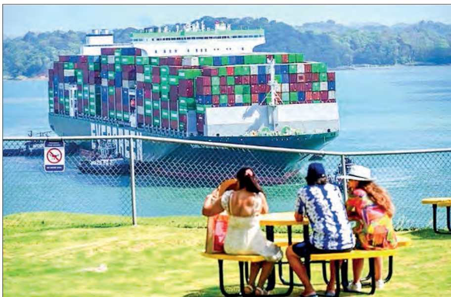
Tourists watch a cargo ship pass through the Panama Canal's Agua Clara Locks.

TRAFFIC in the Panama Canal fell by 29 per cent over the past year due to a severe drought linked