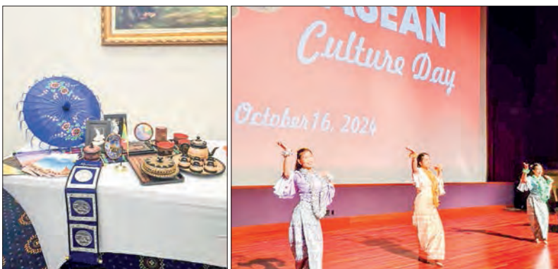
Photos showcase Myanmar traditional handicrafts and the celebration of the ASEAN Culture Day.

ACCORDING to the Ministry of Foreign Affairs, the Myanmar Embassy in Washington participated in the ASEAN Culture Day ceremony held on 16 October at the Visitors' Centre of the Church of Jesus Christ of Lat-