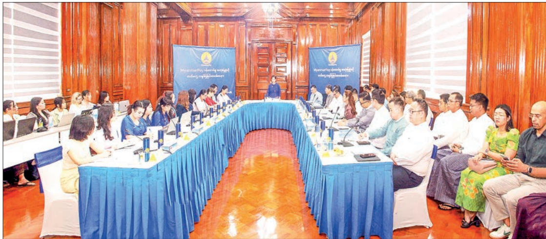
CBM Governor Daw Than Than Swe leads the inspection session of the pilot testing operations of MyanmarPay yesterday in Yangon.

First, the CBM Governor inspected the office setup of PayPlus Co Ltd., the operator of MyanmarPay, at the Central Bank's Sule Branch office. Following that, the CBM Governor explained that the MyanmarPay (Digital Payment Switch) project had been in preparation since 2021, with adjustments made to the necessary business models and infrastructure. The implementation phase only began in