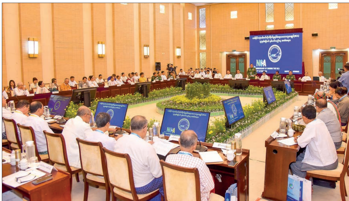
The Nationwide Ceasefire Agreement (NCA) Ninth Anniversary event in progress yesterday in Nay Pyi Taw.