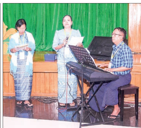
Contestants exercising rehearsals.