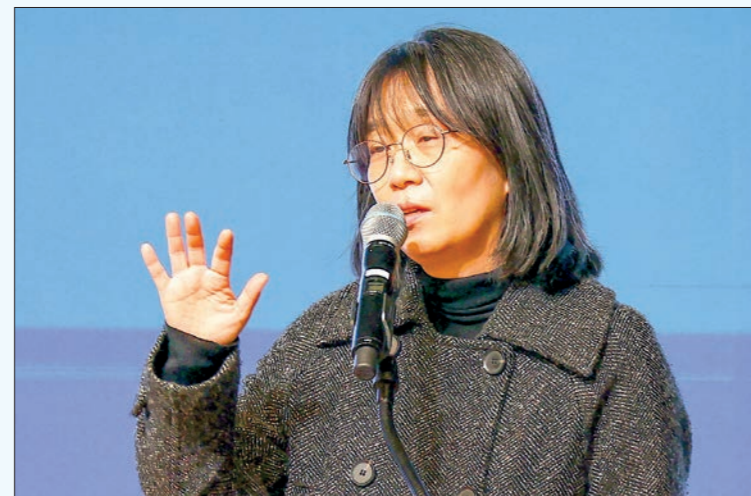
This undated photo released by Yonhap news agency on 10 October 2024 shows South Korean author Han Kang delivering a speech at a lecture in Gwangju. South Korean author Han Kang won the Nobel Prize in Literature 2024, it was announced on 10 October 2024.