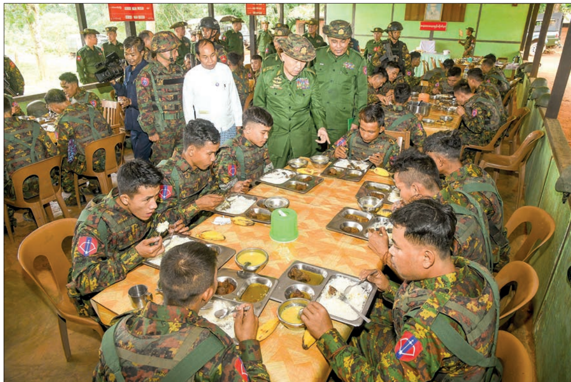
State Administration Council Vice-Chairman Deputy Prime Minister Vice-Senior General Soe Win inspects Tatmadaw mess at Wuntho Station yesterday.

Speaking on the occasion, the Vice-Senior General explained the importance of security awareness and knowledge for people's service personnel not to break security measures, formation of people's security and counter-terrorism troops