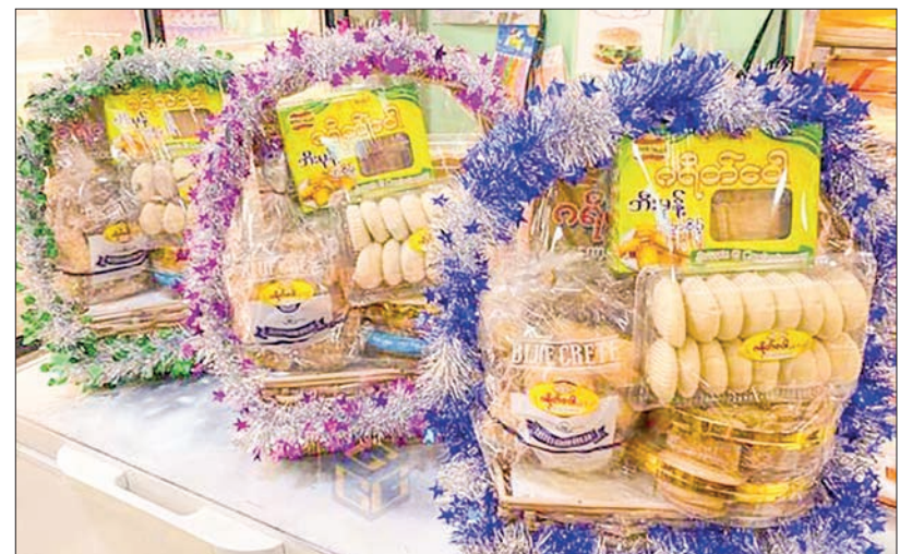
Some traditional homage baskets that sell briskly during Thadingyut.

only 15 October. The holiday period will start only tomorrow, and we can tell you the exact demand for tomorrow and the day after it. Sales in other places, such as City Mart and Ruby Mart, will increase. Some people prefer physical shopping. During these office holidays, there will be more demand. I think that during our traditional Thadingyut, there will be more orders," said an official from Golden Delivery in PyinOoLwin.