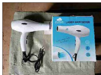
Confiscated illegal items in Shan State.

UNDER the supervision of the Illegal Trade Eradication Steering Committee, efforts to combat the illicit trade continue effectively in accordance with the law.