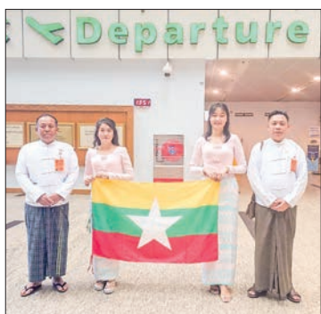
This photo depicts two Myanmar youth representatives.

ACCORDING to the Myanmar-China Friendship Association (Central), two youth representatives from Myanmar are attending the Yunnan International Sister Provinces/Cities Youth Exchange Week 2024, held in Kunming, Yunnan Province, China, from 14 to 19 October.