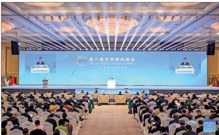
The 6th World Media Summit opens in Urumqi, capital city of northwest China's Xinjiang Uygur Autonomous Region, 14 October 2024.