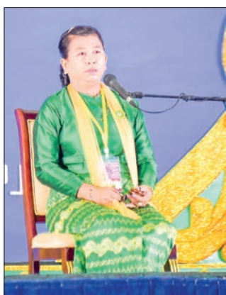
Singing contestant from Bago Region.

The song-composing contest took position at the Yinkyay Hmu Yadana Hall of the Ministry of Religious Affairs and Culture