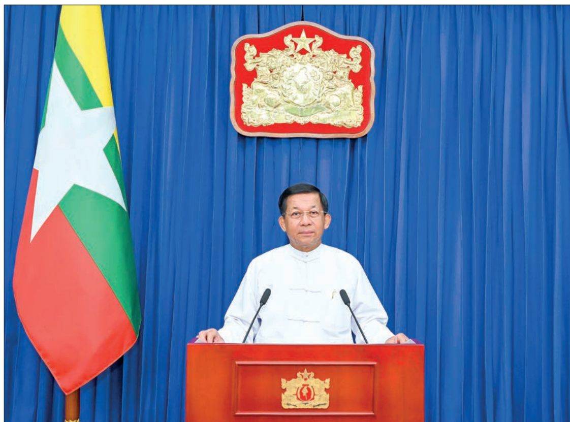
State Administration Council Chairman Prime Minister Commander-in-Chief of Defence Services Senior General Min Aung Hlaing speaks on the occasion of the Ninth Anniversary of the NCA yesterday.

NCA was established through many meetings and dialogues between officials of the stakeholder organizations. It is a historic Agreement of Myanmar. Talks were held thoroughly through mutual understanding and an array of compromises till a