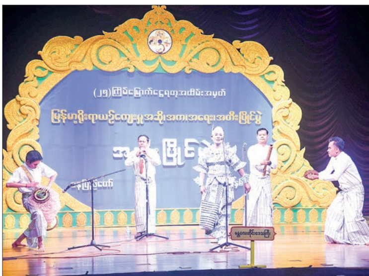
A Myanmar traditional drum (amateur-first class) contestant from Mandalay Region.

with basic education level (aged 15-20) and amateur level (second class) contests.