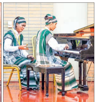
Piano contestant from Kayin State.