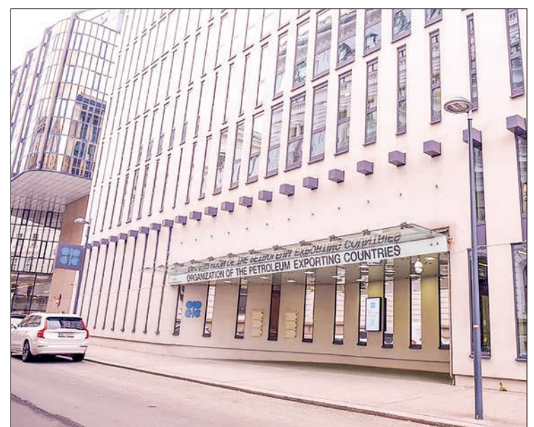
Photo taken on 30 November 2023 shows the headquarters of the Organization of the Petroleum Exporting Countries (OPEC) in Vienna, Austria.

Last month, eight member countries of OPEC+, a group comprising OPEC and its allies, announced an extension of their voluntary oil production cuts by two months until November. — Xinhua