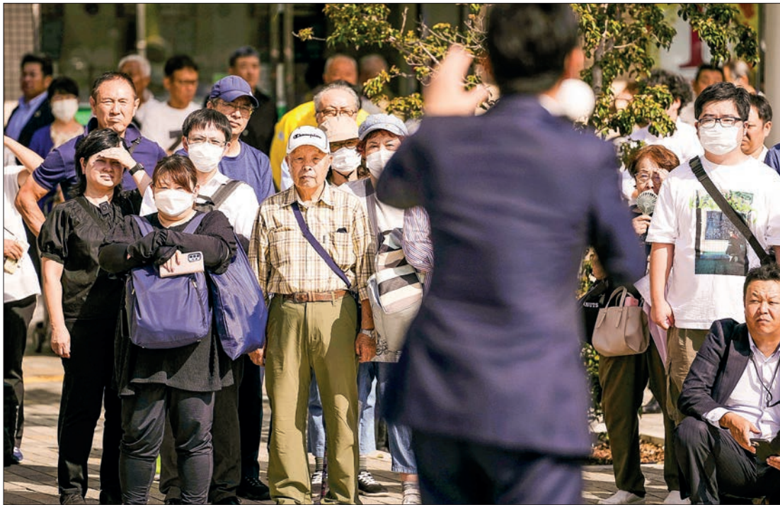
People listen to a stump speech by a House of Representatives election candidate in Hyogo Prefecture on 15 October 2024, as official campaigning for the 27 October general election kicked off the same day.

The main opposition Constitutional Democratic Party of Japan is hoping to realize a rare change of government in a country that has seen uninterrupted LDP rule for most of the postwar era. Its leader Yoshihiko Noda