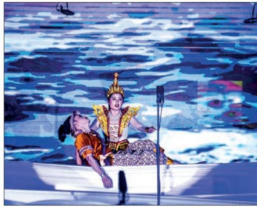
SAC Secretary General Aung Lin Dwe, his wife and dignitaries view the 25 th Anniversary Performing Arts Competition in Nay Pyi Taw yesterday.

The competition featured performances of the grand "Maha Zanaka" drama. Among those present were Union Minister for Commerce U Tun Ohn, the Chairman of the Nay Pyi Taw Council, council members, judges, supervisors, trainers, participants representing various states and regions, government employees, their families, and