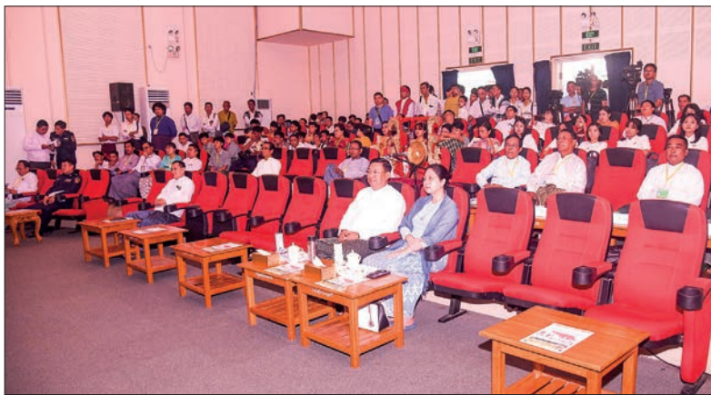
Hall of the National Museum (Nay Pyi Taw).

Taw Win Yoke Sone theatrical troupe of Yangon Region took part in the amateur level (first class) Vesantara Drama contest, whereas Phan Kha Myay theatrical troupe of Magway Region competed in the amateur level (first class) Maha Janaka drama contest "Maha Janaka".