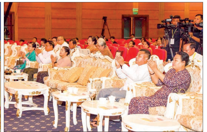
SAC Joint Secretary General Ye Win Oo, his wife, SAC Member Union Minister Admiral Tin Aung San, his wife, and officials attend the competition yesterday.

SAC Joint Secretary General Ye Win Oo and his wife attended the 25 th Anniversary Myanmar Traditional Cultural Performing Arts Competitions 2024 at the Myanmar International Convention Centre II in Nay Pyi Taw yesterday.