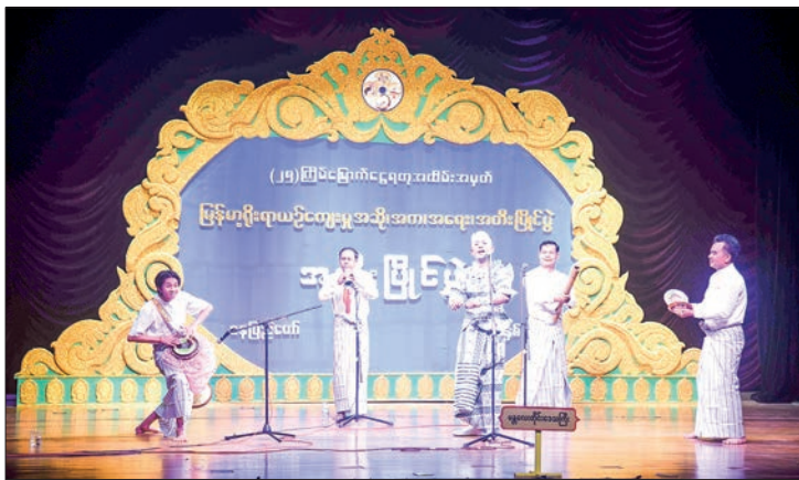
Union Minister General Moe Aung, his wife and dignitaries views the competition yesterday.