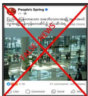
This screenshot validates fake news.

CERTAIN malicious media outlets falsely reported that returnees from abroad, like seafarers and those who faced difficulties while working overseas, were arrested at Yangon International Airport, with no communication allowed between them and their families.