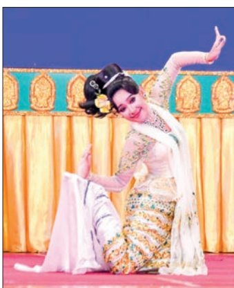
Dance contestant from Yangon.