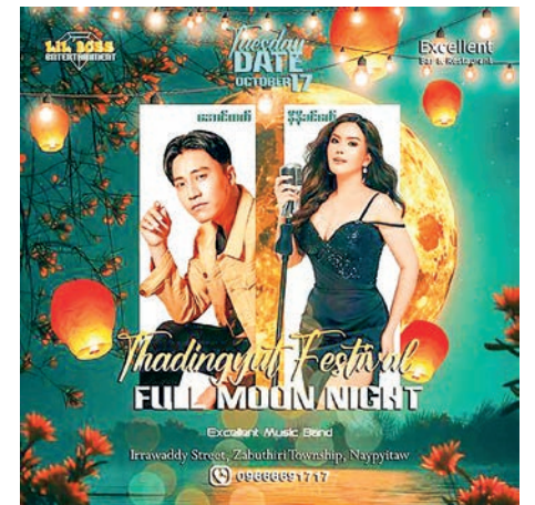
This image showcases a poster of the Full Moon Night Show.

"The Excellent Band will be giving their best performance to accompany us. I'd like to invite everyone to spend the Thadingyut Full Moon Day with our songs," Aung Htet shared. — ASH/TRKM