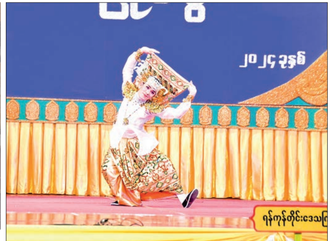
Amateur second class male dance contestant.