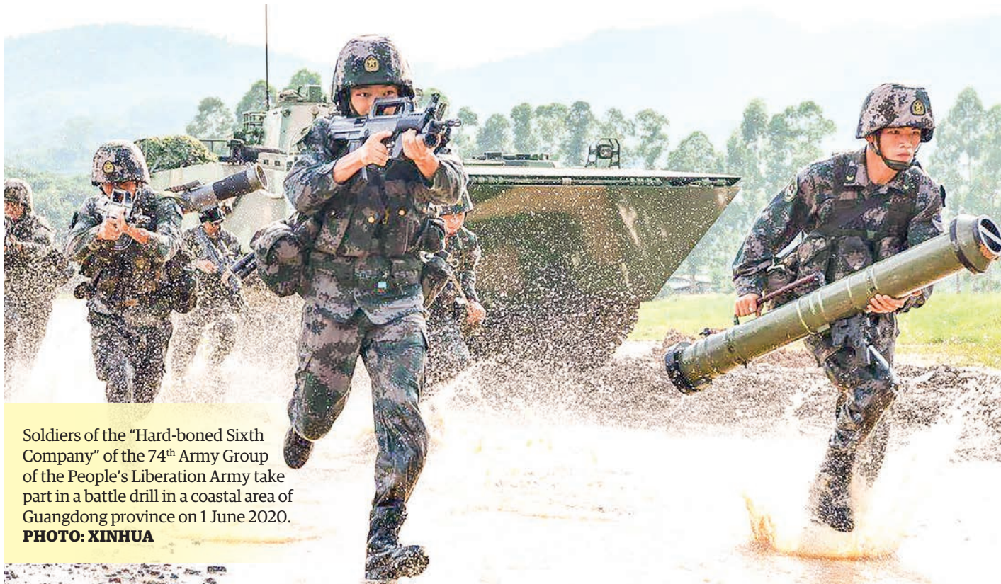
Soldiers of the "Hard-boned Sixth Company" of the 74 th Army Group of the People's Liberation Army take part in a battle drill in a coastal area of Guangdong province on 1 June 2020.