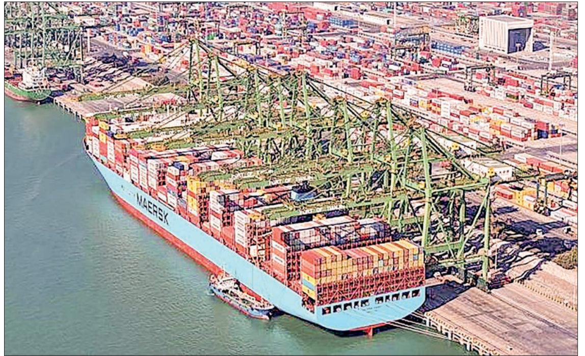
An aerial drone photo taken on 20 March 2024 shows a container ship berthing at the Tianjin Port in Tianjin, north China.

China is the world's largest manufacturing country, the second-largest consumer market and the top country in terms of cargo trade, with a large total volume of goods and a rich variety of categories.