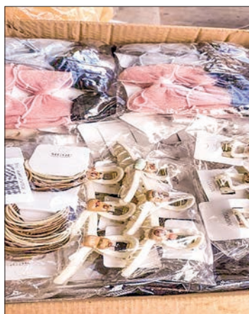
Confiscated illegal consumer goods in Mandalay Region.

UNDER the supervision of the Illegal Trade Eradication Steering Committee, efforts to combat the illicit trade continue effectively in accordance with the law.