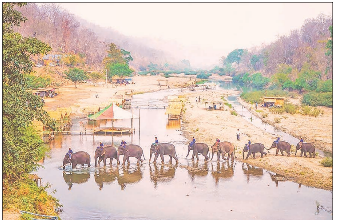
This photo shows elephants from the Shwesettaw Mannchaung Elephant Camp in Minbu Township, Magway Region.

THE Shwesettaw Mannchaung Elephant Camp in Minbu Township, Magway Region, has upgraded facilities and prepared elephant dance performances for visitors, said a camp person-in-charge. The camp was developed as the tourism site on 9 February 2019, with tranquil space, scenic natural beauty of the mountain areas and lush and green serene environment. Smooth transportation, facilitating accessibility and connectivity will enhance tourism experience.