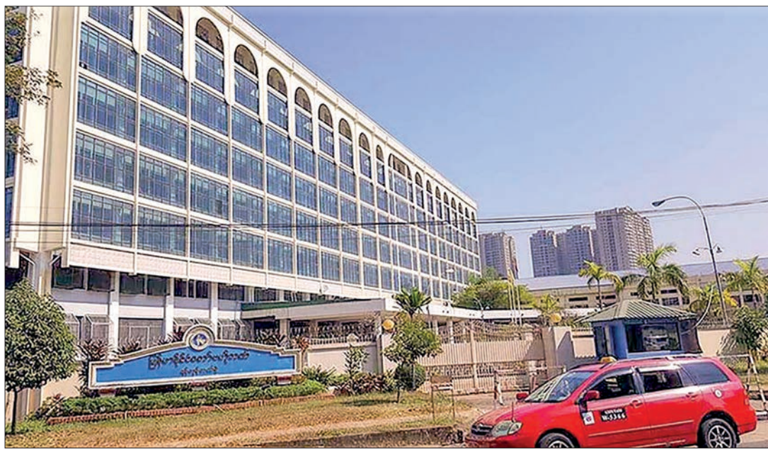
The office building of the Central Bank of Myanmar in Yangon.

THE Central Bank of Myanmar (CBM) injected over US$730,000 on 11 October, $12.4 million and 38.7 million Thai baht, 660,000 yuan on 9 October and over 10 million Thai baht on 7 October into the private sector.