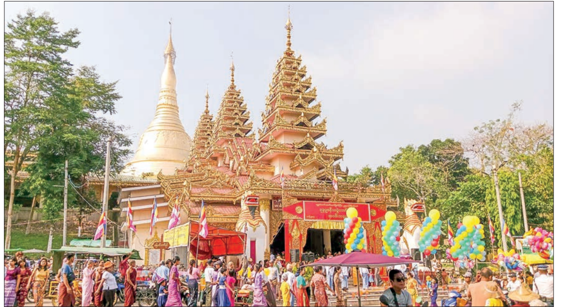
The Twantay Shwesandaw Pagoda hosts the Buddha Pujaniya Festival in the previous year.

The festival will also feature market events with participation of vendors who operate their businesses during Myanmar's traditional festivals held throughout the year. — ASH/MKKS