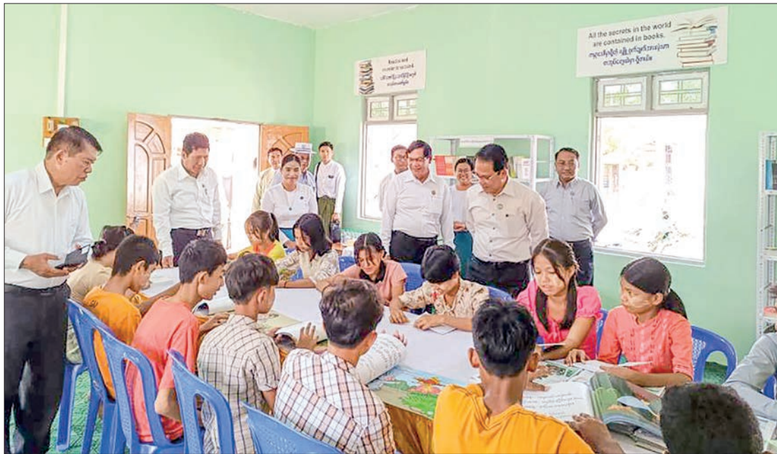
Union Minister for Information U Maung Maung Ohn observes the youths reading at the Pyanya Alin Library in Ingalar Ward, Taikkyi, Yangon Region, yesterday.

The Union minister and party also attended the opening ceremony of Pyanya Alin Library in