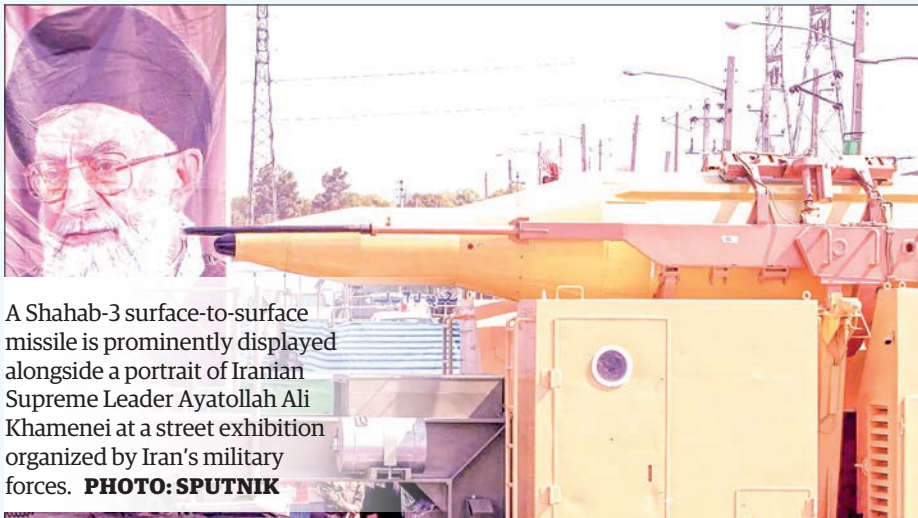
A Shahab-3 surface-to-surface missile is prominently displayed alongside a portrait of Iranian Supreme Leader Ayatollah Ali Khamenei at a street exhibition organized by Iran's military forces.