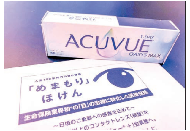
Photo taken on 4 October 2024 in Tokyo shows a disposable contact lens package (top) and a brochure of Sumitomo Life Insurance Co's new insurance policy covering eye treatment costs.

Eligible customers who purchase a specified amount of Acuvue lenses can access the insurance through Johnson & Johnson's member-