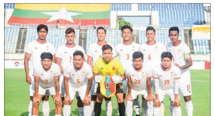
The Myanmar national football team during their first friendly match against Sri Lanka.

Myanmar is using these friendly matches in October and November to prepare for the upcoming ASEAN Cup 2024, which will start in the second week of December.