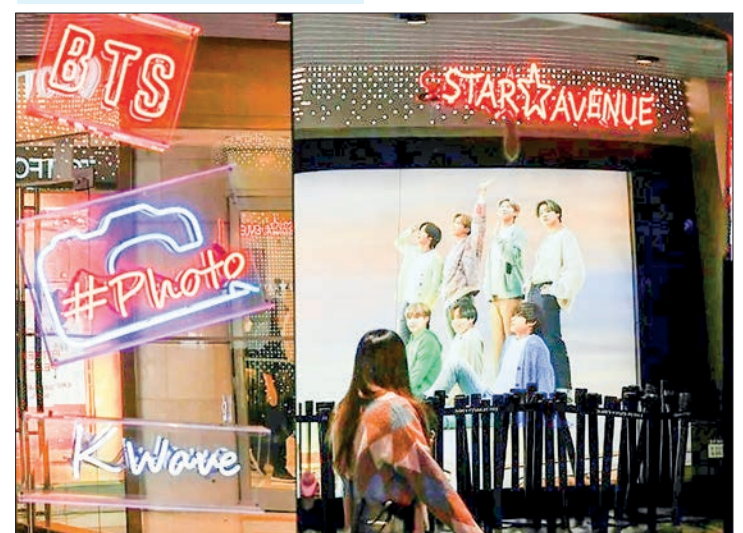
From the late 1990s, Korean dramas and K-pop idols started gaining traction in neighbouring Asian countries like China and Japan, marking the start of Hallyu, or the Korean Wave. PHOTO: AFP

Despite some government support, success has often been attributed to grassroots efforts and innovative translators. — AFP