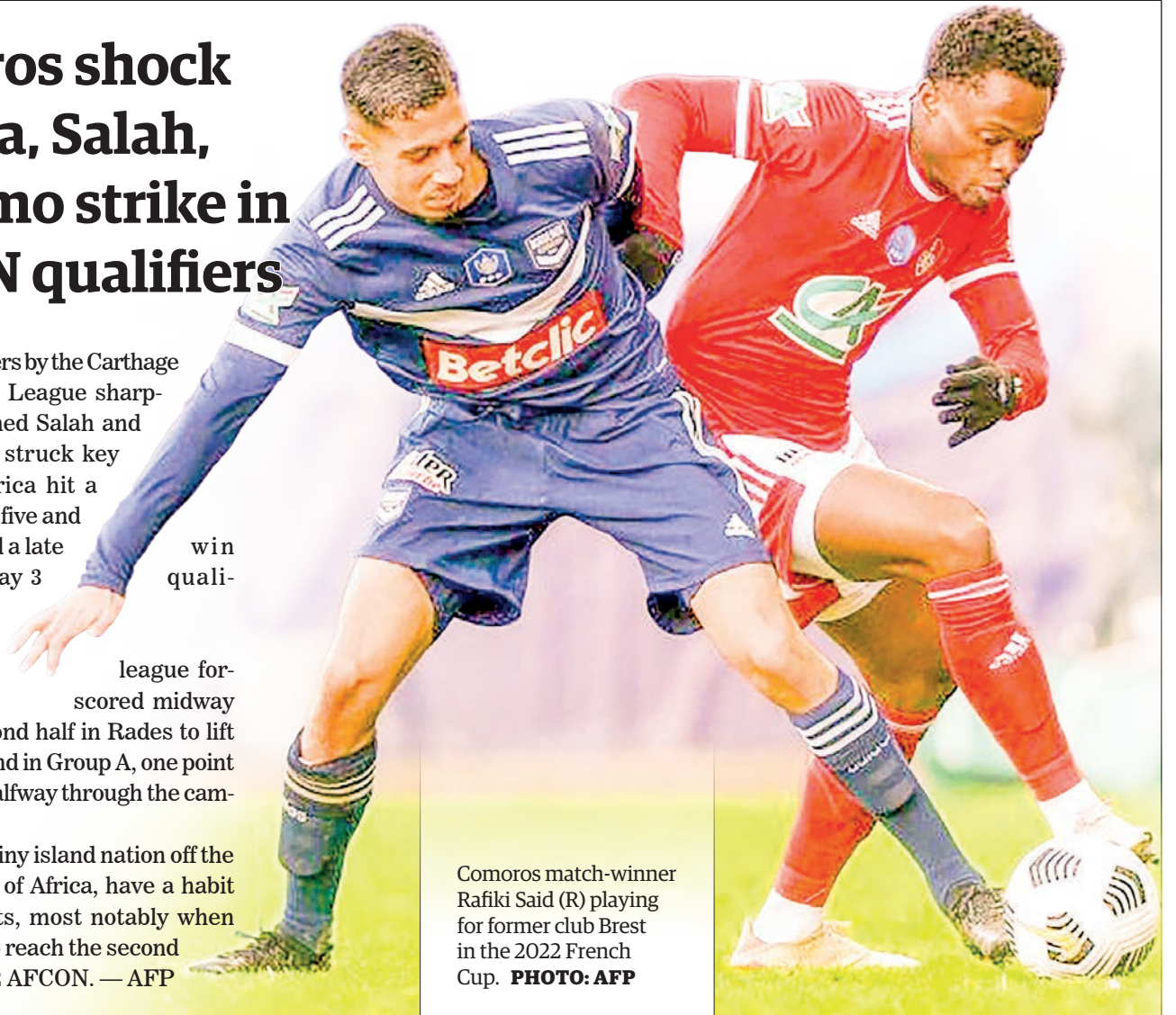
Comoros match-winner Rafiki Said (R) playing for former club Brest in the 2022 French Cup.

Comoros, a tiny island nation off the south-east coast of Africa, have a habit of causing upsets, most notably when beating Ghana to reach the second round at the 2022 AFCON. — AFP