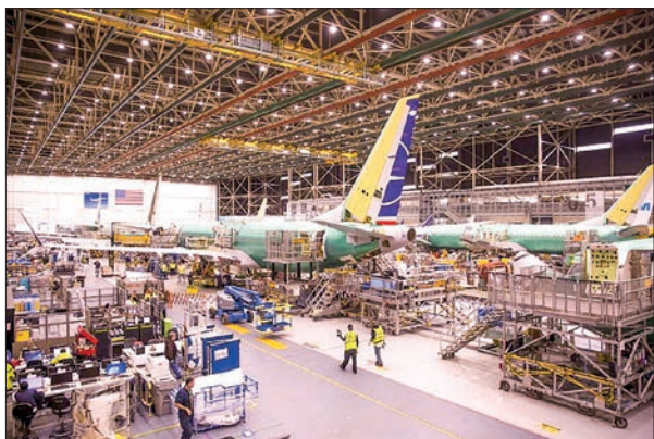
Boeing announced Friday that it plans to cut 10 per cent of its workforce as it projected a large third-quarter loss in the wake of a machinist strike in the Seattle region.

Boeing staff with the International Association of Machinists and Aerospace Workers walked off the job on 13 September after overwhelmingly rejecting a contract offer.