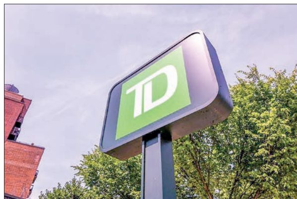
TD Bank has agreed to pay $3 billion in penalties for failing to adequately monitor money laundering by drug cartels, US officials say.

"TD Bank created an environment that allowed financial crime to flourish by making its services convenient for criminals," Garland said at a press conference. "Our anti-money laundering laws dictate that a bank that willfully fails to protect against criminal schemes is also a criminal," Garland said. "That is what TD Bank was." — AFP