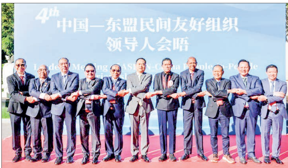
The Myanmar delegate joins hands with attendees at the fourth Meeting of Leaders of the China-ASEAN Friendship Association on 10 October.

The Ministry of Foreign Affairs of Myanmar issued a press release, highlighting that Myanmar urged the United Nations and the international community to refrain from supporting the acts of terrorist groups and to cooperate with the Government in combatting terrorism and preventing terrorist acts, and UN reports and discussions should acknowledge Myanmar's constructive endeavours. — GNLM/TTA