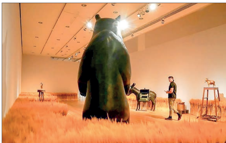
The monumental bear sculpture “Tres Grand Ours (2009)” sold for $6.1 million.

Surve likened the relationship between AI and media content to that of an architect and a building. While AI can construct a basic structure, details within — such as investigations and the humanity of stories — require human input. AI alone cannot capture the full depth and nuance of storytelling, he said. — Xinhua