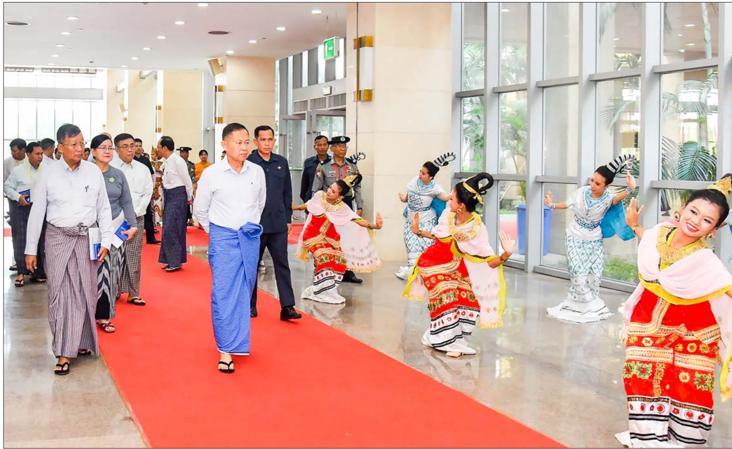
State Administration Council Vice-Chairman Deputy Prime Minister Vice-Senior General Soe Win views round the preparatory activities for the 25 th Myanmar Traditional Cultural Performing Arts Competitions 2024 at MICC II in Nay Pyi Taw yesterday.

Vice-Chairman of the State Administration Council Deputy Prime Minister Vice-Senior General Soe Win, who is in the capacity of Patron of the Leading Committee for Organizing the 25 th (Silver Jubilee) Myanmar Traditional Cultural Performing Arts Competitions 2024 yesterday afternoon, inspected preparations to hold the competition successfully.