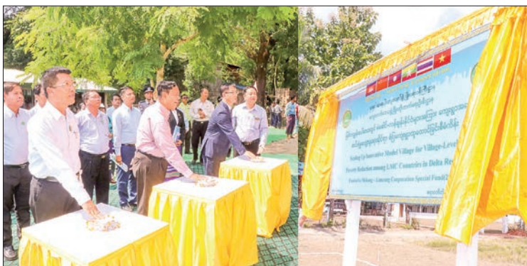
Union Minister for Cooperatives and Rural Development U Hla Moe and dignitaries press the buttons at the launching of Scaling Up Model Village for Village-level in Ohnpinsu Village, Nyaungdon Township, Ayeyawady Region, yesterday.

A model village project was officially launched in Ohnpinsu Village, Nyaungdon Township, Ayeyawady Region, yesterday