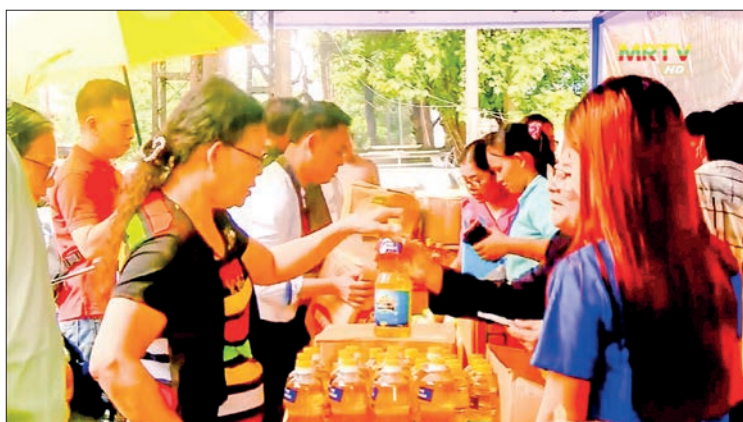
This photo depicts the Myanmar Edible Oil Millers Association holding the local peanut oil fair as a commemoration of its fifth anniversary.

On 3 and 4 August, the Myanmar Edible Oil Millers’ Association celebrated a peanut oil fair as a commemoration of the fifth anniversary of the association, where oil millers from Mandalay, Yangon, Magway, Sagaing and Bago region participated and sold their products.