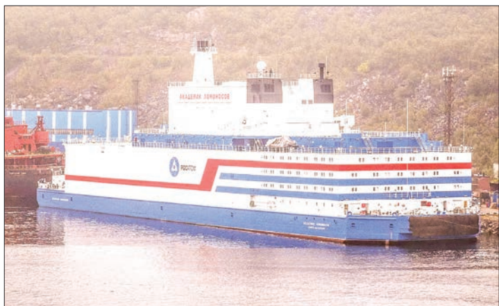
The Akademik Lomonosov is Russia's first floating nuclear power plant, designed to provide energy to remote areas and coastal regions.

The RITM-200 SMR technology is based on over 400 reactor-years of experience from Russia's nuclear ice-breaker fleet. The Akademik Lomonosov floating nuclear plant has generated over 860 million kilowatt-hours in four years. Rosatom is also implementing a land-based SMR project in Russia's Sakha Republic and has signed a deal with Uzbekistan to construct a 330 MW SMR. — SPUTNIK