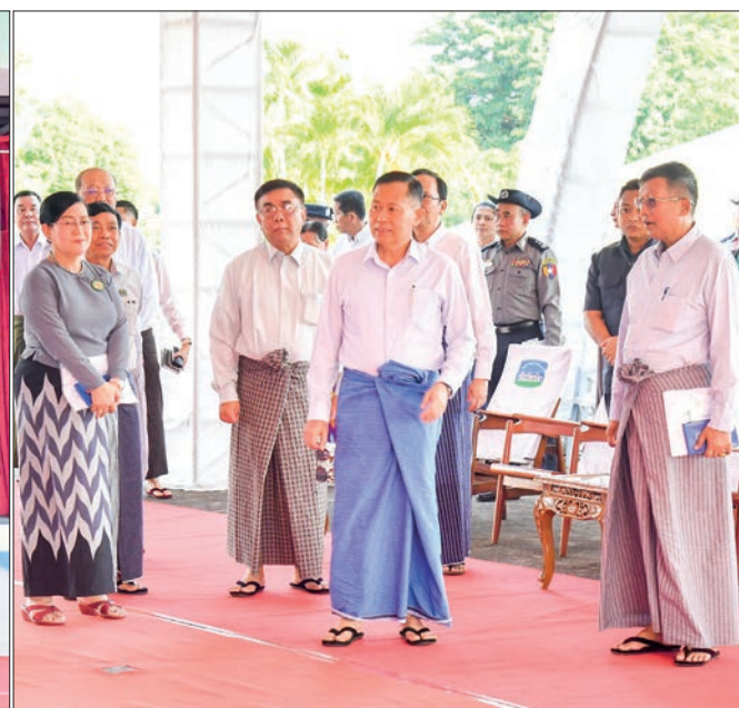
State Administration Council Vice-Chairman Deputy Prime Minister Vice-Senior General Soe Win views round the preparatory activities for the 25 th Myanmar Traditional Cultural Performing Arts Competition 2024 at the open-air theatre of Nay Pyi Taw Development Committee yesterday.

The 25 th Performing Arts Competitions will be organized in accord with four objectives: to uplift national prestige and integrity and to preserve the