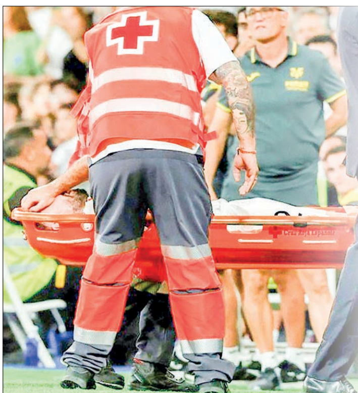
Real Madrid's Spanish defender Dani Carvajal suffered a bad knee injury against Villarreal.

friendly matches in Yangon. The first match will be held on 23 October at Thuwunna Youth Training Centre, followed by the second on 26 October at Yangon United Sports Complex. — Ko Nyi Lay/KZL