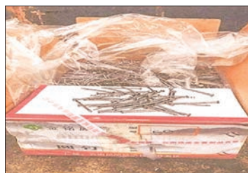
Confiscated illegal goods across states and regions.

an unregistered Toyota Lexus (estimated value of K10 million) and the action was taken under the Export/Import Law. Moreover, a combined team under the management of Magway Region Illegal Trade Eradication Task Force also inspected Magway