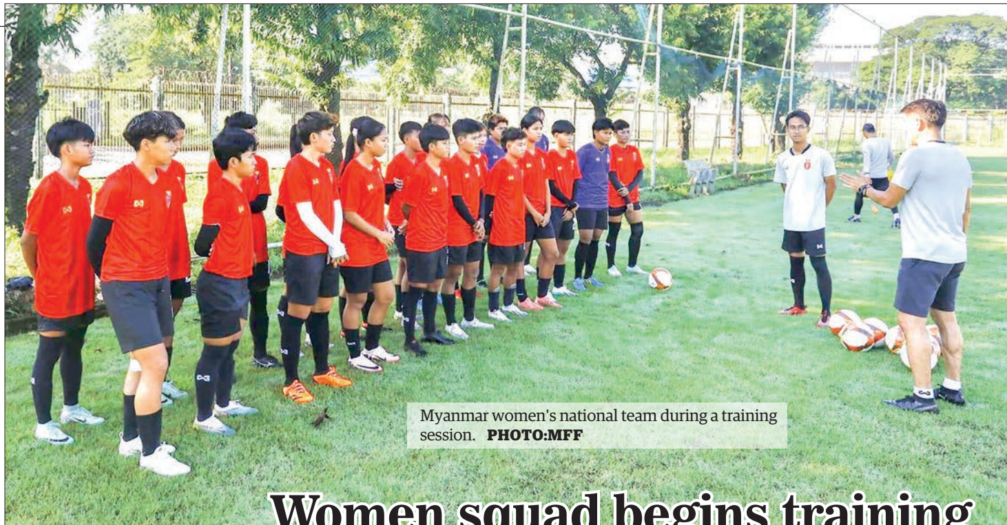
Myanmar women's national team during a training session.

Currently just over 1,000 points behind Iga Swiatek, the race for the top ranking will intensify leading to the WTA Finals in Riyadh. — AFP