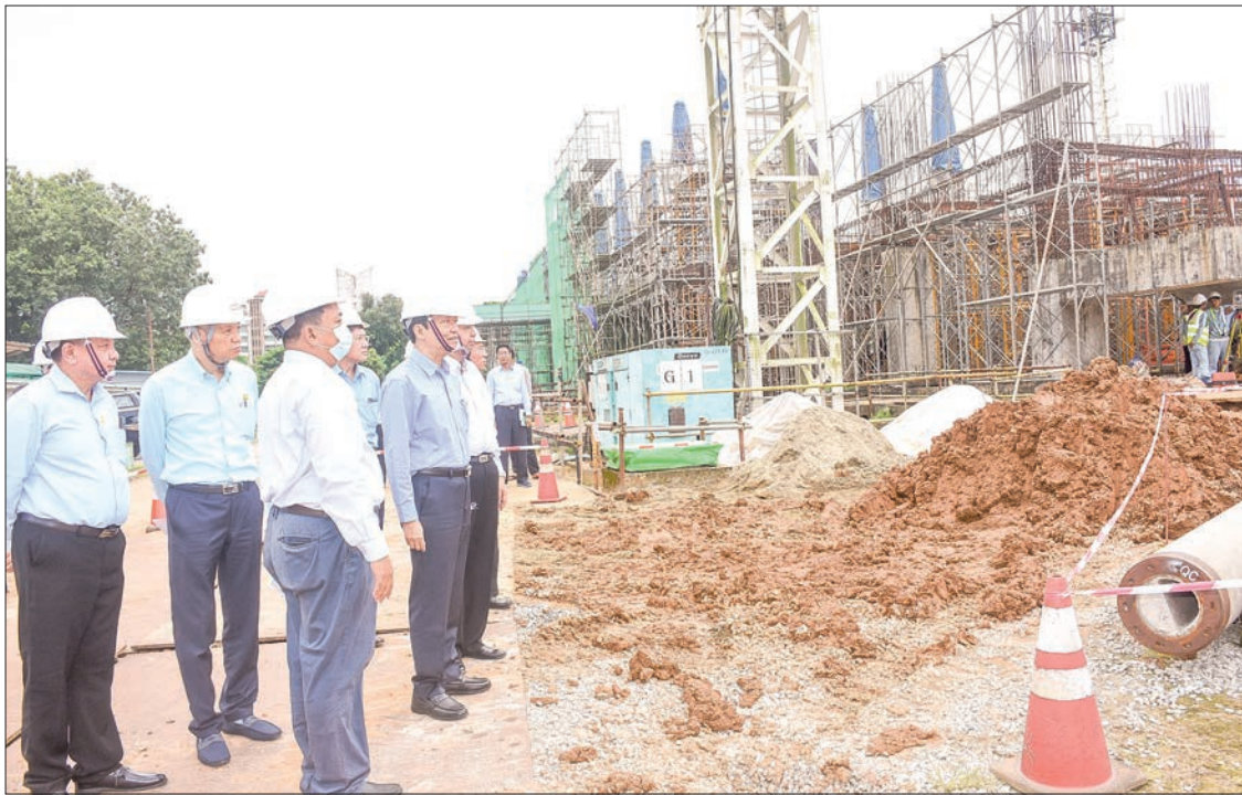
Union Minister for Health Dr Thet Khaing Win looks into the progress of the construction of New Yangon Specialist Hospital project in Lanmadaw, Yangon on 5 October 2024.

DR Thet Khaing Win, the Union Minister for Health, inspected the National Cancer Institute (NCI) in Dagon Myothit (Seik-