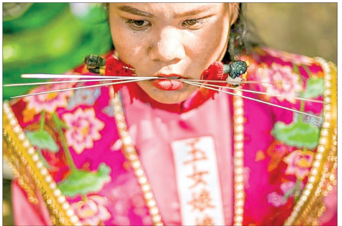
The ceremony at the 2-11 October vegetarian festival in Phuket's old town aims to cleanse 'sinful' souls.

Taking place from 2-11 October at the Jor Soo Gong Naka shrine, this ceremony symbolizes a connection to the divine, with participants embracing a strict vegetarian diet and abstaining from vices to purify themselves.