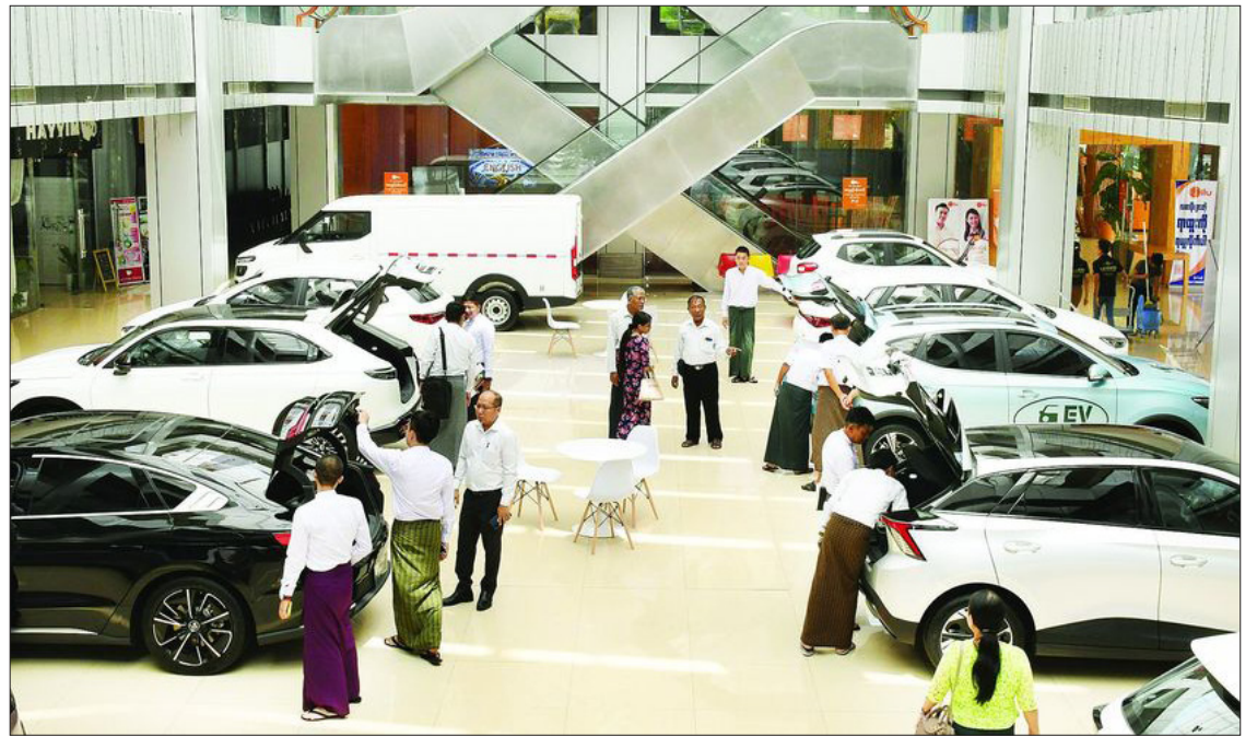
This photo depicts an auto show that sold EVs.

The 16 th Myanmar’s Biggest Property and Car Expo was held at the Lotte Hotel in Mayangon Township, Yangon Region, on 5-6 October. The event aimed to improve the market and featured booths from banks offering services to clients interested in purchasing apartments, condominiums, plots of land, and cars on instalments. — ASH/TH