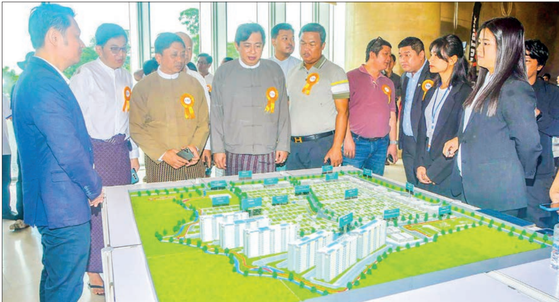
Officials from iMyanmar House and Cars DB views the displays at the the 16 th annual Myanmar Biggest Real Estate and Car Sales Fair at the Lotte Hotel on Pyay Road, Yangon, on 5 October 2024.

MYANMAR House and Cars DB hosted the 16 th annual Myanmar Biggest Real Estate and Car Sales Fair at the Lotte Hotel on Pyay Road, Yangon, with officials from iMyanmar House and Cars DB opening the ceremony.