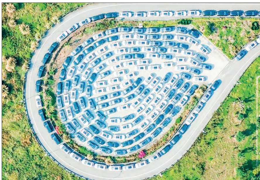
The recent decision by the European Commission, made amid internal discord, highlights the fragility of the EU's consensus.

THE European Commission's latest move to push forward its proposal to impose controversial punitive tariffs