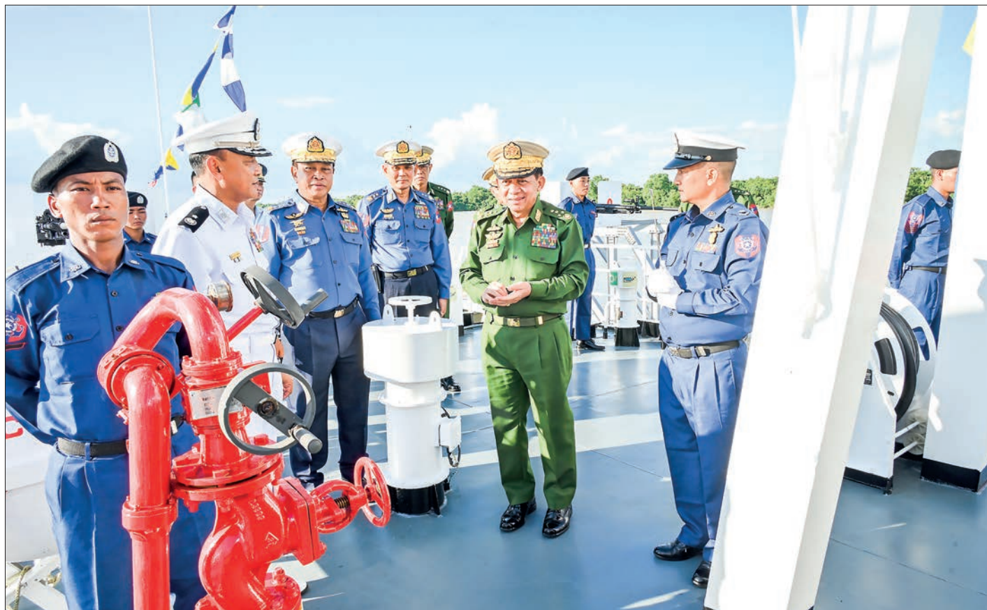
Senior General Min Aung Hlaing inspects a vessel commissioned into service for Myanmar Coast Guard at No 3 Naval Jetty (Thilawa) yesterday.

Moreover, the Senior General added his speech, saying that coast guard members are key actors to primarily take protection of maritime natural en-