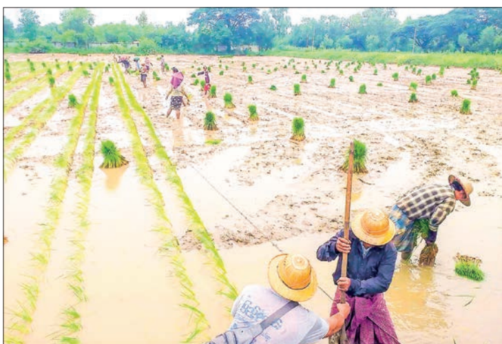
Farmers replant monsoon paddy at a field damaged by flooding caused by the effects of Typhoon Yagi in Yangon Region.

According to the Department of Agriculture in Yangon Region, 46,796 acres of paddy have been replanted after flooding caused by the effects of Typhoon Yagi. For this year's rainy season, 1,148,222 acres were planned for monsoon paddy cultivation in the region, of which 1,101,506 acres were planted. However, due to rising water levels from the Hlaing River and Ayeyawady River, 99,205 acres of paddy fields were flooded and damaged. As of 25 September, 46,796 acres of paddy have been replanted.