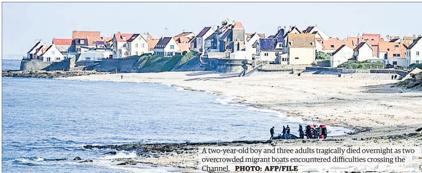
A two-year-old boy and three adults tragically died overnight as two overcrowded migrant boats encountered difficulties crossing the Channel.

The other passengers continued their journey. While French officials try to stop migrants launching their boats, for safety reasons they say they do not intervene once they are at sea except for rescues. — AFP