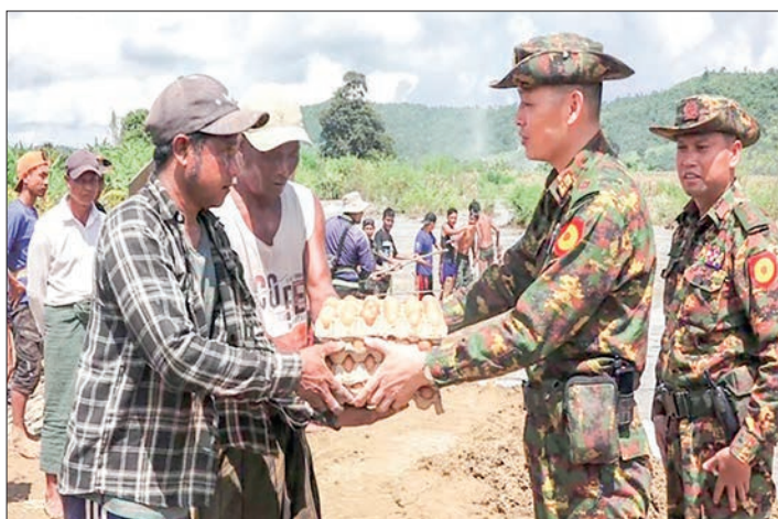
Basic foodstuffs are provided to locals.

The security forces and ethnic people observed the