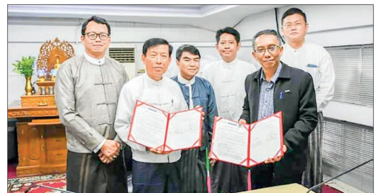
Officials from Silver Sea International Ltd and Myanmar Tourism Federation seen at the MoU signing ceremony.

The event, organized by Silver Sea International Ltd., will also feature the “Medical, Hospital, Health & Beauty Care Myanmar 2024” and “Myanmar Education & Further Study 2024” expos. The Myanmar Tourism Federation signed a Memorandum of Understanding on 26 September to support these exhibitions. — Htun Htun/KZL