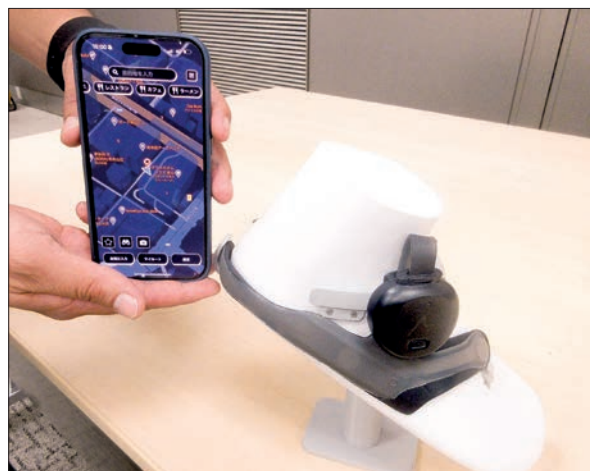
Photo taken on 30 September 2024, shows Ashirase's shoe-mounted navigation device (R) and smartphone app for the visually impaired.

A startup backed by Honda Motor Co has launched a shoe-mounted vibration device to help visually impaired people navigate their surroundings.