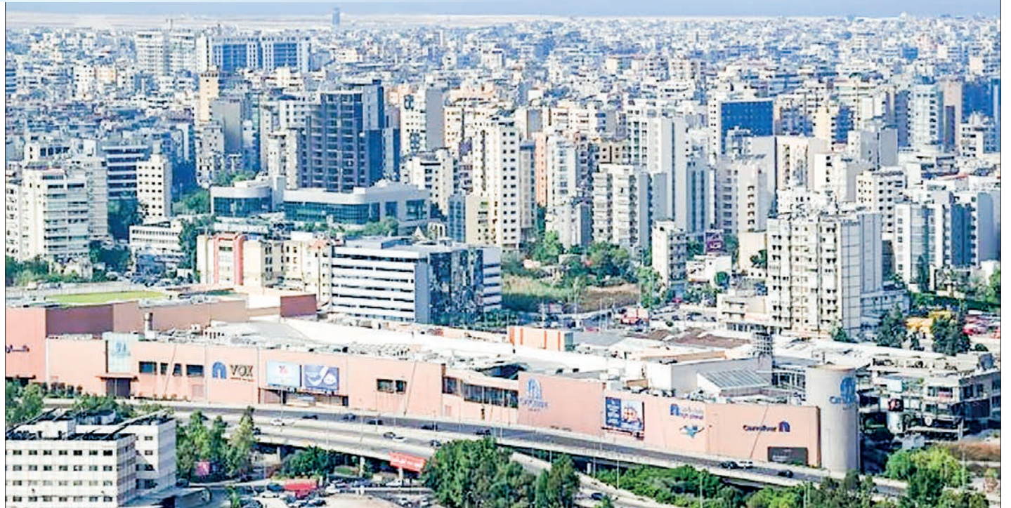
On 23 September 2024, Israel began a series of airstrikes in Lebanon as part of the ongoing Israel-Hezbollah conflict with an operation it code-named Northern Arrows. Lebanon would be on the front line of an all-out regional war.

Iran's missile strike marks a significant escalation in tensions between the two countries, and Israeli author-