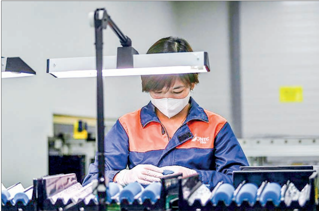
Vietnam has a large and skilled workforce in the garment industry, making it a key player in global textile production.