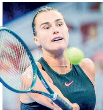
Aryna Sabalenka is targeting the world number one ranking.

Sabalenka, who was upset in the quarter-finals in Beijing