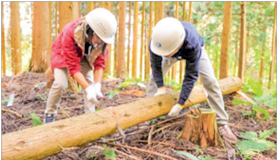
Company employees seen on a forest therapy training programme.

that Japan is recruiting technical interns from Myanmar through the Technical Intern Training Programme, the Organization for Technical Intern Training (OTIT) has informed that one new type has been added in the Agriculture and Forestry industry, it said.