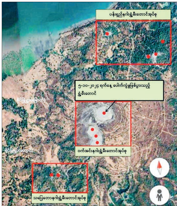
The map shows at the site of eruption of Wetin Nagar mud volcano, near Saichong Kyaywa Village in Kyaukpyu Township, Rakhine State.

There are three groups of mud volcanoes near Saichong Village in Kyaukpyu Township on Yanbye Island: the Wetin Nagar mud volcano group, the Panshay Nagar mud volcano group, and the Thabyaytaw Nagar mud volcano group. Reports indicate that the Panshay Nagar and Wetin Nagar mud volcano groups experience the most frequent eruptions. These mud volcanoes rise to heights of approximately 50 to 60 metres above sea level. The