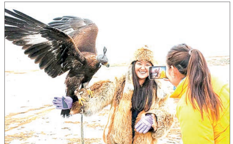
Mongolia's ecotourism offers a unique opportunity to explore its vast landscapes and rich cultural heritage while promoting sustainable practices that protect the environment and local communities.

$4,000 for over a decade, Mongolia's per capita GDP surpassed $6,000 in 2023, driven by improvements in port access, the identification of hidden economy in the mineral sector, and growth in tourism. According to projected estimates, the per capita GDP of our country is expected to reach around $6,800 in 2025," he said. — Xinhua