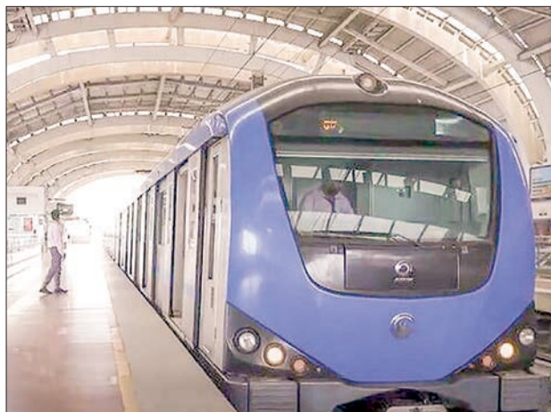
Central Government to fund 65 per cent of Chennai Metro Phase 2 costs.

WITH the Cabinet's recent approval, the Central Government will now finance about 65 per cent of the total estimated cost of the Chennai Metro Phase 2, including a loan of Rs33,593 crore and an additional Rs7,425 crore in equity and subordinate debt.