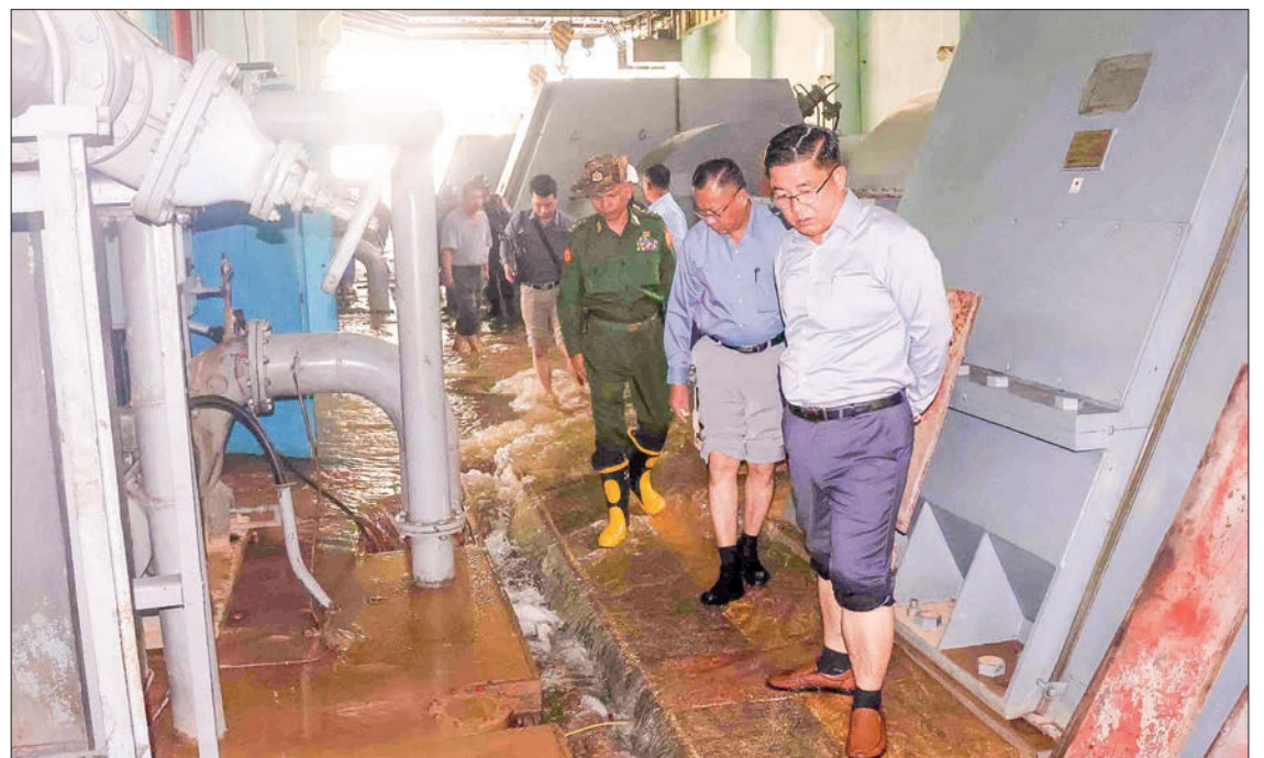
Kayah State Chief Minister U Zaw Myo Tin looks into the ongoing water removal operations inside the No 2 Biluchaung Hydropower Plant (Lawpita) yesterday.

Afterward, they visited the Lawdalay Station Hospital (16-bed), where the medical officer in charge detailed the