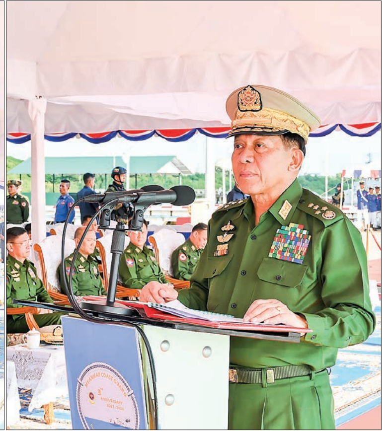
Chairman of the State Administration Council Commander-in-Chief of Defence Services Senior General Min Aung Hlaing delivers speech at the third anniversary of the Myanmar Coast Guard and patrol vessels commissioned into service ceremonies at No 3 Naval Jetty (Thilawa), Yangon Region, yesterday.