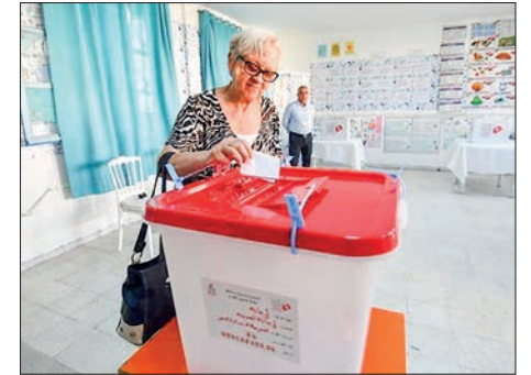
A Tunisian casts her vote in the presidential election at a polling station in Tunis on 6 October 2024.