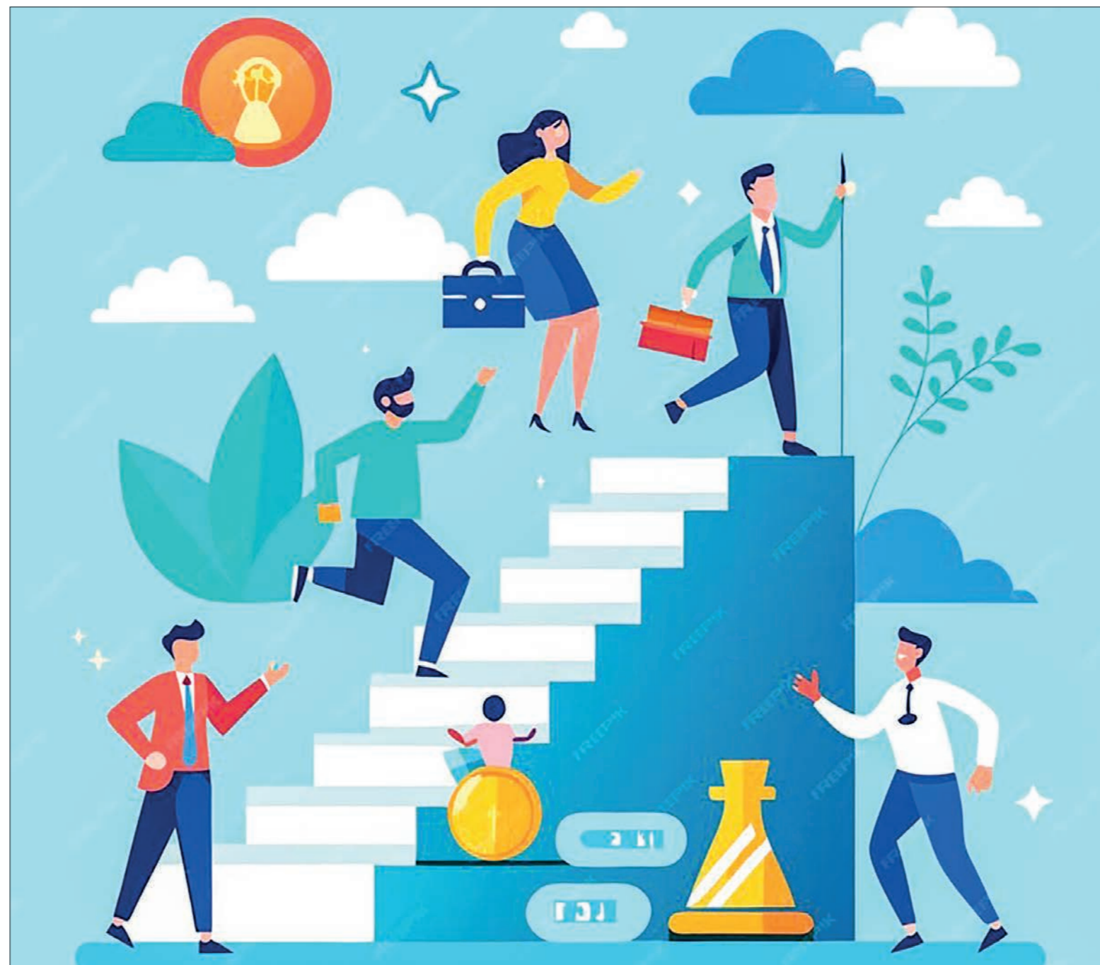
An infographic growth vector design shows professional steps depicting milestones of success in life.

Milestones will exist depending on somebody's wonderful endeavours. Some milestones are gradually fading out, but some milestones have existed for many centuries in global history. Some have been notorious for their malpractices, but their titles are still famous in the society. However, these notorious milestones cannot be compared with those of famous persons. Although both types of persons could set milestones in their lives, it is sure that the most remarkable milestone of a famous person can occupy the hearts and souls of the people regardless of enemy, religion, nationality, country and gender. Whenever people know the root causes of a milestone based on notorious deeds, people will denounce it. Otherwise, people will always praise the milestones depending on genuine and acceptable root causes.