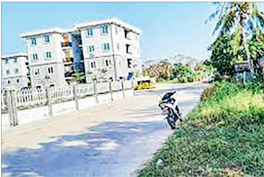
A housing in Pathein.