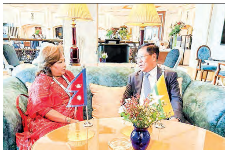
Deputy Prime Minister MoFA Union Minister U Than Swe meets Dr Arzu Rana Deuba, Nepali Minister of Foreign Affairs on 3 October.

Myanmar Ambassador to the State of Qatar U Tin Yu and senior officials from the Ministry of Foreign Affairs were also present at the meetings with