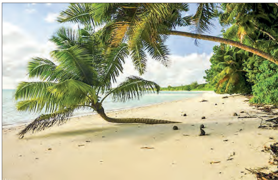
A beach on Diego Garcia, one of the Chagos Islands.

The Chagos Archipelago was hived off Mauritius in 1965 when the latter was a British colony. Britain has retained possession of the islands ever since, while Mauritius has continued to claim its sovereignty over them. — Xinhua