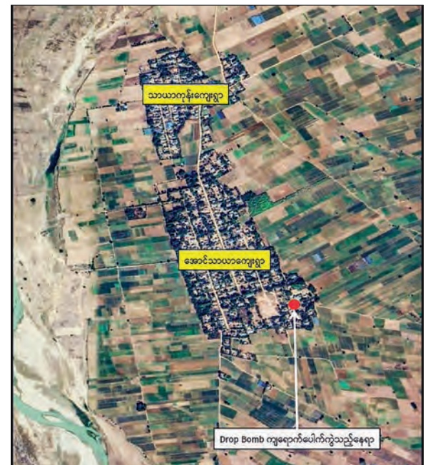
The location map of the attack incident in Kanbalu Township.

This reckless act of violence against peaceful villagers constitutes a war crime under the Geneva Conventions and international laws. Locals are reportedly expressing strong resentment towards PDF terrorists for their heinous actions and actively participating in Tatmadaw's efforts to combat these violent acts. — MNA/KZL