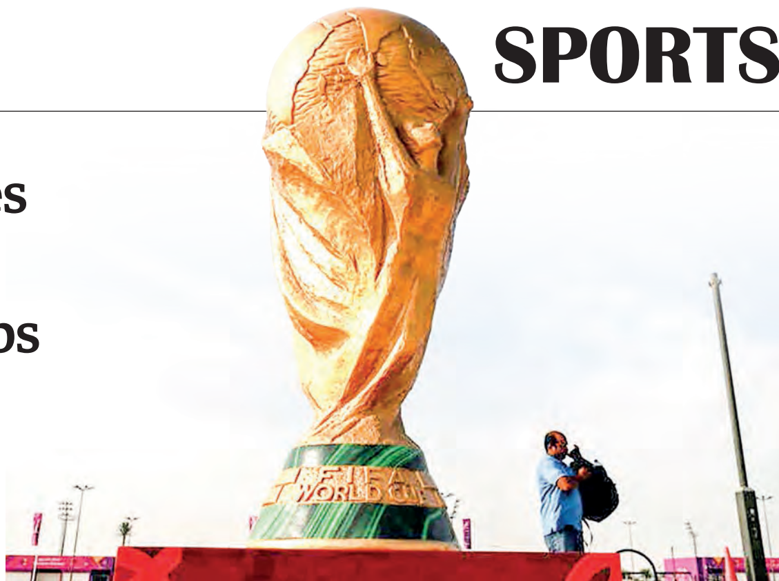
Men walk past a FIFA World Cup trophy replica outside the Ahmed bin Ali Stadium in Al-Rayyan, Qatar on 12 November 2022.

FIFA released the Women's Football Strategy: 2024-2027, "which reflects the overarching framework of FIFA's Strategic