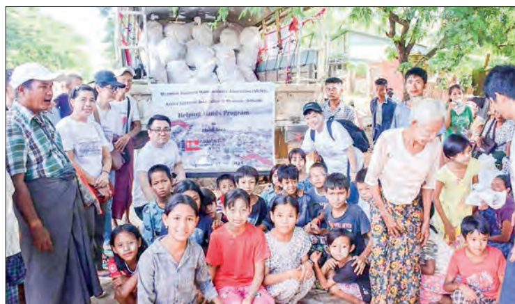
This picture captures the Myanmar Garment Manufacturers Association assisting flood victims through its donation package ‘Phase II’.

Essential needs, such as clothing, foodstuffs, and other consumer products, were al-