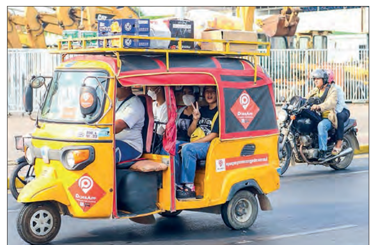
People travel on a road in Phnom Penh, Cambodia on 12 April 2024.

est celebration in the Southeast Asian country after the lunar New Year in April. — Xinhua