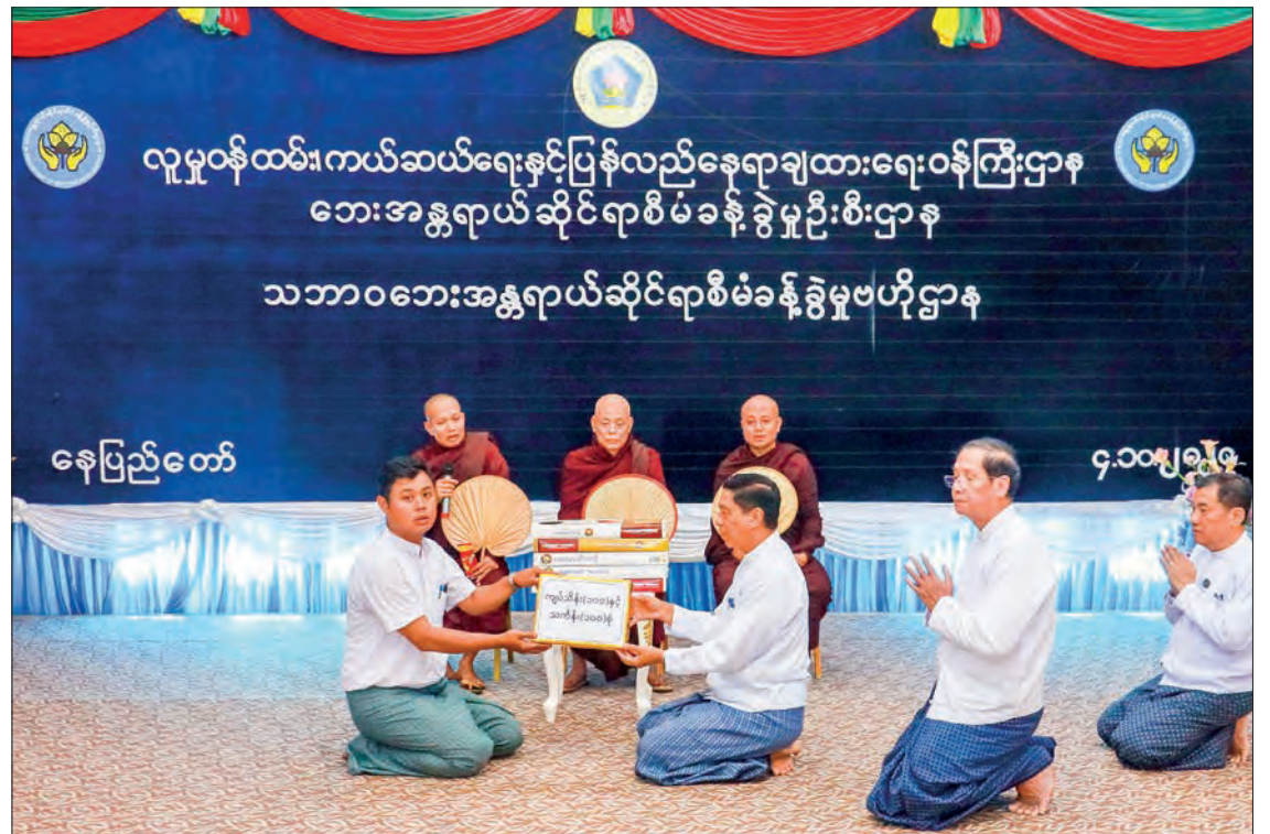
Union Minister Dr Soe Win receives donations for flood relief yesterday.

Ministry of Social Welfare, Relief, and Resettlement. Union Minister Dr Soe Win accepted the donations, expressed gratitude, and presented a certificate of appreciation. — MNA/TRKM