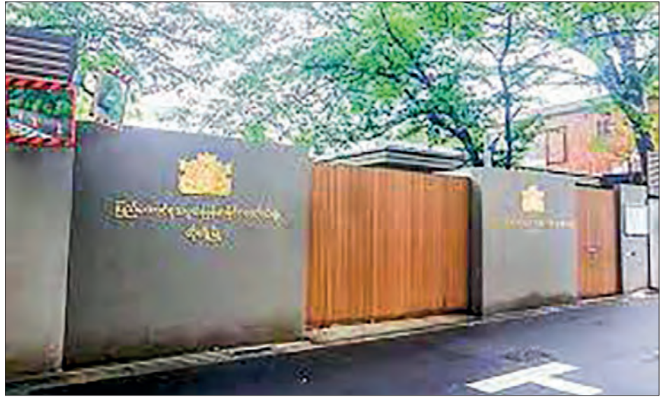
The Myanmar Embassy is in Tokyo, Japan.

Therefore, those who submitted passport service or income tax and official recommendation by post or those who requested to resend those documents by post are urged to submit again with a stamp corresponding to a type of envelope, along with the applicant name, date of birth, passport number and subject of application, it said. For 520-yen envelopes, an 80-yen stamp or stamps equivalent to 80 yen will have to be re-submitted. For 370-yen envelopes, a 60-yen stamp or stamps equivalent to 60 yen will have