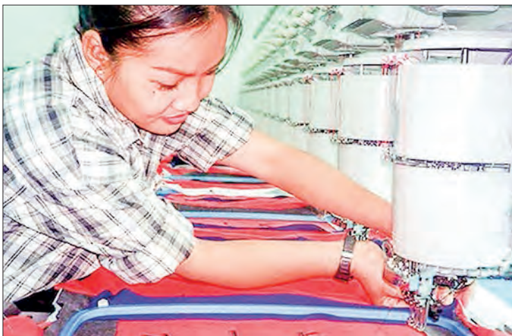
A worker embroiders logos on Nike apparel in a garment factory in Vientiane.

Meanwhile, high inflation and depreciation of the kip mean that workers are being paid less in real terms, undermining their spending capacity and widely believed to have forced many to seek employment in other countries, leading to worsening domestic labor shortages. — Xinhua