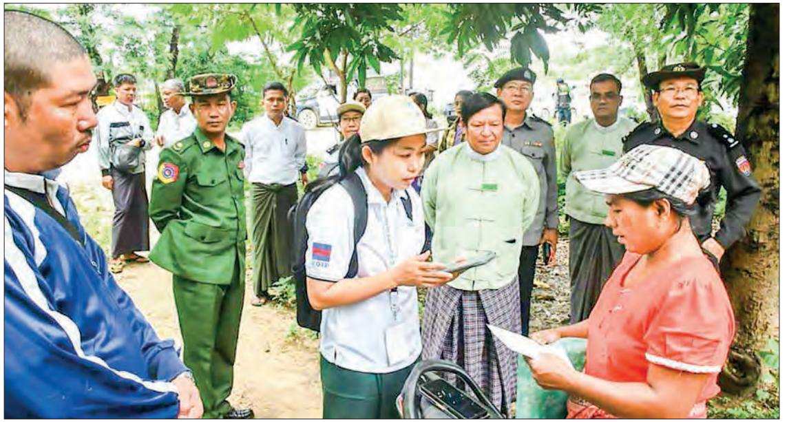
This picture captures the Nationwide Census Collection.

According to the 2014 population and household census, there were 10.88 million households in Myanmar.