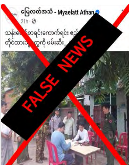
This screenshot validates fabricated stories.

Therefore, these subversive media outlets are deliberately circulating false information in an attempt to undermine the census. — MNA/TRKM