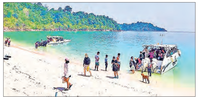
This picture depicts foreign tourists visiting Myeik Archipelago in the previous year.