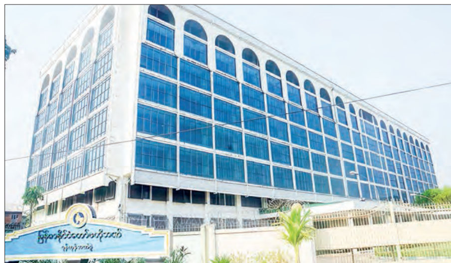
A facade view of the Central Bank of Myanmar (CBM) office in Yangon.

CBM aims to curb the instability in the foreign exchange market and the currency devaluation. According to CBM's notification on 15 March, it has been joining hands with law enforcement agencies to combat and prosecute those who attempt to manipulate the currency market under the existing laws. CBM allowed authorized dealers (private banks) to operate online foreign exchange trading freely as per the market rate depending on supply and demand, starting from 5 December 2023. — NN/KK