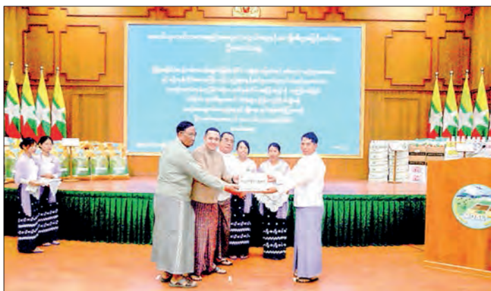
Union Minister U Min Naung receives financial donations for agricultural recovery yesterday.

During the event, the chairpersons of the Myanmar Rice Federation and the Myanmar Pulses, Beans, and Sesame Seeds Merchants Association explained the purpose of their donations. Following the speeches, the Myanmar Rice Federation donated K1,250 million in zero-interest loans and K500 million in financial assistance, and an additional K500 million was provided by the Myanmar Pulses, Beans,