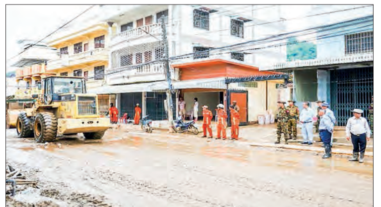
Recovery measures are underway.

He also mentioned that in areas where replanting rice is not feasible, other suitable crops would be introduced, with the financial support of K500 million. This support includes providing one tonne of seeds per acre for the replanting of 2,692 acres of green gram and 1,304 acres of pigeon pea. The Union Minister expressed gratitude to the donating federations and companies for their generous contributions. — MNA/KZL