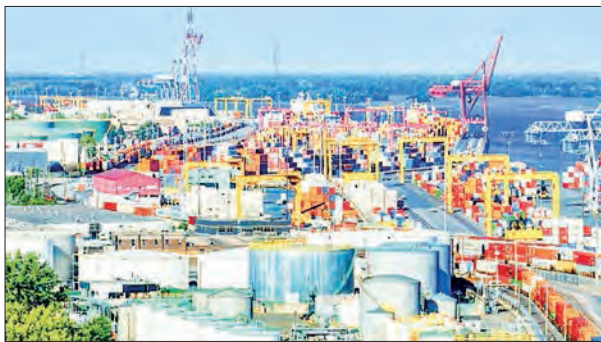
Dockworkers at the port of Montreal have ended a partial three-day strike as planned.

according to the ILA — paralyzed 36 ports from Maine to Texas, which handle an array of goods from food to electronics. But Thursday evening, the two sides announced in a joint statement that they had "reached a tentative agreement on wages and have agreed to extend the Master Contract until 15 January, 2025 to return to the bargaining table to negotiate all other outstanding issues.— AFP