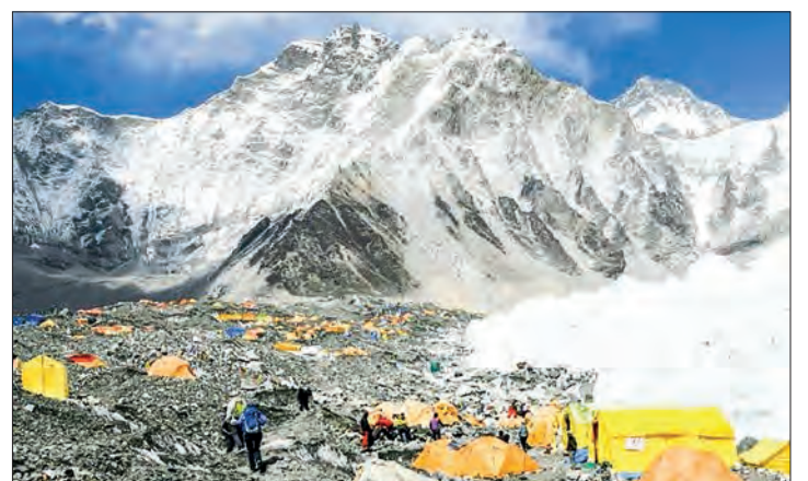
Nepal's tourism thrives on the allure of Everest, attracting climbers from around the globe eager to conquer the world's highest peak.

bank's loosening of monetary policies and easing of regulatory requirements. — Xinhua