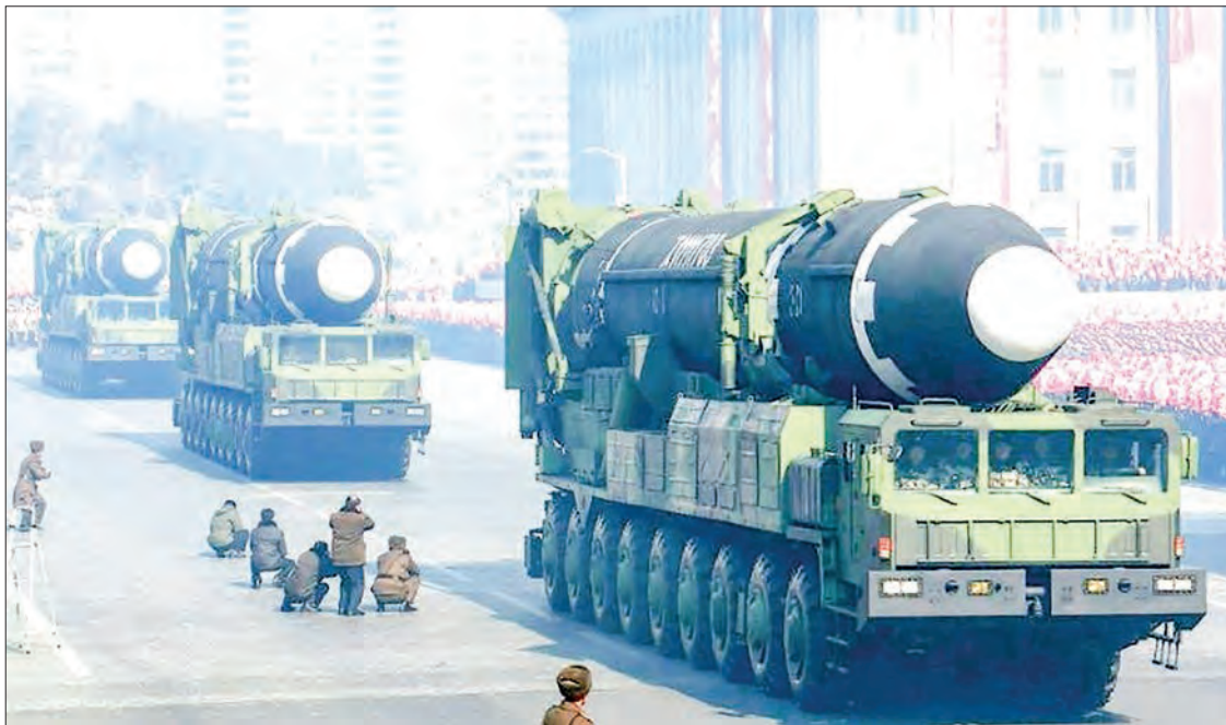
Hwasong-15 ballistic missiles during the military parade to mark the 70 th anniversary of the Korean People's Army at Kim Il Sung Square in Pyongyang.

Kim asserted that the nation has firmly established itself as a nuclear power, with the necessary systems in place for its use.