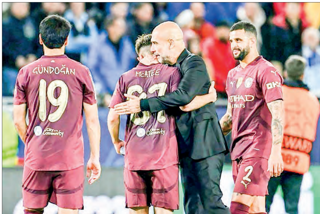
Manchester City manager Pep Guardiola celebrates with his players.

"And, of course I am going to defend my club, I trust them, the owner, the chairman, the CEO, and all the people working here, for many, many years. — AFP