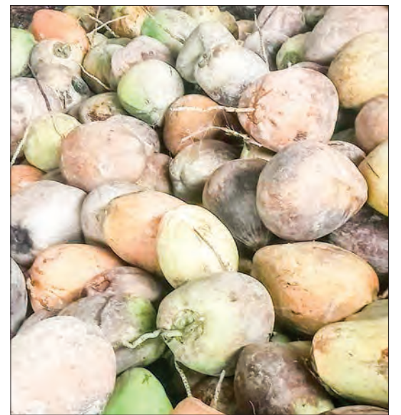
This photo captures coconuts produced from Bogale Township.

In August, the majority of orders were placed from Yangon, and orders for green coconuts were chiefly from Yangon last summer. — Thit Taw/ZS