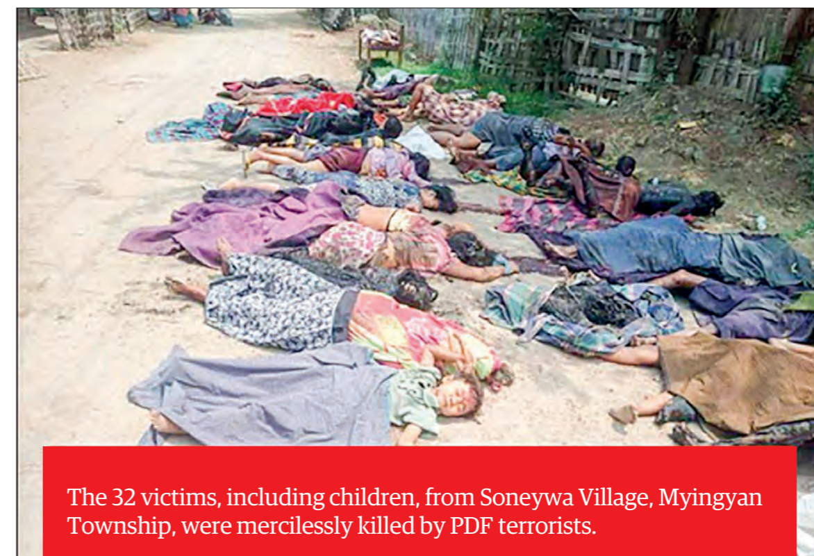
The 32 victims, including children, from Soneywa Village, Myingyan Township, were mercilessly killed by PDF terrorists.

“The evidence of these attacks clearly shows that PDF terrorists, who are funded and armed by NUG, have committed atrocities against innocent civilians. According to watchdog reports, PDF terrorists have killed 6,667 people under NUG's instructions from 1 February 2021, to 5 September 2024. Detailed records on websites such as www.infosheet.org show that the victims include 5,312 civilians, 833 administrators, 75 teachers, 17 healthcare workers, 279 civil servants, 65 retired military personnel, two nuns, and 84 monks.”