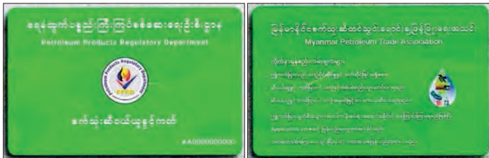
This picture shows a smart card for buying fuel oil.

cially announced. It aims just to trace data but not to limit the sales volume,” said an official of the MPTA.