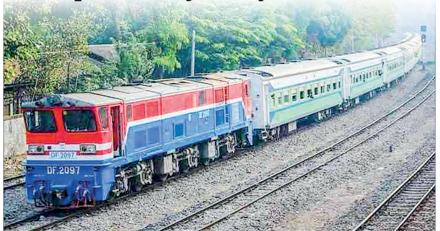
This photo captures the Yangon-Mandalay passenger train en route to its destination.

Myanma Railways has resumed high-speed passenger and mail train services between Yangon and Mandalay, commencing on 3 October, after a temporary suspension due to floods across regions and states, including Nay Pyi Taw Council Area, according to the service organization.