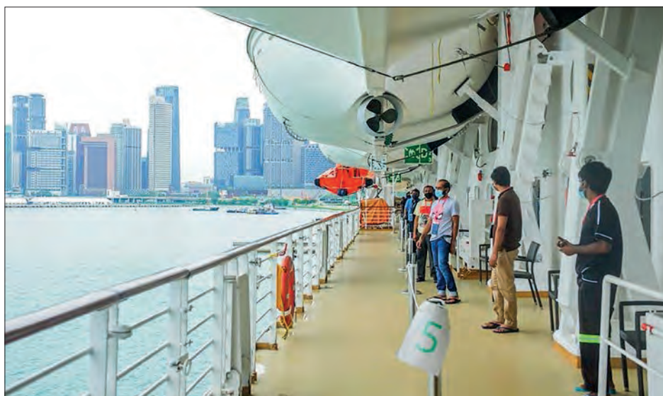
Migrant workers enjoy their outdoor time aboard the SuperStar Gemini cruise ship berthed at Singapore's Marina Bay Cruise Centre on 23 May 2020.

A PMI reading of 50 and above indicates expansion, while a reading below 50 indicates contraction. — Xinhua