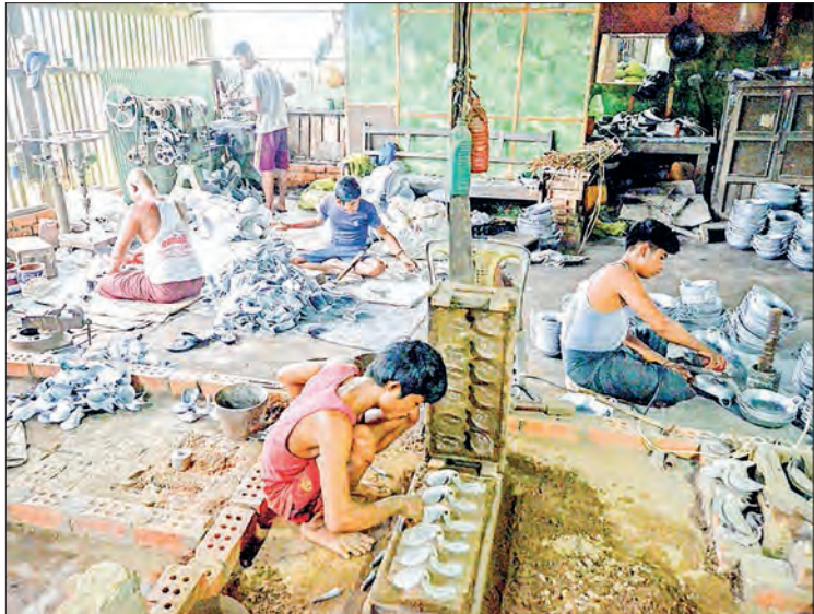
Diligent workers focus on the production process at an MSME workplace.