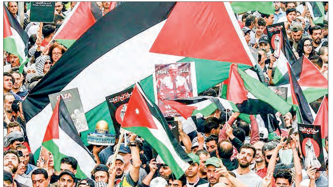
Palestinian flags are waved at a rally in solidarity with Gazans held in Amman, Jordan. PHOTO: AFP/FILE

According to the Istanbul Chamber of Commerce, retail prices in Turkey's largest city Istanbul alone increased by 3.9 per cent on a monthly basis and 59.2 per cent on an annual basis in September. — AFP