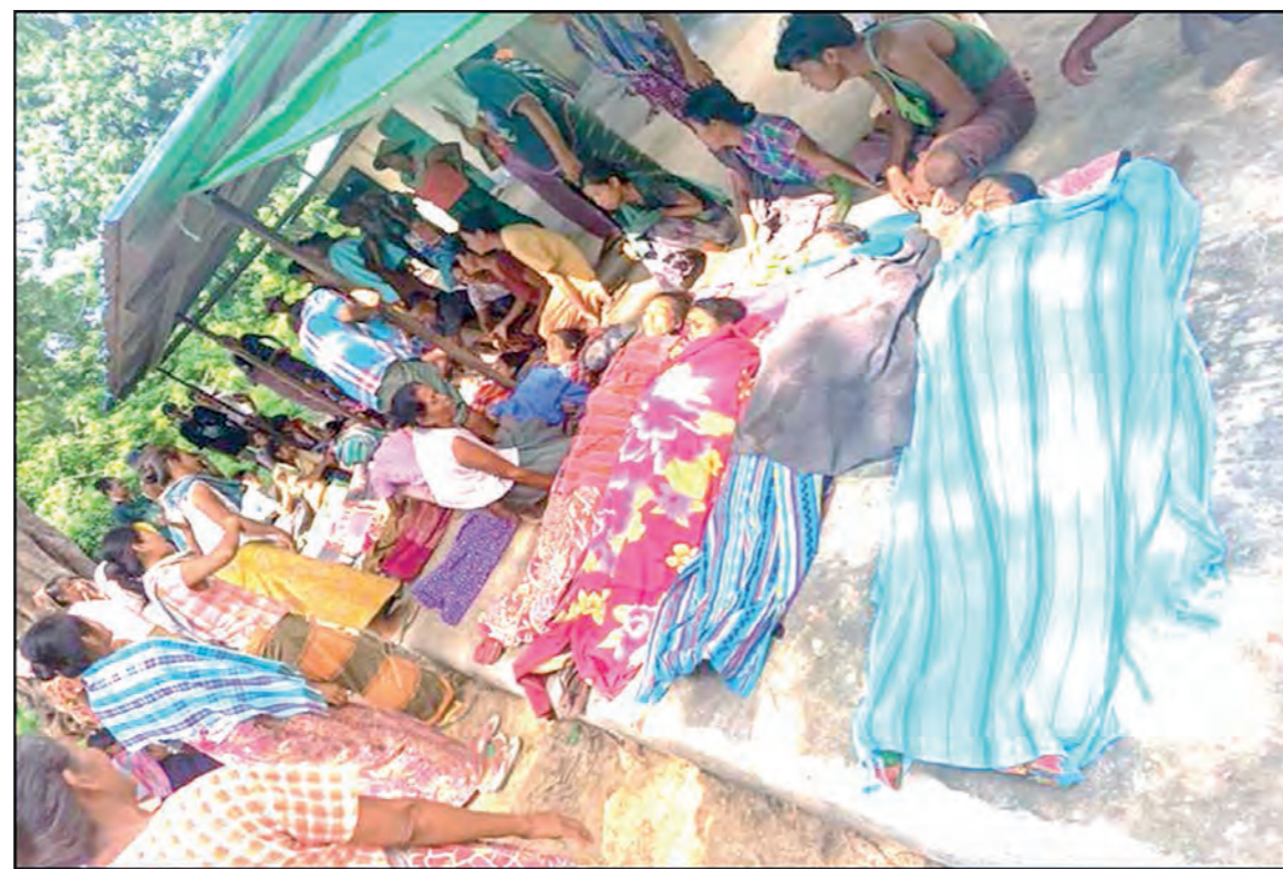
Young women from Kywepon Village, Sagaing Township, killed in a reckless armed attack by PDF terrorists while on their way to work on a farm

I wish to highlight the undeniable proof of these terrorist groups indiscriminately killing innocent people without justification. I would particu-