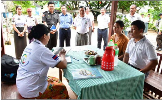
Nay Pyi Taw.

Myanmar's Nationwide Census Collection is underway across states, regions and Nay Pyi Taw Union Territory.