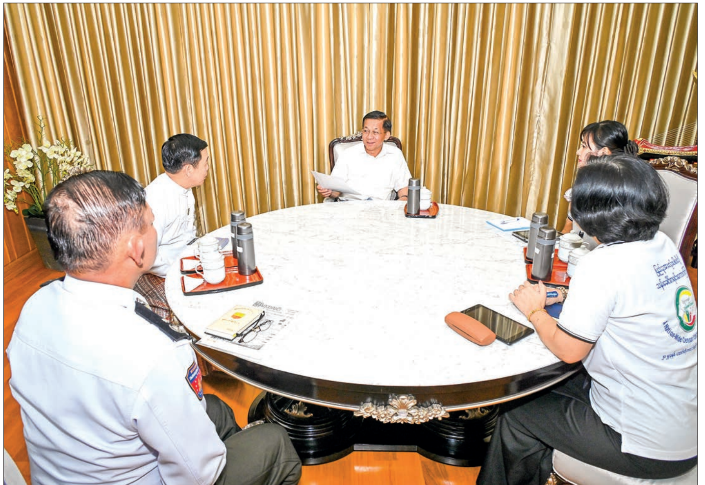
State Administration Council Chairman Prime Minister Senior General Min Aung Hlaing provides census data to enumerators led by Union Minister for Immigration & Population U Myint Kyaing (2L) in Nay Pyi Taw yesterday.

Census collectors, led by Union Minister U Myint Kyaing, gathered data from State Administration Council Chairman Prime Minister Senior General Min Aung Hlaing at Tatmadaw Guesthouse yesterday.