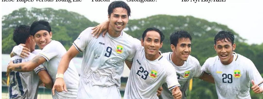
Shan United FC has secured the opportunity to compete in the AFC Challenge League.

The West Asian group matches will take place from 26 October to 1 November, while the East Asian group matches will be held from 27 October to 2 November. The group matches will be conducted simultaneously, with the quarterfinals and finals being single matches.