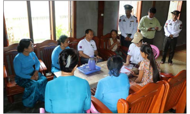
Homalin, Sagaing Region.