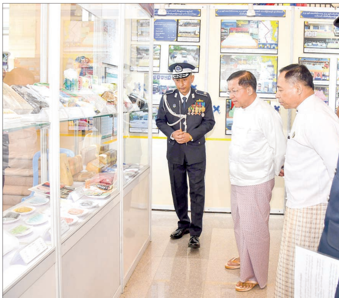
State Administration Council Chairman Prime Minister Senior General Min Aung Hlaing looks round the exhibition at yesterday's event in Nay Pyi Taw.

He underscored the functions of MPF to prevent crimes, expose the crimes to take action against offenders, manage disciplinary tasks in the country, ensure the security of the