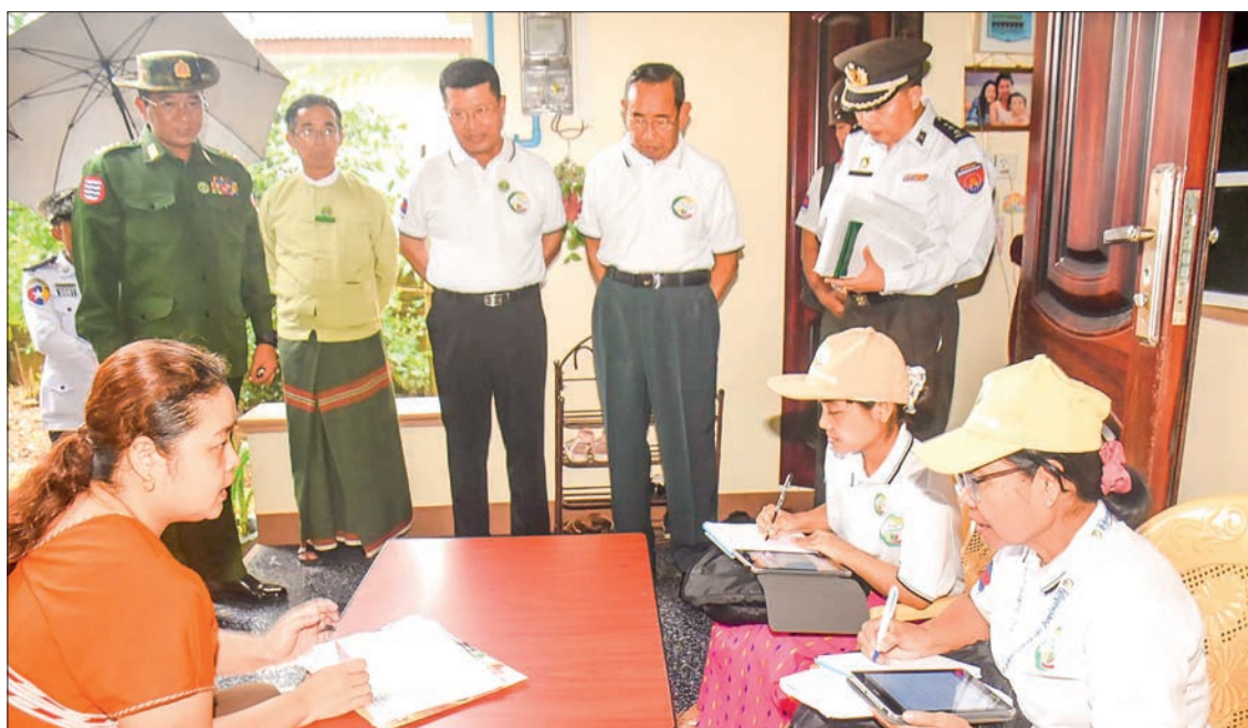
State Administration Council Member Mahn Nyein Maung views the Nationwide Census Collection process in Pathein yesterday.

In Ayeyawady Region, the 2024 population and housing census is being conducted across 26 townships, 302 wards, and 1,920 village-tracts, covering a total of 14,296 household enumeration areas. A total of 1,022 enumeration teams, 1,150 supervisors, and 4,328 enumerators are involved in the process, alongside supporting groups, including ethnic literature and cultural associations, 426 ethnic language teachers, and 49 university faculty and students, as well as community leaders, household heads, and fire brigade members. — MNA/KZL