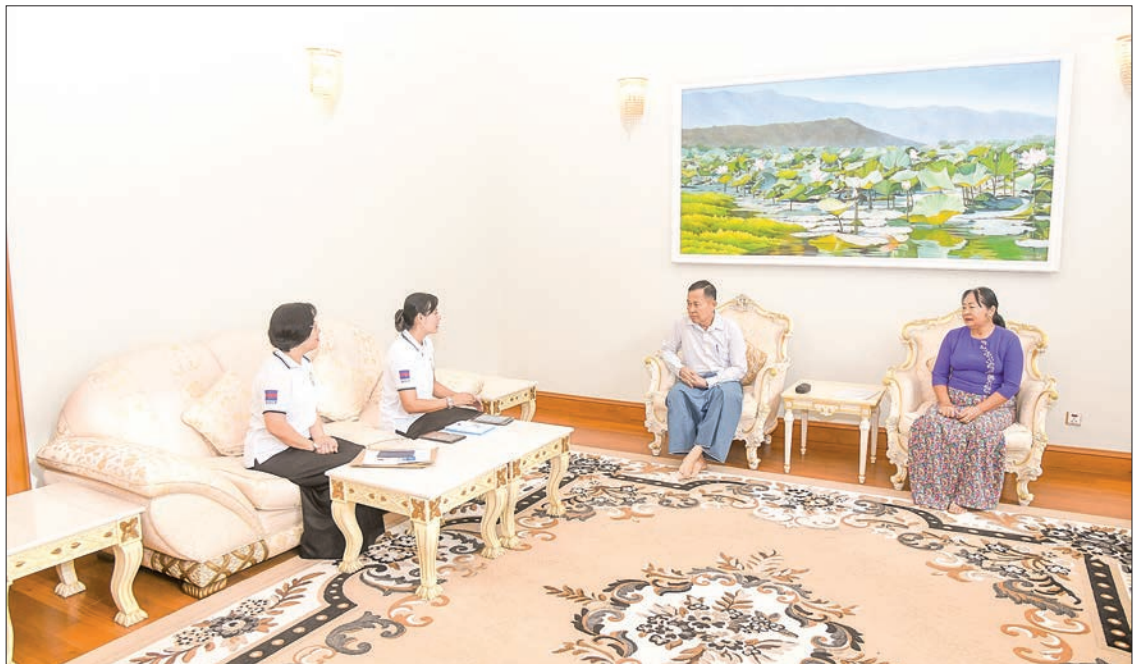
Census enumerators collect information from State Administration Council Vice-Chairman Deputy Prime Minister Vice-Senior General Soe Win, his wife, and his family members in Nay Pyi Taw yesterday.

health, and social sectors. The census team will collect data at homes from 7 am to 6 pm, and they will inform the date in advance. The census-taking process is not concerned with whether the people have a household census form 66/6 or from 10, CSC, or whether they are ethnic people or citizens. However, all the data of the people in Myanmar territory will be enumerated within the census reference timeframe except for those who are not included. Moreover, the tax will not be levied, and action will not be taken against the possessions based on the census. There is no need to worry about the family members residing abroad as there is no occasion to take action. — MNA/KTZH