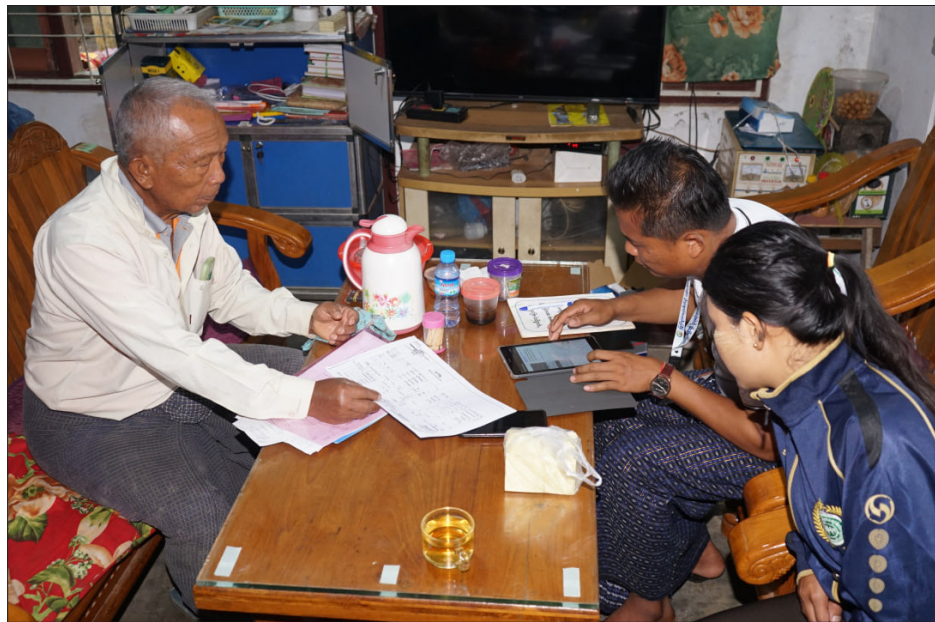
PaO Self-Administered Zone.