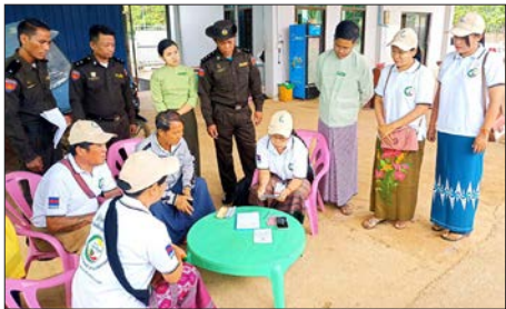
Mongyal, Shan State (North)