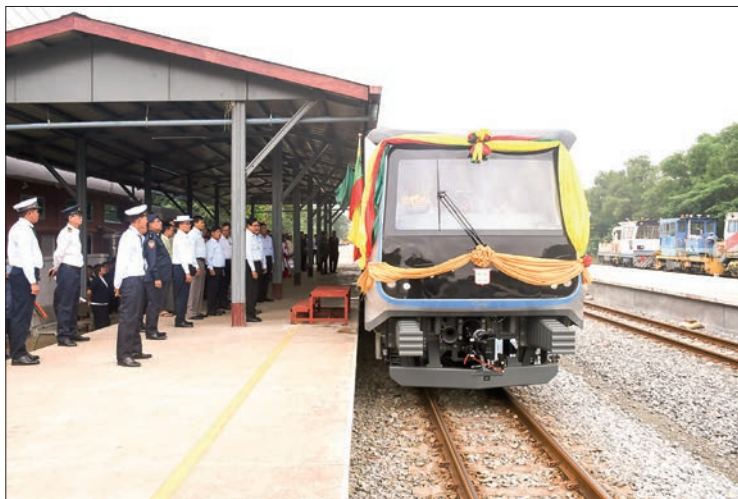
A new DEMU train is set to begin service on the Yangon-Bago route.

The chief minister spoke on the occasion that the government is making efforts in the transport sector to promote the socioeconomic status of people and keep them up-to-date with the developing trend. The Yangon circular railway line is being upgraded, and the people can enjoy services for the Yangon-Bago route with the Spain-made DEMU train carriages, which is proof of the government's effort. He then urged the passengers and locals to