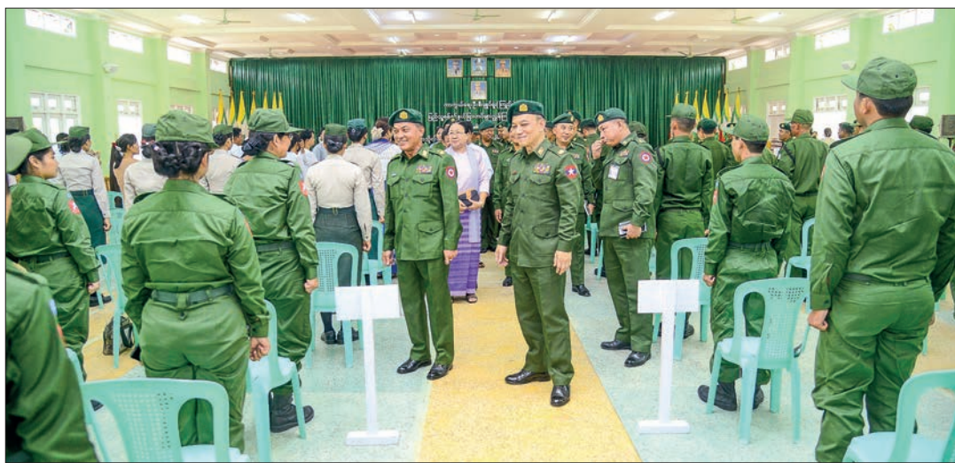
Trainees are seen attending the training for volunteer students and faculty members of the University Training Corps yesterday.

THE University Training Corps of the Directorate of People's Militia and Border Guard Force of the office of Commander-in-Chief (Army) conducted training for volunteer students and faculty members of the University Training Corps (UTC). The monsoon training opening ceremonies for UTC of the 2023-2024 academic year were opened in Nay Pyi Taw, Hmawby of Yangon,