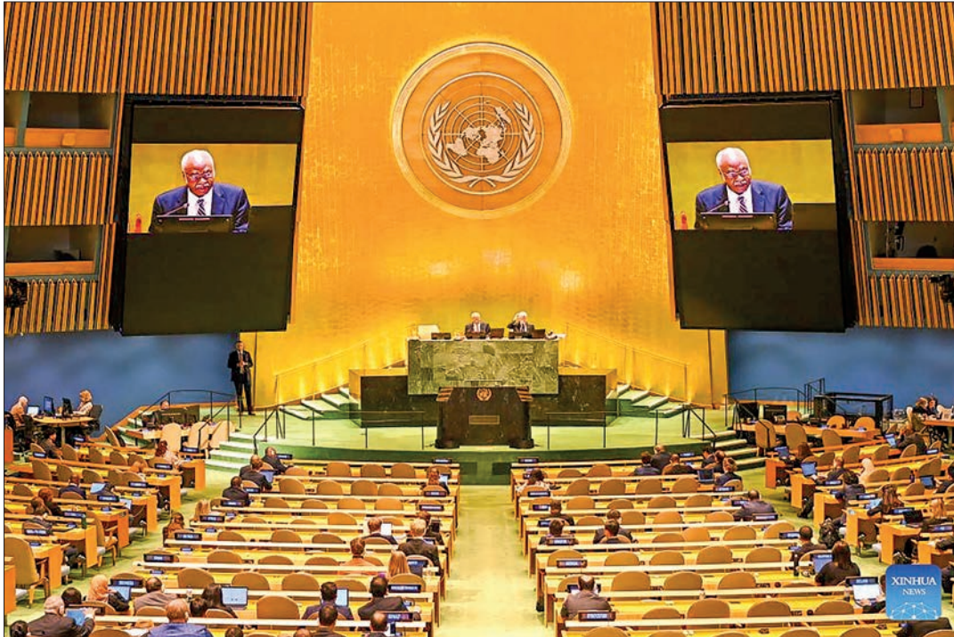
UNGA President Philemon Yang (C and on the screens) delivers concluding remarks during the General Debate of the 79 th session of the United Nations General Assembly (UNGA) at the UN headquarters in New York, on 30 September 2024.

THE General Debate of the 79 th session of the United Nations General Assembly (UNGA) concluded on Monday, with UNGA President Philemon Yang calling on Israel, Hamas and Hezbollah to urgently conclude a ceasefire. In his concluding remarks, Yang said the world has seen an extremely dramatic escalation of violence between Israel and Hezbollah in Lebanon in the past few days, warn-