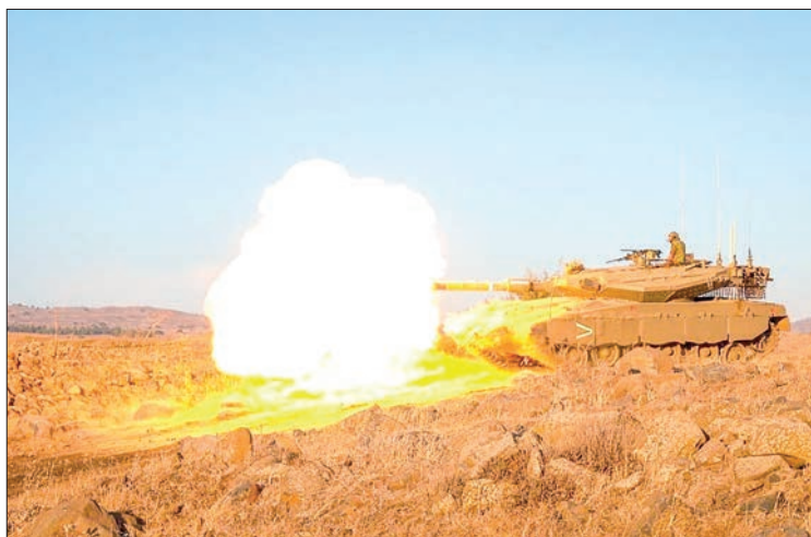
This photo released on 30 September 2024 shows Israeli troops stationed on the Israeli side of the Israel-Lebanon border.

Katsunobu Kato, one of Ishiba's competitors in the LDP race, will take the position of finance minister, while Yoichi Muto will serve as minister for economy, trade, and industry. Only two women were appointed to the cabinet: Toshiko Abe as minister of education, culture, sports, science, and technology, and Junko Mihara as minister for children's policies, reducing the number of female ministers by three compared with the Kishida cabinet. — Xinhua