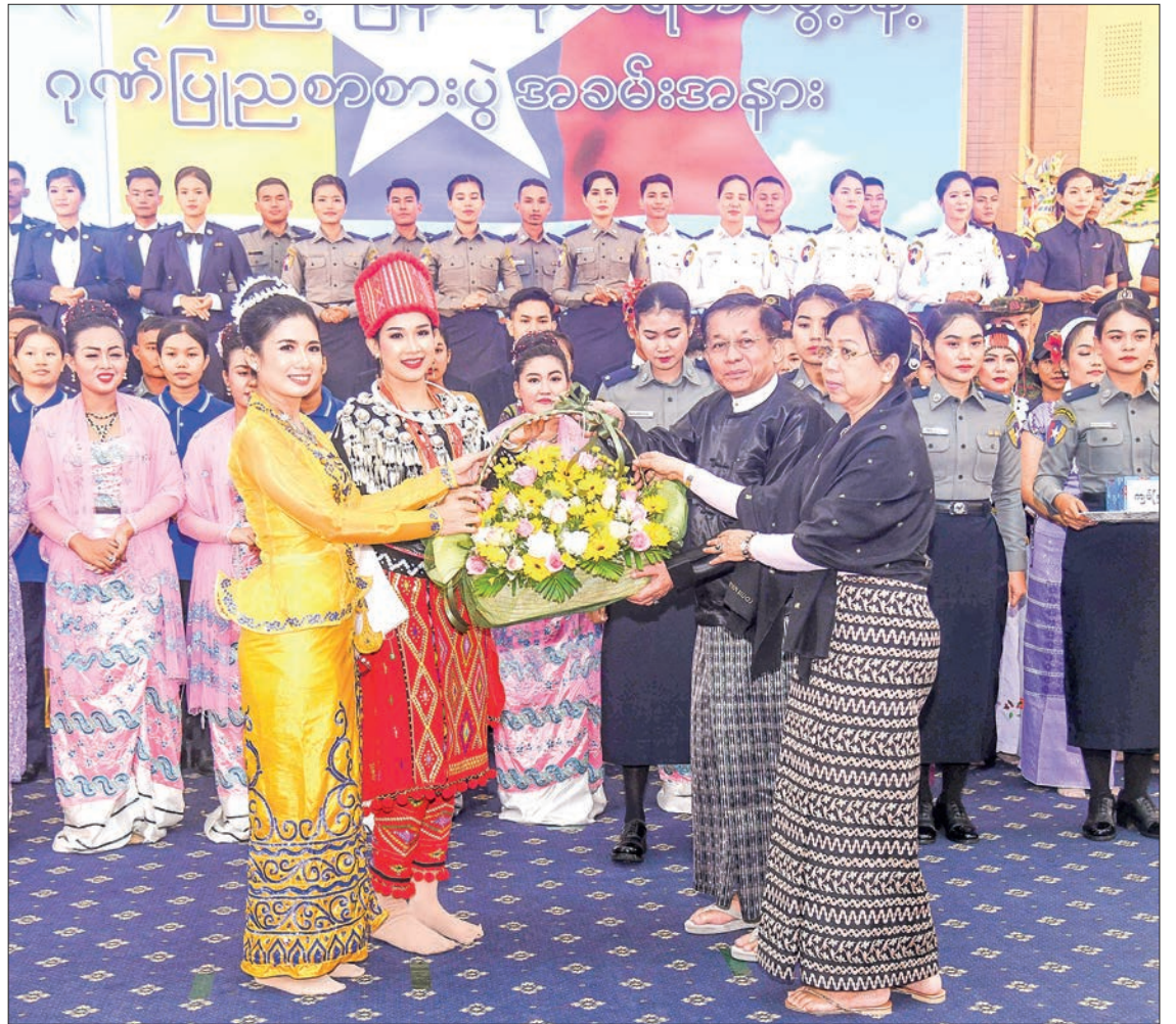
The Senior General and his wife Daw Kyu Kyu Hla present the bouquet and cash awards to the police band and performers during the dinner yesterday.

wife had dinner together with the attendees of the ceremony.