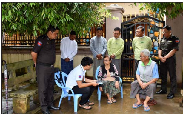
Pyin Oo Lwin.