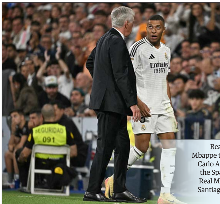
Real Madrid's French forward (9) Kylian Mbappe talks with Real Madrid's Italian coach Carlo Ancelotti as he leaves the pitch during the Spanish league football match between Real Madrid CF and Deportivo Alaves at the Santiago Bernabeu stadium in Madrid on 24 September 2024.

Girona squad following their impressive third-place finish in La Liga last season. However, a 1-1 draw away to Celta Vigo over the weekend suggests that the new lineup is beginning to find its rhythm. In a surprise move, Kylian Mbappe has been included in Real Madrid's squad travelling to Lille, despite expectations that the French striker would not play before the international break due to a muscle injury.