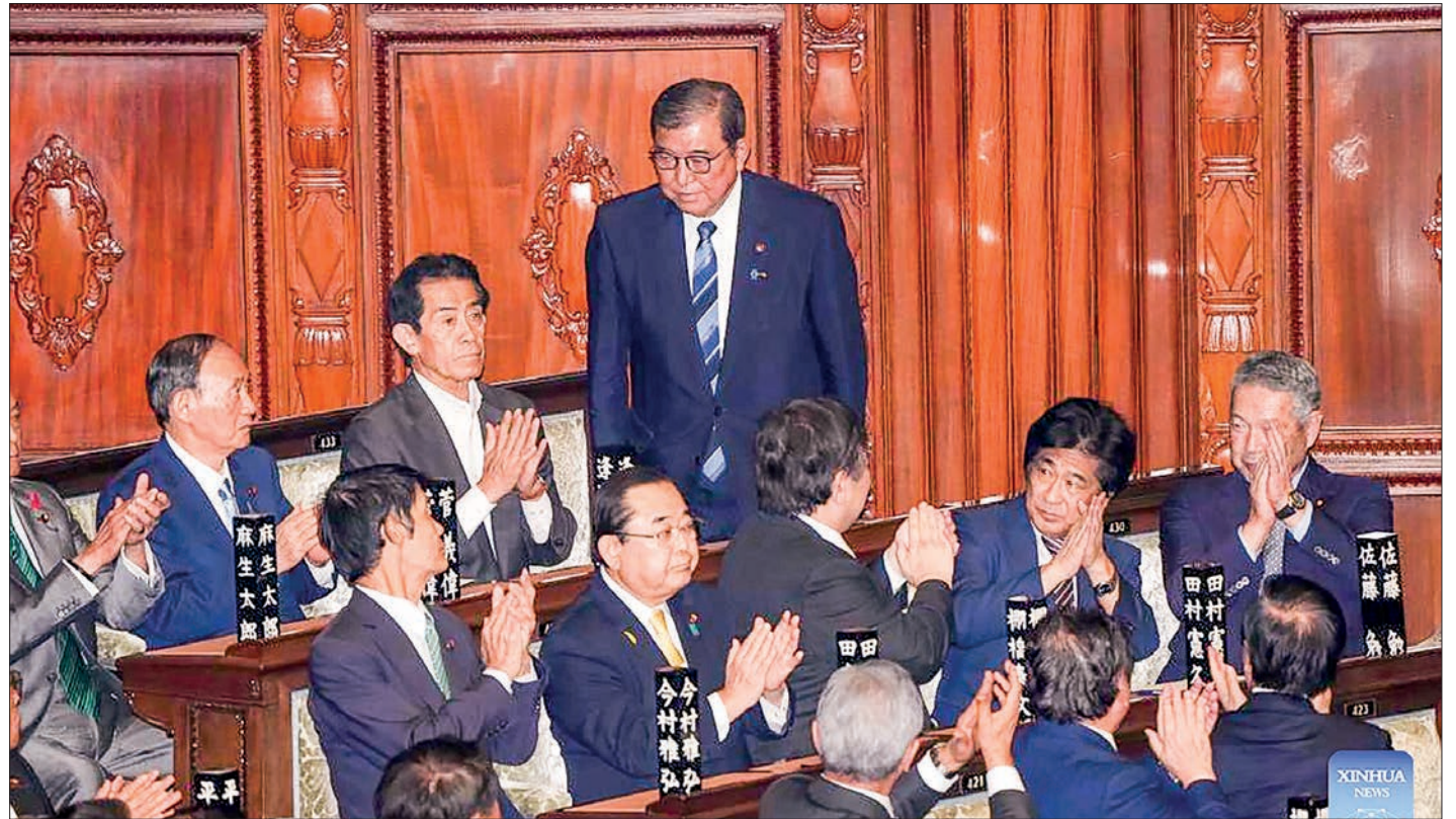
Shigeru Ishiba stands during a special Diet session in Tokyo, Japan, 1 October 2024. Shigeru Ishiba, leader of Japan's ruling Liberal Democratic Party, was officially elected the country's prime minister on Tuesday after winning a majority of votes in both houses of parliament.

German President Frank-Walter Steinmeier said that China actively responds to global challenges including the climate change, adding that it is more important than ever to carry out close and practical bilateral cooperation. He believed that Germany-China relations will continue to consolidate and deepen. — Xinhua