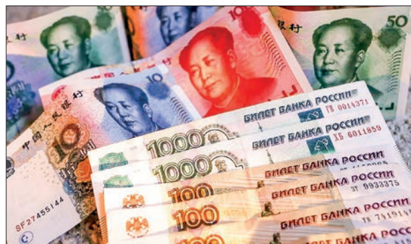
Chinese 100, 50, 20, 10 and 5 yuan bills and Russian 1,000 and 100 rouble bills.

TODAY, 95 per cent of settlements between Russia and China are carried out without the participation of third-country currencies, Russian Ambassador to China Igor Morgulov said in an interview with Sputnik.