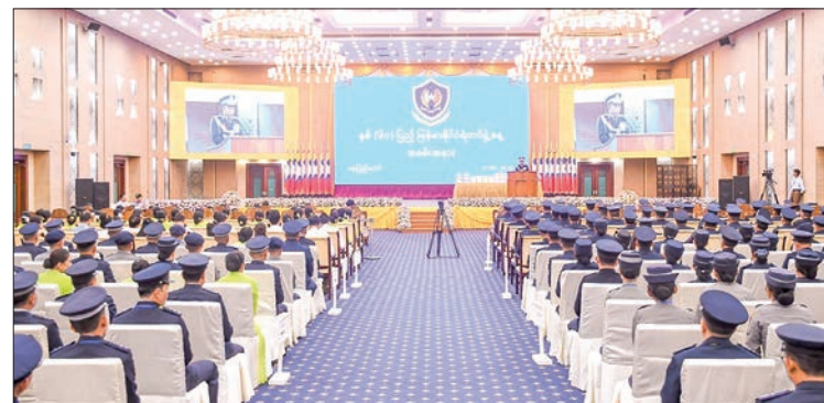
The 60 th Myanmar Police Day celebration is in progress yesterday in Nay Pyi Taw.

A video tribute to the 60 th anniversary of the Myanmar Police Force was shown, followed by a group photo with Police Lt-Gen Win Zaw Moe, police officers, awardees, and celebrity representatives.