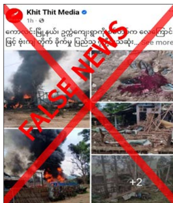
This screenshot reveals fake news.

Despite this, subversive media outlets continue to spread misinformation, aiming to create a rift between Tatmadaw and the public while concealing the utter inhumanity of the terrorists. — MNA/TRKM