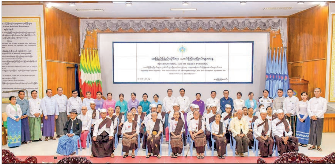
The documentary group photo of the International Day of Older Persons event held in Nay Pyi Taw yesterday.

The Union minister emphasized the need for comprehensive healthcare, support, and social services for older adults, both in Myanmar and globally. The theme for this year's 26 th In-