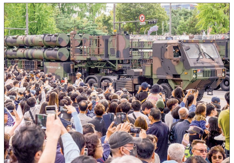
Long-range surface-to-air guided missiles are seen during a parade to celebrate South Korea's 76 th Armed Forces Day in Seoul on 1 October 2024.

Washington stations tens of thousands of troops in South Korea to help defend it against the North, and Seoul — which has no nukes of its own — is covered by the US nuclear umbrella. — AFP