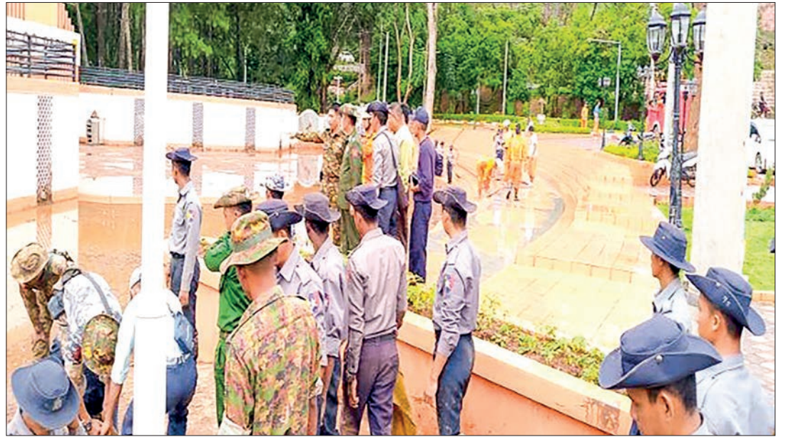
Rescue, relief and rehabilitation measures are ongoing amid the receding water.

EFFORTS for relief and recovery are proceeding vigorously in regions and states affected by flooding, including the Nay Pyi Taw Council Area. Assistance is being provided to relocate essential items for monasteries, schools, hospitals, and government buildings, while sanitation work is ongoing on local roads, bridges, and villages in Zeyathiri, Pyinmana, Lewe, and Pobbathiri townships within Nay Pyi Taw, as well as in Kalaw in southern Shan State and Loikaw in Kayah State. Members of Tatmadaw, police officers, firefighters, Red Cross personnel, and civil society organizations are collaborating with resi-