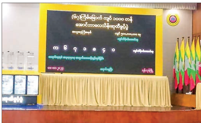
This photo shows the opening ceremony of the 67 th Aungbarlay Lottery on 1 October 2024.

ON 1 October, the 67 th Aungbarlay lottery took place, revealing the following winning numbers.