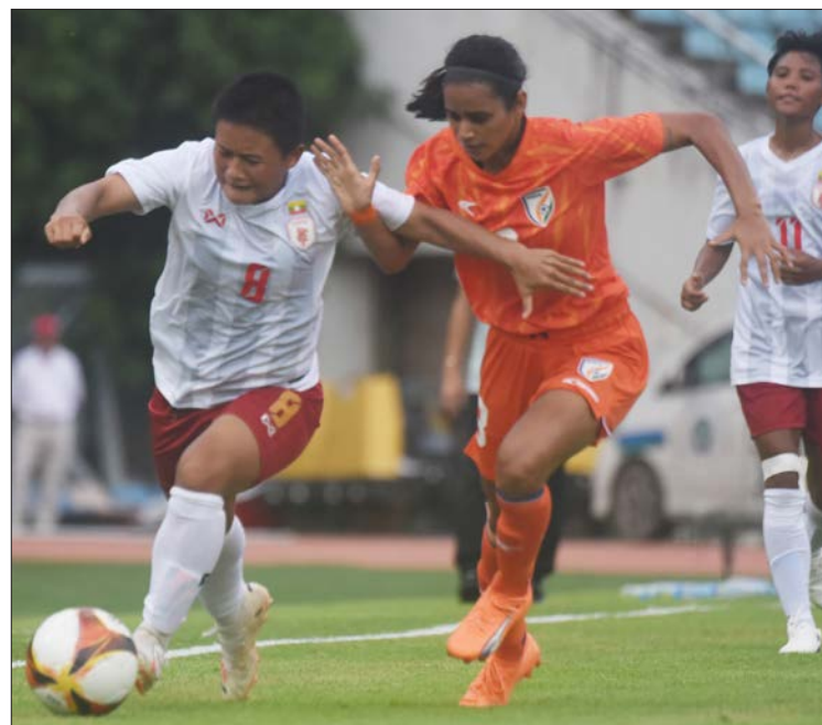
The Myanmar Women's National Team in action against the Indian Women's National Team in June.