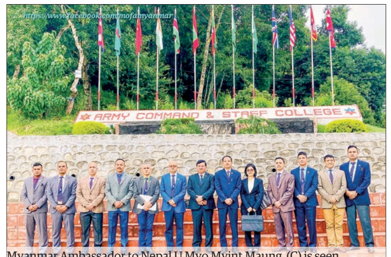
Myanmar Ambassador to Nepal U Myo Myint Maung (C) is seen alongside officials at the Army Command and Staff College of Nepal, where he gives a lecture at the 'Ambassador Talk Programme' of No 31 st Command and Staff Course on 29 September 2024.

Additionally, the ambassador was present at the 45 th World Tourism Day ceremony, celebrated by the Ministry of Culture, Tourism and Civil Aviation of Nepal at the Cultural Corporation Centre.