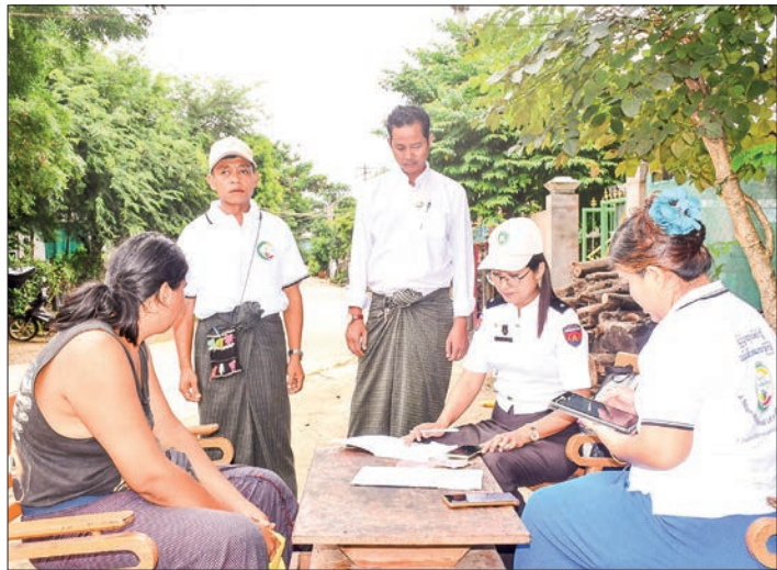
The Nationwide Census Collection is underway in Nay Pyi Taw yesterday.

BEGINNING on 1 October, the nationwide population and household census collections are underway, with the census teams conducting operations in Zabuthiri Township, Nay Pyi Taw Council Area, yesterday morning.