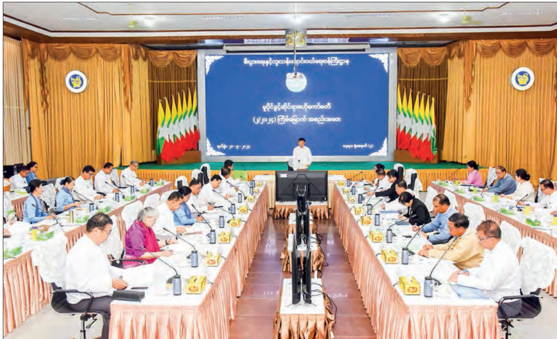
Deputy Prime Minister Union Transport & Communications Minister General Mya Tun Oo chairs the second meeting of the Central Committee on Intellectual Property Rights yesterday.

THE meeting 2/2024 of the Central Committee on Intellectual Property Rights was held yesterday afternoon at the Ministry of Commerce conference room in