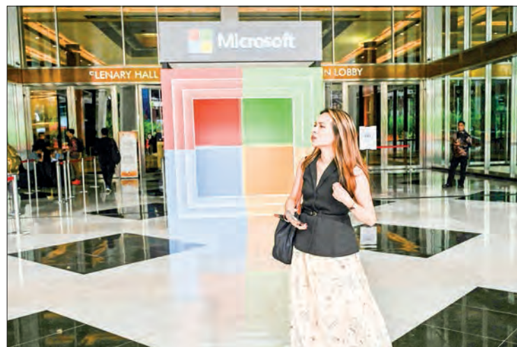
File photo shows a woman walking next to a logo of Microsoft during an event named Microsoft Build AI Day in Jakarta, Indonesia.

"The capital spending needed for AI infrastructure and the