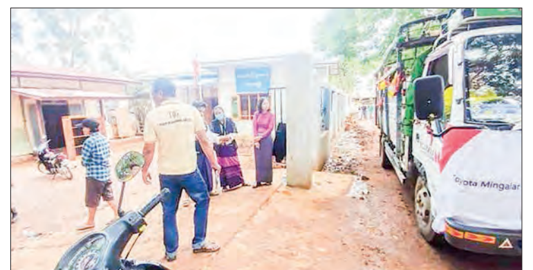
MAEX Public Co Ltd and Dagon Group are seen donating to flood victims on 19 September.

Moreover, they managed to travel to 200 flood-hit households in villages from Inbyin, and Lwe-an village-tract in Kalaw and physically supplied the victims with rice, cooking oil bottles, mosquito nets, pillows, single blankets, twin blankets, warm clothes, garments, water bottles, toothpaste, sardine cans, candles, vermicelli and noodle packs, pots and pans, essential home-use medicines and bamboos. — MT/ZN