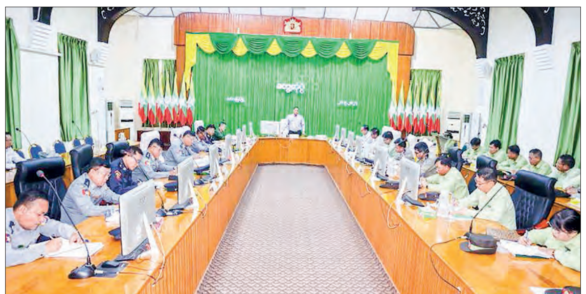
Union Minister for Home Affairs Lt-Gen Yar Pyae meets the Mon State departmental personnel in Mawlamyine yesterday.

They then checked the cooking processes in the compound of Alinn Taik Library in Hlakamyin Kwatthit and greeted the students and locals who