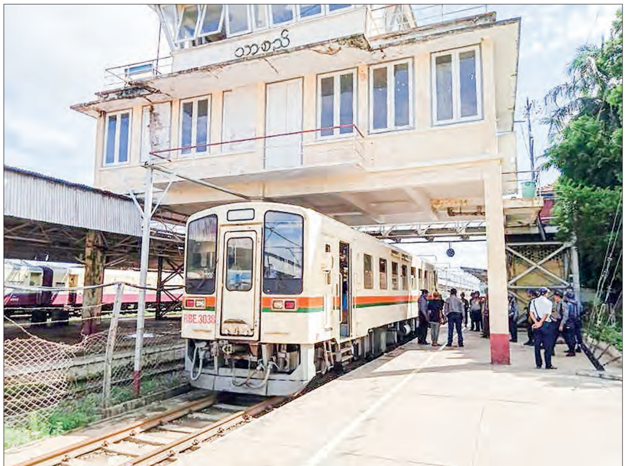
The No 12 Thazi-Yangon Down train prepares to depart from Thazi Railway Station to Yangon.

The Ministry of Transport and Communications