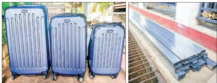
Confiscated illegal goods in states and regions.

On 18 and 19 September, 20 cases were recorded, amounting to an estimated value of K618.389 million, according to the Illegal Trade Eradication Steering Committee. — MNA/KZL