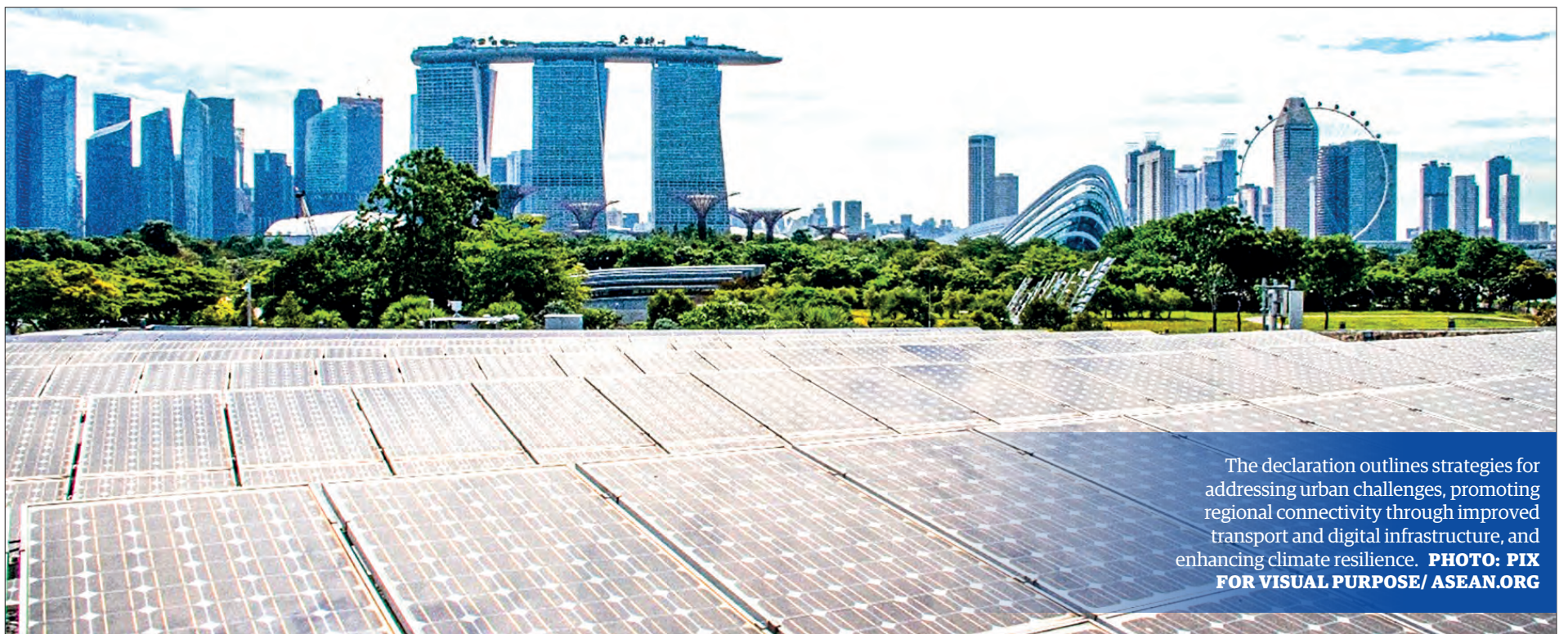
The declaration outlines strategies for addressing urban challenges, promoting regional connectivity through improved transport and digital infrastructure, and enhancing climate resilience.