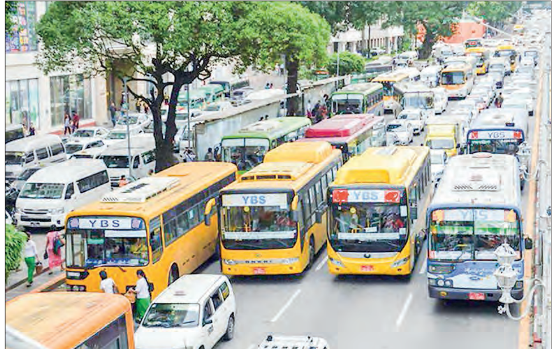
This photo showcases YBS buses running in downtown Yangon in 2023.

THE Yangon Region Public Transport Committee (YRTC) has decided to include another action, revoking the driver's licence issued by the Road Transport Administration Department for a certain period, in addition to YBS driver smart card cancellation for traffic rule violations.