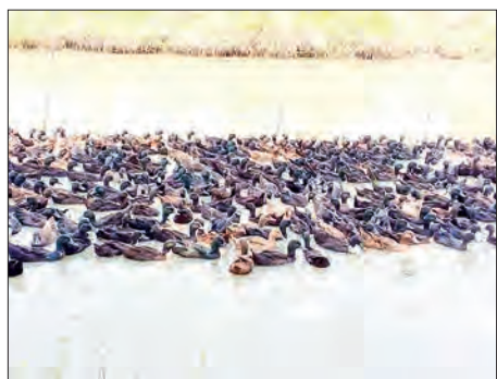
This image shows a flock of ducks at the farm.

The LBVD is selling Day Old Ducklings raising for eggs at fairer rates. Those ducklings are produced from incubation machines owned by the department with the aim of enhancing duck farming businesses. The institutions and those individuals need to make pre-orders one month in advance through the contact numbers of Dr Ye Nanda (farm in-charge) Ph: 09 401617035, 067 3408175, 067 3408020 and Dr Thein Zaw (Phayagyi duck farm in charge) (09 43043152) and U Naing Win Soe (Shwemyo) (09 794926509). — NN/KK