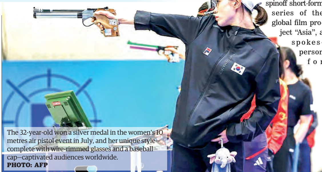
The 32-year-old won a silver medal in the women's 10 metres air pistol event in July, and her unique style—complete with wire-rimmed glasses and a baseball cap—captivated audiences worldwide.

tion movie. No acting required!" Musk wrote on his social media platform X at the time.