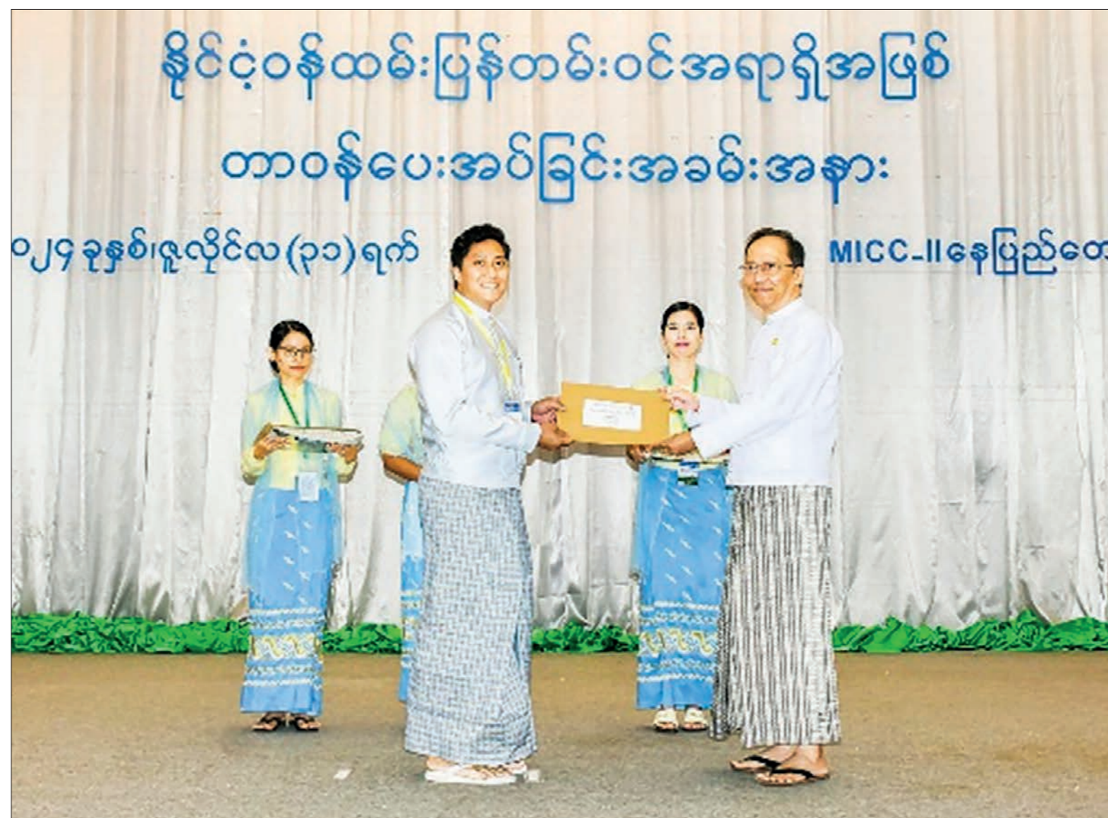
Commissioning ceremony for State civil servant doctors on 31 July 2024, attended by Union Health Minister Dr Thet Khaing Win.

established, allowing public hospitals to resume operations within a short period. The Ministry of Health also established hospital management committees and support committees at each hospital to streamline healthcare services and enhance hospital efficiency. Furthermore, public hospitals have ensured 24-hour emergency care while minimizing the costs of essential medica-