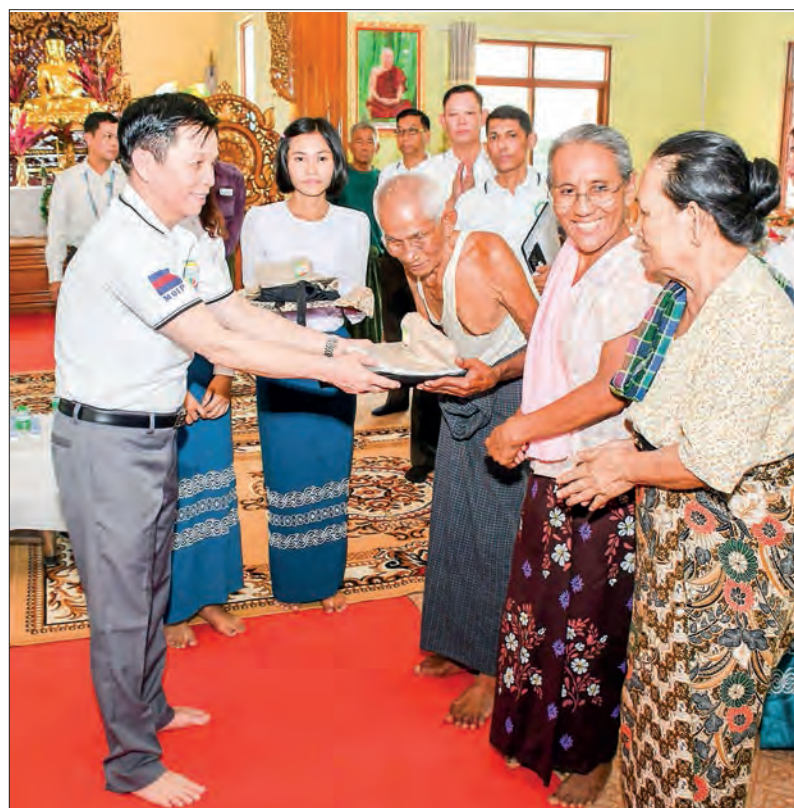
Union Minister U Maung Maung Ohn (L) and Union Minister U Myint Kyaing (R) present relief donations to flood-impacted elderly people yesterday.

at Chanmyae Myaing Yeiktha. They paid homage to Patron Sayadaw Bhaddanta Sihanyana and donated offerings.