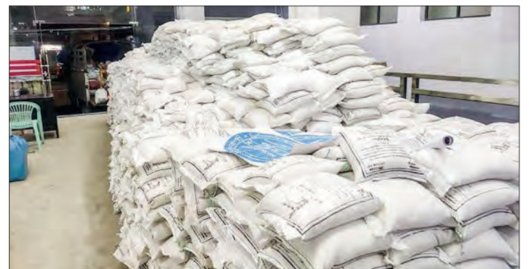
This photo shows foodstuffs being donated by the All-Myanmar Islamic Religious Organization.