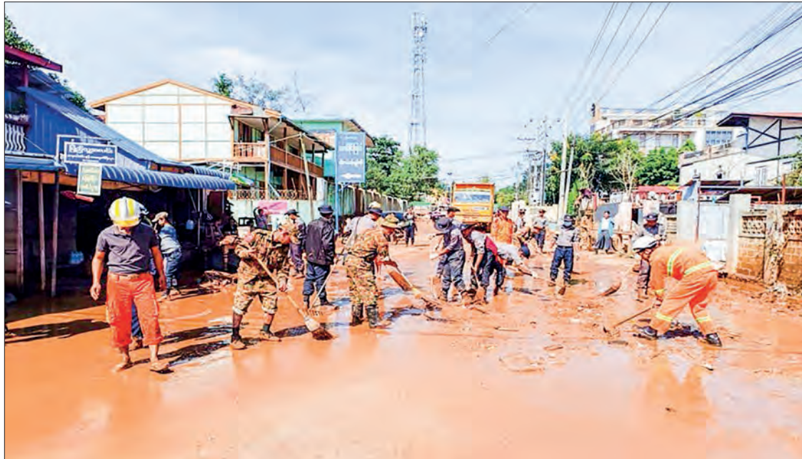
Tatmadaw members, police, firefighters, Red Cross volunteers, and locals are actively engaged in cleanup efforts.

are actively providing medical care and conducting health awareness sessions in temporary shelters, monasteries, and villages. Military person-