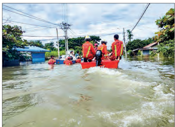
S&R operations are underway in the flooded areas.

Myanma Railways is making efforts to reopen the Thazi-Mandalay railway as rapidly as possible, and train operations from Yangon to Mandalay will restart in the not-distant future. — MNA/KTZH