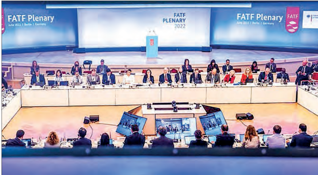
In this file photo taken on 30 June 2022, Financial Action Task Force (FATF) officials are seen on the fourth day of the plenary session in Berlin, Germany.