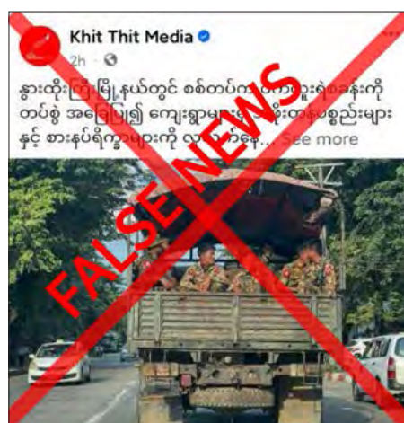
This screenshot reveals misinformation.

Fake news was reportedly circulated through malicious media, defaming security forces. — MNA/KTZH