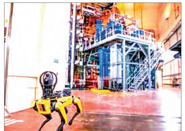
The United Kingdom has made history by becoming the first country to deploy an autonomous robot for inspecting a fusion power complex. UKAEA's Joint European Torus (JET) facility.

The four-legged robot was tested at the decommissioned Joint European Torus (JET) facility, which was one of the largest experimental fusion reactors in the world, the statement read, adding that the robot had to map the facility and take sensor readings of its environment, while avoiding obstacles and employees. The experiment shows that autonomous technologies can be used to maintain fusion power facilities where human access can be limited due to challenging conditions involving radiation, vacuum-level pressure and extreme temperatures, the statement said. — AFP