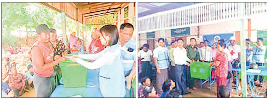
Photos reveal officials from the Ministry of Social Welfare, Relief and Resettlement and the Department of Disaster Management assisting flood victims in Nay Pyi Taw Union Territory.

AS a result of the flood that occurred on 11 September, aid and relief materials were provided to the flood-hit people in Pobbathiri Township, Zeyathiri District in Nay Pyi Taw Union Territory on 18 September.