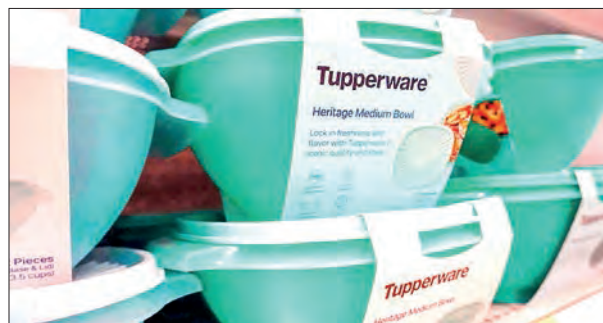
Tupperware has been hit by dwindling sales in recent years.

to seek court approval for a sale process to protect its brand and advance its transformation into a digital-first business while continuing operations during bankruptcy. Tupperware aims to keep paying employees and suppliers and serve customers with its products. The firm has listed assets of $500 million to $1 billion and liabilities of $1 billion to $10 billion, with 50,000 to 100,000 creditors. — AFP