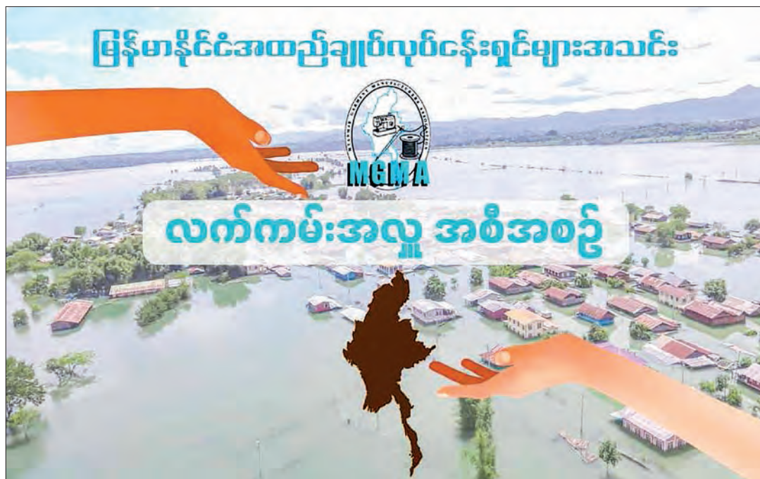
This image showcases MGMA's flood relief donation poster.

Efforts to repair flood-damaged roads and bridges are ongoing. Temporary Bailey bridges have been installed to restore connection as quickly as possible, with more repairs expected to follow swiftly. — MNA/KZL