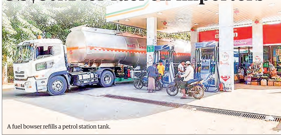
A fuel bowser refills a petrol station tank.

dated 14 August about contribution of $100 million towards the fuel oil sector, it sold over $9.498 million at exchange rate of K3,400 on 15 August, over $89.975 million at exchange rate of K3,410 on 19 August, $31 million at exchange