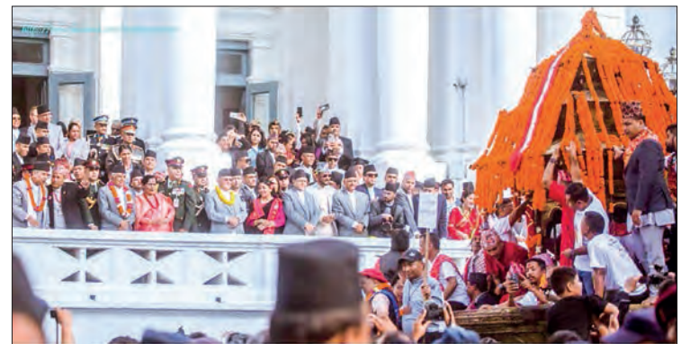
This photo showcases the 'Intra Jatra' Festival. on 18 September.

was attended by Nepal's President Mr Ramchandra Paudel, Vice-President Mr Ram Sahaya Prasad Yadav, Prime Minister Mr KP Sharma Oli, cabinet members, heads of embassies based in Kathmandu, officials from the Nepali Ministry of Foreign Affairs, and invitees. — ASH/MKKS