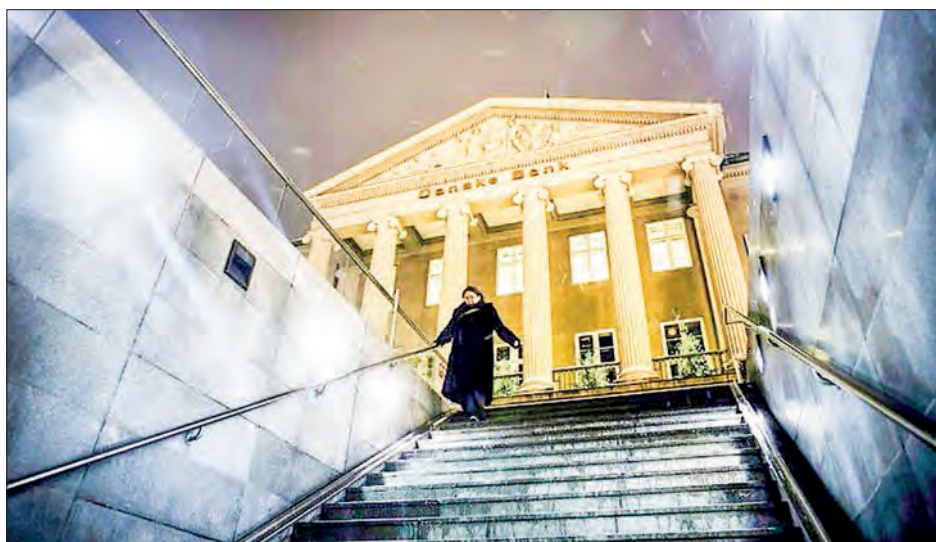
Danske Bank to pay €6.3 million to settle French legal claims linked to money laundering in its Estonian subsidiary.

This settlement, reached on 27 August and confirmed by a court, does not include an admission of guilt.