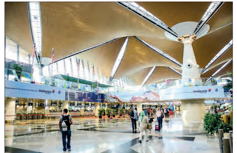
Kuala Lumpur International Airport serves as a key entry point for Malaysia.

Following six months of intelligence gathering, the MACC detained him and others after a failed attempt to flee on 5 September. In total, 49 immigration officers, one policeman, two agents, and eight individuals linked to mule bank accounts have been arrested as part of the ongoing investigation. — AGENCIES