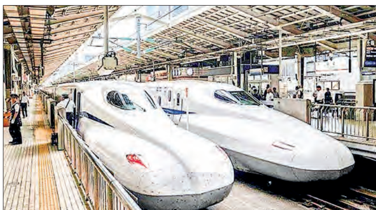
Bullet trains in Japan.

"Through realizing driverless driving and transforming railway management to an efficient and sustainable system, we will adapt to changes in the social environment such as declining population and reforms in ways of how workers work," a company statement said. — AFP