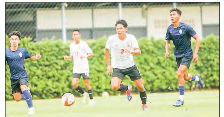
Myanmar U-20 and Cambodian U-20 in action during their friendly match. PHOTO: MFF

They recorded an impressive 5-0 victory over Kasem Bundit University FC, a Thai League III side, followed by a 2-2 draw against Cambodia and a 3-1 defeat to Bahrain U-20. — Ko Nyi Lay/KZL