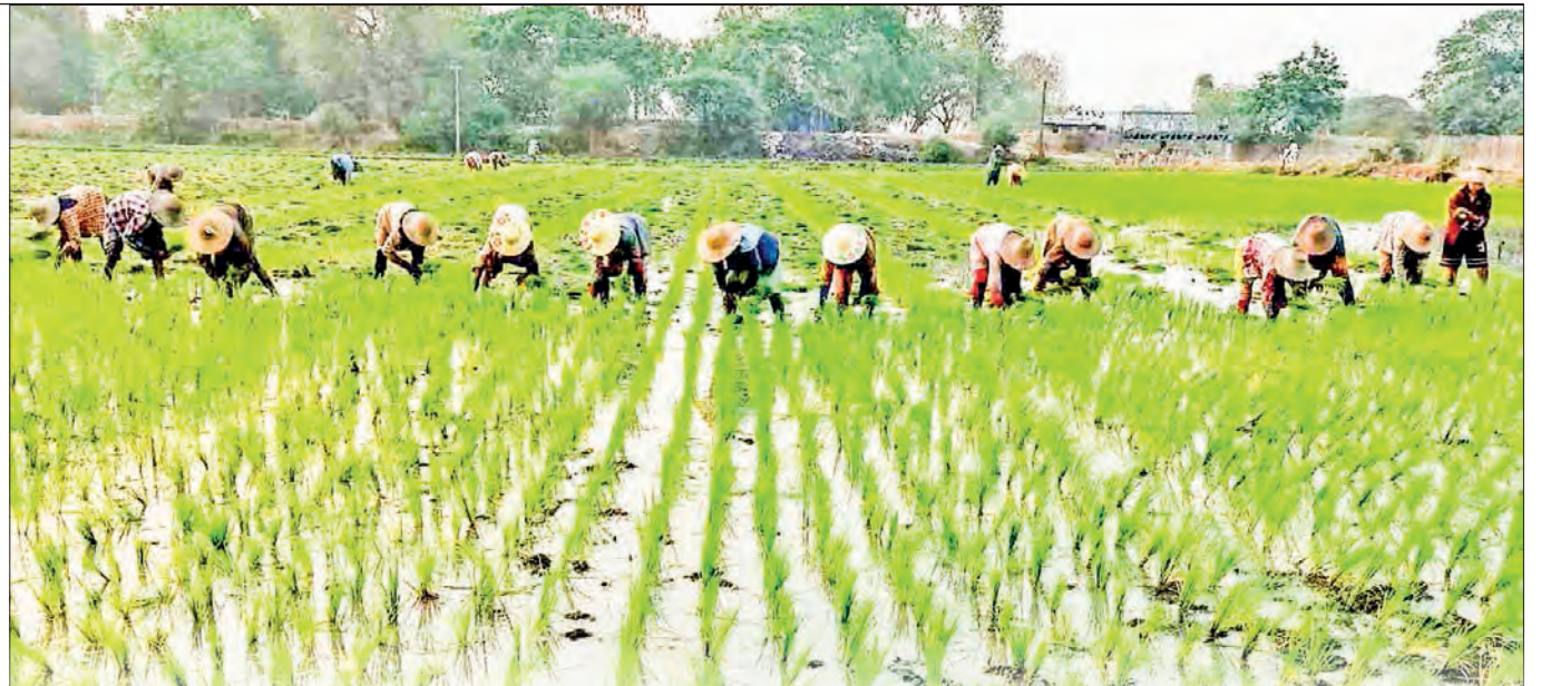
A group of farmers diligently planting paddy in a field.

Myanmar's areca nut market has become widespread. There is competitive pricing in the market. Conical-shaped nuts, rather than round ones, are mostly traded. After baking the soft areca nuts with heat, they are exported to China. Areca palm thrives well in moist soil, yet overwatering and soaking it wet is bad for them. They are commonly found in the Ayeyawady, Bago, and Taninthayi regions, as well as the Mon, Kayin, Kachin, and Rakhine states. — Pyay Phyong Paing (IPRD)/KK