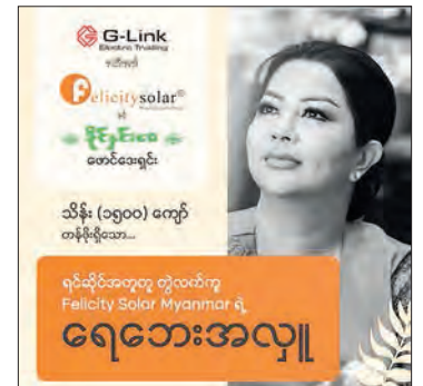
This photo showcases a poster to donate relief supplies and food via the Khaing Hnin Wai Foundation.

“Organized by G-Link Electro Trading, the authorized distributor of Felicity Solar Myanmar, our Khaing Hnin Wai Foundation, in cooperation with other well-wishers, will provide relief supplies and food worth K200 million to flood-affected areas,” said actress Khaing Hnin Wai. Actress Khaing Hnin Wai and the donors are jointly providing relief supplies to areas affected by natural disasters in Myanmar. During the COVID-19