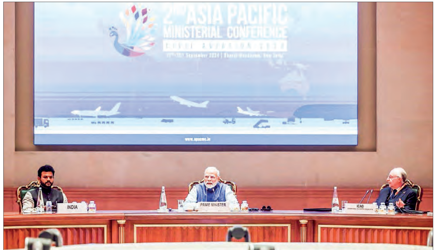
Discussion on the Draft Asia Pacific Ministerial Declaration on Civil Aviation, the establishment of the Pacific Small Island Developing States Liaison Office, and ICAO's 80 th anniversary.

Proposal to create a circuit connecting holy sites related to Lord Buddha to boost regional connectivity and economic benefits.