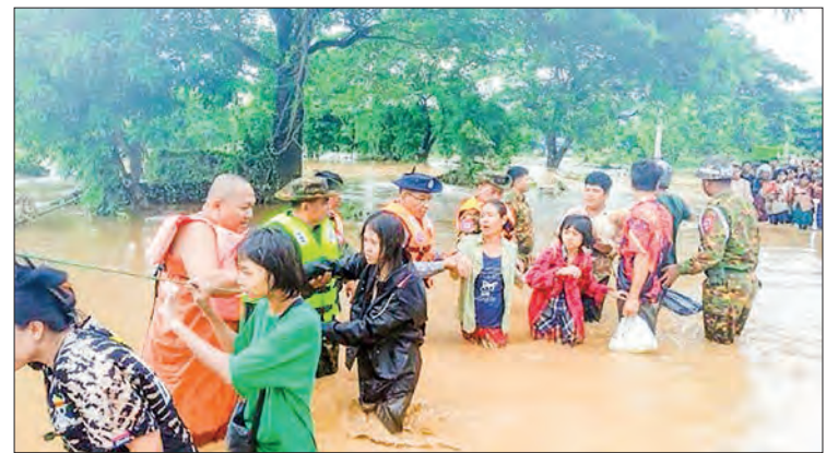
Photos show ongoing rescue and relief efforts for the flood victims in the Nay Pyi Taw Council Area, states and regions.

FLOODING occurs due to continuous heavy rainfall in the Nay Pyi Taw Council Area and several states and regions, causing rivers and streams to overflow.