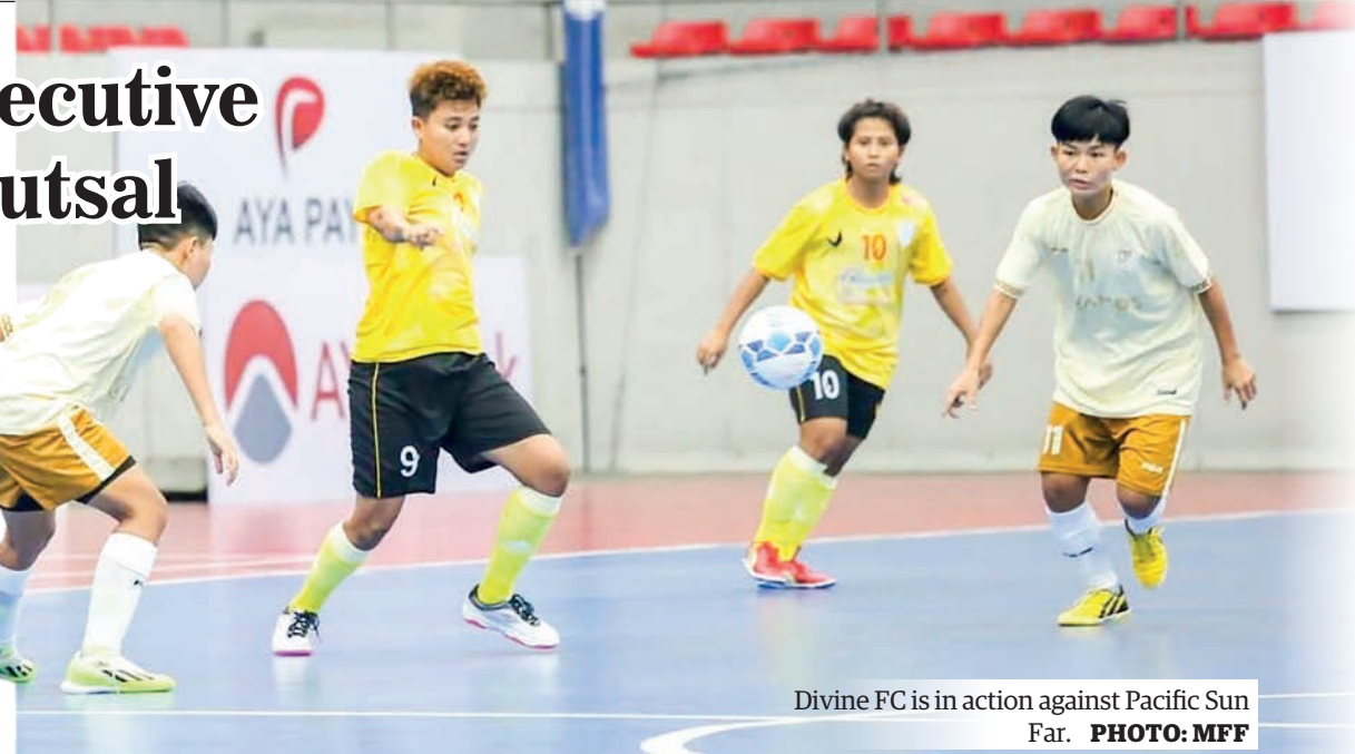
Divine FC is in action against Pacific Sun Far.

The tournament, organized in a round-robin format, will see the top two teams advance to the finals, while the third and fourth-placed teams will compete in the third-place