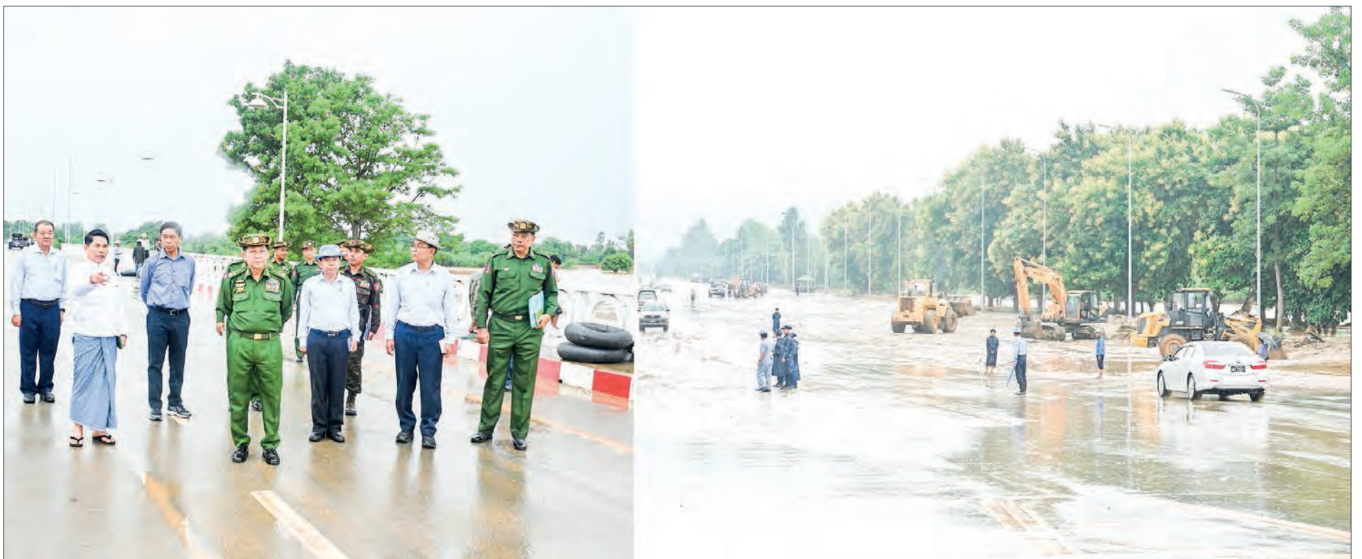
State Administration Council Chairman Commander-in-Chief of Defence Services Senior General Min Aung Hlaing reviews rescue, relief, and rehabilitation efforts in Nay Pyi Taw Council Area yesterday, while Union Minister for Construction U Myo Thant and officials are reporting on the ongoing repair work.

(Excerpt from guidance given by Chairman of the State Administration Council Prime Minister Senior General Min Aung Hlaing to Shan State cabinet members and state-level departmental officials on 3 September 2024)