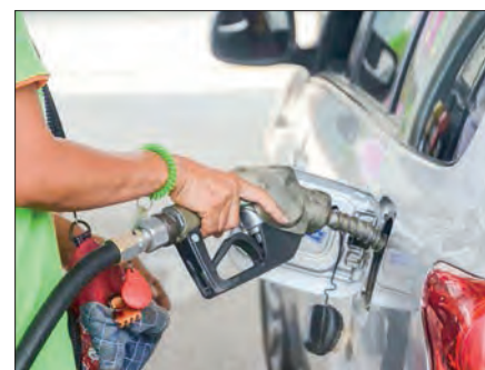
A vendor refuel the car at the Yangon petrol station.

Following CBM's notification dated 14 August about the contribution of $100 million towards the fuel oil sector, it sold over $9.498 million at an exchange rate of K3,400 on 15 August, over $89.975 million at an exchange rate of K3,410 on 19 August, $31 million at an exchange rate of K3,440 on 22 August, over $35 million at an exchange rate of K3,460 on 26 August and $16.9 million at an exchange rate of K3,472 on 28 August, respectively.