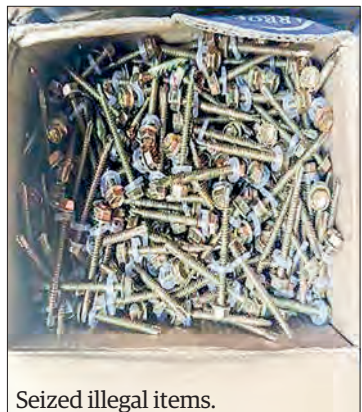
Seized illegal items.

UNDER the supervision of the Illegal Trade Eradication Steering Committee, operations are being conducted to effectively curb illegal trade in accordance with the law.