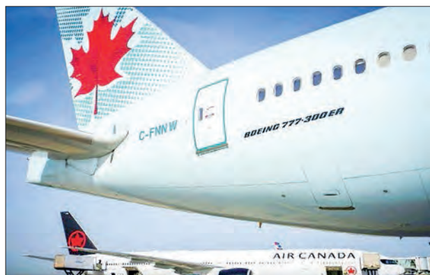
Air Canada said it was preparing to suspend most of its flights starting next Sunday.

GROUPS representing more than 200,000 businesses across Canada on Thursday urged the government to intervene to block a looming pilot's strike at flagship carrier Air Canada that they say risks devastating the economy. The Canadian Chamber of Commerce, the Business Council of Canada and nearly 100 other associations in a letter to the fed-