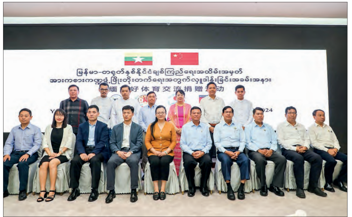
The commemorative group photo of the handover ceremony for China's donation to develop Myanmar's sports sector yesterday in Yangon.

Later in the day, Union Minister U Min Thein Zan, accompanied by Yangon Region Minister for Social Affairs U