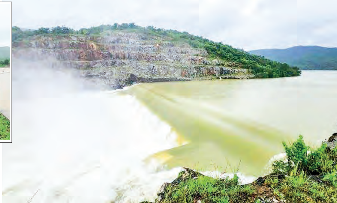
This photo shows the Mezali Diversion Weir on 12 September 2024.

MISINFORMATION is circulating that large dams were drained during the flash flood period, but this is not true. An experienced engineer has stated that spreading such misinformation can cause public panic and should be avoided.