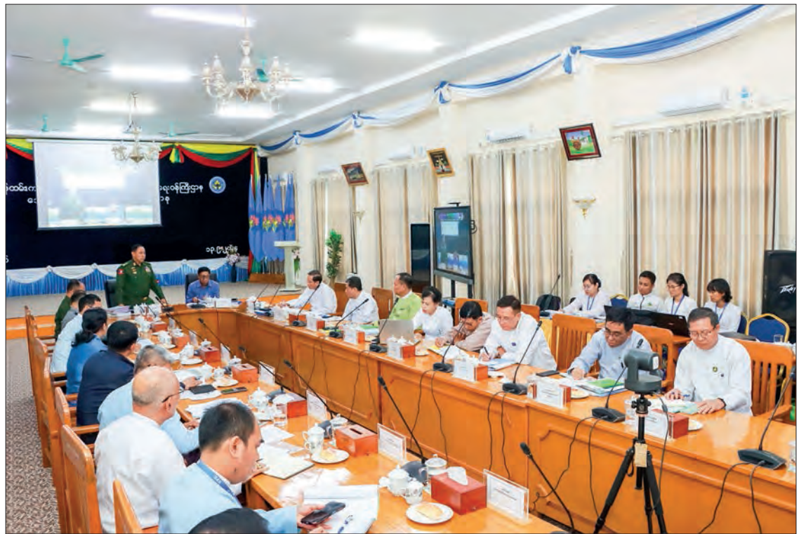
The work coordination meeting of the National Disaster Management Committee is in progress yesterday in Nay Pyi Taw.

phoon Yagi in the South China Sea in September 2024 and due to the force of the low pressure associated with the Bay of Bengal and some regions and states, there have been damages because of flash floods. When flood victims occurred, search and rescue teams, Tatmadaw member, members of the Myanmar Police Force, and volunteers also tried to carry out rescue operations. Restoration of infrastructure damage to homes, roads, and bridges, as well as rehabilitation of livelihood activities, must also be carried out. To assist the requirements for flood victims, presenting sector-specific damage to higher levels in a timely manner, in order to effectively carry out guidance and implementation, he said that he would like the ministries and relevant work committees to discuss their plans.