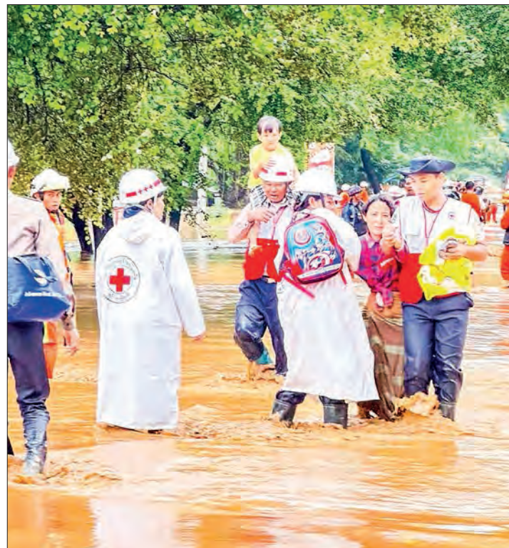
The Nay Pyi Taw local Red Cross team provides first aid and flood evacuation to victims.

rescue teams are working tirelessly to ensure the safety of those affected.