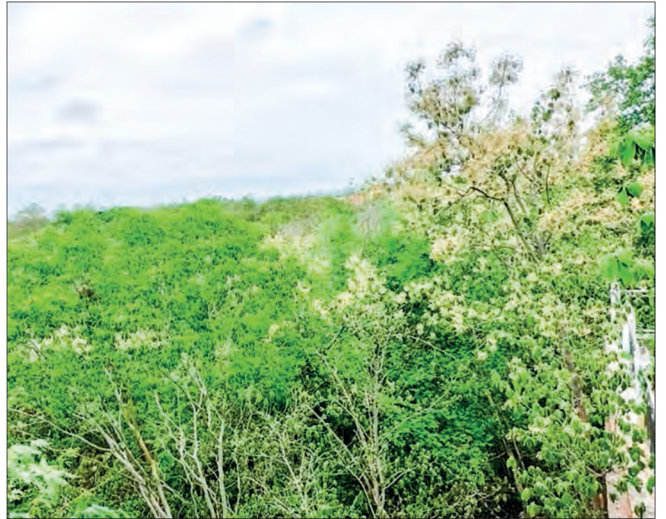
A general view of the Shwesandaw Protected Public Forest.

The establishment of the Shwesandaw Protected Public Forest is expected to safeguard valuable tropical timber species in the area. Additionally, it will help protect the habitats of wildlife such as barking deer, Columbidae, wild cats, quail, and rabbits. Moreover, it will support efforts to combat land degradation, prevent soil erosion caused by water and wind, promote soil conservation, enhance groundwater recharge, expand forest cover, and improve the overall ecosystem balance. — MNA/TKO