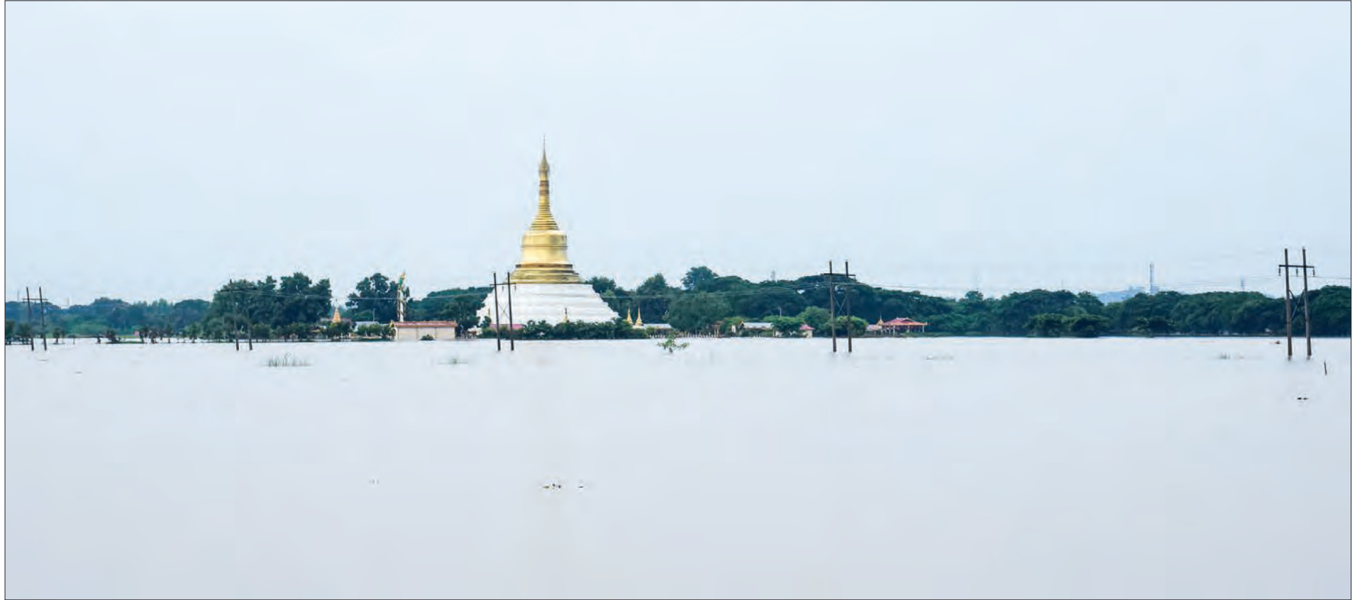
This photo shows the flooding around the Nayaungpya Pagoda during the inspection tour by SAC Chairman Commander-in-Chief of Defence Services Senior General Min Aung Hlaing in Nay Pyi Taw Council Area yesterday.

H EAVY rains have been scattering across Myanmar due to impacts of Typhoon Yagi from the South China Sea and a depression from the western central and north-west of the Bay of Bengal since 10 September. Subsequently, water levels at creeks and rivers are rising, causing flash floods in some townships of Nay Pyi Taw Council Area and some regions and states.