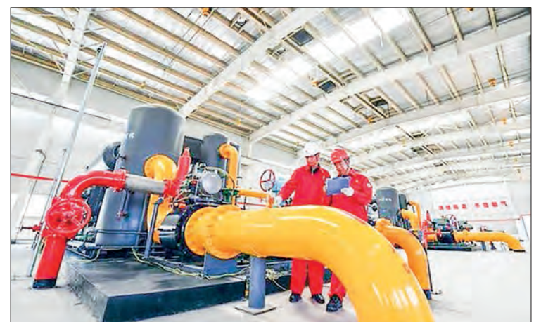
This photo taken on 25 June 2022 shows workers checking equipment at the workshop of a coalbed methane mining base in Qinshui County, north China's Shanxi Province.

In the currency markets, the Indian rupee traded with a slight negative bias, primarily due to the strength of the US dollar and a rebound in global crude oil prices. — ANI