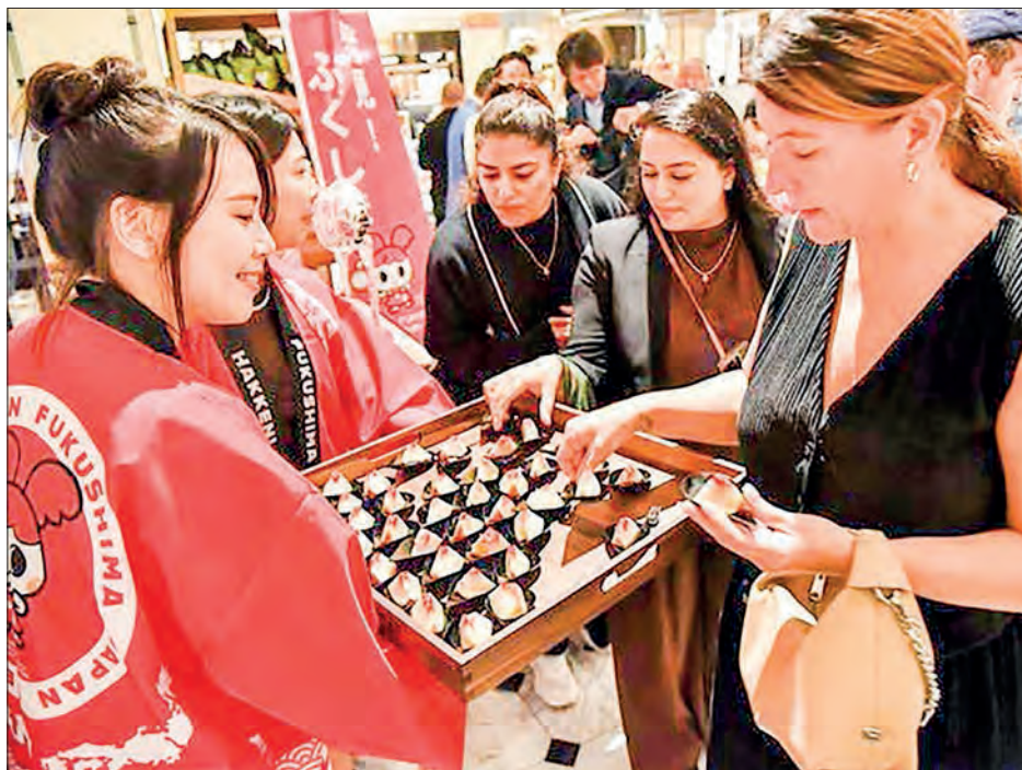
A customer (R) trying peaches from Japan's Fukushima prefecture, which went on sale at luxury department store Harrods in central London. PHOTO: AFP

And before being sent to stores, all farm and fishery products from the northeastern Japanese prefecture now undergoes strict radiation inspection. Harrods began selling the peaches on Saturday, part of a reputation-building initiative by Tokyo Electric Power Company (TEPCO), the operator of the Fukushima plant. — AFP