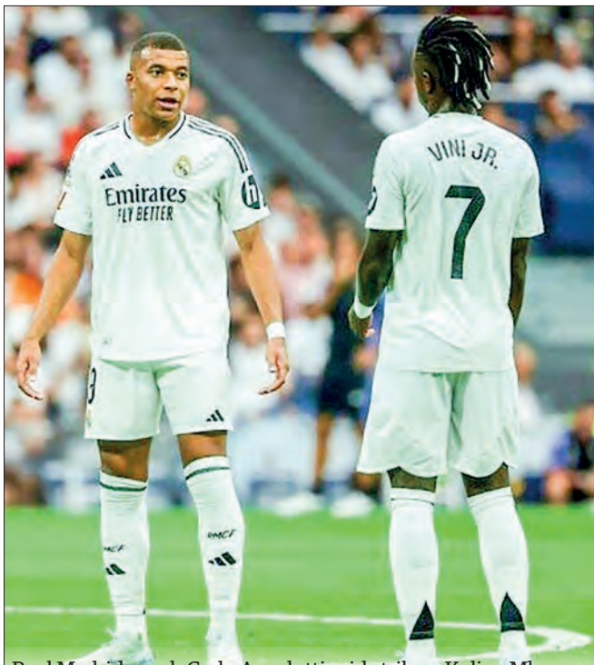
Real Madrid coach Carlo Ancelotti said strikers Kylian Mbappe (L) and Vinicius Junior (R) are "training well, happy" after an underwhelming start to the season.

"Many forget they started pre-season in the