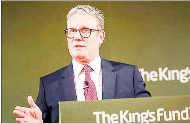
Prime Minister Keir Starmer delivers a speech in central London on 12 September 2024 following a report into the condition of the state-run National Health Service (NHS).

The 142-page report, authored by Lord Ara Darzi, highlighted the NHS's deterioration over 15 years due to insufficient investment, reorganization issues, and the impact of the coronavirus pandemic.