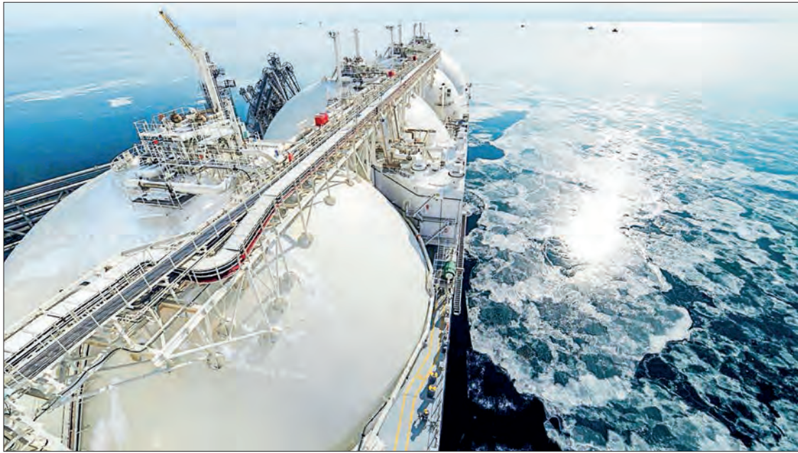
The liquefied natural gas tanker Grand Aniva at the mooring of the first LNG plant in Russia (the Sakhalin-2 project), built by Sakhalin Energy Investment Ltd in the village of Prigorodnoye in southern Sakhalin.

South Korea purchased 1.2 million tonnes of Russian LNG worth $711 million in the first seven months of 2024, up from 953,000 tonnes worth $657 million in the same period of 2023.