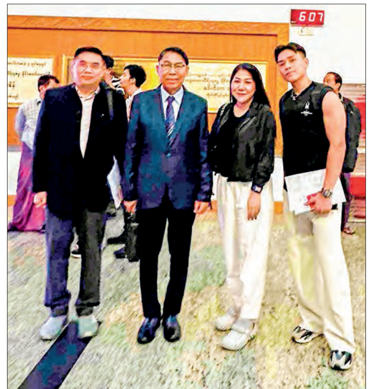
Myanmar's realty delegates are seen before leaving for Malaysia.

BCI-Thai networking event, held at the Amari Hotel in Bangkok from 30 to 31 August 2024.