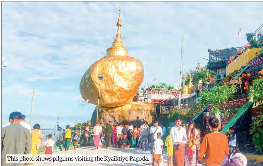
This photo shows pilgrims visiting the Kyaiktiyo Pagoda.