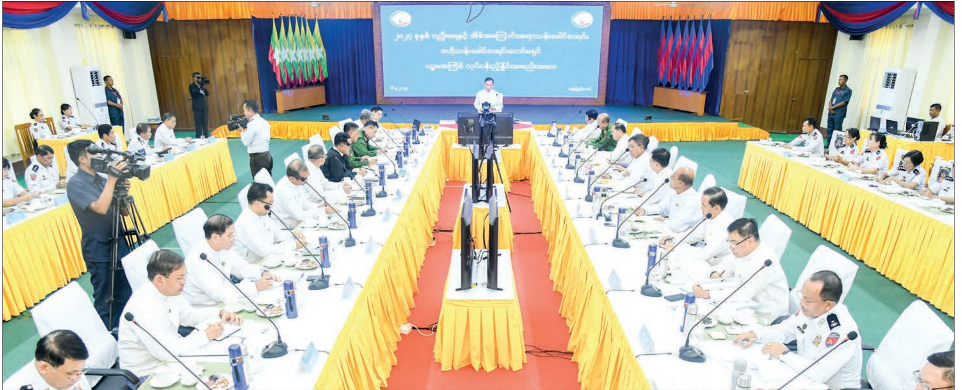
State Administration Council Vice-Chairman Deputy Prime Minister Vice-Senior General Soe Win addresses the fifth coordination meeting of the Central Census Commission yesterday.

Salient points from the speech delivered by Vice-Senior General Soe Win at the fifth coordination meeting of the Central Census Commission