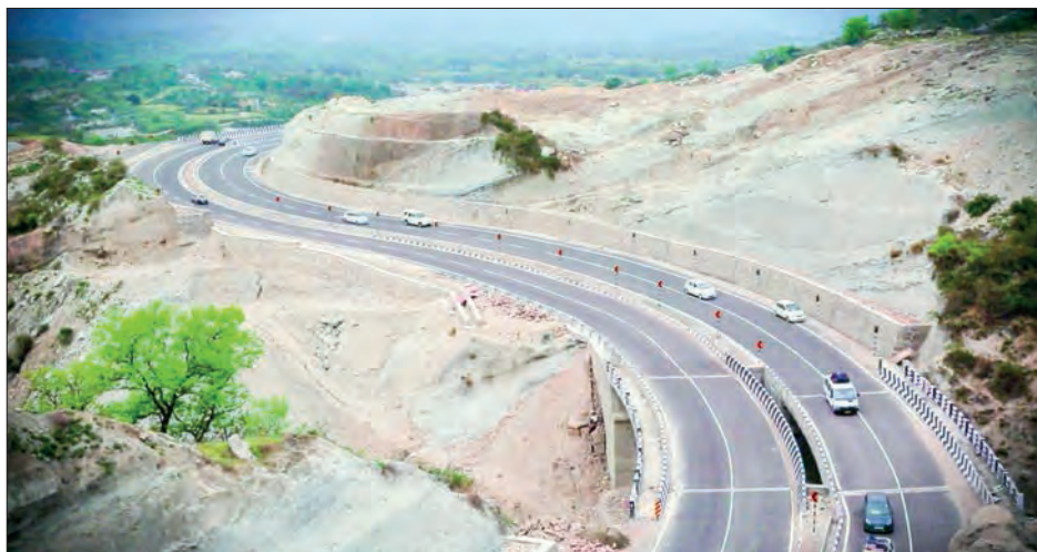
Committee will oversee national highways, transport systems, and renewable energy projects. NH 44 is India's longest north-south highway.

Initiative aims to channel sustainable infrastructure investments.