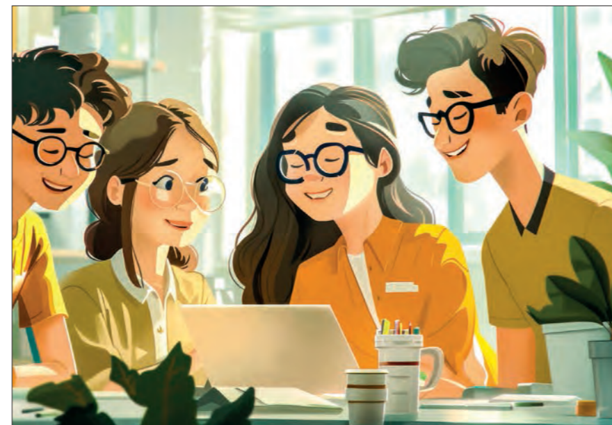
A digital art illustrates the nature of happy coworkers in teamwork at a workplace.

However, they see these procedures as a waste of time and money. Therefore, they rely on illegal employment agencies to go abroad through illicit routes. Unfortunately, most of them