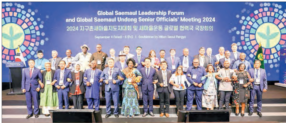
Senior officials pose for the group documentary photo at the Global Saemaul Leadership Forum and Global Saemaul Undong Senior Officials' Meeting 2024.