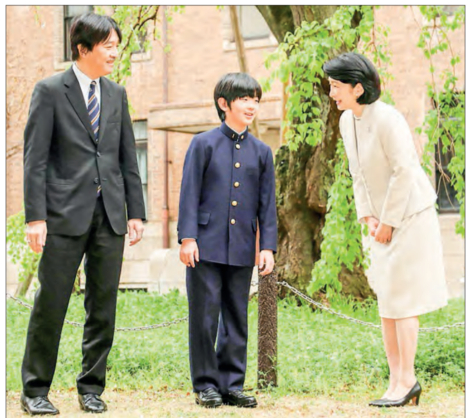
Prince Hisahito (C) is pictured with his parents, Prince Fumihito and Princess Kiko, in this file photo in April 2019 upon his enrolment at a junior high school affiliated with Ochanomizu University in Tokyo.

His Coming-of-Age Ceremony, typically marked by a press conference, will be postponed until spring 2025 or later to avoid disrupting his studies. Hisahito will be the first member of the Japanese imperial family to come of age under the