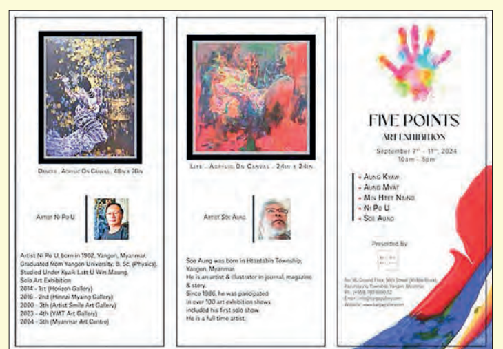
Some paintings from the exhibition are seen in the catalogue of 'Five Points'.

The Ministry of Interior and Safety and Samaeul Undong Centre jointly organized the event. Under the support of KOICA, representatives from 29 countries implementing model village projects, ambassadors, KOICA officials, senior officials and professors attended the forum and meeting. — ASH/KK