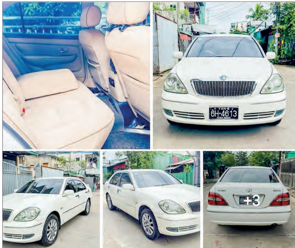
A social media post selling a car worth less than K 100 mln on Thakayta brokers' page on 6 September.