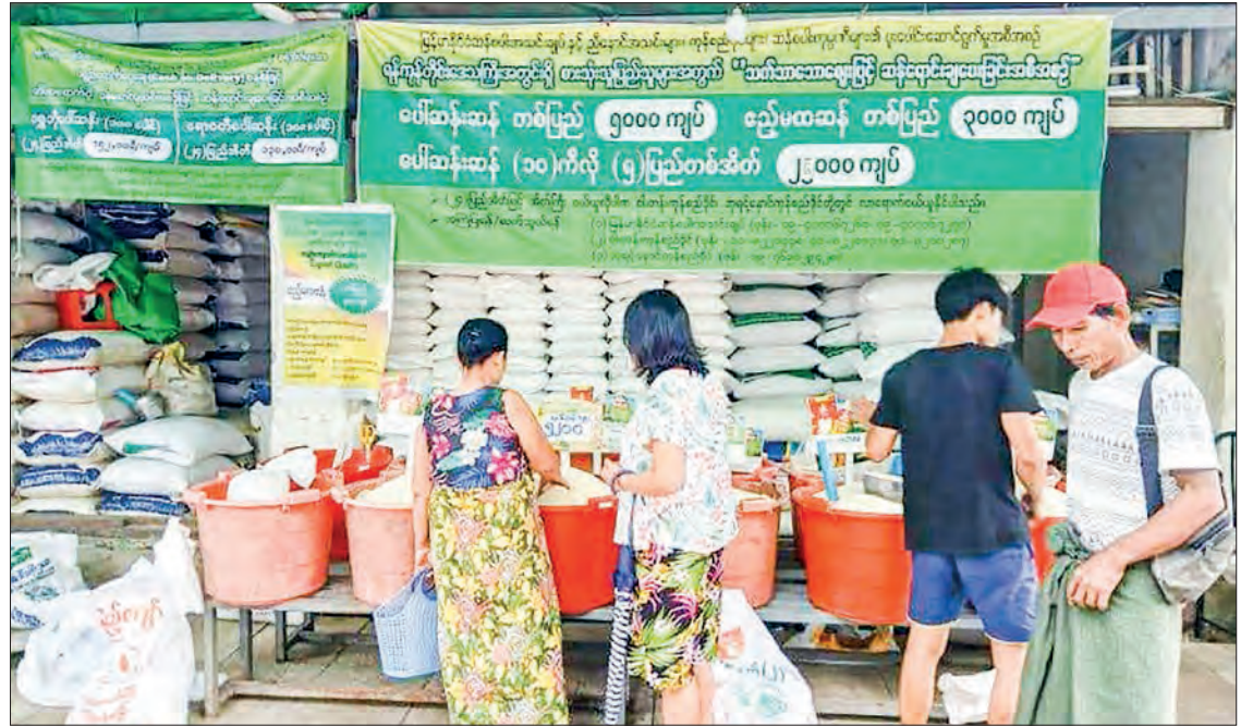
Consumers purchasing various rice varieties at reference prices in Yangon.

The reference prices are set for non-premium rice such as Aemahta, Ngasein, Sinthukha, Yadanatone, Tunpu, Shweman, Hnankauk, Ziyar, Ngwetoe, Min Ayeya, Manawthukha, moderate quality rice such as 90-day short matured rice, Pakan, Anyatha, Magyantaw, Ayamin, Ayeya Padaytha, and premium rice varieties like Kyapyan, Pawkywe, Ayeyawady Pawsan and Shwebo