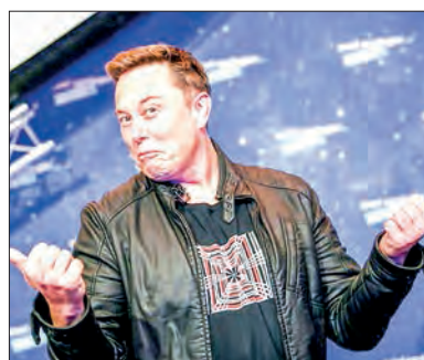
Elon Musk, known for his pioneering work in technology and space exploration, has agreed to lead the new Government Efficiency Commission to address financial inefficiencies in the federal government.

nounced plans to establish a Government Efficiency Commission, following Elon Musk's endorsement and agreement to lead the task force. The commission will conduct a comprehensive audit of the federal government to propose significant reforms. Trump highlighted the problem of improper and fraudulent payments, costing taxpayers hundreds of billions in 2022, and promised the commission will develop a plan to eliminate these payments, potentially saving trillions. — ANI