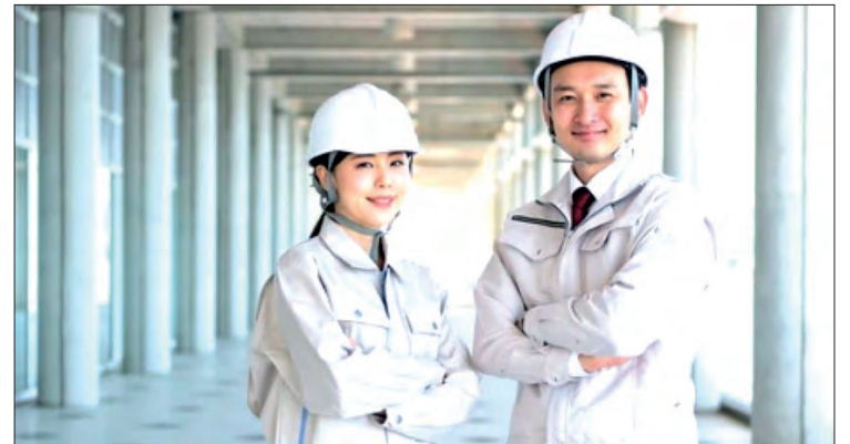
Japan's wages have shown notable improvements recently. In July, real wages edged up by 0.4% year-on-year, marking the second consecutive month of increase.

The upward trend in regular pay continued after Japanese companies agreed to hefty hikes at this year's spring wage negotiations. The average monthly wage increase reached 5.1 per cent, rising over five per cent for the first time in 33 years, according to the Japanese Trade Union Confederation, the country's largest labour federation. — Kyodo