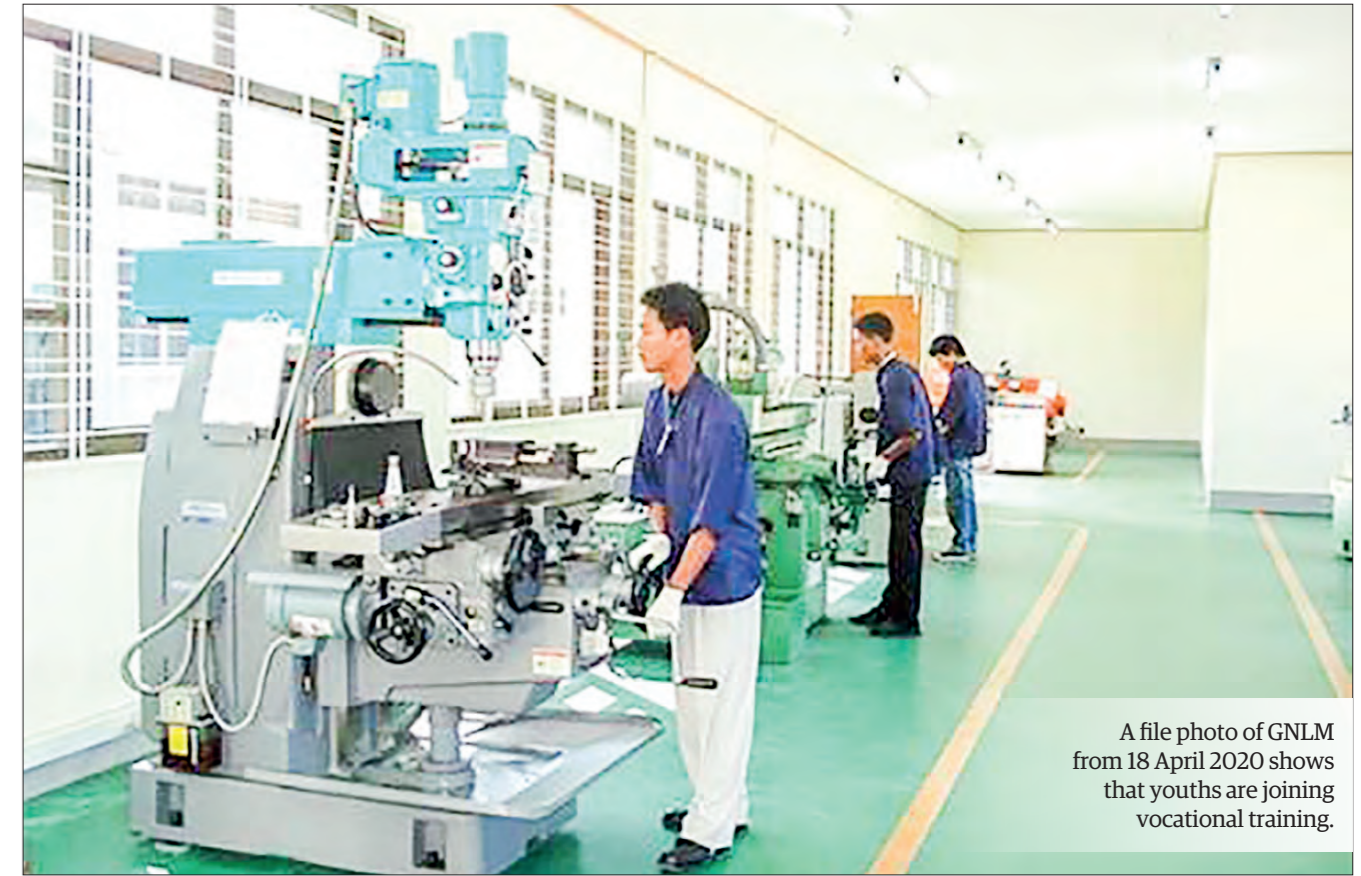
A file photo of GNL from 18 April 2020 shows that youths are joining vocational training.

Generally, youths who have a clear vision of going abroad for jobs must join vocational courses. These vocational