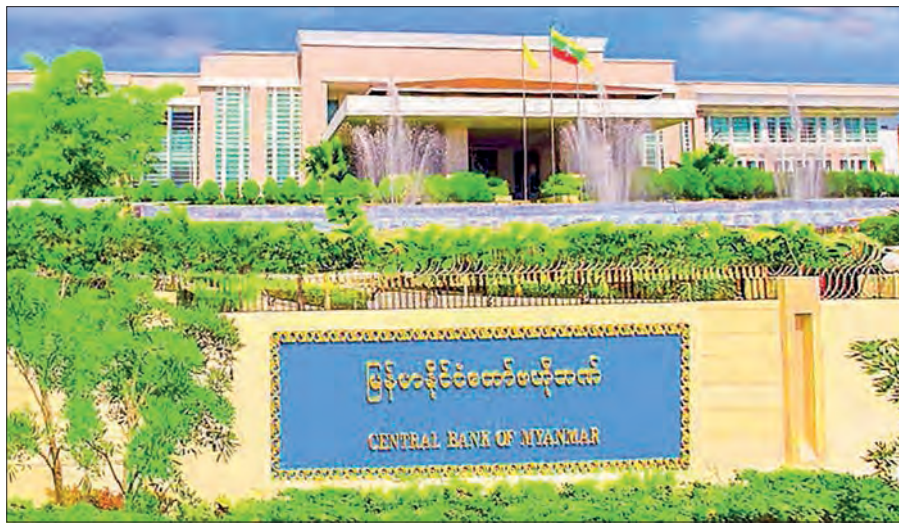
Facade of the Central Bank of Myanmar in Nay Pyi Taw.

CBM sold $5 million and five million yuan for the fuel oil, edible oil and pharmaceutical sectors on 2 August, after selling 69 million baht and nine million yuan for those importing edible oil,