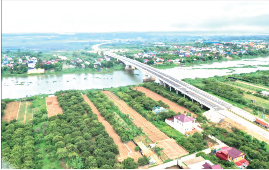
This aerial photo taken on 5 June 2023 shows the Chinese-funded third ring road in Kandal province, Cambodia.