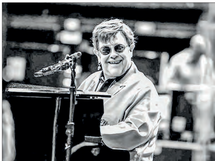
Elton John has shared that he is dealing with partial blindness due to a severe eye infection, describing the recovery as slow and ongoing.

Fashion icon Donatella Versace expressed her sentiments, saying, “Sending you so much love Elton! Feel better soon. Love you.” — ANI