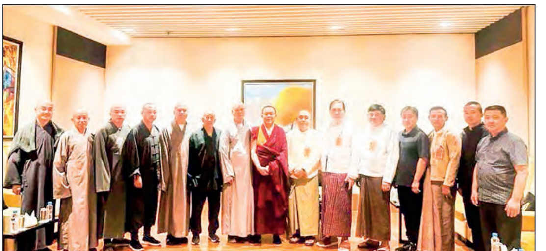
A commemorative group picture taken during the religious visit in Yangon.