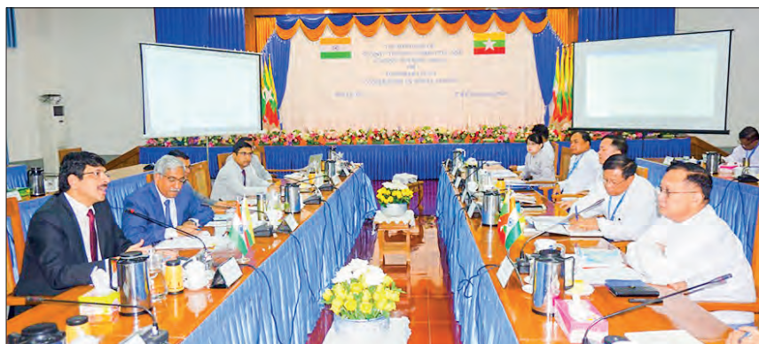
The fifth Myanmar-India Electricity Sector Steering Committee meeting is in progress yesterday in Nay Pyi Taw.

In the meeting, they coordinated and discussed issues of cooperation in the electricity sector.