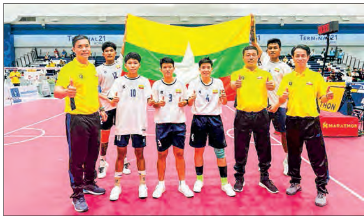
The winning Myanmar Sepak Takraw team.

IN the 37 th King's Cup Sepak Takraw Championship, now being held from 1 to 8 September, the Myanmar team secured another gold medal.