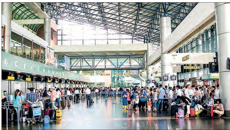
Check-in area at Noi Bai Int'l Airport, Hanoi, Vietnam.

Ten localities forecast to be directly hit by the typhoon in the north, including Hanoi, Hai Phong, Thai Binh, Ha Nam, will shut schools on Saturday for 5.6 million