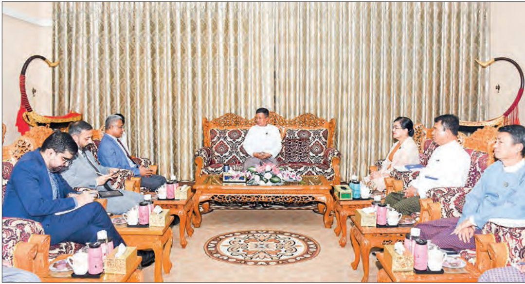
Indian Ambassador Mr Abhay Thakur calls on Union Minister U Tin Oo Lwin yesterday in Nay Pyi Taw.

UNION Minister for Religious Affairs and Culture U Tin Oo Lwin received Mr Abhay Thakur, Indian Ambassador to Myanmar, in Nay Pyi Taw yesterday afternoon.