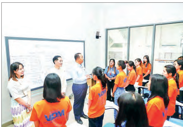
Union Minister U Myint Naung (4R) is pictured visiting VDM Co Ltd and inspecting Myanmar workers set to work in Thailand.

The Central Bank of Myanmar amended the CBM interest rate, interest on savings paid by the banks and interest rate on loans up to 8-12.5 per cent per annum in a bid to reduce inflation and let private banks offer more loans. — TWA/KK