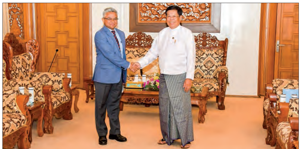
Deputy Prime Minister MoFA Union Minister U Than Swe shakes hands with Indian Ambassador Mr Abhay Thakur during the latter's courtesy call yesterday.