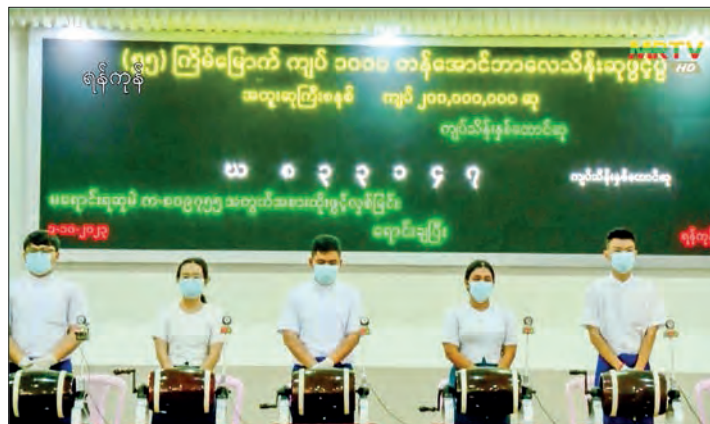
This photo shows the 55 th Aungbarlay Lottery opening event.

THE Aungbarlay Lottery Directorate of the Internal Revenue Department has announced that over 10,000 lot-