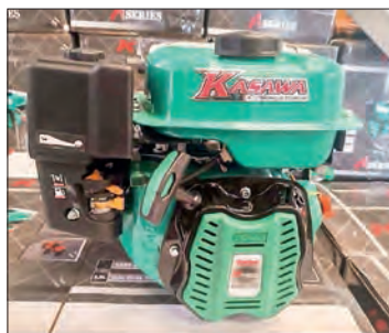
Confiscated illegal item.

UNDER the supervision of the Illegal Trade Eradication Steering Committee, efforts to combat the illicit trade are being effectively carried out in accordance with the law.