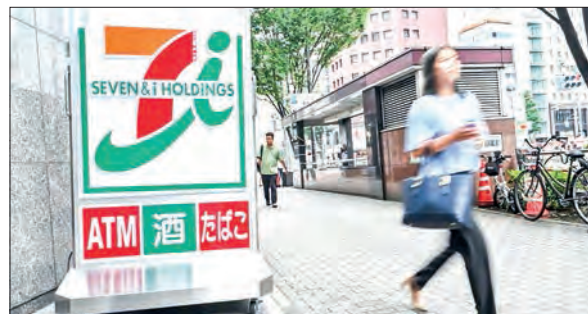
The purchase of Seven & i Holdings would be the biggest ever foreign takeover of a Japanese firm.

ern coastline on Saturday, bringing heavy rain of up to 400 millimetres in volume. — Xinhua