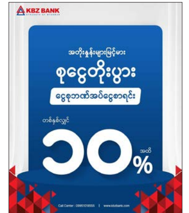
This image shows KBZ Bank's advert, which declares their increased interest rates.

Private banks offer up to 12.5% interest on savings