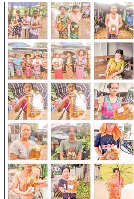
Consumers are seen pleased with their share of edible oil.

The contact numbers are 01 4705566 (15 extension lines), 09 940171222 (15 extension lines) for Taikkyi, Hlegu, Hmawby, Htantabin, Mingaladon, Shwepyitha, Insein, Hlinethaya, Thanlyin, Thongwa, Kyauktan, Kayan, Twantay, Kungyangon, Kawhmu, Seikkyi Kanaungto, Dala, Mayangon, Hlaing and North Okkalapa townships and 09 771002722 (10 extension lines), 01-4706722 (10 extension lines) for Kyauktada, Pabedan, Lanmadaw, Latha, Dagon, Ahlon, Kyimyindine, Sangyoung, Thingangyun, South Okkalapa, Tamway, Yankin, Botahtaung, Dawbon, Mingala