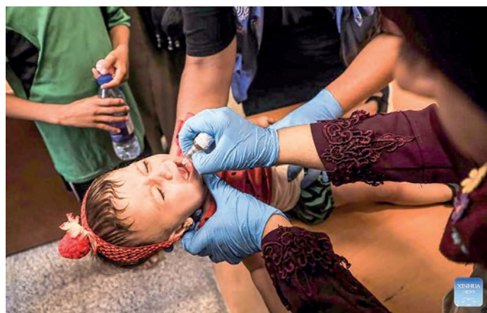
A Palestinian child receives a polio vaccination in Deir al-Balah, central Gaza Strip, 1 September 2024.