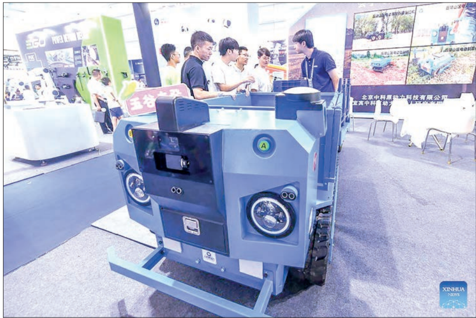
A transport robot is on display during an exhibition of the 2024 World Power Battery Conference in Yibin, southwest China's Sichuan Province, 1 September 2024.

A total of 137 projects with a combined investment of 95.25 billion yuan (about US$13.4 billion) were signed at the 2024 World Power Battery Conference, organizers said Sunday.