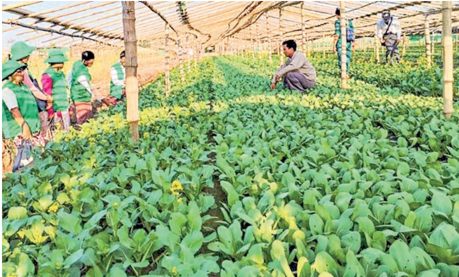
The rainy season vegetable plantations usually commence in late April. It usually takes from 30 days to 90 days, depending on the species of the vegetables. A vegetable plantation in Yangon Region.

YANGON Region regularly grows vegetables to make sure there is no shortage for the public. During this year's rainy season, the region plans to grow a total of 50,000 acres of peanuts, crops and vegetables. Amongst, over 19,197 acres have already been grown in 18 townships, according to the Agriculture Department of Yangon Region.