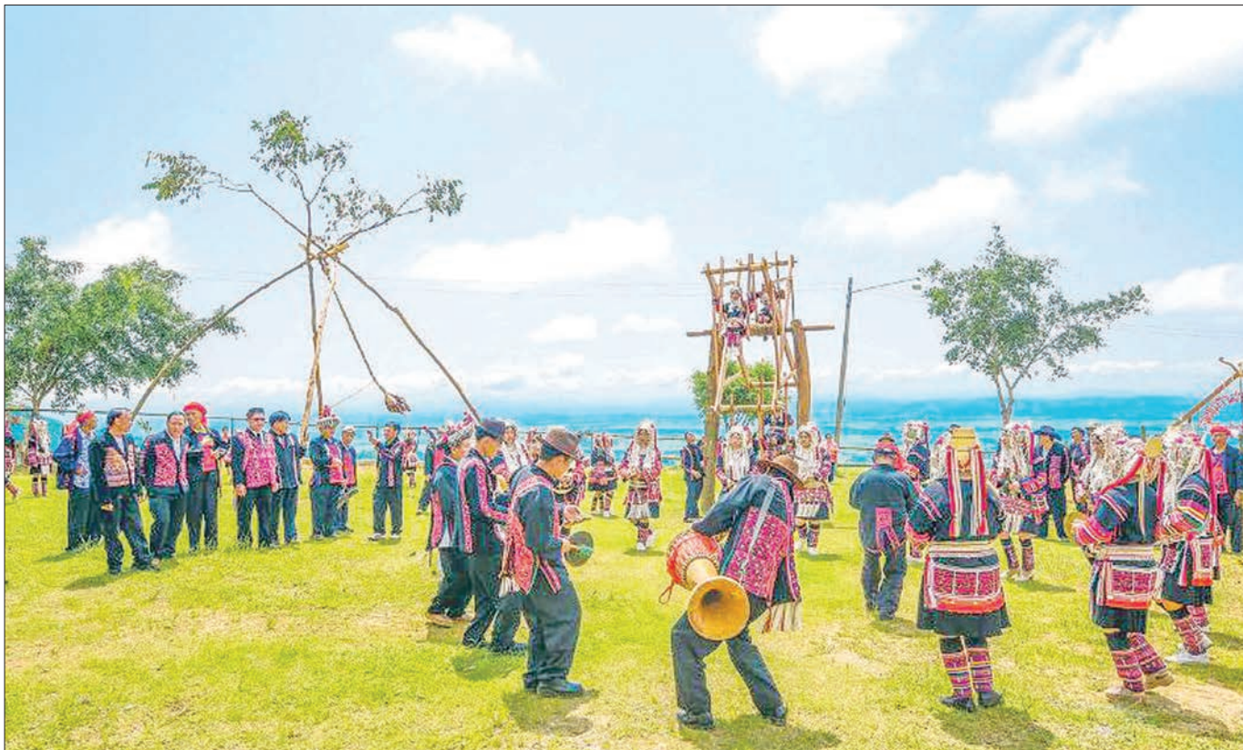
This photo captures the Akha Swing Festival in Kengtung Township, Shan State (East)