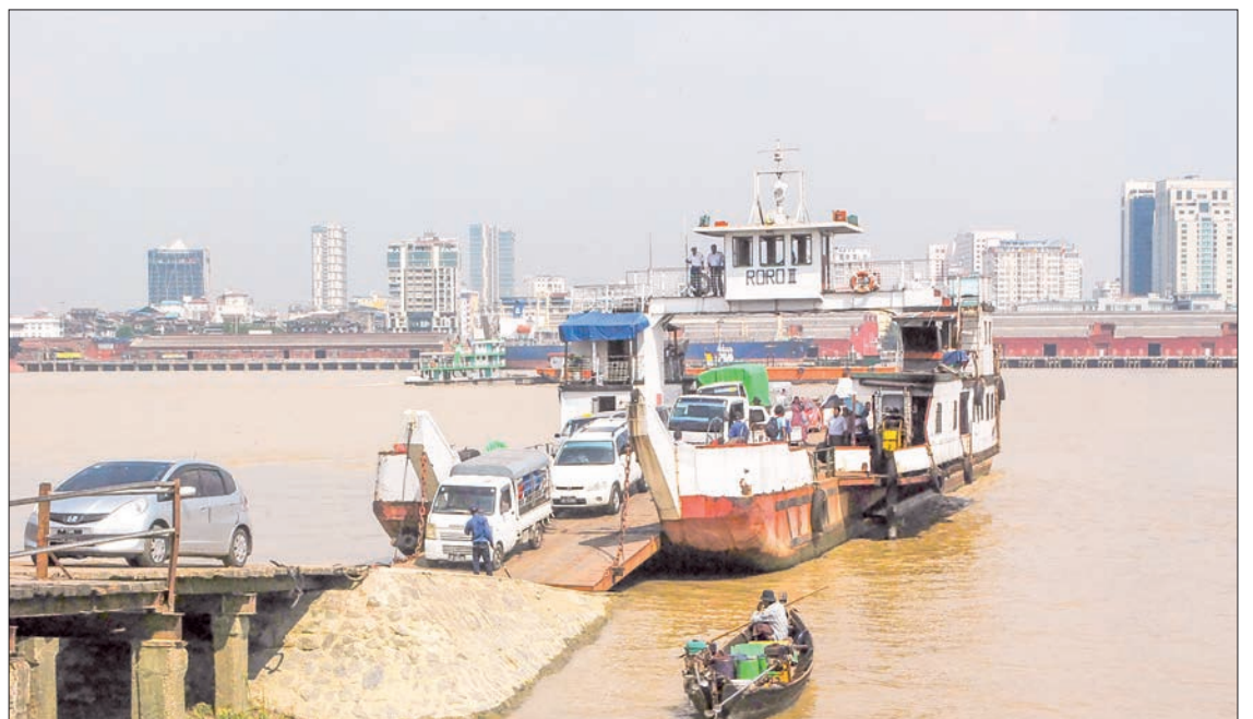
This photo shows the Z-craft running at the Wahdan-Dala port.

and approximately 100 tonnes of goods daily from 7 am to 7 pm," said U Aung Kyaw Oo. — ASH/MKKS