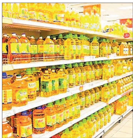
Cooking oil is seen being arranged for sales in the supermarket.

THE wholesale reference rate of palm oil for the Yangon market was set higher at K6,490 per viss this week ending 8 September, which increased from K6,375 recorded last week ending 1 September 2024, according to the Supervisory Committee on edible oil import and distribution.