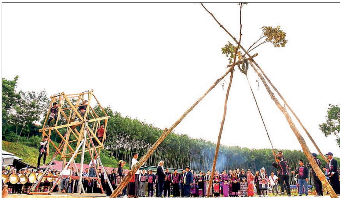
The Swing Festival of the Akha ethnic in action.