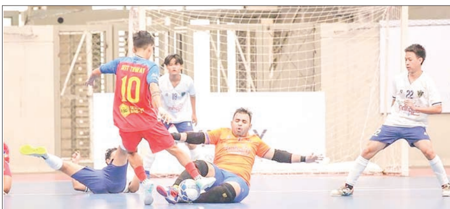
Players of Winner Soccer and M-Million seen in action.

The second-day knockout matches will continue on 3 September. In this regard, defending champion VUC