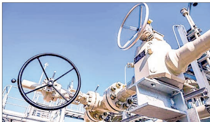
Piping systems and shut-off valves are pictured at the gas receiving station of the Nord Stream Baltic Sea pipeline, in Lubmin, Germany.

IMPORTS of Russian gas by EU countries continue to grow, with its share in the un-