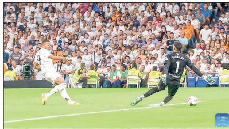
Real Madrid player Kylian Mbappe scores his first goal during La Liga football match between Real Madrid and Real Betis, in Santiago Bernabeu stadium, Madrid, Spain, 1 September 2024.