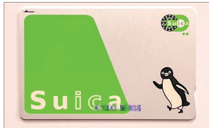
Photo shows one of the "My Suica" travel cards that are again available to buy after a suspension due to chip shortages, in Tokyo on 1 September 2024.

Suica and Pismo cards are owned by JR East and Pismo Co, respectively, and can be purchased for a deposit of 500 yen ($3.40) from train station ticket offices and some ticket machines. If charged with