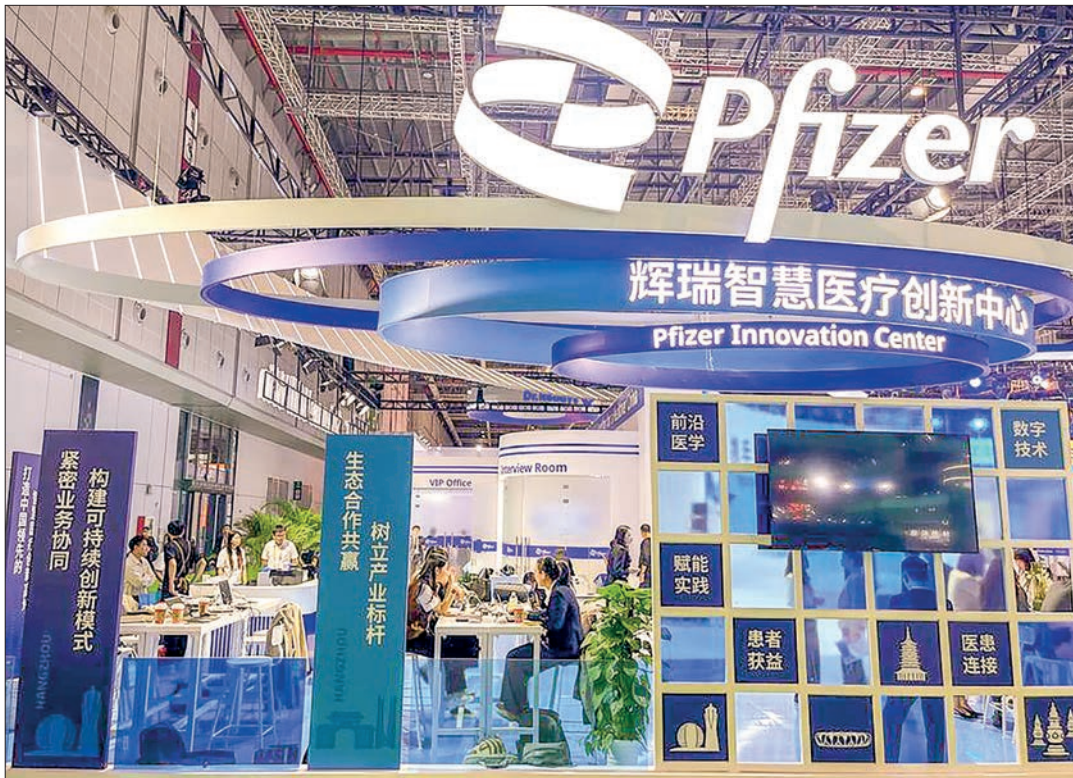
This photo shows the Pfizer booth at the 6 th China International Import Expo (CIIE) in east China's Shanghai, 8 November 2023.