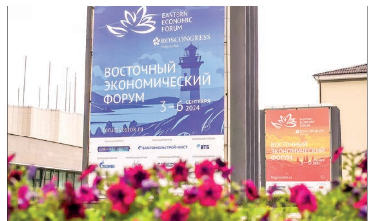
EEF banners are installed on a city street ahead of the 2024 Eastern Economic Forum (EEF), which will be held 3-6 September at the Far Eastern Federal University (FEFU) in Vladivostok, Russia.

"I mentioned Malaysian Prime Minister Anwar Ibrahim as one of the main guests of the forum. [Putin] will hold full-scale negotiations with him on 4 September, including a narrow and expanded format, various issues of Russian-Malaysian cooperation, economic issues, as well as issues of international and regional problems will be discussed," Ushakov told reporters. — SPUTNIK