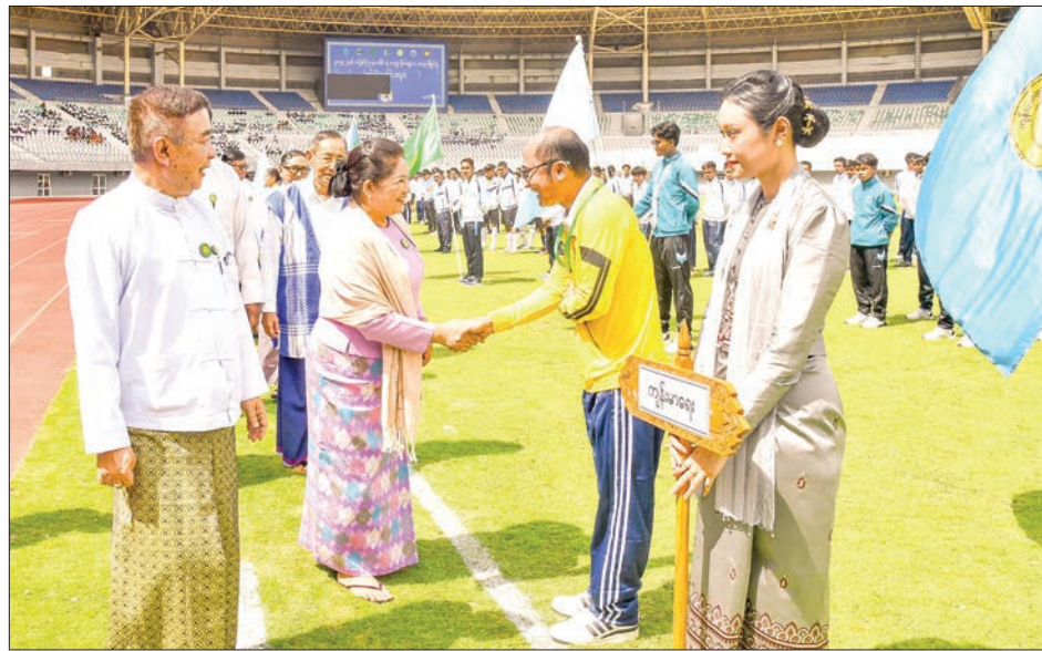
SAC Member Daw Dwe Bu (2 nd L), SAC Members and Union Education Minister Dr Nyunt Pe (L) greet athletes at yesterday's opening in Nay Pyi Taw.

of youths in State development and for the future nation and inaugurated the 2024 Inter-Ministerial Universities' Football Tournament.