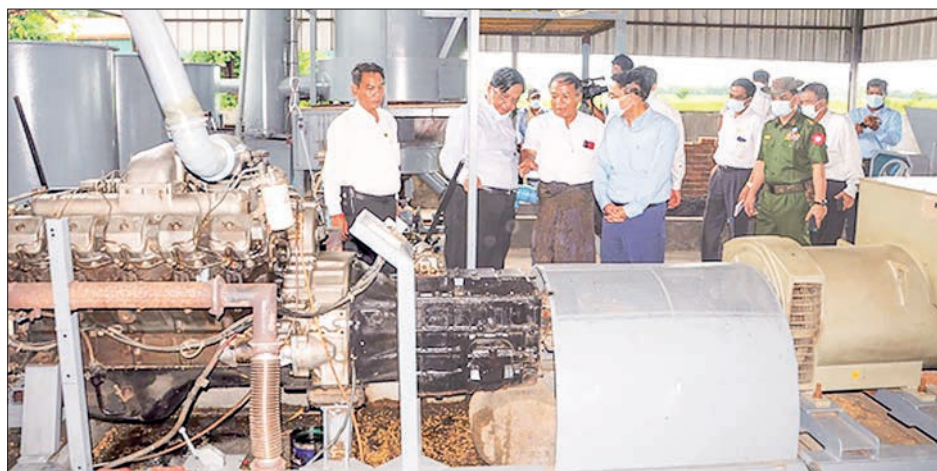
Authorities inspect the rice husk gasifiers.

ACCORDING to the Myanmar Rice Federation (MRF), rice husk gasifiers are being constructed in Bago and Ayeyawady Regions to supply the needed electricity. The report states that 1,391 rice mills in Bago Region and 543 rice mills in Ayeyawady Region are currently constructing these gasifiers. In Ayeyawady Region, rice is milled using gasifiers at 543 rice mills, and electricity is generated from four rice husk steamed boilers. Additionally, local businesses such as agriculture and fish farming are using gasifiers to produce small-scale electricity.