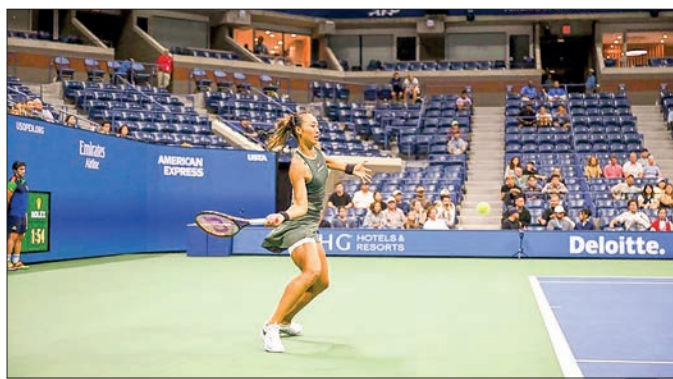
Zheng Qinwen of China hits a return to Donna Vekic of Croatia during the women's singles 4th round match in New York, the United States, 2 September 2024.

CHINA'S Zheng Qinwen reached the US Open quarterfinals for the second consecutive time with a victory over Donna Vekic of Croatia on Monday.