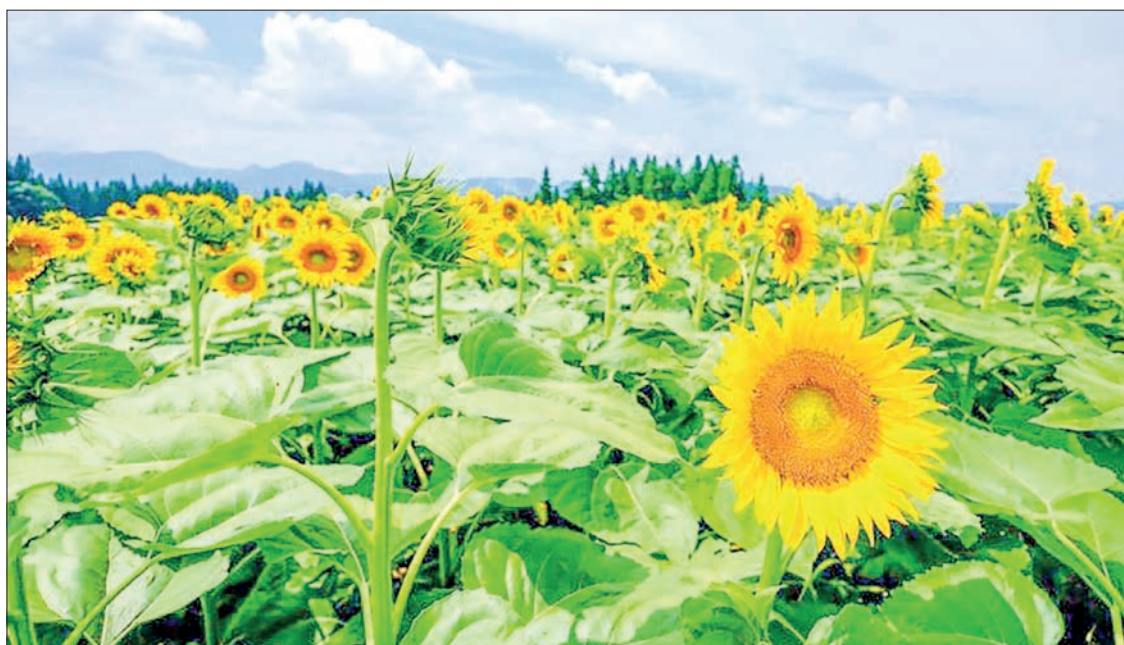
A thriving sunflower plantation – one of edible oil crops in Myanmar.

“We manage to plant over three million acres of edible oil crop, sunflower. We planted 1.08 million acres last year, and we will expand about 14,700 acres this year. We will arrange to expand the plantations gradually in the coming years, and we aim to meet three million acres in three years. The main operation is that we aim to meet three million acres of sunflower plantations after the water access project in double-crop plantation areas,” said Dr Ye Tint Tun, direc-