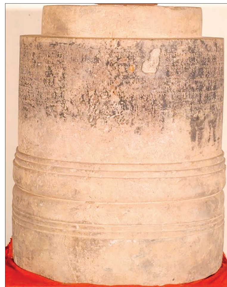
Inscribed Stone Burial Urn Found at Payahtaung Stupa in Sri Kshetra.

Prabhu Devi", belonging to the 5 th -7 th century CE (Varman Dynasty) (Aung Thaw et al, 1993). These inscriptions reflect that