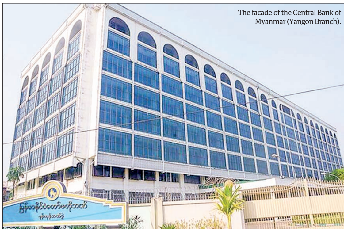
The facade of the Central Bank of Myanmar (Yangon Branch).

In accordance with the instructions of the Anti-Money Laundering Office (AMLO), Thailand's key agency responsible for