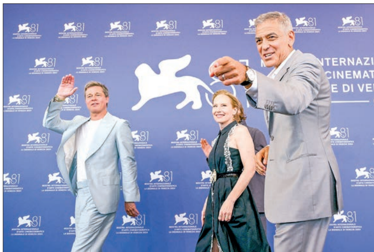
Actors George Clooney (R), Brad Pitt and Amy Ryan attend the photocall of the movie "Wolfs" presented out of competition during the 81 st International Venice Film Festival at Venice Lido, on 1 September 2024.

Clooney said it felt second nature sparring with Pitt in the action comedy about two professional fixers begrudgingly forced to work together.