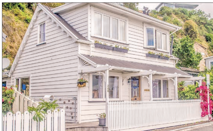
July 2024 saw a 9.6% increase in new home consents compared to the previous month, largely due to more working days available for processing consents.

The decreased number of homes consented is bad news for New Zealand's construction industry, with many companies having to close and around 8,000 fewer people employed in the sector since last November. — Xinhua