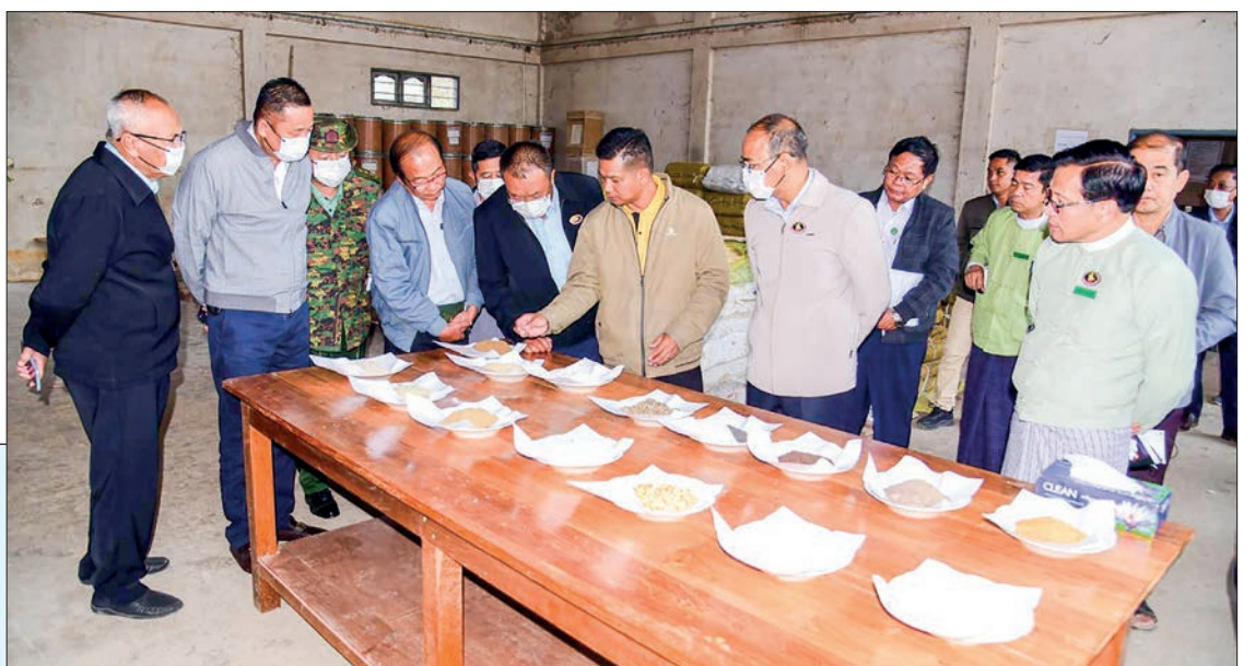
This photo shows officials inspecting the feedstuff processing factory in the Ayethaya Industrial zone in Shan State.

Global NEW LIGHT of MYANMAR www.gnlm.com.mm