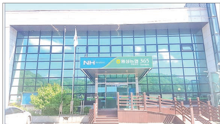
Nong Hyup Bank (also known as NH Bank) is significant financial institution in South Korea.

The BOK has left its benchmark interest rate unchanged at 3.50 per cent since January last year. Rate for banks' new corporate loans dipped 0.10 percentage points to 4.78 per cent in July compared to the previous month. Lending rate for big corporations shed 0.11 percentage points to 4.89 per cent, and rate for small companies declined 0.10 percentage points to 4.69 per cent. — Xinhua