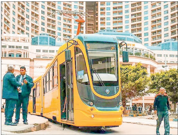
The project aims to upgrade the existing Abu Qir railway into an efficient metro line and is estimated to cost €1.5 billion.

The project, estimated to cost 1.5 billion euros, will be co-financed by the AIIB, the European Bank for Reconstruction and Development, the European Investment Bank, and the French Development Agency. — Xinhua