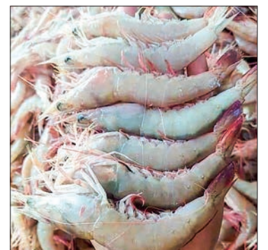
This photo showcases shrimps, which are mostly placed orders from hot pot restaurants.

"Consuming shrimp has become relatively high in Myanmar.