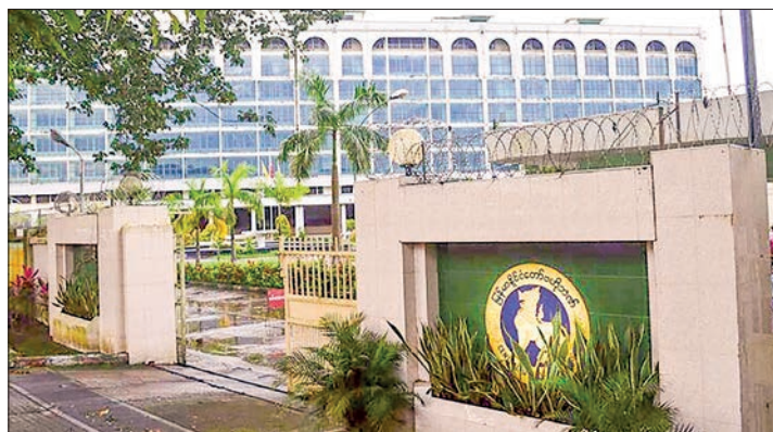
The office building of the Central Bank of Myanmar in Yangon.

cording to CBM's notification on 15 March, it has been joining hands with law enforcement agencies to combat and prosecute those who attempt to manipulate the currency market under the existing laws. CBM allowed authorized dealers (private banks) to operate online foreign exchange trading freely as per the market rate depending on supply and demand, starting from 5 December 2023. — NN/KK