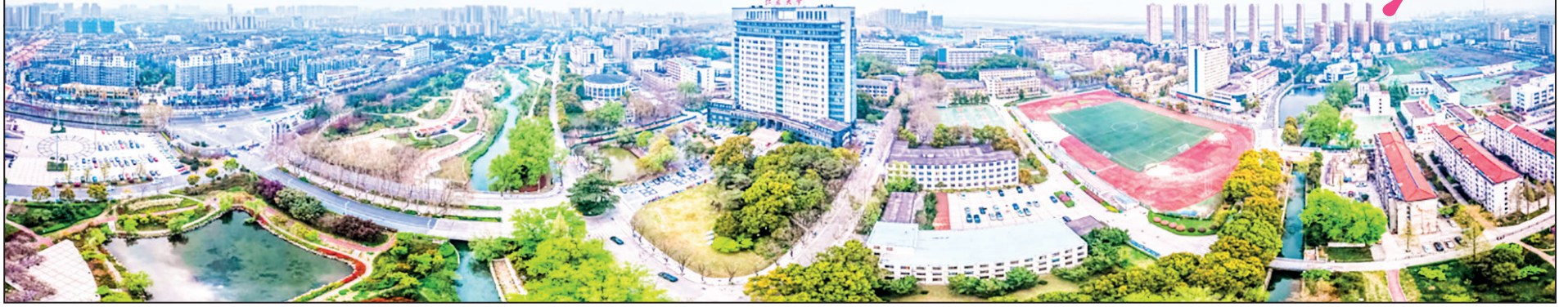
Jiangsu University, home to over 4,000 African students, exemplifies the strengthening of China-Africa ties through its educational partnerships and the Belt and Road Initiative.