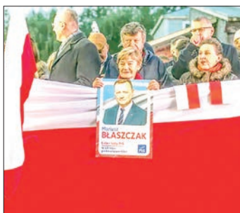
The PiS governed for eight years before losing power after the last election in October 2023.

The conservatives from the PiS governed in Poland for eight years and remain the biggest party in the Polish parliament, but lost power to Prime Minister Donald Tusk's