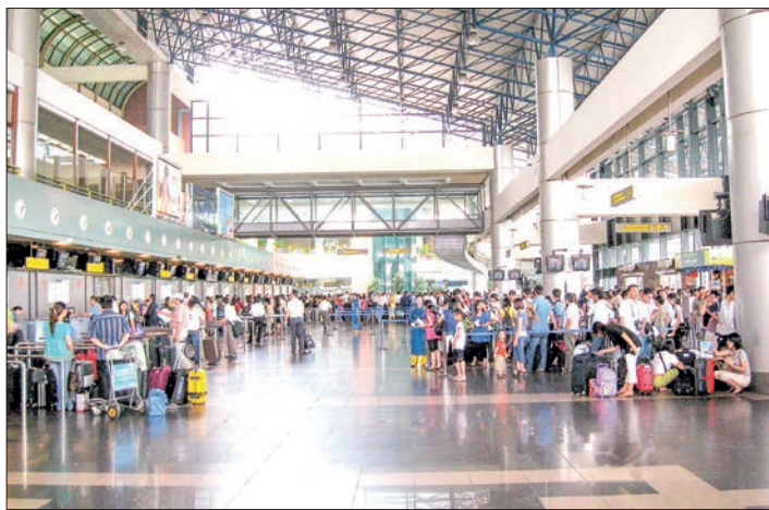
Check-in area at Noi Bai International Airport, Hanoi, Vietnam.

On 3 September the peak day, the airport is forecast to cater to more than 96,000 passengers, including nearly 35,000