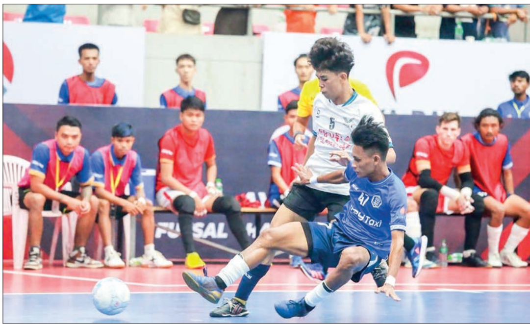
This photo shows Seven FC in action against Bushido FC.