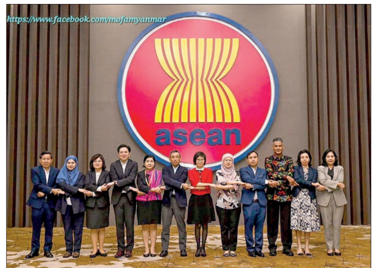
Delegates to the 74 th IAI Task Force Meeting and the 14 th Consultation Meeting of the IAI Task Force-ASEAN Partners pose for the documentary photo.