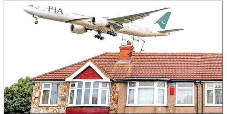
The buyer will need to address PKR 200 billion in liabilities and invest PKR 400 million in repairs and other issues.