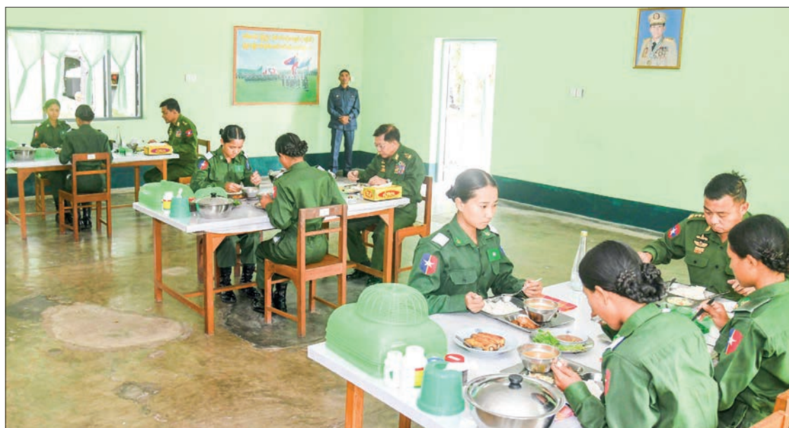
The Senior General (centre table) is seen having lunch together with female trainees from the OTS (Hmawby) and female officer platoon commander course yesterday.

Hence, he continued that Tatmadaw (Air) is being upgraded with aircraft as well as neces-