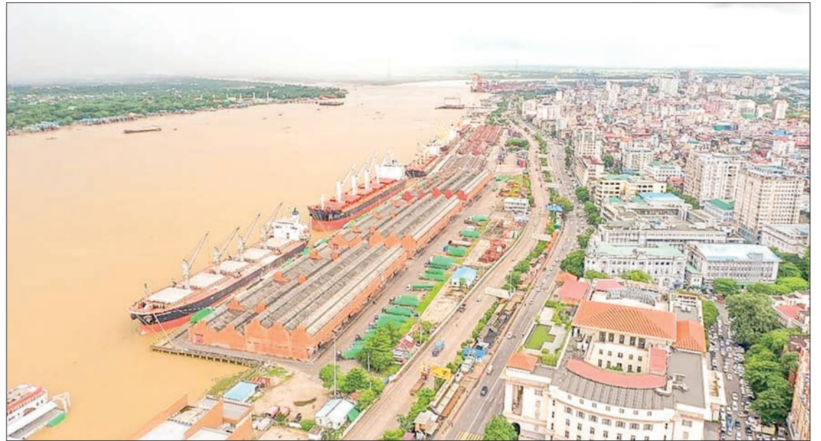
Aerial panoramic view: vessels are seen at Yangon Port along the Yangon River.

After the new navigation channel (Kings Bank Channel) accessing the inner Yangon River had been found, the draft extension work was accelerated. After that, the port can now