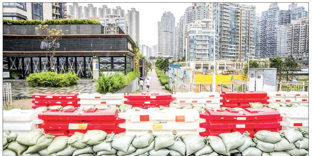
A recent study published in Nature Cities reveals that coastal cities worldwide are falling short in adapting to climate change.