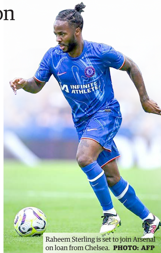
Raheem Sterling is set to join Arsenal on loan from Chelsea.

On a busy day for Chelsea, the club also secured Manchester United winger Jadon Sancho during the closing hours of the transfer window. Sancho joins Stamford Bridge on loan, with a clause obligating Chelsea to make the transfer permanent at the end of the season. — Xinhua