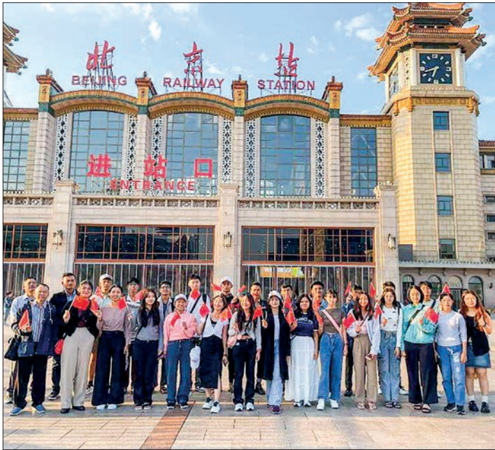
Myanmar outstanding youths, matric passer soldiers pose for a group photo at Beijing Railway Station during their excursion in Beijing, China.

AS per the guidance of State Administration Council Chairman Prime Minister Senior General Min Aung Hlaing, soldiers, children of servicemen and servicewomen, war veterans, and substituted civilian staff who passed the 2023-2024