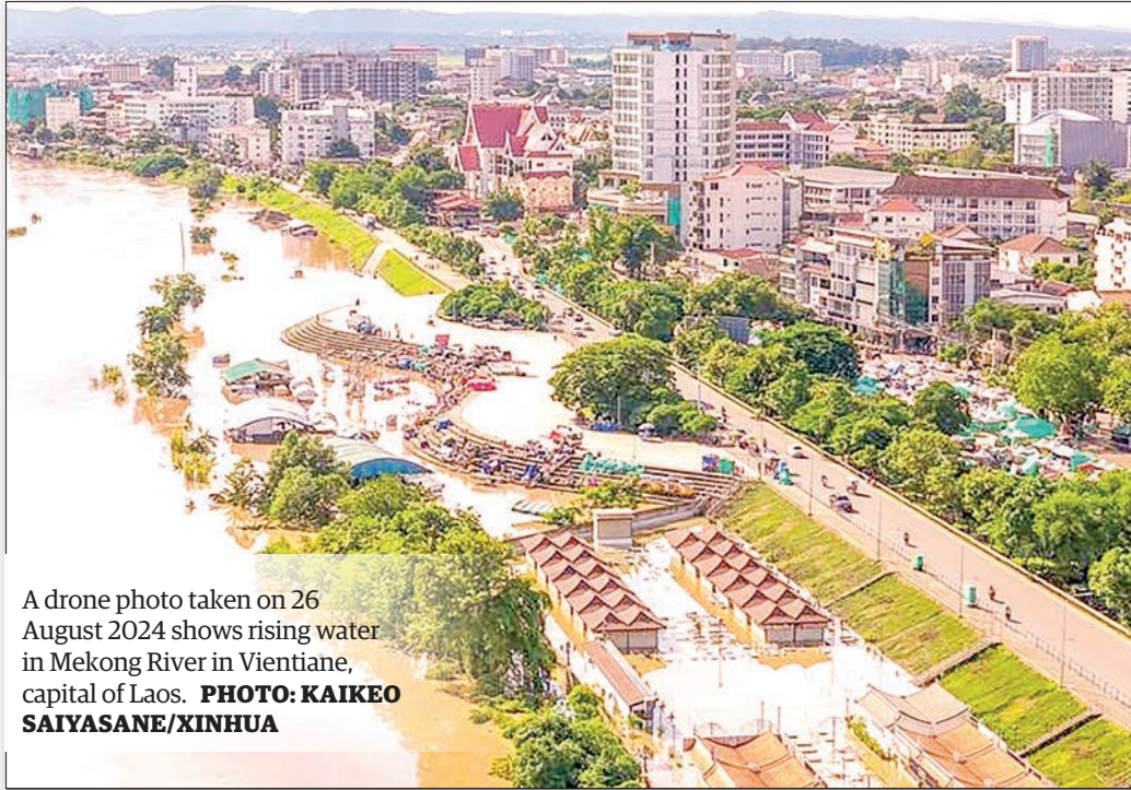
A drone photo taken on 26 August 2024 shows rising water in Mekong River in Vientiane, capital of Laos.