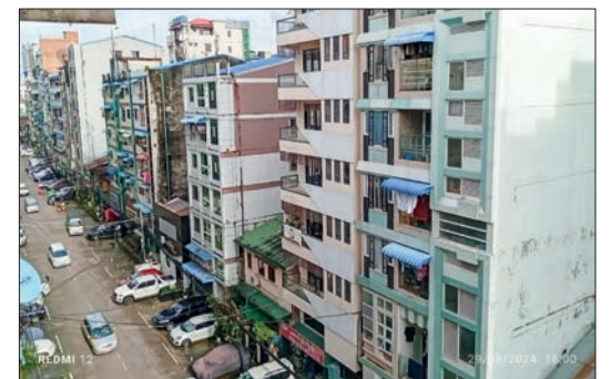
Some apartments in Sangyoung township, Yangon region.

ship, Yangon, stated he started selling his unit last year through real estate brokers, but he didn't find a buyer for an extended period. There are many potential buyers now, and he is in a wait-and-see mode.