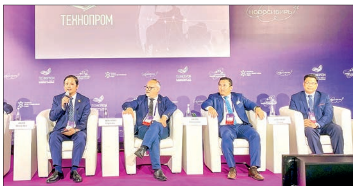
The XI International Forum of Technological Development "Technoprom-2024" is in progress on 27-29 August in the Russian Federation.

Additionally, on 28 August, the Myanmar Consul-Gener-