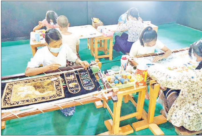
This photo depicts the previous gold and silver embroidery course.