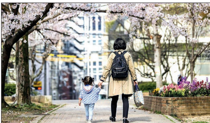
A mother and her child walk to nursery school in Osaka, Japan.

If the declining trend continues, the number of births for the full year, excluding foreigners, could fall below 700,000 for the first time. — Kyodo