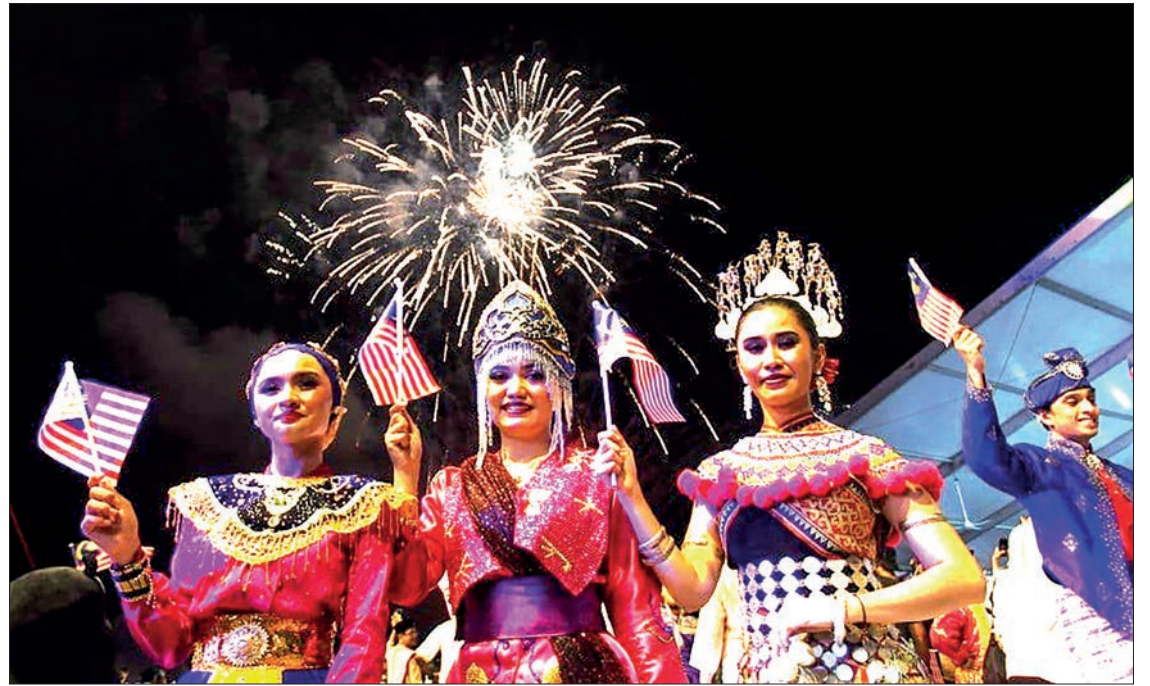
Over 17,000 people participated in the parade, representing diverse sectors such as civil society, state-owned enterprises, the civil service, and the armed forces.