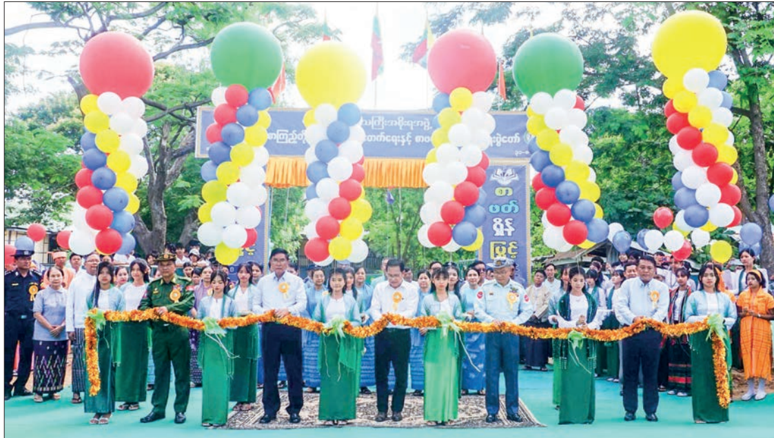
Union Minister for Information U Maung Maung Ohn launches the Developing Libraries and Raising Reading Habits campaign in Minbu, Magway Region, yesterday.

He continued that the State Head instructed him to reprint