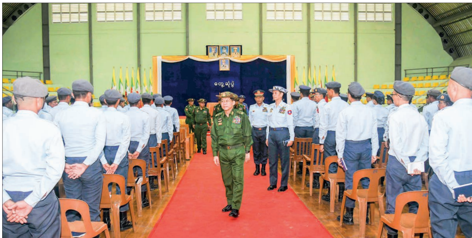
State Administration Council Chairman Commander-in-Chief of Defence Services Senior General Min Aung Hlaing warmly greets Tatmadaw members yesterday in Hmawby.

As Tatmadaw members, born of the people, sacrifice life to serve the defence duties of the State, taking oaths, they are in the highest institution for the State.