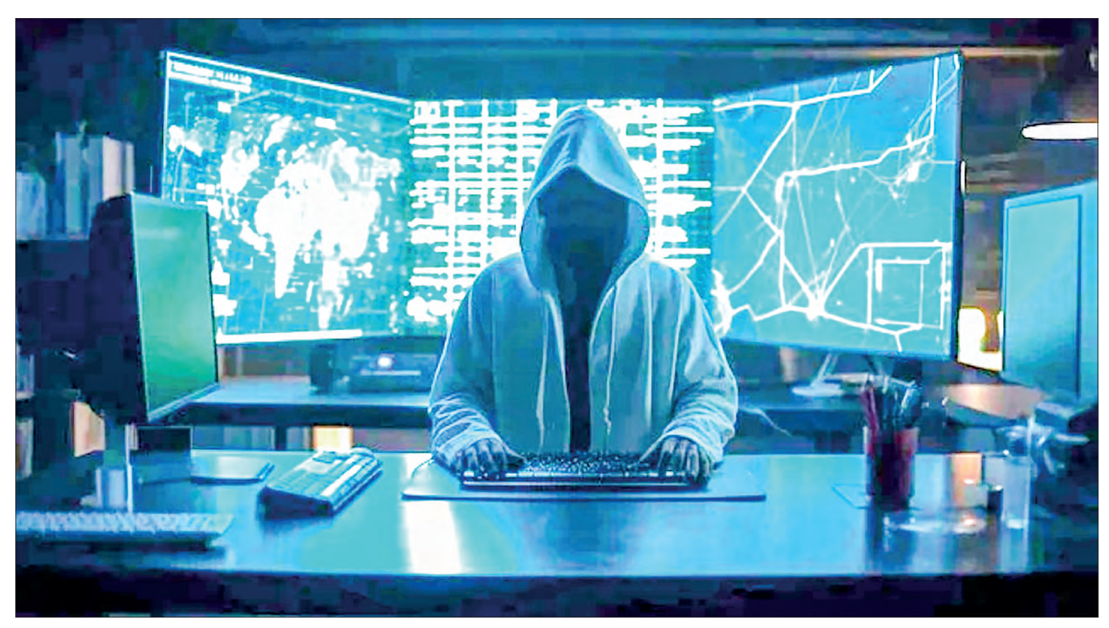
To combat the increasing threat of scammers and cyber crime, investing in robust digital security measures is essential for protecting personal and

The CBM has established the necessary infrastructure and regulatory framework to enable the operation of mobile wallet services. In 2006, the CBM enacted the Financial Institutions Law and Mobile Financial Services Regulations. As of 2022, the CBM has granted five companies, including Wave Money, OK Dollar, MPT, Ooredoo and Mytel mobile financial service providers. Additionally, the CBM has granted licences to 18 private banks for mobile banking under the Law and Regulations.