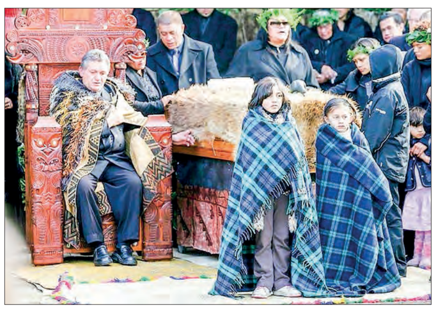
The king of New Zealand's Indigenous Maori people, Kiingi Tuheitia Pootatau Te Wherowhero VII (left), died on Friday.

Celebrated as a symbol of national unity and Maori identity, he died peacefully surrounded by family, shortly after marking the 18<sup>th</sup> anniversary of his coronation.