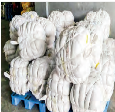
Photos show confiscated illegal commodities and vehicles in different states and regions.

UNDER the supervision of the Illegal Trade Eradication Steering Committee, efforts to combat the illicit trade are being effectively carried out in accordance with the law.