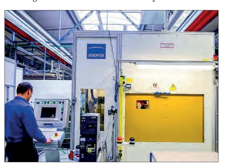
The city of Jena in eastern Germany is a world-renowned centre of expertise in the field of optics.

In recent elections, the Alternative for Germany (AfD) has become a significant political force in eastern Germany, performing notably well in European Union elections and expected to make gains in regional polls in Thuringia and Saxony.