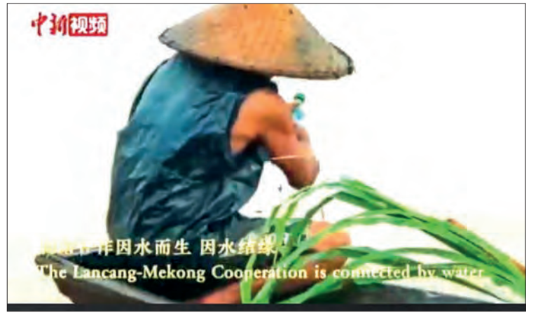
This picture captures a scene from the 'Lancang-Mekong Impression' entry video.

For more details, visit http://www.eens.cn/m/cns-wire/2024-04-29/detail-ihczz-kiq6812202.shtml, according to China News Service. — TWA/ MKKS