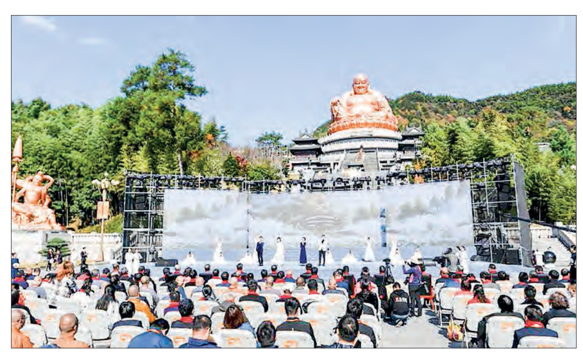
Photo taken on 11 November 2020 shows the opening ceremony of the Maitreya Cultural Festival of Xuedou Mountain in Ningbo, east China's Zhejiang Province.

The forum aims to foster global peace, enhance individual well-being, and build a shared future for humanity.