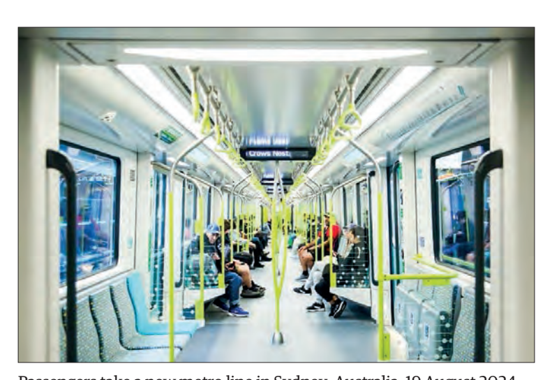
Passengers take a new metro line in Sydney, Australia, 19 August 2024.

AUSTRALIA'S annual rate of inflation slowed to 3.5 per cent in the year to July, official figures have shown.