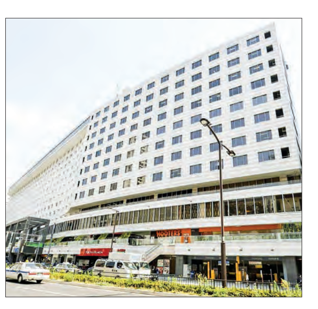
File photo taken in 2013 shows Akasaka Excel Hotel Tokyu.

Japan National Tourism Organization. The July figure for Japanese guests was up 1.9 per cent from a year earlier, reaching 44.22 million, and 7.9 per cent higher compared with the same month of 2019, the data showed. — Kyodo