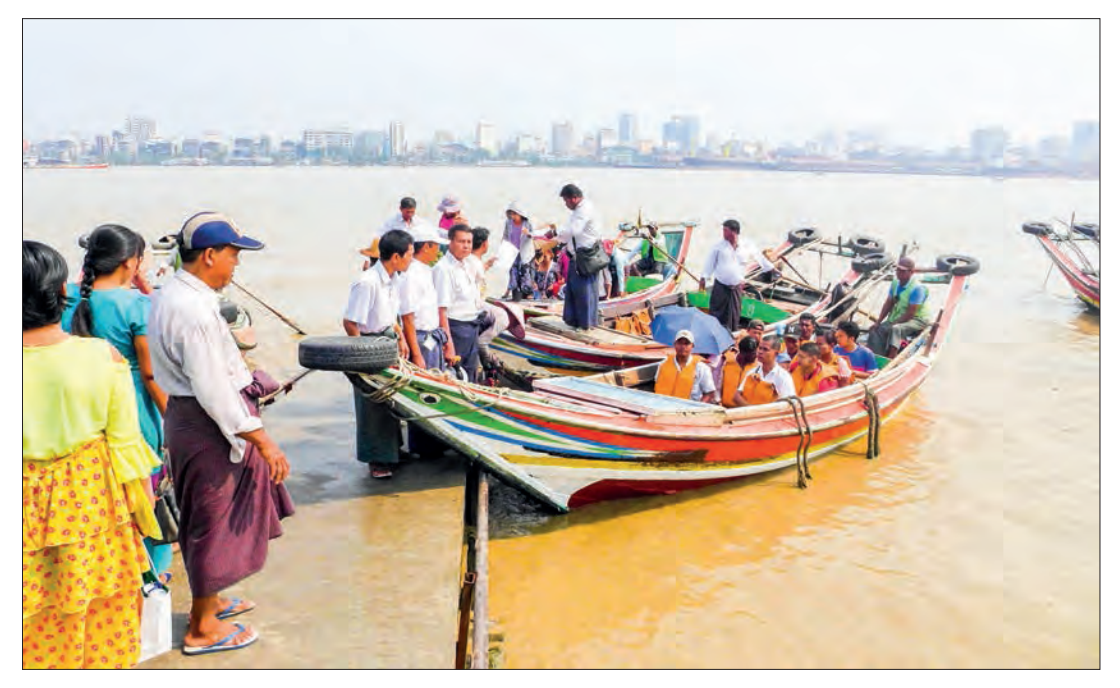
This photo shows machine-powered launches operating on the Yangon River.