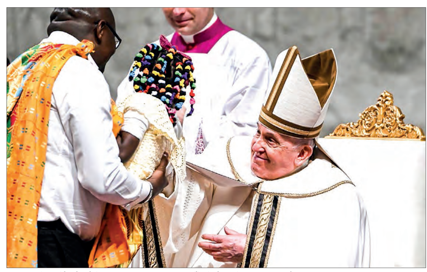
Pope Francis presides the Christmas Eve mass at St Peter's Basilica in the Vatican on 24 December 2023.

Despite the physical demands and time zone changes, the Pope is focused on spreading the faith and will deliver 16 speeches and conduct several large masses.