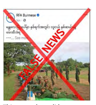
This screenshot validates misinformation.

Malicious media intentionally circulates wrong and fake