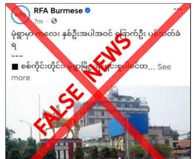
The screenshot validates misinformation.

The prison staff follow the prison rules and regulations when taking action against these female prisoners. But, the Khit Thit media attempted to mislead the people. — May Moe/KTZH