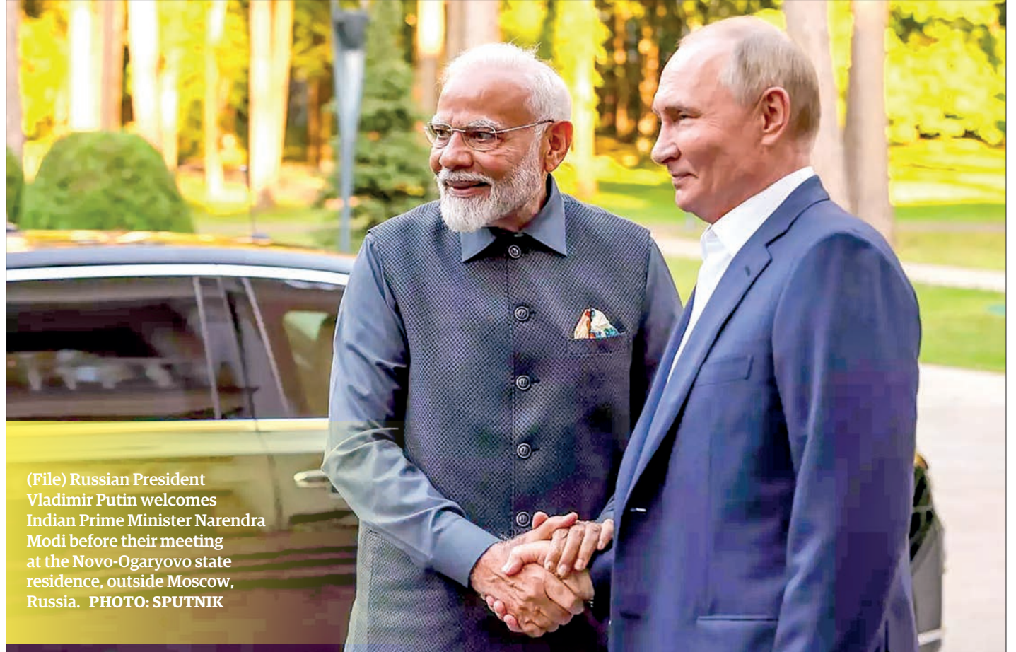
(File) Russian President Vladimir Putin welcomes Indian Prime Minister Narendra Modi before their meeting at the Novo-Ogaryovo state residence, outside Moscow, Russia.

According to a WHO statement, a funding appeal will be launched shortly. — Xinhua