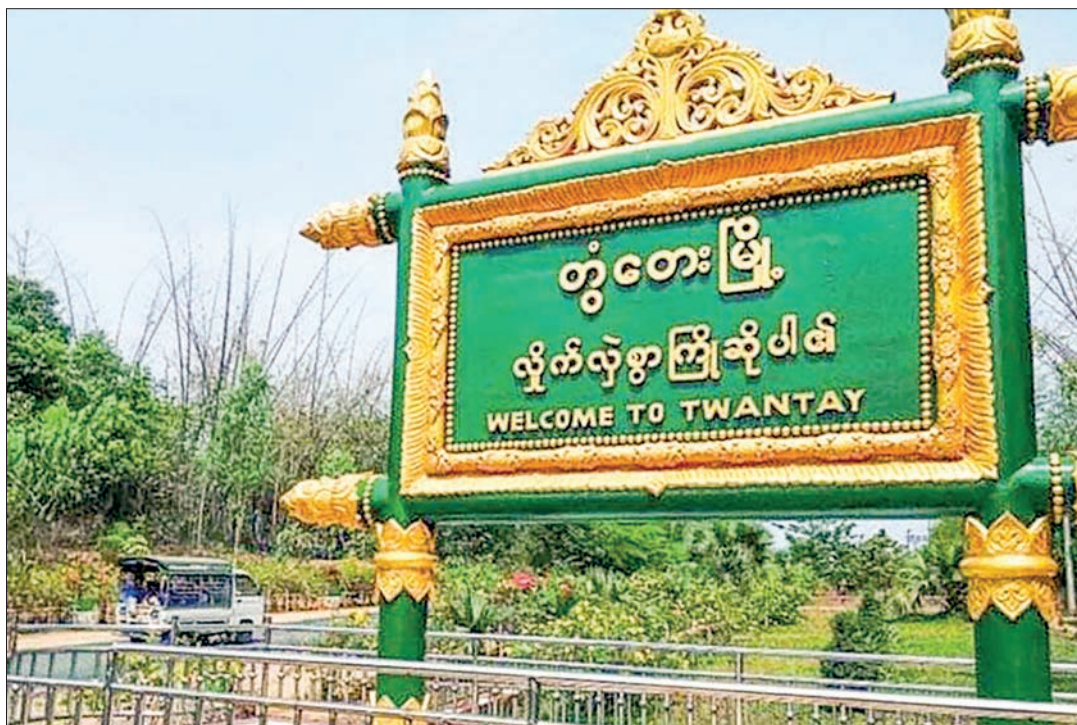
The photo shows the entrance to Twantay Township in Yangon Region.