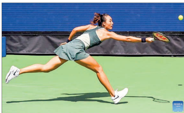
Zheng Qinwen of China hits a return during the women's singles first round match against Amanda Anisimova of the United States at the 2024 US Open tennis championships in New York, the United States, on 26 August 2024.

China's Wang Yafan advanced to the second round after her opponent Maria Sakkari exited early due to an injury after the first set. However, the other two Chinese women's singles players on Monday faced first-round exits: Wang Xiyu lost to Diane Parry of France 7-6(2), 7-6(5), and Yuan Yue was defeat-