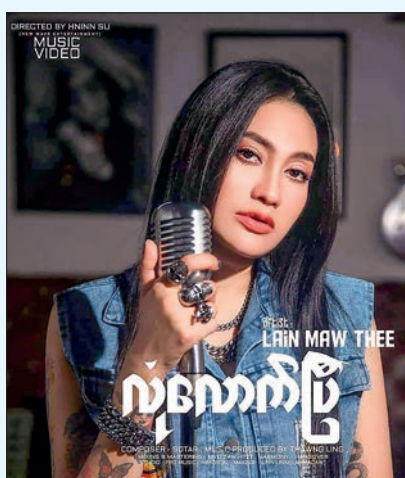
This photo depicts a scene from the 'Loan Laut Pi' music video.

The song was distributed on 26 August via the Tay Than Thar Application and Online App. Earlier