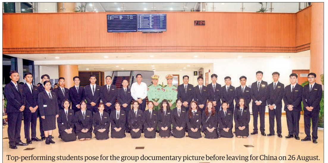
Top-performing students pose for the group documentary picture before leaving for China on 26 August.

Tatmadaw has presented awarded prizes to the children of Tatmadaw families, war veteran members and Tatmadaw substitute staff who passed the matriculation exam with distinctions since 2011-2012. Among them, the outstanding soldiers and youths were arranged to go on foreign excusing in 2013, and the plan was suspended during the outbreak of COVID-19 and resumed in the 2023-2024 academic year. — MNA/KTZH