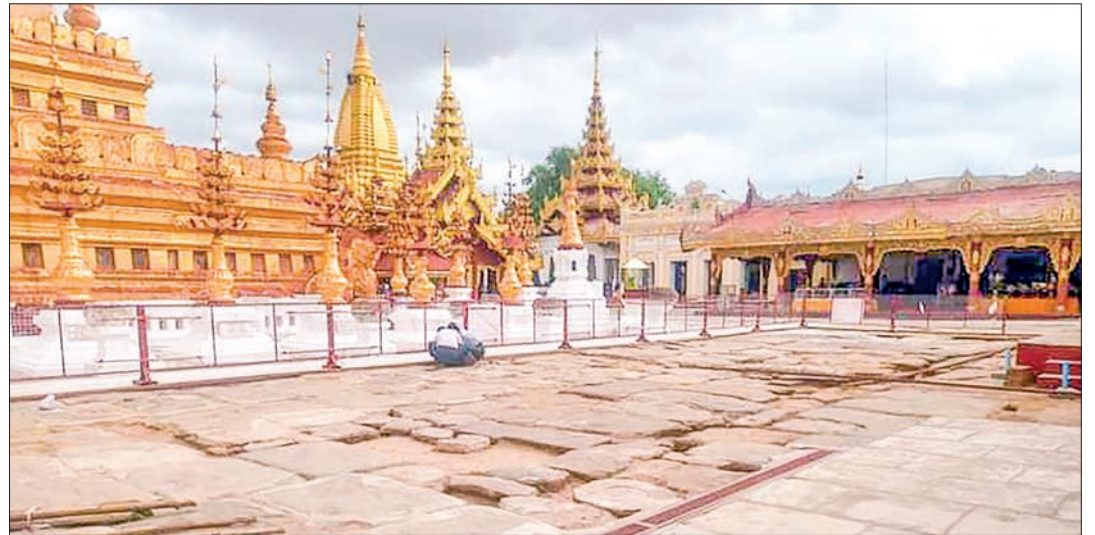
Maintenance works of ancient sandstone slabs in progress on the platform of the Shwezigon Pagoda.