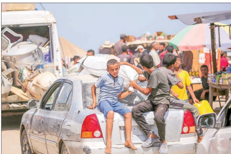
Displaced Palestinians leave the perimeter of the Al-Aqsa Martyrs Hospital in Deir al-Balah in the central Gaza Strip following renewed Israeli evacuation orders for the area on 26 August 2024 amid the ongoing conflict between Israel and the Palestinian Hamas movement.

“The sides expressed satisfaction with the level of interaction between the two countries in BRICS. Narendra Modi confirmed his readiness to take part in the summit of the association held under the Russian chairmanship in Kazan in October,” the statement said. — SPUTNIK