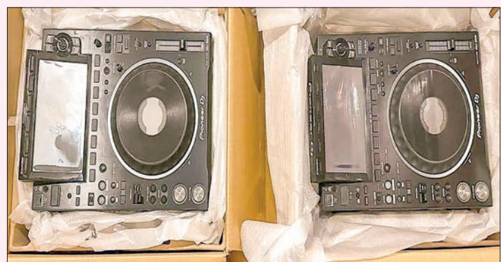
Confiscated illegal items in different states and regions.

The Illegal Trade Eradication Steering Committee reported 24 arrests on 23, 25 to 26 August, resulting in the seizure of illegal goods valued at approximately K596.008 million. — MNA/TMT