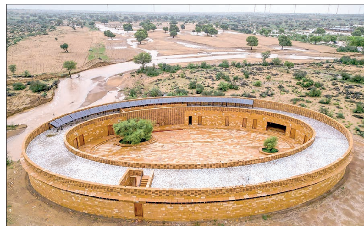
An architecturally striking school is an oasis of cool thanks to a combination of age-old techniques and modern design.

Temperatures surged above 50 degrees Celsius (122 degrees Fahrenheit), with warnings people