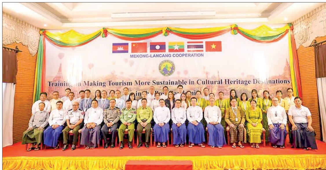
The commemorative group picture taken at the opening event in Bagan on 26 August 2024.

Deputy Minister U Phyo Zaw Soe explained that training was opened based on the outcome of the Seminar on Making Tourism More Sustainable in Cultural Heritage Destinations in the Post-Pandemic held on 23 August in Bagan, with the presence of representatives and experts from Mekong-Lancang member states. Myanmar's hotel and tourism sector saw four projects operated under the 2021-2023 Mekong-Lancang Cooperation Special Fund: The establishment of the Tourism Research Centre