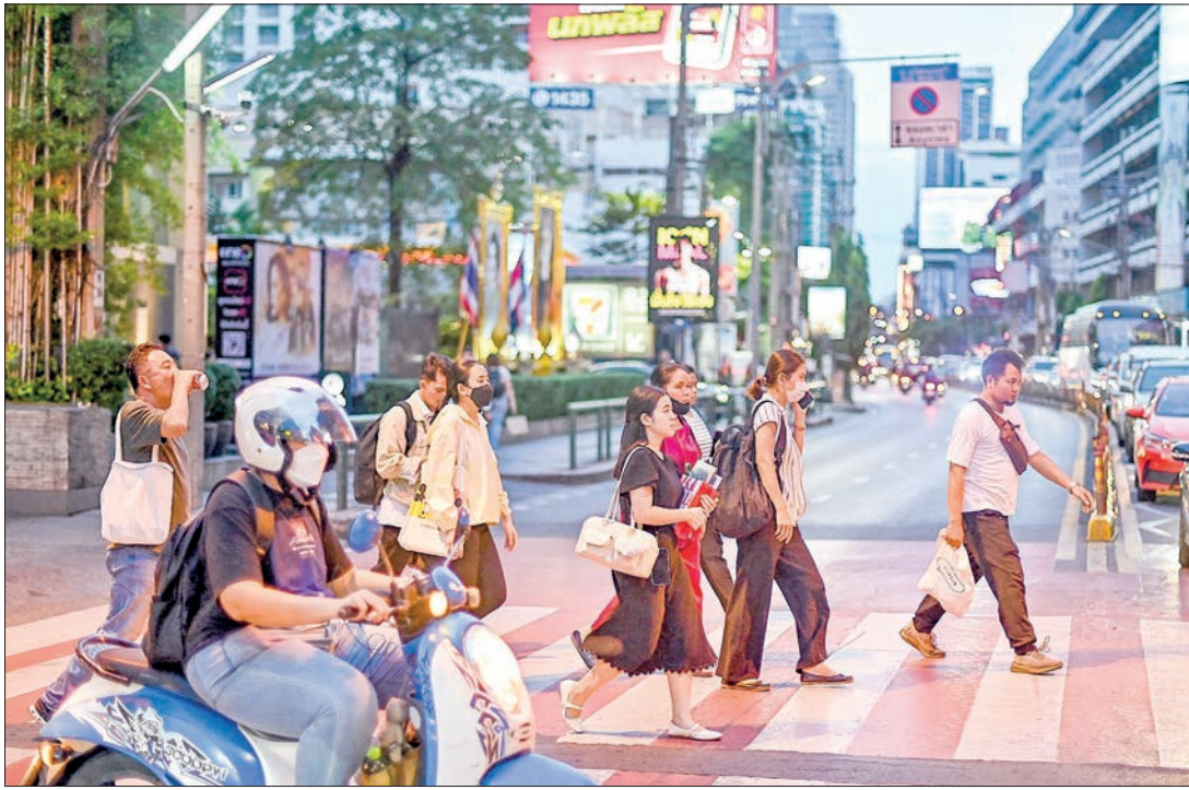
Pedestrians cross a busy street in Bangkok on 21 August 2024.

THAILAND'S exports surged to a 28-month high in July thanks to a marked increase in shipments to key markets, driven by higher demand for electronic products, which aligns with a growing digital economy, official data showed on Tuesday.