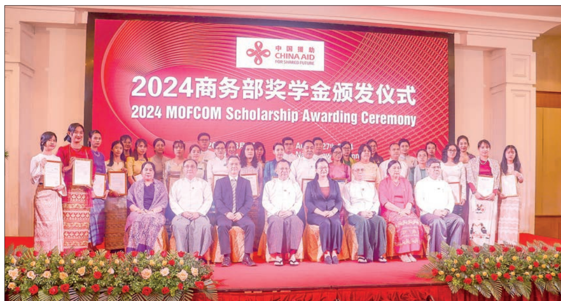
The commemorative group picture taken at yesterday's event in Nay Pyi Taw.