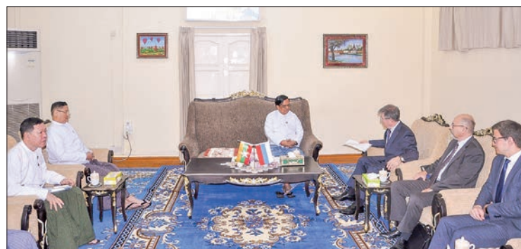
Union Industry Minister Dr Charlie Than receives Mr Iskander Azizov, Ambassador of the Russian Federation yesterday.

Both sides cordially discussed and exchanged views on the soonest complete operation of the No 2 Steel Factory (Pangpet) project by the Ministry of Industry and TPE Co Ltd of the Russian Federation, installation of the melting furnace, equipment in oxygen workshops for conducting test runs, the provision of technical support for the operation of the factory, signing the contract framework after the two parties have completed the final discussion and negotiation, and further collaboration with stronger friendship between the two countries. — MNA/TS