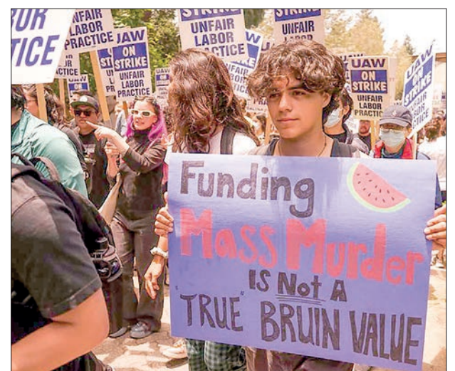
Academic workers protest at the University of California (UC), Los Angeles, in Los Angeles, California, the United States, on 28 May 2024.

“The priority is to evacuate those trapped by the flooding,” Tahir said, adding that rescue teams are currently working to reach them. Local media said the dam collapse, caused by heavy rains, led to intense flooding filled with silt, destroying nearby villages and making rescue efforts difficult. — Xinhua