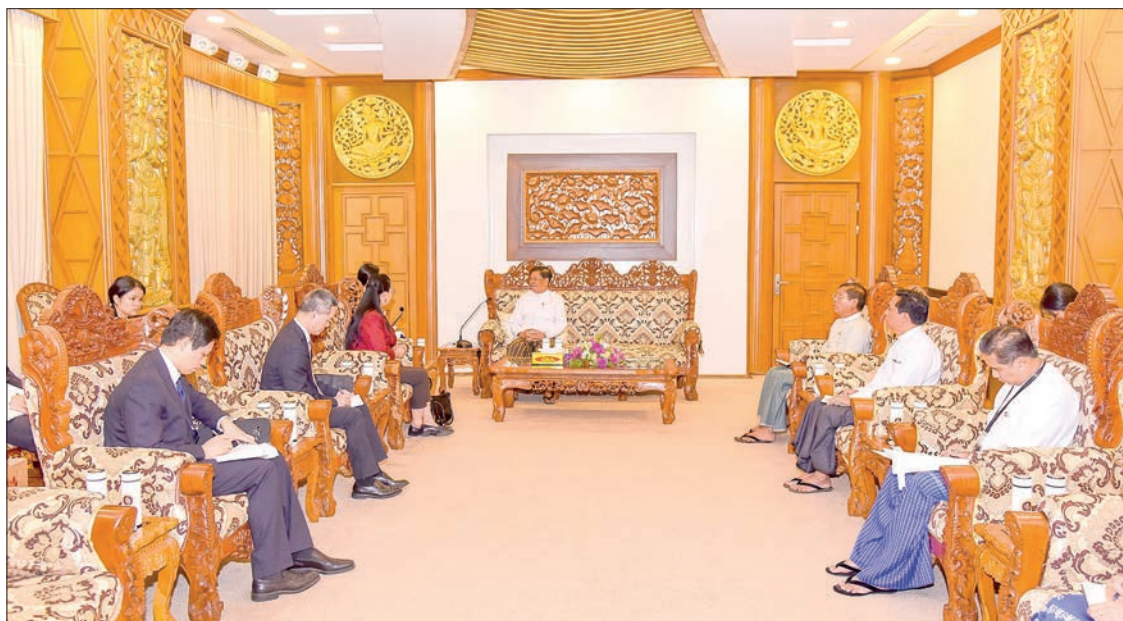
Chinese Ambassador Ms Ma Jia calls on Deputy Prime Minister Union Foreign Affairs Minister U Than Swe in Nay Pyi Taw yesterday.

Both sides also exchanged views on closer collaboration in the regional and international arena, especially ASEAN and the United Nations. — MNA