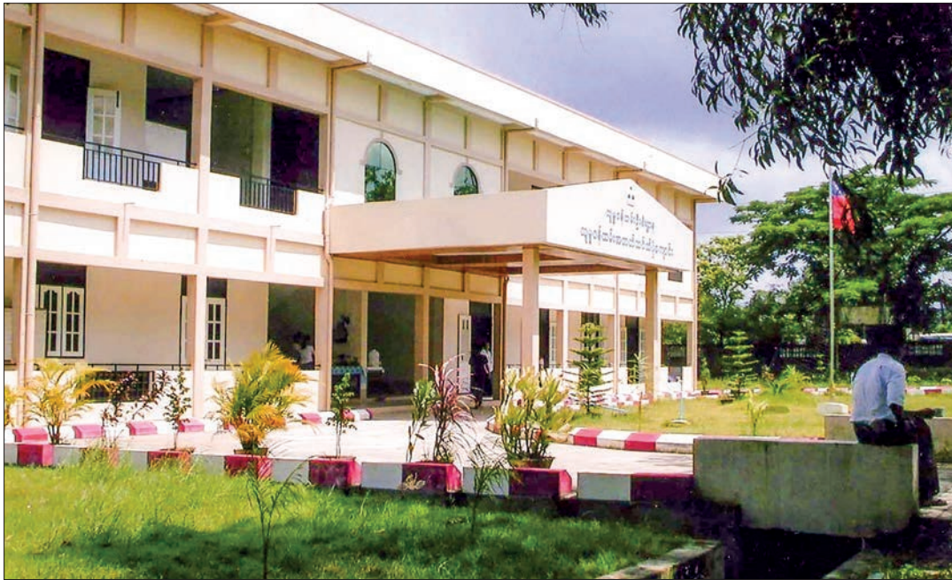
The School for the Adults with Disabilities (Yangon).

A second three-month vocational training course for the 2024-2025 academic year will commence on 9 September at the School for Adults with Disabilities (Yangon), according to the Department of Social Welfare.