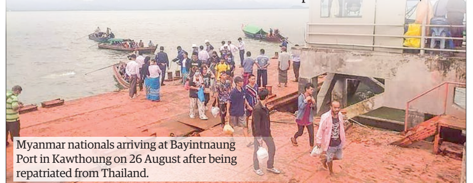
Myanmar nationals arriving at Bayintnaung Port in Kawthoung on 26 August after being repatriated from Thailand.

Upon arrival, the returnees were provided with medical check-ups by the health department at the Nawaratt Sports Hall in Kawthoung. Myanmar authorities, in collaboration with NGOs, processed the returnees' personal information. They will be sent back to their respective hometowns according to official procedures. — TWA/KZL