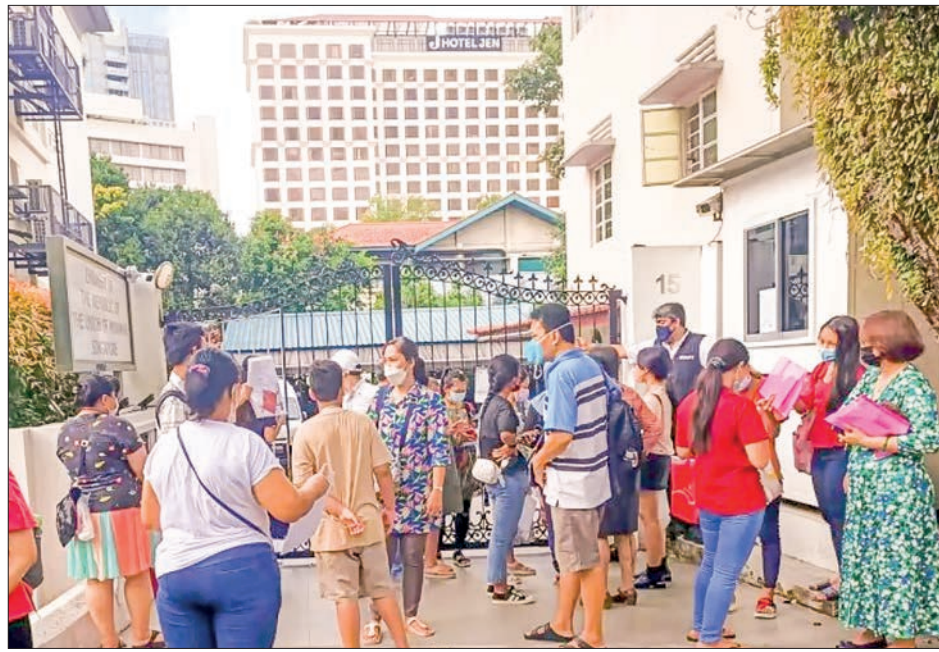
The photo shows Myanmar nationals seeking passport extensions at the Myanmar Embassy in Singapore in 2023.