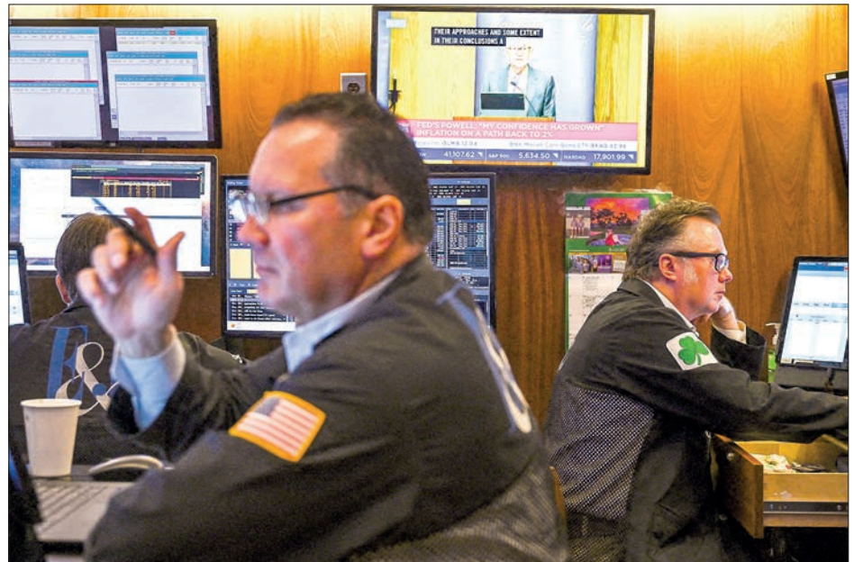
A television station broadcasts US Federal Reserve Chair Jerome Powell speaking in Jackson Hole, Wyoming, on the floor of the New York Stock Exchange (NYSE) in New York on 23 August 2024.