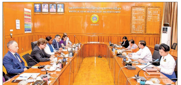
This picture captures Deputy Minister for Social Welfare, Relief and Resettlement discussing with Emergency Directors Group.

The director-general of the Department of Social Welfare, the director-general of the Department of Disaster Management, and delegation members of EDG were also present at the meeting.