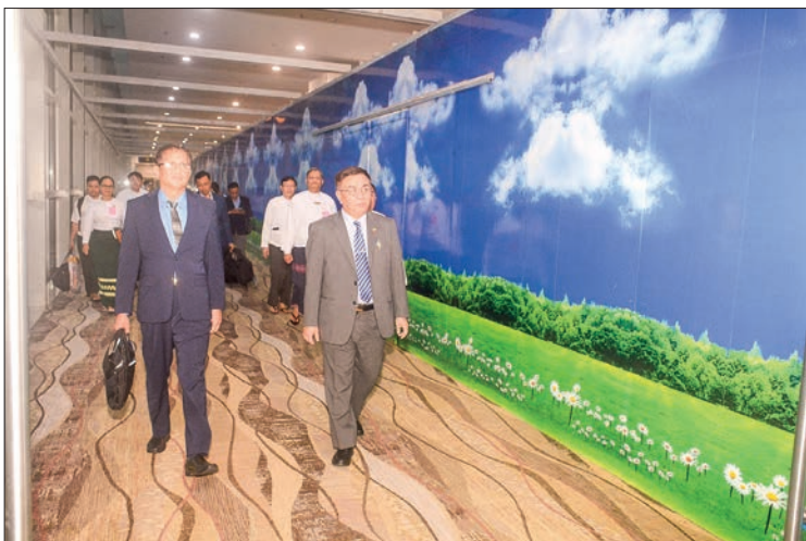
Union Minister Dr Nyunt Pe (R) is pictured on his arrival back yesterday.

A delegation led by Union Minister for Education Dr Nyunt Pe, who attended the 13 th ASEAN Education Ministers' Meeting, the 7 th ASEAN Plus Three Education Ministers' Meeting, and the 7 th East Asia Education Ministers' Meeting, returned to Yangon from Thailand yesterday.