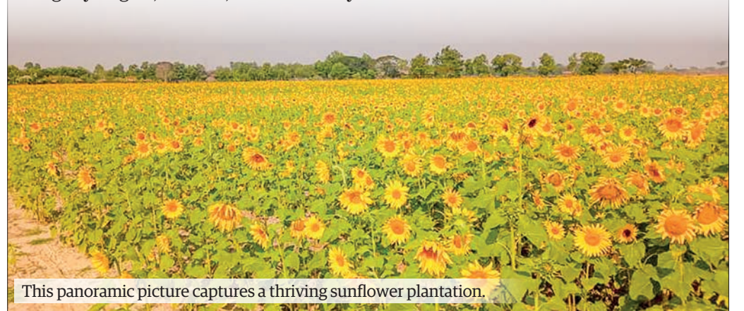
This panoramic picture captures a thriving sunflower plantation.

He also coordinated related institutions to provide seeds, fertilizer, irrigation water and technical assistance. — NN/KK