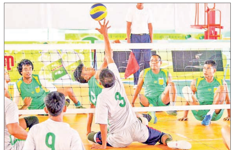
The sitting volleyball.

The sports festival will include 25 sports disciplines, such as athletics, swimming, football, chess, table tennis, and sitting volleyball. The first National Sports Festival was held in 1992, followed by the second in 1994 and the third in 1997, all in Yangon. The fourth National Sports Festival was held in Nay Pyi Taw in 2015. — TWA/MKKS