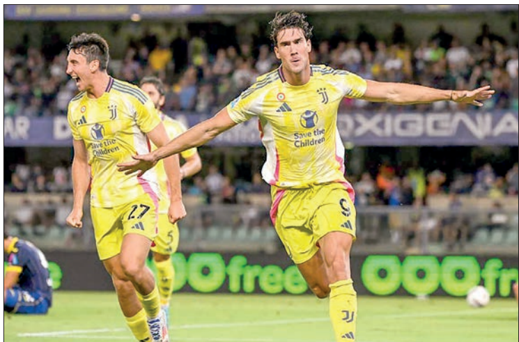
Juventus' Dusan Vlahovic (R) celebrates his goal during a Serie A football match between Hellas Verona and Juventus in Verona, Italy, 26 August 2024.

"We all agree that our attitude is the key to everything, if we have the right mentality, it all works better. — AFP