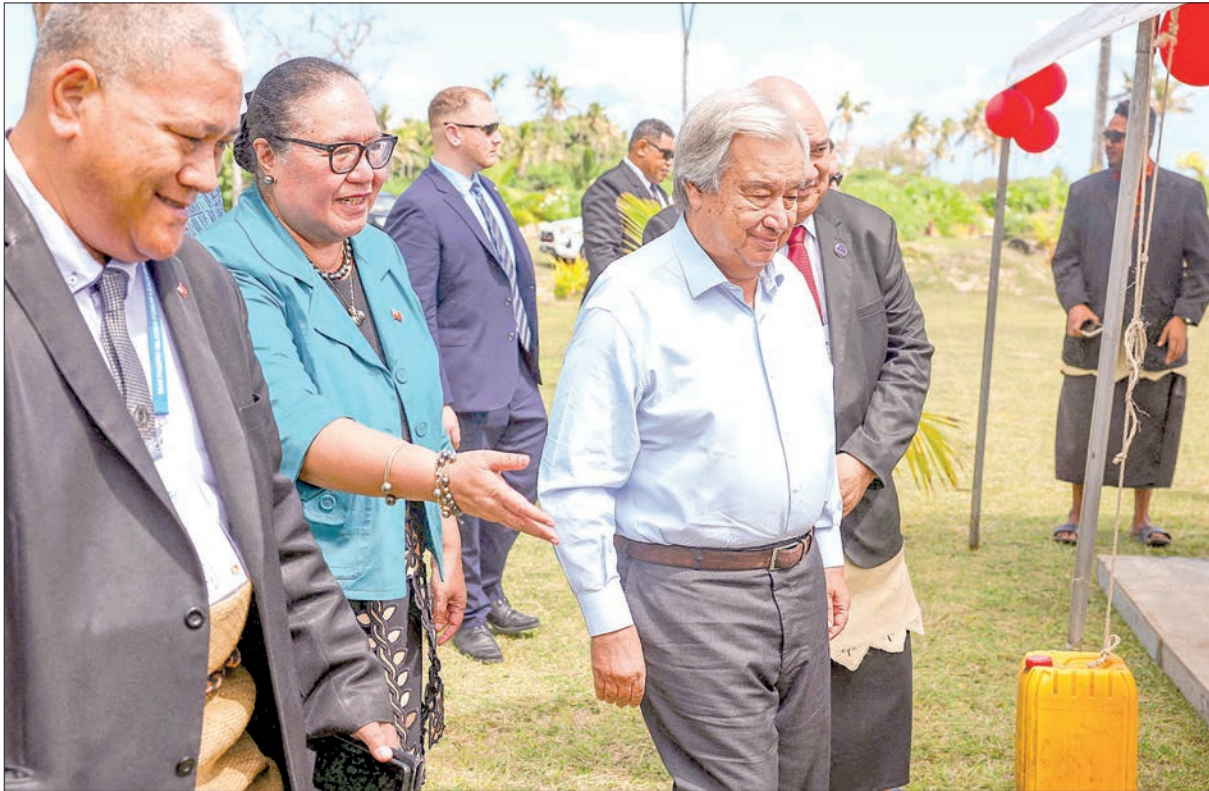
United Nations Secretary-General Antonio Guterres (2 nd R) visits the Ha'atafu Beach, an area affected by the volcanic eruption and tsunami in 2022, in Tongatapu on 27 August 2024.

UNITED Nations Secretary-General Antonio Guterres issued a “global SOS” in Tonga on Tuesday, urging governments to step up climate action to “save our seas”, as two new reports revealed how rising sea levels are threatening the vulnerable Pacific region and beyond.