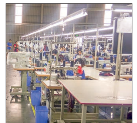
This photo shows ShuangXi (Pathein) Garment Co Ltd running operations in Pathein Industrial Park in Ayeyawady Region.

The committee is exerting continuous efforts to spur investments, support existing businesses, entice new investors, increase job opportunities in the region, enhance the socio-economy of the local community, and endorse businesses that are in line with rules and regulations. — ASH/KK