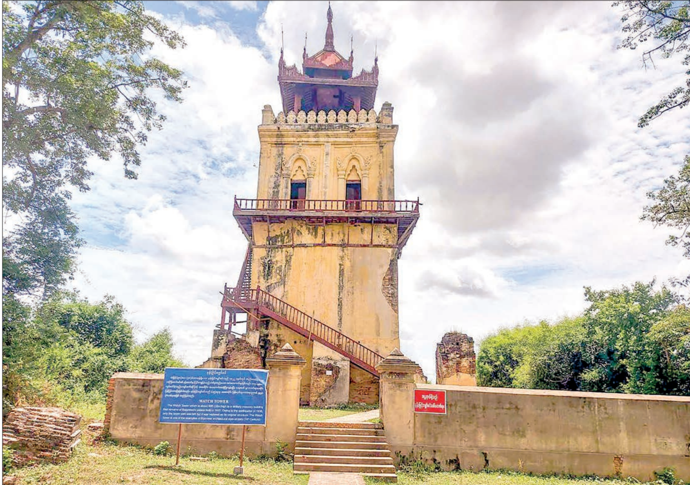
This photo depicts a general view of the Inwa palace tower in ancient Amarapura-era style.