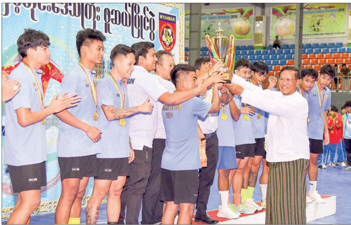
The Yangon Region men's team raised the championship trophy at yesterday's event, graced by SAC members and dignitaries.

Next, an awarding ceremony was held, and officials presented cash awards and medals to the best male and female athletes, the third-prize