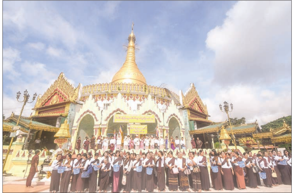
Photos show devotees and well-wishers throng on the platforms of the Shwedagon Pagoda (L) and the Thiri Mingala Kaba Aye Pagoda (R) yesterday.