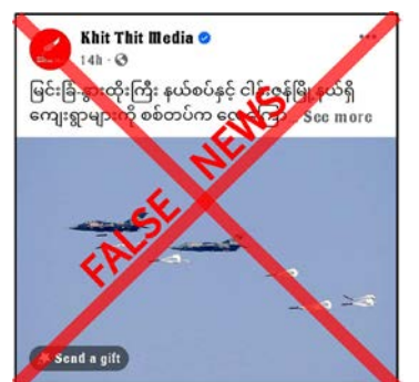
This screenshot validates misinformation.

The only damage observed was minor and limited to the outer walls of ancient pagodas in the vicinity due to exchanges of fire with insurgents. Insurgents, known for attacking Buddhist sites, have been reported to vandalize pagodas repeatedly.