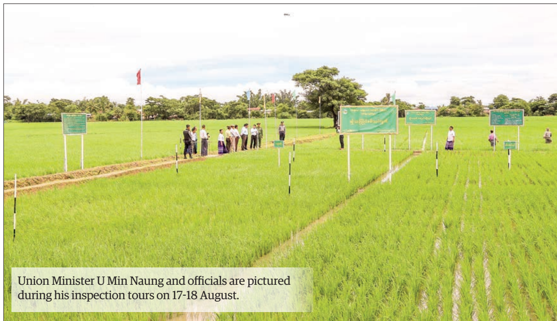
Union Minister U Min Naung and officials are pictured during his inspection tours on 17-18 August.

The Union minister stated self-sufficiency in domestic edible oil with sunflower crops. The planting of sunflower crops in various regions and states is