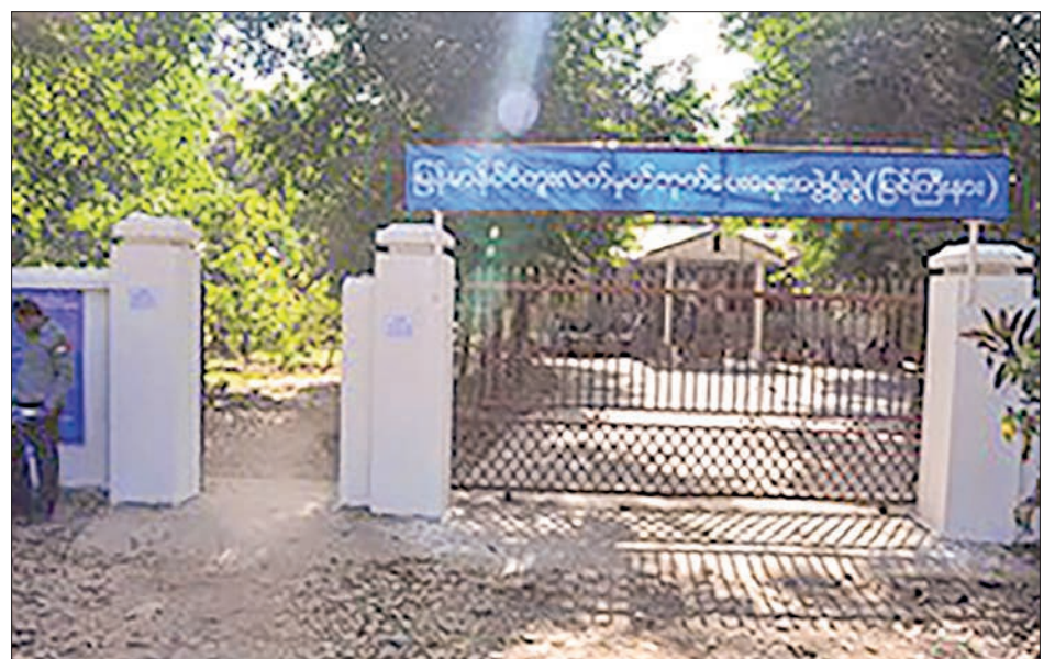
The facade of the Myanmar Passport Office (Myitkyina).

The Myanmar Passport Board has been issuing passports at the Yangon office since 24 February and at Nay Pyi Taw, Mandalay, Patheingyi, and Bago offices since 26 February – all through an online appointment system.