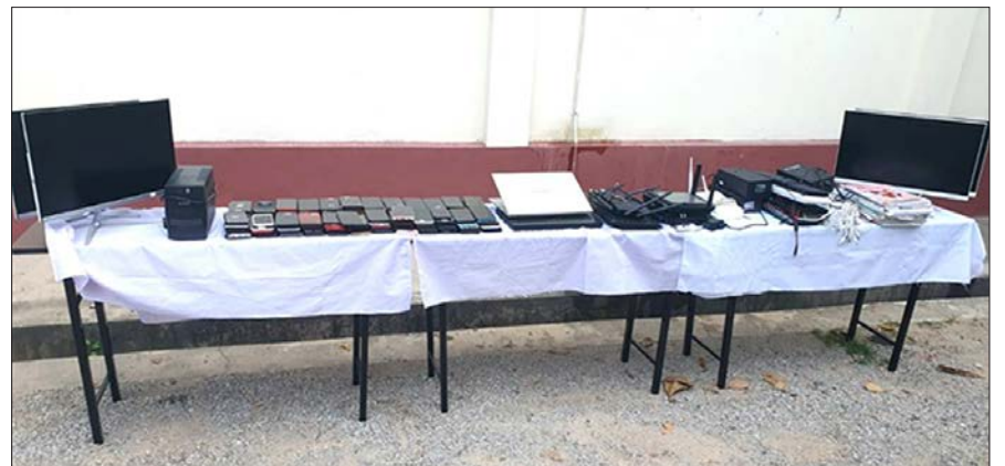
Four Chinese 17 Myanmar nationals are seen being arrested for online scams (L) with fraud-related evidence and items being seized (R).