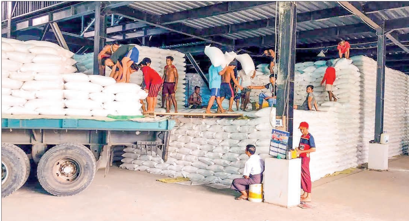
Workers carefully organize rice bags in a Yangon warehouse—one to three bags are designated for rice reserve per tonne of rice export.