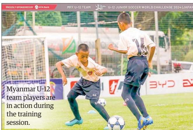
Myanmar U-12 team players are in action during the training session.

In the group stage, the Myanmar U-12 team will face the Tozuka Football Club Junior at 7:20 am on 20 August, Kashima Antlers Norte at 8:50 am on 20 August, and FC Basara Hyogo at 7:20 am on 21 August.