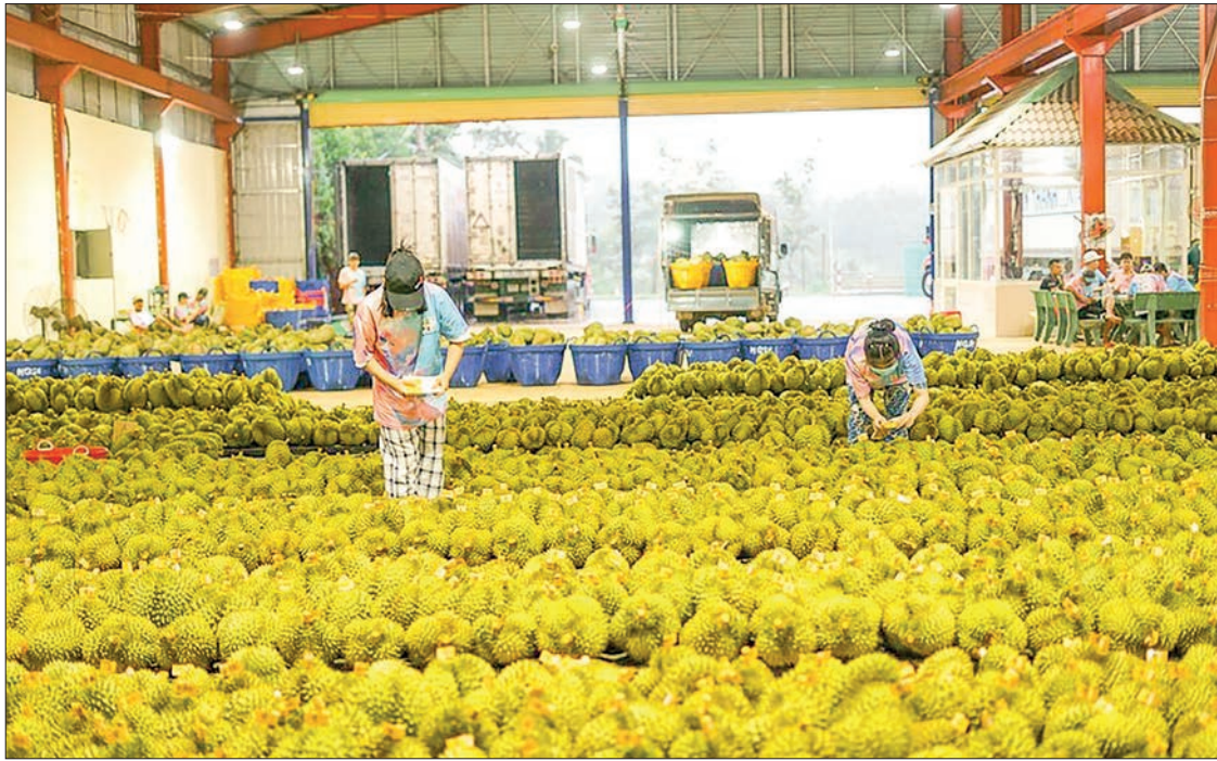
Staff members label durians to be exported to China at a durian processing plant in Dak Lak province, Vietnam, 15 September 2023.

VIETNAM'S fruit and vegetable exports could reach a record high of US$7 billion this year given the context that the country has continuously reported double-digit export growth of those products, Vietnam News Agency reported Monday.