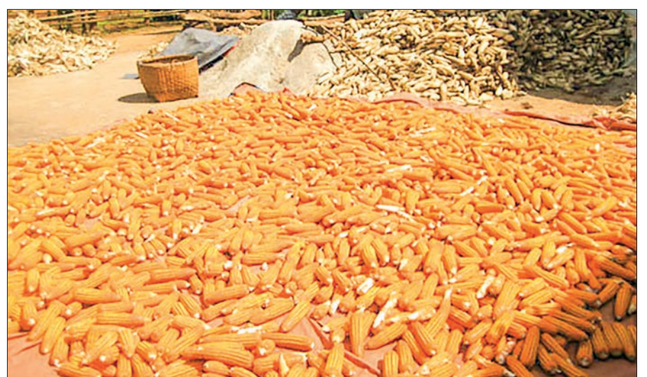
This photo shows harvested corn at the corn plantation.

Additionally, China has been purchasing Myanmar's maize through cross-border trade under the alternative development programme. Legitimate maize trade between Myanmar and