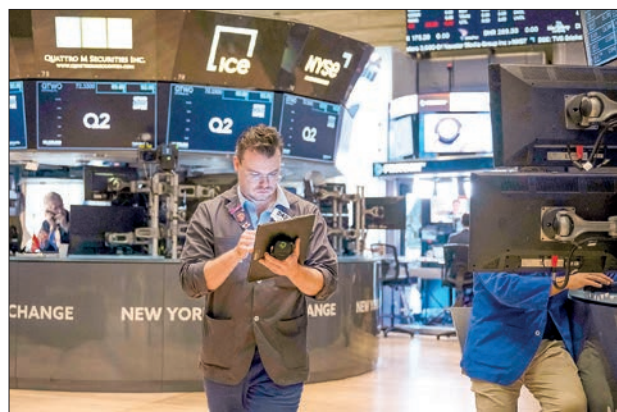
Traders work the floor of the New York Stock Exchange on 16 August 2024.

Santos said a "modest" cut of 0.25 percentage points seems likely while a larger 0.50-point reduction "would need stronger evidence of a weakening US job market". — AFP