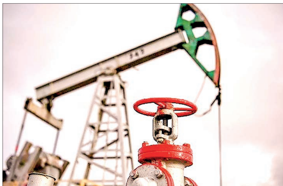
An oil pump jack operated by the Yamashneft Oil and Gas Production Division of Tatneft, are seen in Almetyevsk District of Russia's Republic of Tatarstan.

Russia and China are systematically increasing natural gas supplies via the Power of Siberia