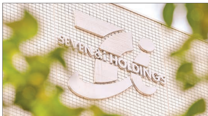
Photo taken in Tokyo in May 2023 shows the logo of Seven & i Holdings Co.

JAPANESE retail giant Seven & i Holdings Co said Monday it will review a proposal by Canadian convenience store giant