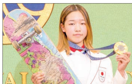
Olympic women's street skateboarding gold medalist Coco Yoshizawa attends a press conference in Tokyo on 19 August 2024.

trip to Japan. The team consists of 18 players and six administrative and coaching staff members. — TWA/TMT