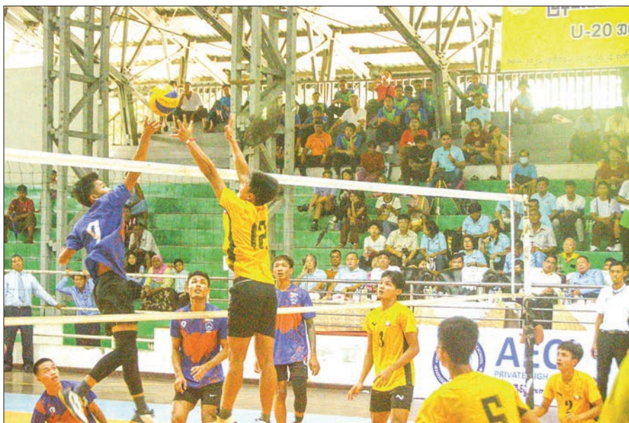
The Mandalay team and Shan (youth) competing in the national competition.