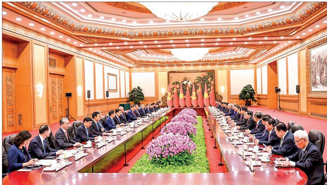
Xi Jinping, general secretary of the Communist Party of China Central Committee and Chinese president, holds talks with To Lam, general secretary of the Communist Party of Vietnam Central Committee and Vietnamese president, who is on a state visit to China, at the Great Hall of the People in Beijing, capital of China, 19 August 2024.

Xi expressed the willingness to establish good working relations and personal friendship with Lam to jointly guide the substantial development in building a China-Vietnam community with a shared future.