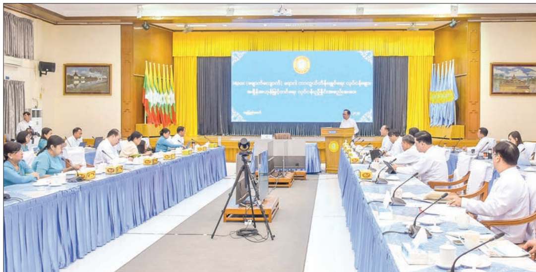
Union Minister Dr Thet Khaing Win addresses the meeting to ramp up prevention measures against mpox yesterday.

Then, the attendees reported on mpox cases in the world countries, preventive measures in Myanmar and supervision of mpox at borders. — MNA/KTZH