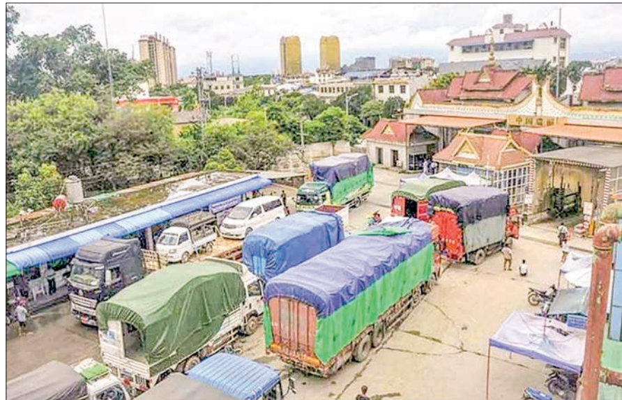
Lorries loaded with export-import cargoes line up for crossing at the Muse 105-Mile border post.

THE Agriculture Department, Consumer Affairs Department and Myanmar Rice Federation jointly arranged a work coordination meeting at Mingala Hall of the Union of Myanmar