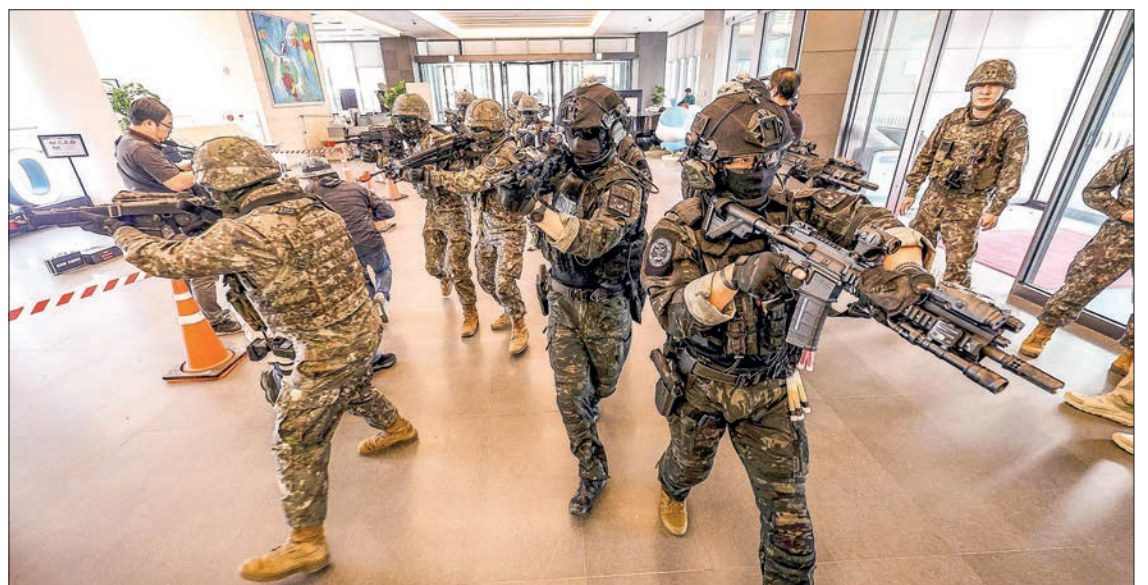
An anti-terror drill is held as part of the US-South Korea joint annual Ulchi Freedom Shield military exercise at a bank in South Korea’s Daegu on 19 August 2024.

SOUTH Korea and the United States began a joint large-scale military exercise on Monday aimed at further strengthening their combined defence capabilities to cope with threats from North Korea, with a focus on readiness against Pyongyang’s weapons of mass destruction.