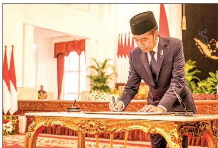
Indonesia's President Joko Widodo signs during the swearing-in ceremony of ministers and a deputy minister at the Presidential Palace in Jakarta on 19 August 2024.

Former investment minister Bahlil Lahadalia, a close aide and vocal supporter of Jokowi, was appointed energy and mineral resources minister as the