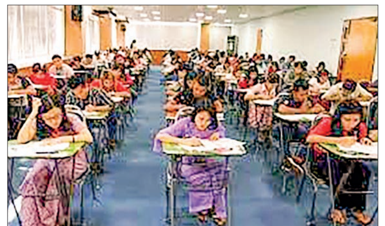
Candidates for Japanese Language Proficiency Test (JLPT) in 2023.

The JLPT, ranging from N1 to N5, qualifies successful candidates to work for companies in Japan or for Japanese companies operating in Myanmar.