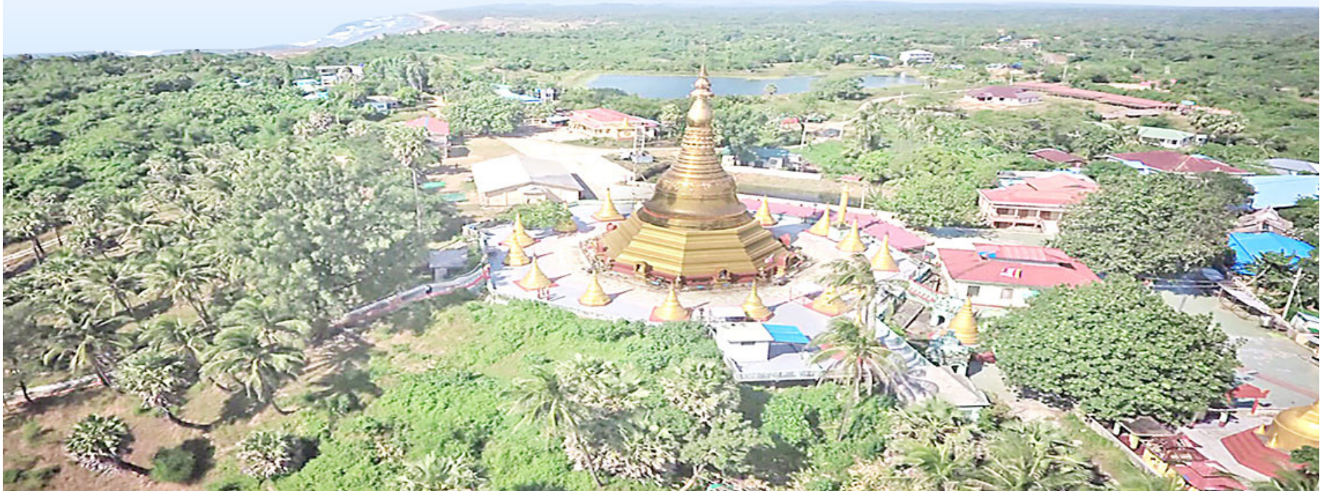
An aerial panoramic view of the Myat Mawtin Pagoda and its scenic surroundings in Ayeyawady Region.

As part of a five-year plan running from 2022 to 2026, the four pagoda platform are under renovation. The religious hall is being enlarged to accommodate more pilgrims, and accessible accommodation facilities are under construction at present. — ASH/MKKS