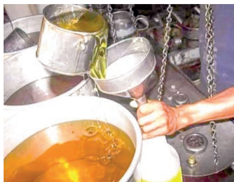
Palm oil is arranged for sales at the market.

The domestic consumption of palm oil is estimated at one million tonnes per year. The local palm oil production is just about 400,000 tonnes. About 700,000 tonnes of palm oil are yearly imported through Malaysia and Indonesia to meet domestic demands. — NN/KK