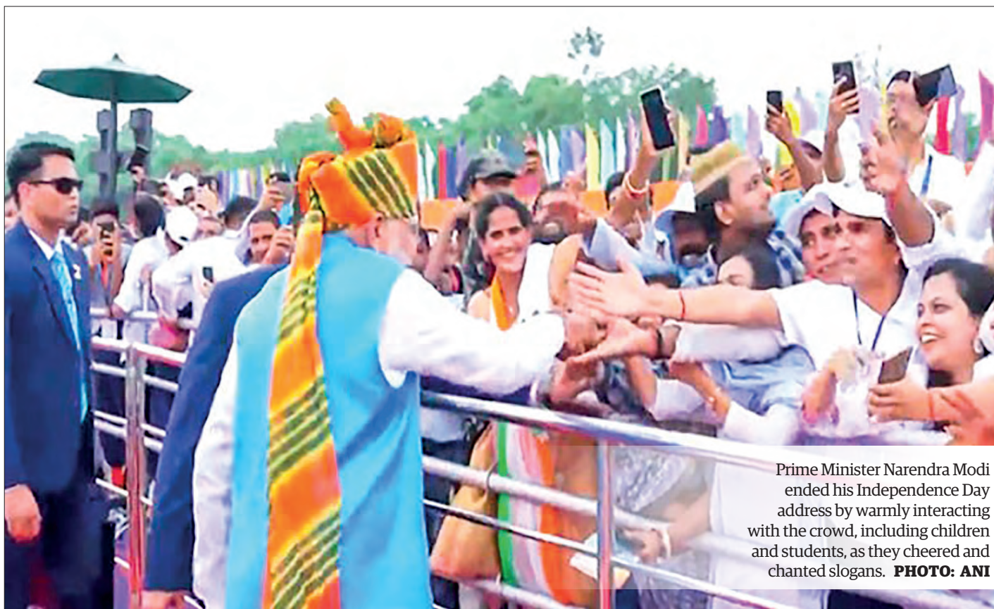
Prime Minister Narendra Modi ended his Independence Day address by warmly interacting with the crowd, including children and students, as they cheered and chanted slogans.