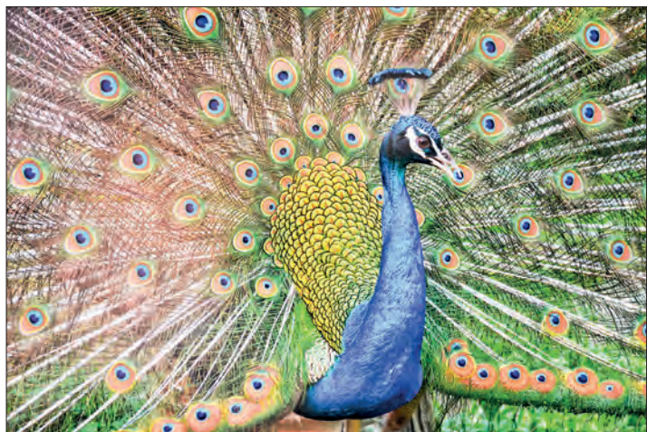
The Indian peacock, notable for its vibrant colours, holds significant cultural importance in India, and its population has declined due to urbanization and habitat loss, leading to stringent wildlife protection laws.

AN Indian would-be social media star has been arrested and detained after outrage by his video of cooking and eating the country’s protected national