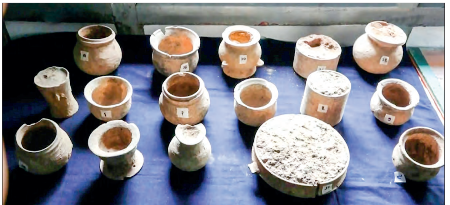
Ancient pre-Bronze and Iron Age earthen utensils donated to Archaeology Department.

CBM injected $15.4 million and five million yuan into the foreign exchange market in July with a view to curbing the instability in the foreign exchange market and stopping the currency devaluation. According to CBM's notification on 15 March, it has been joining hands with law enforcement agencies to combat and prosecute those who attempt to manipulate the currency market under the existing laws. CBM allowed authorized dealers (private banks) to operate online foreign exchange trading freely as per the market rate depending on supply and demand, starting from 5 December 2023. – NN/KK