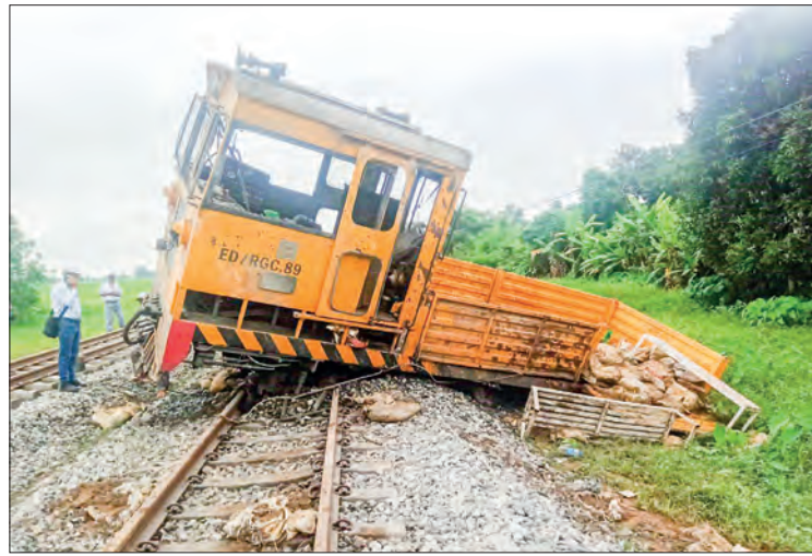
Photos (left & right) show The RGC 89 rail vehicle derailed after a mine blast.

THE RGC89 rail vehicle, which departed for security patrol from Nyaungbintha Station of Pyu Township located on Yangon-Mandalay railway, faced mine-attack yesterday afternoon near Mile Post 132, between the telegraph pillars No