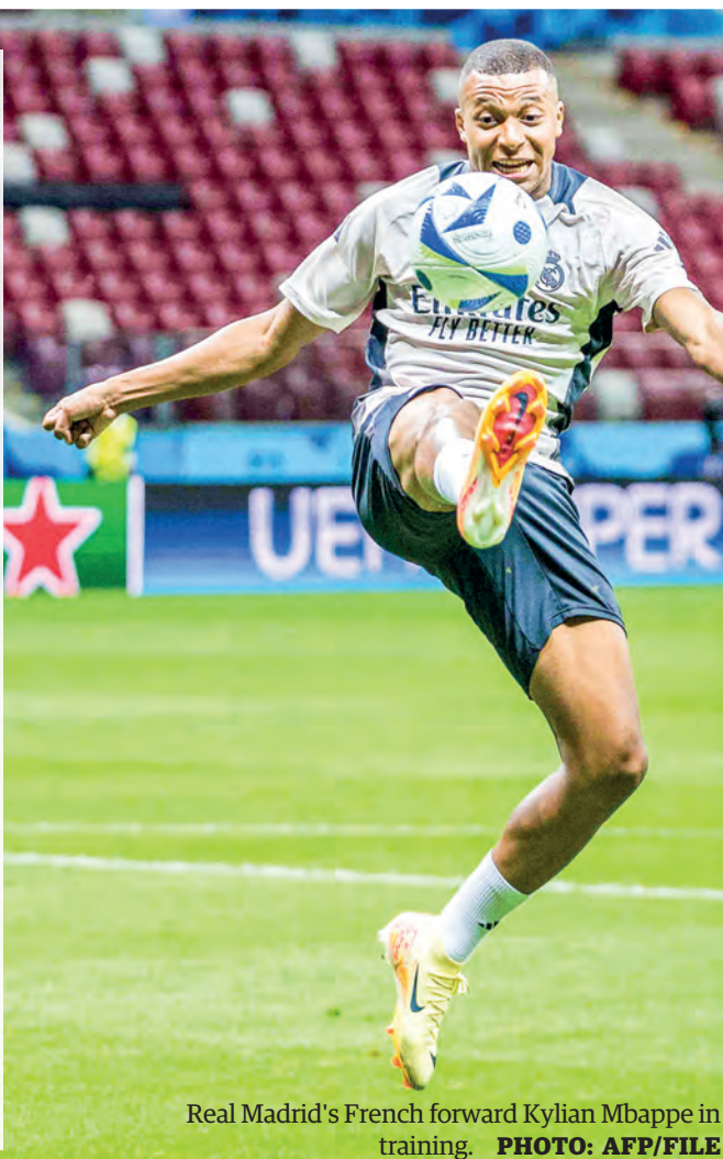
Real Madrid's French forward Kylian Mbappe in training.

"The problem doesn't exist, because we have many games — last year those who played less still brought a lot to the team." — AFP