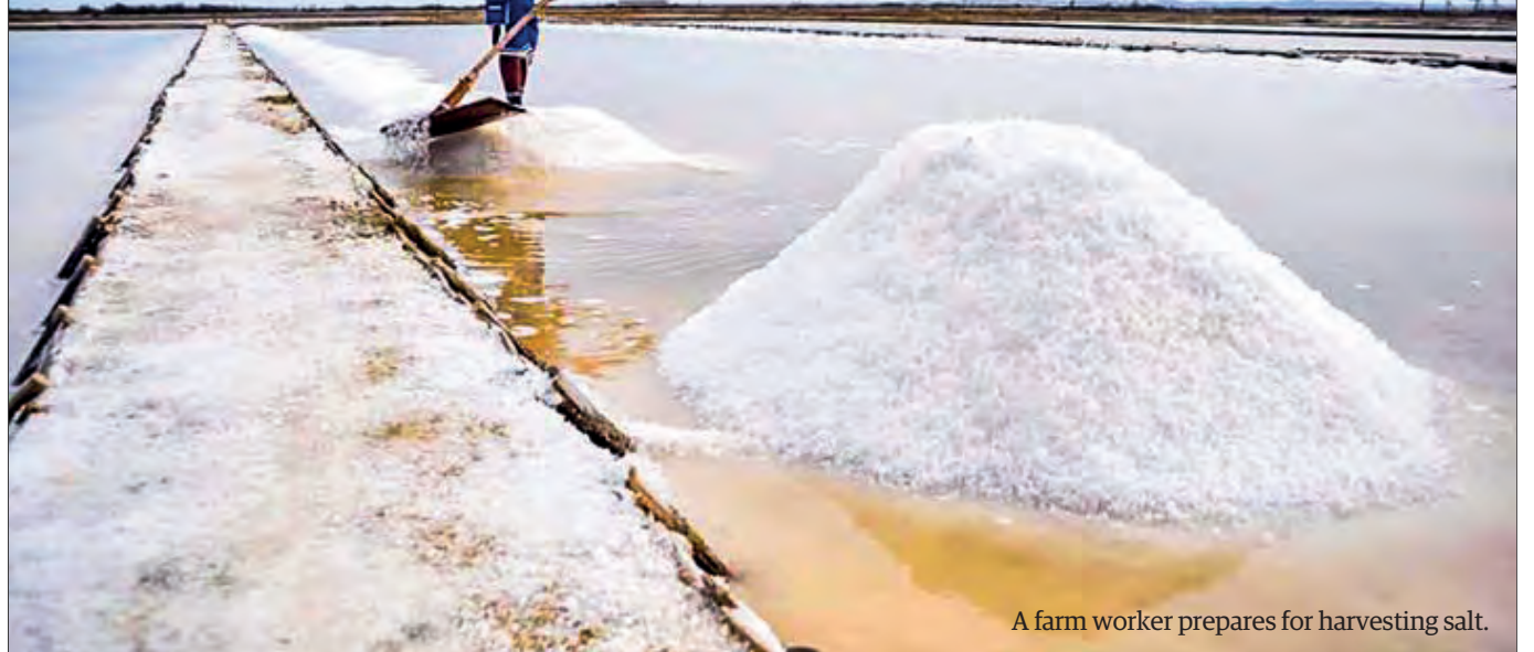
A farm worker prepares for harvesting salt.

In the 2023-2024 salt production season, there were 90 salt producers in Mon State, covering 4,700 acres. The salt output was expected to reach 47,000 tonnes, yet heavy rainfall reduced the yield to 45,000 tonnes. — NN/KK