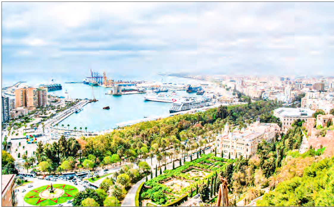
The ongoing war has significantly impacted tourism, leading to decreased visitor numbers and economic losses for regions that once thrived on travel and hospitality. Aerial view of the harbour and old town of Acre, Israel.

The downgrade reflects concerns that the ongoing conflict with Hamas in Gaza might continue into 2025, potentially causing significant economic strain.