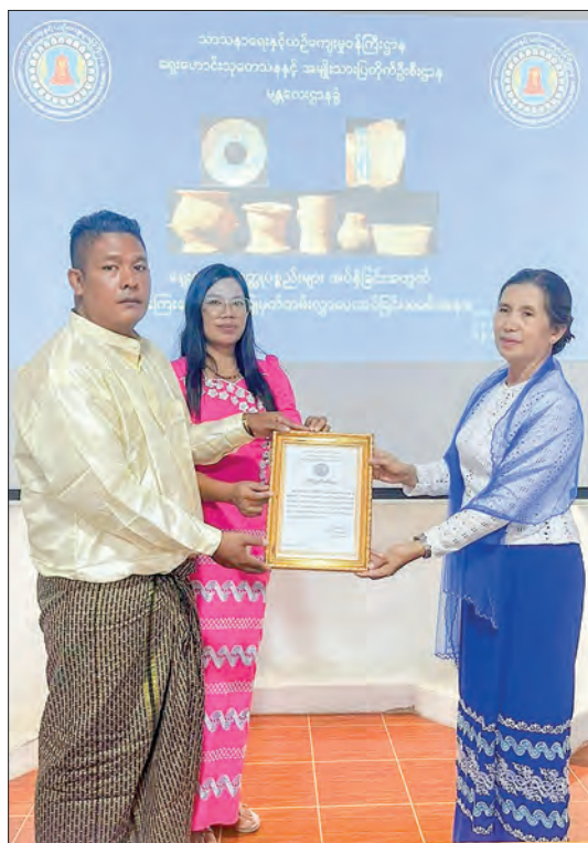
This photo shows an official from the Department of Archaeology and National Museum (Mandalay branch) providing a reward and certificate of honour to a collector for transferring 28 ancient utensils to the department on 13 August 2024.

The Department of Archaeology and the National Museum (Mandalay branch) under the Ministry of Religious Affairs and Culture reported that a reward and certificate of honour were given to a hobby collector who transferred 28 ancient utensils dating back to the Bronze and Iron Ages, to the department on 13 August.