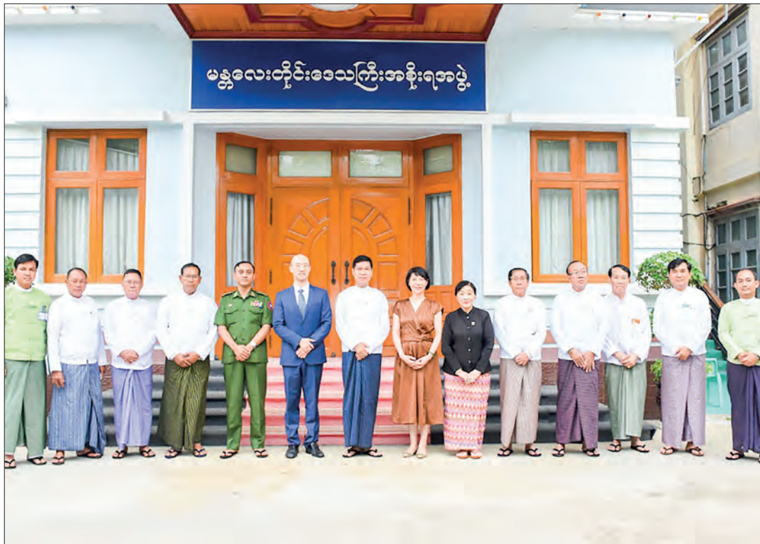
The commemorative group photo at the meeting between Mandalay Region Chief Minister U Myo Aung and Chinese Consul-General in Mandalay Ms Gao Ping yesterday.

Relevant officials of the Mandalay Region government and the Consulate-General of the People's Republic of China in Mandalay were also present at the event. — MNA/KTZH