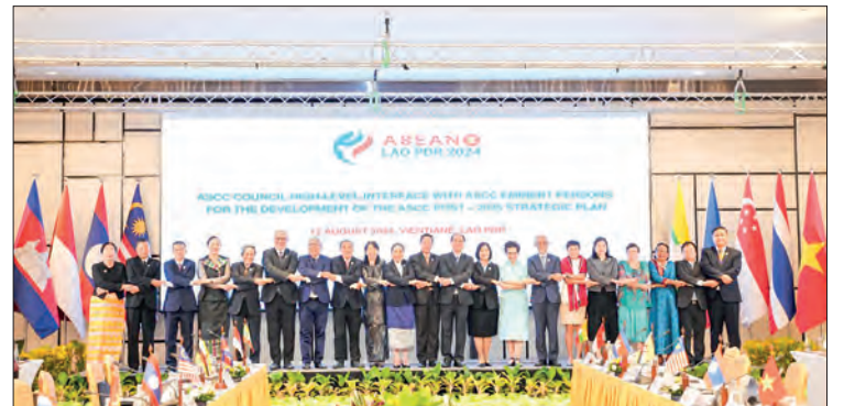
The Myanmar delegation led by Union Minister U Tin Oo Lwin poses for the group photo session at the meeting in Laos.

On the occasion, awards were given to the respective national labour-sending agencies, and Chairman of the Public Overseas Employment Agency (POEA) of Myanmar received an award. — ASH/TMT