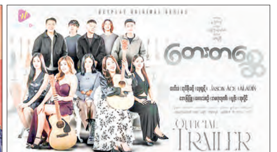
Posters showcase the Myanmar series 'Tay Tasay (Musical Ghost)' and the film 'Patauk Katae Gita' which include most theme songs.

ACCORDING to the Myanmar Motion Pictures Organization (MMPO), it is now necessary to provide proof of copyright ownership or licensing for any theme songs used in their movies or TV series.