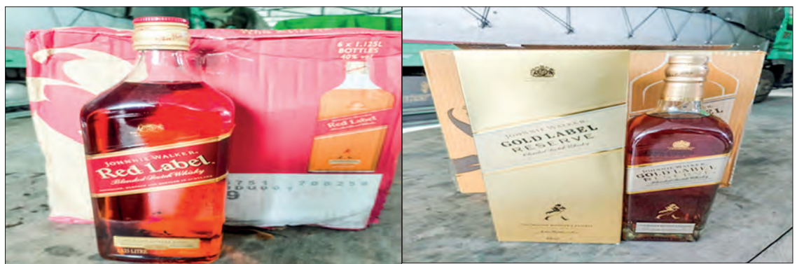
Photos show confiscated illegal goods in states and regions.

Moreover, on the same day, the Magway Region Illegal Trade Eradication Special Task Force seized a Hino truck carrying 0.374 tonne of illegal timber in Setoktara Township, Minbu District, with an estimated value