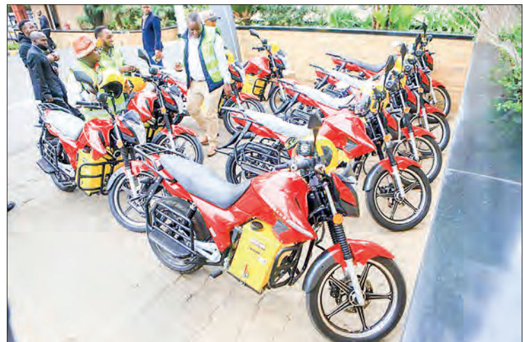
People look at the electric motorbikes during the launch of an e-bike project in Nairobi, capital of Kenya, on 5 July 2023.

“We don’t know how widespread it is.” — AFP