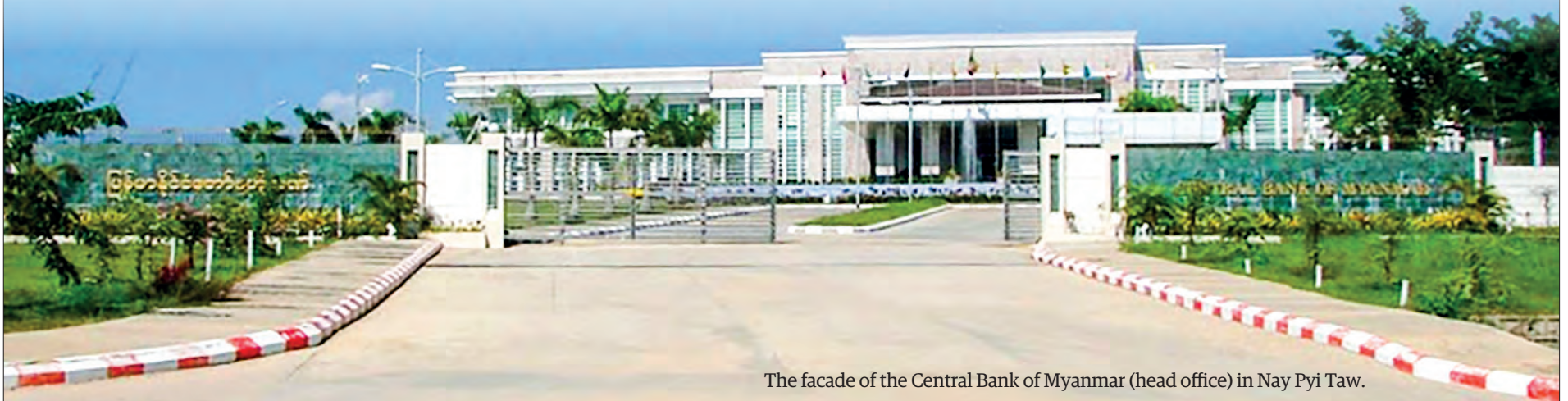
The facade of the Central Bank of Myanmar (head office) in Nay Pyi Taw.

Individuals can enquire about details through the Infrastructure Maintenance Section and email inframaint@cbm.gov.mm . — TWA/KK