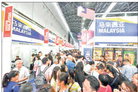
People visit the booth of Malaysia during the 20 th China-ASEAN Expo at Nanning International Convention and Exhibition Centre in Nanning, capital of south China’s Guangxi Zhuang Autonomous Region, 19 September 2023.

MALAYSIA has organized 150 Malaysian enterprises and 10 governmental departments and agencies to participate in the 21 st China-ASEAN Expo, scheduled to be held from 24 to 28 September in Nanning of south China’s Guangxi Zhuang Autonomous