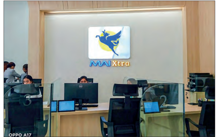
Myanmar's first airline service centre, Shoppe by MAI, is unveiled at the MAI office.

SHOPPE by MAI, Myanmar's first airline service centre, was launched in Yangon yesterday.