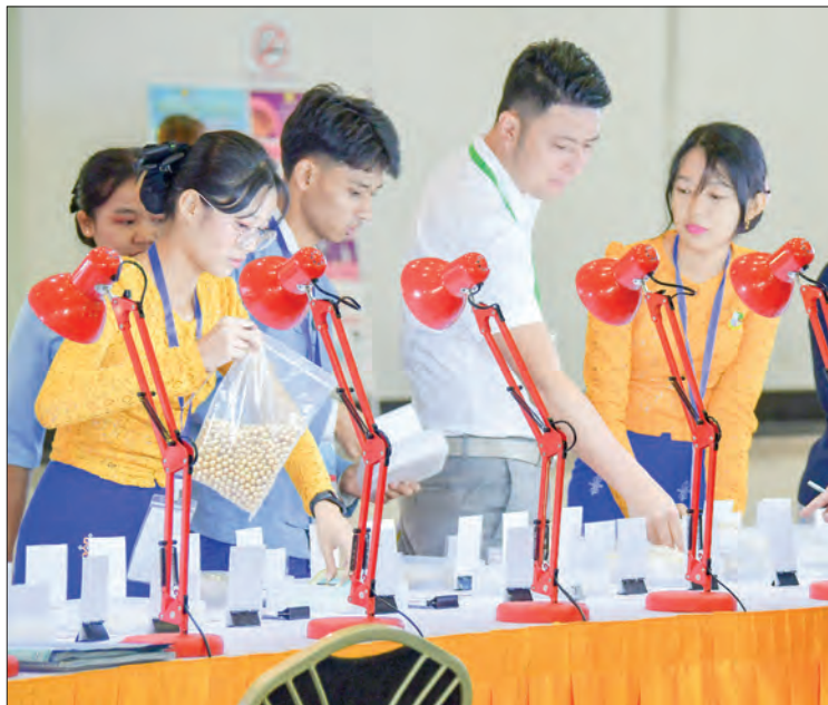
The final day of the 142 nd Myanmar South Sea Pearl Emporium 2024 in progress yesterday in Nay Pyi Taw.

The emporium was held from 12 to 15 August. The 142 nd Myanmar South Sea Pearl Emporium was successfully held by selling 177 out of 230 pearl lots on the second day, 184 out of 230 pearl lots on the third day and 196 out of 240 pearl lots on the fourth day in addition to 14 more pearl lots, respectively, for both local and foreign merchants with the open tender system under the management of Myanmar South Sea Pearl Emporium Committee. — MNA/TRKM