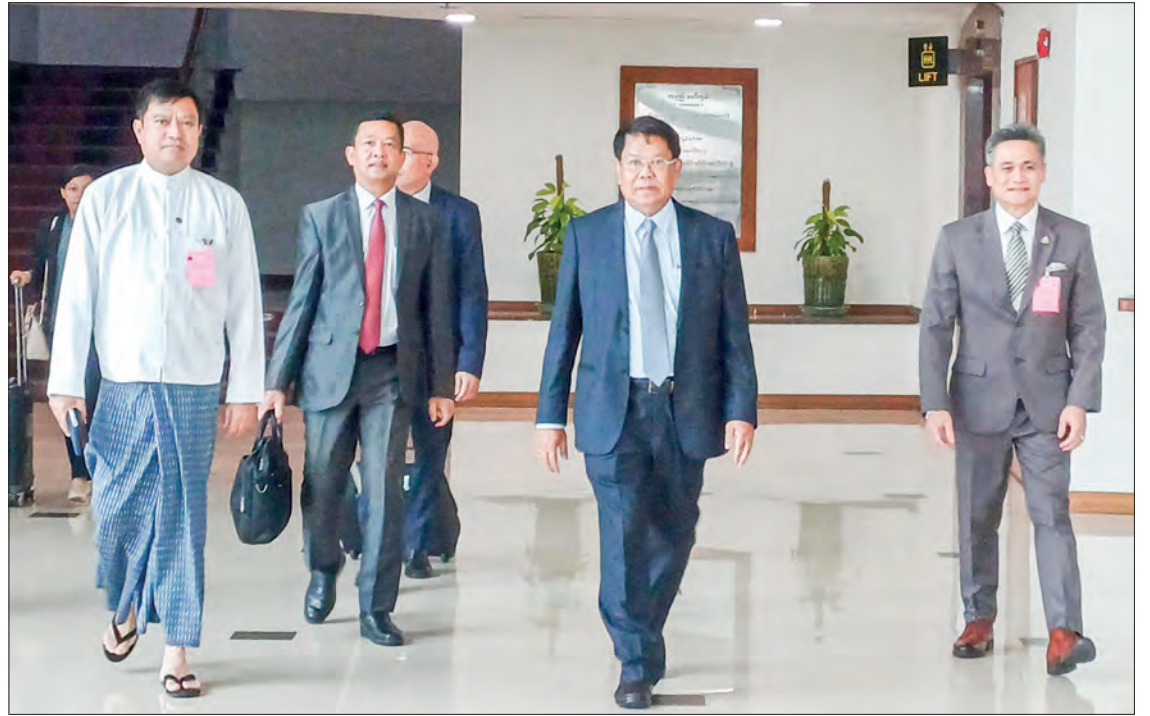
Deputy Prime Minister MoFA Union Minister U Than Swe is seen at the Yangon International Airport yesterday before departing for Thailand.

Chiang Mai. The delegation was seen off at the Yangon International Airport by Ambassador of the Kingdom of Thailand to Myanmar Mr Mongkol Visitstump and senior officials from the Ministry of Foreign Affairs. — MNA