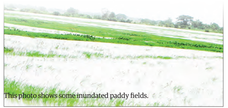
This photo shows some inundated paddy fields.

states that overseas employment seekers shall register themselves as overseas employment seekers at the department for the type of overseas employment for which the department requires compulsory registration, and section 10(b) states that “certificates of registration must be issued to them before leaving for abroad, the ministry said. — MT/ZN