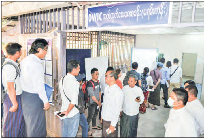
This photo shows the issuance of an Overseas Worker Identification Card (OWIC) at the Yangon Region Office of the Department of Labour at 8 th -Mile, Mayangon Township, Yangon Region, in 2023.

When PV holders are prohibited at the departing airports and border gates, they can suffer unnecessary losses, and to avoid them, they need to apply for PJ from the very