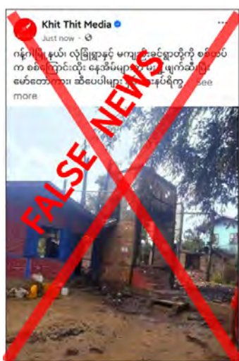
This screenshot validates misinformation.

These false allegations and propaganda are part of ongoing efforts by these malicious news