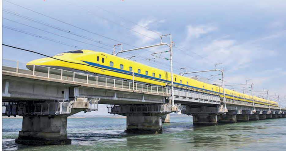
Hundreds of Japanese flights and trains were cancelled Thursday as Typhoon Ampil approached the archipelago, following record rains from Tropical Storm Maria.

The typhoon is expected to affect Tokyo and the Pacific coast over the weekend, disrupting travel during the busy “obon” holiday week.