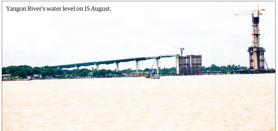
Yangon River's water level on 15 August.

13:30 time measurement, the Sittoung River water level in Toungoo Township was more than 1.5 feet (52 centimetres) below the danger level of 19.69 feet (600 centimetres) in the town. The water of the river may reach the danger level of the city within the next two days; therefore, people living near the river bank and in low-lying areas in Toungoo Township are advised to be extra cautious. — TWA/TKO