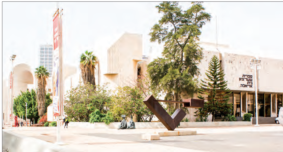
The Tel Aviv Museum of Art.

Notable works by artists like Pablo Picasso and Gustav Klimt were among those relocated after the 7 October attack by Hamas, which sparked the ongoing Gaza war.