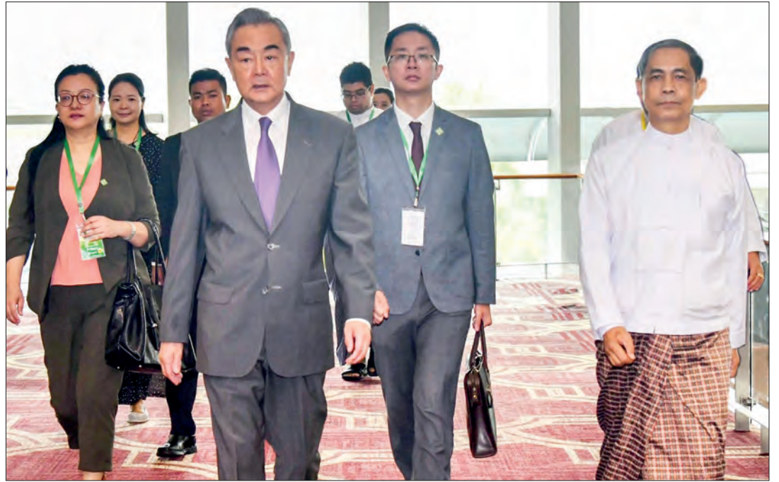
Union Minister U Ko Ko Hlaing sees off the Political Bureau Member of the CPC Central Committee and Minister of Foreign Affairs of the People's Republic of China yesterday.