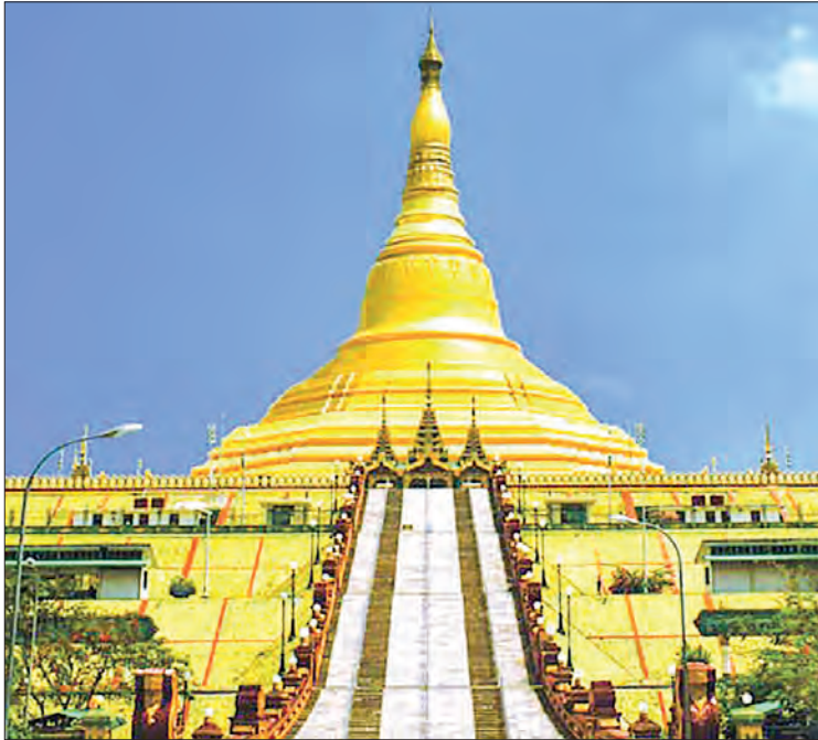
The Uppatasanti Pagoda in Nay Pyi Taw.