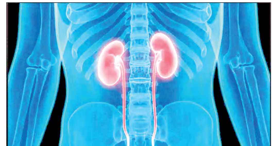
The surgery, performed using a spinal anesthetic rather than general anesthesia, allowed Stackhouse to be discharged just 36 hours later, a significant improvement over the typical recovery time.

After meeting with Nadig and learning about the AWAKE Kidney Program, which