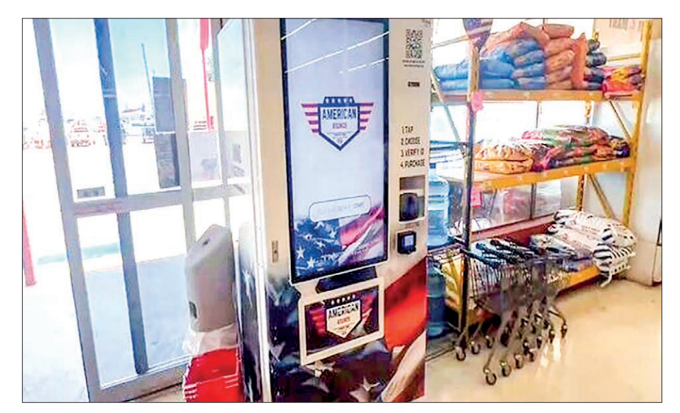
Vending machines selling ammunition have started appearing in grocery stores across Alabama, Texas, and Oklahoma, sparking a range of responses from state officials.

VENDING machines selling ammunition are now appearing in grocery stores across Alabama, Texas, and Oklahoma, stirring mixed reactions from officials in