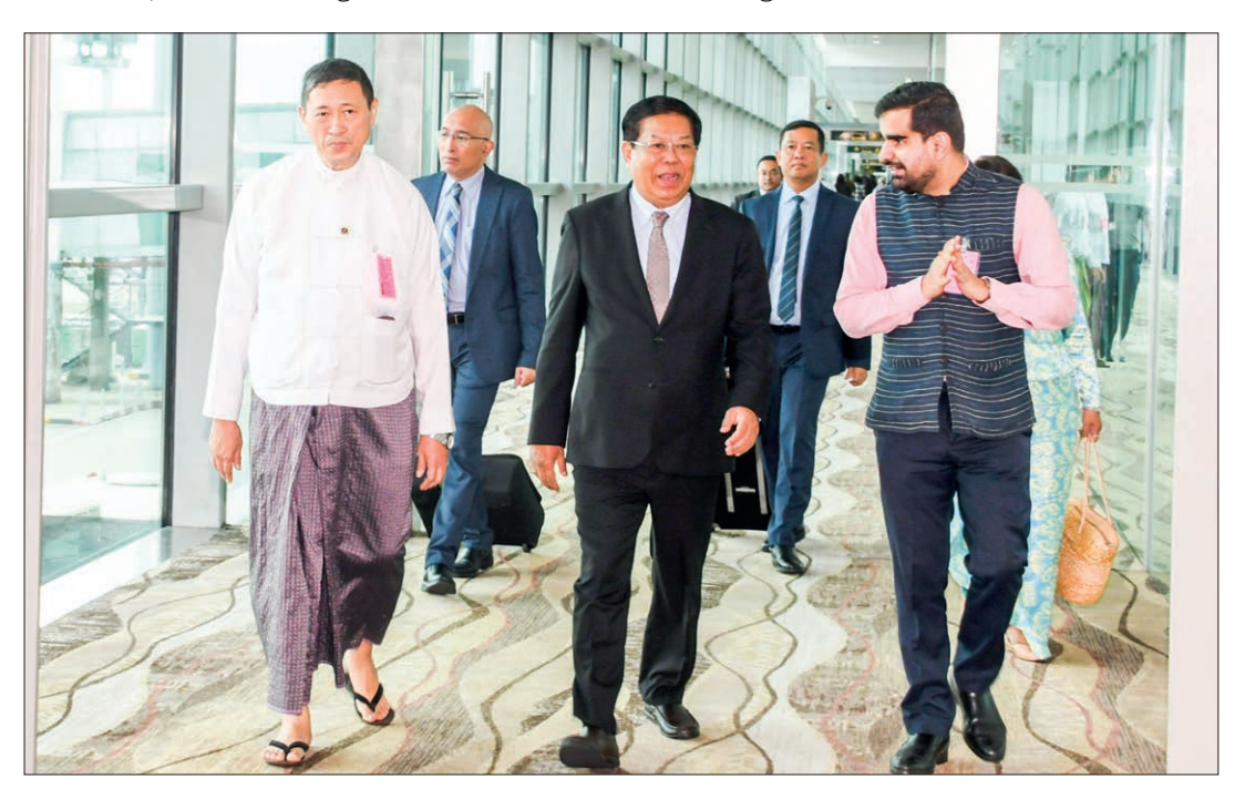
Union\ Minister\ U\ Than\ Swe\ being\ welcomed\ back\ on\ his\ arrival\ at\ Yangon\ International\ Airport\ yesterday.

International Airport by officials from the Ministry of Foreign Affairs and the Embassy of India in Yangon. — MNA