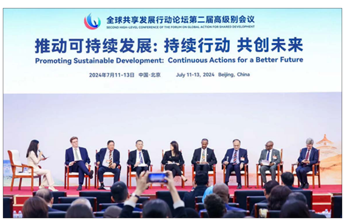
Union Minister for Investment and Foreign Economic Relations Dr Kan Zaw takes part in the Second High-Level Conference of the Forum on Global Action for Shared Development held in Beijing from 11 to 13 July.

On the morning of 12 July, the forum's first day, the Union minister participated in the Interactive Discussion: Joint Actions to Promote Sustainable Development. Ministers from