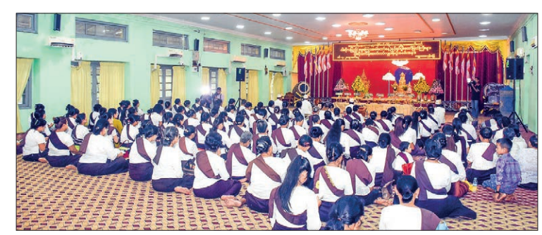
This photo shows the Waso-robe offering ceremony and sermonchanting events.

years for females and two years for males. A female weighing 10 kilogrammes can lay about one million eggs. — Thit Taw/ZS