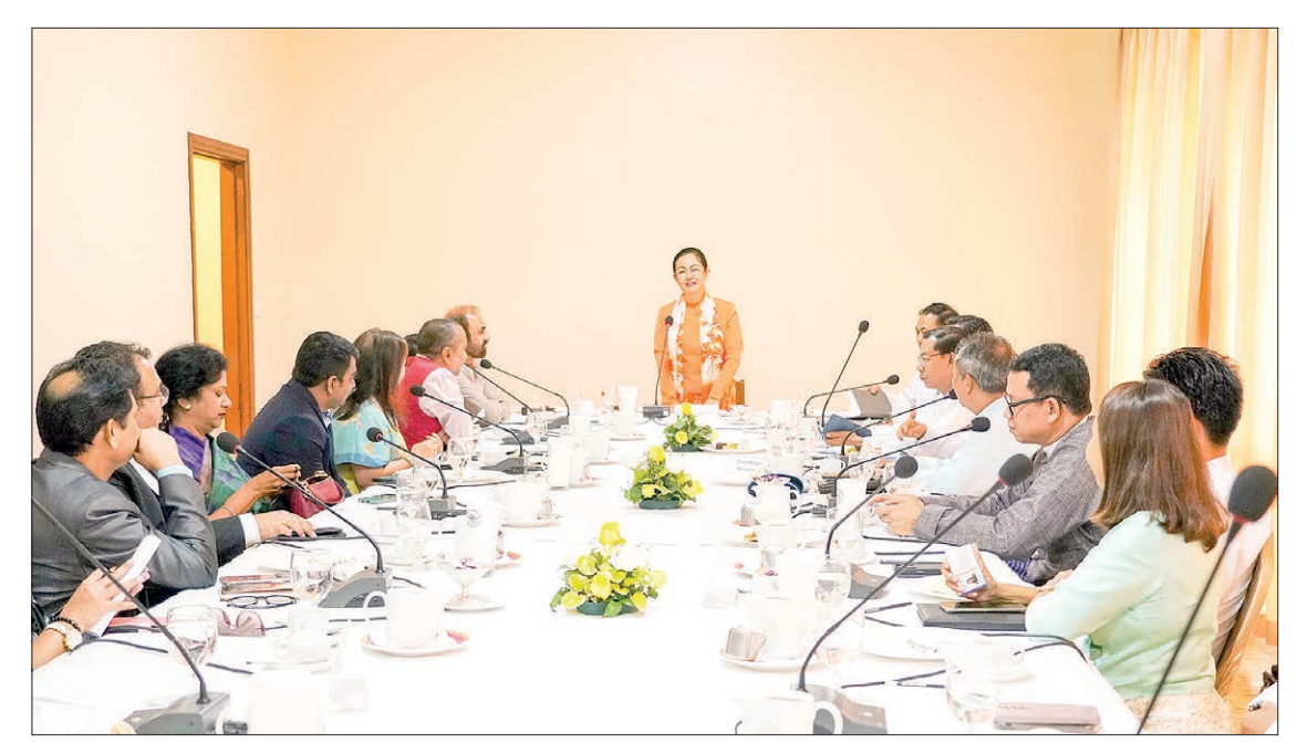
The Myanmar-India Tourism Cooperation Coordination Meeting in progress at Inya Lake Hotel in Yangon yesterday.

Discussions among attendees focused on Myanmar's hotels and tourism sector development, increasing Indian tourist arrivals, operational aspects of domestic and international airlines, Myanmar-India tourism cooperation, and relevant procedural frameworks.