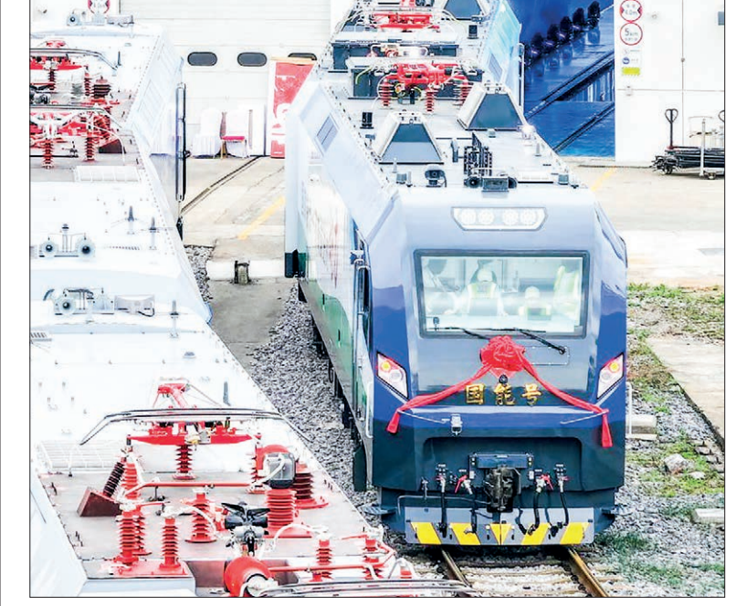
An AI voice interaction system in a heavy-haul electric locomotive streamlines operations, enhances safety, and improves efficiency by leveraging natural language processing and AI capabilities to assist operators in managing complex tasks effectively. An intelligent heavyhaul electric locomotive in Zhuzhou, central China's Hunan Province, 9 May 2024.