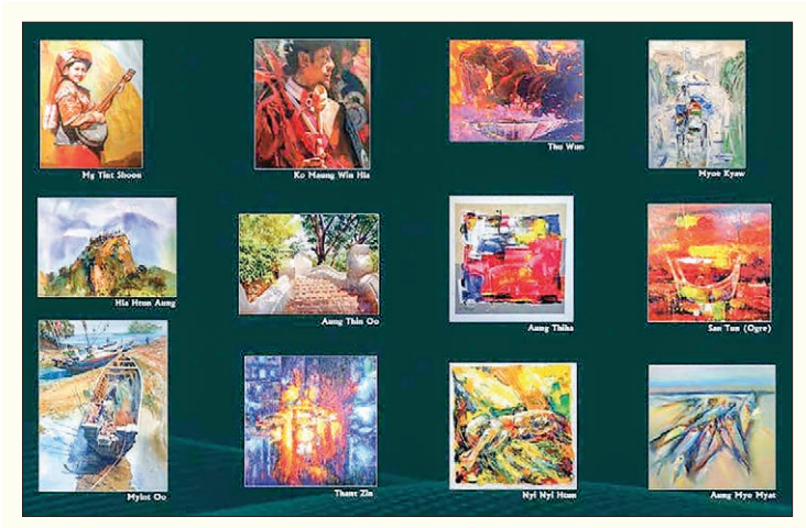
This image showcases the catalogue of paintings for "The Glorification"