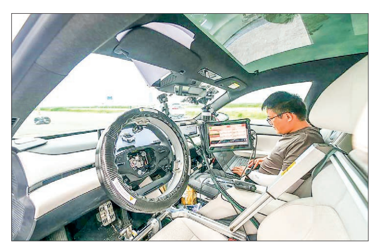
An intelligent connected vehicle tester works before a test at an enclosed test field in Tianjin, north China, 14 June 2024.

The profession "intelligent connected vehicle tester" was listed as one of 19 new professions by the Ministry of Human Resources and Social Security earlier this year. — Xinhua