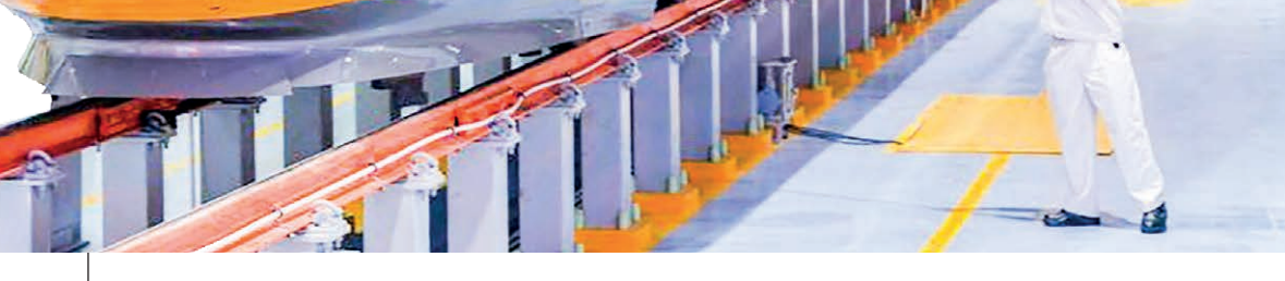
A staff member cleans a comprehensive inspection train at a workshop for the Jakarta-Bandung High-Speed Railway in Bandung, Indonesia, 21 June 2023.

The aircraft stopped on a grassy area beyond the concrete runway, causing the airport's closure, and forcing incoming flights to be diverted to other airports. PAL said it is working with related authorities to restore normal operations in Busuanga airport. The Civil Aviation Authority of the Philippines is expected to investigate the incident. —Xinhua