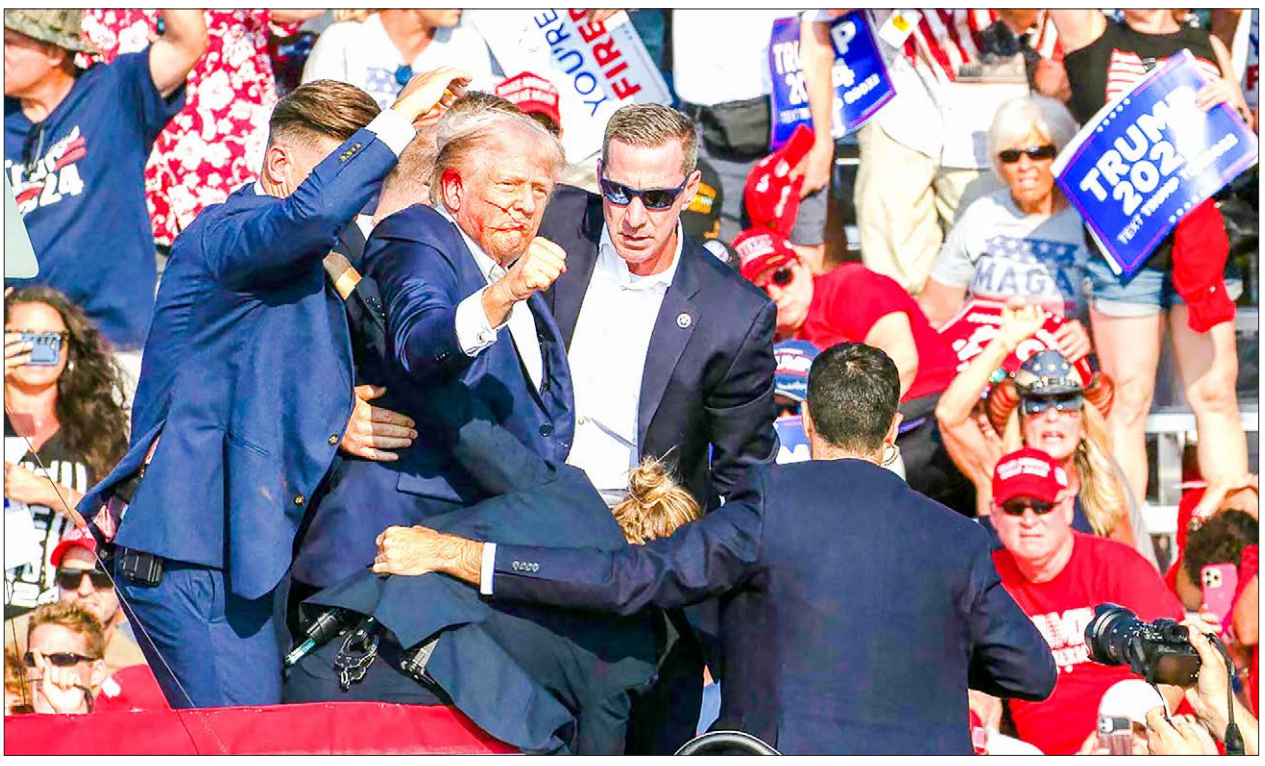
Donald Trump is seen with blood on his face surrounded by secret service agents as he is taken off the stage at a campaign event at Butler Farm Show Inc. in Butler, Pennsylvania, 13 July 2024.

The attack has heightened political tensions ahead of the presidential election. Various world leaders expressed shock and condemnation.