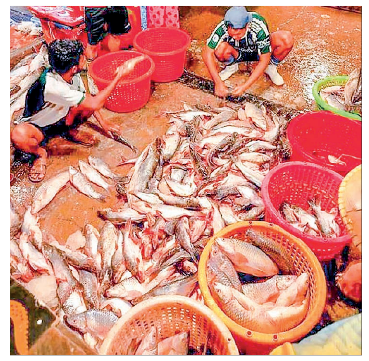
This photo shows rohus being displayed for sale in the market.

Thailand species river catfish farming was initiated in