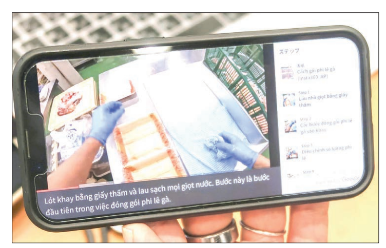
Studist Corp, a Tokyo-based software provider, has launched "Teachme AI," a new AI-driven software designed to simplify the creation of instructional videos for foreign workers in Japan.

This initiative aims to alleviate the challenges faced by companies amidst Japan's growing labour shortages and aging population.