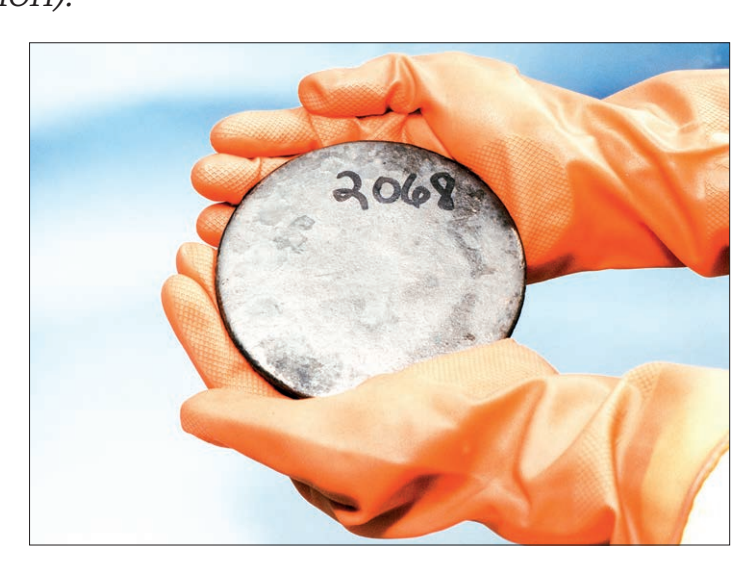
Uzbekistan's uranium production has surged by 12 per cent in the first half of this year.

Russia signed an agreement on the construction of a small nuclear power plant in Uzbekinten