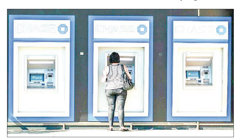
JPMorgan Chase and Citi experienced higher credit costs in the second quarter, reflecting greater stress on lower-income consumers.

Barnum offered measured optimism on the economy, saying conditions remain broadly positive, while noting persistent big-picture risks that include geopolitical instability and the chance that inflation and interest rate will stay high. — AFP