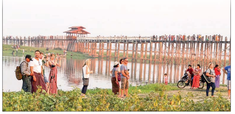
Some foreign tourists visiting Myanmar.