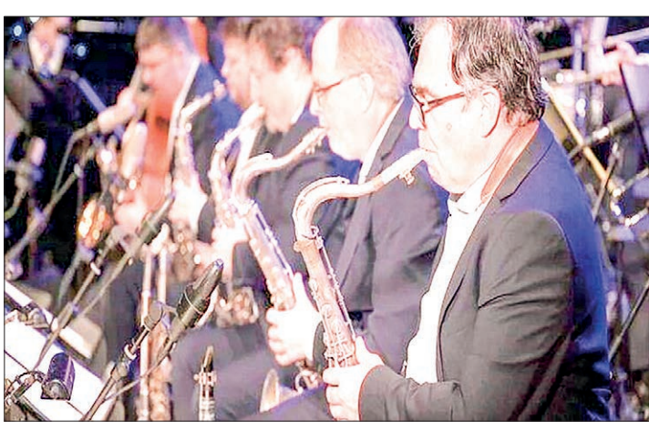
Abu Dhabi's selection underscores its status as a UNESCO Creative City of Music and highlights its rich cultural heritage.

Classical instruments like Oud, Qanoon and Ney will introduce global audiences to 'Arabic Jazz'. As the 2025 Global Host City, Abu Dhabi,