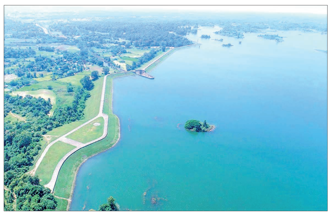
This photo shows the North Nawin Dam which distributes irrigated water to monsoon paddy field in Pyay Township.

"In Pyay District, where drought conditions prevail, ensuring sufficient water for planting is critical. Agriculture remains Myanmar's key economic sector, and our ability to provide timely irrigation sup-