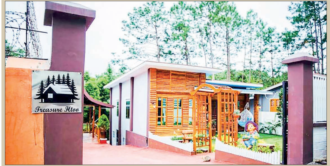
Guest house of homestays in Kalaw.