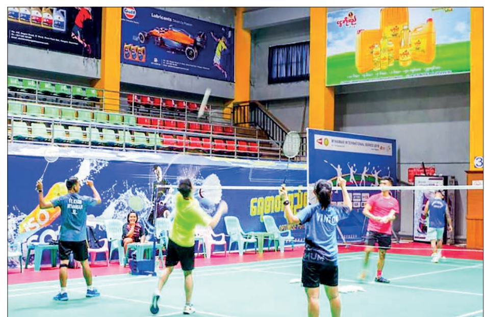
Badminton players show up skills at the National Badminton Court in Yangon.