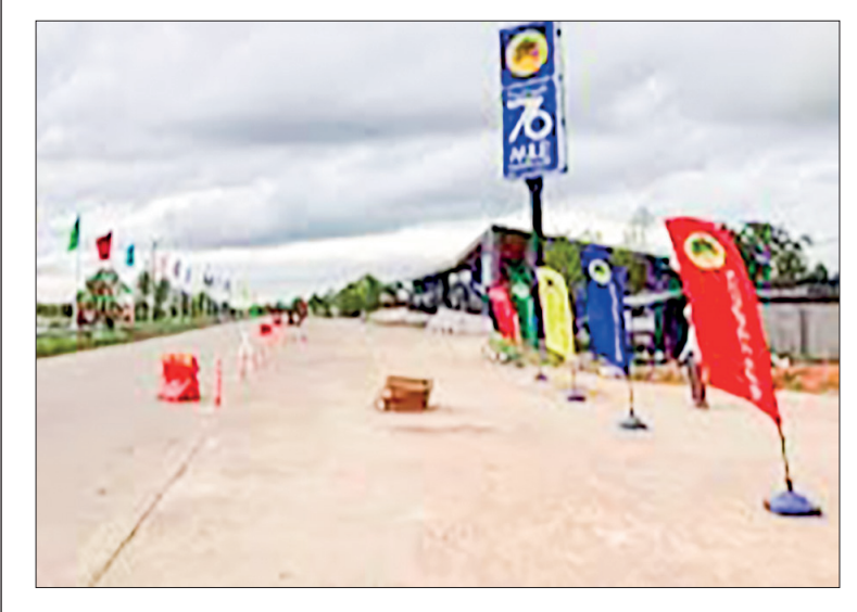
Photo depicts 76th-Mile and 115th-Mile Mini Rest Camps on the Yangon-Mandalay Expressway.

Tender applications must be submitted during office hours on 9 August. The ministry will inform applicants of the date and time for the adjudication of tenders. — TWA/TH