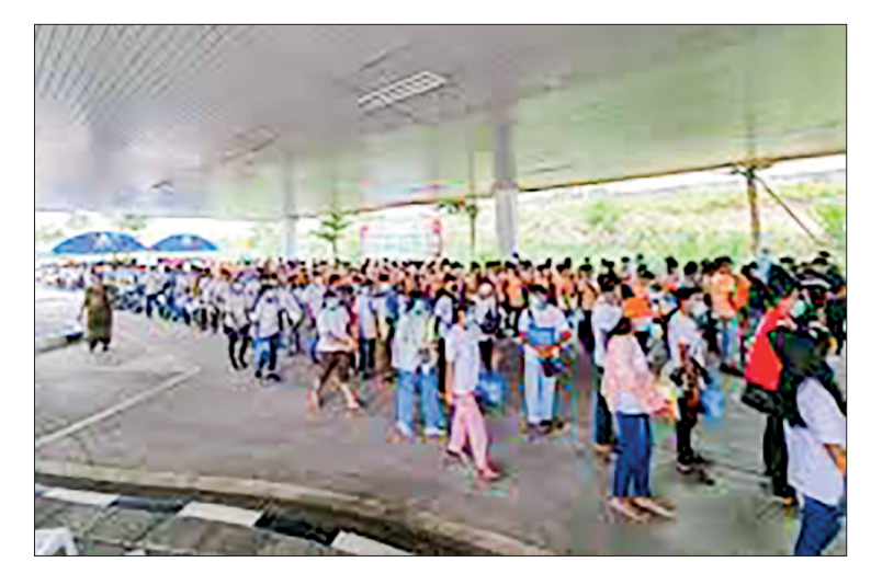
Photo taken last year shows Myanmar workers who are going to work in