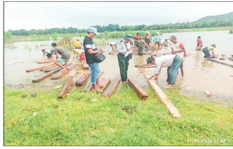
Pieces of confiscated illegal teak in Bago Region.

In Pyay District on 13 July, the on-duty team managed by Bago Region Illegal Trade Eradication Special Task Force seized 9.331 tonnes of illegal teak, estimated to be worth K5,164,256. Action is being taken under the Customs procedures.