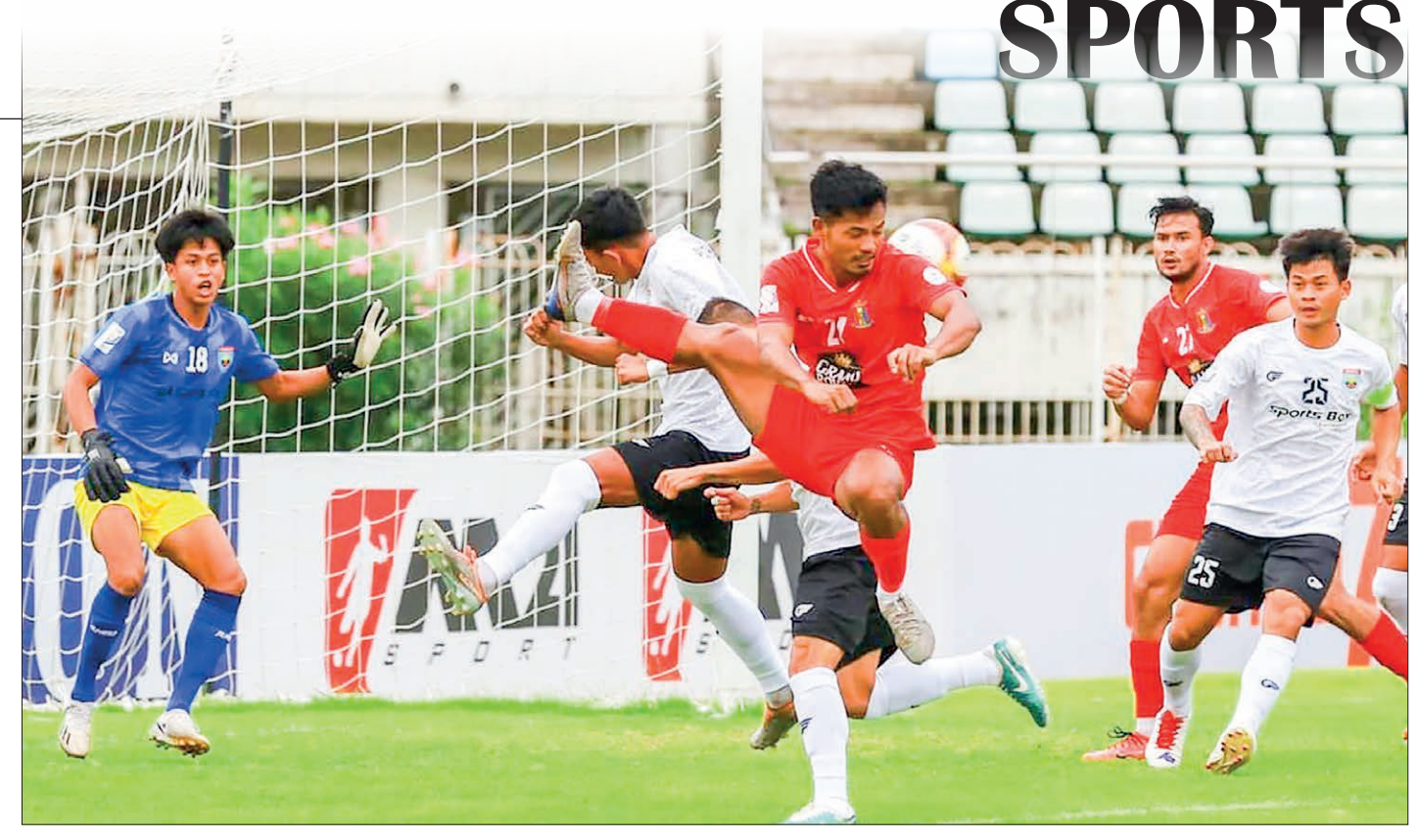
The Hanthawady United player vies for the pass against Thitsar Arman player during the Myanmar National League match at Thuwunna Youth Training Centre in Yangon on 14 July 2024.

They have already eliminated several of the continent's heavy-weights while winning all six matches en route to the final as they aim to become European champions for a record fourth time, after 1964, 2008 and 2012. — AFP