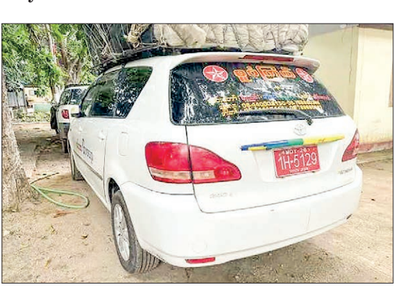
A confiscated vehicle in Sagaing.

In Myanaung Township on 12 July, the on-duty team managed by the Ayeyawady Region Illegal Trade Eradication Special Task Force confiscated 0.504 tonne of illegal teak and 0.265 tonne of illegal timbers, estimated to be worth K151,094. Action is being taken under the Forest Law.