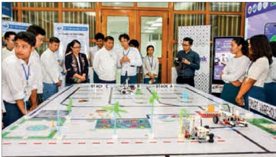
A glimpse of the scenes from the opening event of the Digital Talent & Career Fair/Scholarship Programme (India).

The event features booths of 10 job-seeking companies, interviews and scholarship programmes for the Professional Diploma in Java Programming Course (India).