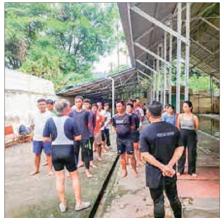
Training for flood disaster relief in action.

them. We train them what to do in the water and what to avoid. The most important thing is that the rescuers do not become second victims. That is why we are practising together,” she said. — Thit Taw/ZN