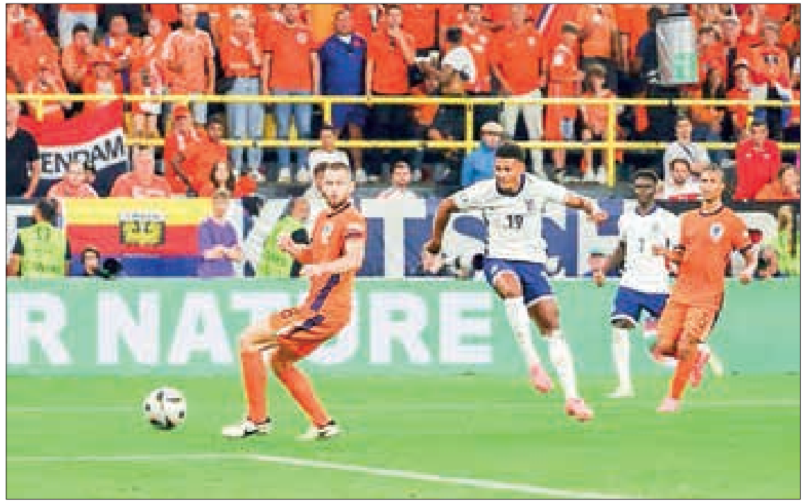
Please England do not leave the goals till the last minute jokes delighted King Charles III.

I am sure the stresses on the nation's collective heart rate and blood pressure would be greatly alleviated!" he said.