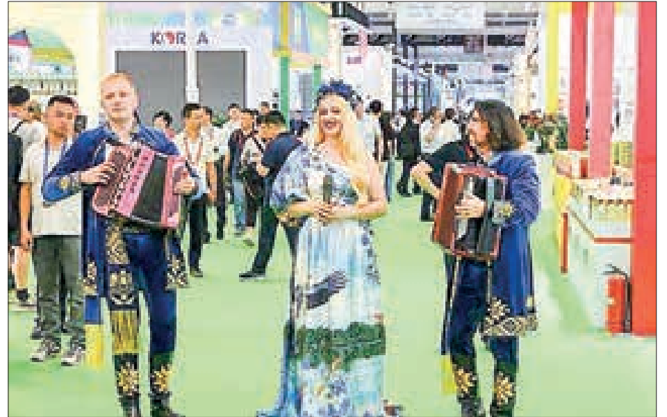
A Belarusian band performs before the Belarus booth during the 30 th China Lanzhou Investment and Trade Fair in Lanzhou, northwest China's Gansu Province, 6 July 2024.