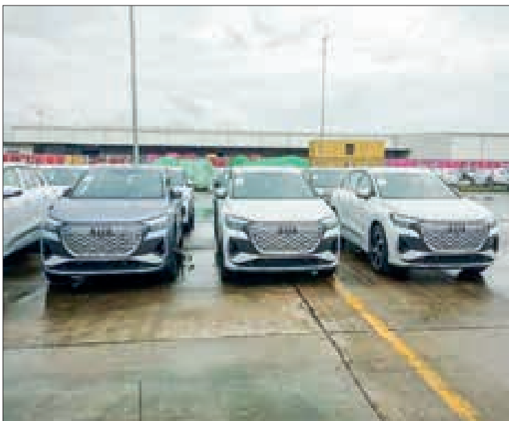
The newly arrival of battery electric cars seen at Yangon Port.

WITH the approval of the Steering Committee on National-level Development for Electric Vehicles and Related Industries, KIA EV-6 imported by Super Seven Stars Motors Industry Co Ltd whereas Faw Audi and Q4 E Tron-40 by Win Motor Myanmar Co Ltd, Dongfeng Nissan by Asia Pacific Automaker