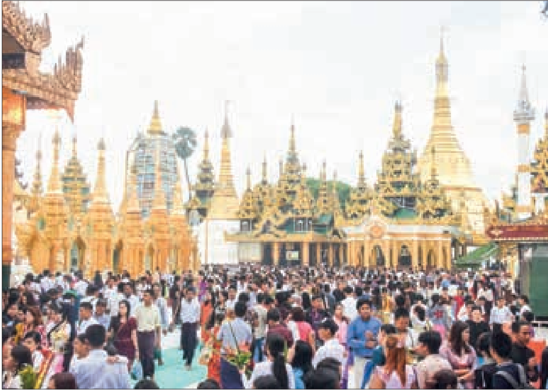
This picture depicts the Shwedagon Pagoda being thronged with pilgrims.