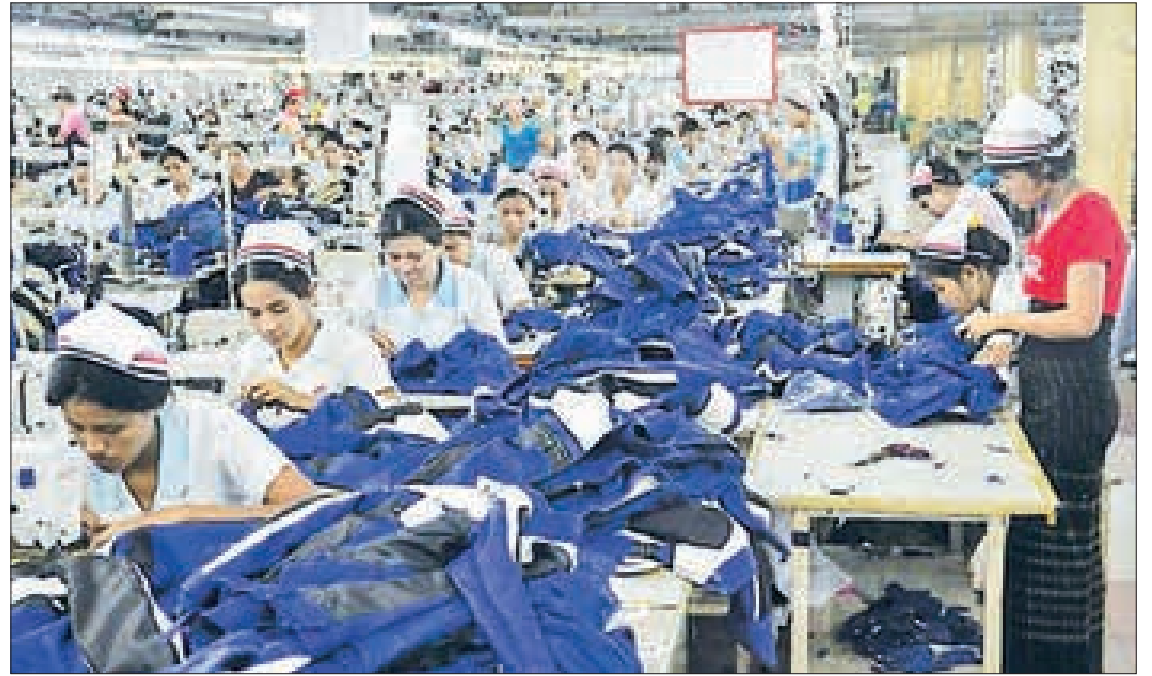
Workers sew garments at the manufacturing facility.