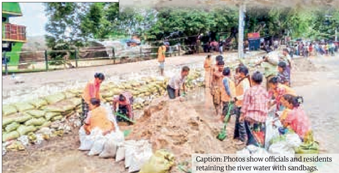
Caption: Photos show officials and residents retaining the river water with sandbags.

According to the weather forecast by the Department of Meteorology and Hydrology on 11 July, the Chindwin River will rise about 1-1.5 feet above existing levels in Mingin, Kani and Monywa townships and fall about 12-14 feet below existing levels in Kalewa, Maw-