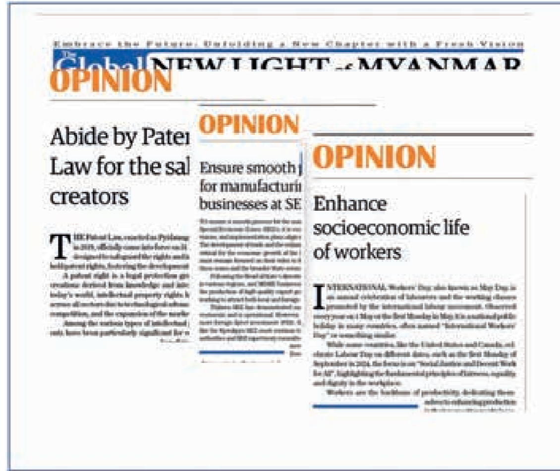
Editorials from The Global New Light of Myanmar.

During my early studies, I consistently ranked first in English in monthly examinations. Living in a rural area meant access to English books was limited to school textbooks. After completing sixth Grade, I delved into my sister's seventh-grade English textbook to prepare for the upcoming school term. I meticulously studied its comprehension passages and completed all exercises diligently throughout the entire summer break, along with revising my previous English composition exercises.