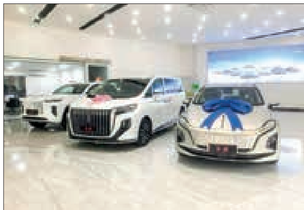
Chinese-made Hongqi electric vehicles are displayed at a showroom in Phnom Penh, Cambodia on 11 September 2023.

have gained momentum in Cambodia, as more and more people are interested in using them," the news release said. "Using EVs saves on fuel costs, with low or zero emissions."