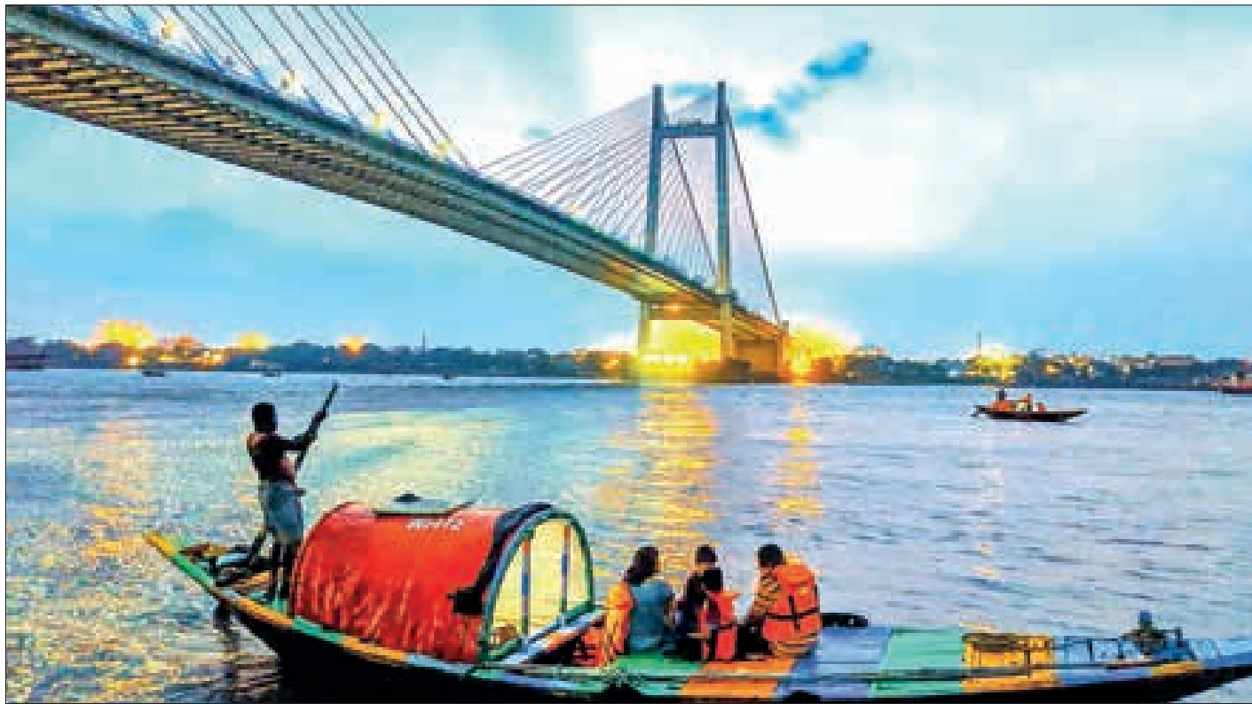
BIMSTEC focuses on regional grouping, sectoral cooperation, and people-to-people exchange. Howrah bridge and the tourists passing below. An iconic landmark in Kolkata, the Howrah Bridge is a huge steel bridge over the Hooghly River. It is considered to be one of the longest cantilever bridges in the world.

Jaishankar emphasized the need to swiftly enhance regional cooperation, acknowledging the importance of open and candid exchange of ideas among member nations.