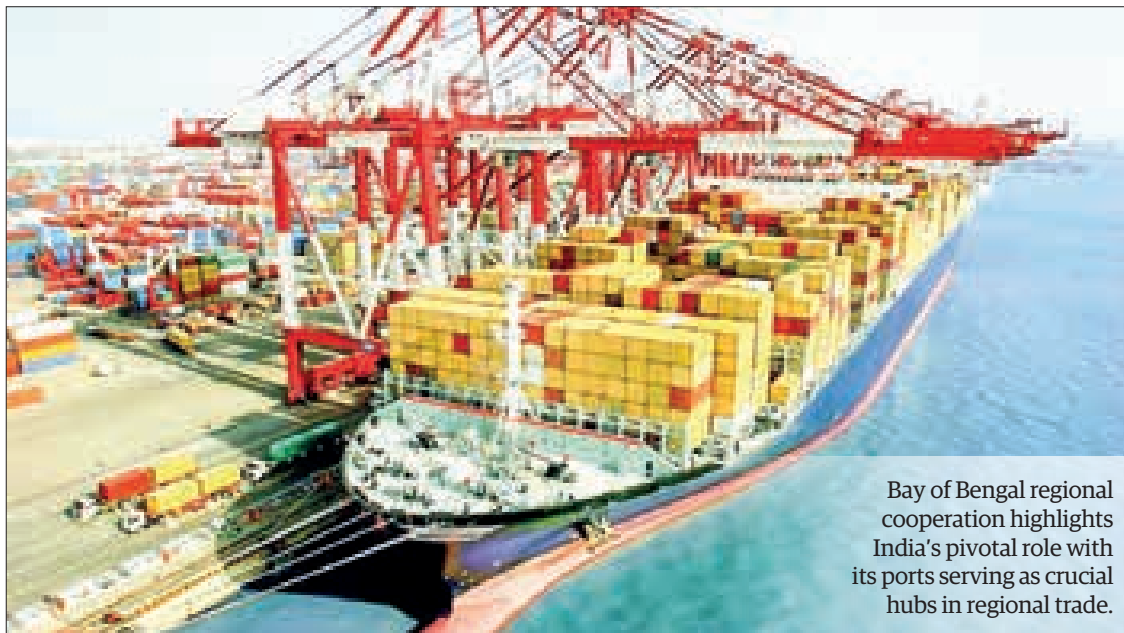
Bay of Bengal regional cooperation highlights India's pivotal role with its ports serving as crucial hubs in regional trade.

This event will gather Foreign Ministers from BIMSTEC nations to discuss and enhance cooperation across various sectors such as security, connectivity, trade, investment, and people-to-people contacts in the Bay of Bengal region and its littoral.