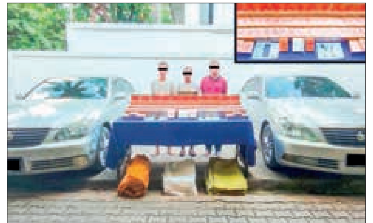
Three offenders seen alongside confiscated heroin and vehicles.

A total of 300 blocks of heroin weighing 105 kilogrammes worth over K1.5 billion was impounded in Tachilek, Shan State (East), as stated by the Myanmar Police Force.