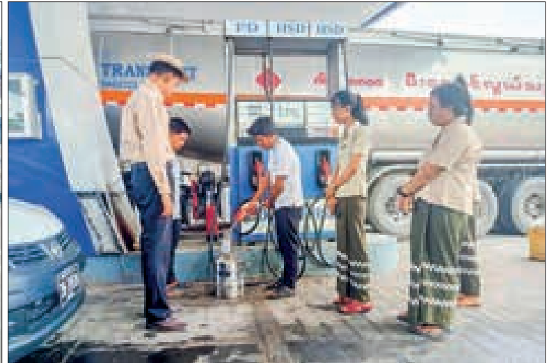
Photos (L & R) show surprise inspections in progress at Yangon's petrol stations.

in Nay Pyi Taw, Yangon, and Mandalay Regions, as well as