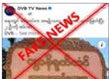
The screenshot validates misinformation.