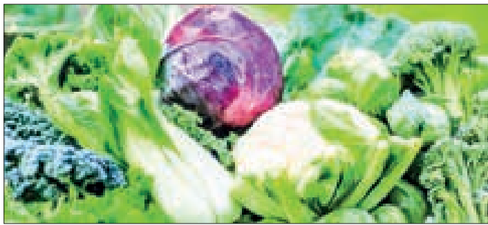
The figures rose from $843.6 million recorded in the corresponding period last FY, showing a sharp increase of $549.426 million.

cultural produce, animal products, minerals, forest products, and finished industrial goods through maritime and border trade channels. At the same time, it imports capital goods, intermediate goods, raw materials imported by the CMP enterprises and consumer goods.