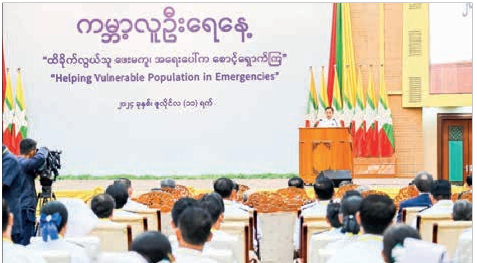
State Administration Council Vice-Chairman Deputy Prime Minister Vice-Senior General Soe Win addresses the 2024 World Population Day ceremony yesterday.

He continued that the majority of developing countries are experiencing a lesser number of children, a shortage of labour and an increasing number of older persons due to a remarkable decline in birth rates. At the same time, some developing countries and least developed countries are also facing high birth rates, lower standards of education, a larger