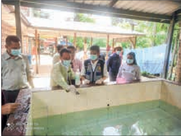
The prevention of severe diarrhoea underway in the markets of Tamway Township on 10 July.

The Ministry of Health stated that there have been 115 patients with diarrhoea as of 10 July.