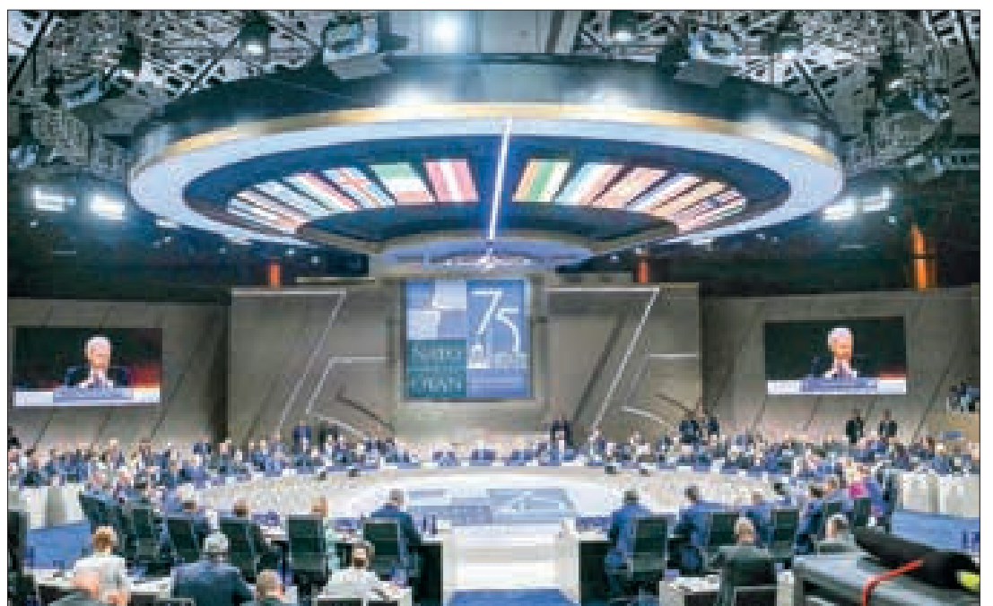
NATO heads of state meet during the NATO 75 th anniversary summit at the Walter E Washington Convention Centre in Washington DC, on 10 July 2024.

CHINA deplors and strongly opposes the Washington summit declaration of the North Atlantic Treaty Organization (NATO), which hypes up tensions in the Asia-Pacific region and is full of bellicose remarks with a Cold War mentality, a Chinese foreign ministry