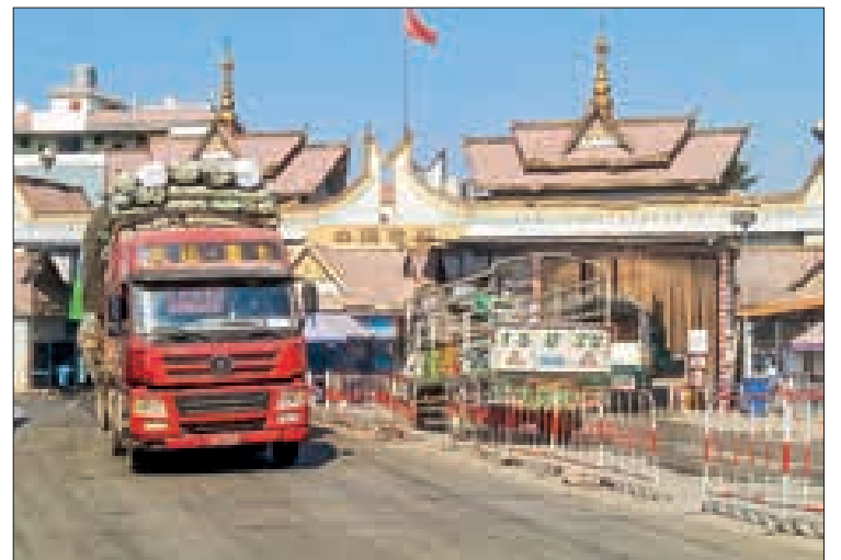
Trucks are seen at the Myanmar-China border.

Myanmar exports agricultural products, animal products, minerals, forest products, and finished industrial goods, while it imports capital goods, intermediate goods, raw materials imported by the CMP enterprises and consumer goods. — TWA/KK