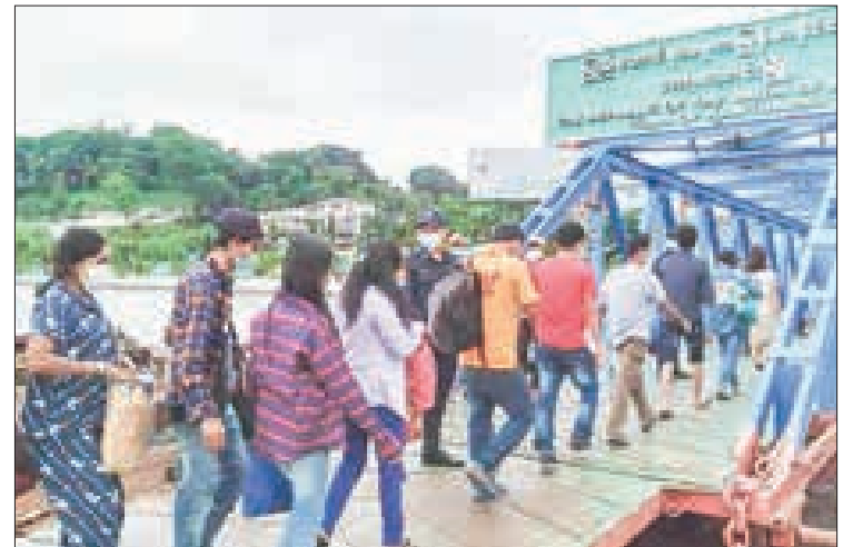
Myanmar migrant workers are seen at the Kawthoung jetty.

In addition, these listings play an important role and thus the agencies should follow them with respect, it said. According to reports published by Safe Migration on 9 June, there are 565 licensed overseas employment agencies in Myanmar. — MT/ZN