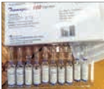
Confiscated illegal items.

On 10 July, a combined team under the Yangon Region Illegal Trade Eradication Special Task Force inspected and seized an unregistered Nissan Wingroad vehicle worth approximately K3.5 million near Yan-