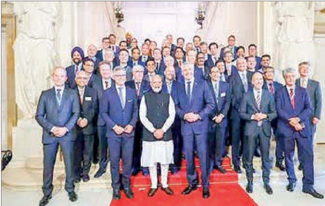
Prime Minister Narendra Modi invited Austrian companies to invest in India across sectors such as infrastructure, renewable energy, green technologies, fintech, and innovation.

DURING his official visit to the European nation, Prime Minister Narendra Modi has invited Austrian companies to invest in India, to strengthen the economic ties between the