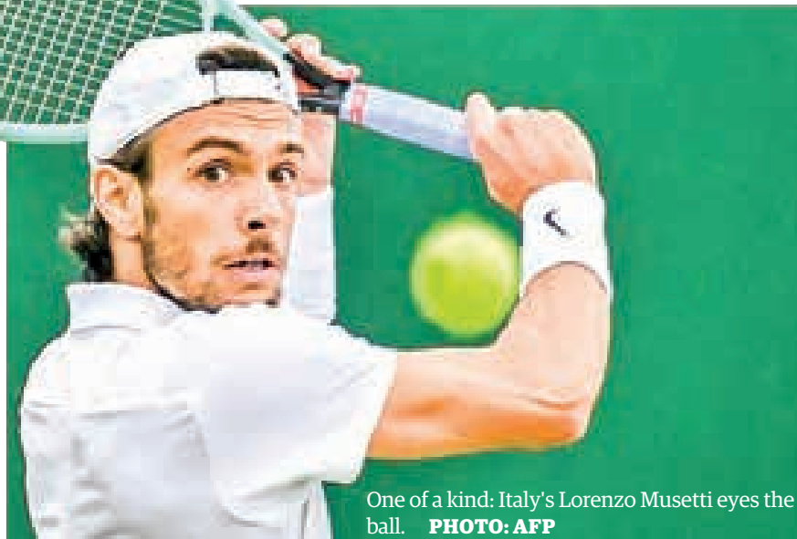
One of a kind: Italy's Lorenzo Musetti eyes the ball.

It had carried Pete Sampras and Roger Federer to 15 Wimbledon titles between them and was the weapon of choice for Stan Wawrinka when he captured three majors. Federer described the absence of one-handers in the top 10 as a "dagger" to the sport.