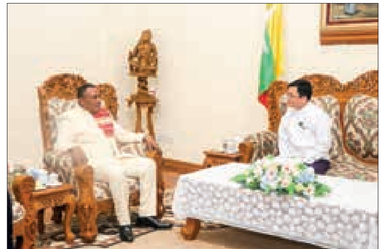
Union Minister U Myint Kyaing receives the Ethiopian ambassador yesterday.

U Myint Kyaing, Union Minister for Immigration and Population, met Mr Daba Debele Hunde, Ambassador of the Federal Democratic Republic of Ethiopia in Nay Pyi Taw yesterday.