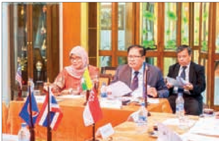
Myanmar Ambassador to Bangladesh U Kyaw Soe Moe taking part in the 59 th ADC meeting.

ACCORDING to the Ministry of Foreign Affairs, Myanmar Ambassador to Bangladesh U Kyaw Soe Moe participated in