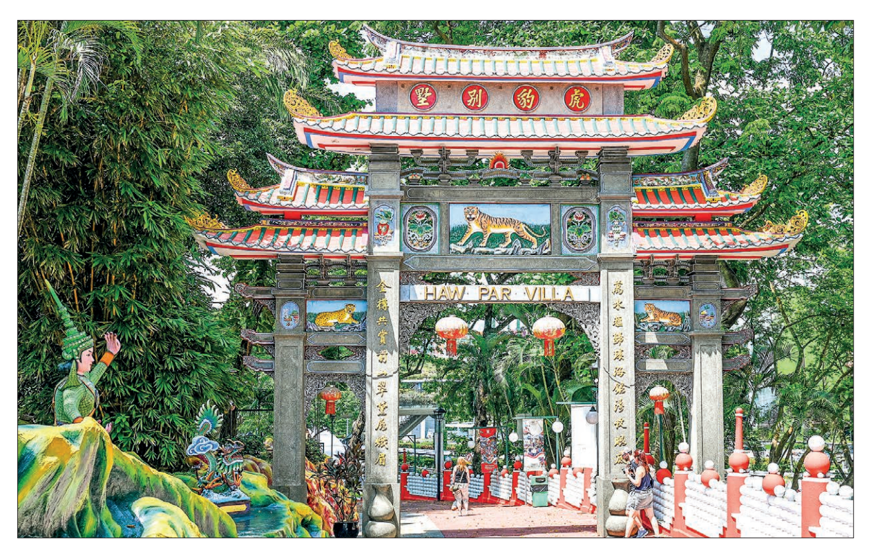
This photo taken on 1 May 2024 shows visitors entering Haw Par Villa, an Asian cultural park which features Chinese folklore, legend and mythology in Singapore.

GORY grottos with demons impaling sinners on stakes and people drowning in a pool of blood are not part of your average theme park experience.