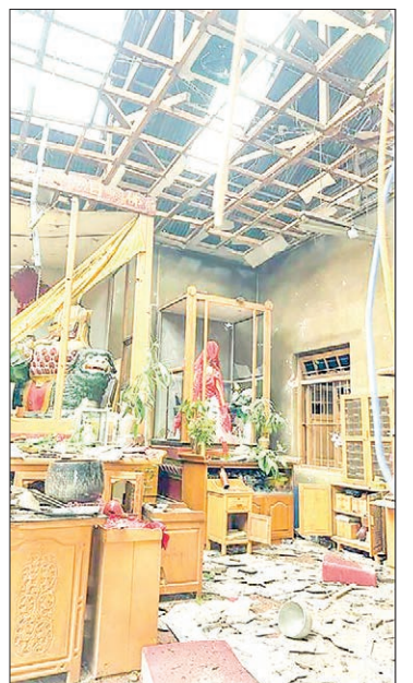
Debris and damage are seen in the aftermath of the terrorist attack.