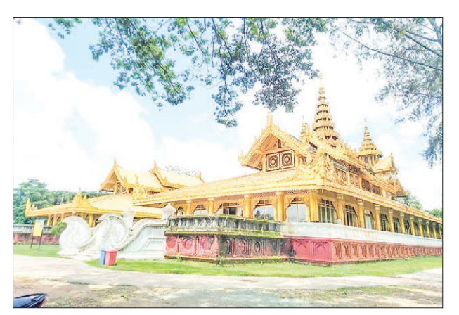
Some tourist destinations in Bago Region.

The Shwemawdaw Pagoda, the Kyaikpun Pagoda, the Shwethalyaung Reclining Buddha Image, and the Kanbawzathadi Palace are popular attractions for both domestic and foreign tourists. Foreign visitors typically arrive in group tours with packages rather than individually. — ASH/MKKS