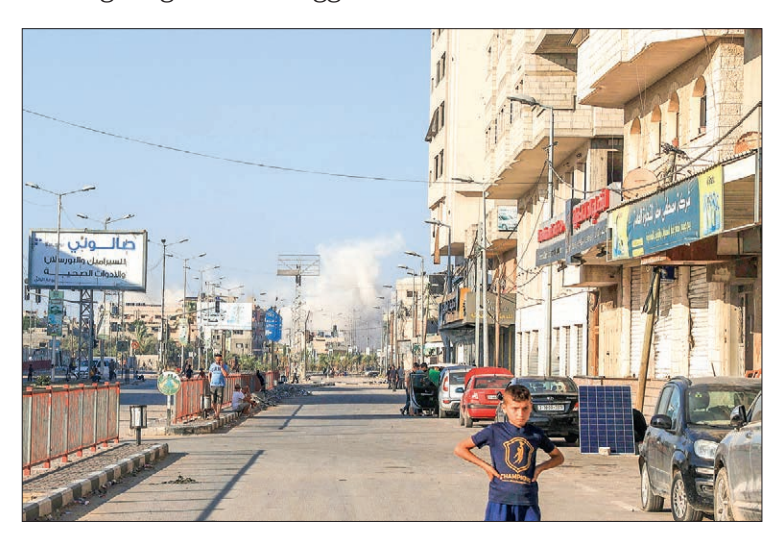
A picture taken from al-Bureij refugee camp in the central Gaza Strip shows smoke billowing after Israeli bombardment in the Wadi Gaza (Gaza Valley) area on 8 July 2024 amid the ongoing conflict between Israel and the Palestinian Hamas militant group.

A source with knowledge of the talks said CIA director William Burns and Israel's Mossad