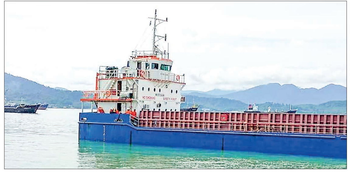
The image show one of the cargo vessels cruising through Yangon-Kawthoung-Ranong marine route.

Currently, Myawady and Phayathonsu, Kayah State's