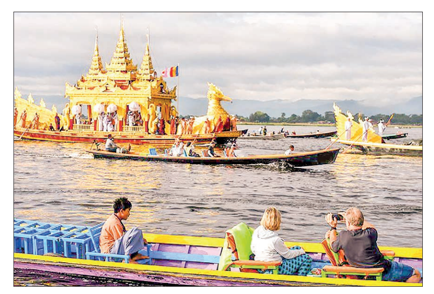
LET'S Travel Easily, a local travel company, announced plans for an instalment payment system to help