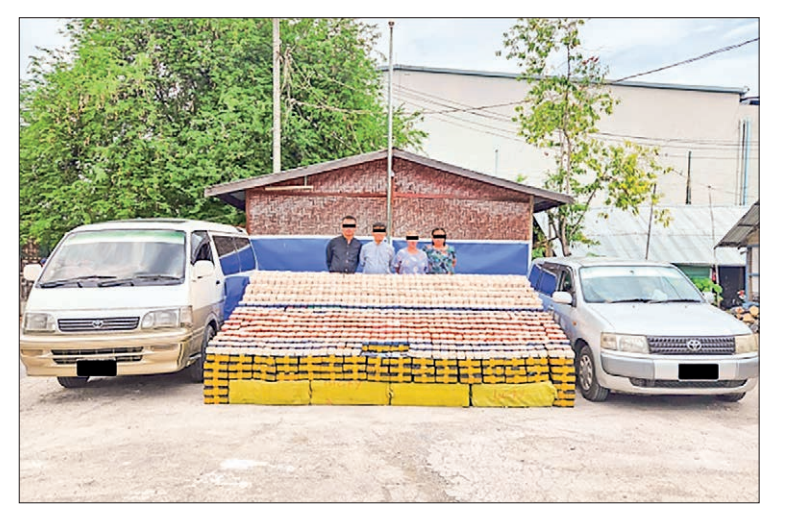
Four arrestees are seen alongside seized drugs and vehicles.

Legal action has been taken against them, and the perpetrators of chain crimes are being investigated.