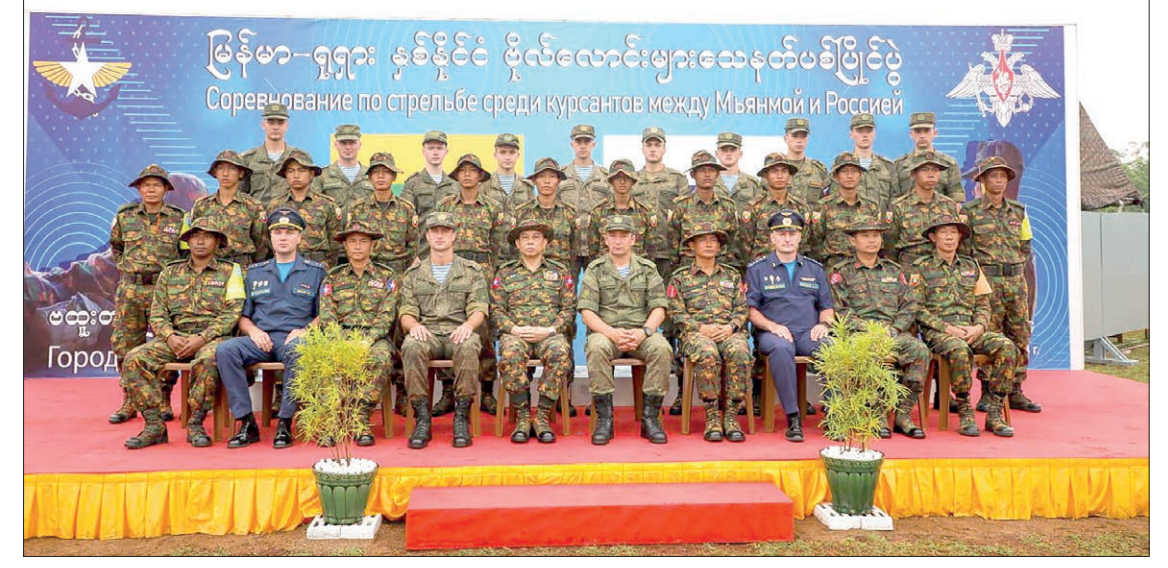
A documentary group photo (above) of the Myanmar-Russia Cadet Shooting Competition and the competition is in action (right below) on 7-9 July.

Competition at 600 metres ASE-AN shooting range of Tatmadaw (Army) Officer Training School (Bahtoo) from 7 to 9 July.