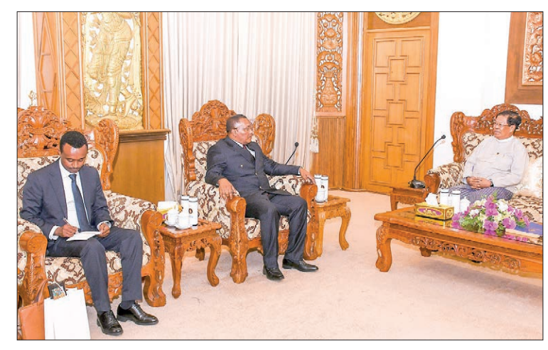
Ethiopian Ambassador Mr Daba Debele Hunde calls on Deputy Prime Minister MoFA Union Minister U Than Swe yesterday.

Deputy Minister for Foreign Affairs U Lwin Oo also received Mr Daba Debele Hunde, Ambassador-designate of Ethiopia to Myanmar, separately yesterday at the Ministry of Foreign Affairs in Nay Pyi Taw. — MNA