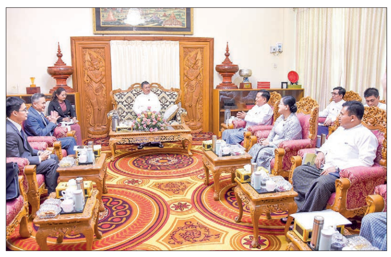
Union Minister U Tin Oo Lwin receives Thai Ambassador Mr Mongkol Visitstump yesterday.

UNION Minister for Religious Affairs and Culture U Tin Oo Lwin received Mr Mongkol Visitstump, Thai Ambassador to Myanmar, at the ministry in Nay Pyi Taw yesterday.