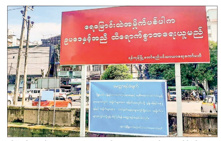
This photo shows a warning sign that says not to throw rubbish in drains.

ACCORDING to the Yangon City Development Committee, more signposts have been erected in the townships, urging the public to dispose of rubbish properly.