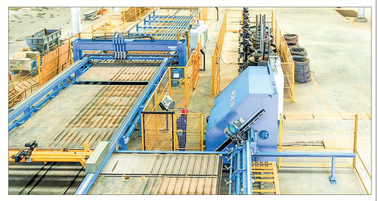
A staff member works at a workshop of China Wu Yi (Kenya) Precast Company Limited in the industrial town of Athi River, Kenya on 17 May 2024.

ABOUT 30 kilometres southeast of Nairobi, the Kenyan capital, China Wu Yi (Kenya) Precast Company Limited has built an expansive factory for new building technologies, causing ripples in the local construction