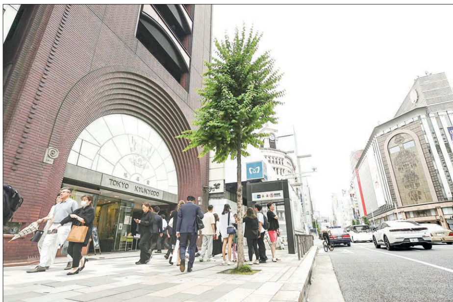
The land in front of Kyukyodo stationery store in Tokyo's Ginza shopping district, the most expensive area in Japan for the 39 th year, is pictured on 25 June 2024.

showed that among prefectural capitals, 37 saw land prices in their prime locations increase, with those in