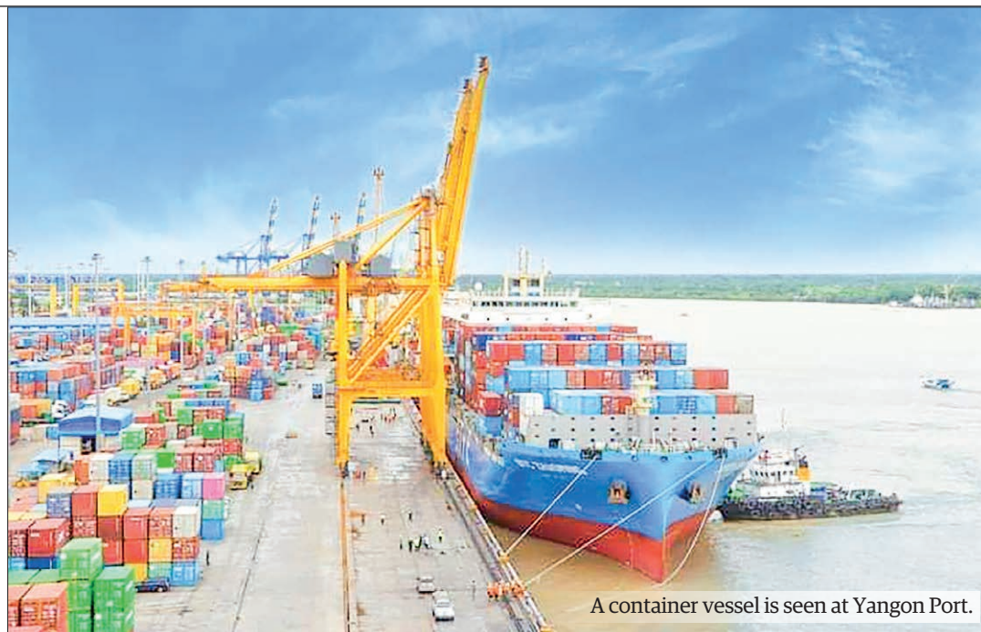
A container vessel is seen at Yangon Port.