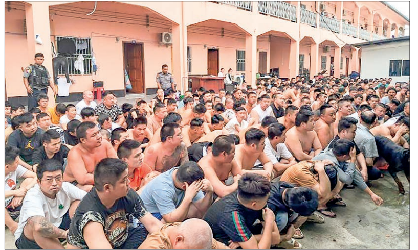
Photos (L & R) show undocumented Chinese nationals being arrested for online gambling in Tachilek.