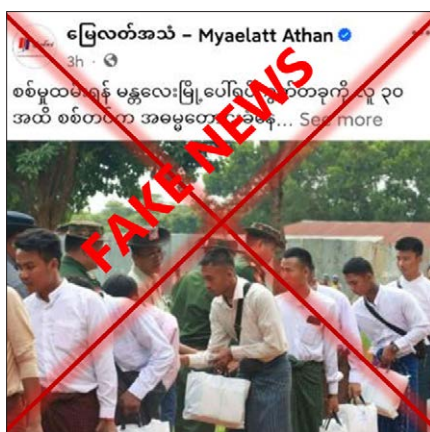
The screenshot validates misinformation.

Since the implementation of the People's Military Service Law, there have been reports of misinformation circulating on social media. These unsubstantiated claims, likely spread by