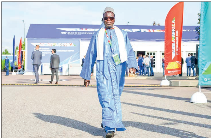
2 nd Russia-Africa Summit and Economic and Humanitarian Forum. A participant at the ExpoForum Congress and Exhibition Centre.

THE increasing global interest in Africa, particularly from China and Russia, will boost economic growth on the con-