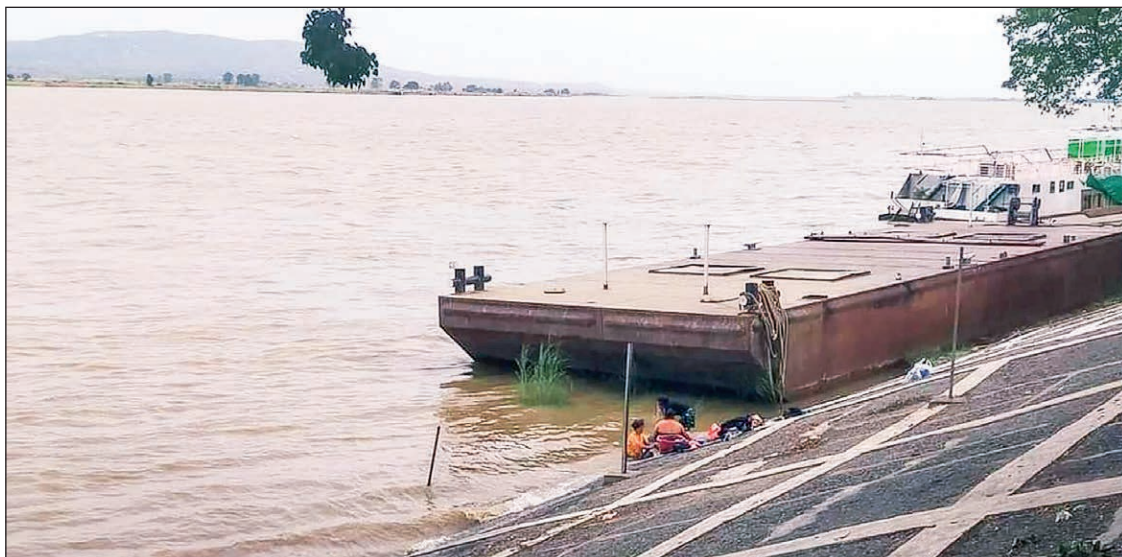
The Mandalay Jetty is seen amid the rising water level in the Ayeyawady River yesterday.

"The river water level at Mandalay Jetty may decline within one or two days, but it might increase later on 3 July. The Department of Meteorology and Hydrology also released a statement saying the river water level can increase six to 10 feet within the first ten days of July," he continued. The Meteorology and Hydrology releases flood warnings in a timely manner so that the public can carry out necessary preparations. — Min Htet Aung (Mandalay Sub-printing House)/KTZH