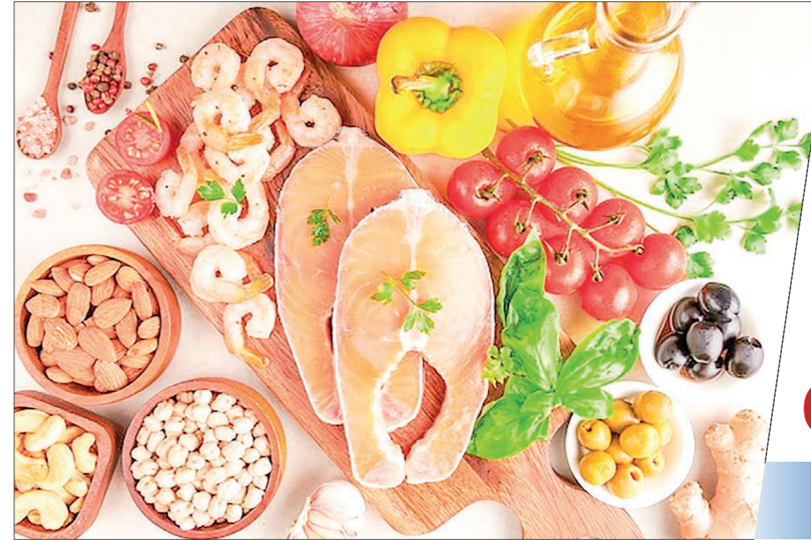
Found in fatty fish like salmon, mackerel, and sardines, as well as flaxseeds, chia seeds, and walnuts, omega-3s can help improve heart health.

❖ Maintain a Healthy Weight: Losing excess weight can help lower LDL cholesterol levels.