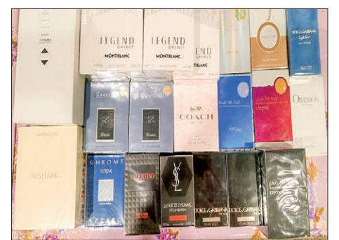
Confiscated illegal goods at Yangon International Airport.

On the same day, the Ayeyawady Region Illegal Trade Eradication Special