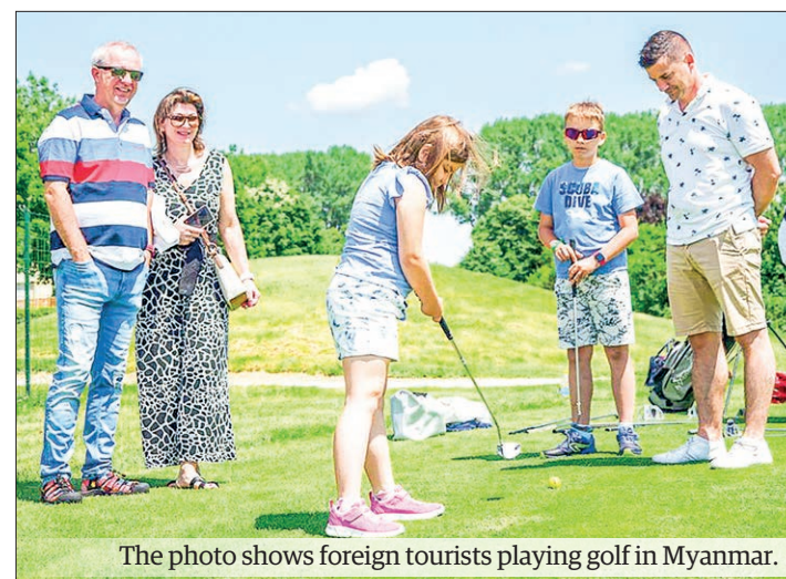
The photo shows foreign tourists playing golf in Myanmar.

Globally, there are over 50 million golfers, and revenue from golf tourism reached US$5.44 billion in 2023. According to the World Tourism Federation, this revenue is expected to reach US$5.88 billion by 2024. — ASH/MKKS