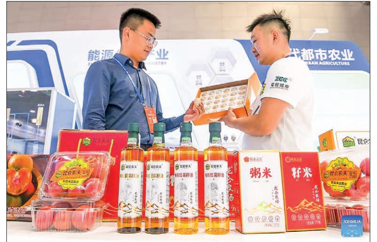
A staff member (R) introduces agricultural products to an exhibitor at the 8 th China-Eurasia Expo in Urumqi, northwest China's Xinjiang Uygur Autonomous Region, 28 June 2024.

During the previous seven expos, more than 12,200 domestic and foreign exhibitors from more than 70 countries and regions exhibited, attracting 2.16 million visitors. — Xinhua