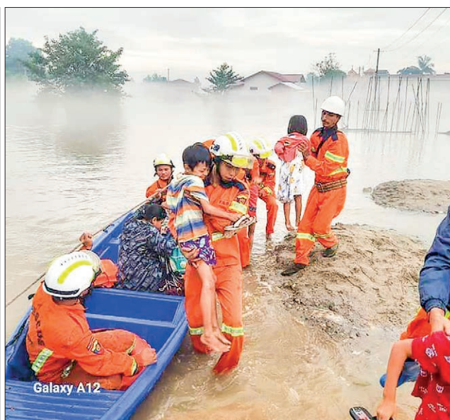
Photos depict flooding and victims being evacuated to safe areas.

are now evacuating and relocating property. As Kyetpaungchan and Rampu are close to the river, water is constantly coming in via ditches. The water level is still rising. These are the main flooded areas. All the people