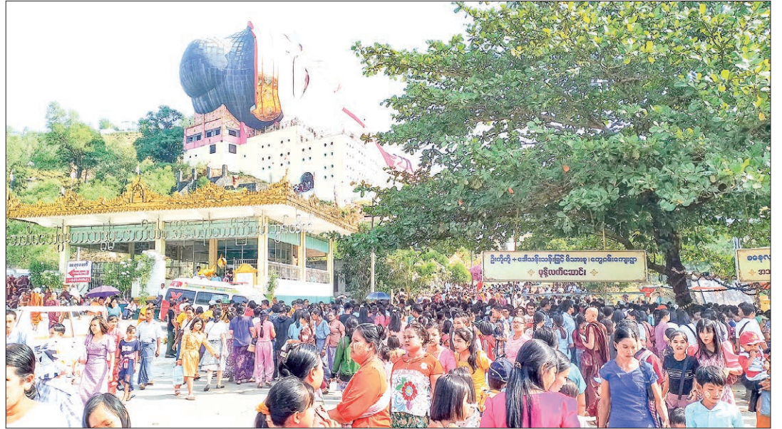
Visitors through one of the destinations in Mon State.

It is especially advised to the people who settle near the river banks and low lying areas in Hkamti Township, to take precaution measure.