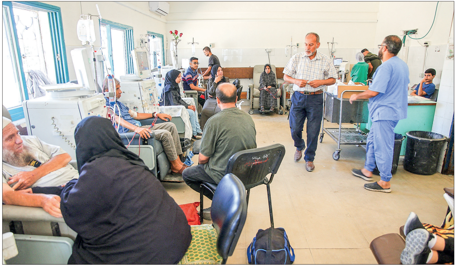
Patients receive treatment at Al-Shifa hospital's dialysis centre after its rehabilitation in Gaza City on 11 June 2024.