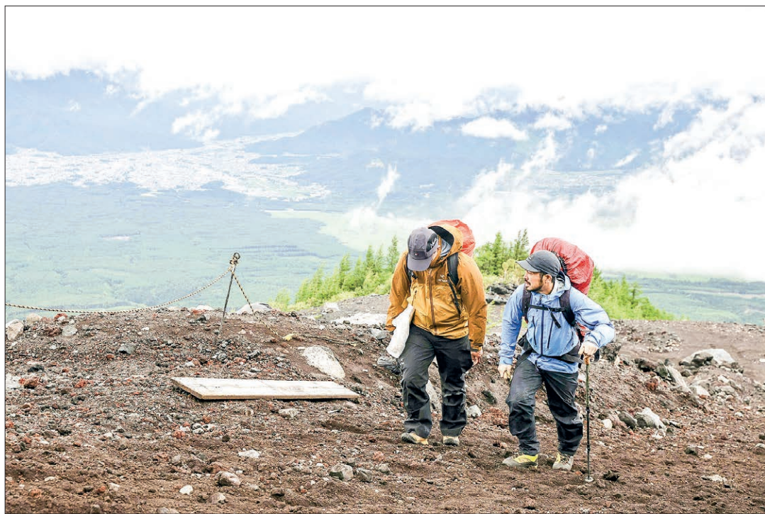
Climbers make their way up Mt Fuji's Yoshida Trail on the Yamanashi Prefecture side of the mountain on 1 July 2024 as this year's climbing season starts.