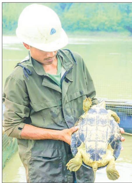
A glimpse of a roofed turtle.

The species of Burmese roofed turtles are located in the Ayeyawady,