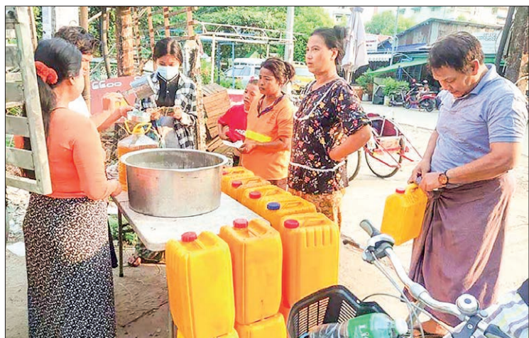
Consumers are seen purchasing palm oil at reasonable rates.

The domestic consumption of palm oil is estimated at one million tonnes per year. The local palm oil production is just about 400,000 tonnes. About 700,000 tonnes of palm oil are yearly imported through Malaysia and Indonesia to meet domestic demands. — NN/KK