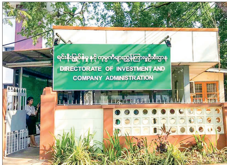
The office signage of the Directorate of Investment and Company Administration (DICA) in Yangon.

In order to remedy the economic impacts caused by COVID-19, the committee disbursed the loan to the businesses under the approval of the Union of Myanmar Federation of Chambers of Com-