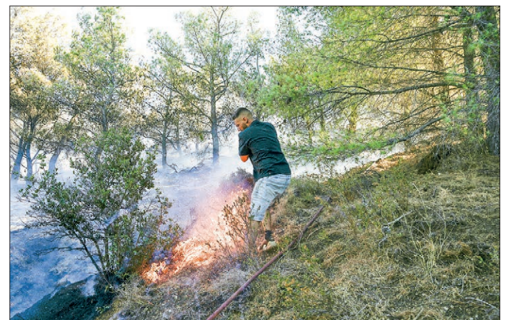
A man uses a tree branch to extinguish a fire after a wildfire broke out in Keratea, near Athens, on 30 June 2024.

He said there was no longer an active front in Stamata, north of Athens, though there were some minor reignitions in the eastern area of Keratea.