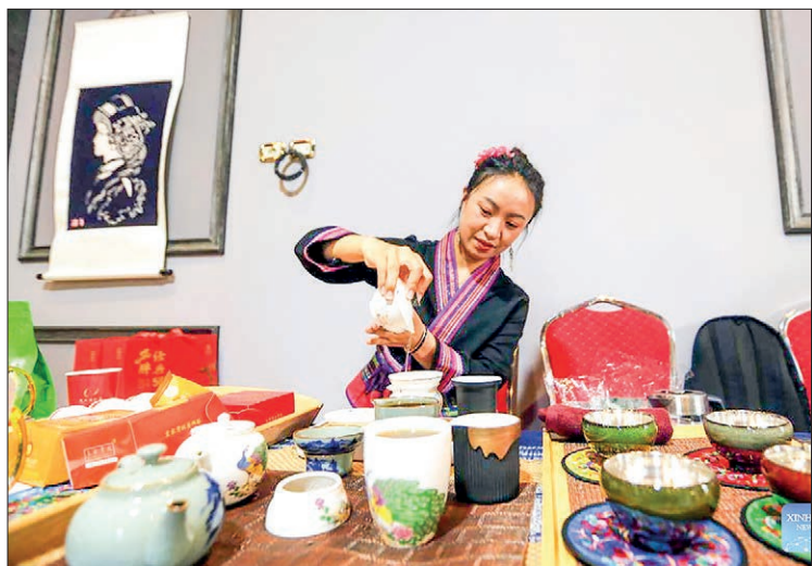
An exhibitor makes tea during a promotion event of Chinese tea culture in the China Cultural Centre in Amman, Jordan, on 30 June 2024.

The event, which was held in the China Cultural Centre in Amman and runs until 2 July, saw its opening attracting more than 300 participants from China, Jordan, and other countries.