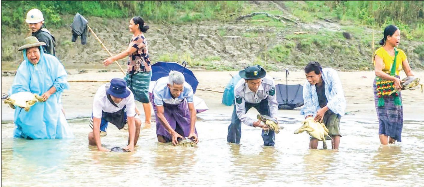
Officials and volunteers release 50 roofed turtles into the Chindwin River for the sixth time, part of collaborative efforts by the Environmental Conservation Department and Upper Chindwin NGO to conserve this rare, endangered species.