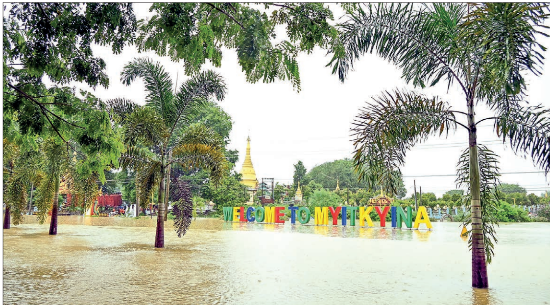
Photos (above & below right) show floods in Myitkyina and officials visit the evacuation centre yesterday.

Subsequently, the chief minister, along with senior military officers, regional ministers, and departmental officials, coordinated with search and rescue