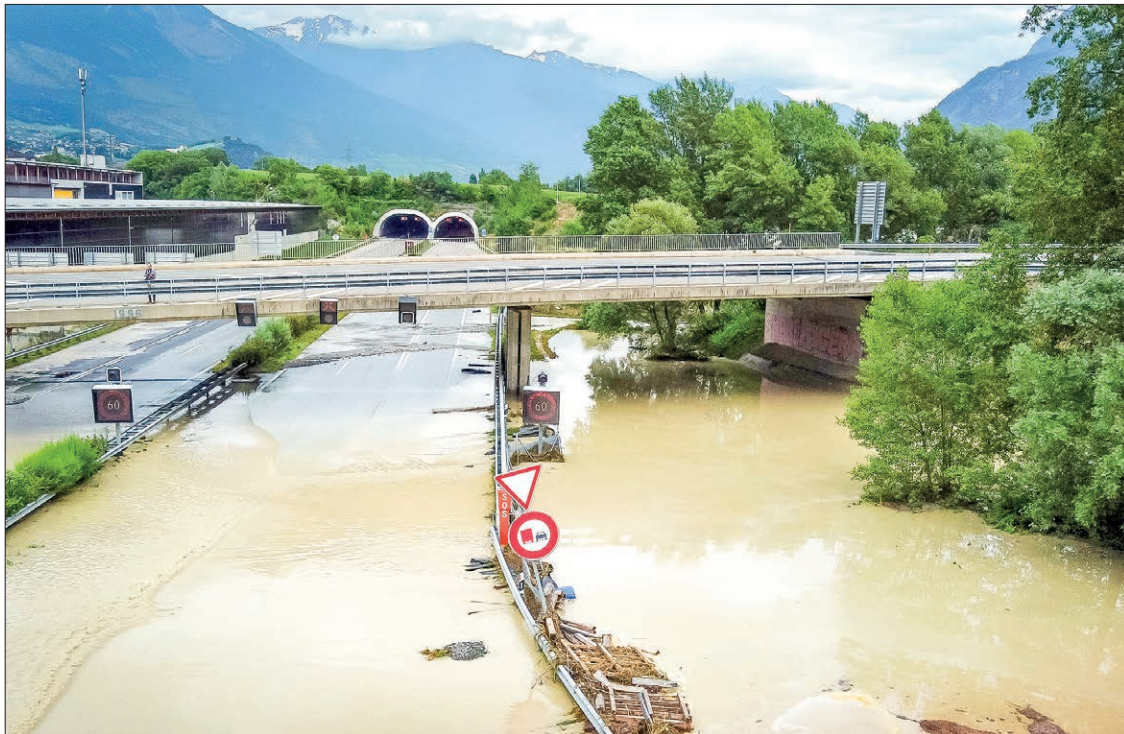
An aerial picture taken on 30 June 2024 shows the A9 motorway A9 partially flooded near Sierre, western Switzerland. Ferocious storms and torrential rains that lashed France, Switzerland and Italy this weekend have left five people dead, local authorities said on Sunday.

FEROCIOUS storms and torrential rains that lashed France, Switzerland and Italy this weekend have left at least seven people dead, local authorities said on Sunday.