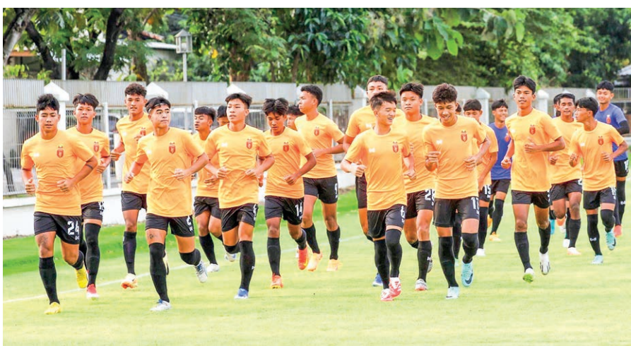
Myanmar U-16 players are seen in a training session in preparation for taking part in the 2025 Asian Cup U-17 qualifier.

This year, the Myanmar U-16 team will compete in the 2025 Asian Cup U-17 qualifier as the second international match to be held in coming October. So, the players are taking training for both tournaments.