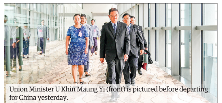
Union Minister U Khin Maung Yi (front) is pictured before departing for China yesterday.

of connecting the three sectors of development among the countries of the Himalayan region, cooperation and harmonious development between humans and nature and environmental conservation. A total of 300 delegates from 12 countries will attend the fourth China Xizang Trans-Himalaya Forum for International Cooperation. — MNA/TS