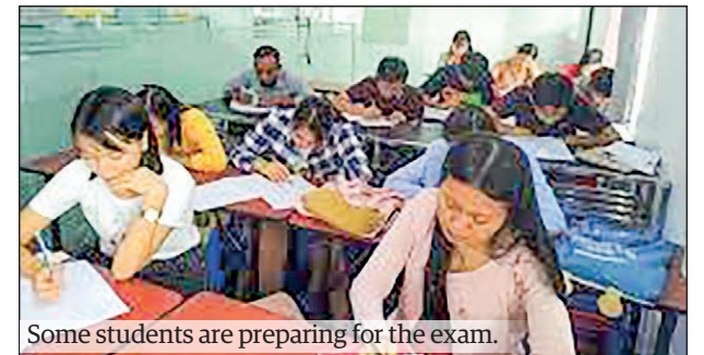
Some students are preparing for the exam.

Data filling needs to ensure accuracy, and corrections cannot be made after submission. Candidates have to answer the subject they chose in the application, said MAJA. — MT/ZS