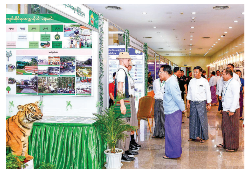
Union Minister for Information U Maung Maung Ohn inspects the preparation for the ceremony of outstanding students, receiving instructions from the State Administration Council Chairman at the Myanmar Convention Centre-II yesterday.

At the event, 76 booths from 23 ministries will be displayed.