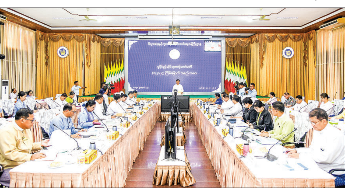
Deputy Prime Minister and Union Minister for Transport and Communications General Mya Tun Oo presides over the meeting 1/2024 of the Central Committee on Copyright yesterday.

Subsequently, Central Committee Joint Secretary Direc-