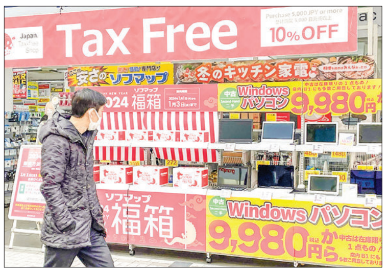
File photo shows an electronics store in Tokyo's Akihabara district in December 2023.