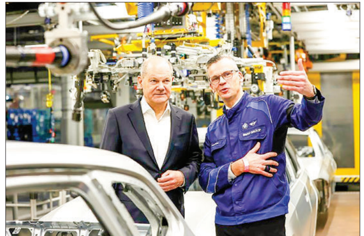
Disagreements in the three-party ruling coalition of Chancellor Olaf Scholz (L) are hindering efforts to reignite the German economy. critics say.

Initial hopes for a strong rebound this year were dialled back as the economy languished, with Berlin in February slashing its growth forecast to just 0.2 per cent. The International Monetary Fund followed suit last week and is