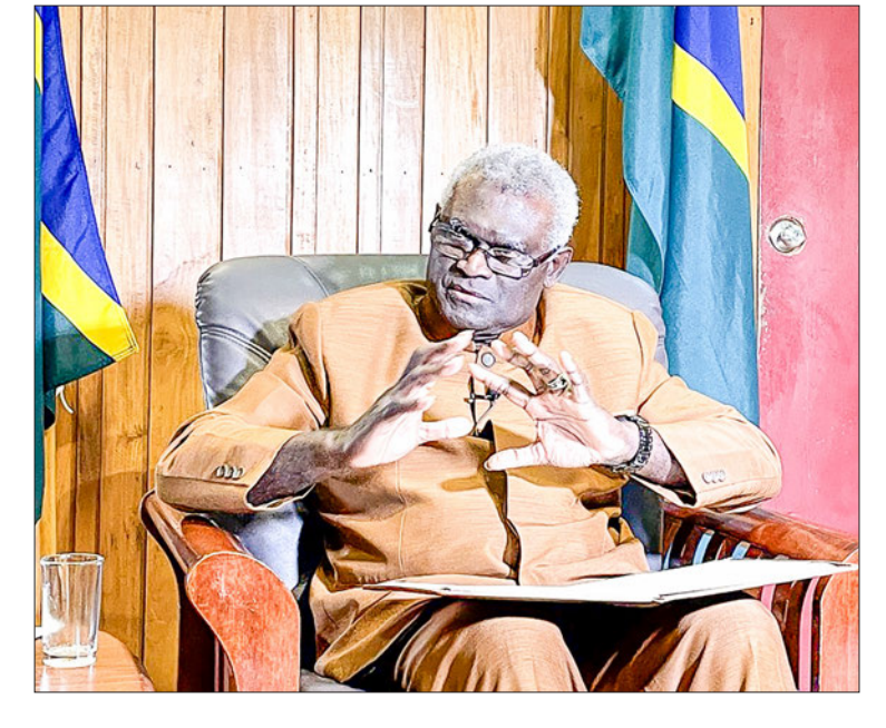
Prime Minister of the Solomon Islands Manasseh Sogavare speaks during an interview with Xinhua in Honiara, capital of the Solomon Islands, 4 July 2023.