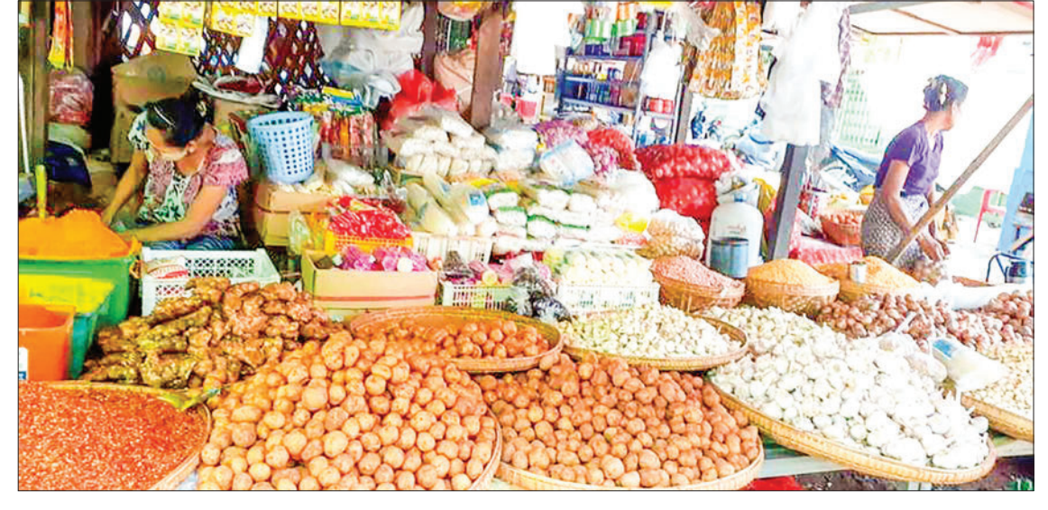
The photo shows a retail shop selling kitchen commodities.

On 22 April 2024, new onion 180,000 visses arrived in the Pa-