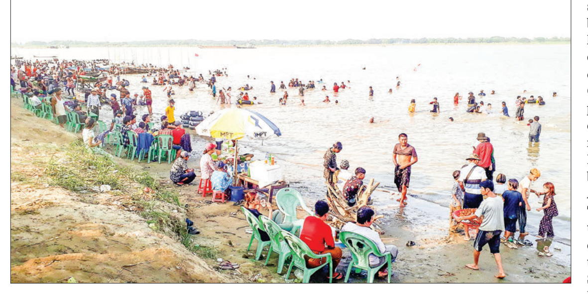
A general view of Omadanti beach near Danubyu Township in Ayeyawady Region crowded with beachgoers during the Thingyan festival.

seeking relaxation at nearly all beaches in Ayeyawady Region has significantly increased during this Thingyan period compared to previous years. Omadanti Beach near Danuphyu, which is relatively lesser-known, has attracted the most day-trippers from Yangon Region. In reality, it is not a beach but a sandbank in the Ayeyawady River. During the Thingyan period, 21,155 domestic travellers visited it. A total of 11,557 domestic and foreign tourists visited the well-known Shwethaungyan Beach near Pathein during Thingyan," said U Soe Win. — ASH/MKKS