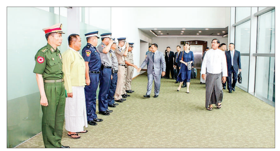
Union Minister Lt-Gen Yar Pyae (C) is pictured before departing for China yesterday.