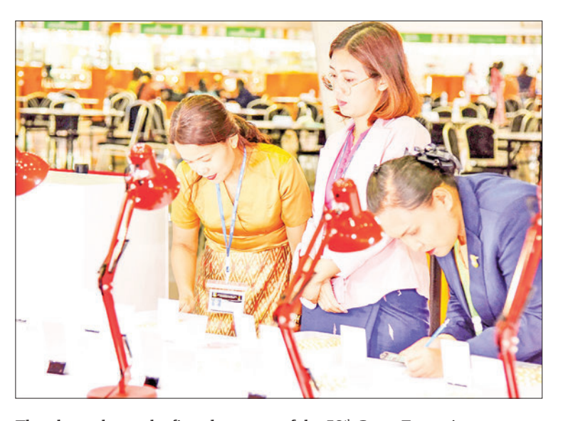
The photo shows the first-day event of the 58th Gems Emporium.

Those who wish to attend the exhibition can contact the Myanmar Gems Enterprise Head Office (Nay Pyi Taw) and the Myanmar Pearl Enterprise Head Office (Nay Pyi Taw) of the Myanmar Gems Emporium Central Organizing Committee. - NN/ TMT