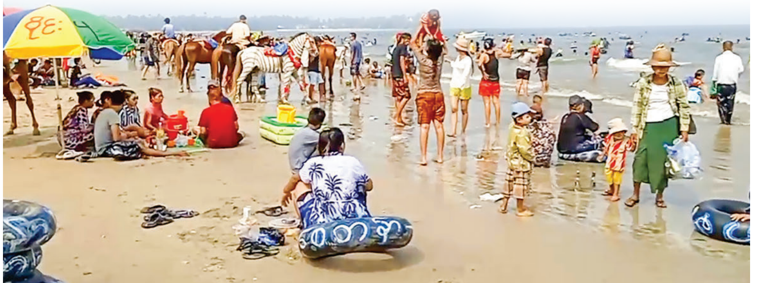
Beachgoers seen enjoying the beauty of Chaungtha Beach on Myanmar New Year Day, yesterday.

Chaungtha continues to attract tourists consistently.