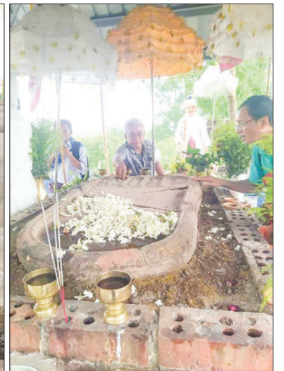
A presumably ancient work of Buddha's footprint in sandstone.

THE Historical Team of Hlegu Township (HTHT) has observed a recently discovered sandstone Buddha footprint sculpture in Hlegu, Yangon Region, which is believed to be an ancient work, according to an official.