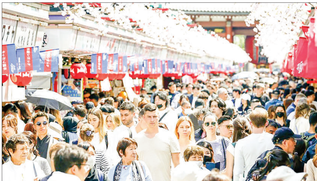
The Nakamise shopping street in Tokyo's Asakusa area is crowded with visitors, including tourists from overseas, on 17 April 2024.

In March, Japan welcomed over 3.08 million foreign visitors for the first time in a single month, driven by cherry blossom enthusiasts and Easter holidaymakers.