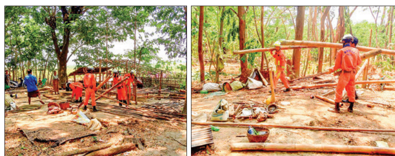
The search and rescue teams launched rescue operations of collapsed houses due to strong winds.

Given these conditions, the DMH has advised the public, as well as domestic flights and waterways, to remain vigilant and heed weather forecasts closely. — TWA/MKKS