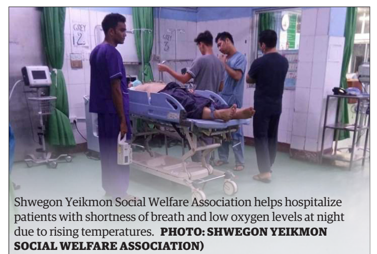
Shwelon Yeikmon Social Welfare Association helps hospitalize patients with shortness of breath and low oxygen levels at night due to rising temperatures.

“In previous summers, it was only hot during the day and not much at night. Now, in summer, it is hot both during the day and at night. People, especially those in poor health, should be cautious. Symptoms include over-sweating, low oxygen level, fatigue, sudden rise in body temperature, fainting, and if there is no one around to help, it may even lead to death. There have been some recent