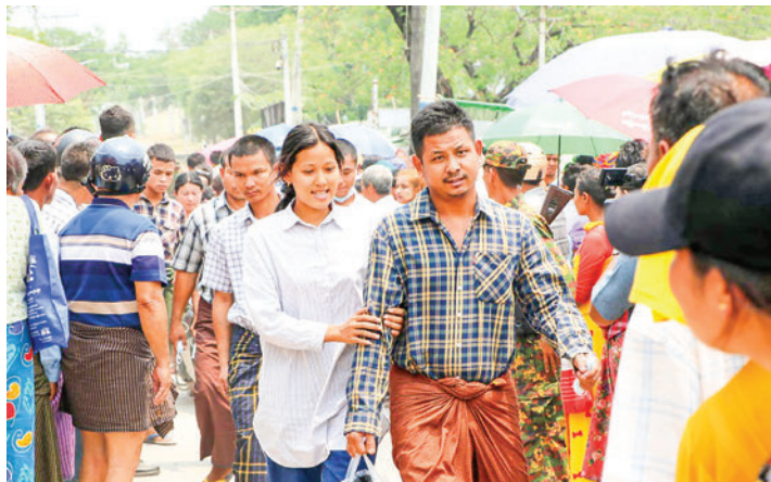
Released prisoners reunite with their families in front of the Mandalay prison yesterday.