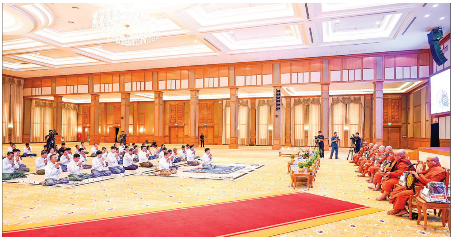
The SAC Secretary and the congregation seen taking Nine Precepts from members of the Sangha at yesterday's ceremony in Nay Pyi Taw.