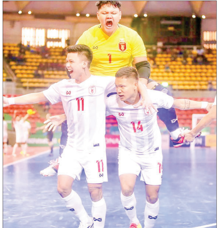
Myanmar futsal team players are seen celebrating the victories during the opening group match of the AFC Futsal Asian Cup 2024 against Viet Nam in Bangkok, Thailand, on 17 April 2024.

tion is held. Tickets can also be purchased in advance on the https://www.ticketmelon.com/futsalthaileague/afc24 website. Team Myanmar will take on host Thailand on 19 April and China on 21 April in Group A. — Htun Htun/KZL