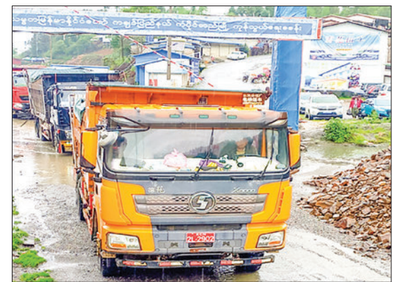
Trucks loaded with export and import cargo are seen passing the Kampaiti border.

TRADE value at the Kampaiti border post between Myanmar and China reached US$13.424 million in the first week of April 2024, which accounts for 45.397 per cent of the total trade target in April, the Ministry of Commerce's statistics showed.