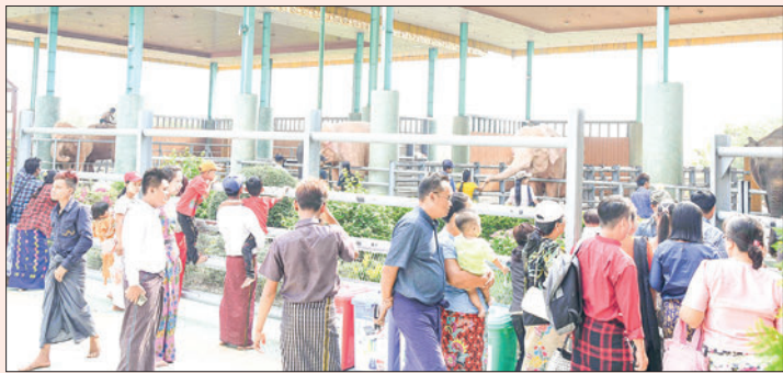
On Myanmar New Year Day, well-wishers and devotees gather at prominent pagodas, Buddha images and destinations in Nay Pyi Taw.