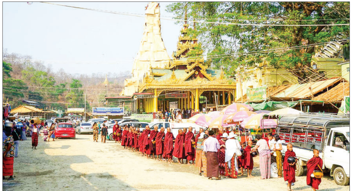
Well-wishers donate alms to members of the Sangha at Mann Shwesettaw Pagoda. PHOTO: MAUNG MAUNG (MINBU)

for 64 days, from the 5 th Waxing of Tabodwe to the 1 st day of Myanmar New Year. There were about 1,000 guesthouses and over 800 stalls during the festival. Although the access to two sacred footprints of the Lord Buddha have closed, visitors across the county can visit peacefully anytime, according to the pagoda board of trustees. — Maung Maung (Minbu)/KTZH