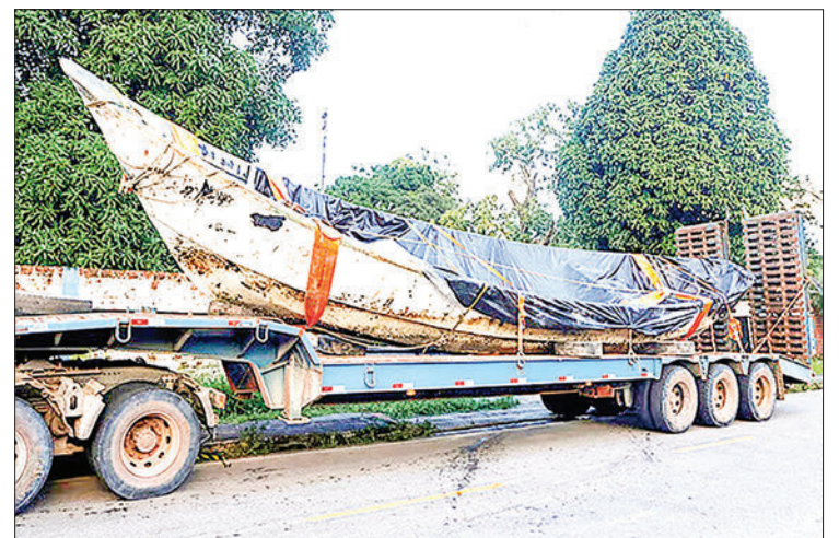
The boat was found near Braganca, northeast of Para, on 13 April, leading to the initiation of two investigations.

This is a developing story, more details are awaited. — ANI