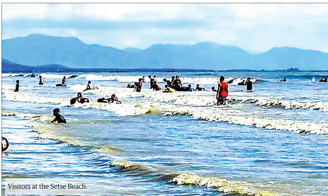
Visitors at the Setse Beach.

U Zeya Tun highlighted the primary attractions drawing travellers to the state, including Kyaiktiyo Pagoda in Kyaikto