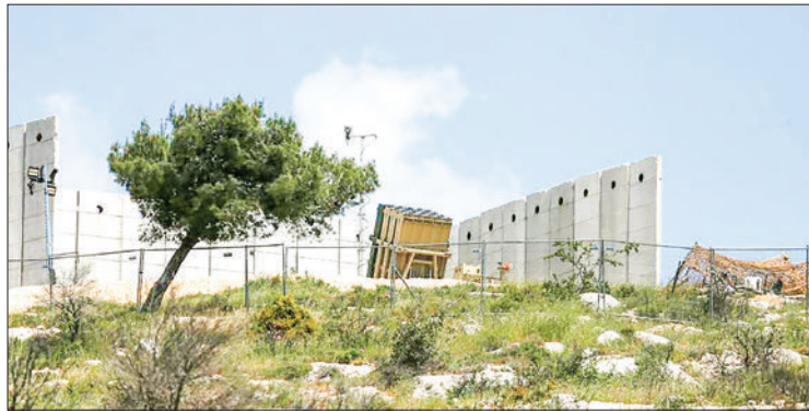
Photo taken on 15 April 2024 shows a battery of Israel's Iron Dome defence system deployed near Jerusalem. Herzi Halevi, chief of staff of the Israel Defence Forces, stated on Monday that a response is imminent following Iran's "unprecedented" missile and drone attack on Israel.

Commenting on the attempts by the United States and several other countries to intercept the Iranian missiles, Ukrainian President Volodymyr Zelen-