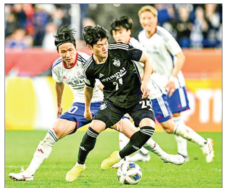
Ulsan and Yokohama F-Marinos will play the second leg of their Asian Champions League semi-final next week in Japan.

Former Liverpool and Leeds forward Kewell replaced