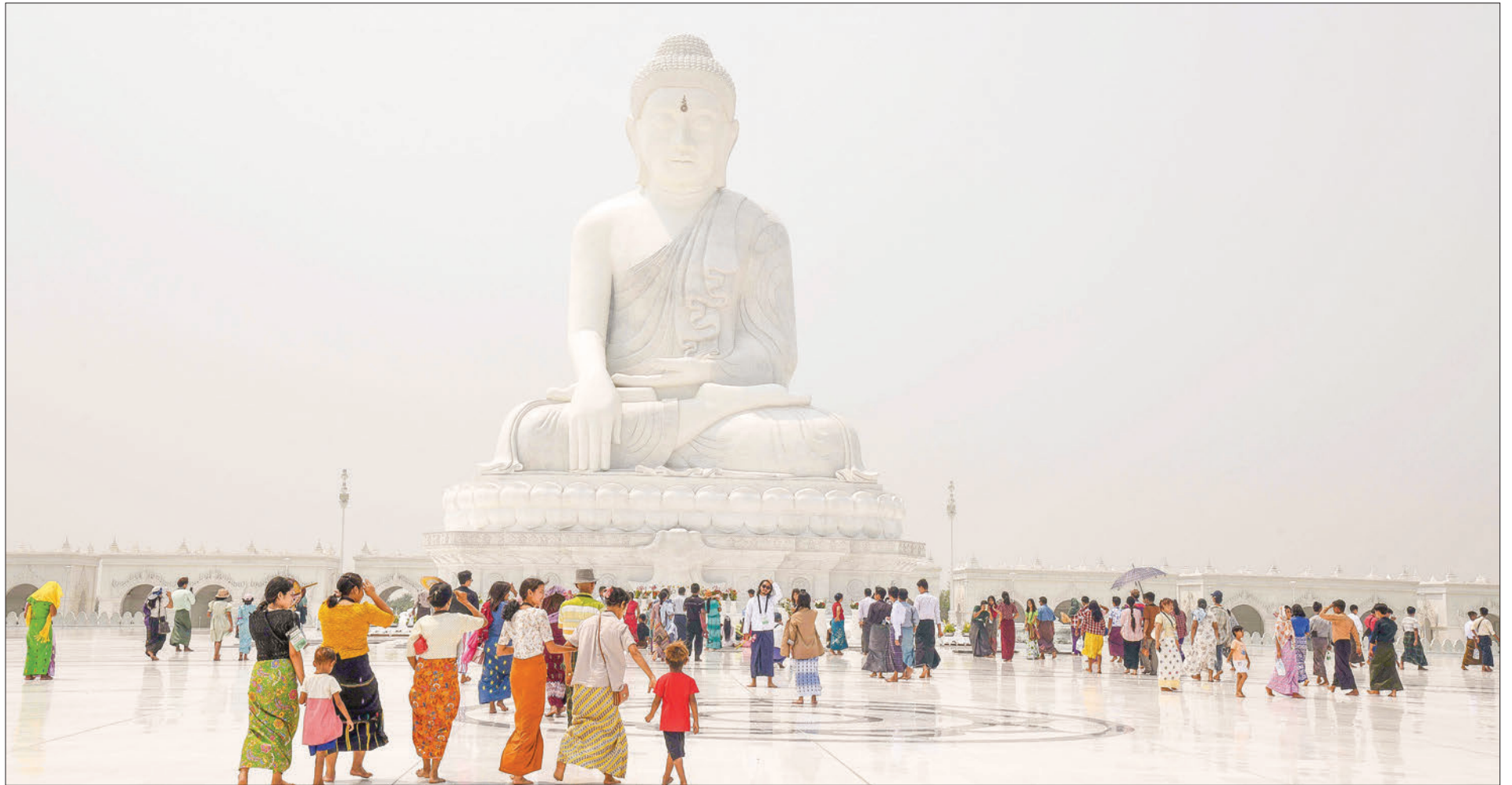
Locals flock to Maravijaya Buddha Image, participating in good deeds on Myanmar New Year Day in Nay Pyi Taw yesterday.

T HE Myanmar Era 1385 is over, and the New Year 1386 ME has come. People did good deeds at famous pagodas yesterday, which is the Myanmar New Year (after the Thingyan Water Festival).