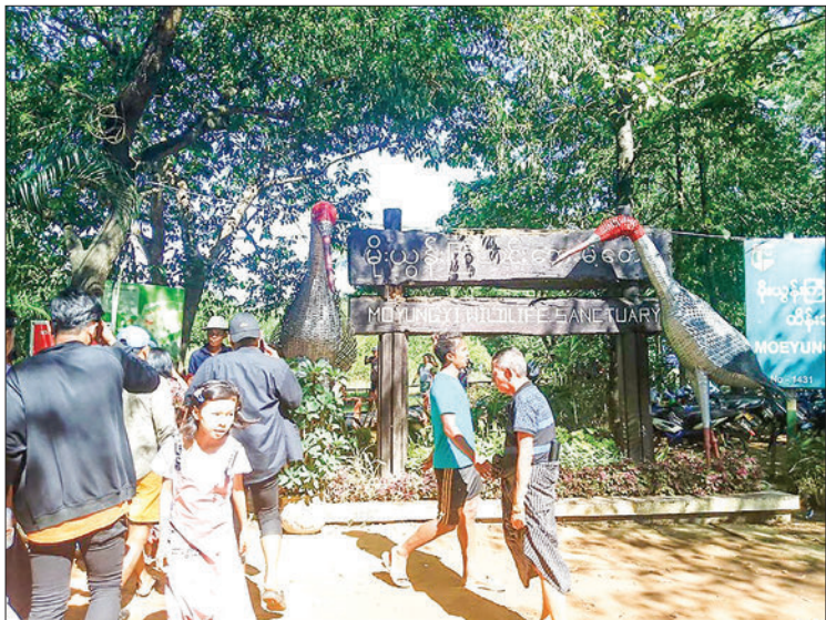
Holidaymakers at the sanctuary.

Before the COVID-19 pandemic, the sanctuary enjoyed about 80,000 domestic and foreign travellers annually.