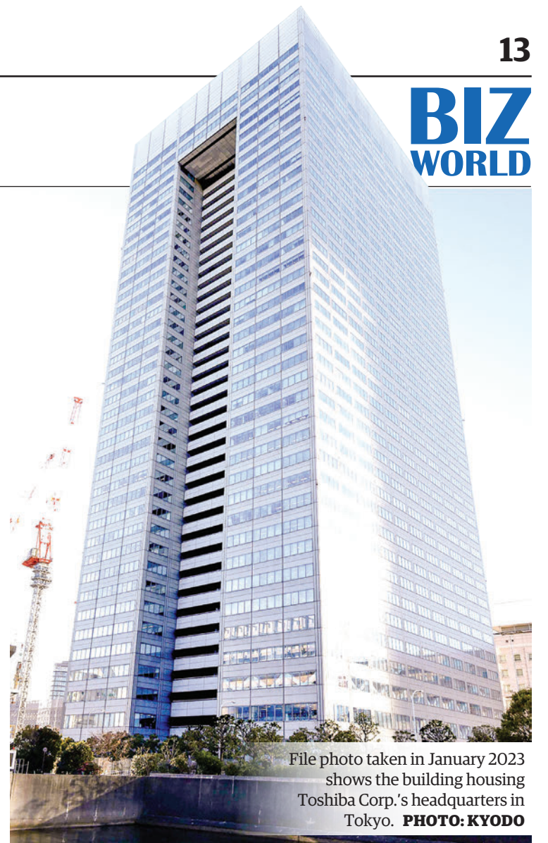
File photo taken in January 2023 shows the building housing Toshiba Corp.'s headquarters in Tokyo.