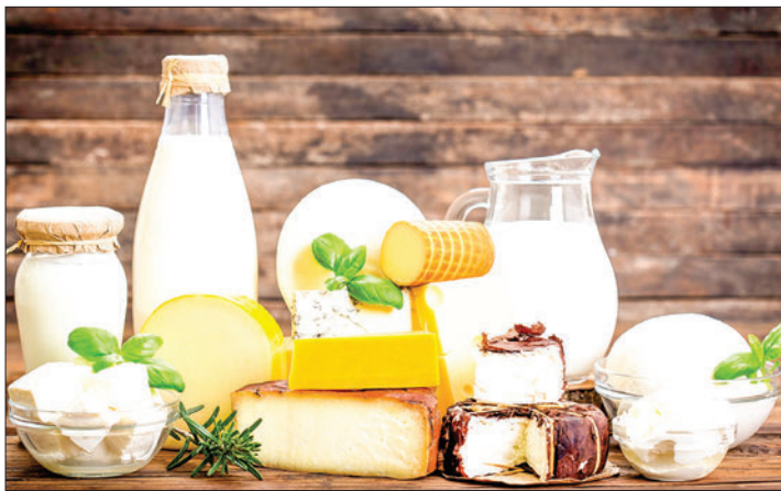
Milk prices rise by 1.13% due to index price increases and an extra 3.35% from a previous agreement between dairies and government ministries.

The price calculations are reviewed according to fixed formulas every six months to a year within an automatic mechanism that does not require the signature of ministers and takes into account the changes that have occurred in the main inputs in the production of the products taking into account the change in the input and price indices. — ANI