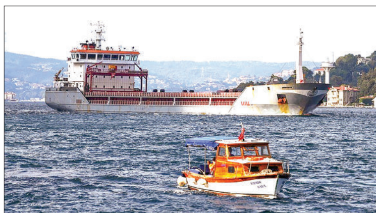
A vessel in the second caravan of ships transporting grain from Ukraine passes through the Bosphorus Strait in Istanbul, Türkiye, 7 August 2022.

Despite Ukraine's initial consent for Turkish President Tayyip Erdogan to announce the agreement on 30 March, they withdrew from the deal abruptly, resulting in its collapse.