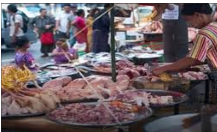
A pork and chicken retail outlet.

On every New Year’s Day, people make New Year donations and Satuditha (food donations to all comers) in wards and villages, by either groups or families. — Thit Taw/ZS