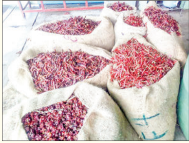
The picture shows bags of chilli peppers flowing into the market.

TRADERS are struggling to store the chilli pepper amid the surge in cold storage charges for the second time this year and shortage of cold storage facilities, a chilli depot owner from Bayintnaung Commodity Wholesale Centre told The Global New Light of Myanmar (GNLM).