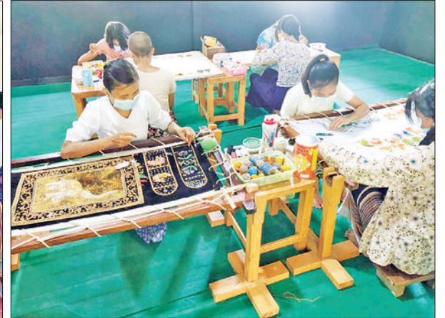
Images capture diligent artisans and workers crafting handmade goods in their small-scale workshops.