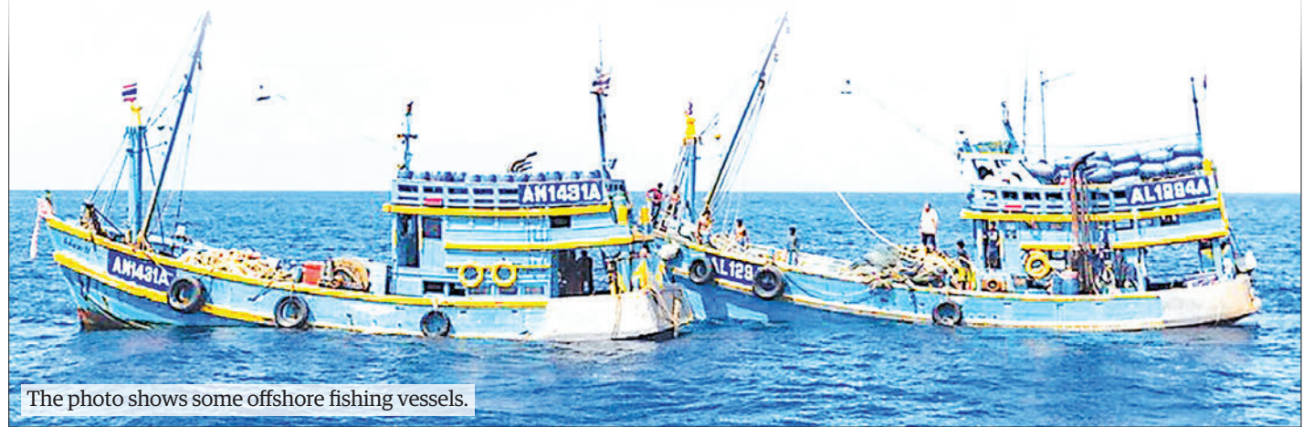
The photo shows some offshore fishing vessels.

A total of 3,000 fishing vessels from various regions and states operate in the Myanmar sea. — TWA/TRKM