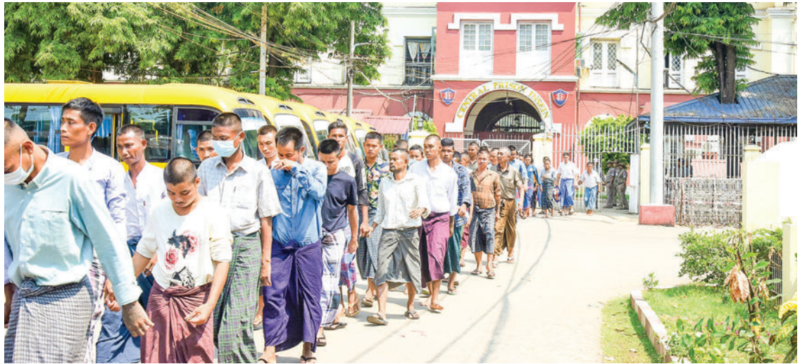
Released prisoners are pictured lining up for their homes in Insein prison, Yangon yesterday.

Prison. The released prisoners included 20 foreigners, 754 males and 60 females, totalling 834, and they were transported to their respective townships by YBS buses at noon. The State Administration Council released its 17 th amnesty for Insein Prison on 17 April during its term. SAC pardoned 236 prisoners from Insein Prison: 3,015 male and female prisoners who face punishment from their respective prisons, jails and camps and 98 foreign prisoners, totalling 3,114 prisoners, on Myanmar New Year Day in 2023. — Nyein Thu (MNA)/KTZH