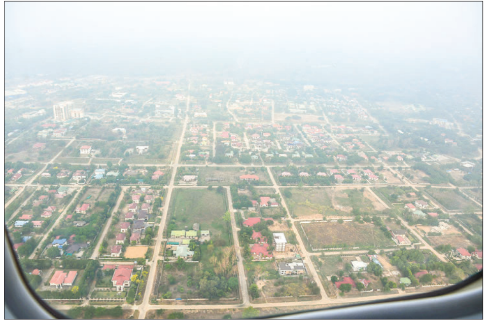
Images capture members of the Sangha reciting Paritta aboard aircraft with general view of Nay Pyi Taw Union Territory yesterday.