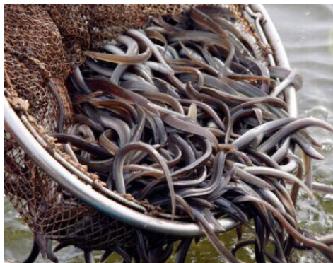
Eels seen arranging for sales in the domestic market.

ACCORDING to the Myanmar Fisheries Federation (Yangon Region), the distribution of eel breeding technique to fish-