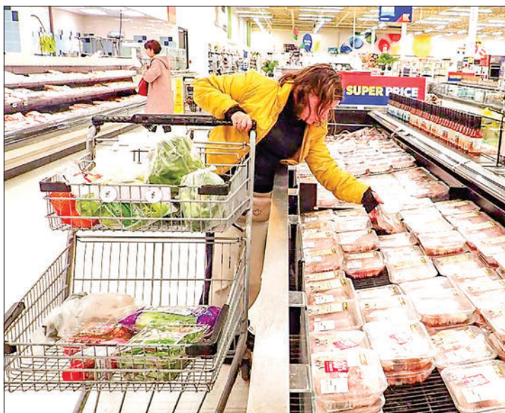
A customer shops for groceries at a supermarket in Vancouver, British Columbia, Canada, on 16 April 2024.

On a monthly basis, the CPI rose 0.6 per cent in March. On a seasonally adjusted monthly basis, the CPI rose 0.3 per cent in March, Statistics Canada said. — Xinhua