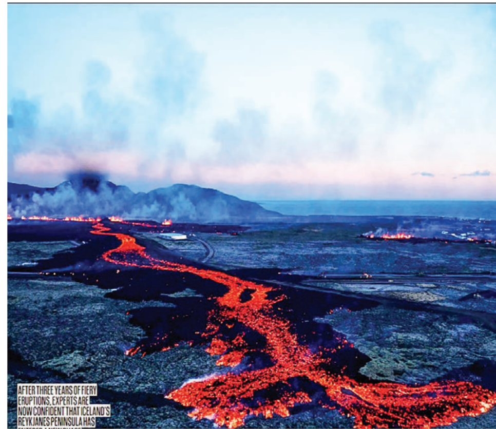
AFTER THREE YEARS OF FIERY ERUPTIONS, EXPERTS ARE NOW CONFIDENT THAT ICELAND'S REYKJANES PENINSULA HAS

Another dangerous mountain in Iceland is Katla. It's one of the biggest, and it's under a thick layer of ice. If Katla were to blow up, it would melt a lot of ice and cause big floods. Katla last blew up in 1918, and people are watching it closely in case it wakes up again.