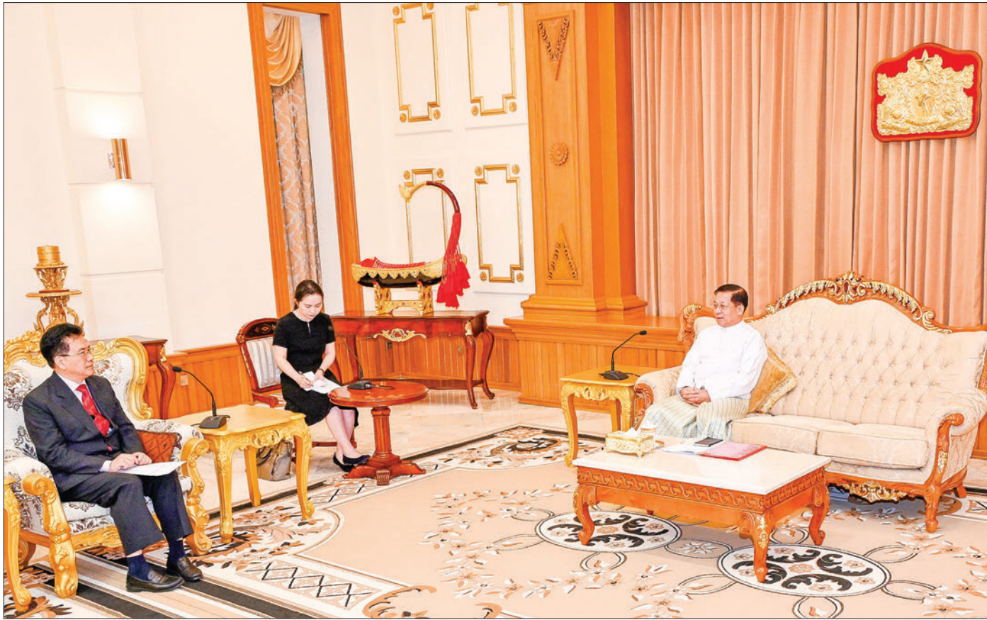
State Administration Council Chairman Prime Minister Senior General Min Aung Hlaing receives Mr Deng Xijun, Special Envoy for Asian Affairs of the Ministry of Foreign Affairs of the People's Republic of China yesterday in Nay Pyi Taw.

S ENIOR General Min Aung Hlaing and Mr Deng Xijun, Special Envoy for Asian Affairs of the Ministry of Foreign Affairs of the People's Republic of China, discussed the government's peace talks with ethnic armed organizations to ensure peace and stability in the whole country including border regions.