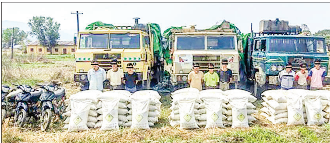
Offenders seen alongside seized restricted chemicals and vehicles.

Legal action has been initiated against the offenders, and an ongoing investigation is underway to apprehend other individuals involved in the case. — MNA/MKKS