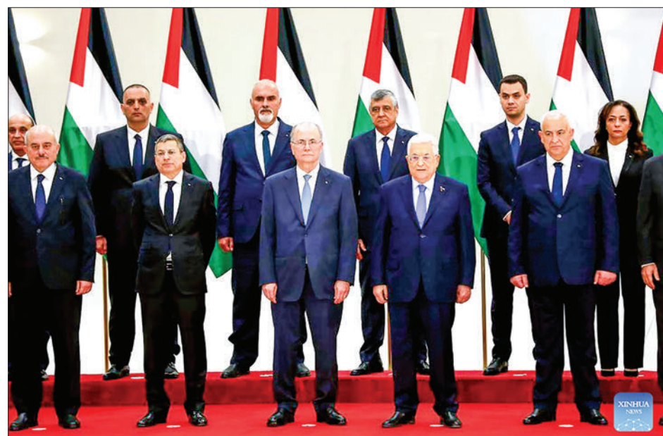
Palestinian President Mahmoud Abbas (2 nd R, front) poses for a picture with Prime Minister Mohammad Mustafa (3 rd L, front) and other members of the new government in the West Bank City of Ramallah, on 31 March 2024.

At a meeting with the new government after the ceremony, Abbas reaffirmed that work is underway in coordination with Arab and international parties to stop the conflict in Gaza. "Our political goal is to achieve freedom, independence and liberation from the (Israeli) occupation, and we are working with concerned Arab and international parties to obtain full membership in the United Nations," said the president, according to the official news agency Wafa. — Xinhua