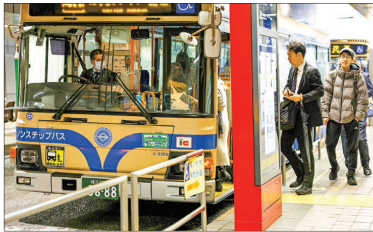
People board a bus in Yokohama on 1 April 2024.

Under the law on workstyle reform, implemented in 2019, overtime for doctors and drivers will be capped at 960 hours per year, while emergency medical