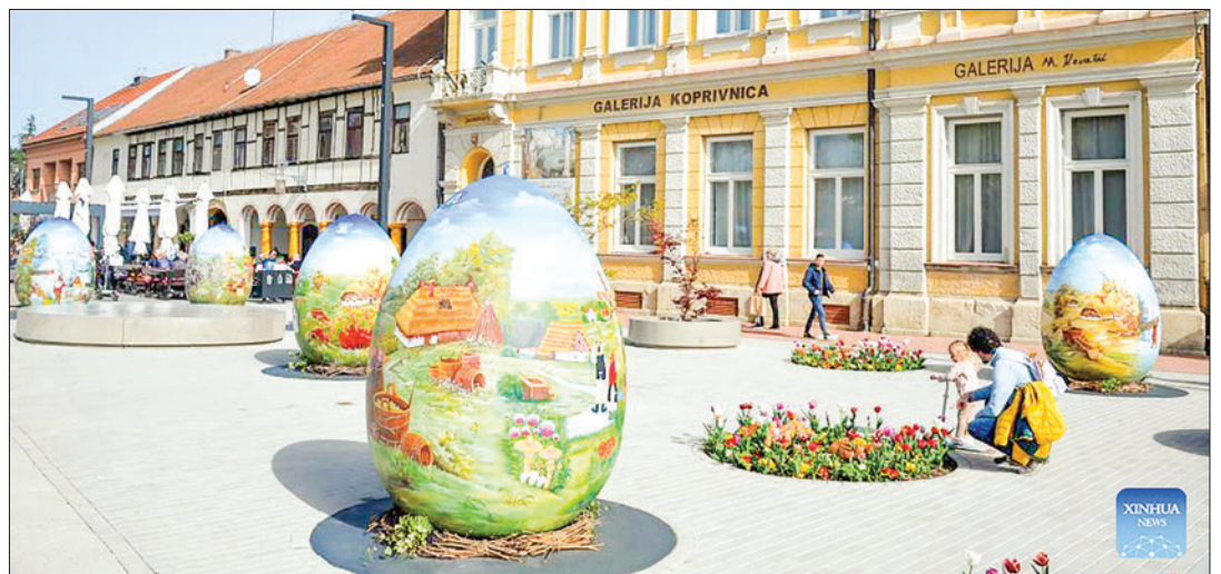
This photo taken on 30 March 2024 shows a view of the annual traditional Easter eggs exhibition held in Koprivnica, Croatia. PHOTO: XINHUA

The Easter eggs from Koprivnica, while having enjoyed the status of Intangible Croatian Cultural Heritage, have been gifted to other cities including Munich, Rome, New York, Prague, and Vienna. — Xinhua