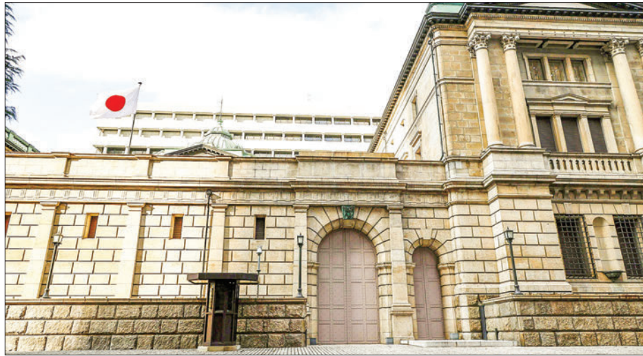
Photo taken on 23 January 2024 shows the Bank of Japan headquarters in Tokyo.

But large nonmanufacturers, including the service sector, benefited from a revival of inbound tourism and the passing of higher costs on to consumers. The index improved for the eighth straight quarter to hit its highest level since 1991, rising to