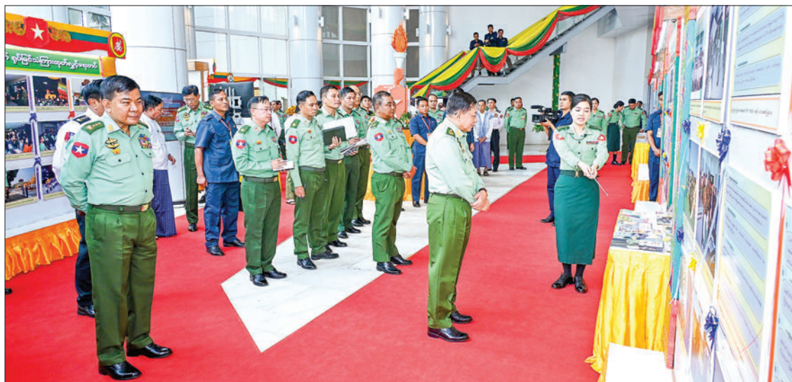
The Senior General views round the exhibits at yesterday's event in Nay Pyi Taw.