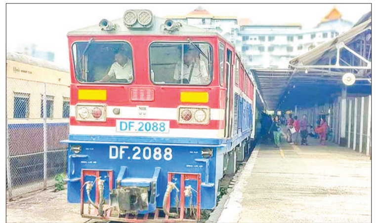
The photo shows a special train that will run during the Thingyan Festival.

Furthermore, Yangon's circular train services will be temporarily suspended during the Maha Thingyan festival holiday. Regular circular train operations will resume after the Thingyan festival holiday. — ASH/MKKS