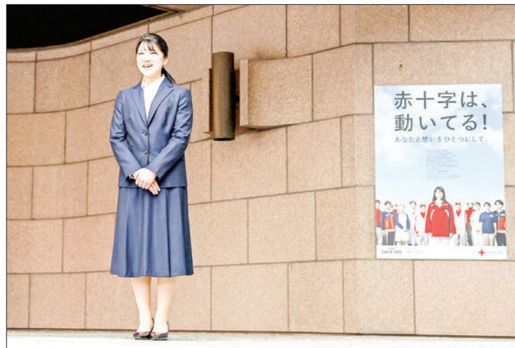
Princess Aiko is pictured at the Japanese Red Cross Society headquarters in Tokyo on 1 April 2024, her first day of work there.

“While my days as a working member of society have just begun, I will endeavour to adjust quickly to the workplace