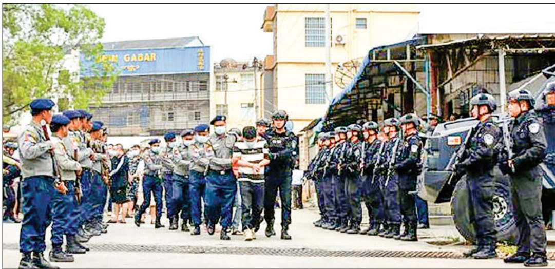
Fraudsters seen being arrested in the Myanmar-China combined crackdown.

MORE than 800 people suspected of online scams were detained in a joint police operation by Myanmar and China.