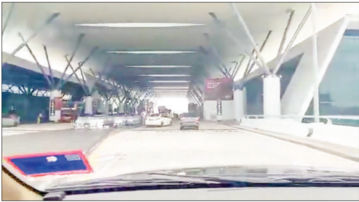
An airport facility is at the façade of Malaysia airport.

PHOTO- LOVELY HEART PHILANTHROPIC MYANMAR YOUTH BLOOD DONOR GROUP (KUALA LUMPUR- MALAYSIA).