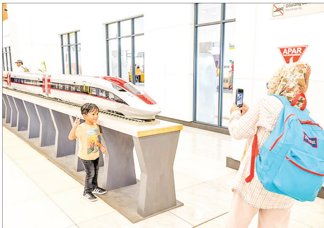
A boy poses for photos with a model of a high-speed electrical multiple unit (EMU) train of the Jakarta-Bandung high-speed railway in the waiting hall at Halim Station in Jakarta, Indonesia, 3 March 2024.

“The high-speed train makes everything more efficient for me, from the location to the time. The train is also comfort-