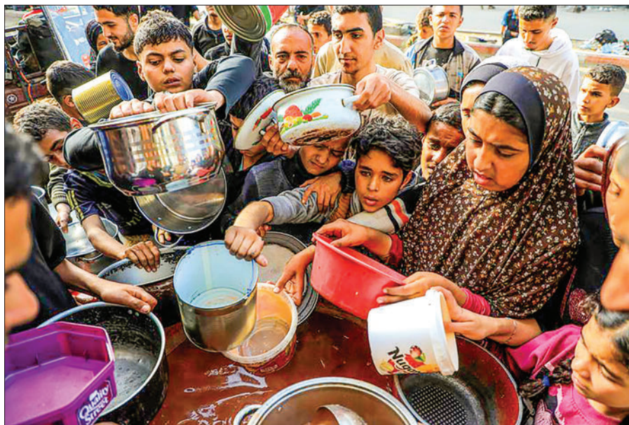
People wait to receive food relief in the southern Gaza Strip city of Rafah on 30 March 2024.

gation of security officials departed for a new round of talks with negotiators in Cairo.