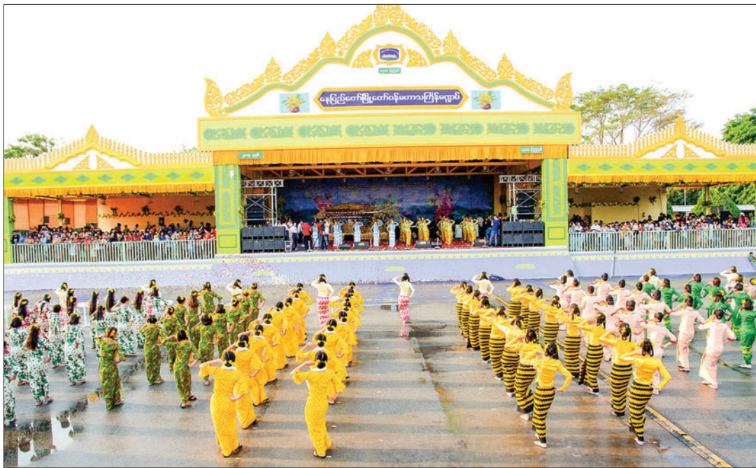
An enchanting scene of the Thingyan Water Festival in Nay Pyi Taw last year.

ENTERTAINMENT and performances by dancers and singers from South Korea, the People's Republic of China, and the Russian Federation are scheduled for the upcoming Thingyan Water Festival of 1385 ME, as announced by the Nay Pyi Taw City Development Committee.