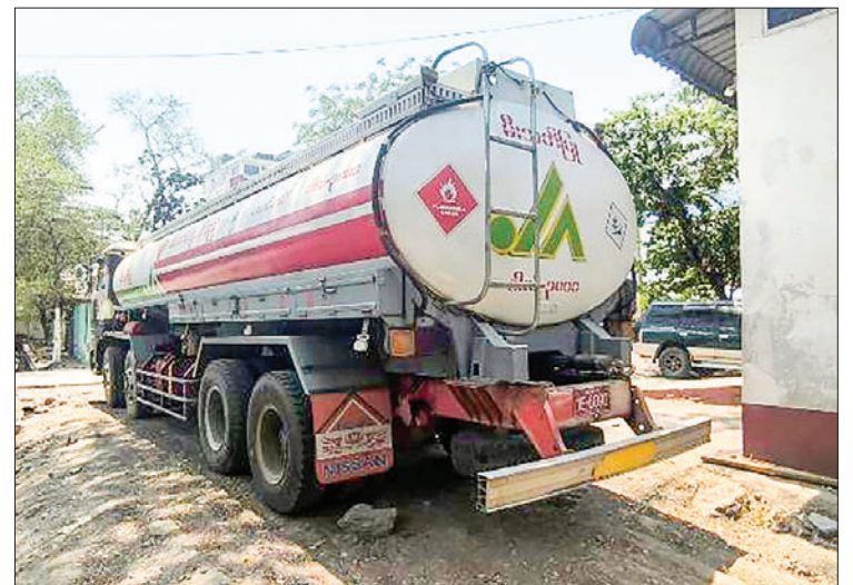
Confiscated fuel bowsers in Mandalay Region.

ON 30 March, authorities seized 0.813 tonne of illegal teak valued at K92,500 in Ingapu township. This enforcement was conducted under the Forest Law.