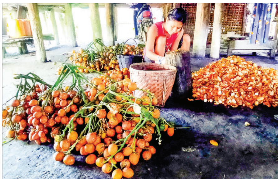
File photo shows a worker peeling areca nuts in Minbya Township, Rakhine State.

The prices of dried areca nuts and soft and unripe areca nuts are the same. After peeling the outer shell, a viss (1.6 kilogrammes) includes 220 dried areca nuts. Yet, 62 soft shell areca fruits weigh a viss. Thus, soft and unripe areca nut trade can reap a profit three times higher than that of dried ones. The growers,