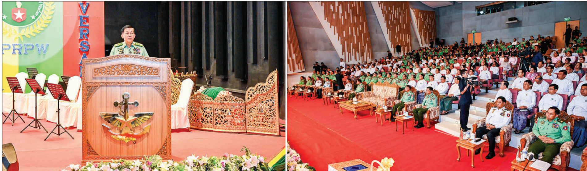
State Administration Council Chair Commander-in-Chief of Defence Services Senior General Min Aung Hlaing addresses the 77 th anniversary celebration of the Directorate of Public Relations and Psychological Warfare of the Commander-in-Chief (Army) yesterday in Nay Pyi Taw.

IT is necessary to foster patriotism and the spirit of defending the State in the mindsets of newly recruited persons who will serve people's military services in the future, said Senior General Min Aung Hlaing.