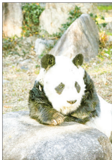
Photo shows Tan Tan, a giant panda at Oji Zoo in Kobe, in January 2024.

TAN Tan, the oldest giant panda in Japan, has died at age 28 at a Kobe zoo after her planned return to China was delayed for medical treatment several years ago, the zoo in the western city said Monday.