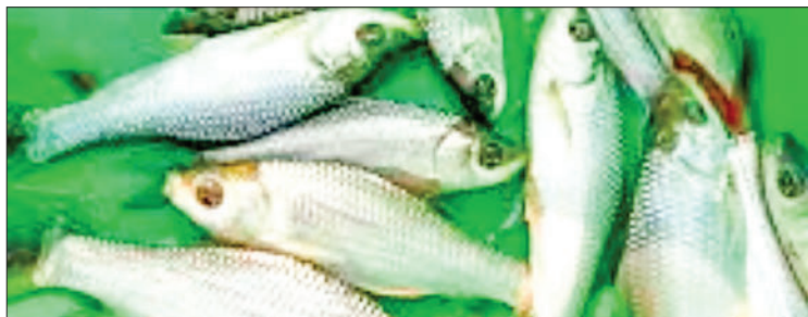
Some baby Rohu at a fish farm.

tal goods, intermediate goods, consumer goods and raw materials goods imported by the CMP enterprises. — TWA/KK