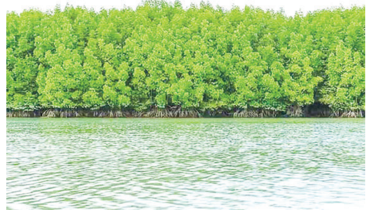
The Mainmahla Island Wildlife Sanctuary.

Local artistes have already been invited to participate in festivities at the Nay Pyi Taw Mayor's pavilion and the walking Thingyan pavilion, according to the report. — ASH/TMT