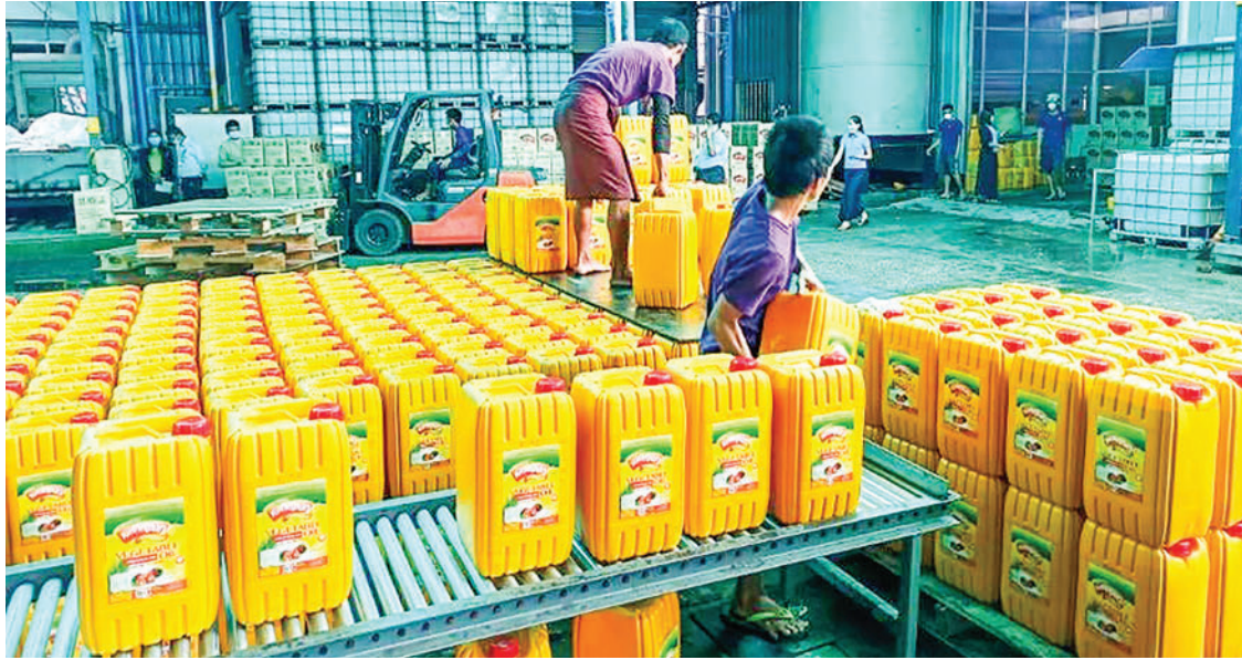
Workers seen arranging jerrycans of cooking oil for distribution and sale.

To control overcharging, the Consumer Affairs Department