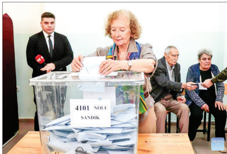
A woman casts her vote at a polling station in Ankara, Türkiye, 31 March 2024. Turkish citizens head to voting stations Sunday for local elections, a crucial test for President Recep Tayyip Erdogan who seeks to retake control of major cities that his party lost to the opposition in 2019.

Turkish President Recep Tayyip Erdogan's ruling party lost control of both cities in the last local elections in 2019. In May last year, Erdogan was reelected as president and his alliance secured a majority of seats in the parliament. — Xinhua