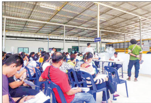
Myanmar workers seen making CI booklets at Mahachai station last year.

The Myanmar Embassy and Labour Attached Office (Bangkok) have advised the workers in a statement in February to go in person for the service and not to carry it out with brokers, which may cost more. — MT/ZN