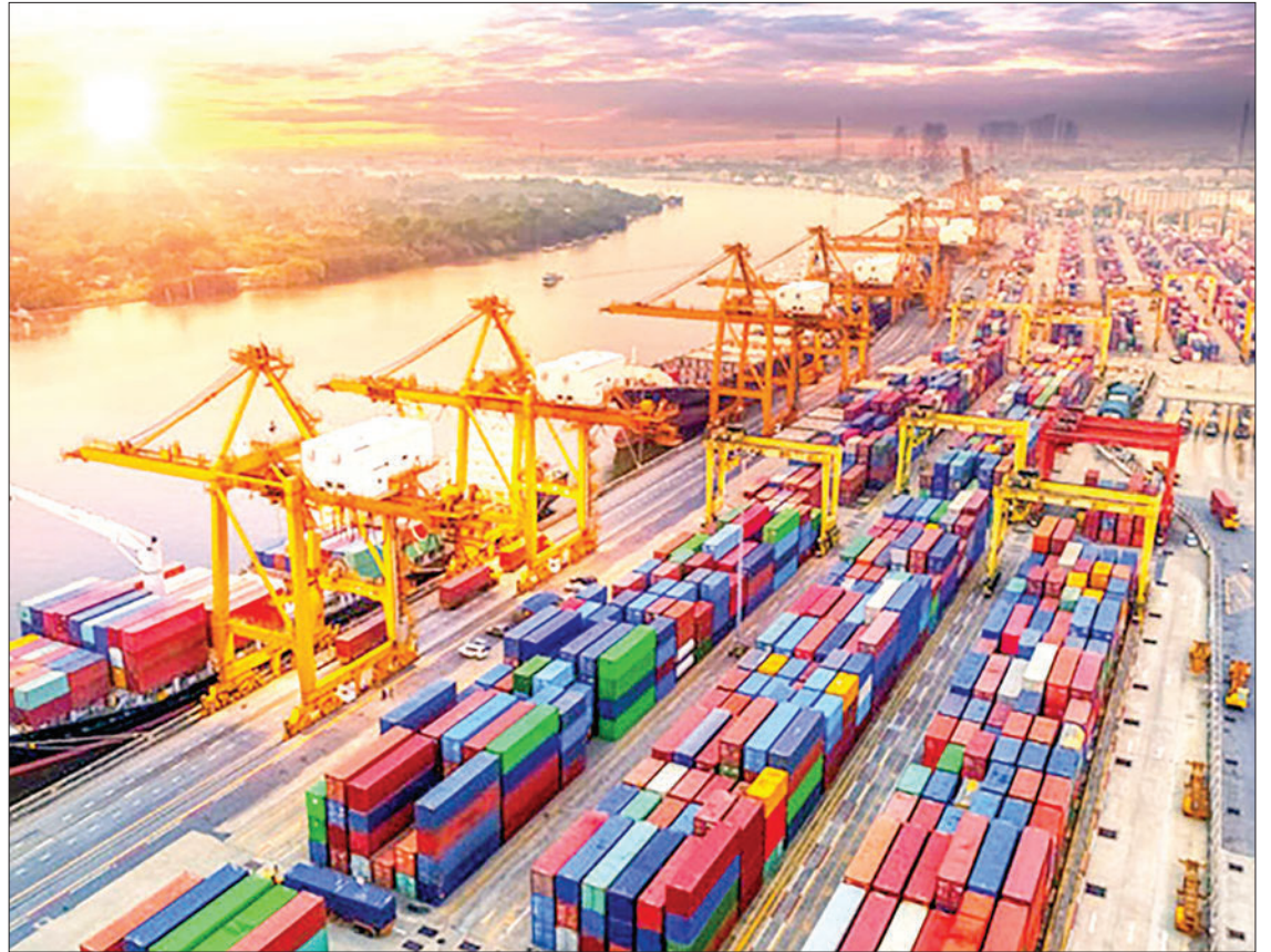
A major port terminal with export and import activities.

According to the statistics of the Ministry of Commerce for the FY 2023-2024, almost ending, imports worth over $15 billion surpassed the exports