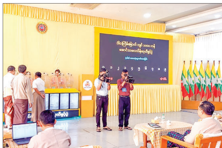
Officials inspecting letters and numbers for the 61 st Aungbarlay lottery.

THE 61 st Aungbarlay lottery opened on 1 April, and the fol-