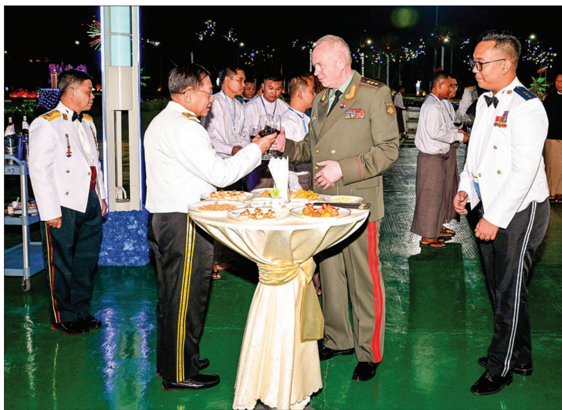
SAC Chair C-in-C of Defence Services Senior General Min Aung Hlaing cordially greets Russian Deputy Minister for Defence Colonel-General Alexander Vasilyevich Fomin at the dinner yesterday.