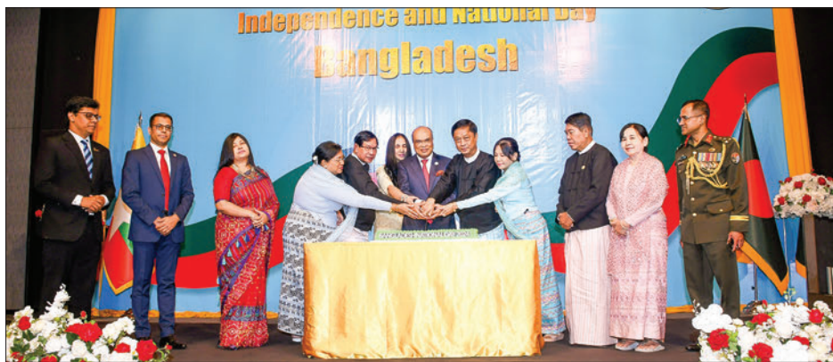
The reception of Bangladesh's 53 rd Independence Day and National Day celebration in progress yesterday in Yangon.

THE 53 rd Independence Day and National Day reception of Bangladesh was held yesterday at the Lotte Hotel in Yangon.