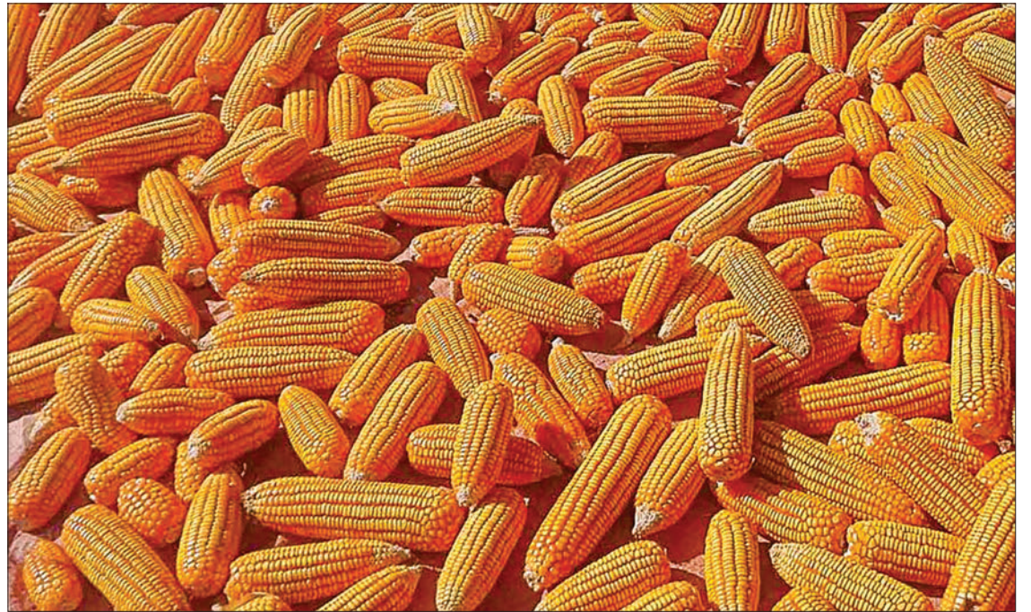
Myanmar exported over two million tonnes of corn to foreign trade partners in the 2022 corn season.

Myanmar exported over two million tonnes of corn to foreign trade partners in the 2022 corn season. The majority of them were sent to Thailand, and the remaining went to China, India, the Philippines and Viet Nam.