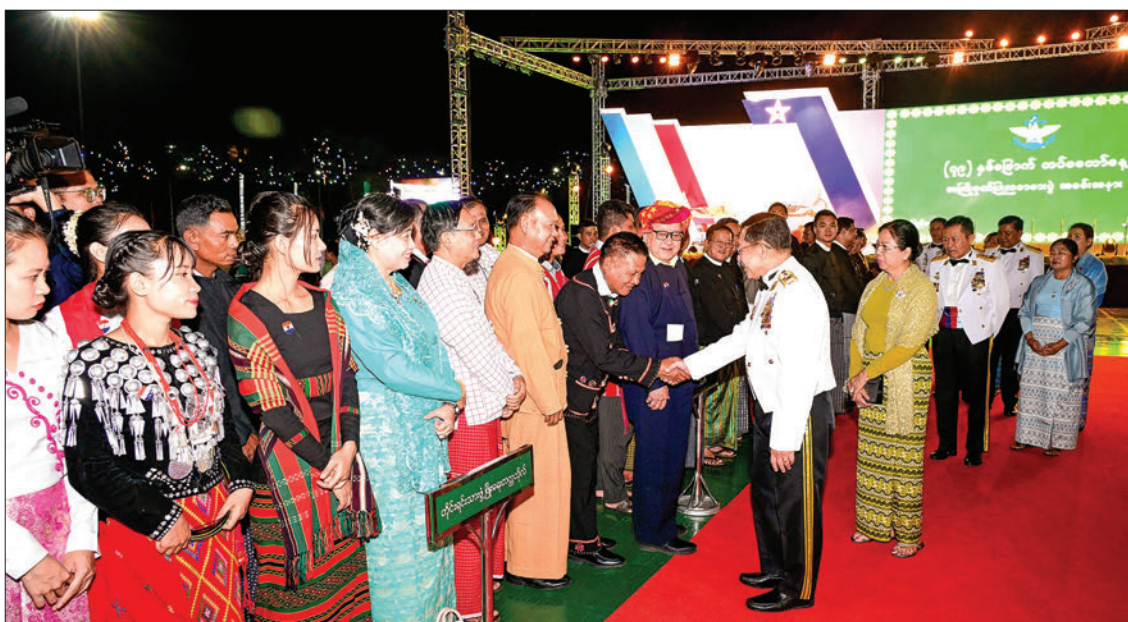
The Senior General warmly greets ethnic representatives.

Tatmadaw Army, Navy and Air, Independence Mawgun award recipients, advisers, deputy ministers, Tatmadaw member retired ambassadors, Nay Pyi Taw Council members, military attachés of foreign missions, representatives from the NCA-signatory ethnic armed organizations, chairperson and officials from political parties, families and relatives of Aung San Thuriya title, Thiha Thura title, Thura title, military capability gallantry title and medal winners and families, members of Myanmar War Veterans Organization, transformed people's militia, original people's militia, border guard central advisory board members, officials of MPF, Fire Brigade and Myanmar Red Cross Society, officials of ministries, those from YMBA, Myanmar Women's Affairs Federation, Myanmar Maternal and Child Welfare Association, Myanmar Interfaith Dialogue Group of Myanmar, artistes who participated in the dramas in honour of the Armed Forces Day, winners in the military song and marching song