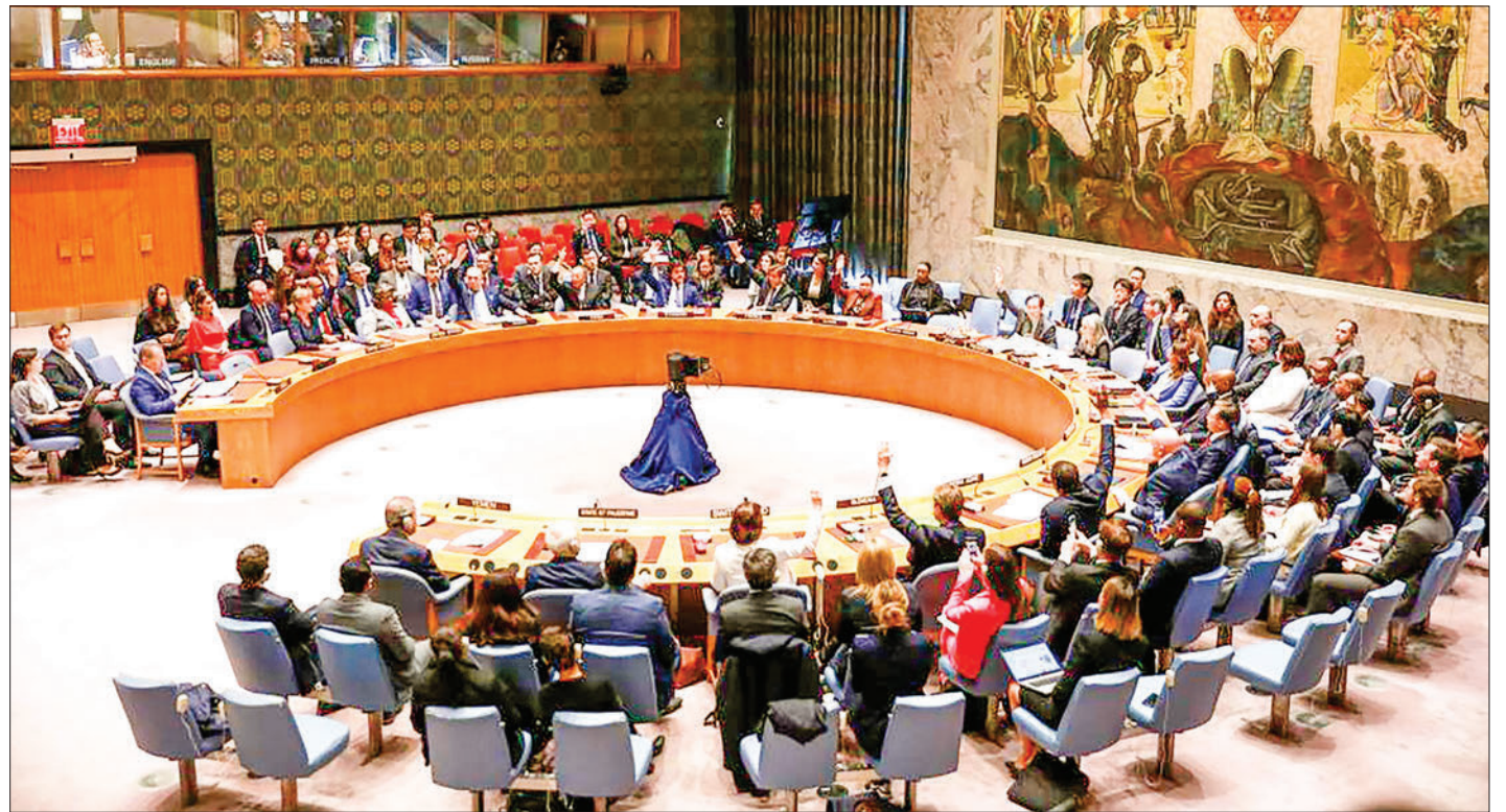
Representatives vote on a draft resolution during a Security Council meeting at the UN headquarters in New York on 25 March 2024. The Security Council on Monday adopted a resolution that demands an immediate ceasefire in Gaza for the holy month of Ramadan.

It also demands the immediate and unconditional release of all hostages, as well as ensuring humanitarian access to address their medical and other humanitarian needs. It further demands that