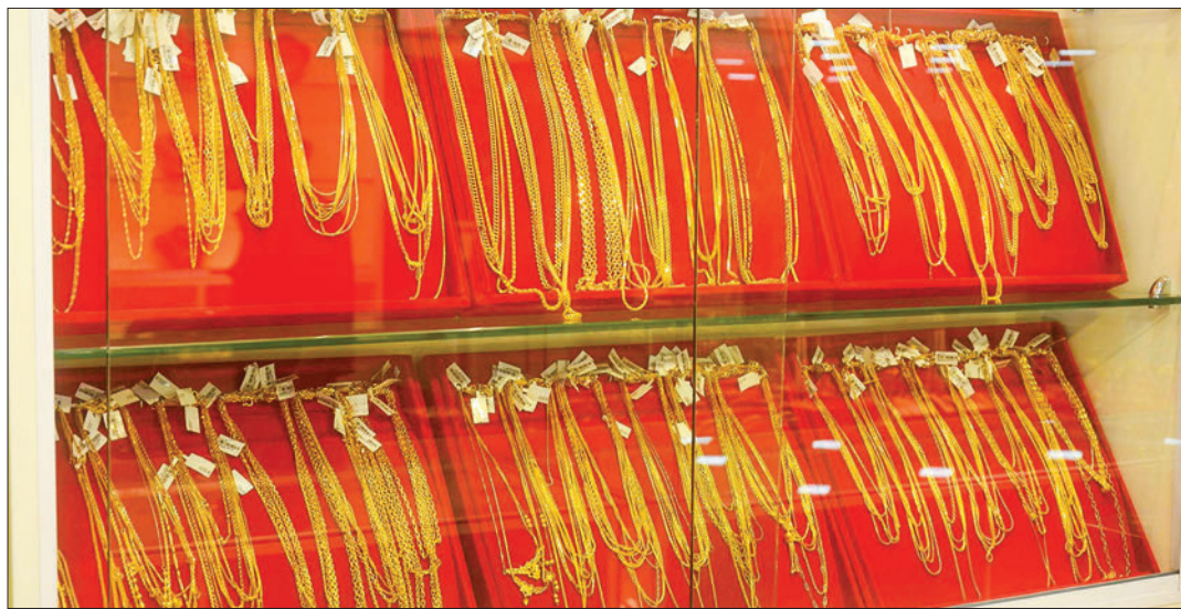
The kyat depreciation to K4,000 against the US dollar drove the gold price up to a record high of K4 million per tical in late August 2023.

FOLLOWING the spot gold price rally to over US$2,170 per ounce and kyat depreciation to approximately K3,740 against the US dollar on 26 March 2024, domestic gold price hit a fresh new peak of K4.31 million per tical (0.578 ounce or 0.016 kilogramme).