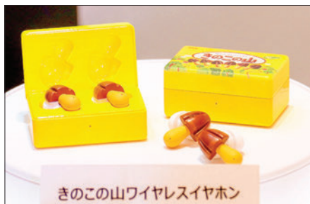
Photo taken in Narita, Chiba Prefecture, on 25 March 2024, shows wireless earphones designed after Meiji Holdings Co's chocolate snack "Kinoko no Yama".

WIRELESS translator earphones in the shape of the beloved Japanese mushroom-shaped chocolate snack "Kinoko no Yama", sold as "Chocorooms" in the