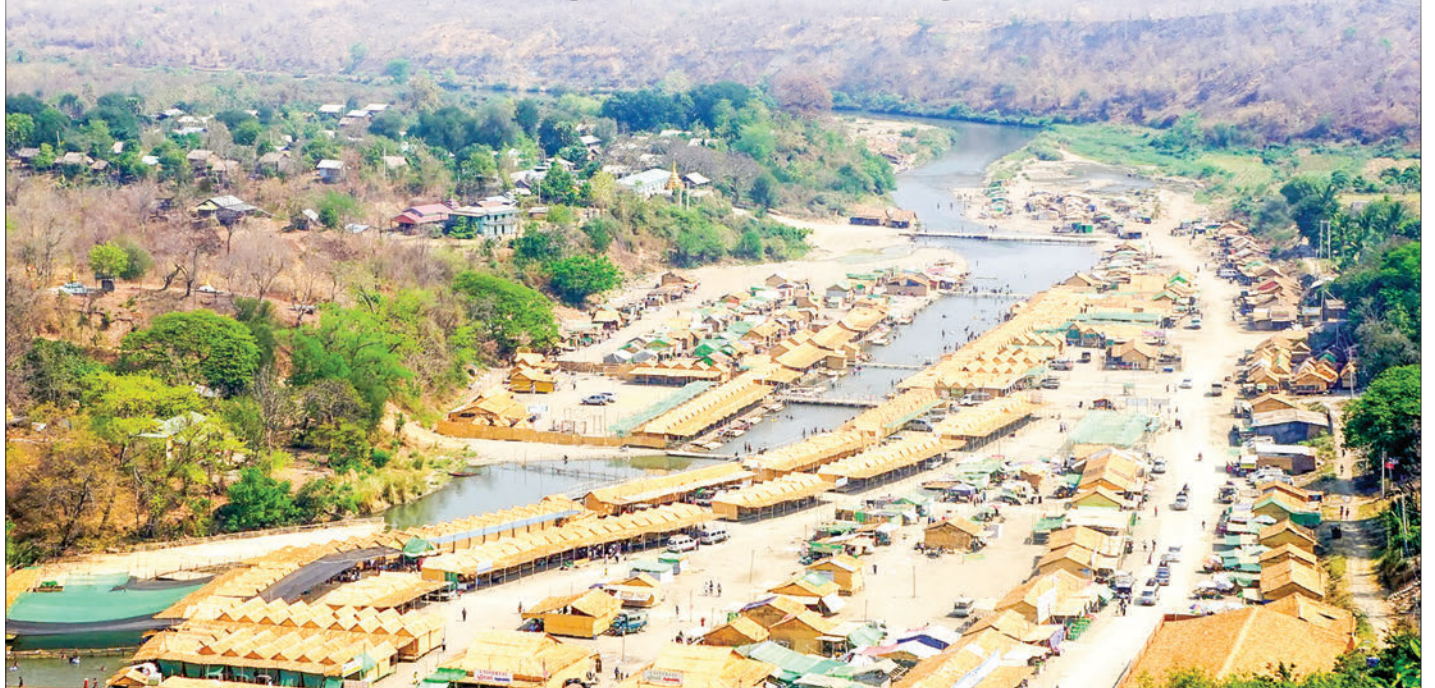
(Above & below): Photos show an aerial panorama of the Mann Shwesettaw Pagoda, packed with visitors.