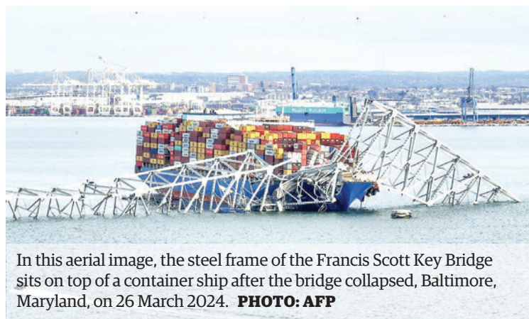
In this aerial image, the steel frame of the Francis Scott Key Bridge sits on top of a container ship after the bridge collapsed, Baltimore, Maryland, on 26 March 2024.

Similar measures were also announced in France on Sunday, where Prime Minister Gabriel Attal decided to upgrade the "Vigipirate" plan to "urgent attack" level. The decision comes just a few months ahead of the Olympic Games, to be held in Paris in July. Vigipirate is the key tool in France's anti-terrorism system, and involves both public and private entities in security efforts. — Xinhua