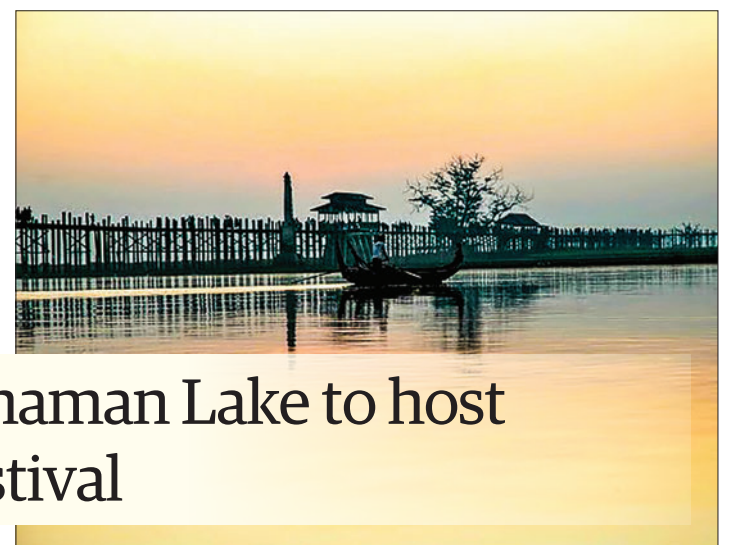
The photo shows the Taungthaman Lake and U Bein Bridge.

This year's Taungthaman Thingyan Festival will feature water pavilions, dance and entertainment pavilions, and a food donation program around