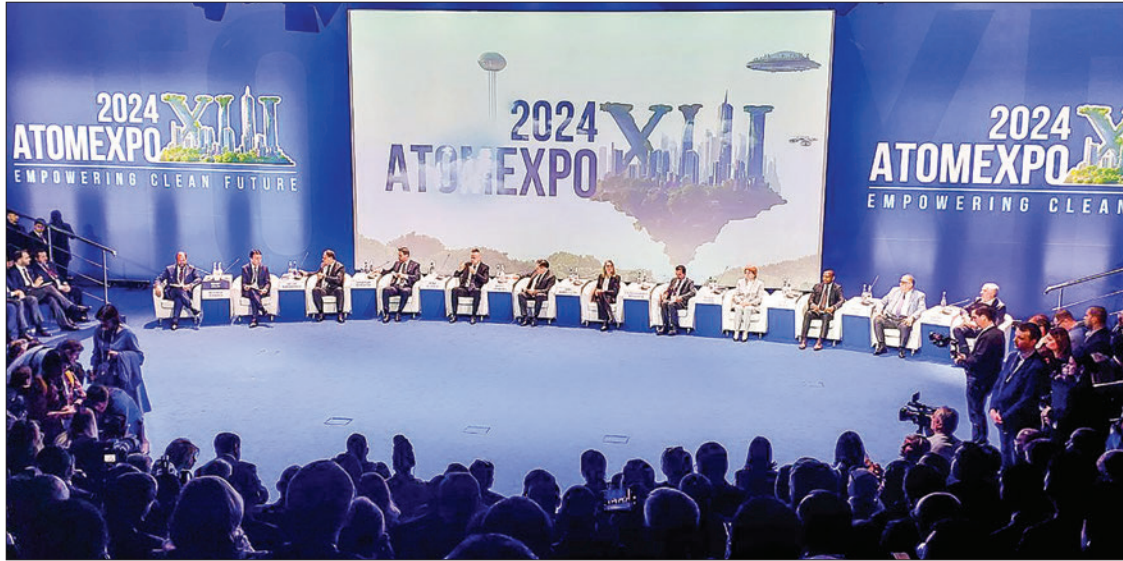
The XIII International Forum ATOMEXPO 2024 underway in the Russian Federation on 25 March 2024.

Next, the Union Ministers attend the launching ceremony of the XIII International Forum ATOMEXPO 2024, as well as the Plenary Session of the Forum, with the topic named "Clean