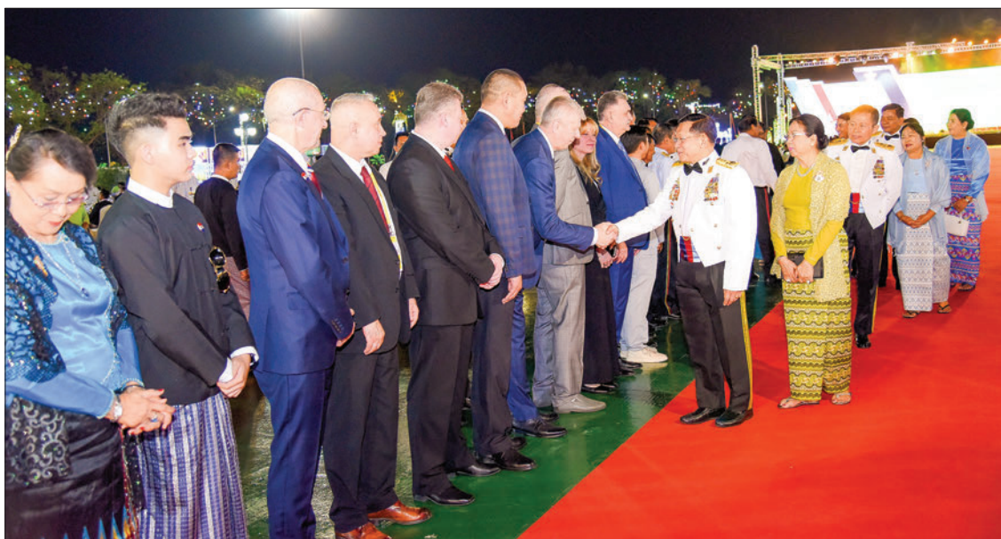
The Senior General cordially greets foreign attendees.