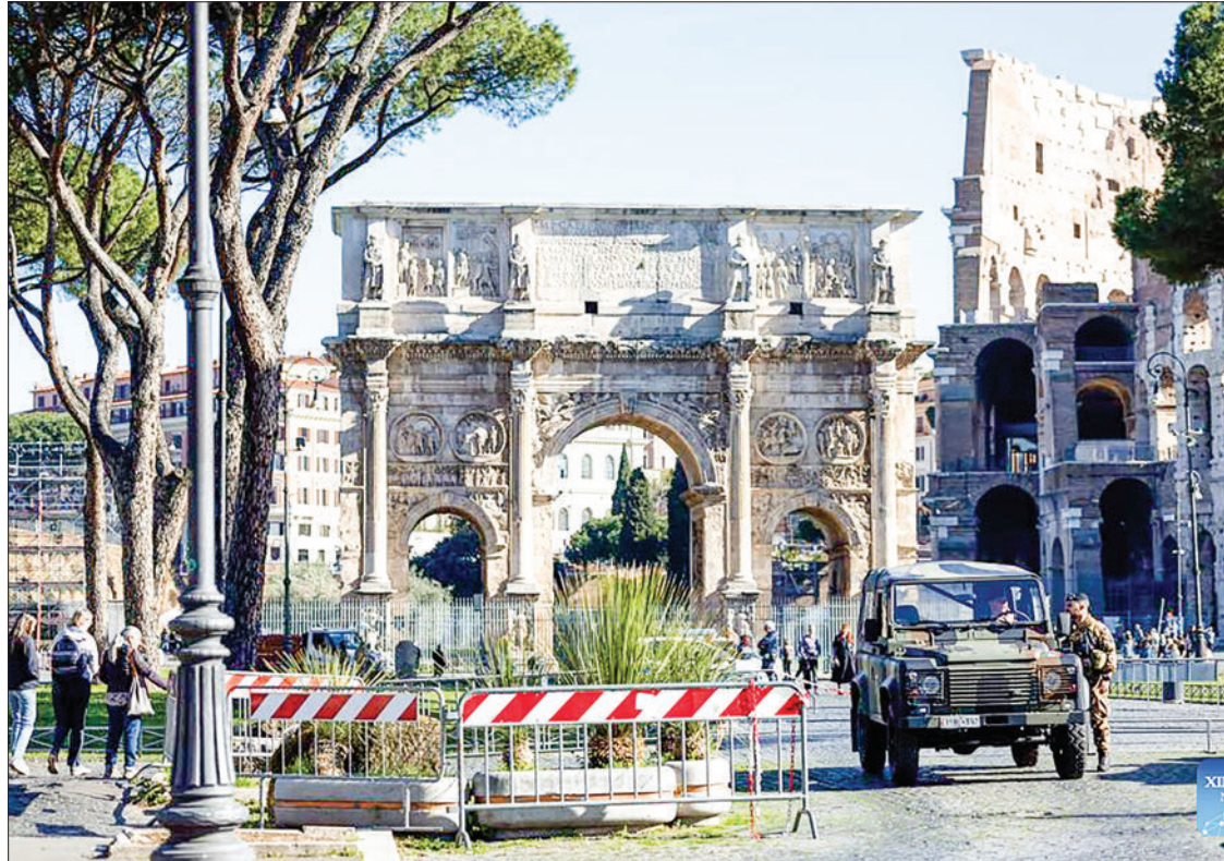
Italian soldiers stand guard in front of the Arch of Constantine in Rome, Italy, 25 March 2024.

Many foreign tourists also visit Italy in this period, with this number estimated at 3.3 million