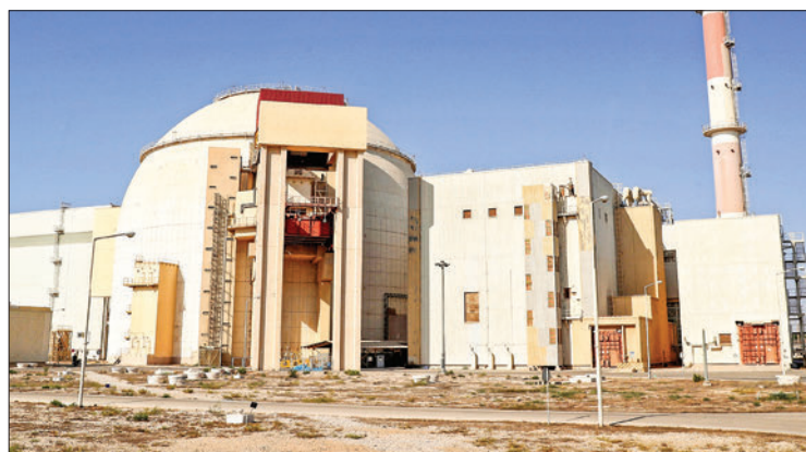
A handout picture provided by the Iranian presidency on 8 October 2021 the Bushehr Nuclear Power Plant, southeast of the city of the same name, during the visit of the country's president.

Bushehr NPP is a good example of international cooperation and, among other things, a creative approach to cooperation in the nuclear field. — SPUTNIK