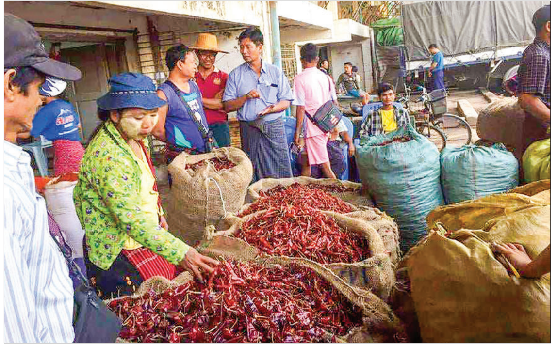
Chilli pepper sacks seen being piled up in front of a warehouse in the Bayintnaung area on 26 March 2024.

That is an unusual event in history, as the chilli pepper supply exceeded the demand, causing piles of stocks outside of the warehouses. U Hla Tin, a trader who saw that sight, told the GNLM. Of the commodities whose