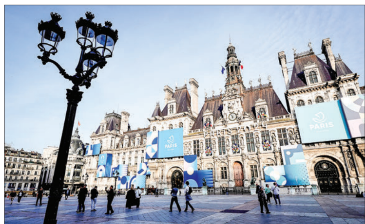
This photograph taken in Paris on 21 March 2024 shows a view of the Paris' city hall decorated with Paris 2024 Olympic and Paralympic Games' posters.

But a 2020 study by academics at the University of Oxford concluded that every summer Games since 1960 had gone over budget, with the average sports-related costs ending up between two and three times (172 per cent) the original estimate. — AFP