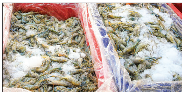
Saltwater shrimps en route to China.

THE General Administration of Customs of the People's Republic of China (GACC) has granted approval for the export of Myanmar's farm-produced saltwater shrimps, as confirmed by the Fisheries Department.