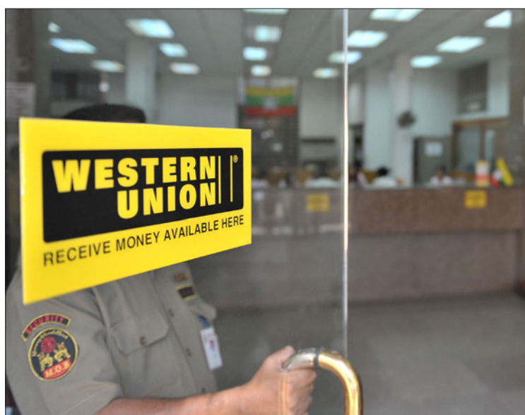
A domestic bank processing outward remittance.

Form SAS-1 of the IRD regarding profit transfer, goods transaction, profit, licence, brand name, lien, payment for trademark and service fees, taxpayer registration issued by the IRD for new taxpayers, statements for withholding tax payment or exemption evidence from the relevant tax offices must be attached as well. — TWA/EM