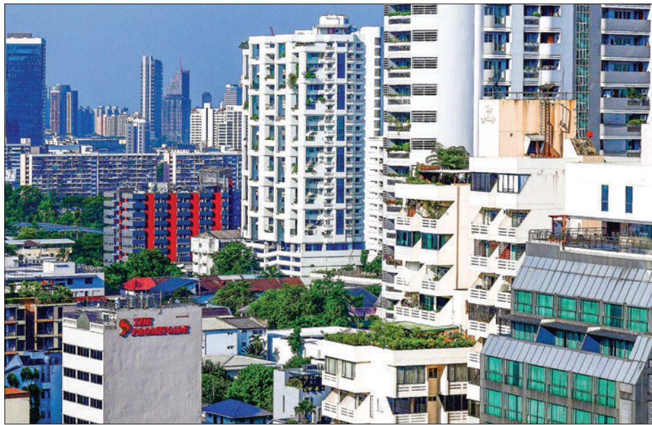
A general view shows residential and commercial buildings in Bangkok on 2 June 2023.

Thailand must also enhance tech competitiveness, strengthen competition regulations, attract skilled professionals, and empower small and medium-sized enterprises through increased access to finance for innovation, according to the report. — Xinhua