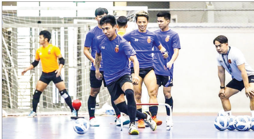
The Myanmar futsal team players are seen in their training session.

THE Myanmar national futsal team will play four international friendly matches before the final stage of the 2024 Asia Cup futsal tournament, which will be played in April.