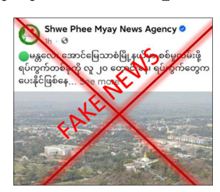
The screenshot validates misinformation.

According to a security official, the news about the gathering of 20 people from each of the wards in Aungmyaythazan Township of Mandalay Region is invalid. As the people know, the malicious media have been spreading mis-