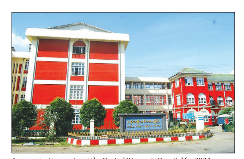
An examination centre at the Central Women's Hospital for 2024 matriculation exam.

THE Department of Myanmar Examinations has announced that four hospital examination centres will be available for the 2024 matriculation examination.