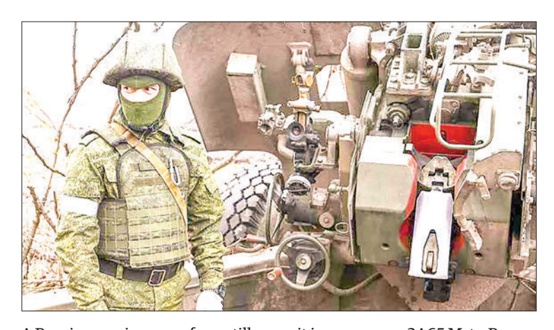
A Russian serviceman of an artillery unit is seen near a 2A65 Msta-B towed howitzer, in the southern sector in the course of Russia's military operation in Ukraine, at the unknown location.

Hungarian Foreign Minister Peter Szijjarto emphasized that deploying Western troops to Ukraine would contravene NATO's consensus decision, which Hungary supports.