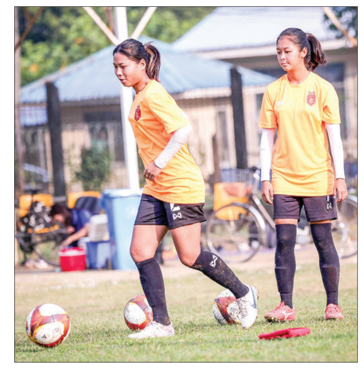
Myanmar women players are seen in their training sessions ahead of the international tourneys.

Most of the young players are included in the preliminary list that has been selected. The Myanmar Football Federation