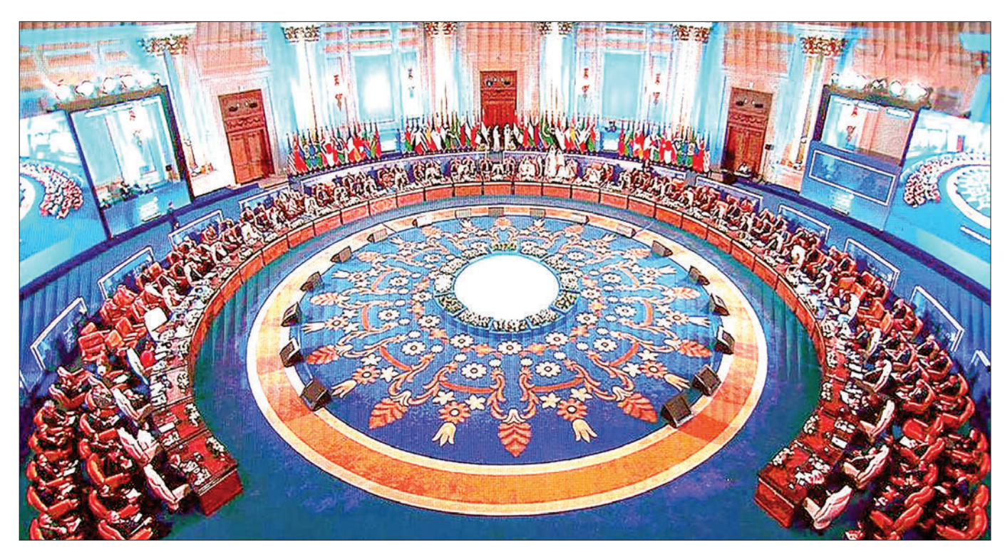
A scene from an international peace summit in Cairo, Egypt, on 21 October, 2023, where heads of state and ministers from several countries urged an end to the ongoing Israel-Hamas armed conflict in the Gaza Strip, is displayed on a screen at the media centre.

Planes attract lightning bolts once or twice per year. While it may be frightening, passengers are usually unharmed thanks to the smart design of modern aircraft. – SPUTNIK