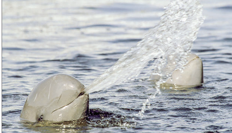
Irrawaddy dolphins seen swimming in the Mandalay-Kyakmyaung marine area of the Ayeyawady River.

THE Irrawaddy Dolphin Conservation Group of the Department of Fisheries (Mandalay Region)