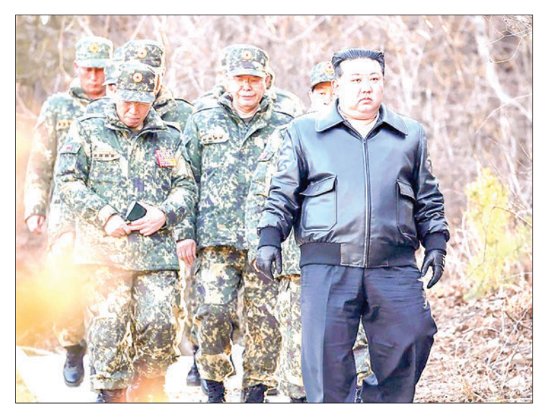
North Korean leader Kim Jong Un inspects a major operational training base at an undisclosed location in North Korea on Wednesday.