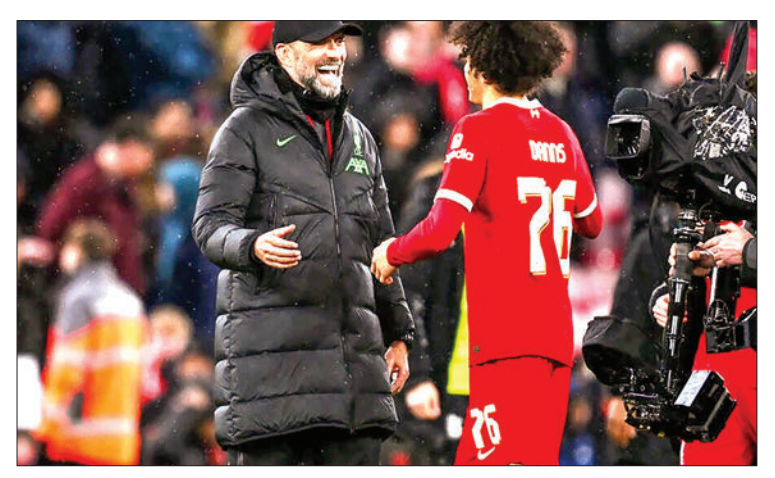
Jurgen Klopp's Liverpool head to the Czech Republic to face Sparta Prague.

Despite Sparta's strong performance in the Czech league and in Europe, Liverpool's exceptional form makes them the favourites to advance to the quarter-finals.