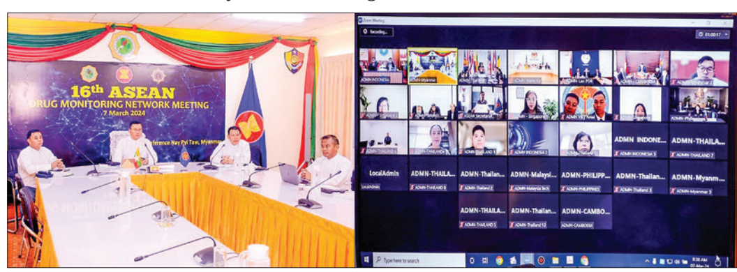
The 16^{\rm th} ASEAN Drug Monitoring Network meeting in progress online yesterday.

The ASEAN Drug Monitoring Network was established in 2015, and related meetings are convened to review the information contained in the drug monitoring reports of ASEAN countries, discuss and address any challenges encountered in inputting information via the online system, promote cooperation among member countries on drug-related issues, and facilitate the exchange of information. — MNA/TH