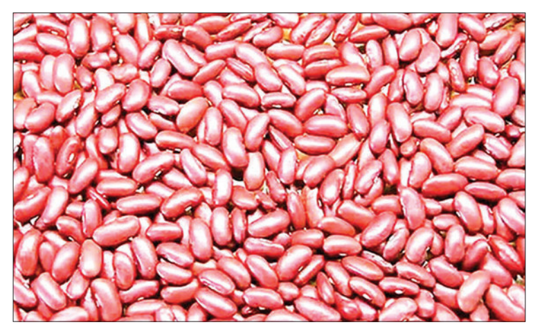
The photo provides a close-up view of kidney beans at the market.

Kidney bean is cultivated in October-November and harvested in early February. They are grown in the upper Sagaing Region, Bhamo in Kachin State, Kayin State and along the Ayeyawady River. The beans produced from Katha and Bhamo townships are in high demand in the domestic market due to their large size. — NN/EM