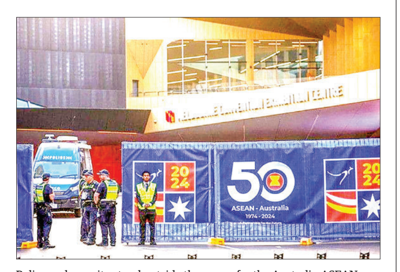
Police and security stand outside the venue for the Australia-ASEAN (Association of Southeast Asian Nations) summit in Melbourne on 4 March 2024.

Australia's new funding package will provide export financing and loans geared largely towards infrastructure and renewable energy projects.—AFP