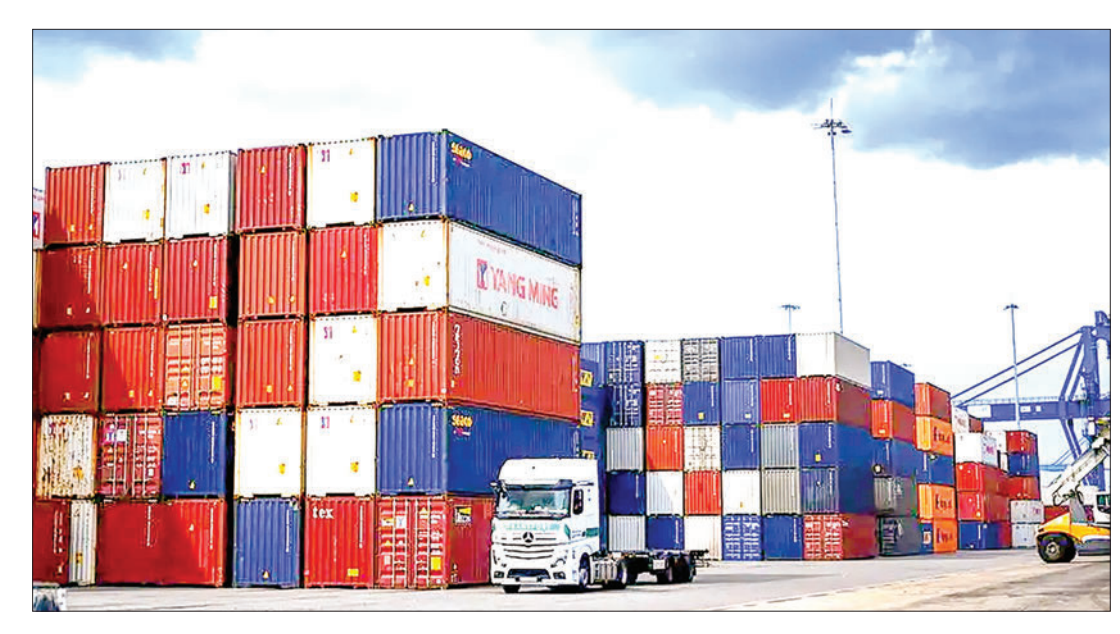
A truck stands next to empty containers at the seaport terminal DIT Duisburg Intermodal Terminal at the Duisburg harbour, on 13 July 2023.

The boost in exports comes as a rare positive development for Germany, which faced economic challenges last year.