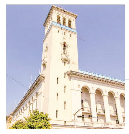
Myanma Port Authority's Store Department, where tender forms and tender rules can be

ers and 10 LCL shipments will be sold at auction, according to the Ministry of Transport and Communications.