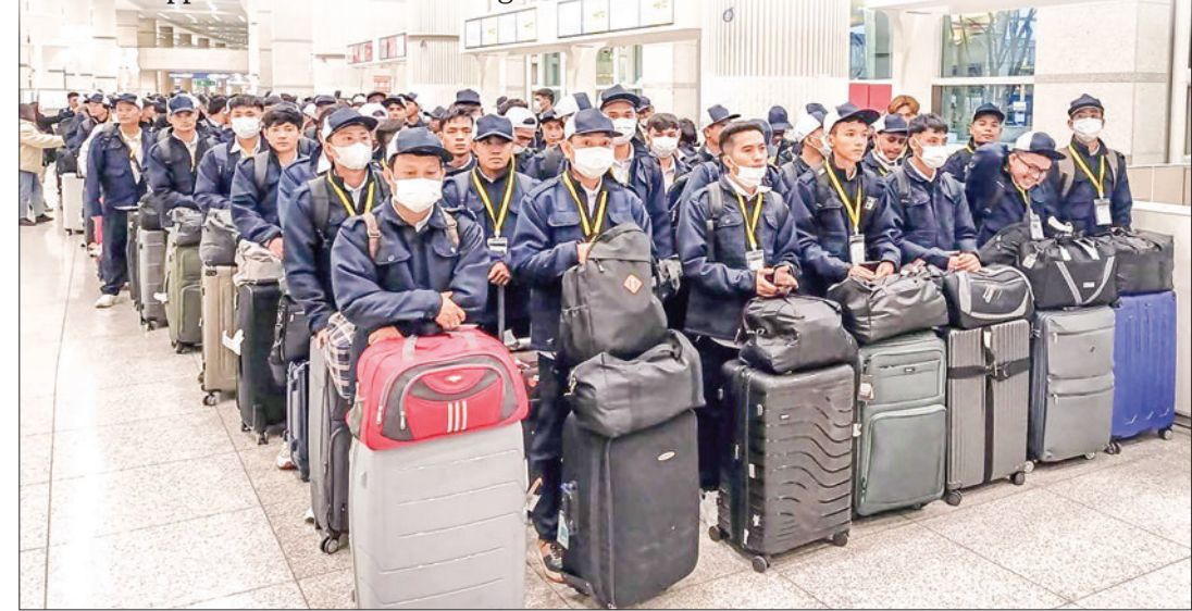
A total of 141 new manufacturing workers sent to the Republic of Korea through the Public Overseas Employment Agency (POEA) via the EPS system arrive at the Incheon International Airport of the Republic of Korea on 6 March 2024.

At present, more than 70,000 Myanmar workers have been working in Korea through the EPS system. — TWA/KZL