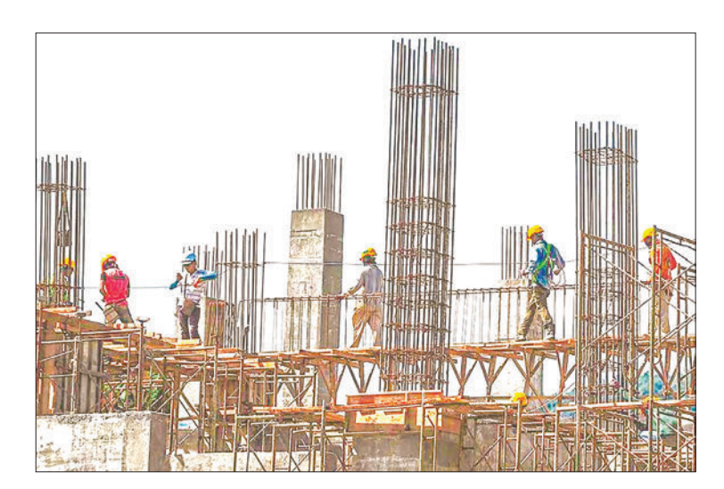
Despite global efforts, the sector's greenhouse gas emissions continue to rise, highlighting the urgent need for innovative solutions to decarbonize construction practices and align with climate goals outlined in the Paris Agreement.

"We support Palestine's full membership in the UN, and urge certain UN Security Council member to stop laying obstacles to that end," Wang said, adding that China calls for a more broad-based, more authoritative, and more effective international peace conference to work out a timetable and road map for the two-state solution. — Xinhua