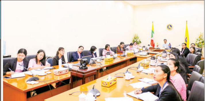
The 27th ASEAN Senior Level Committee Meeting for Financial Intergration in progress online yesterday.

Settlement System (PSS) and Steering Committee on Capacity Building (SCC).