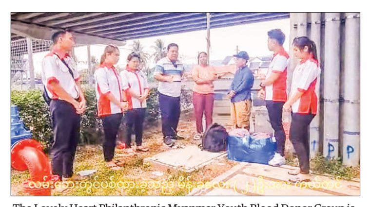
The Lovely Heart Philanthropic Myanmar Youth Blood Donor Group is helping two Myanmar women who were abandoned under the bridge.

A broker on TitTok cheated 600 Ringgits from two Myanmar women and abandoned them on the street in Malaysia, according to Lovely Heart Philanthropic Myanmar Youth Blood Donor Group (Kuala Lumpur-Malaysia).