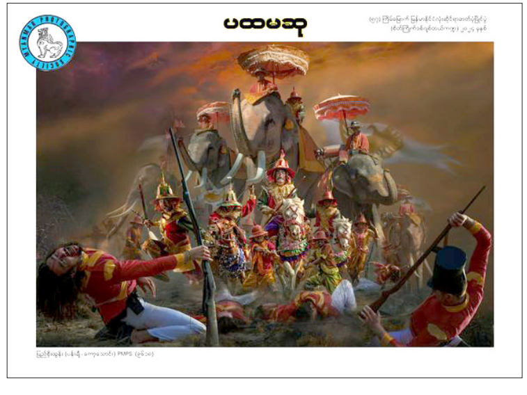
A glimpse of photos which were awarded first prizes.

The 57th Annual Myanmar Photo Contest is an annual event held by the MPA. Entries for the 2024 competition opened in November 2023, and the final selection of award-winning photographs was completed earlier this month. Over 700 photographs were submitted across six different categories.