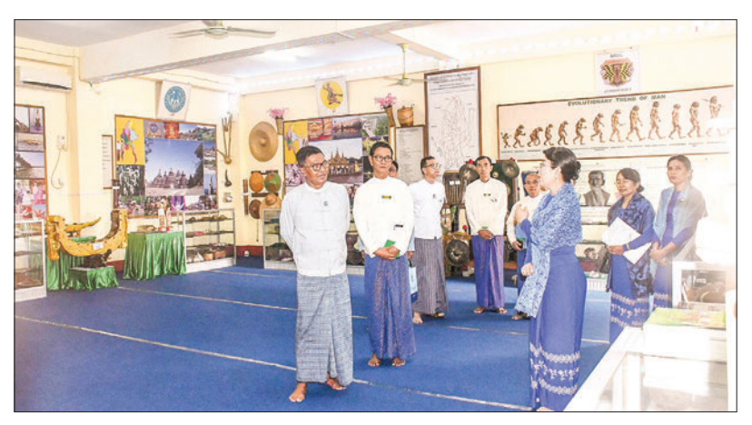
Deputy Minister U Ye Tint views round the Nationalities Youth Resource Development Degree College in Yangon yesterday.

DEPUTY Minister for Information U Ye Tint met students, teachers and staff of Nationalities Youth Resource Development Degree College (Yangon) yesterday afternoon to discuss youth affairs and the development of human power.