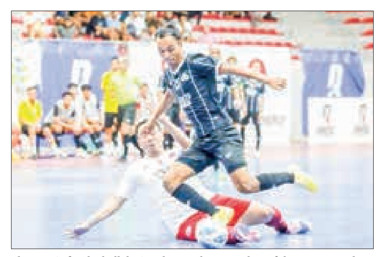
Players vie for the ball during the Week-17 matches of the MFF Futsal League I at the Futsal Stadium in Yangon on 2 March 2024.

With one game to go before the end of the second round, the top three teams, VUC, MIU, and Generations, will vie for the playoffs. — Shine Htet Zaw/KZL