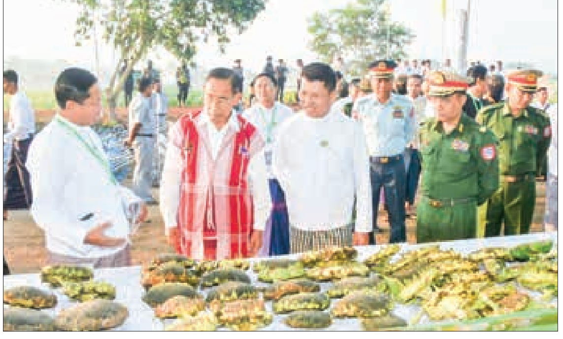
State Administration Council Member Mahn Nyein Maung observes harvested sunflower seed at the SuperSun-41 sunflower plantation on the 10-acre croplands in Thebyu Village-tract of Thaboung Township.

The SAC member and party attended the real-life show on undertakings and experiences of prize-winning farmers. They also viewed the thriving of a SuperSun-41 sunflower plantation on the 10-acre croplands in Thebyu Village-tract of Thaboung Township. — MNA/ KTZH