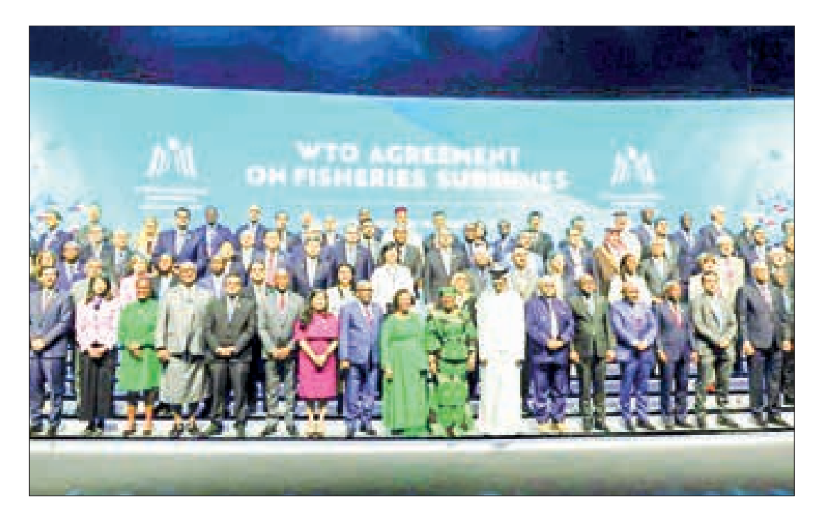
A closing conference previously scheduled for 1300 GMT on Friday was pushed back by three hours, as trade ministers negotiated new draft texts on fisheries and agriculture after all-night talks.