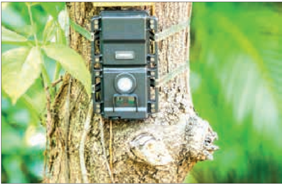
Camera traps are a type of remote cameras used to capture images of wildlife with as little human interference as possible.

World Wildlife Day should connect people with our natural world and inspire