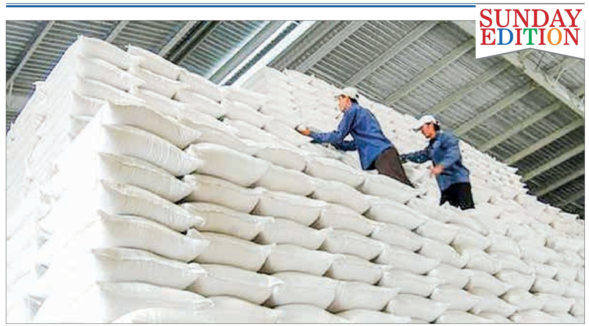
Export rice bags are pictured being arranged by diligent workers in the warehouse.