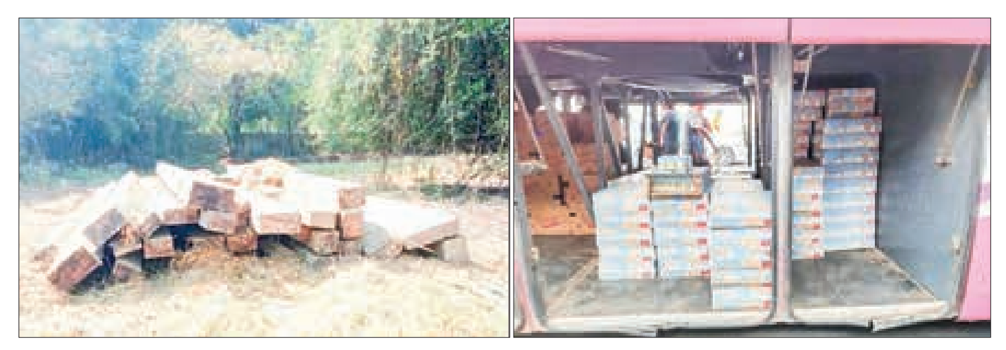
Confiscated illegal timbers in Bago Region and illegal Lactasoy soy milk in Yangon Region.

THE combined teams managed by the Customs Department confiscated 605.5 kilogrammes of Polyester 3D Air Mesh from China that exceeded the Import Declaration (ID) worth K2.098 million at the Asia World Port Terminal container checkpoint on 29 February. This enforce-