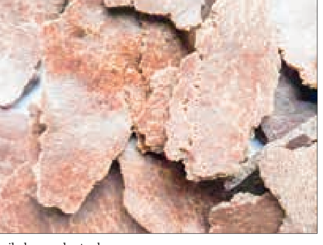
De-oiled groundnut cakes.

"De-oiled groundnut cake is sold in viss, and here it is K2,600, K2,700 or K2,800. Demand is rising. But, due to transport issues, sellers and buyers face a few difficulties. You can see plenty of these cakes as this is the groundnut harvest-