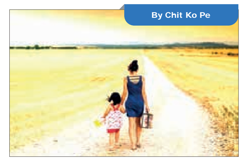
A woman plays variety of great roles in everyone's life in various forms by being involved in various relationships. From her birth till her end of life, she plays various roles as a daughter, sister, wife, mother and other relationships.

She laughs, helps comfort, and hides her pain. When you struggle, she pulls you through All this is she, and what do we do?