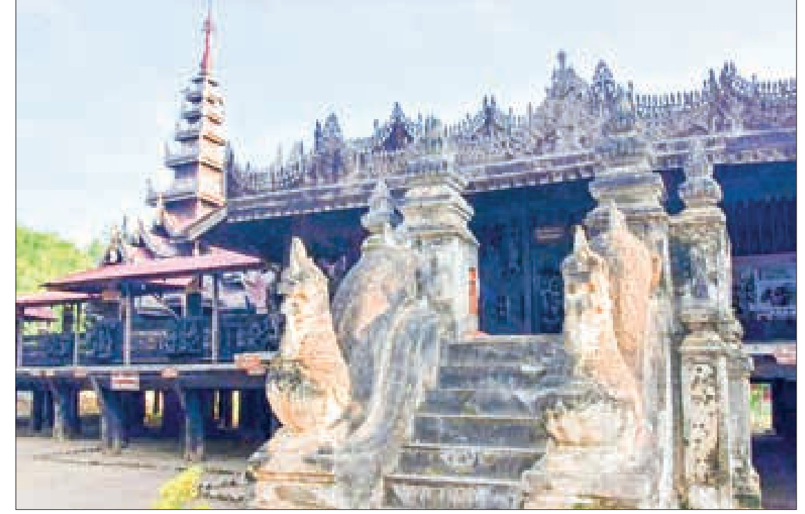
The photo depicts the Yokesone Monastery.

Digital documentation also includes three-dimensional visualization of ancient artefacts, creating an immersive online experience that simulates the feeling of being inside the museum itself. The artefacts with greater historical significance will be prioritized. Online visitors