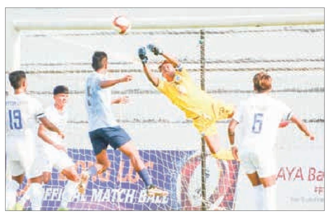
Dagon Port FC's goalie clears the attack of the Dagon Star at Padonmar Stadium in Yangon on 2 March 2024.