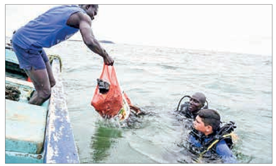
Ocean of Pollution: In this file photo, scuba divers deliver collected plastic waste and other items from a bay during a 'clean-up day' campaign of the ocean off the coast of the capital Dakar, Senegal.

The high-level segment of UNEA-6 commenced in Nairobi, with African leaders stressing the need for a strengthened multilateral system to address global challenges like climate change and pollution.