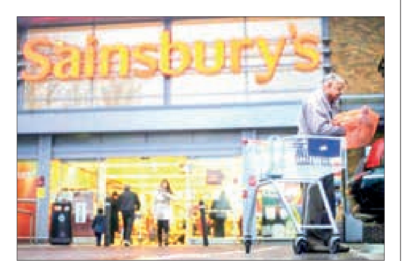
Sainsbury's employs about 162,000 staff. PHOTO: AFP

Elsewhere Thursday, the UK arm of The Body Shop cosmetics group confirmed the loss of nearly 500 jobs with the closure of about 75 shops following recent poor sales. - AFP