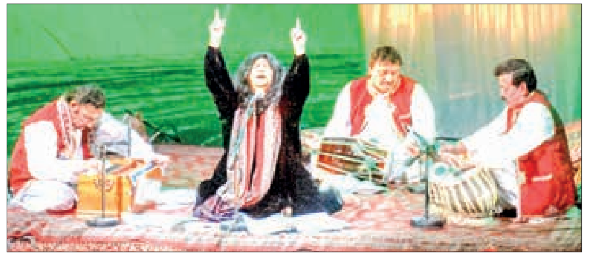
Sindhis are an Indo-Aryan ethnolinguistic group who speak the Sindhi language and are native to the Sindh province of Pakistan. PHOTO: PIX FOR VISUAL PURPOSE/WIKIPEDIA

now, what discrepancies we are facing and how we want our digital connectivity to evolve for people and planet. — WEB TV/UN.ORG