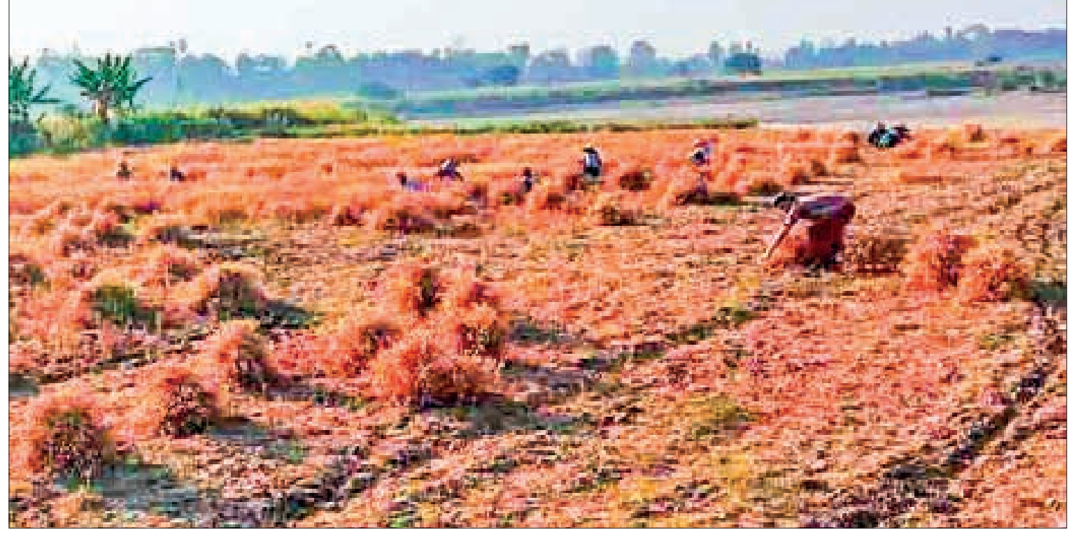
Farmers harvest chickpeas in a field in Nyaungsauk Village, Pwintbyu Township, Magway Region.

The country primarily cultivates paddy, corn, cotton, sugarcane, various pulses and beans. Its second largest production is pulses and beans,