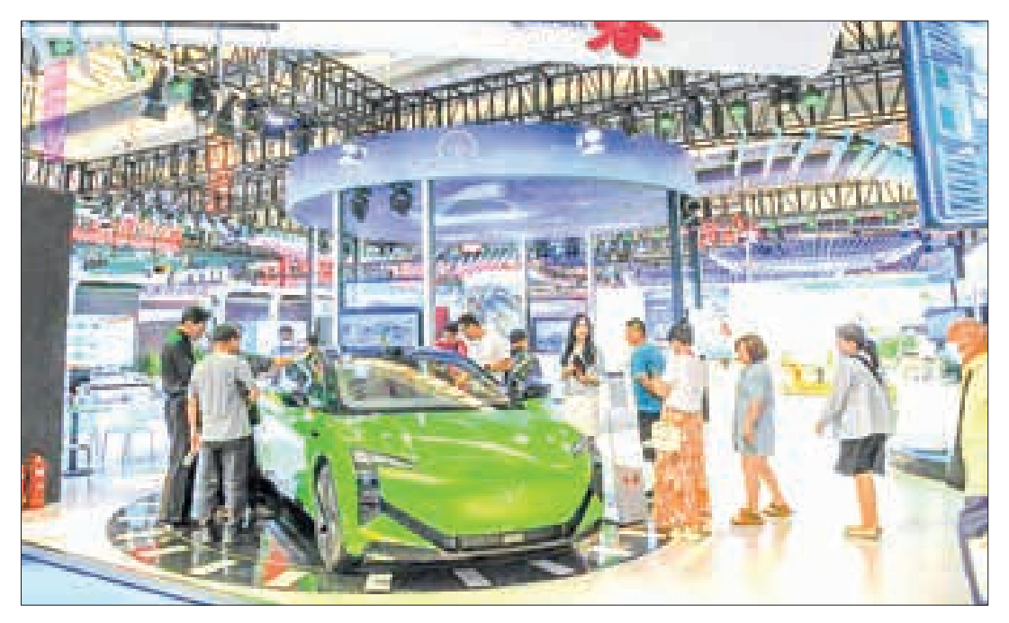
Visitors watch a new-energy car displayed by FAW Hongqi during the 14th China-Northeast Asia Expo in Changchun, northeast China's Jilin Province, 23 August 2023.