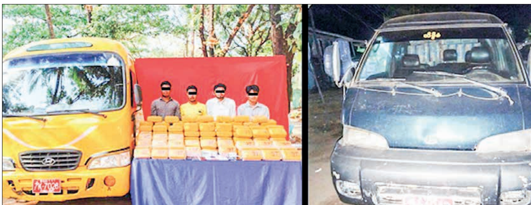
Suspects seen with seized stimulant tablets and vehicles in Kyaikto Township.

Legal proceedings have been initiated against the offenders, and an ongoing investigation is underway to apprehend others involved in the case. — MNA/MKKS