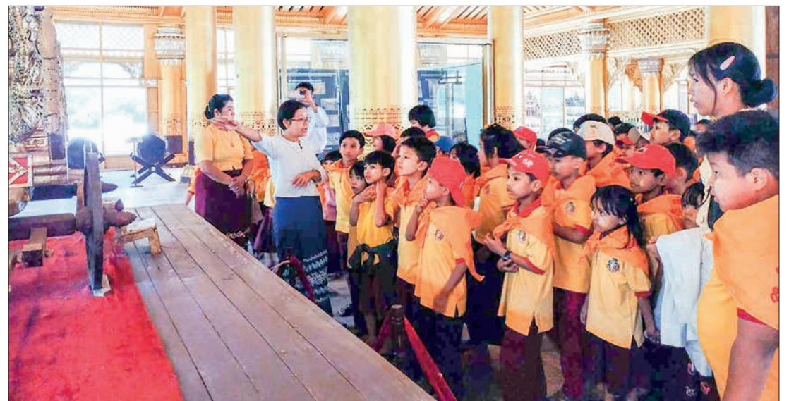
The photo shows students and visitors at the museum.

Museums across Myanmar are open daily from 9:30 am to 4:30 pm, except on Mondays and public holidays. — ASH/MKKS