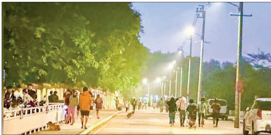
Trekkers and views of Mount Taung Wine.

The Sasana Nwe Foundation has advised Mount Taung Wine visitors to refrain from smoking while walking, to dispose of rubbish properly in designated bins, and for vendors not to conduct sales activities on the concrete road.