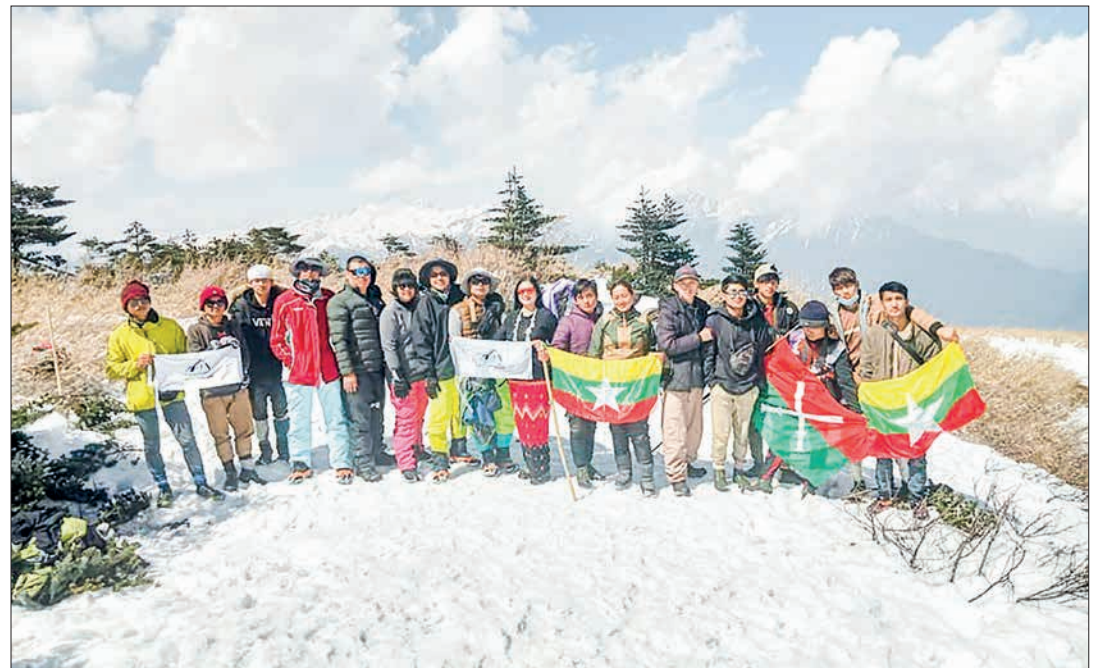
Trekking in Myanmar.

THERE are two months left for the opportunity to enjoy dense snow caps by climbing the snow-capped Mount Hponkanrazi, and they will organize a weekly 5-night 6-day trip from PutaO, according to an official from the Trekking in Myanmar.