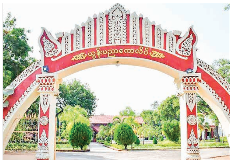
Lacquerware Technology College (Bagan).