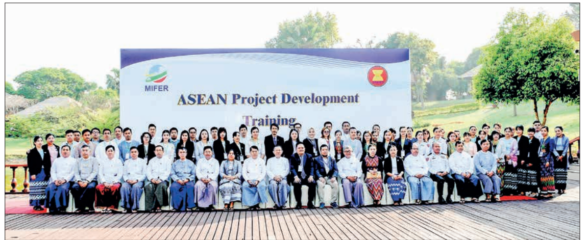
MIFER Union Minister Dr Kan Zaw poses for group photo after ASEAN Project Development Training in Nay Pyi Taw yesterday.

The training will last from 20 to 22 February 2024. The technical experts from the ASEAN Secretariat will give lectures on overview of the ASEAN cooperation projects, the ASEAN project proposal template, formulating Project results in the proposal materials and the work plan for the implementation. During the training, the participants will get hand-on experience for de-