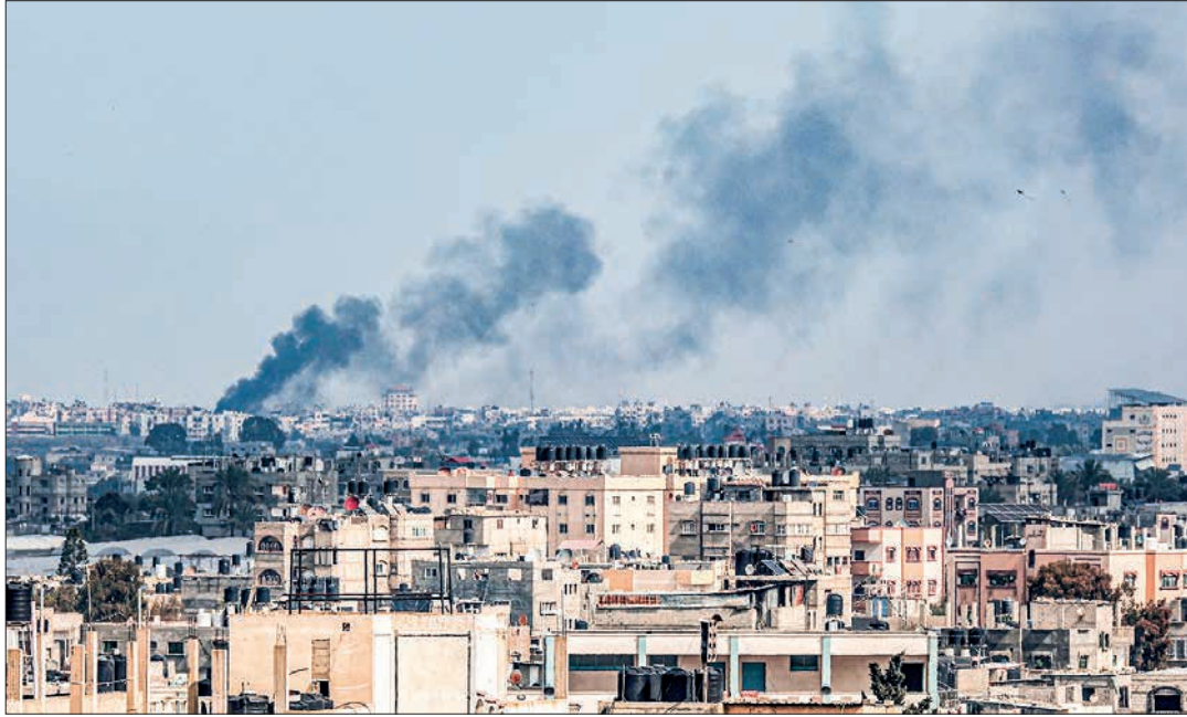
This picture taken from Rafah shows smoke billowing over Khan Yunis in the southern Gaza Strip during Israeli bombardment on 20 February 2024, amid continuing battles between Israel and the Palestinian militant group Hamas.

ISRAEL hit Gaza with air strikes on Tuesday as world powers grappled with how to broker a ceasefire ahead of a UN Security Council vote that was expected to be blocked by a US veto.