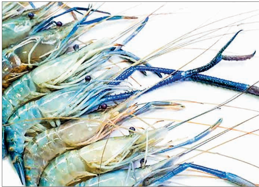
The photo shows marketable lobsters and shrimps bred in Ayeyawady Region.

U Tun Win Aung stated, "Seawater shrimp farming is primarily conducted in areas at high salinity levels, including Labutta Township. However, there is a growing trend toward freshwater hybrid shrimp. These hybrid shrimps are not the original species of Myanmar. The shrimps can be bred commercially, with from 80,000 shrimps up to 100,000 shrimps on a one-acre plot. The breeding cycle takes just six months, after which these shrimps can be sent to the market. Cold storage facilities operate not only for export but also for local