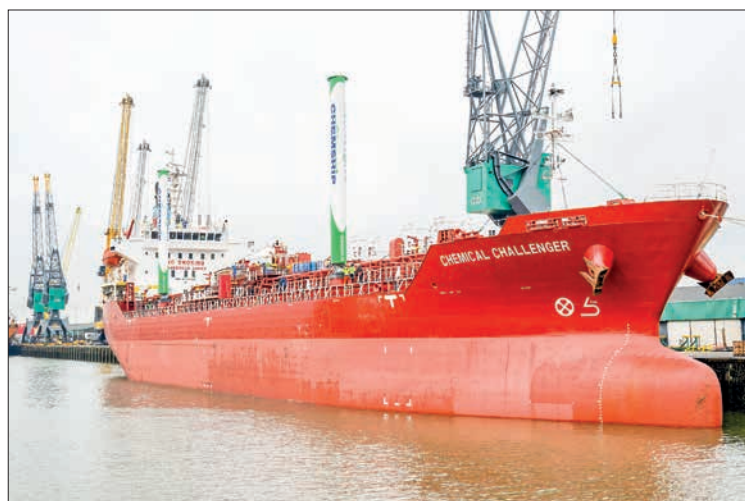
This photograph taken on 16 February 2024, shows a view of the 16,000 ton MT Chemical Challenger ship of Dutch shipping company Chemship BV, a chemical tanker equipped with sails in Rotterdam.

"Shipping has always been extremely competitive and it will be a struggle to reach these targets," admitted Grotz, who added the company was unlikely to "make money" on its latest project. — AFP