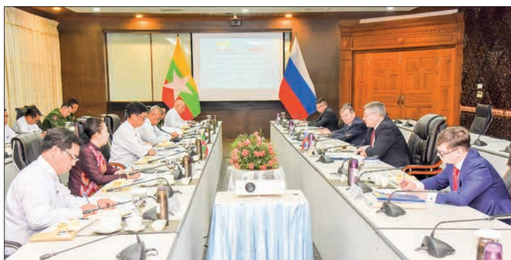
Deputy Minister for Foreign Affairs U Lwin Oo meets Russian Deputy Minister of Foreign Affairs Mr Andrey Rudenko.

THE Myanmar-Russia Political Consultations co-chaired by U Lwin Oo, Deputy Minister for Foreign Affairs of Myanmar and Mr Andrey Rudenko, Deputy Minister of Foreign Affairs of the Russian Federation, was held yesterday afternoon, at the Ministry of Foreign Affairs in Nay Pyi Taw.