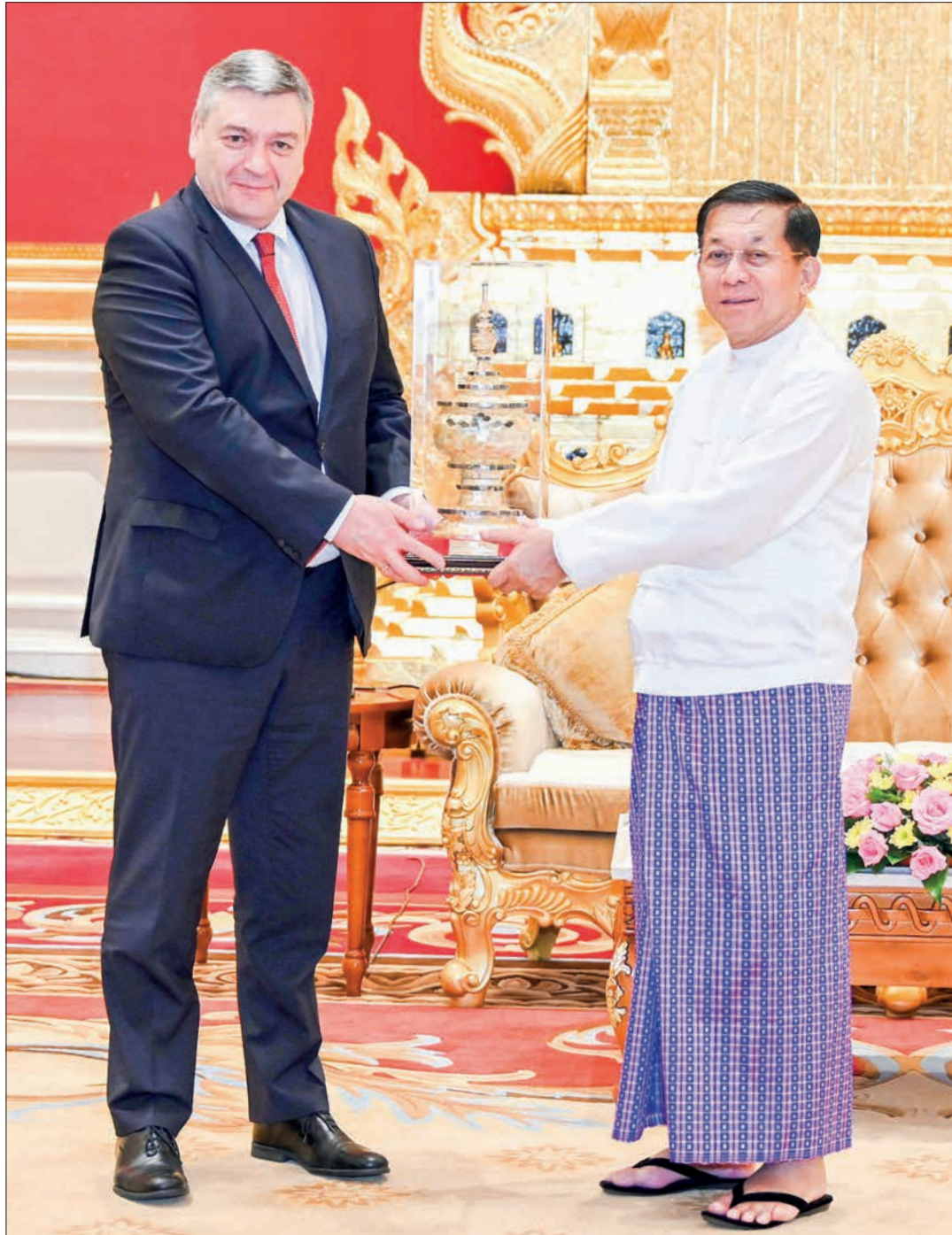
SAC Chairman Prime Minister Senior General Min Aung Hlaing gives gift to Russian Deputy Minister of Foreign Affairs Mr Andrey Rudenko at SAC Chairman Office in Nay Pyi Taw yesterday.

Also present at the meeting were Council Joint Secretary Lt-Gen Ye Win Oo, Deputy Prime Minister Union Minister for Foreign Affairs U Than Swe, Deputy Minister for Foreign Affairs U Lwin Oo and officials. The Russian Deputy Minister of Foreign Affairs was accompanied by Russian Ambassador to Myanmar Mr Iskander Azizov and officials. — MNA/TTA