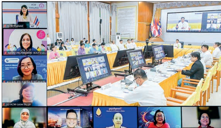
The workshop on advancement of women in ASEAN countries in progress yesterday.

Meanwhile, the Chairperson of the ASEAN Commission on the Promotion and Protection