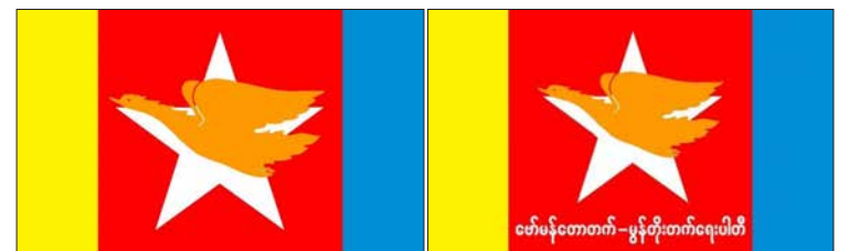
The flag design of the Mon Development Party