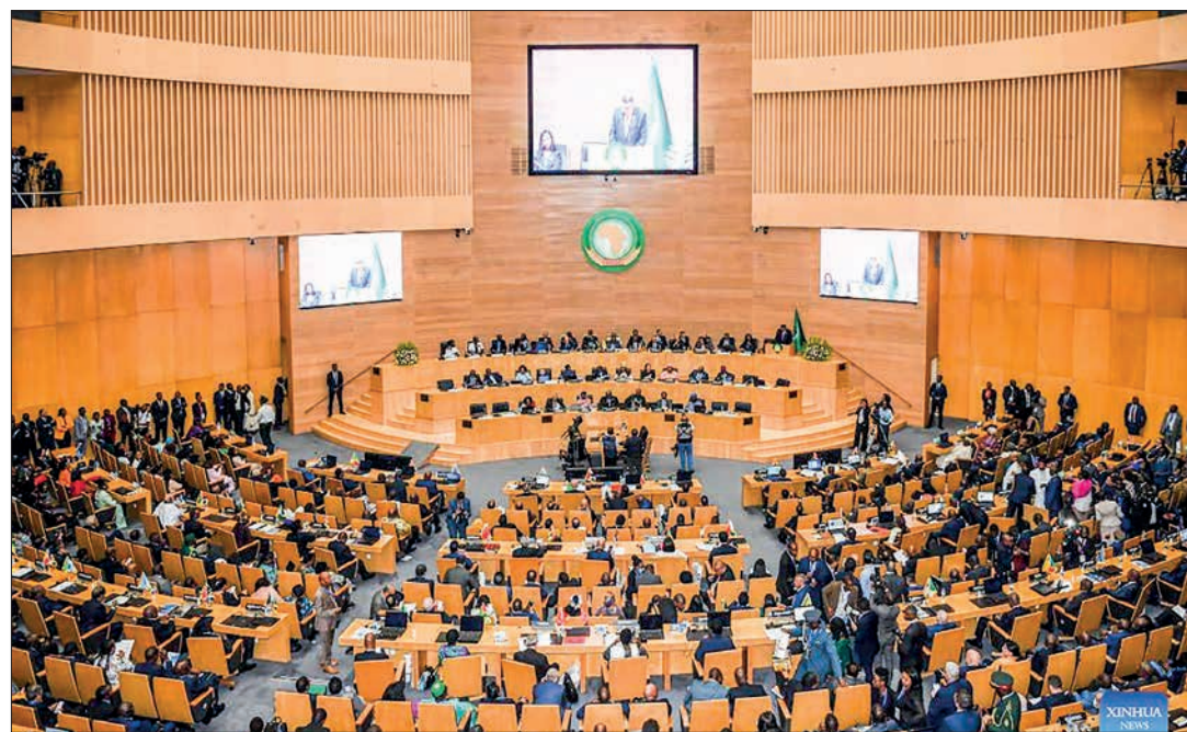
This photo taken on 17 February 2024 shows a scene of the 37 th Ordinary Session of the African Union (AU) Assembly of the Heads of State and Government in Addis Ababa, Ethiopia.