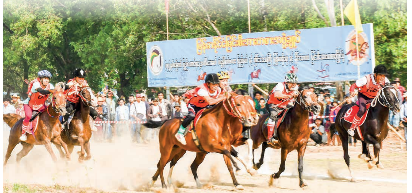
Jockeys competing in different events of equestrian championship in Yangon yesterday.

THE Inter-State/Region Myanmar Traditional and International Equestrian Championship, in honour of the 77 th Anniversary of Union Day, concluded in Dagon Myothit (North) Township, Yangon yesterday morning.