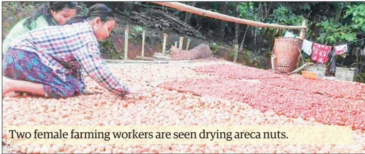
Two female farming workers are seen drying areca nuts.

Bangladesh is the primary purchaser of areca nuts, and Myanmar exported nearly 2,000 tonnes to Bangladesh in the 2021-22 financial year, according to statistics released by the Ministry of Commerce. — TWA/TMT