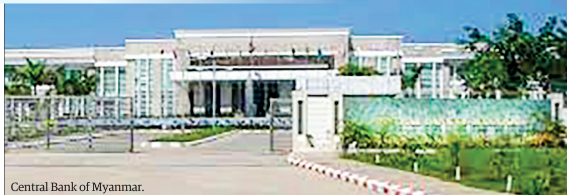
Central Bank of Myanmar.

tified that outward remittance must comply with the rules and regulations of the Foreign Exchange Management Committee.