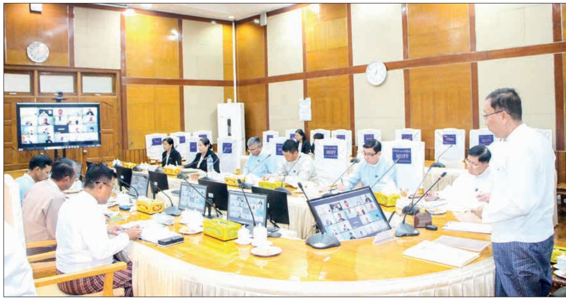
DPM Union Minister for Planning and Finance U Win Shein speaking at Microfinance Business Supervisory Committee meeting 1/2024 in Nay Pyi Taw yesterday.

The MBSC should supervise the licensed microfinance companies to follow the law, rules and regulations, procedure and directives in offering financial services, and should