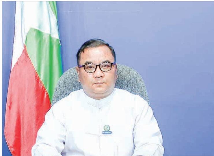
Leader of Information Team of State Administration Council Maj-Gen Zaw Min Tun.

ated that a suitable amount of strength will be recruited for the military services in the set age limit not to be a burden for the State and the people. People need to take care of instigations based on unfounded information and criticisms.