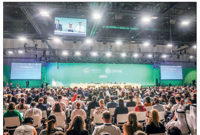
Participants attend a COP28 a plenary session at the United Nations climate summit in Dubai on 13 December 2023.

The failure of wealthy nations to meet their previous goal of $100 billion per year by 2020 has soured trust, with indications the target was likely reached only in 2022. — AFP