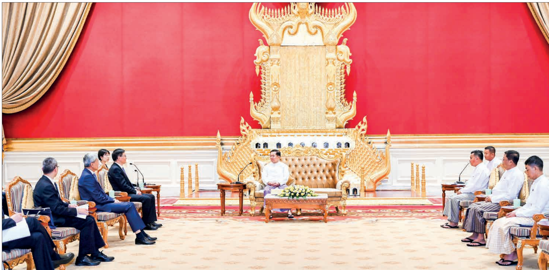
SAC Chairman Prime Minister Senior General Min Aung Hlaing receives Deputy Secretary of Yunnan Provincial Party Committee of the Communist Party of the People's Republic of China and Yunnan Province Governor Mr Wang Yubo in Nay Pyi Taw yesterday.

Senior General Min Aung Hlaing and Deputy Secretary of Yunnan Provincial Party Committee of the Communist Party of the People's Republic of China and Yunnan Province Governor Mr Wang Yubo exchanged views on assistance of China in peace talks and peace process of Myanmar for ensuring peace and stability in the border region and the entire country.