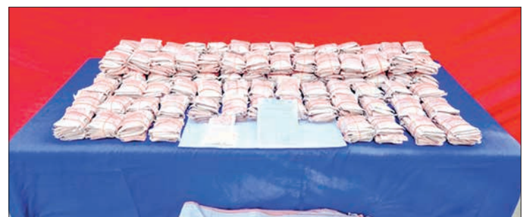
Seized packets of Happy Water displayed in Mandalay.

The perpetrator confessed that the seized drugs were to be transported from Shan State to Kachin State through Mandalay Region. Legal proceedings have been conducted against the offender, and an ongoing investigation is underway to apprehend others involved in the case. — MNA/MKKS