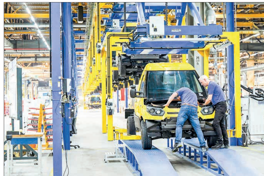
Employees control an assembled electric vehicle at the plant of Neapco Europe in Dueren, western Germany, on 22 August 2023.

THE market share of electric vehicles dropped below 11 per cent in Europe last month, despite an increase in sales as the overall auto market rebounded, data released on Tuesday by the European Automobile Manufacturers' Association (ACEA) showed.