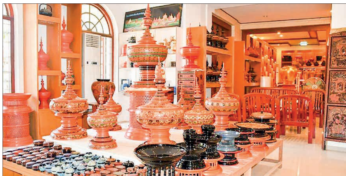
Different types of lacquerwares displayed at showroom.

Although lacquer has an attachment to ancient Bagan, lacquer was not included in Myanmar’s traditional arts and