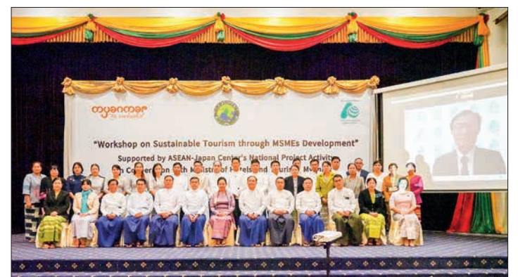
Union Minister Dr Thet Thet Khine poses for documentary photo together with workshop participants yesterday.

attended the Workshop on St Petersburg-Myanmar Tourism Development marking 76 th anniversary of establishment of Myanmar-Russia diplomatic ties online in the same evening.