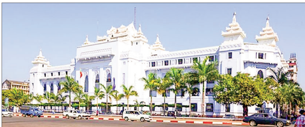
The photo shows Yangon City Hall where the YCDC is located.

The interested persons can buy the tender application forms until 28 February and have to submit them by 29 February. For further information, dial 01-8376708, 01-8377890 and 09-420144112 during the office hours. — TWA/ TMT