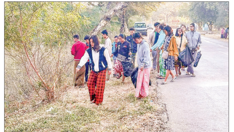
Local people clean up plastics and other debris in Bagan Ancient Cultural Zone during a campaign on 17 February 2024.