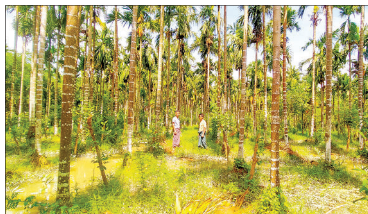
Farmers are seen in an areca nut farm.

Presently, the refinery is not ready yet. However, 800 tonnes of crude palm oil produced from 8,000 out of 15,000 acres of palm plants in Mawtaung will be exported to Yangon via the Myeik jetty. — ASH/NT