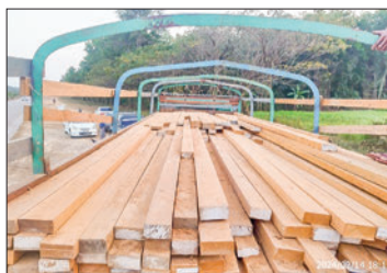
Confiscated illegal timbers in Bago Region.

On 16 and 17 February, the Sagaing Region Illegal Trade eradication special