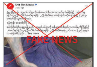
The screenshot validates the fake news about injured person attacked by Tatmadaw.

Likewise, another unfounded report alleged that a heavy weapon attack by the Tatmad-