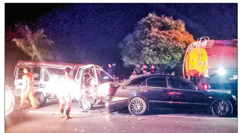
Traffic accidents on the roadside of Thanlwin Road in Pobbathiri Township, Zeyathiri District in Nay Pyi Taw on 14 January 2024.