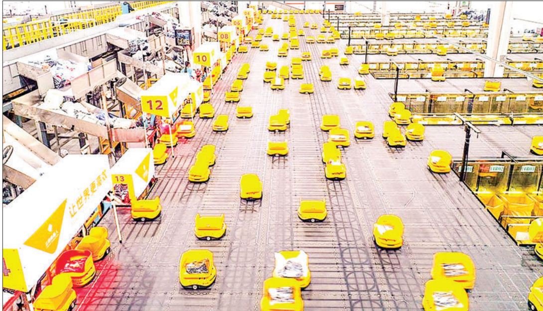
This aerial photo taken on 8 November 2023 shows robots sorting and conveying parcels at an intelligent logistics center in Deqing County, east China's Zhejiang Province.