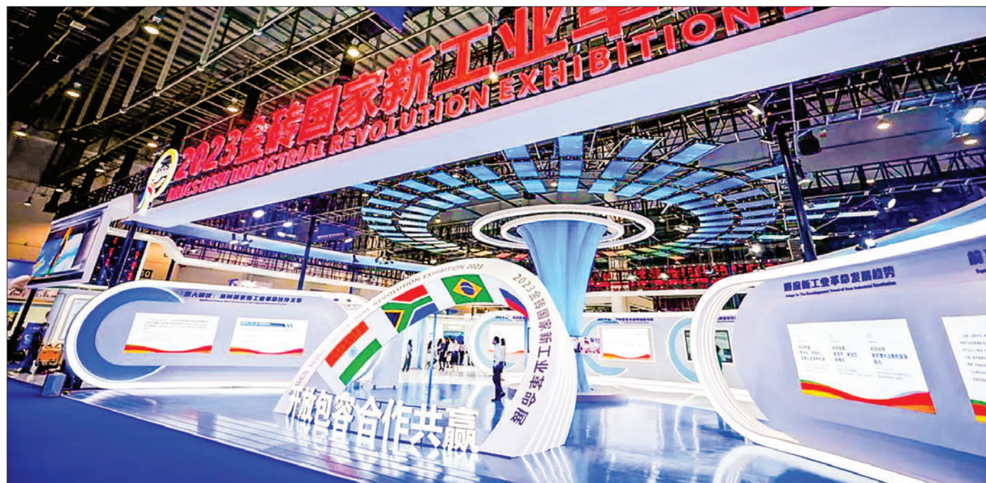
The 2023 BRICS New Industrial Revolution Exhibition focuses on the theme of "Deepening Partnership Cooperation, Promoting the New Industrialization of BRICS Countries", based on the high-end, intelligent, and green development of the manufacturing industry in BRICS countries.

President Putin emphasized Russia's aim to enhance multilateral industrial cooperation with foreign partners, intending to expand alliances with the Eurasian Economic Community, BRICS countries, and other willing associations.