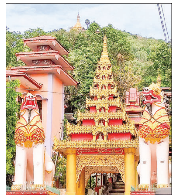
The photo shows the Myathabeik Pagoda.

During the Buddha Pujaniya festival, the Buddha's sermons are recited at the Pagoda's platform. Additionally, at 5 am on the full moon day, the Pagoda on the summit of the mountain will be consecrated by Sayadaws with an offering of flowers, candlelights, joss sticks, and 1,000 bowls of alms. After that, the donors will offer the Htamane alms, rice and foodstuffs to more than 680 monks from 174 monasteries and over