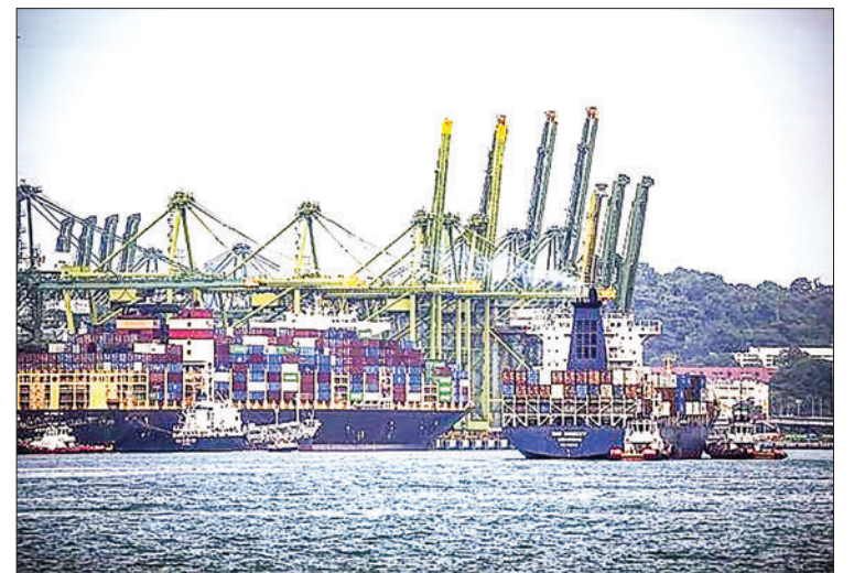
Container ships berth at Singapore's Pasir Panjang container terminal on 31 January 2024.

"Though expecting the situation to improve this year, there are still more uncertainties in the outlook," Wong said, noting that the budget bill will invest more to support households. — Xinhua