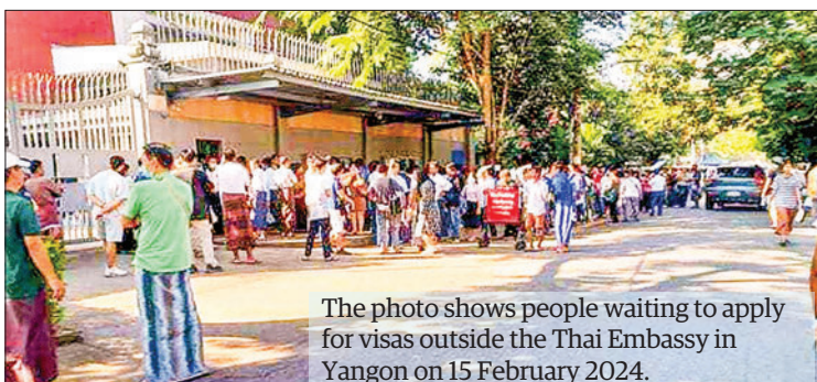
The photo shows people waiting to apply for visas outside the Thai Embassy in Yangon on 15 February 2024.

The persons who hold Myanmar citizen passports are allowed to visit Thailand for 14 days without a visa application, according to the embassy.