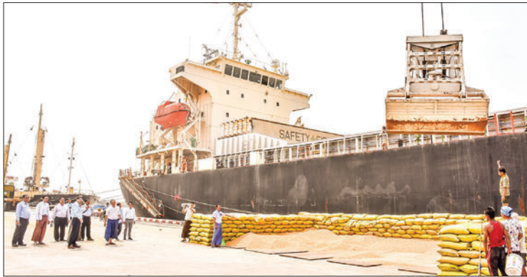
Deputy Minister for Commerce U Min Min looks into the maize loading processes onto Hong Linh-1 and MV Pioneer Fortune at Ahlon Port on 17 February 2024.

DEPUTY Minister for Commerce U Min Min inspected Thilawa Port yesterday, and the official reported on the ongoing arrival of foreign oil tankers and storage and distribution systems.