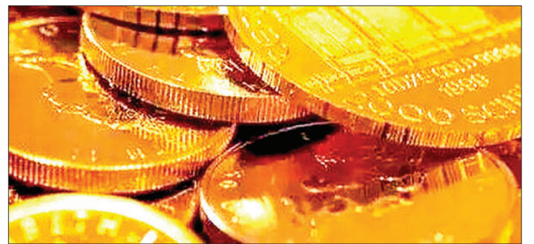
In 2023, near Nova Varbovka in Bulgaria, ancient Roman tombs were accidentally found, yielding precious artifacts like jewelry and coins dating back to 200-250 AD.

A rare and very valuable find from the child's tomb is a bronze medallion featuring Roman Emperor Marcus Aurelius Antoninus, also known as Caracalla, who reigned between 198 and 217 AD.