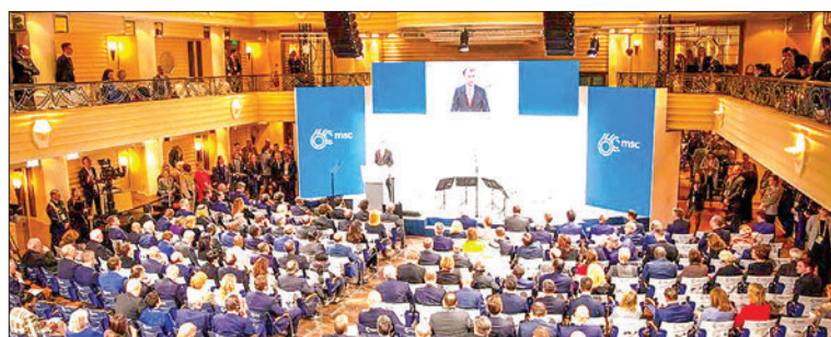
Munich Security Conference (MSC) Chairman Christoph Heusgen speaks during the opening of the 60 th MSC in Munich, Germany, 16 February 2024. The 60 th MSC opened here on Friday, with a spotlight on the need to boost cooperation and improve global governance.

At the 60 th Munich Security Conference, top officials emphasized the necessity of a permanent resolution to the Israeli-Palestinian conflict, advocating for the two-state solution for lasting security in