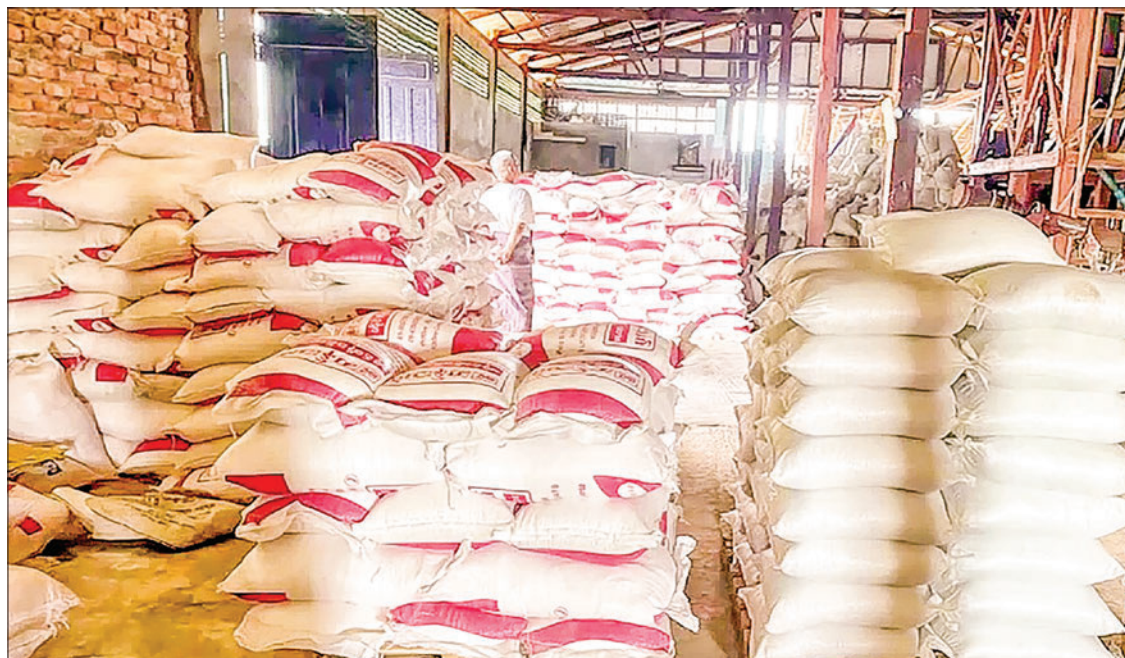
Photo shows sacks of salt in a warehouse in Mon State and they are ready for distributing across the country.

orts are underway to install modern machinery for producing fine iodized salt from coarse salt, as stated by U Win Htein, chairman of the Mon State Salt