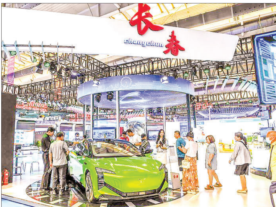
Visitors watch a new-energy car displayed by FAW Hongqi during the 14 th China-Northeast Asia Expo in Changchun, northeast China's Jilin Province, 23 August 2023.

The NEV market has witnessed robust expansion in China over the past years thanks to the country's accelerated push for green development and a rapidly growing auto