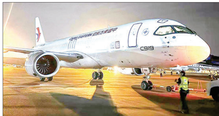
China's first self-developed narrow-body aircraft C919 arrives at Singapore's Changi Airport on 17 February 2024, ready to debut in the Singapore Airshow that runs through 20 February until 25 February.

C919 will demonstrate flight maneuvers at Singapore Airshow 2024 from 20 February to 25, joined by aerobatic teams from India, Australia, Indonesia, and South Korea.