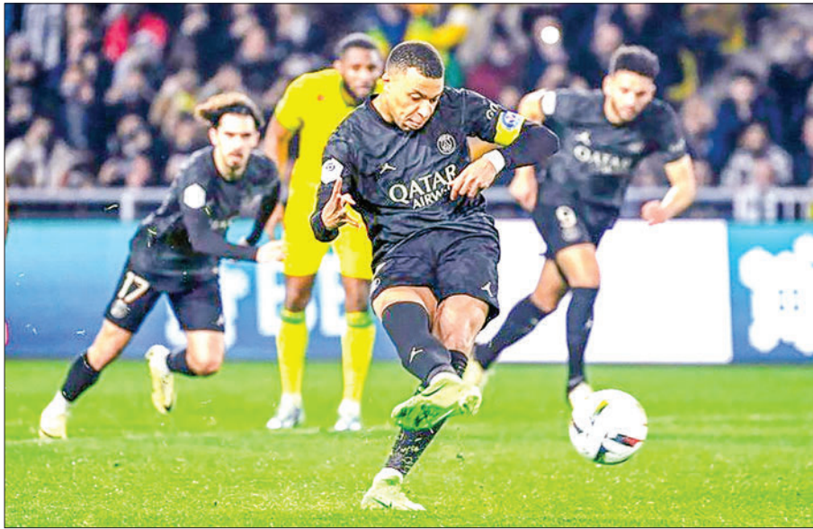
Kylian Mbappe scored his 21 st Ligue 1 goal of the season.

Mbappe, who plans to leave PSG at the end of the season, came off the bench and secured the victory after Lucas Hernandez's deflected strike.