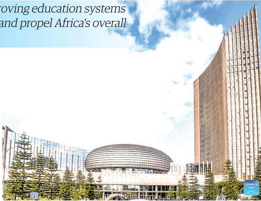
This photo taken on 17 February 2024 shows an exterior view of the African Union (AU) headquarters in Addis Ababa, Ethiopia. The 37 th Ordinary Session of the AU Assembly of the Heads of State and Government opened on Saturday at the AU headquarters in Addis Ababa, the capital of Ethiopia.

Addressing the opening session, Azali Assoumani, president of the Comoros and chairperson of the AU, high-