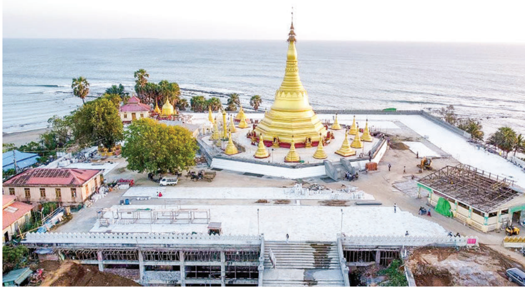
The photo shows Myat Mawtin Pagoda under renovation.