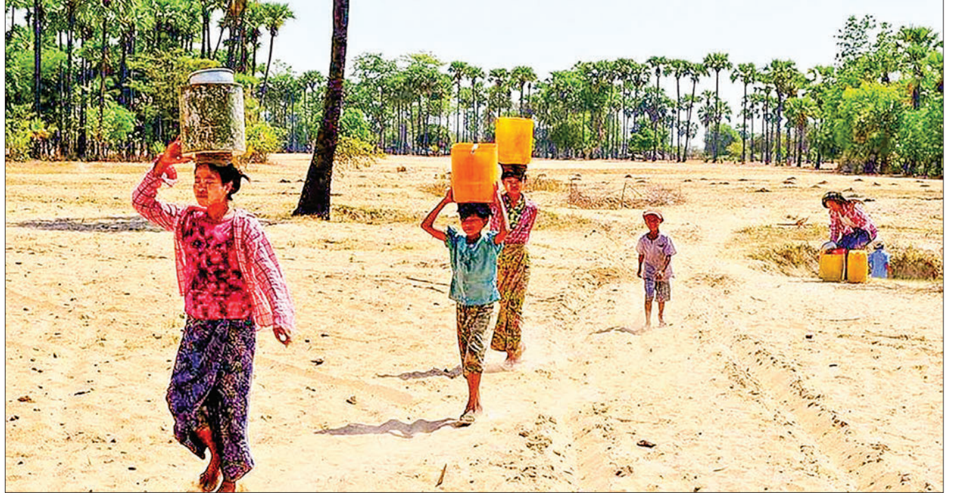
Some local people from Magway Region carrying drinking water last summer.

Furthermore, it is necessary for livestock farmers to cultivate animal feed plants, and to ensure that the people in the region have enough meat, fish, milk, eggs, and vegetables to consume, and to raise high pedigree and productive animals in the livestock industry under the advice of livestock breeding experts in order to earn more income and improve the socio-economic life of the local people.—TWA/TKO