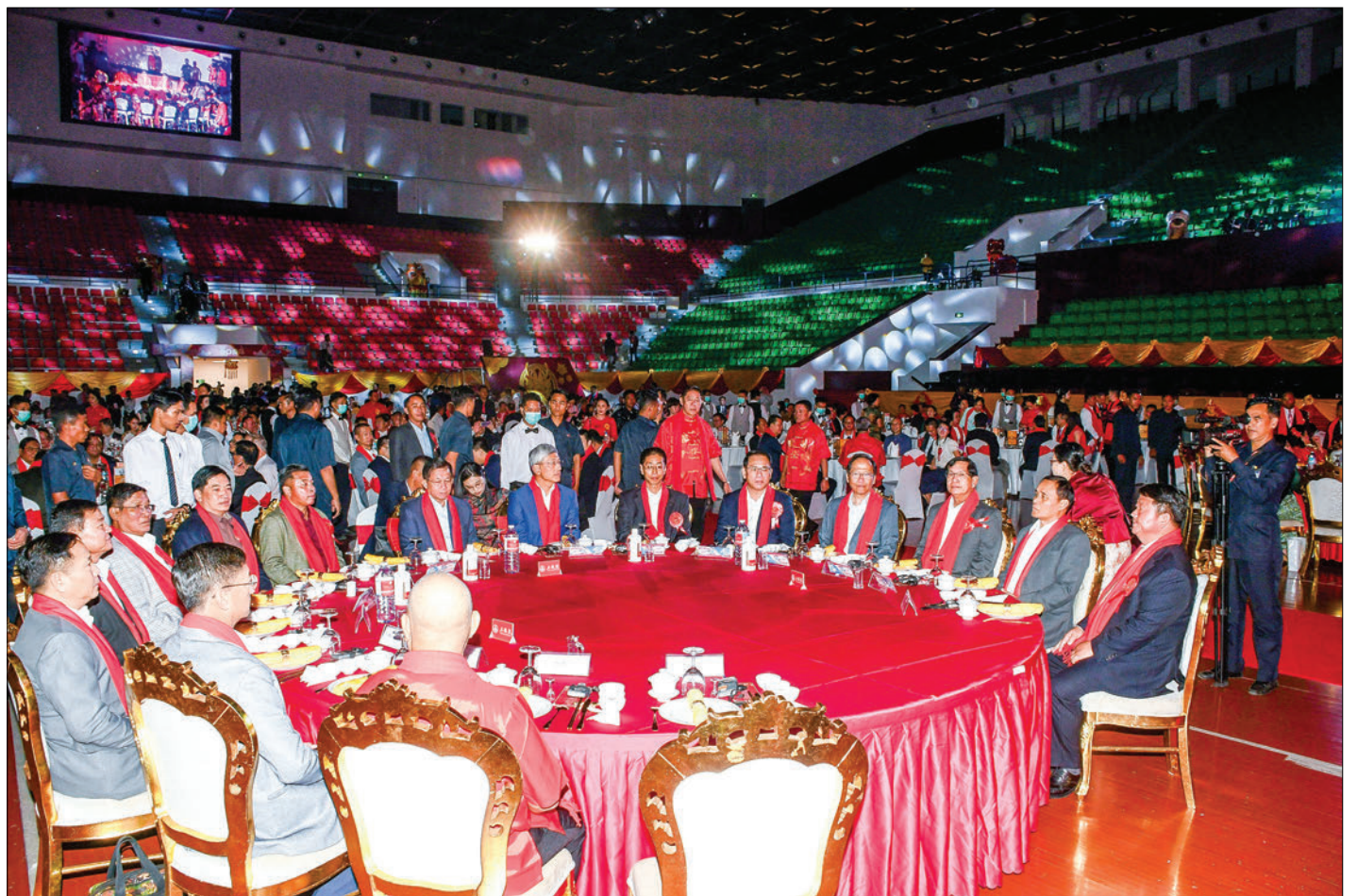
Chairman of the State Administration Council Prime Minister Senior General Min Aung Hlaing attends the dinner to mark 2024 Gold Dragon Chinese New Year festival at National Indoor Stadium-1 in Thuwunna of Yangon on 18 February 2024.

Since China has established, he recounted Myanmar has been holding the