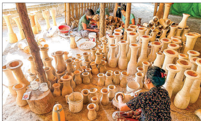
Skilled workers producing musical instruments applying woodturning techniques.

Additionally, the proprietor has a plan to modernize the craft while maintaining its cultural characteristics, so it