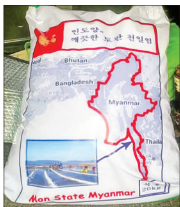
Photo shows a sack of salt exported to South Korea.

In Mon State, 92 salt farmers operate on 5,000 acres. To advance the salt industry, ef-