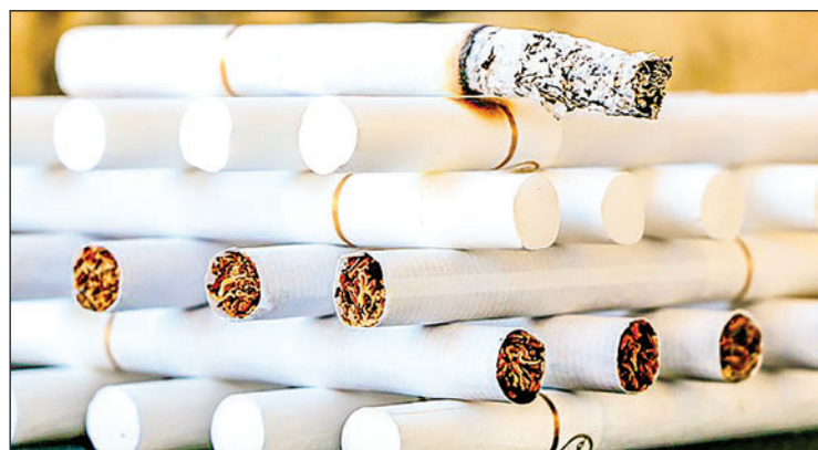
A recent study in the journal Nature revealed that smoking has long-lasting effects on the immune system, even after quitting.

It particularly highlighted changes to what is called adaptive immunity, which is built up over time as the body's specialised cells remember how