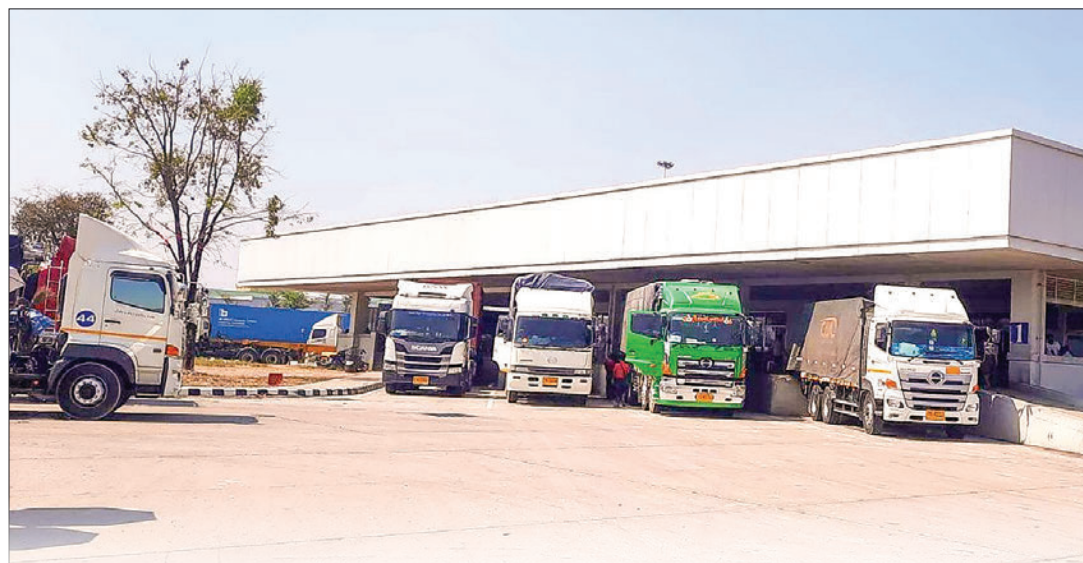
Lorries prepare for export cargoes on the Myanmar-Thailand border.

The non-premium rice prices moved between K74,000 and K93,000 per sack depending on varieties (rice grown under the intercropping system, Ngasein, Thipu and Aemahta) on 15 February in the wholesale depot. Premium Pawsan rice was worth K110,000-K135,000 per sack depending on the producing areas (Shwebo, Pathein, Myaungmya and Dedaye). — NN/KK