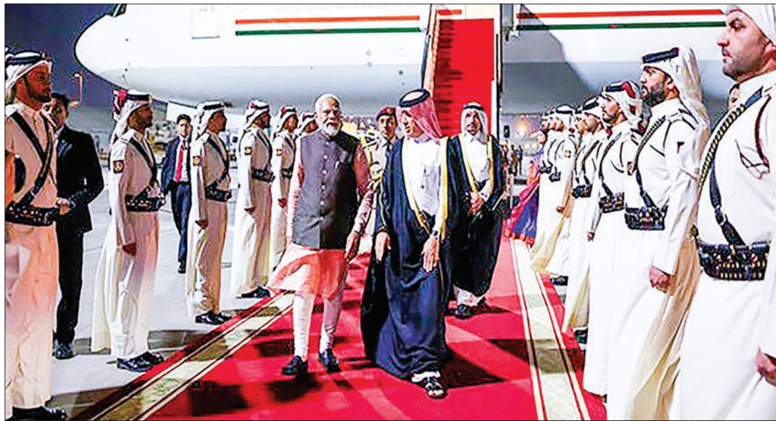
Prime Minister Narendra Modi arrived in Doha, Qatar, for a two-day official visit on 14-15 February.

During his visit, PM Modi will meet Qatar's Amir Sheikh Tamim bin Hamad Al Thani. Earlier, PM Modi met Qatar's Amir Sheikh Tamim bin Hamad Al Thani on the sidelines of the COP28 summit in Dubai and discussed bilateral partnership and the "well-being of the Indian community" living in Qatar.