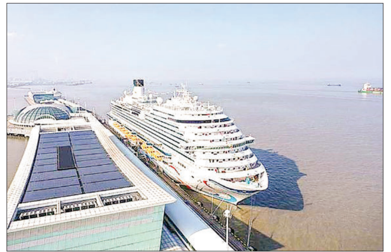
This aerial photo taken on 1 January 2024 shows the large cruise ship Adora Magic City at the Shanghai Wusongkou International Cruise Terminal in east China's Shanghai.

In 2023, Chinese shipbuilding companies accelerated digital transformation and stepped up its input in technological in-