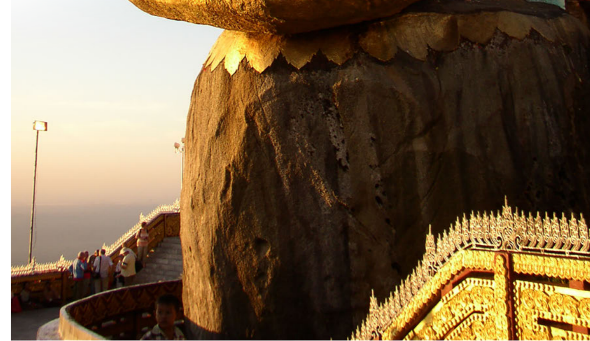
Constructed in 574 BC, Kyaiktiyo Pagoda is one of the world's most important pilgrimage sites for Buddhists and the third most important pilgrimage site in Myanmar after Shwedagon Pagoda in Yangon and the Mahamuni Pagoda in Mandalay.

enshrined in the complex with its magnificent weight perfectly balanced on the edge of a cliff. The Golden Rock is truly a natural and extraordinary sight, which is why it is regarded with such sacred astonishment. The scenery from the Golden Rock is a spectacular sight, and many visitors stay behind the Rock to watch the sunset. The Kyaiktiyo shrine complex consists of several viewing platforms, pagodas, and Buddha shrines. Devotees gather in the area behind the Rock to pray and make offerings, and almost everyone attaches a golden leaf to the Rock as an act of merit. A glimpse of the fascinating Golden Rock is believed to be enough to inspire and enlighten any person to turn to Buddhism. Also, according to legend, pilgrims who