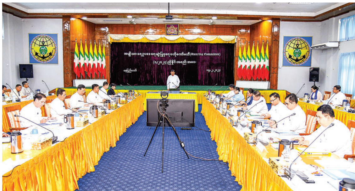
SAC Member Deputy Prime Minister Union Transport and Communications Minister General Mya Tun Oo chairs the 1/2024 meeting of the National Water Law Drafting Steering Committee yesterday.

The General highlighted the formation of National Level Water Resources Committee in 2013 as a drive for drafting