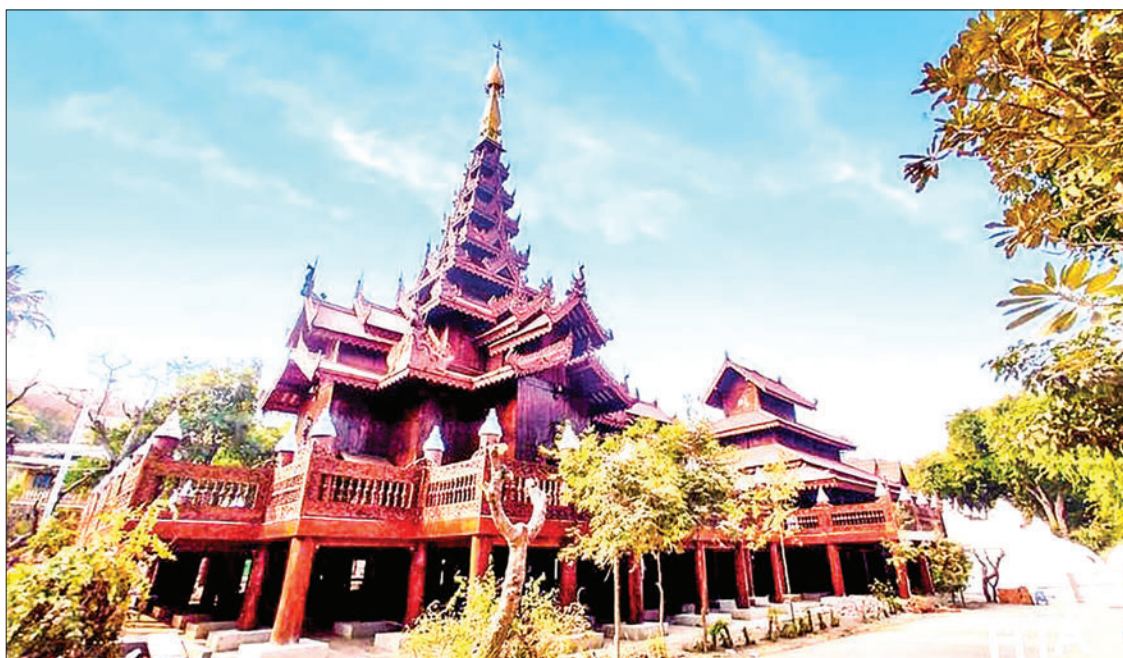
The photo depicts the general view of the Kyun Kyaung (teak monastery) in Mandalay.

"After this monastery was built, it was donated to the first founder Sayadaw of Shwegyin Sect along with the land. For the Shwegyin Sect, this place is its original auspicious ground.