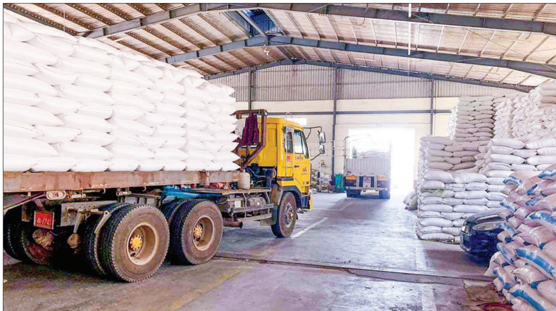
Rice bags are organized at the warehouse.

townships: Hlinethaya, Shwepyitha, South Dagon, North Okkalapa, North Dagon, Dagon Seikkan, East Dagon, Hmawby,