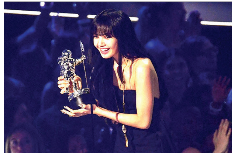
Thai singer Lisa from the group BLACKPINK accepts the Best K-pop award for 'Lalisa' during the MTV Video Music Awards at the Prudential Centre in Newark, New Jersey on 28 August 2022.

A dark, stylish satire on wealth and hypocrisy, "The White Lotus" has been a commercial and critical hit for HBO, with both previous seasons garnering multiple Emmy nominations. — AFP