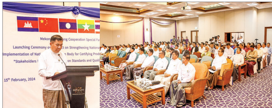
The project to strengthen national quality infrastructure and certification on body underway yesterday.

THE Project on Strengthening National Quality Infrastructure and Implementation of National Certification Body for Certifying Products, Processes, and Services, along with the Stakeholders Engagement Forum on Standards and Quality for Trade Facilitation and Industry Development, was formulated and led by the Department of Research and Innovation of the Ministry of Science and Technology under the Mekong-Lancang Cooperation Special Fund (2023). The event took place yesterday at Mercure Hotel in Yangon.