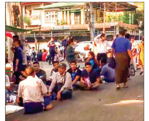
The photo shows people waiting to apply for visas outside the Thai Embassy in Yangon on 15 February 2024.

Applicants can obtain the necessary information by scanning the embassy's QR code. Incomplete appli-