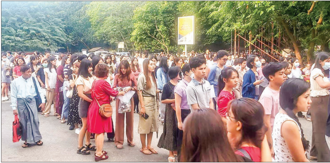
The photo shows exam candidates who sat the JLPT on 3 December 2023.

THE Myanmar Association of Japan Alumni (MAJA) has announced that application forms for the Japanese Language Proficiency Test (JLPT), scheduled for the first week of July, will be available starting on 29 February. The exam will be conducted