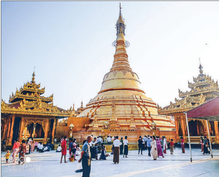
Myanmar's traditional Htamane-making festival and competition were held at the Botahtaung Pagoda in the previous year.