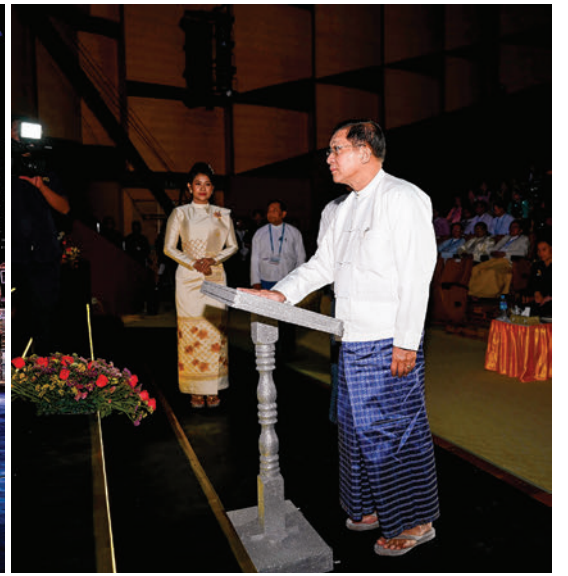
The Senior General presses the button to launch the broadcasting of 19 TV channels and upgrading 11 channels yesterday.

Sports channels, MITV channel, Myanmar Radio, Thabye Radio, and 17 ethnic language radio programmes.