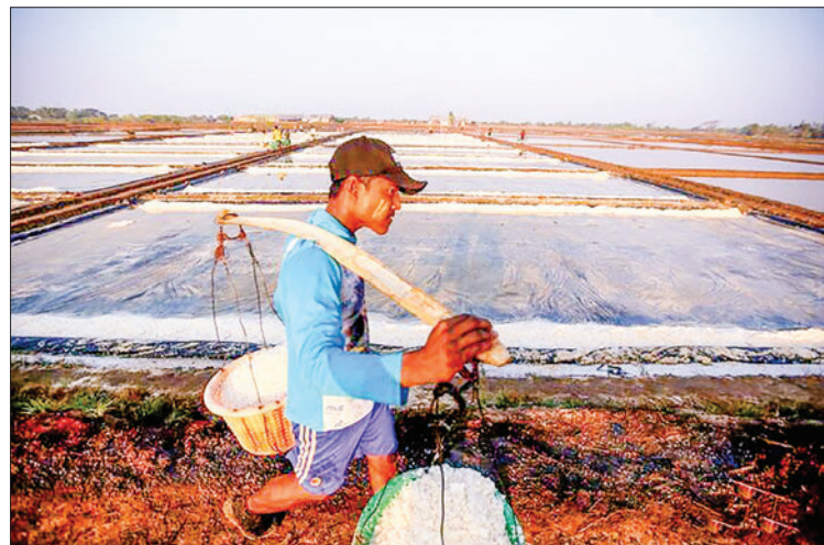
File photo by Xinhua shows a farmer works in salt beds at Panga Village, Thanbyuzayat Township, Mon State.

"The salt price fluctuates depending on supply and demand. Salt manufacturing needs to rely on the weather, so the price gets high if the yield is low when it rains. There was rain in January so the price climbs up about K10-K20 a viss," he said. The export licence is still underway for exporting Mon State-produced sun-dried salt to Japan and South Korea. — MT/ZS