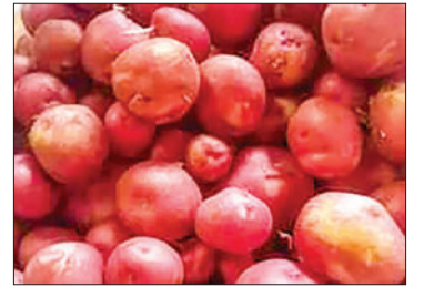
Red potatoes from Kachin State

The wholesale price per viss of mixed small and big-sized red potatoes is from K2,500 to K2,700 while the price per viss of small-sized red potatoes is around K2,500 and big-sized red potatoes is around K3,000, according to Mohnyin red potato market. — Thit Taw/ZS