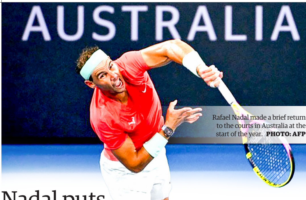
Rafael Nadal made a brief return to the courts in Australia at the start of the year.

Oberdorf has become a fixture of the German national team set-up, having played in the 2022 final against England at Wembley. She was named best young player at the tournament. — AFP