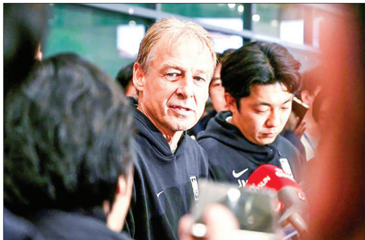
Jurgen Klinsmann's time as South Korea coach could be over.