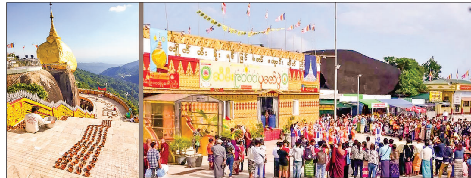
The photo shows the ceremony of offering 9,000 oil lamps to Kyaiktiyo Pagoda