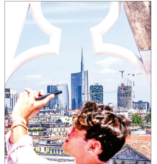
A tourist takes photos on the terrace of Duomo di Milano in Milan, Italy, on 6 August 2021.