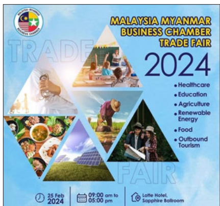
The Malaysia-Myanmar Business Chamber Trade Fair 2024 billboard.

THE Malaysia-Myanmar Business Chamber (MMBC) will organize the Malaysia-Myanmar Business Cham-