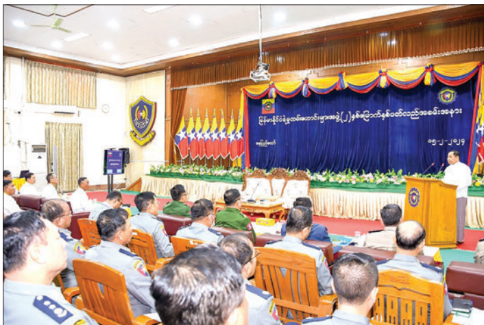
The 2 nd Anniversary of the Myanmar Police Veteran Organization celebration in progress yesterday.

He also urged the police veterans to cooperate to achieve the organization's