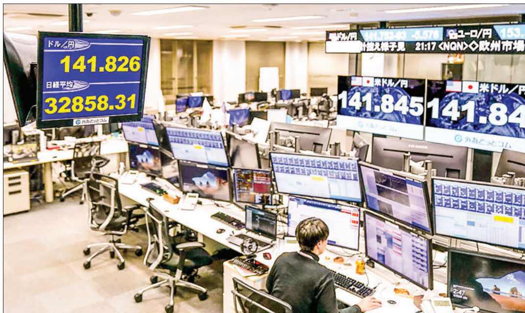
Photo taken in Tokyo on 8 December 2023, shows monitor screens displaying the Japanese yen trading in the 141 zone against the US dollar.

Kanda expressed concern over the yen's nearly 10 yen decline against the dollar in a month, negatively affecting the economy.