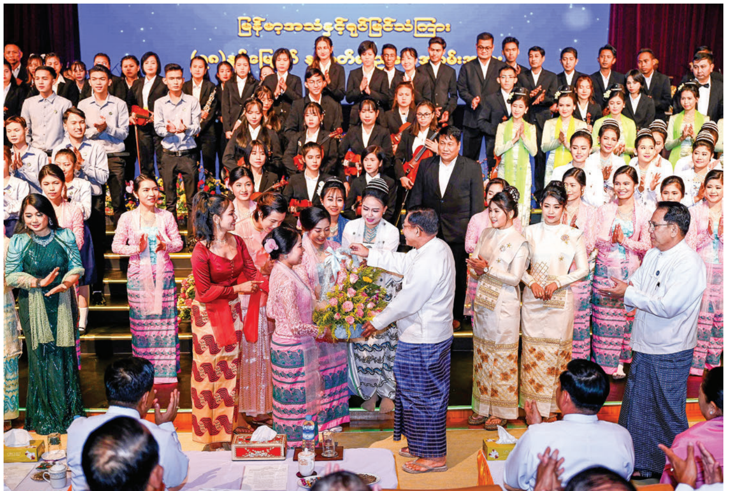
State Administration Council Chairman Prime Minister Senior General Min Aung Hlaing presents prizes and cash awards to the MRTV staff yesterday in Nay Pyi Taw.

Speaking on the occasion, the Senior General said that MRTV is striving to initiate a modern State media due to the reform process conducted by the