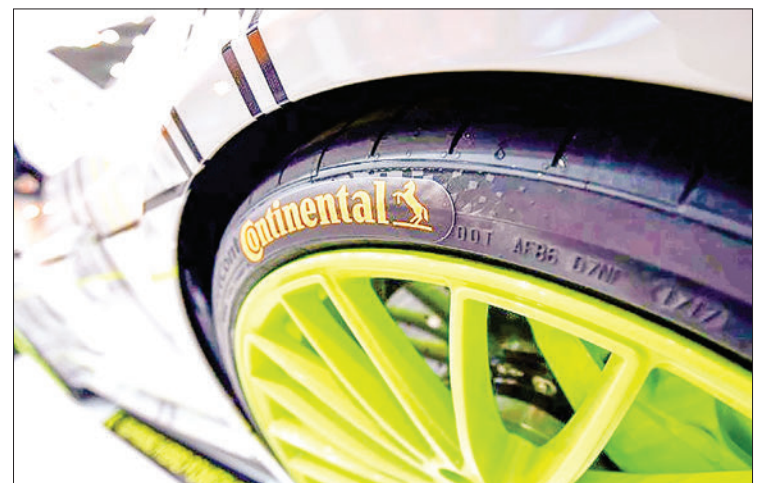
Germany's auto suppliers have been facing problems as the transition to electric mobility gathers pace, after decades relying on fossil fuel vehicles for their profits.

The cuts would allow Continental to "focus our resources even more on future technologies for software-defined vehicles", von Hirschheydt said. — AFP