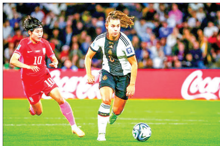
Germany midfielder Lena Oberdorf will join Bayern Munich from Wolfsburg in the summer.

He added: "I am 100 per cent confident of being in Indian Wells, it's a very special tournament for me. I don't know if it's going to be the last time I play in it, so I would like to be in Indian Wells, for sure." — AFP