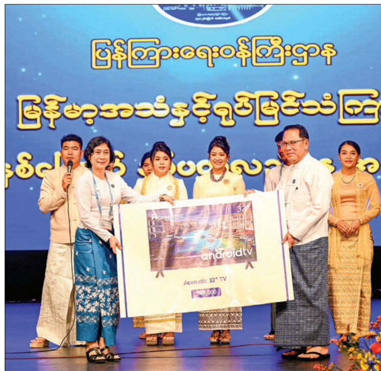
Union Minister U Maung Maung Ohn presents awards to the MRTV personnel yesterday.

The Union minister and the deputy minister then opened a lucky draw for the employees of Myanmar Radio and Television and awarded prizes. — MNA/KZL