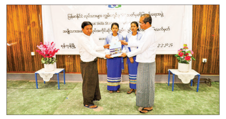
The NSSA official presents an excellent award certificate during the award ceremony.

types of jobs, exceeding the financial year 2022-2023 target. In the 2023-2024 financial year, 3,500 workers were targeted for inspection and evaluation. So far, there have been 2,735 respondents for 29 types of jobs, and 2,534 qualified workers were recognized as skilled workers.