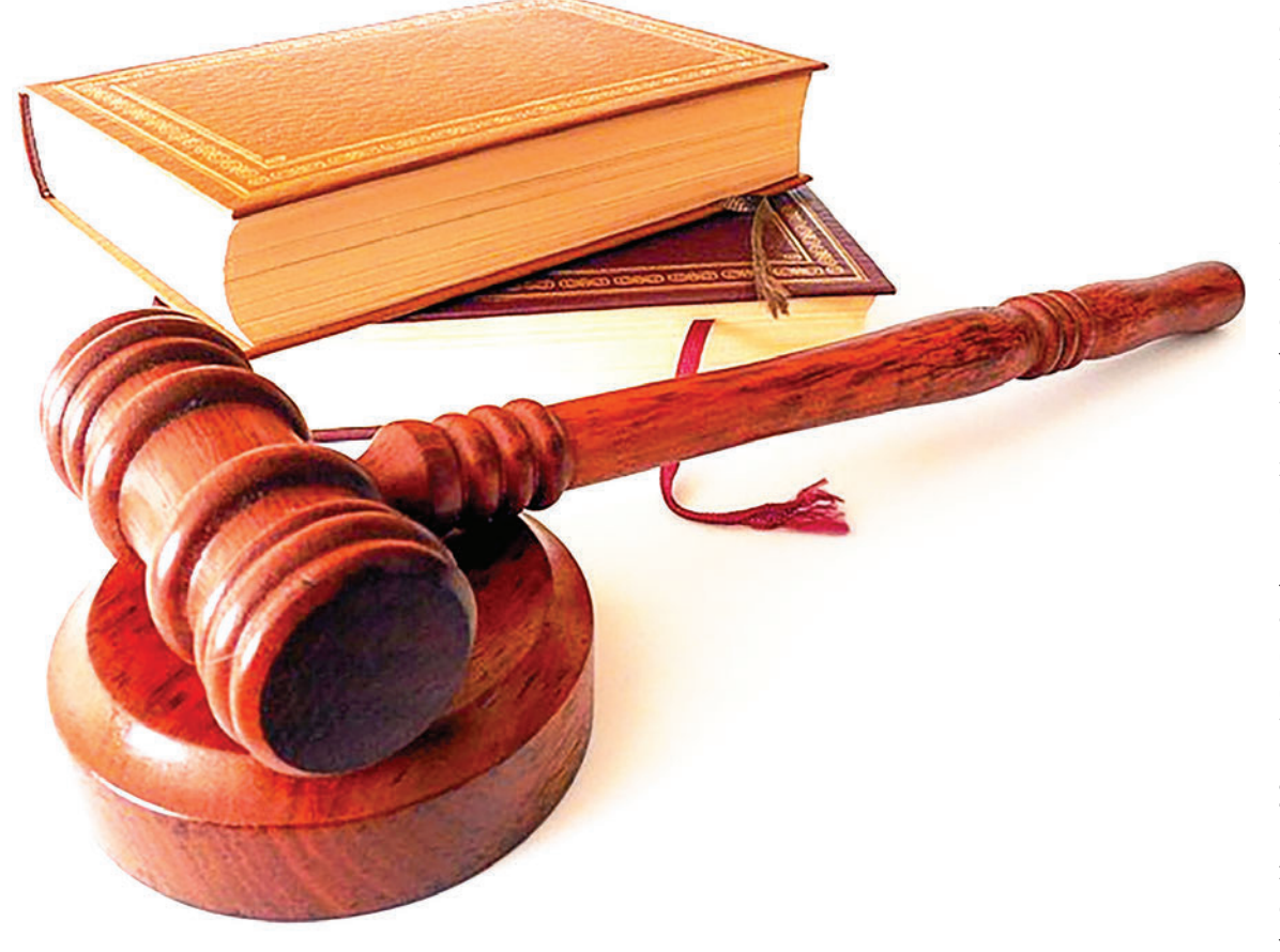
Obtaining a clear and unbroken title is crucial when purchasing a home, and the associated legal document, the title document, outlines key details about property ownership. ILLUSTRATION: REPRESENTATIVE IMAGE/ PIXABAY

When buying, selling or licensing real estate property rights, be sure to make sure the chain of title is clean and