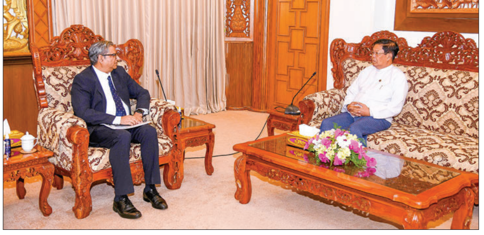
The UNOCHA head calls on Deputy Prime Minister Union Minister for Foreign Affairs U Than Swe yesterday in Nay Pyi Taw.

Also present at the meeting were senior officials from the Ministry of Foreign Affairs, Ms Danielle Parry and Ms Kyoko Ono, Deputy Heads of Office for UNOCHA. — MNA