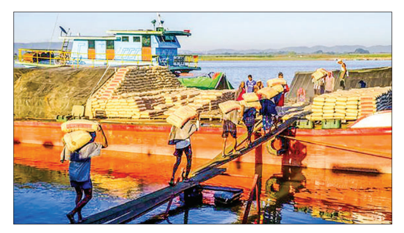
Workers are seen loading cargo onto a vessel at Mandalay port.