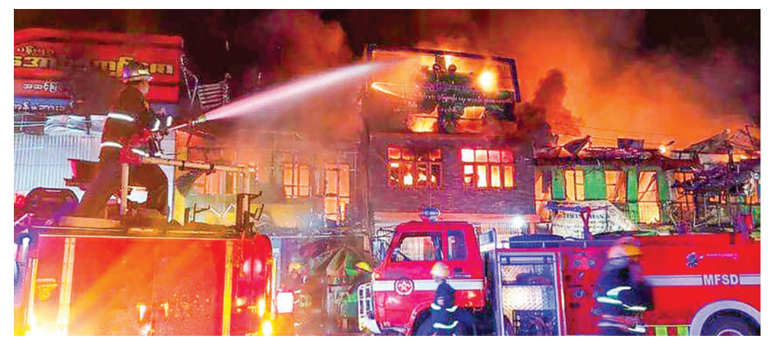
Firefighters are extinguishing fire at the Aung Mingala Highway Bus Terminal.