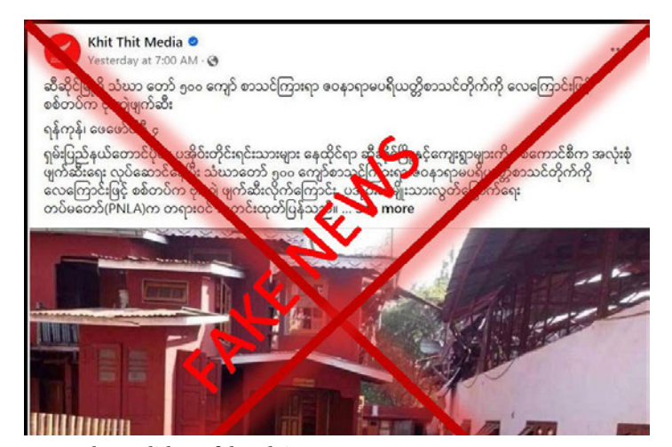
Screenshot validates false claims.

Similarly, Khit Thit media spread misinformation, claiming that the artillery shells and airstrike of Tatmadaw destroyed some buildings of Zawanarama Buddhist learning Centre in Hsihseng Town-