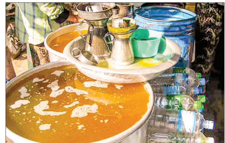
Palm oil is organized for sale at the shop

The Supervisory Committee on Edible Oil Import and Distribution under the Ministry of Commerce has closely observed the FOB prices in Malaysia and Indonesia, adding transport costs, tariffs and banking services to decide the weekly wholesale market reference rate for edible oil.