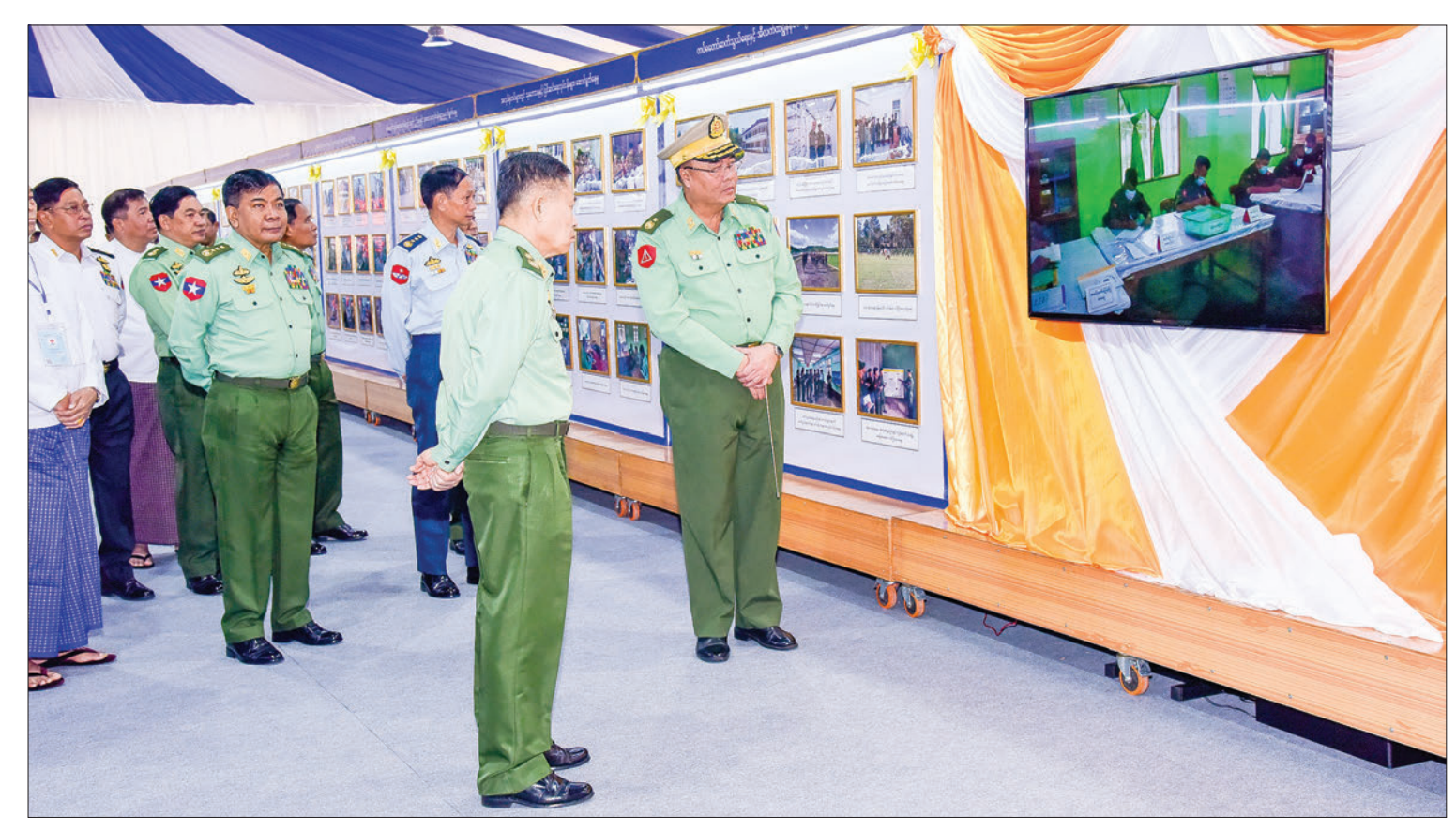
State Administration Council Vice-Chairman Deputy Commander-in-Chief of Defence Services Commander-in-Chief (Army) Vice-Senior General Soe Win observes the display at the booths yesterday in Nay Pyi Taw.

VICE-SENIOR General Soe Win said the Signals Corps serves its primary duties of not only communications but contributes to the TV transmission sector as well whenever the country faces a state of emergency.