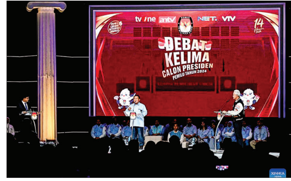
Indonesian presidential candidates Anies Baswedan, Prabowo Subianto and Ganjar Pranowo (L-R) attend the fifth presidential candidates' debate at Jakarta Convention Centre in Jakarta, Indonesia, on 4 February 2024. Indonesia will hold presidential and legislative election on 14 February 2024.

"Which is more important, free internet or free food for those who are