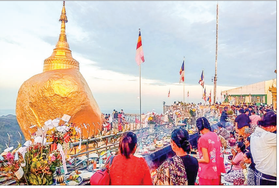
Travellers seen at the Kyaiktiyo Pagoda under arrangements to be involved in the World Heritage Sites.

Other festival highlights include the pine-growing demonstration, pounding khawpoke (dried sticky rice), games of spinning tops, courtship rituals among bachelors, and dodge ball