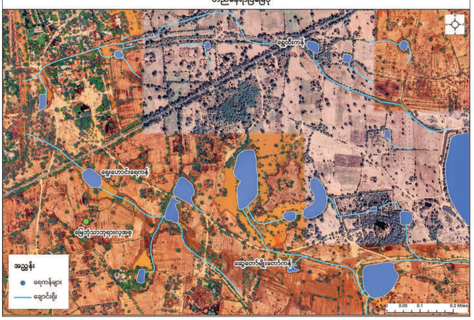
The map of ancient water reservoirs vital in the Bagan-era water distribution system.

မြေဘုံသာဘုရားလှအစုမြောက်ဘက်ရှိရှေးဟောင်းရေကန်၊ရွှေထီးကန်နှင့်ဆွေတော်မျိုးတော်ကန်တို့၏ တည်နေရာပြမြေပုံ