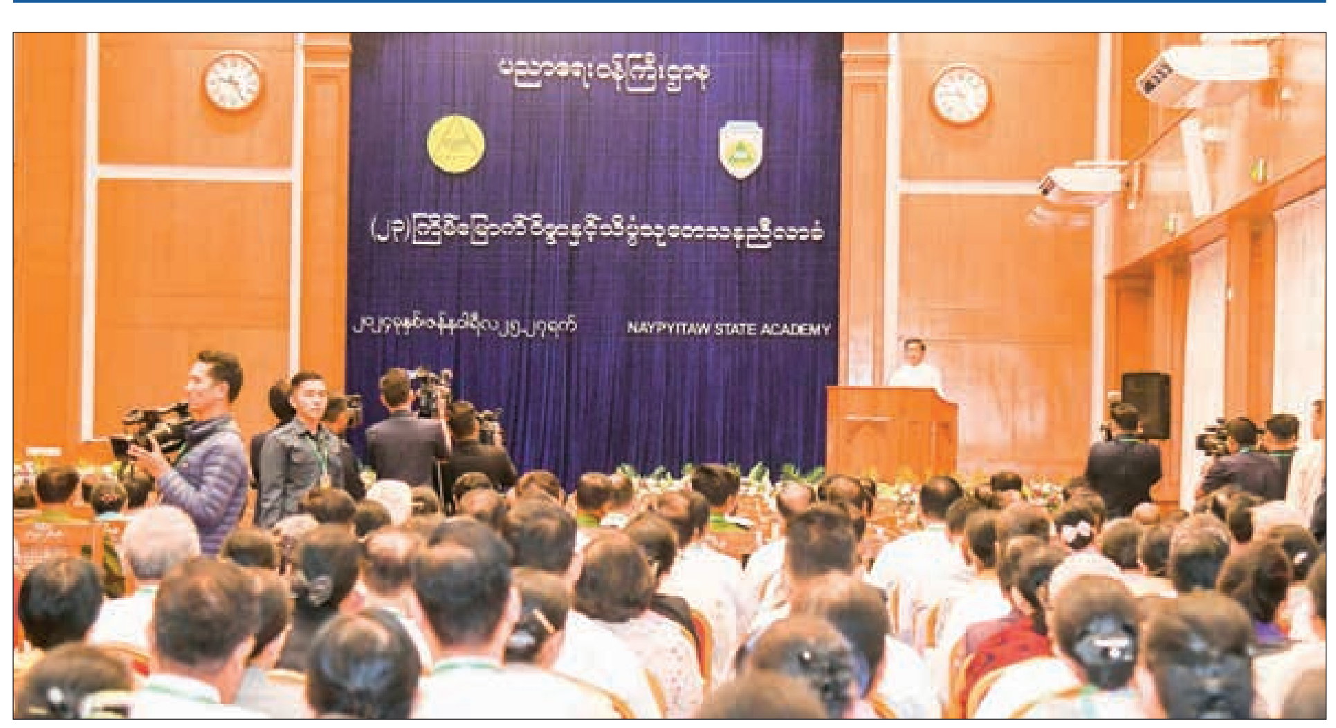
State Administration Council Chairman Prime Minister Senior General Min Aung Hlaing speaks on the inaugural occasion of the 23<sup>rd</sup> Arts and Science Research Conference at the Naypyitaw State Academy yesterday in Nay Pyi Taw.