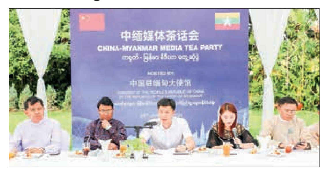
The photo shows the convening of the 2024 Myanmar-China Media Tea Party on 24 January 2024.