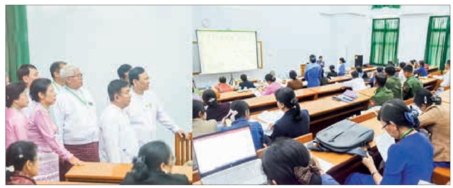
The 23<sup>rd</sup> Arts and Science Research Conference in progress yesterday in Nay Pyi Taw, attended by Union Minister Dr Nyunt Pe.

THE Ministry of Education organized the 23<sup>rd</sup> Arts and Science Research Conference at Naypy-