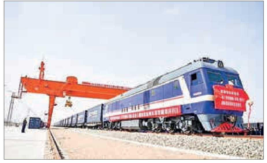
Gansu's first international freight train that runs via the China-Laos Railway prepares to depart from Dunhuang, northwest China's Gansu Province, 21 April 2022.

As part of the Belt and Road Initiative, Gansu actively expanded its trade cooperation with ASEAN members throughout 2023, encompassing diverse sectors such as energy, mineral products, grain, seeds, and fruits and vegetables.