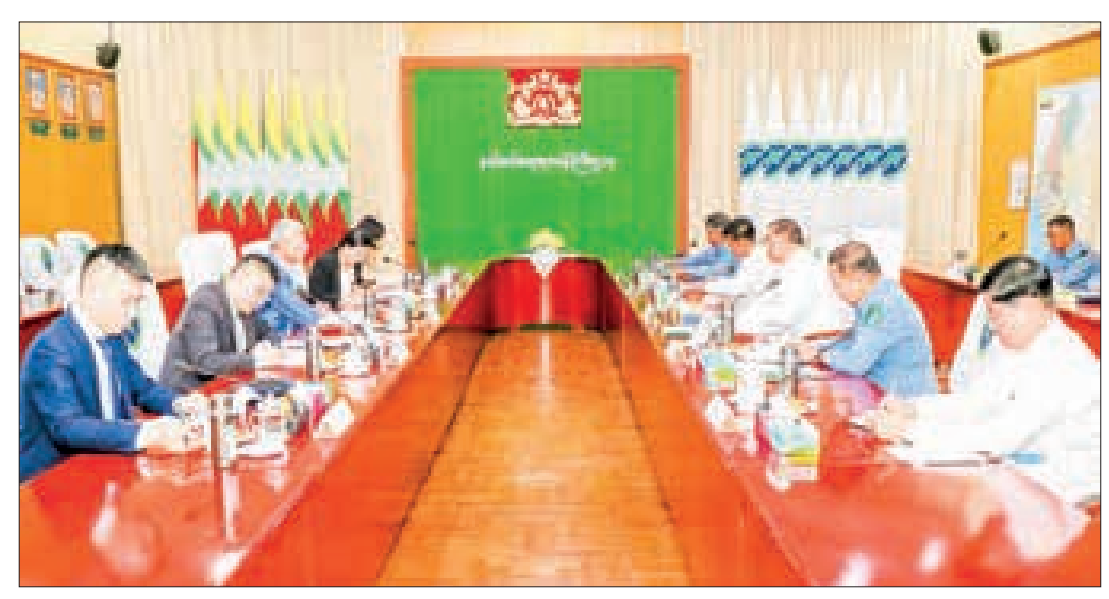
Union Minister Lt-Gen Tun Tun Naung holds talks with the Chinese Ambassador-led delegation yesterday.

UNION Minister for Border Affairs Lt-Gen Tun Tun Naung met Ambassador Mr Chen Hai of the People's Republic of China to Myanmar at the Minister's Office yesterday afternoon.