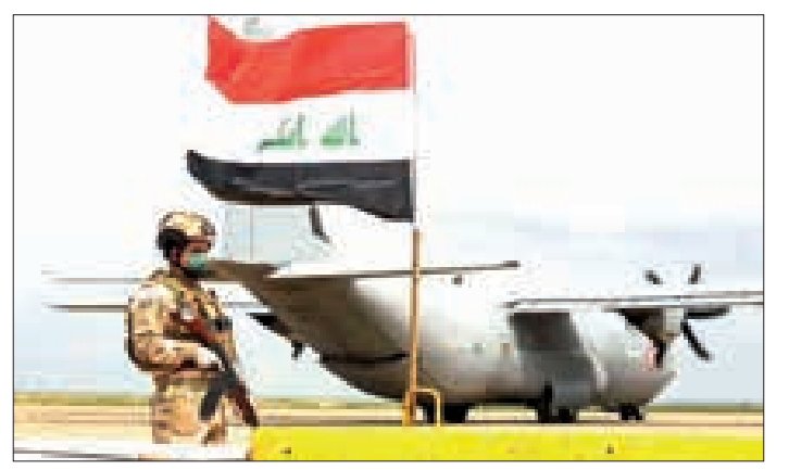
An Iraqi soldier stands guard in front US military air carrier at the Qayyarah air base, Iraq.

The upcoming talks will primarily focus on the next phase of the US-led anti-ISIS coalition, given the significant reduction of the terror group's influence.