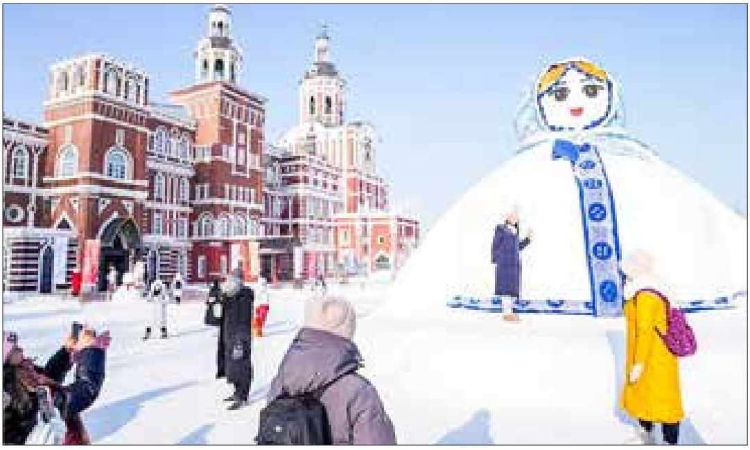
Tourists pose for photos in Harbin, Heilongjiang province on 7 January 2024.

China's northeastern city of Harbin is emerging as a leading winter destination, prompting tourism bureaus nationwide to actively promote local attractions using innovative strategies to attract visitors.