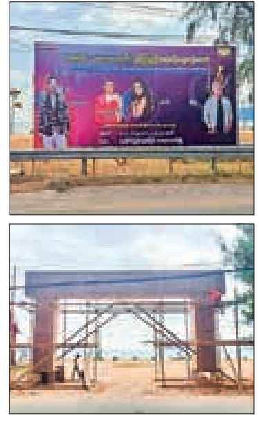
An advertising board for the Ranong-Kawthoung Friendship Tourism Festival that will be held in the 3<sup>rd</sup>-mile People's Square in

The Taninthayi Region government office announced that the Ranong-Kawthoung Friendship Tourism Festival will come to life at the 3<sup>rd</sup>-mile People's Square in Kawthoung Township, Taninthayi Region. In an effort to boost tourism between Myanmar and Thailand, the Ranong-Kawthoung Friendship Tourism Festival is scheduled to take place from 4 to 8 February for five days at the 3<sup>rd</sup>-mile People's Square in Kawthoung Township, Taninthayi Region. The event will feature performances by renowned artistes, as per the regional gov-