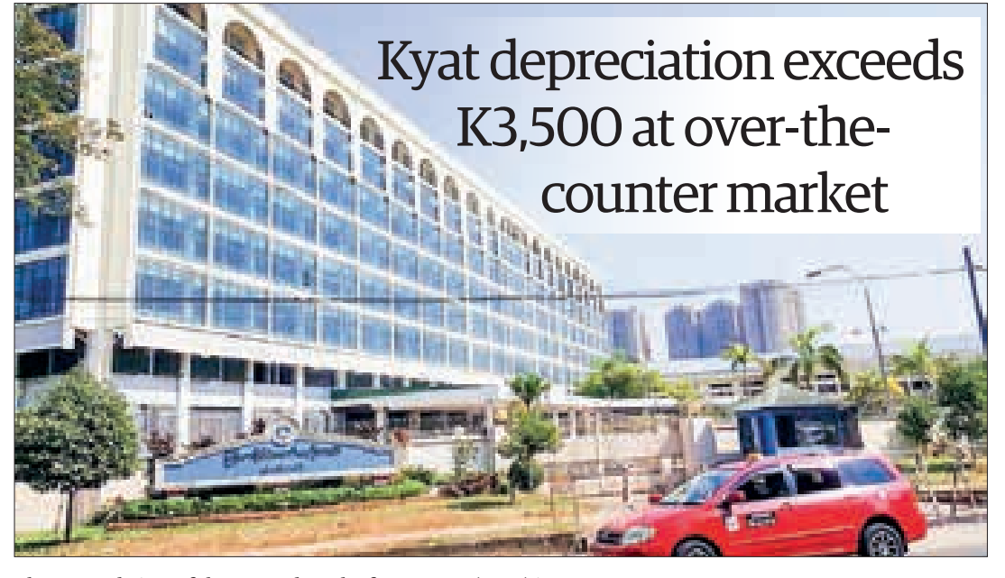
The general view of the Central Bank of Myanmar (CBM) in Yangon.

statistics showed Myanmar bagged $1.47 billion from 1.9 million tonnes of pulses exports last FY 2022-2023. — NN/EM