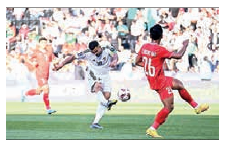
Aymen Hussein of Iraq shoots during the Group D match against Viet Nam at AFC Asian Cup Qatar 2023 at Jassim Bin Hamad Stadium in Doha, Qatar, 24 January 2024.

Iraq eased into the knockout stage of the AFC Asian Cup with three straight wins, while Japan also advanced from Group D.