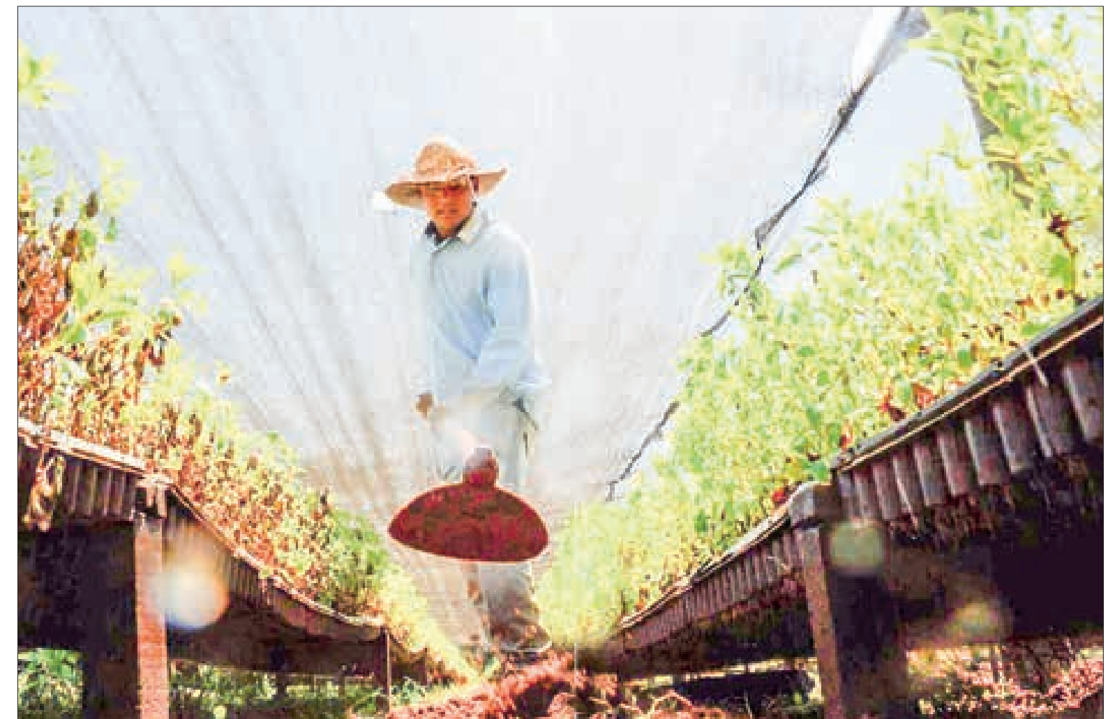
Now, new alternatives are emerging, such as sweeteners from the miracle berry, rare sugar from figs, and a different type of sugar crystal. The question arises: Will these plant-based alternatives be a healthy way to enjoy sweetness, or should our perception of sweet things change?

Health is also a complicated issue. Sweeteners should be good because they help us eat less sugar. But not everyone agrees on this.