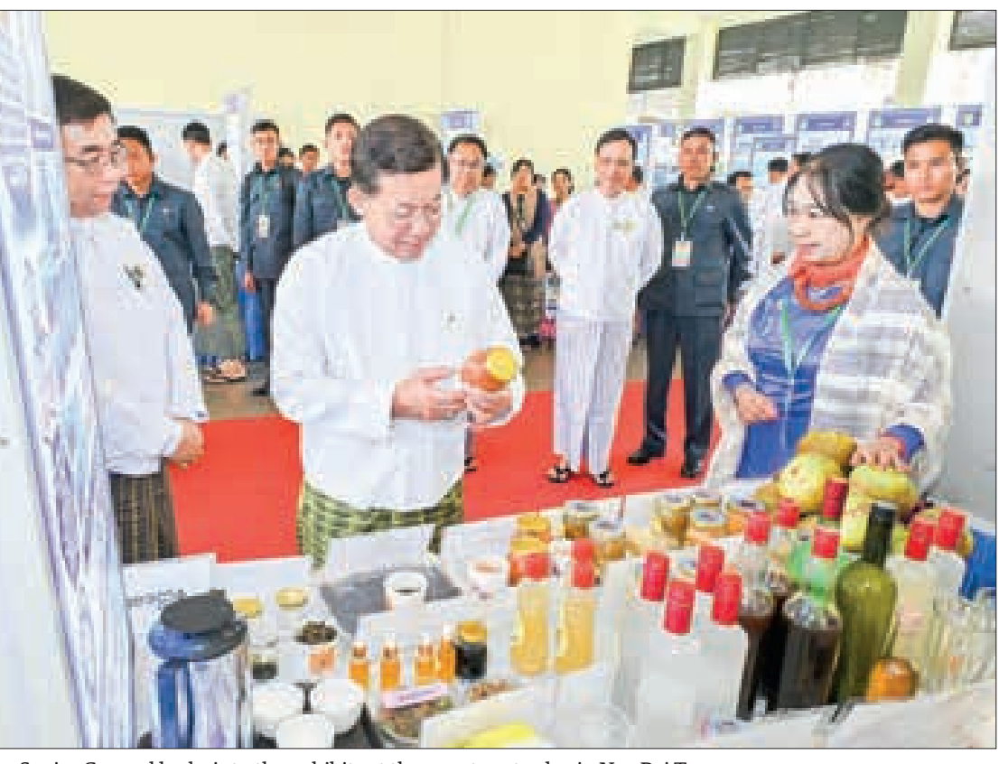
The Senior General looks into the exhibits at the event yesterday in Nay Pyi Taw.

He disclosed that researchers from six ministries, including