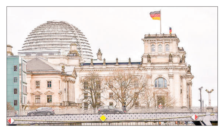
Vehicles run on a bridge in Berlin, Germany, on 15 January 2024. Germany slipped into recession in 2023, the country's Federal Statistical Office (Destatis) said on Monday.

Inflation in Germany gradually weakened last year, but picked up again at the end of the year, to 3.7 per cent in December. Compared to other European countries, consumer prices in the country normalized slowly, as the average value for the eurozone was already 2.9 per cent last month. Food prices in particular continued to rise at above-average rates, and were still up 4.5 per cent at the end of last year. Although real wages rose, consumption remained subdued. - Xinhua