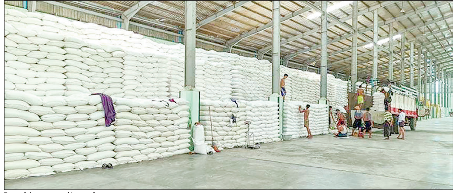
Bags of rice are stored in warehouse.

As of 13 January 2023, 193 warehouse facilities in Yangon, Ayeyawady, Bago, Mandalay, and Sagaing regions, Rakhine State, and Nay Pyi Taw Council Area have been registered. The feder-