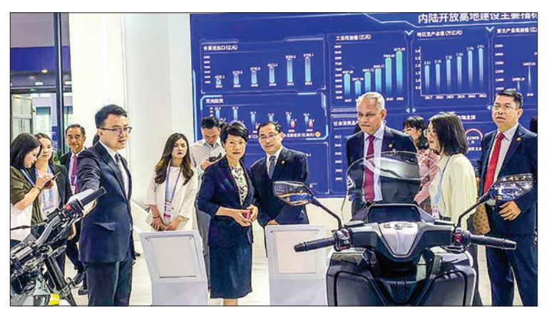
Western China International Fair: Union Minister U Aung Naing Oo attends 5th Investment and Trade Fair.

Myanmar shipped 10,850 tonnes of fisheries that week,