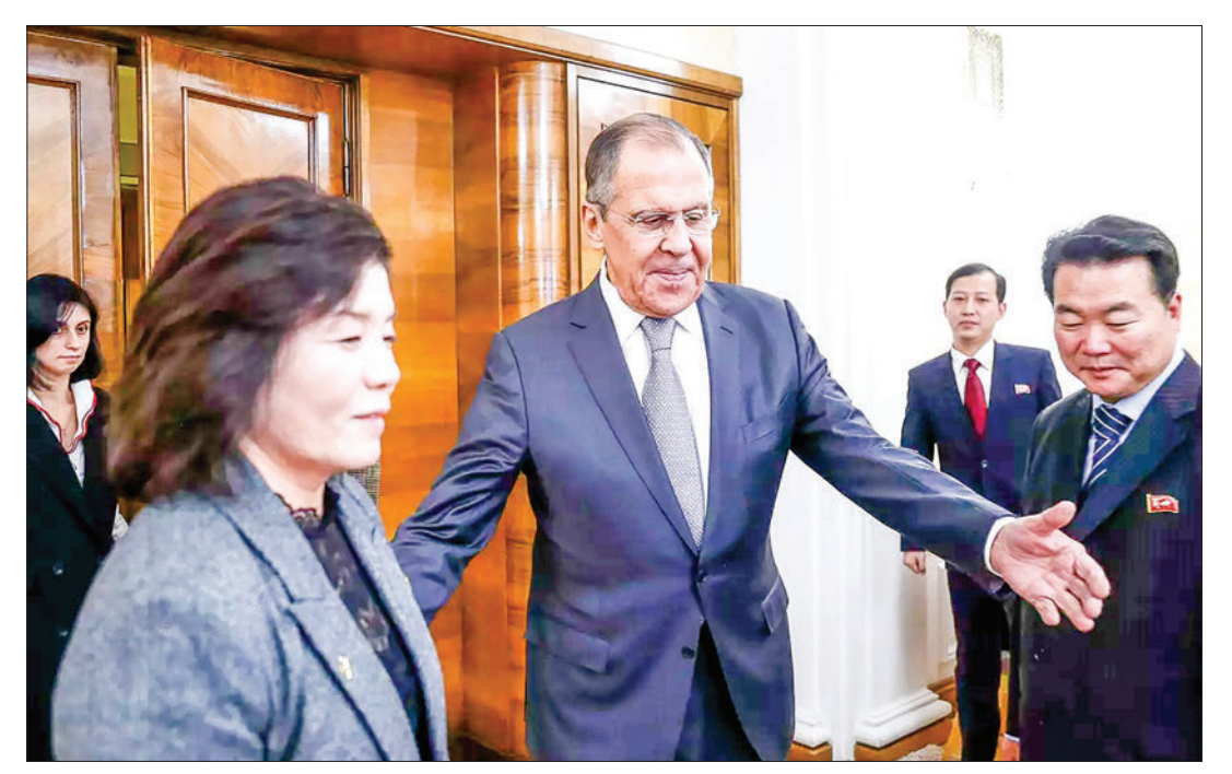
Russian Foreign Ministry, Russian Foreign Minister Sergey Lavrov shows the way to North Korean Foreign Minister Choe Son Hui.

RUSSIAN Foreign Minister Sergey Lavrov said on Tuesday that he will discuss the situation on the Korean Peninsula with North Korean Foreign Minister Choe Son Hui.