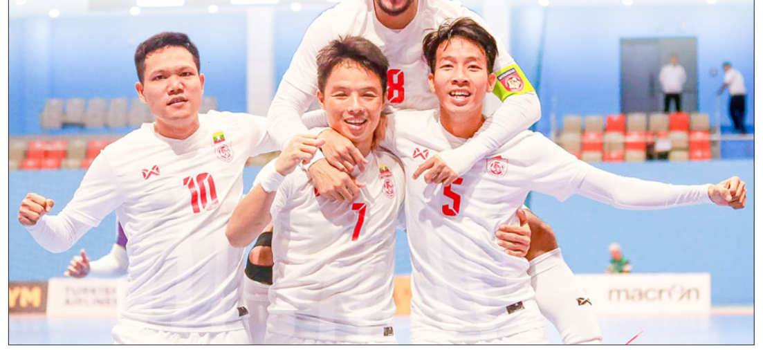
The Myanmar futsal team players are seen at the previous international futsal match.

A total of nine coaches will handle the Myanmar team consisting of 25 players. — Ko Nyi Lay/KZL