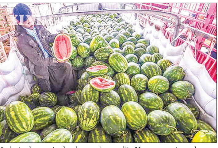
A photo shows a trader showcasing quality Myanmar watermelon before exportation to China.

As Chinese New Year 2024 approaches, the demand for Myanmar's fruits is steadi-