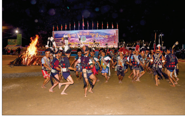
Naga ethnic people enjoying traditional bonfire in Leshi on 15 January.

On 14 January, the Deputy Prime Minister attended sports competitions held as part of the Naga Traditional New Year festival for 2024, awarding medals and cash prizes to the winners. - MNA/KTZH