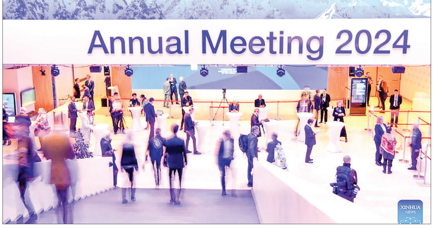
People attend the World Economic Forum (WEF) Annual Meeting 2024 in Davos, Switzerland, 15 January 2024. The WEF Annual Meeting 2024 opened here on Monday. In the face of escalating global division and uncertainty, the 54th WEF Annual Meeting has assembled leaders from around the world for a week of dialogue aimed at enhancing cooperation and cultivating partnerships.

CONOMIC optimism has more than doubled year-on-year but almost half of CEOs doubt the viability of their businesses as tech and climate pressures accelerate, a new PricewaterhouseCoopers (PwC) survey presented at the World Economic Forum (WEF) in Davos on Monday showed.