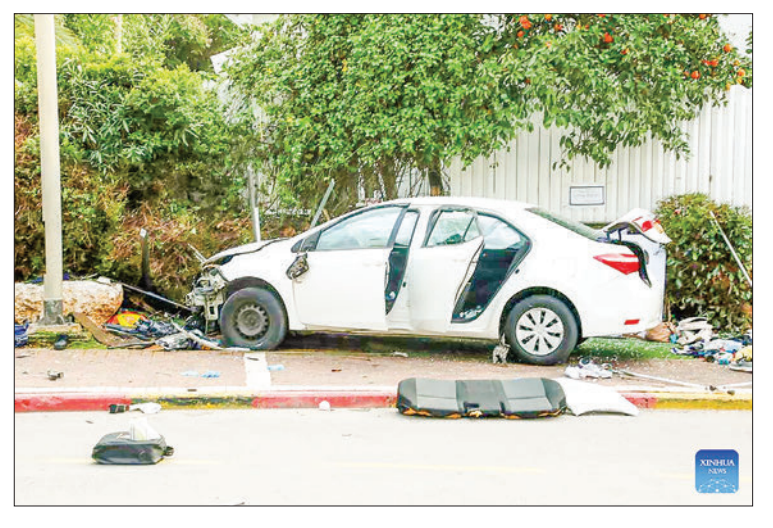
Photo taken on 15 January 2024 shows the scene of car-ramming and stabbing attacks in the central Israeli city of Ra'anana. Combined carramming and stabbing attacks carried out by two Palestinians killed an elderly woman and wounded 17 others in central Israel on Monday, Israeli authorities said.

Video footage on Israel's Kan TV news showed personal belongings strewn across the road and a shattered bus stop, with at least four children reportedly injured in the attack, the report said. — Xinhua