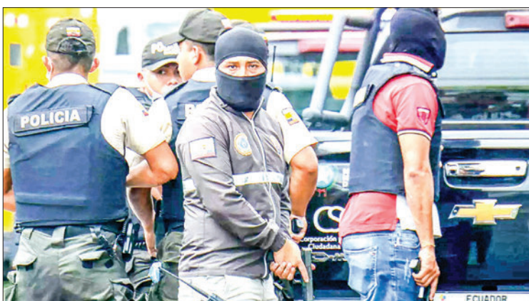
The Ecuadorian Armed Forces Joint Command chief declared 22 criminal groups as a “military target” after a security council meeting, emphasizing a no-negotiation stance with these groups.

“Daniel Noboa, the president of the republic, has set a very clear mission for us in his decree No. 111. From now on, every terrorist group identified in the above-mentioned decree becomes a military target. The present and future of our country are at stake, and no act of terrorism will make us surrender. We are not going to retreat or negotiate,” the army chief said in a video address posted by the Ecuadorian presidency on X. — SPUTNIK