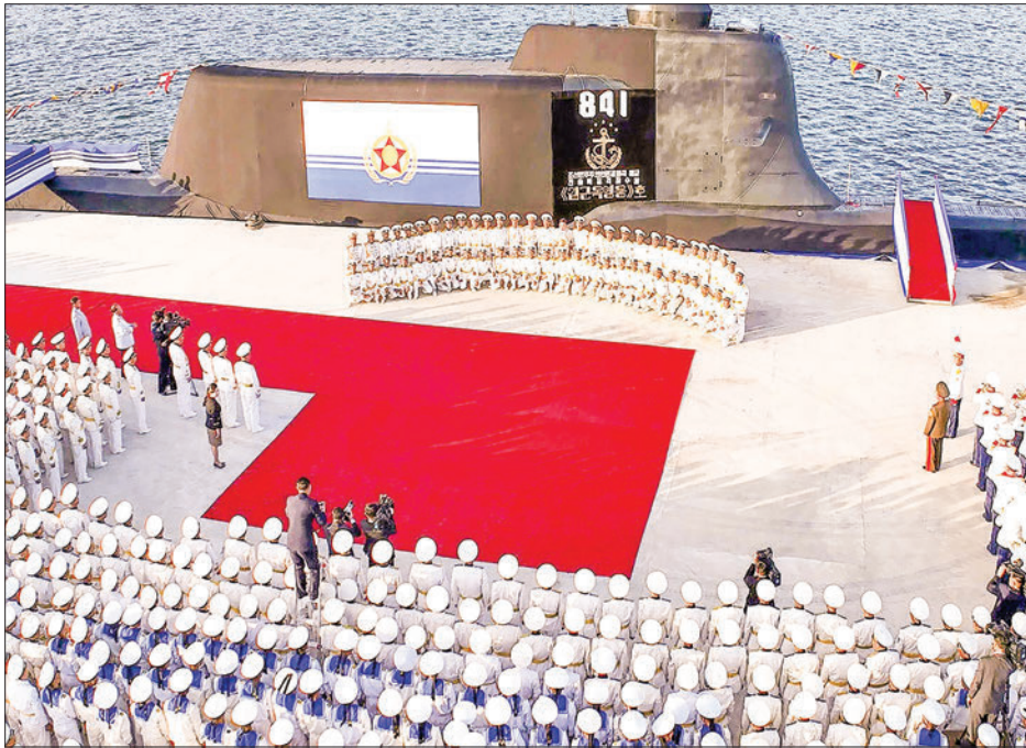
A launching ceremony of the Democratic People's Republic of Korea's first tactical nuclear attack submarine is held on 6 September 2023.

THE top leader of the Democratic People's Republic of Korea (DPRK) called South Korea a “principal enemy” and asked his country to bolster up self-defence capabilities, the official Korean Central News Agency (KCNA) reported Wednesday.