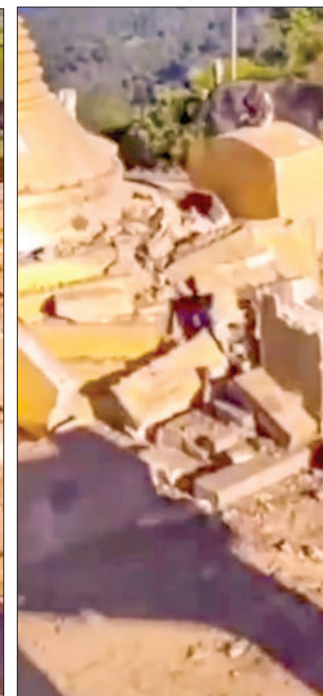
Photos show the pagoda and a terrorist destroying the pagoda in Laukkai Township.

Buddhists. This barbaric and despicable incident saddens all of us Buddhists. I am saddened. This action will shock Buddhists from not only Myanmar but from Thailand, Laos, Cambodia, Sri Lanka, India, and China, including Tibet region and Yunnan Province. They also bombed with driverless drones on the monastery in