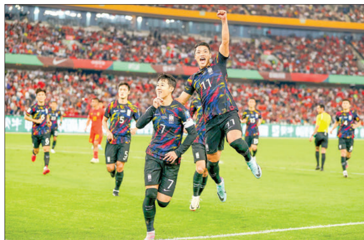
South Korea's Son Heung-min celebrates his goal with his teammates during the match against China at the 2026 FIFA World Cup Asian qualifier.

Qatar won plaudits for its organisation of the World Cup but the team flopped on the pitch, their three straight defeats the worst performance of any World Cup host. — AFP