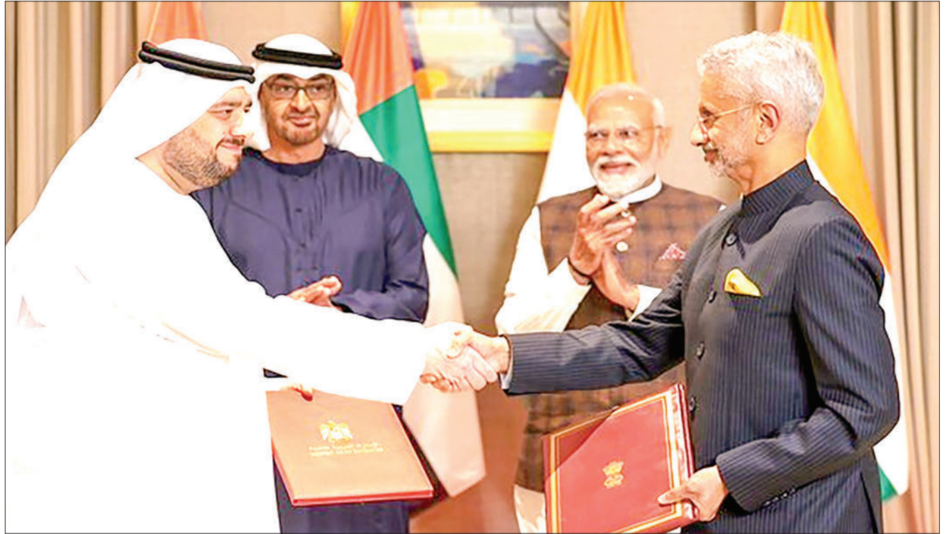
India, UAE on Tuesday signed several Memorandums of Understanding (MoUs) in the presence of Prime Minister Narendra Modi and UAE President Mohamed bin Zayed Al Nahyan.

The agreements include cooperation in renewable energy sectors, innovative healthcare projects, food park development, and creating sustainable ports.