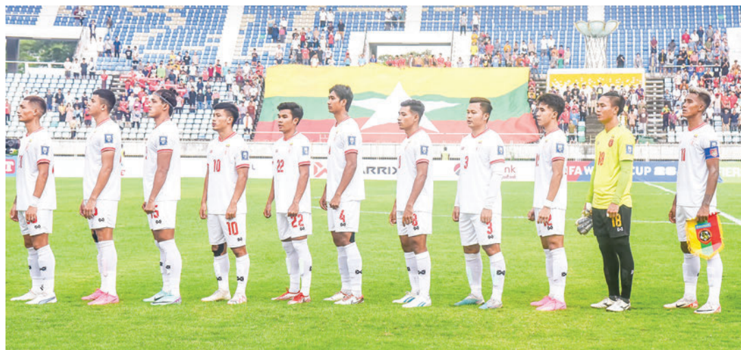
Myanmar team players are seen during an international football match.