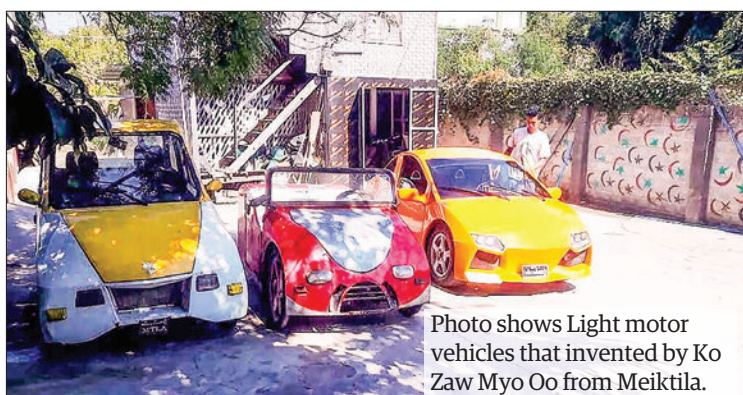
Photo shows Light motor vehicles that invented by Ko Zaw Myo Oo from Meiktila.

KO Zaw Myo Oo from Meiktila, who is famous for his inventions of own-designed motorcycles