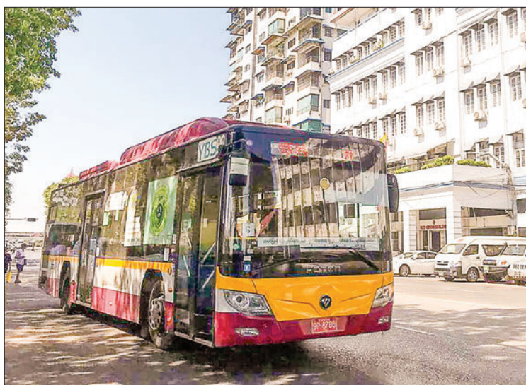
A YBS bus runs in downtown Yangon.

Senior General Thadde Maha Thray Sithu Thadde Thiri Thudhamma Min Aung Hlaing Prime Minister Chairman State Administration Council