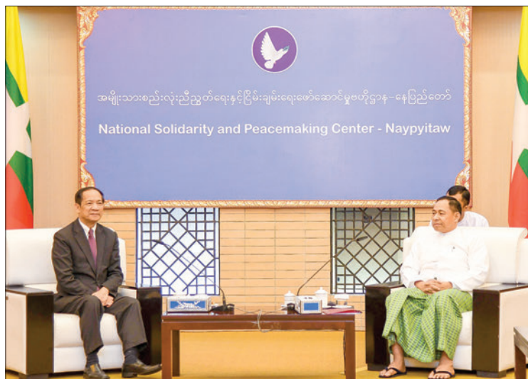
SAC Member Union Minister for Home Affairs Lt-Gen Yar Pyae receives Special Envoy of ASEAN Chair on Myanmar Mr Alounkeo Kittikhoun in Nay Pyi Taw yesterday.

Home Affairs Lt-Gen Yar Pyae and Special Envoy to ASEAN Chair on Myanmar Mr Alounkeo Kittikhoun discussed Myanmar's peace processes, the status of peace talks with ethnic armed organizations, ASEAN Five-Point Consensus and humanitarian aid issues. — MNA/TS