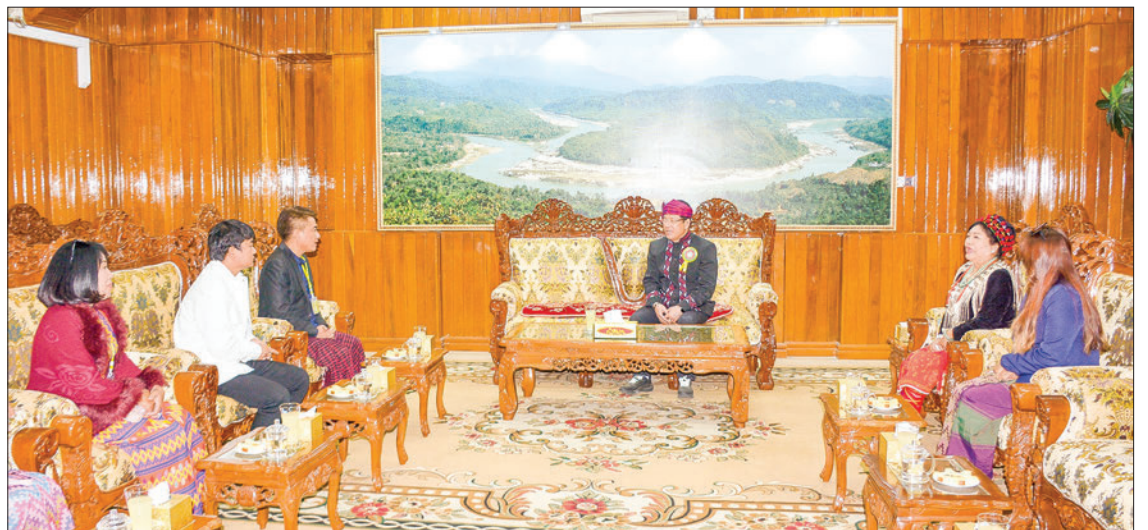
The meeting on describing Kachin culture, customs, and traditions with music and dance in progress in Myitkyina, Kachin State, yesterday.