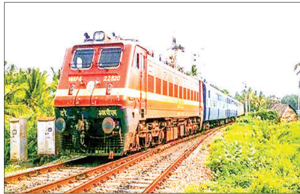
The achievement, driven by a commitment to eco-friendly practices, has transformed 61,508 route kilometres into an electrified network by December 2023, as per the Ministry of Railways.

With a steadfast commitment to eco-friendly practices, the Indian Railways' electrification drive