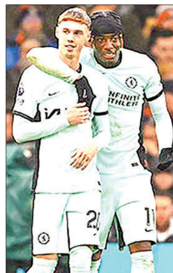
Despite the desire to stay, Palmer made a £40 million move to Chelsea on Deadline Day last summer and has become a key player under manager Mauricio Pochettino.

CHELSEA midfielder Cole Palmer stated that he wanted to stay at his boyhood club Manchester City