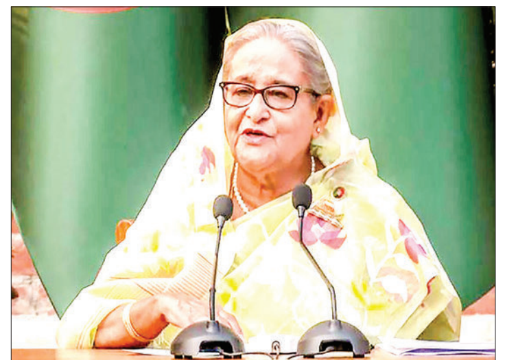
Bangladesh Prime Minister Sheikh Hasina, in her fifth term, outlined plans for the country's international relations and emphasized the strong bond with India.

The Prime Minister stressed the historical significance of India's support during the Bangladesh Liber-