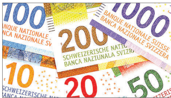
The SNB, like other central banks globally, raised interest rates to address inflation, leading to the payment of interest to banks depositing money at the central bank. PHOTO: FREEPIK

Like other central banks worldwide, the SNB has raised its interest rates out of negative territory in efforts to tame inflation. — AFP