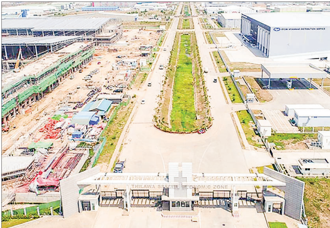
An aerial view shows factories in Thilawa Special Economic Zone in Yangon.

in the forex market, the gold price peaked at K4 million per tical in August 2023. — NN/EM