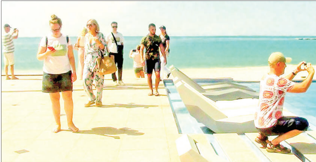
Overseas tourists were seen on the beach of Ngapali in October 2023.