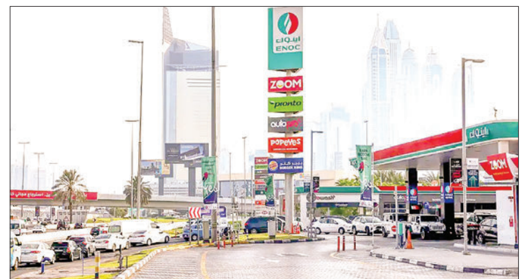
The World Bank projects the UAE's real GDP to grow by 3.4 per cent in 2023, with further increases to 3.7 per cent in 2024 and 3.8 per cent in 2025.

The report said that the growth rate in the Middle East and North Africa (MENA) region slowed down sharply to 1.9 per cent in 2023, as the region faced multiple headwinds, including oil production cuts, elevated inflation, and weak private sector activity in oil-importing economies. The report also expected the growth rate in the MENA region to pick up to 3.5 per cent in 2024 and 2025. — ANI