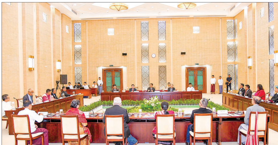
The meeting between delegation led by Special Envoy of the ASEAN Chair on Myanmar and seven NCA-signatory EAOs in progress in Nay Pyi Taw yesterday.