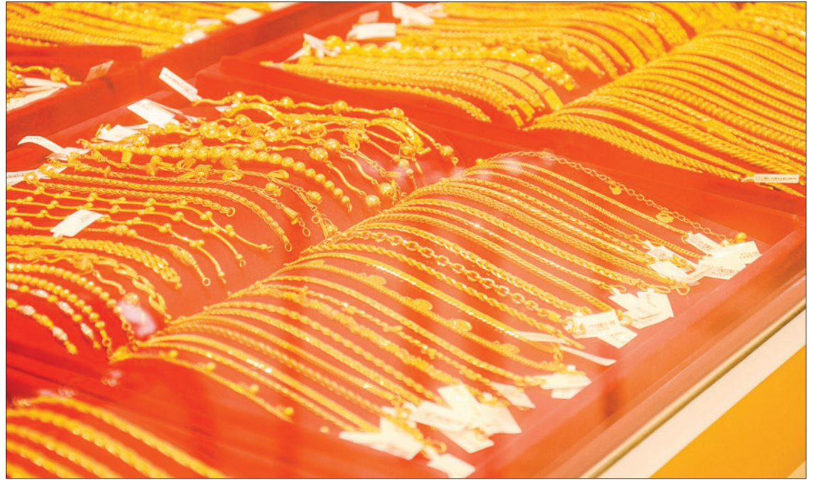
Varieties of gold ornaments are seen in the gold outlet in Yangon.

On 5 December, the Central Bank of Myanmar (CBM) allowed authorized dealers (private banks) to operate forex exchange transactions freely as per the market rate determined by the supply and