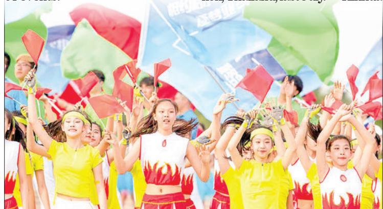
Harbin, the capital of Northeast China's Heilongjiang province, will host the 9 th Asian Winter Games in 2025. PHOTO: XINHUA

Harbin was awarded the 2025 Asian Winter Games by the Olympic Council of Asia at its 42 nd General Assembly held in Bangkok, Thailand, last July. — Xinhua