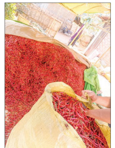
Shan Moehtaung's new chillies have recently arrived in the market.

On 10 January the red long chilli from the Salin area will be priced at K14,000 per viss, while the Shan long chilli (new) will be priced at K11,500/K11,800 per viss. The price of old long chilli from the Delta region, produced in the 2023 chilli harvesting season, is K7,000 per viss. Consequently, buyers prefer old and new long chillies over cold storage ones. — TWA/TMT