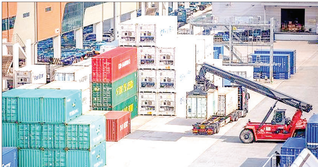
This photo taken on 7 March 2023 shows a container yard at the port of Busan, South Korea. The port of Busan is the largest seaport in the country.

South Korea achieved a current account surplus for the seventh consecutive month, driven by export recovery, with a surplus of US$ 4.06 billion in November 2023, as reported by the Bank of Korea.