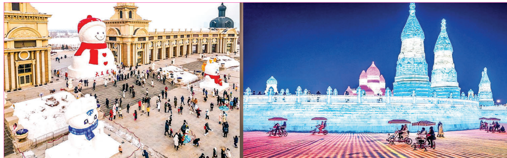
People visiting giant snowmen in Harbin. (L) Tourists have fun at Harbin Ice-Snow World in Harbin, northeast China's Heilongjiang Province, 2 January 2024. (R)

The Spring Festival, China's largest festival, falling on 10 February is a key window for observing economic vitality and consumer confidence. Experts predict that this year's holiday will be the most vibrant and prosperous in recent years, with an estimated 80 million passenger trips, a record high, during the travel rush from 26 January to 5 March.