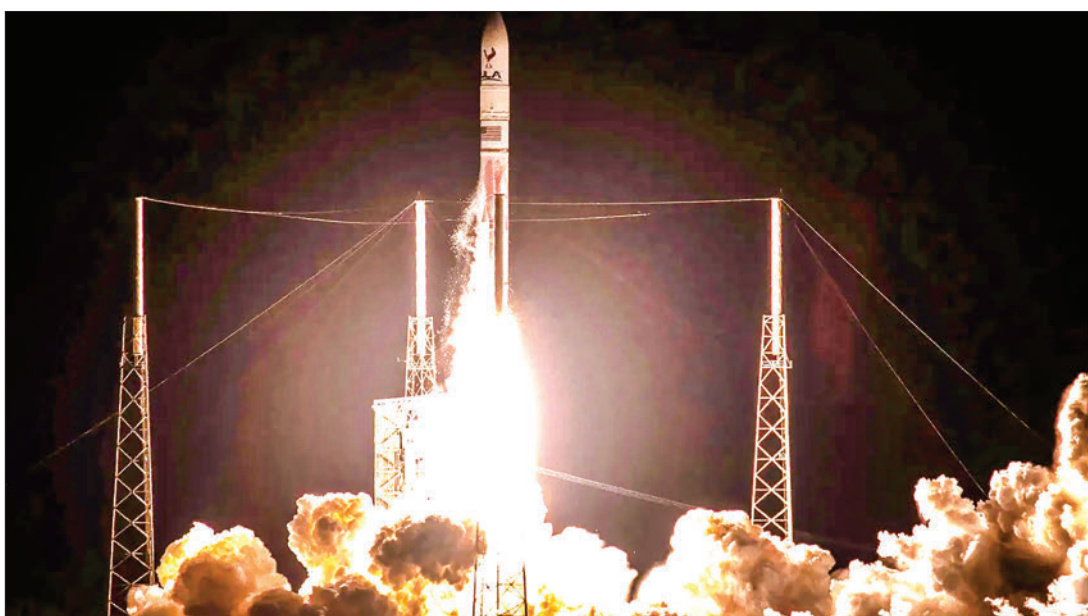
ULA's Vulcan Centaur rocket launches the Peregrine moon lander on 8 January 2024.

"After successful propulsion systems activation, Peregrine entered a safe operational state. Unfortunately, an anomaly then occurred, which prevented Astrobotic from achieving a stable sun-pointing orientation," the company said in a release. — Xinhua