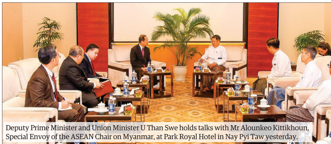
Deputy Prime Minister and Union Minister U Than Swe holds talks with Mr Alounkeo Kittikhoun, Special Envoy of the ASEAN Chair on Myanmar, at Park Royal Hotel in Nay Pyi Taw yesterday.

U Than Swe, Deputy Prime Minister and Union Minister for Foreign Affairs of the Republic of the Union of Myanmar, received Mr Alounkeo Kittikhoun, Special Envoy of the ASEAN Chair on Myanmar, yesterday at Park Royal Hotel in Nay