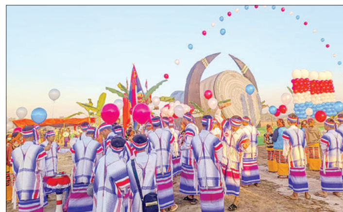
Unveiling image of Phasi (frog drum) to mark the Kayin New Year festival in Taungkalay village.

The upcoming festival in Taungkalay Village, Hpa-an Township, Kayin State, from 9 to 11 January, is expected to feature sports competitions and traditional Kayin ethnic dance competitions. — ASH/TKO