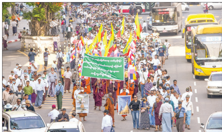
A rally takes place yesterday in Yangon, to denounce the acts of terrorists destroying and insulting religious edifices.

A protest against the terrorist insurgents who are destroying and insulting religious edifices that are not related to the military was held near Maha Bandoola Park in front of Yangon City Hall yesterday.