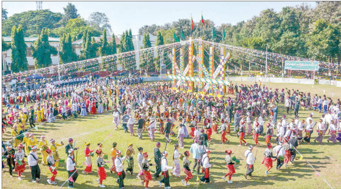
The ceremony for the 76 th Anniversary of Kachin State Day in progress on the lawn in front of the Kachin State government office in Myitkyina yesterday.

Union Minister for Border Affairs Lt-Gen Tun Tun Naung handed over 150 sets of 120-watt solar home system units for the