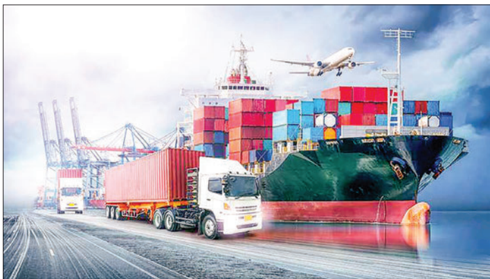
The Hong Kong Special Administrative Region (HKSAR) signed the first protocol to amend its free trade agreement (FTA) with the Association of Southeast Asian Nations (ASEAN) on Tuesday, aiming to strengthen economic and trade connections.

The specified products incorporated into the FTA through the protocol include various categories of products of interest to Hong Kong traders and manufacturers, such as jewellery, medicaments, food products and textile products. — Xinhua