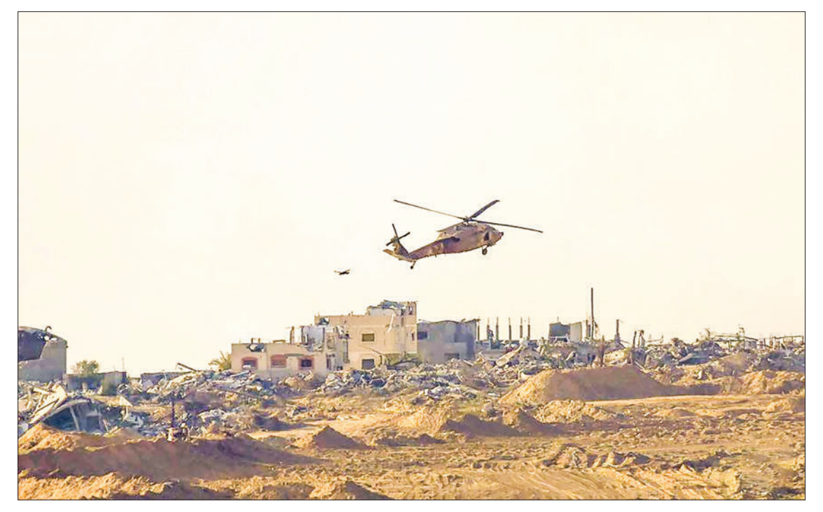
This photo taken from the Israeli side of the border with the Gaza Strip shows an Israeli military helicopter hovering over the Gaza Strip, on 8 January 2024. The Israeli army has started a new, less intensive phase in its military operation against Hamas in the Gaza Strip, Israel Defence Forces (IDF) Spokesman Daniel Hagari said on Monday. The remarks came after Israeli Defence Minister Yoav Gallant told the Wall Street Journal that Israeli forces would start a new chapter of the conflict that "will last for a longer time."