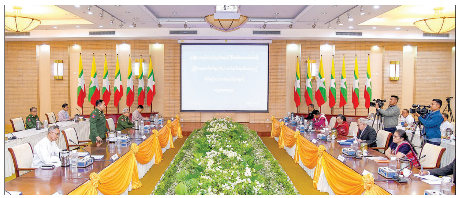
NSPNC meets seven NCA signatory ethnic armed organizations in Nay Pyi Taw yesterday.

A meeting between the National Solidarity and Peacemaking Negotiation Committee and seven NCA-signatory EAOs took place at the NSPNC centre in Nay Pyi Taw yesterday morning.