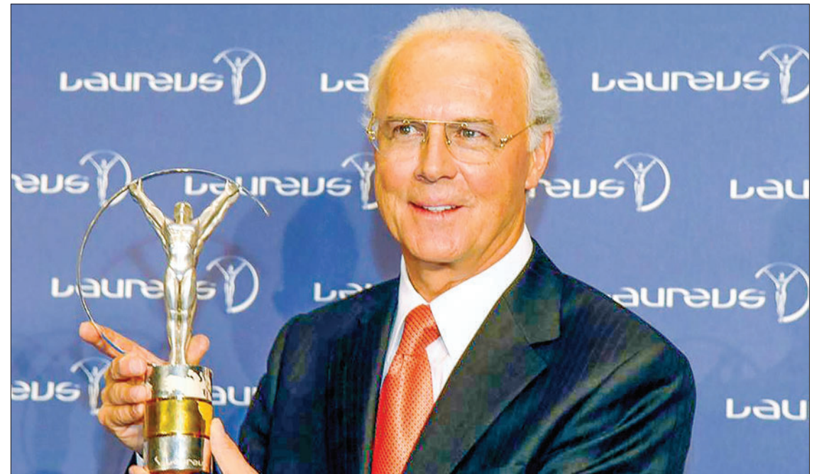
German football legend Franz Beckenbauer has died at 78, according to German Football Association (DFB) on 8 January 2024. This file photo taken on 2 April 2007 shows Franz Beckenbauer posing after winning the Lifetime Achievement Award as the 2007 Laureus World Sports Awards unveiled in Barcelona, Spain.

Beckenbauer's illustrious playing career included winning the European Championship title in 1972. He was the first German footballer to make over 100 international appearances. His successes with the national team include being the runner-up in the World Cup in 1966 and runner-up in the Eu-