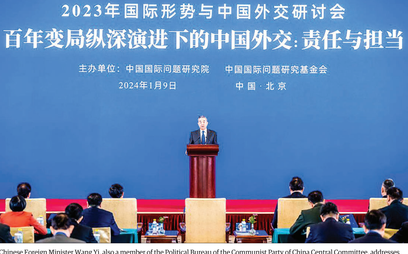
Chinese Foreign Minister Wang Yi, also a member of the Political Bureau of the Communist Party of China Central Committee, addresses the symposium on the international situation and China's foreign relations in 2023 in Beijing, capital of China, 9 January 2024.

Xi and Putin met twice during the year. At the end of 2023, when Russian President Vladimir Putin sent New Year's greetings to Chinese President Xi Jinping,