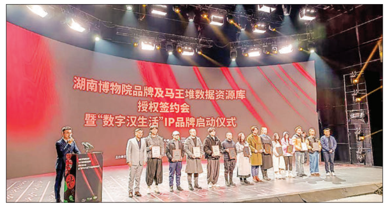
This photo taken on 8 January 2024 shows a scene at the launch ceremony in Changsha, central China's Hunan Province. The Hunan Museum made the digital database on the world-famous Mawangdui Tombs available to colleges and companies on Monday, becoming the latest Chinese museum aiming to turn archaeological finds into popular cultural brands.

The site gained international attention in the 1970s when researchers opened a coffin and found a female corpse that showed no signs of decay. The corpse, now preserved in the museum, is said to be that of a woman named Lady Xin Zhui, the wife of the Marquis of Dai. — Xinhua