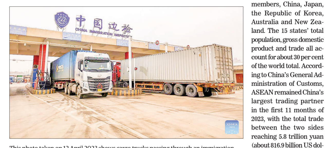
This photo taken on 12 April 2023 shows cargo trucks passing through an immigration inspection checkpoint at Dongxing port in Dongxing, south China's Guangxi Zhuang Autonomous Region.

Boosted by the Regional Comprehensive Economic Partnership (RCEP) agreement that entered into force on 1