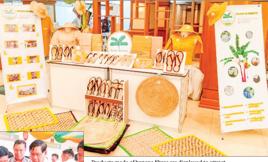
Products made of banana fibres are displayed to attract visitors.

His company is involved in a weaving business that utilizes banana fibres.