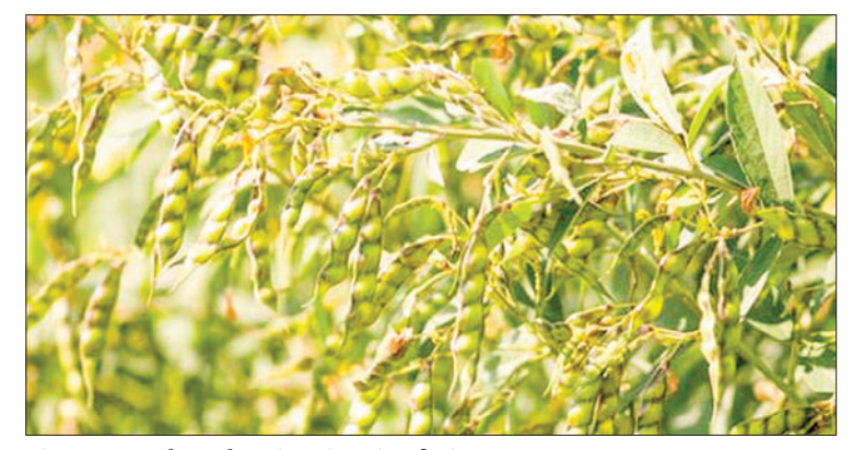
Pigeon pea plants bearing ripening fruits.

According to a Memorandum of Ministry of Commerce's statistics Understanding between Myan-indicated. — NN/EM