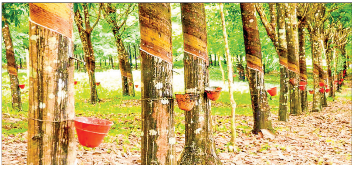
Collection of rubber latex seen at young rubber farm.

Global demand for rubber, rubber production of the Southeast Asian nations and the market supply weigh on Myanmar's rubber prices.