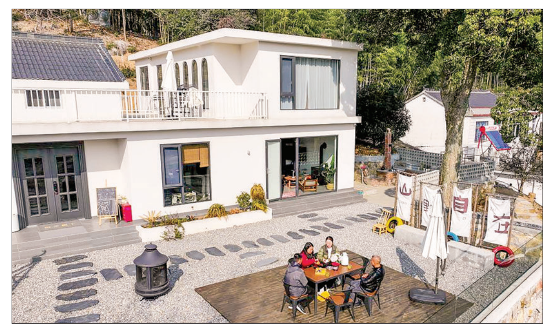
This aerial photo taken on 6 January 2024 shows tourists chatting at a homestay in Tianzhu Village of Shuihou Township, Qianshan City, east China's Anhui Province. The tourist service of Shuihou Township at the foot of Tianzhu Mountain used to be limited to pure sightseeing in the mountainous areas. In recent years, the service has been diversified with the development of a number of high-quality homestays. A new business model of "snow plus homestay" has also been built based on the nearby ski resort during winter time. Homestays and other household-based tourist attractions now provide job opportunities to more than 3,000 local residents.