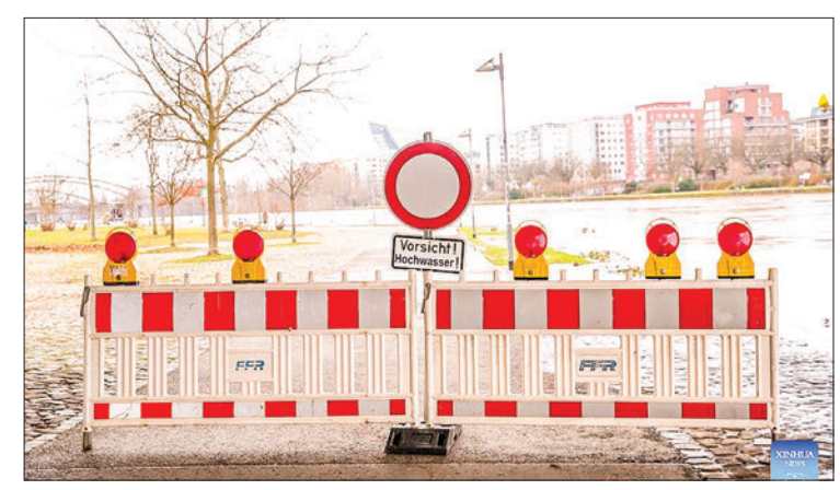
A warning sign of floods is seen in Frankfurt, Germany, 7 January 2024. Some areas in Frankfurt were flooded due to continuous rainfall and rising water level of the Main River.

The meteorological department has issued warnings of heavy rains due to the northeast monsoon, which typically lasts from October to March, with strong winds and rough seas expected in northern states and the east coast of the Southeast Asian country. — Xinhua