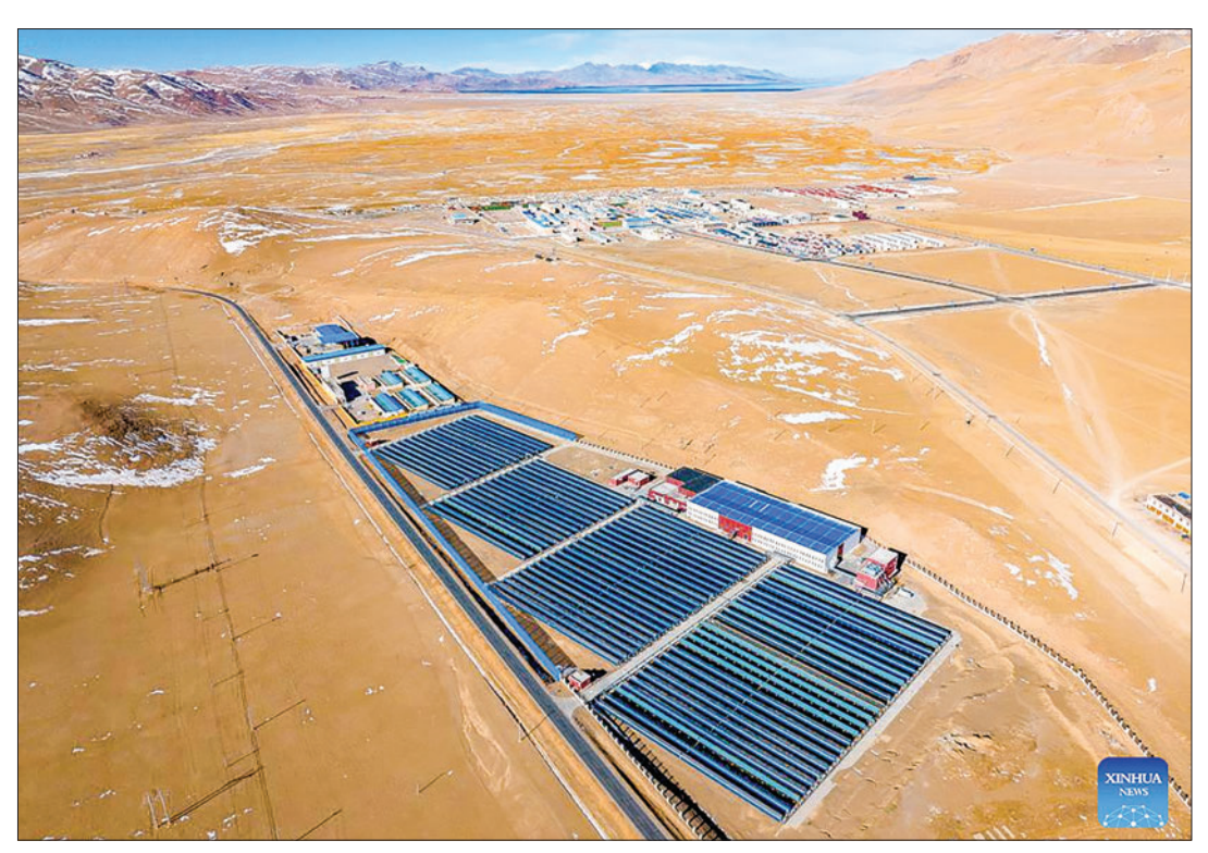
This aerial photo taken on 6 January 2024 shows solar thermal collectors at a heating plant in Xainza County, southwest China's Xizang Autonomous Region.

A survey of 1,200 people undertaken by Mesidis and his fellow researchers found that consumers favoured glass wine bottles, associating them with tradition and prestige, over the alternatives. — Xinhua