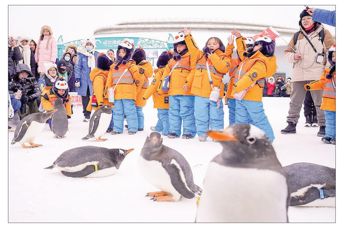
Children from south China's Guangxi Zhuang Autonomous Region meet with penguins as they visit the Harbin Polarpark in Harbin, northeast China's Heilongjiang Province, 6 January 2024.

As Guangxi is closely linked with sugar oranges, which has a peel colour exactly the same as the down jackets worn by the