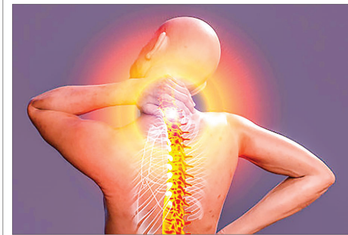
Fibromyalgia, characterized by widespread pain, exhaustion, and stiffness, lacks a known cure, and current medications often prove insufficient in efficacy.

A study from the Karolinska Institutet finds no substantial differences in treating fibromyalgia between exposure-based Cognitive Behavioral Therapy (CBT) and standard CBT, both significantly reducing symptoms in affected individuals.