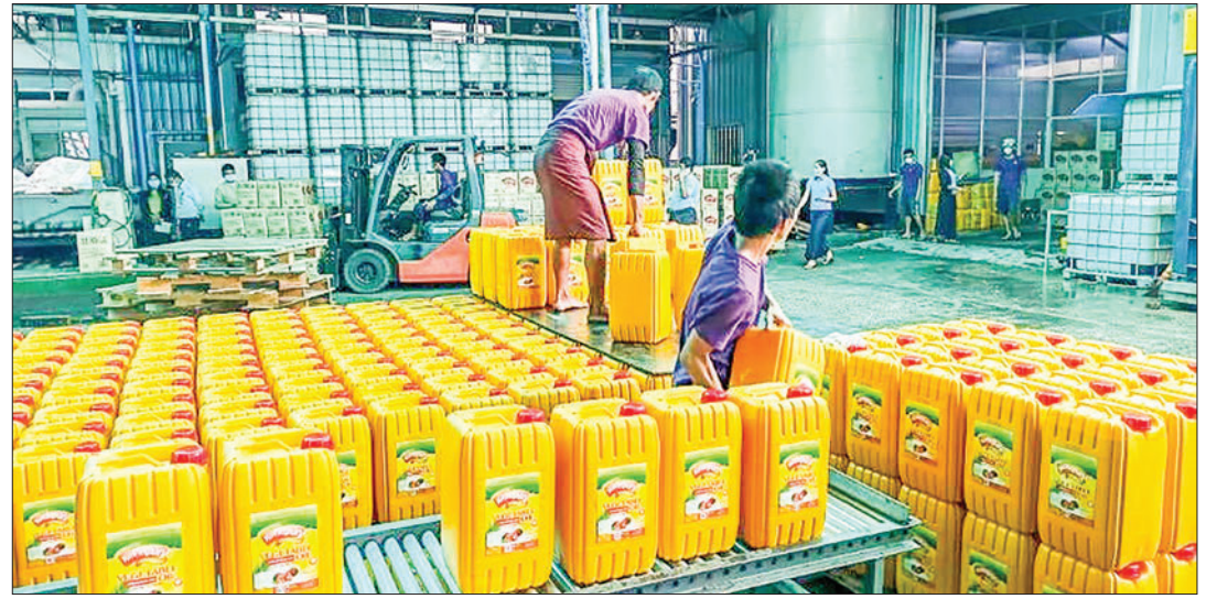
Palm oil production in Taninthayi Region.

ACCORDING to the Supervisory Committee on edible oil import and distribution, the wholesale reference rate of palm oil for the Yangon market has stayed the same for three weeks.