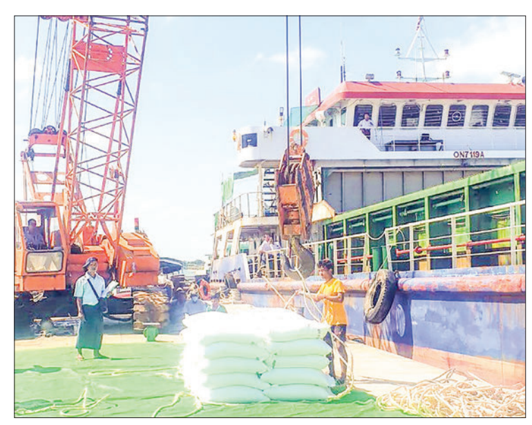
Bags of rice being loaded aboard cargo vessel at Pathein Port for exporting rice to Bangladesh.

Myanmar has implemented the National Export Strategy (NES) 2020-2025 to boost exports. The priority sectors of the NES consist of agricultural production, garment and apparel, industrial and electronic device, fishery business, forest product, digital manufacturing and service, logistic service, quality management, trade information service, innovation and entrepreneurship sectors. — NN/KK