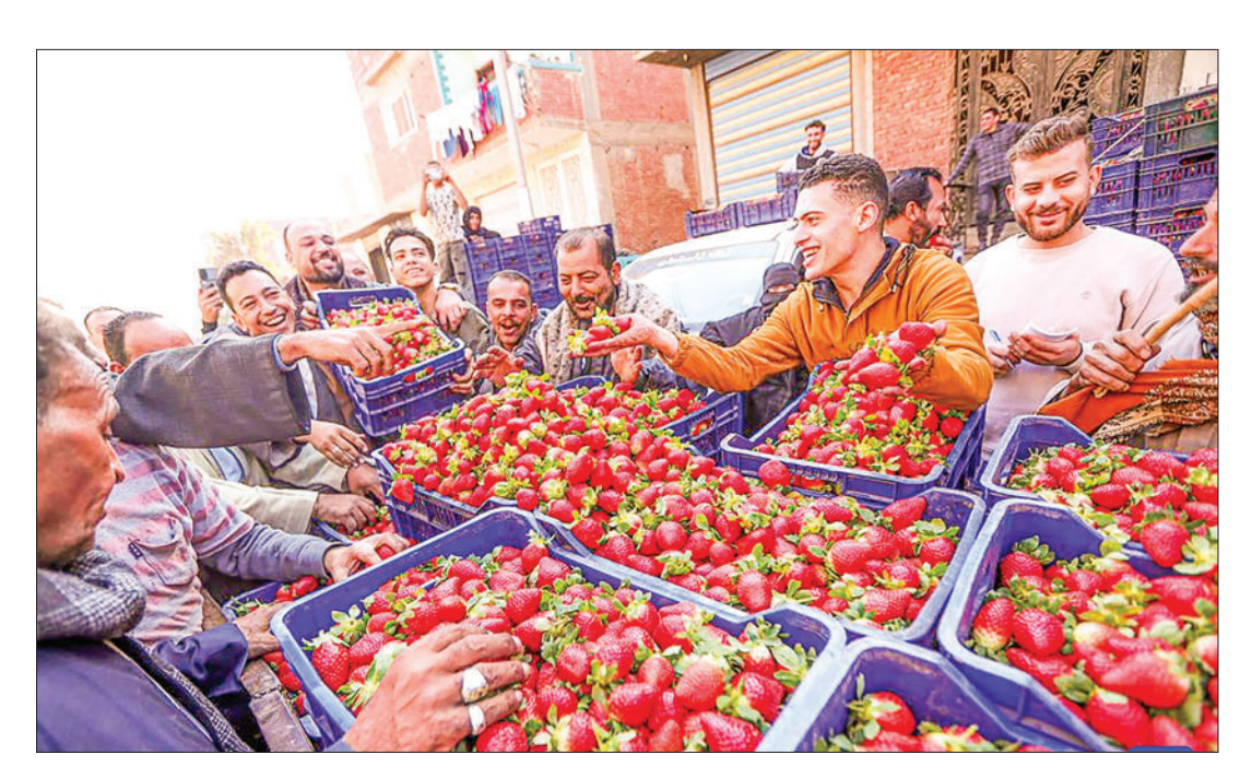
People buy freshly harvested strawberries at a market in Qalyubia Governorate, Egypt, 6 January 2024.

This year marks the 45<sup>th</sup> anniversary of the establishment of a sister city relationship between Dalian and Kitakyushu. The resumption of the air route will help strengthen personnel, economic and trade exchanges between northeast China and Kitakyushu, according to sources with the Dalian international airport. — Xinhua