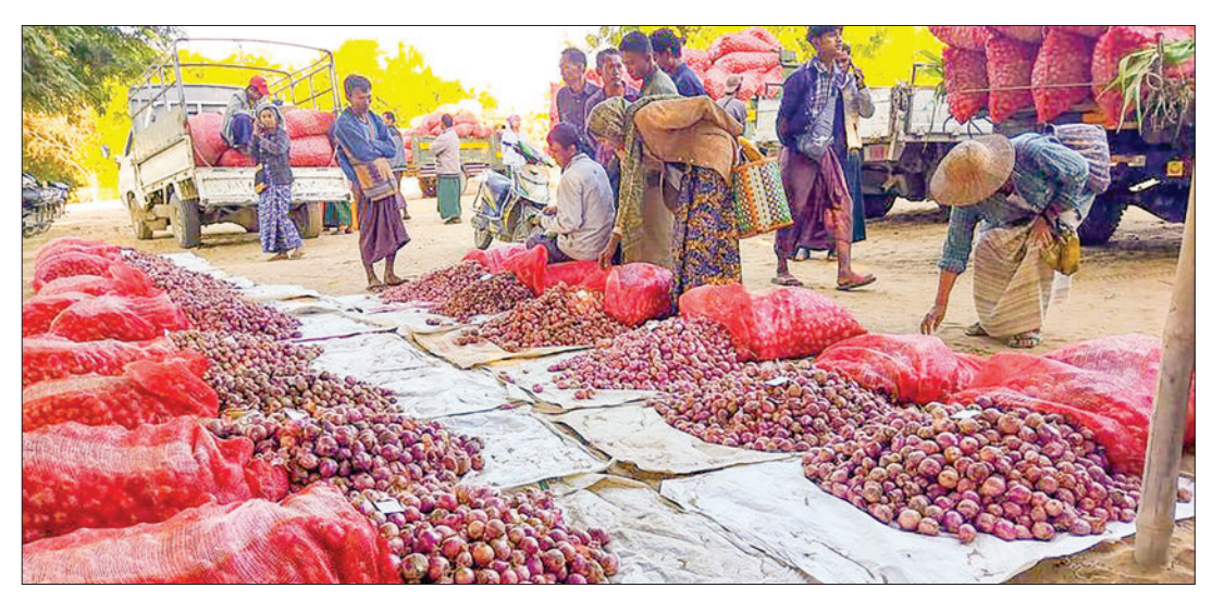
Monsoon onions are displayed at the Seikphyu market on 7 January 2024.

The prices of new monsoon onions are on a downward trend.