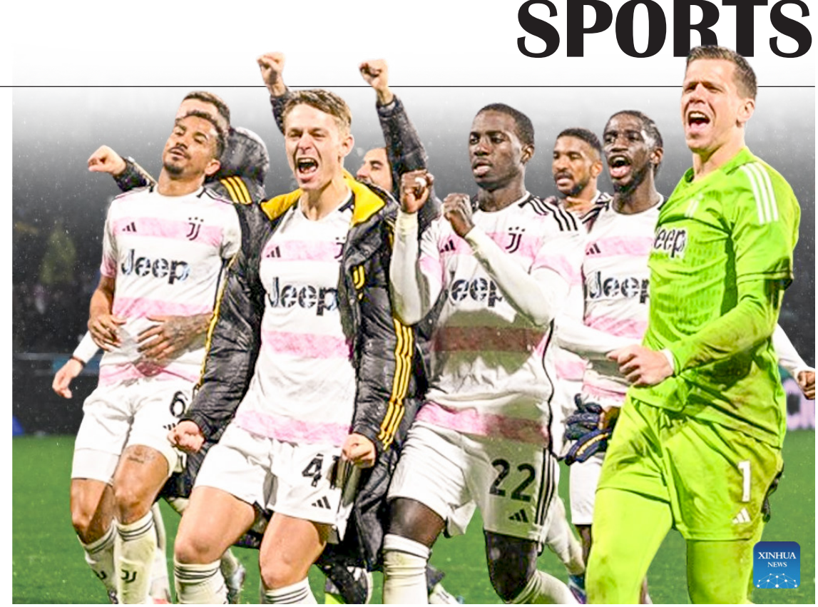
FC Juventus players celebrate at the end of the Italian Serie A football match between Salernitana and FC Juventus in Salerno, Italy, 7 January 2024.

The Rossoneri put their nose ahead in the 11<sup>th</sup> minute when Rafael Leao collected the ball on the left side and out-