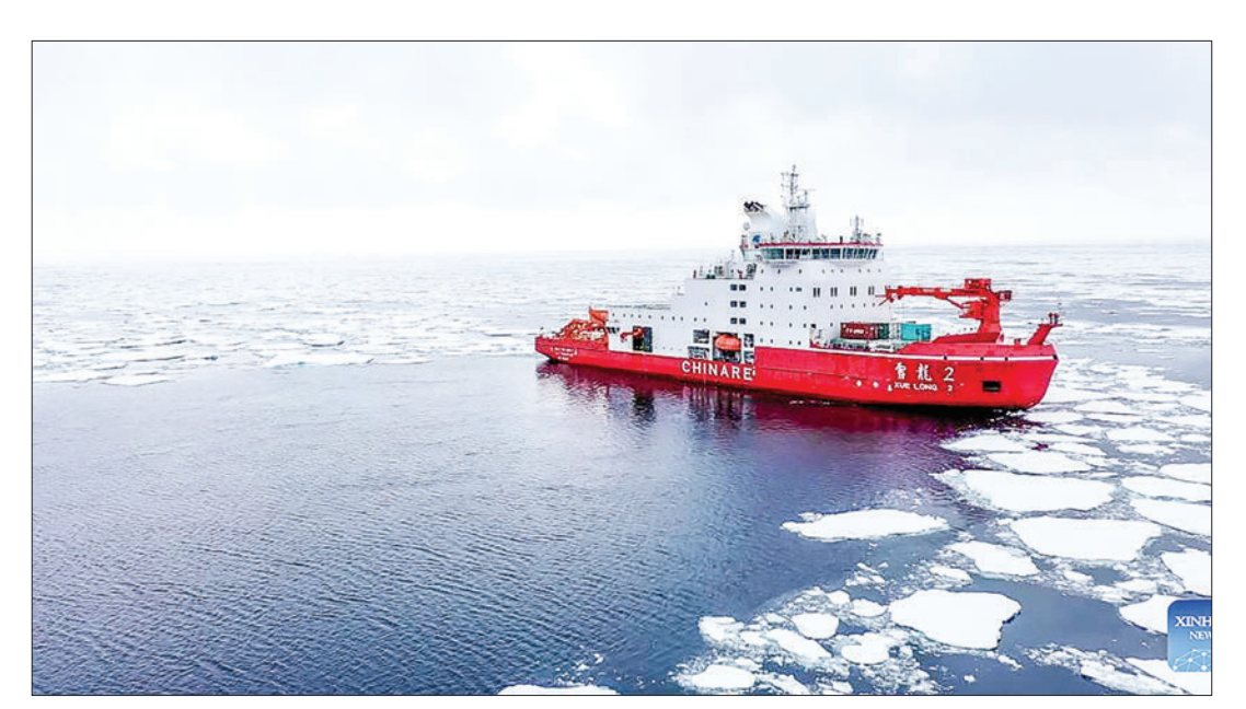
This aerial photo taken on 6 January 2024 shows China's research icebreaker Xuelong 2 conducting scientific expedition in the Amundsen Sea. Members of China's 40<sup>th</sup> Antarctic expedition team have recently conducted scientific work aboard China's research icebreaker Xuelong 2 in the Amundsen Sea.