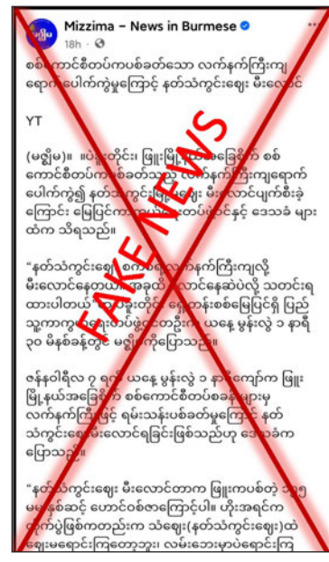
A screen-shot of misinformation.

information on social media through malicious news media. — MNA/KZW