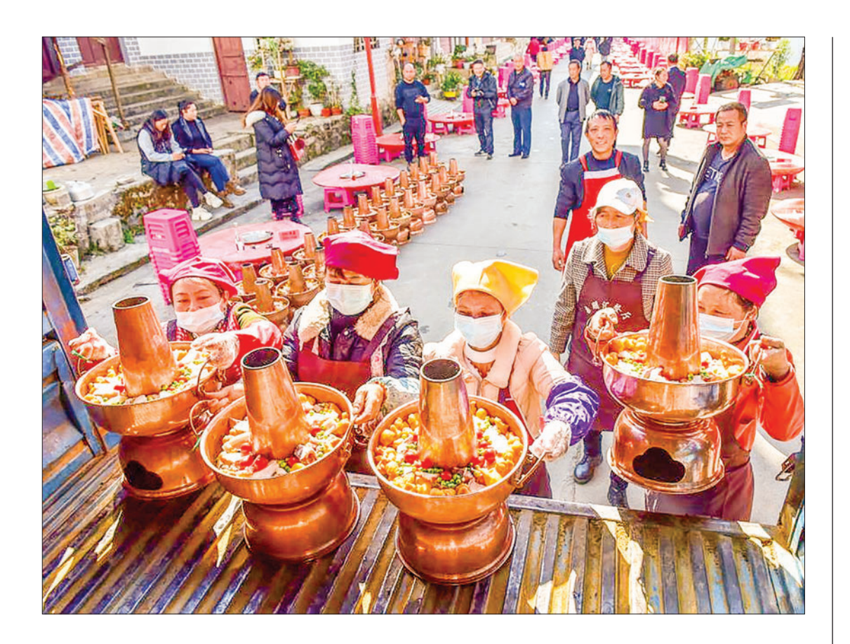
Staff members prepare for a copper hot pot banquet in Wenshan Zhuang and Miao Autonomous Prefecture, southwest China's Yunnan Province, 6 January 2024. Yunnan has attracted legions of tourists this winter due to its mild climate.