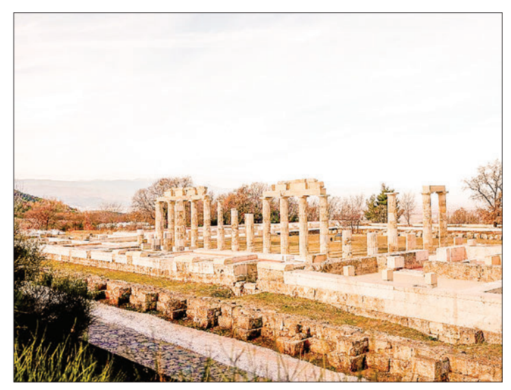
This photo taken on 5 January 2024 shows a view of the site of a palace of the ancient kingdom of Macedonia at the archaeological site of Aigai in Vergina, Greece.

GREECE is ready to reopen on Saturday a palace of the ancient kingdom of Macedonia where Alexander the Great (356 B.C.-323 BC) was declared king.