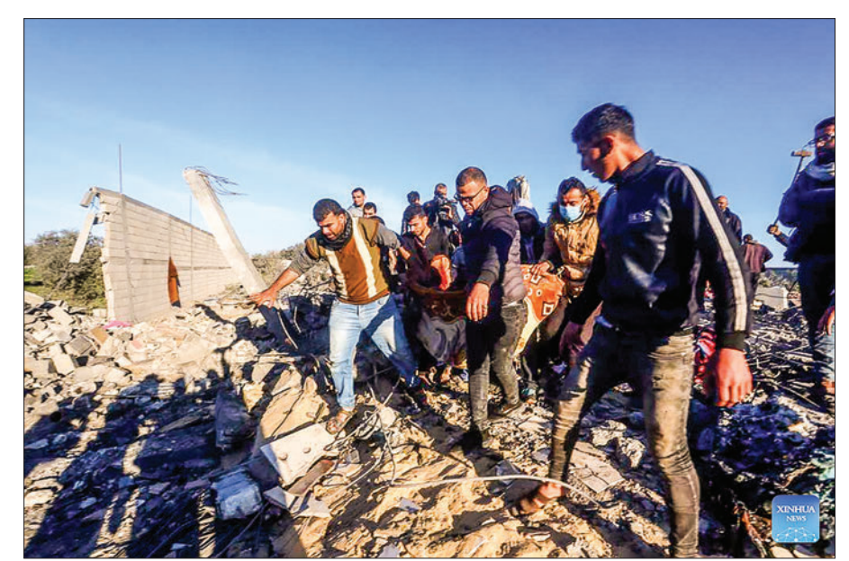
Rescue work is underway after Israeli attacks in the southern Gaza Strip city of Rafah, on 7 January 2024.

Halevi also said the IDF would increase "the pressure it exerts" on Israel's northern border with Lebanon, where it has traded fire with Hezbol-