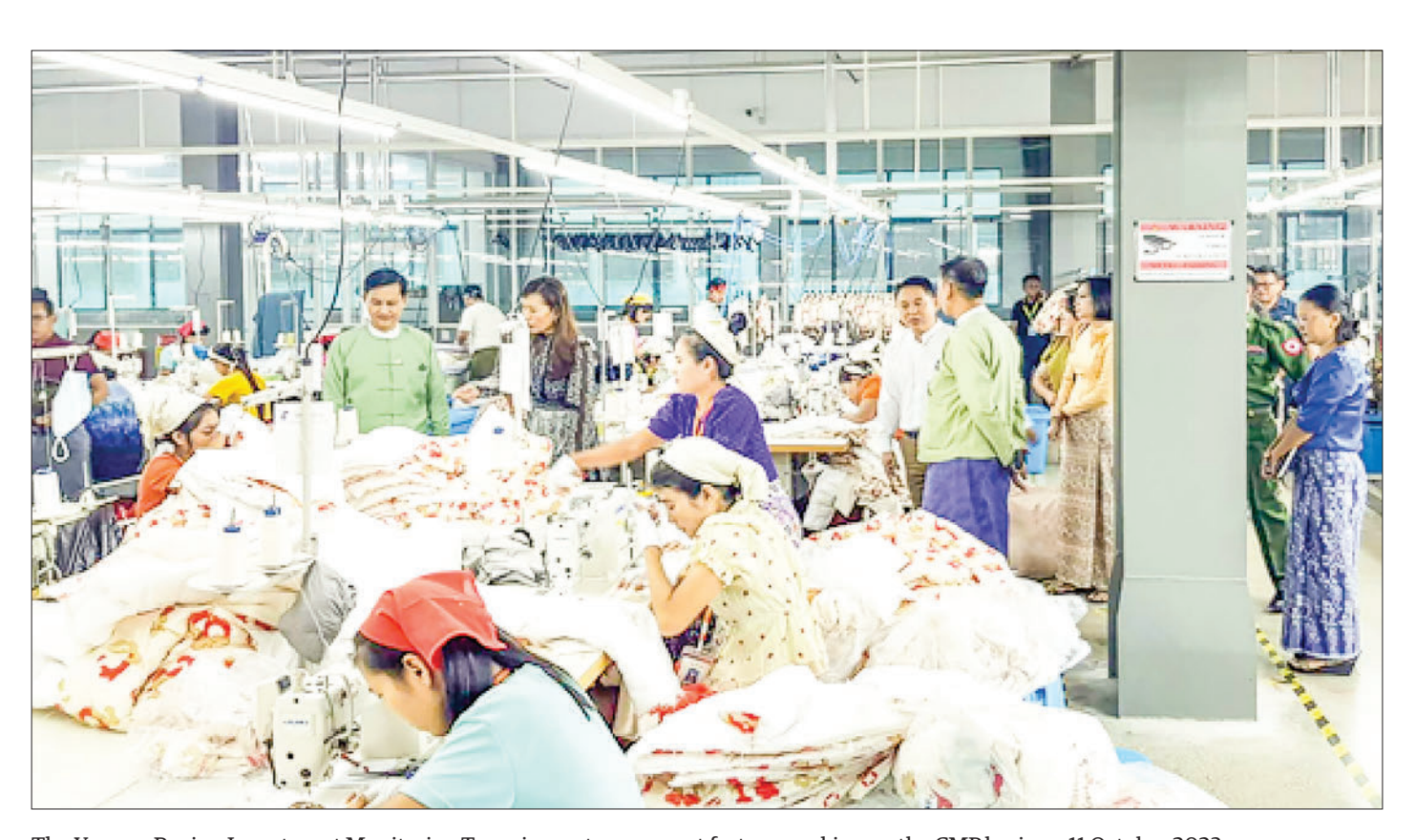
The Yangon Region Investment Monitoring Team inspects a garment factory working on the CMP basis on 11 October 2023.