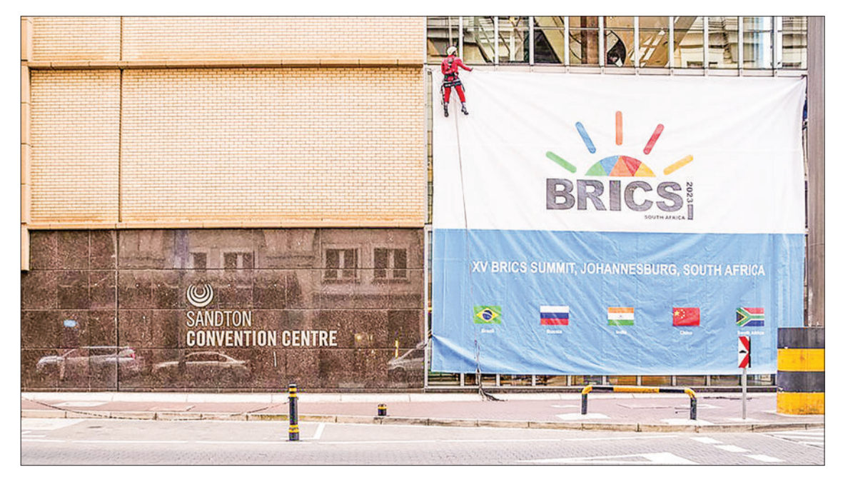
A worker arranges a signboard of the 15<sup>th</sup> BRICS summit outside the Sandton Convention Centre in Johannesburg, South Africa, 17 August 2023.

Originally comprising Brazil, Russia, India, China, and South Africa, the BRICS group welcomed Egypt, Ethiopia, Iran, Saudi Arabia and the United Arab Emirates as new members during the bloc's summit in August 2023. Their membership has