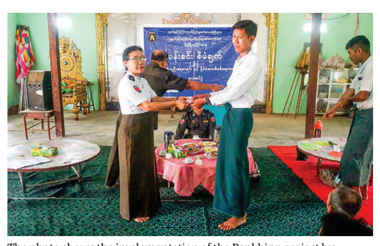
The photo shows the implementation of the Pankhinn project by officials in Hmawza village-tract in Pyay township in Bago Region on 29 August 2023.

UNION Minister U Myint Kyaing of the Ministry of Immigration and Population announced on 30 December that the third phase of the Pankhinn Project, scheduled to run from 1 January to 30 September 2024, aims to issue citizenship scrutiny cards (CSCs) to more than two million people.