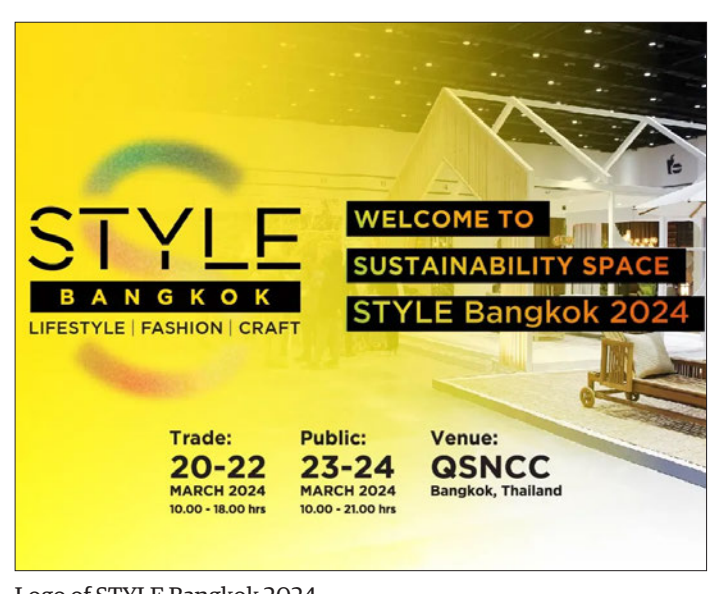
Logo of STYLE Bangkok 2024.

Those interested companies need to register at https:// mitc.myantrade.gov.mm/member/trade-fair/new and the participants will be selected in order. For further details, the Myanmar Trade Promotion Organization can be reached at phone number 067 408622. — NN/EM