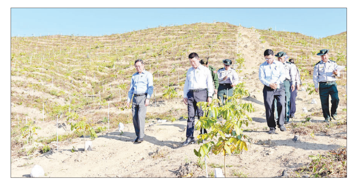
Union Minister U Khin Maung Yi makes an inspection tour to Ayeyawady Region on 30 December.

UNION Minister U Khin Maung Yi for Natural Resources and Environmental Conservation (MoN-REC) said on 31 December that planting economically significant trees is instrumental in restoring the forest's status and reducing dependency on natural forests.