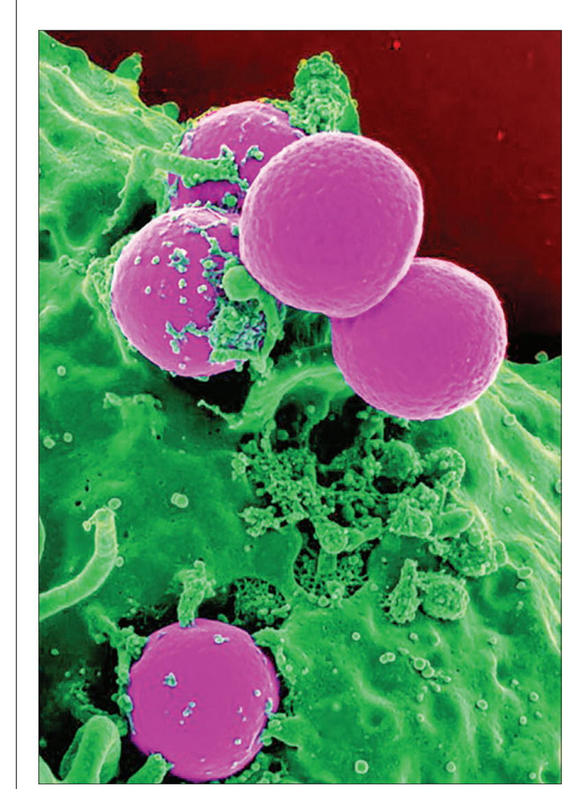
Next-generation sequencing by Brigham researchers suggests that modifying current cancer care standards could enable approximately 6,000 more patients in the United States to benefit from immunotherapy treatment annually. ILLUSTRATION: PIX FOR VISUAL PURPOSE/