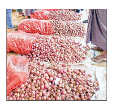
The photo depicts Seikphyu onion depot on 2 January 2024.

There are around 180,000 acres of onion across the country. Myanmar aims to achieve onion exports of 100,000 tonnes in the current 2023-2024 financial year. The leading onion exporting country India banned onion ex-