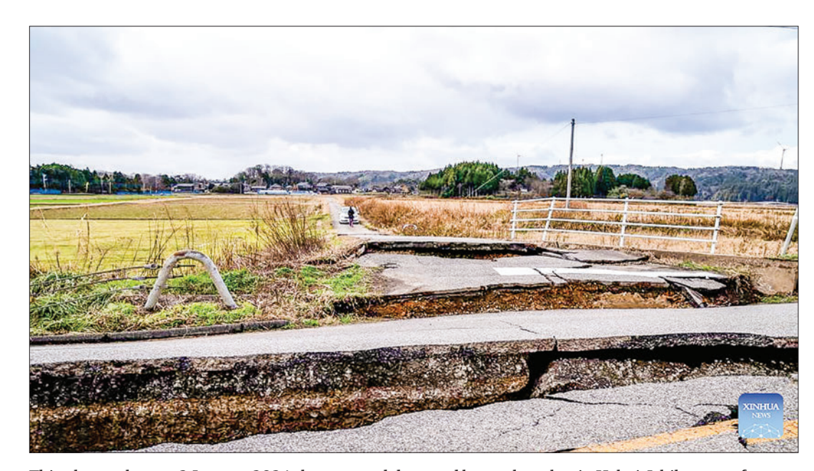
This photo taken on 2 January 2024 shows a road damaged by earthquakes in Hakui, Ishikawa prefecture, Japan.

THE death toll has risen to 48 in the central Japanese prefecture of Ishikawa as of 3:30 pm local time, after a series of powerful earthquakes hit the area in central Japan and the vicinity, with aftershocks and more damage reports coming in