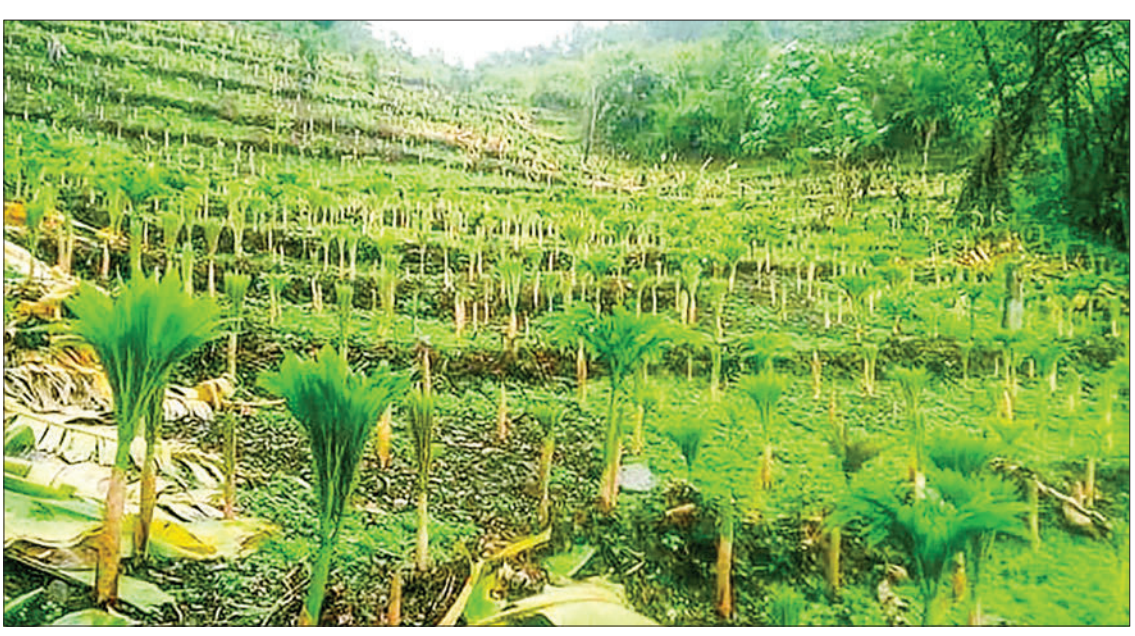
Young Konjac plants thriving in the farm.

Konjac is commonly grown in Mindat, Kanpetlet, Matupi and Haka townships. Konjac plantations cover 4,325 acres in Mindat, 1,565 in Matupi, 1,559 in Haka, 847 in Tiddim, 609 in Falam, 203 in Kanpetlet, and 933 in other townships in Chin State, totalling