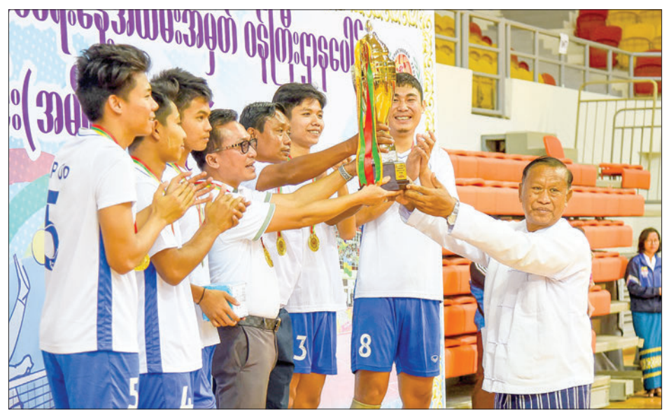
Champion Ministry of Border Affairs holds up championship trophy in celebration over its victory in Inter-Ministry Sepak Takraw Tournament yesterday.

presented individual medals and cash awards to the second prize winning Ministry of Home Affairs team.