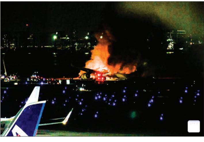
This photo taken on 2 January 2024 shows a Japan Airlines airplane caught in fire at Haneda Airport in Tokyo, Japan.

NHK footage showed a large burst of fire erupting from