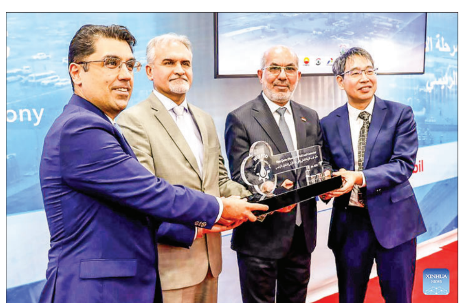
Bassim Mohammed Khudair (2<sup>nd</sup> R), Iraqi deputy oil minister for extraction affairs, and other representatives attend a handover ceremony in Basra, Iraq, on 1 January 2024.

The West Qurna 1 oil-field, located about 50 km northwest of Basra, the capital of the namesake province, is one of Iraq's largest oilfields, with an estimated annual crude oil output of more than 25 million tonnes. — Xinhua