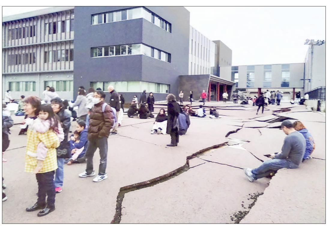
Large cracks are seen on the ground in Wajima, Ishikawa Prefecture, on 1 January 2024, after a strong earthquake rocked a wide area on the Sea of Japan coast in central Japan.

MYANMAR citizens residing in Japan can seek necessary assistance from the embassy in the event of natural disasters, as announced by the Myanmar embassy.