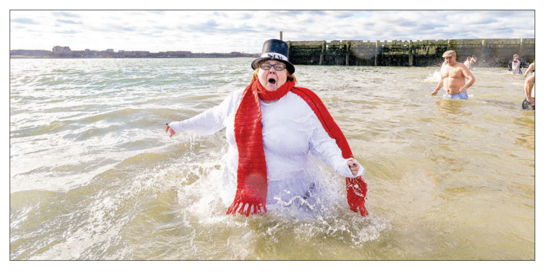
Revelers take the plunge during the annual "L Street Brownies" polar bear plunge in Boston Harbor on 1 January 2020. The polar plunge on New Year's day dates back over 100 years in Boston, but many people, mainly members of the L-Street Brownies, take daily swims 365 days a year into the ocean. The water was reported to be 4 degrees °C (40 °F and the air 36 °F).

Some of the swimmers from the sports-mad city wore hockey masks or the shirts of their favourite teams, while others donned festive outfirts like Santa Claus's red suit. One family even dressed as bees to honour their late father. — AFP