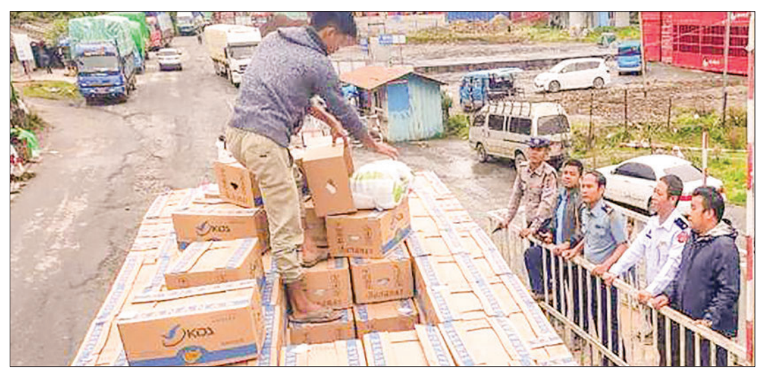
The photo shows the authority checking a truck loaded with goods at the Kampaiti checkpoint.

Tissue-cultured bananas, watermelon, pumpkin, rubber, chili pepper, and Aemahta rice were mainly exported and construction materials, capital goods, and intermediate goods were imported. — TWA/KK