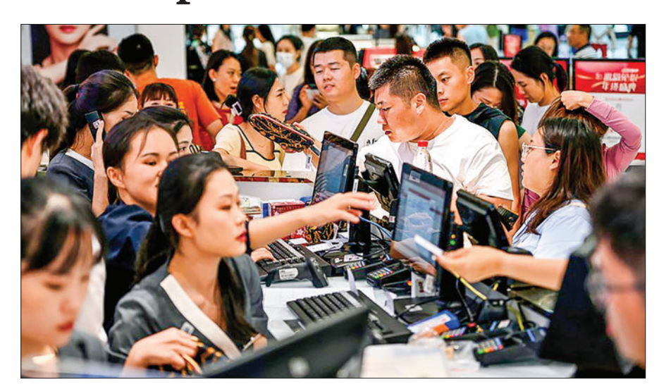
Tourists check out in a duty-free shopping mall in Sanya, south China's Hainan Province, 30 September 2023.

CHINA'S southern island province of Hainan saw total offshore duty-free sales surging 25.4 per cent year on year to 43.76 billion yuan (about 6.2 billion US dollars) in 2023, local customs said Monday.