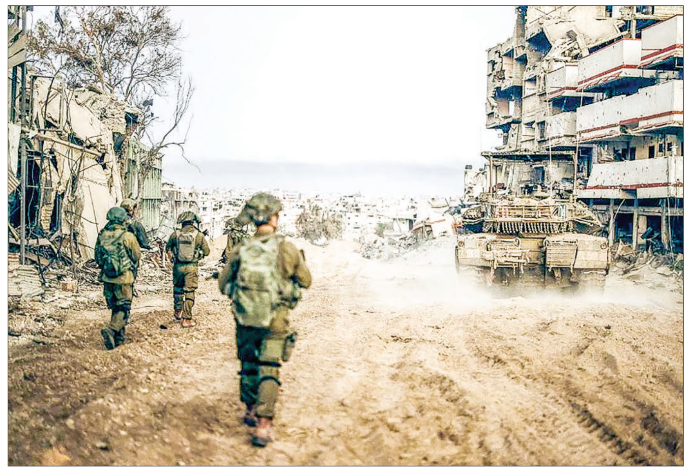
The photo released by the Israel Defence Forces (IDF) on 1 January 2024 shows Israeli troops conducting a military operation in Gaza Strip.

ALESTINIAN movement Hamas, through Qatari and Egyptian intermediaries, presented its proposal for a new prisoner deal to Israel, but the Jewish state found it unacceptable, the Axios news portal reported on Monday, citing Israeli officials and a source.