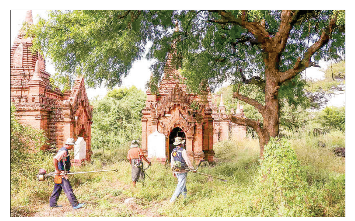
Staff cleansing bushes and debris in part-1 area of Bagan cultural heritage zone.

kyats for the upper class on Yangon-Mandalay journeys. For the Yangon-Pyay airbag train journey, it is 5,000 kyats for the ordinary class and 10,000 kyats for the upper class. As for the Yangon-Mawlamyine train with AAR coaches, the rates are 5,000 kyats for the ordinary class and 10,000 kyats for the upper class. For the Yangon-Mawlamyine train with airbag coaches, passengers will now pay 6,000 kyats for the ordinary class and 11,000 kyats for the upper class." — ASH/TKO