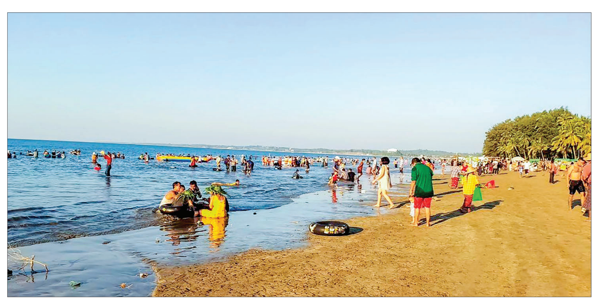
Chaungtha Beach packed with local and foreign travellers during the New Year.

T is reported that in Chaungtha town, Pathein district of Ayeyawady Region, there were a lot of local and foreign visitors who welcomed the New Year at the Chaungtha Beach and relaxed at the same time and it was more than normal days.