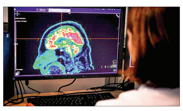
While preliminary, the study hints that daydreaming may influence the brain's future responses, potentially contributing to brain plasticity.