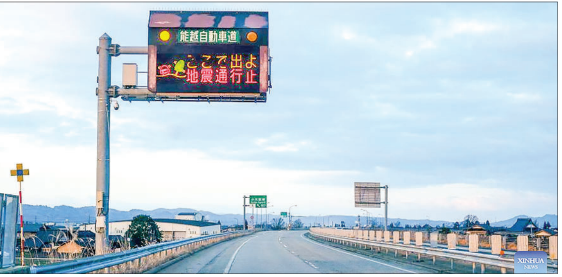
A road sign informs drivers to exit the expressway due to earthquakes in Oyabe City of Toyama Prefecture of Japan, 1 January 2024. A series of strong earthquakes with major ones measured at up to 7.6 magnitude have struck the central Japanese prefecture of Ishikawa on Monday, with tsunami warnings issued, according to the Japan Meteorological Agency (JMA).

The weather agency said the latest major temblor occurred at 4:10 pm local time