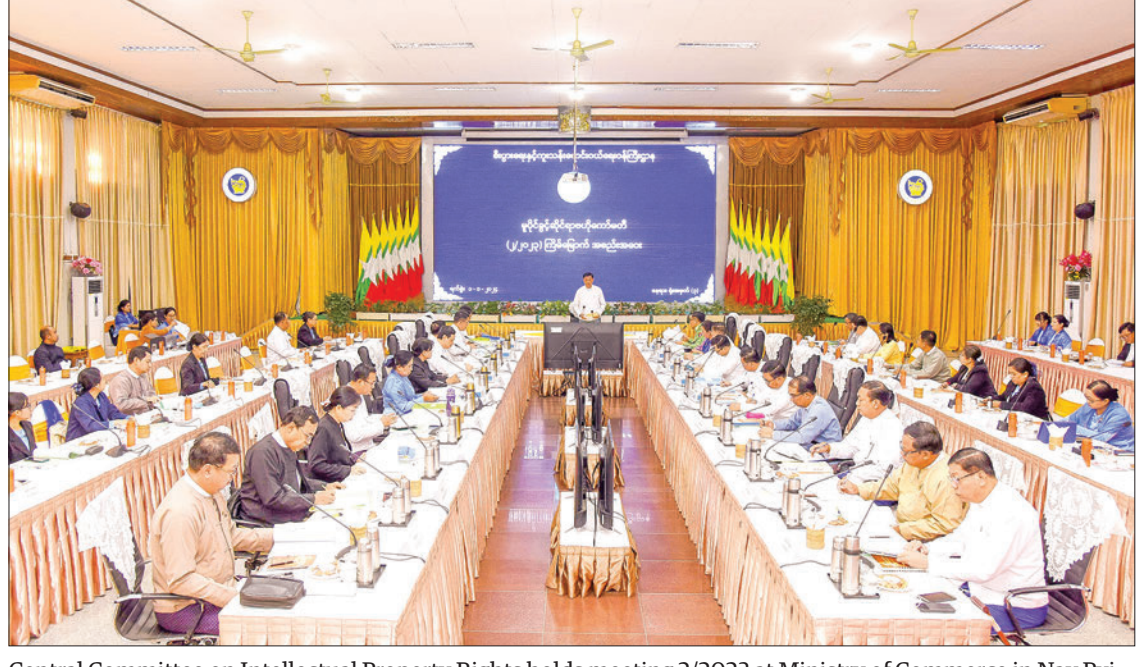
Central Committee on Intellectual Property Rights holds meeting 2/2023 at Ministry of Commerce in Nay Pyi Taw yesterday.

The General also said, out of four copyright laws, the Trademark Law came into force on 1 April 2023, and the registration of trademarks was officially accepted on 26 April this year. Similarly, the Patent Law and Copyright Law came into force on 31 Oc-