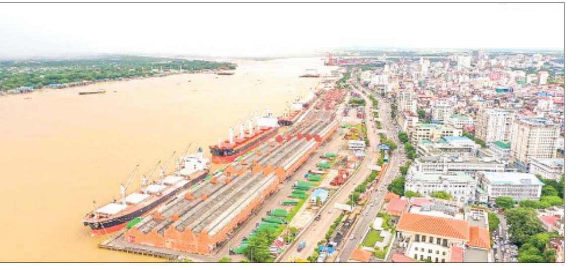
An aerial view of international port in Yangon.

Demand for sesame has also surged during the new year period. Sesame shipments