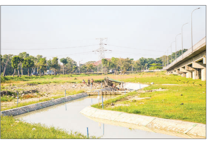
The start of modern park seen in the plot of land under the Bavintnaung Bridge in early December.

Previously, the beauty of the city and the charm of the two bridges were affected due to encroaching tents, but at the time being construction works are being implemented quickly so that the public and tourists can rest and relax.