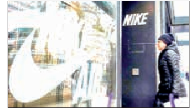
Nike executives described heighten consumer caution as is targets up to $2 billion in cost cuts.

"We are seeing indications of more cautious