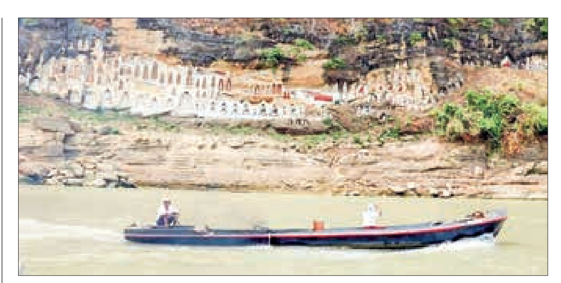
Serenic View: Akauktaung Pagoda along the Ayeyawady River.