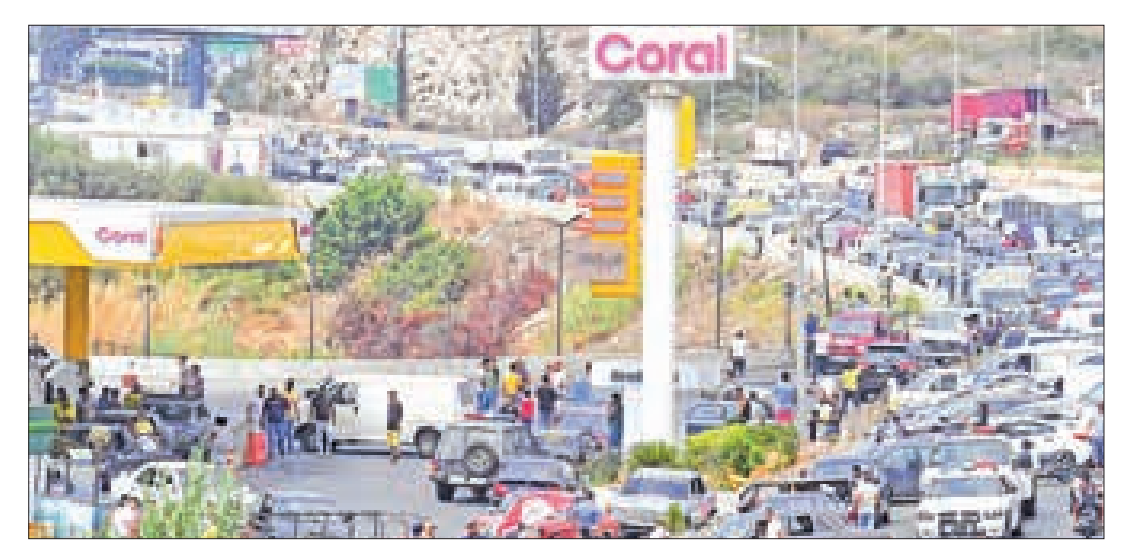
Cars queue in a long line outside a gas station due to the fuel crisis at Jieh region in southern Beirut,

The impact of the conflict had reversed a slight recovery for Lebanon, which has battled a deep economic crisis for years, the Washington-based bank said in a report.