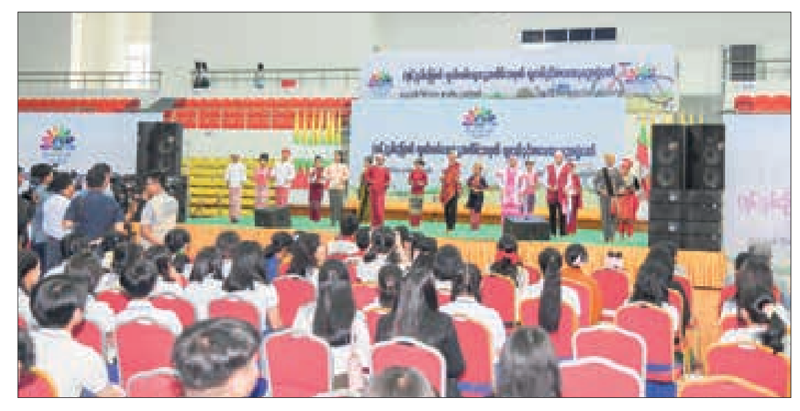
The winding up event of the Youth and Literary Fine Arts Festival in progress yesterday in Nay Pyi Taw.

THE Youth and Literary Fine Arts Festival commemorating the 76<sup>th</sup> Independence Day continued its third day yesterday. It came to a successful conclusion with the strong participation of government personnel, teachers, students, youths and enthusiastic people.