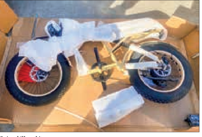
Seized illegal item.

During inspections on 20 December, the on-duty teams seized 30 kinds of goods worth K4,192,600, including 29 bags of SCG cement (50 kilogrammes each) and 240 bottles of Chang beer without official documents from a motorboat near Thahtay Island in Kawthoung township, four kinds of goods worth K11.568 million including 14,400 bags of Oupai Wipe tissue that were not