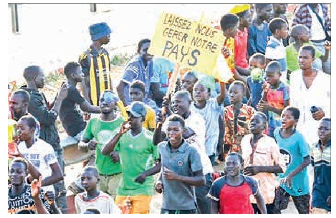
'Let us manage our country': The Nigerien army wants France out.

They were forced to leave fellow former colonies Mali last year and Burkina Faso earlier this year following military takeovers in those countries too.