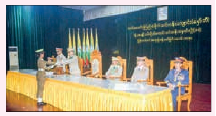
The commissioning ceremony for the 10<sup>th</sup> intake of female cadet course in progress yesterday.

The ceremony was to appoint female cadets who graduated from the school with the rank of second lieutenant. The female cadet training course was opened in 2014 with the aim of producing qualified officers for Tatmadaw. As female graduates who have completed the training, they must serve in the relevant (Army, Navy and Air) corps. — MNA/KZL