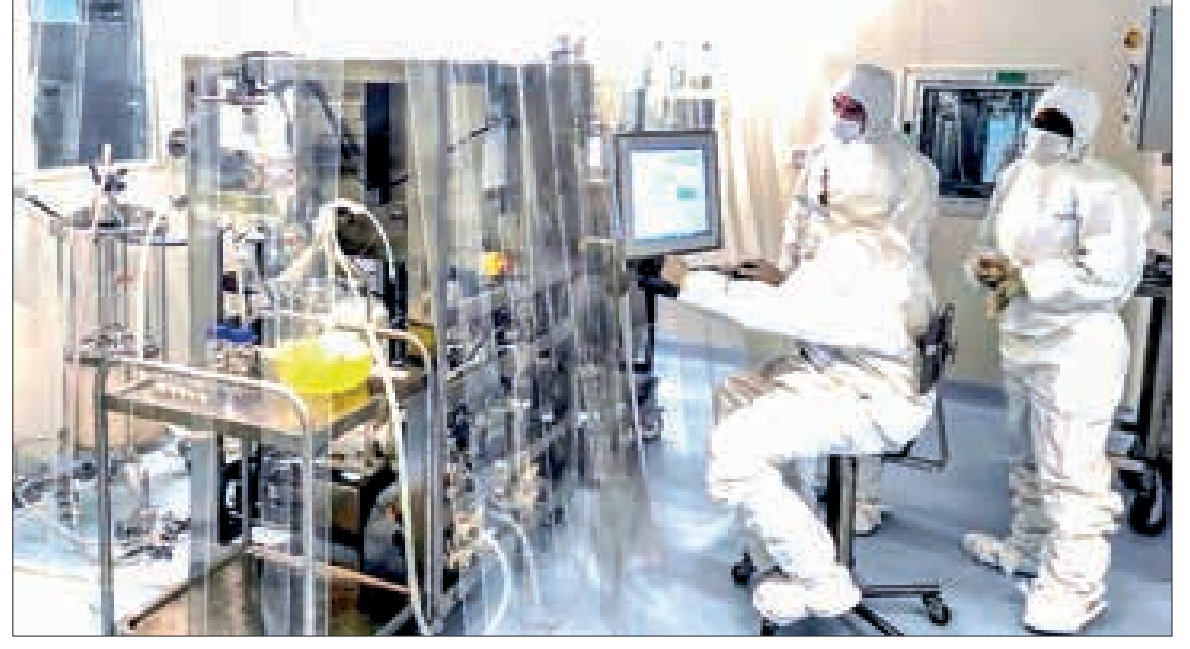
AI-driven advancement in biotechnology with implications for medication discovery, disease diagnosis, and environmental monitoring.

Developed in the Baker Lab, these programs allow scientists to create functional proteins more efficiently than ever before. By combining these tools in new ways, the team generated