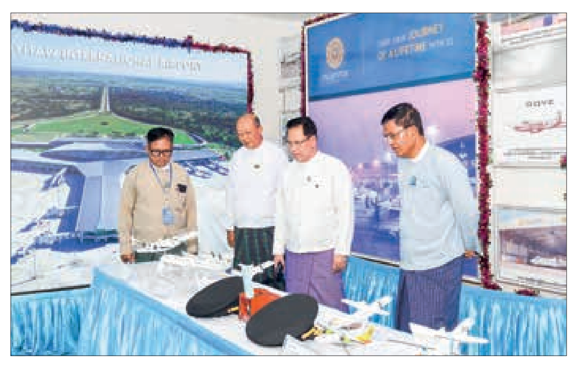
Union Minister U Maung Maung Ohn (2R) and Union Minister Jeng Phang Naw Tung (3R) view round the exhibition yesterday.

The festival was organized from 20 to 22 December, aiming at sharpening the intelligibility and critical thinking of youths, motivating the young people to read books and publications, know the advantages of literature, uplift patriotic spirit, prestige and integrity through literature and fine arts, adore the independence of the nation with the knowledge of independence struggle and sufferings in the colonial era, enjoy peace, stability and beautifying scenes of the country with development activities as well as panoramic rural scenes to have the soul for adoring the relevant regions and states, and quickly know endeavours of relevant ministries through the displays of booths at the event. --- MNA/ KTZH