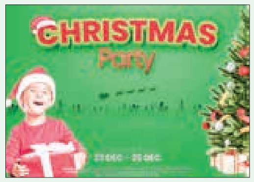
The image depicts the advertisement of the Christmas Party at Yangon Zoo.

Upon its re-operation in the next financial year, No 2 Steel Mill (Pangpet) will contribute to producing pig iron, which will be supplied to No 1 Myingyan Steel Mill for the steel melting process.