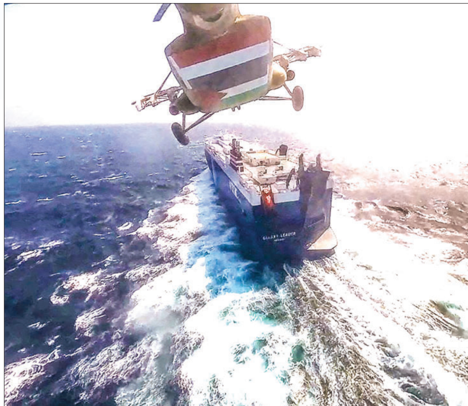
Houthi military helicopter flies over the Galaxy Leader cargo ship in the Red Sea in this photo released 20 November 2023.

The Israel Defence Forces (IDF) launched a large-scale operation in Gaza to thwart Hamas. However, the military effort resulted in massive civilian casualties, prompting the international community to call for a ceasefire. The Houthis said they would continue the naval attacks until Israel halted its assault on Gaza. — SPUTNIK