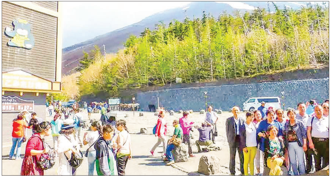
In November, Japan welcomed 2,440,800 foreign visitors, surpassing two million for the sixth straight month.

The number of foreign visitors is on the pace to reach around 25 million by the end of the year. The government aims to surpass the highest annual figure recorded in 2019 — 31.88 million — in 2025. — Kyodo