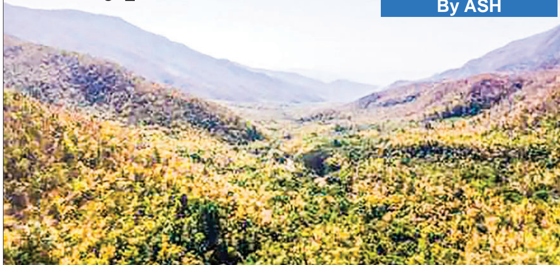
A distant view shows Hanlin Hill protected public forest designated on 11 March 2022 in Ywangan Township of southern Shan State.