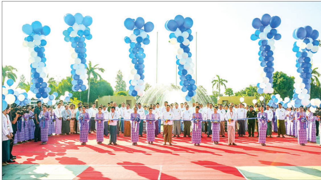
The inaugural event of the 22 nd Myanmar Traditional Medicine Practitioners Conference and Myanmar Traditional Medicine Seminar in progress yesterday.

Currently, the Vice-Senior General highlighted that as the government is encouraging the traditional medicine sector, Myanmar traditional medicine prac-