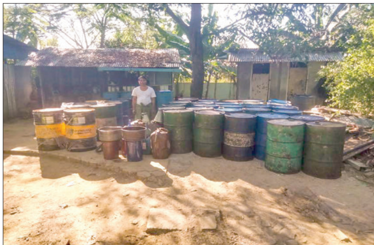
The photo shows illegal storage of fuel oil in Kyauktan Township.

Officials verified that some people did not sell fuel, transported it to other places with the bowser without permission, and sold more than the specified reference price in some townships of Mandalay Region, Sagaing Region and Yangon Region. Therefore, under the law on petroleum and petroleum products, fines were imposed according to the administrative method, the licence was suspended for a