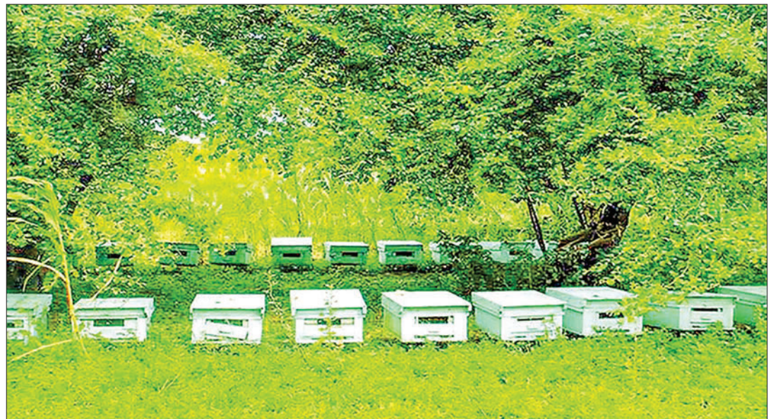
Some state-owned beekeeping stations have 6,200 beehives in 31 townships and over 950 private beekeeping businesses with nearly 200,000 beehives.

ing will also build the network between those engaged in garment factories and those hunting jobs from regions outside Yangon to create job opportunities for residents. Thus, the training will also help find employment. Those who wish to attend the training can enrol through the following contact numbers: 09 940858350, 09 450723262, 09 9403912570, 09 784085794 and 09 969865024. — NN/EM