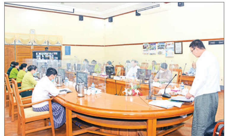
The coordination meeting on drafting bylaws for registration of rights related to literature and arts was conducted in August 2022.

For further information, inquiries can be directed to 067 430571, said the Ministry of Commerce. — TWA/TMT