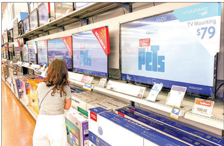
A Walmart store in Los Angeles.

"An upside surprise in the figures is crucial to bolster the credibility of the Federal Reserve's efforts to push back against market rate cut expectations. Failure to see an upside surprise could challenge the Fed to counter expectations of a rate cut in March. — AFP