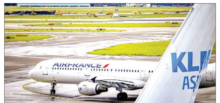
During the 2020 aviation sector downturn, the group received billions in euros, later repaid with interest. PHOTO: AFP

The court noted that Ryanair and Malta Air had argued that the measures were "contrary to EU law". — AFP