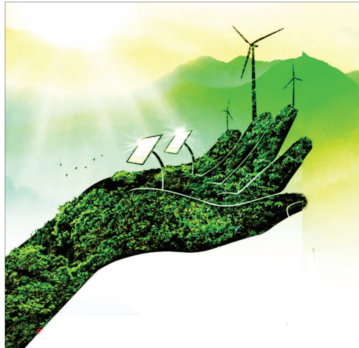
24 NOVEMBER, 2023

When biomass — agricultural waste like plant husks, stalks, and wood — is burned, or even when it simply decomposes, it releases CO 2 and other climate-changing gases like methane and nitrous oxide into the atmosphere. But if biomass is heated without oxygen, those substances are trapped in a black ashy substance called Biochar. Farmers have known for thousands of years that Bio-