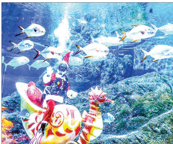
A diver dressed in a Santa Claus costume performs at the Bangkok Ocean World in Bangkok, Thailand, 19 December 2023.

Divers here dressed in Santa Claus costumes perform underwater with various kinds of marine animals, creating a different Christmas vibe for visitors. — Xinhua