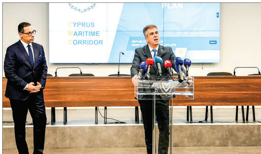
Israeli Foreign Minister Eli Cohen and his Cypriot counterpart Constantinos Kombos discussed the logistical details of a Cyprus plan to set up an aid corridor for the besieged Gaza Strip.

Cyprus is prepared to deliver significant aid through this “maritime lifeline” to provide sustained humanitarian assistance to Gaza civilians, according to Kombos.