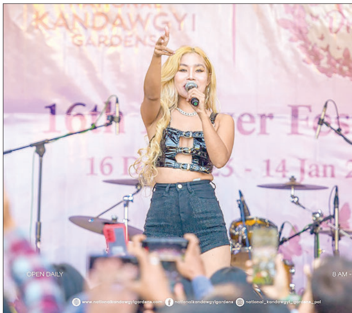
A singer performing at the Bazaar Stage of the 16 th Flower Festival

PyinOoLwin National Lake Garden covers 436.96 acres — 366.96 acres of land and 70 acres of water. The National Lake Garden was built in 1924 and has now been leased for 15 years to the Htoo Group of Companies starting from 2010. — ASH/TRKM