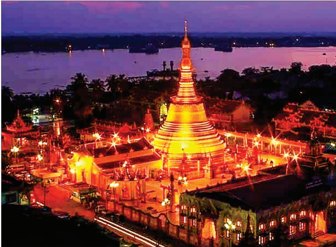
The photo shows the Botahtaung Pagoda in the night view.