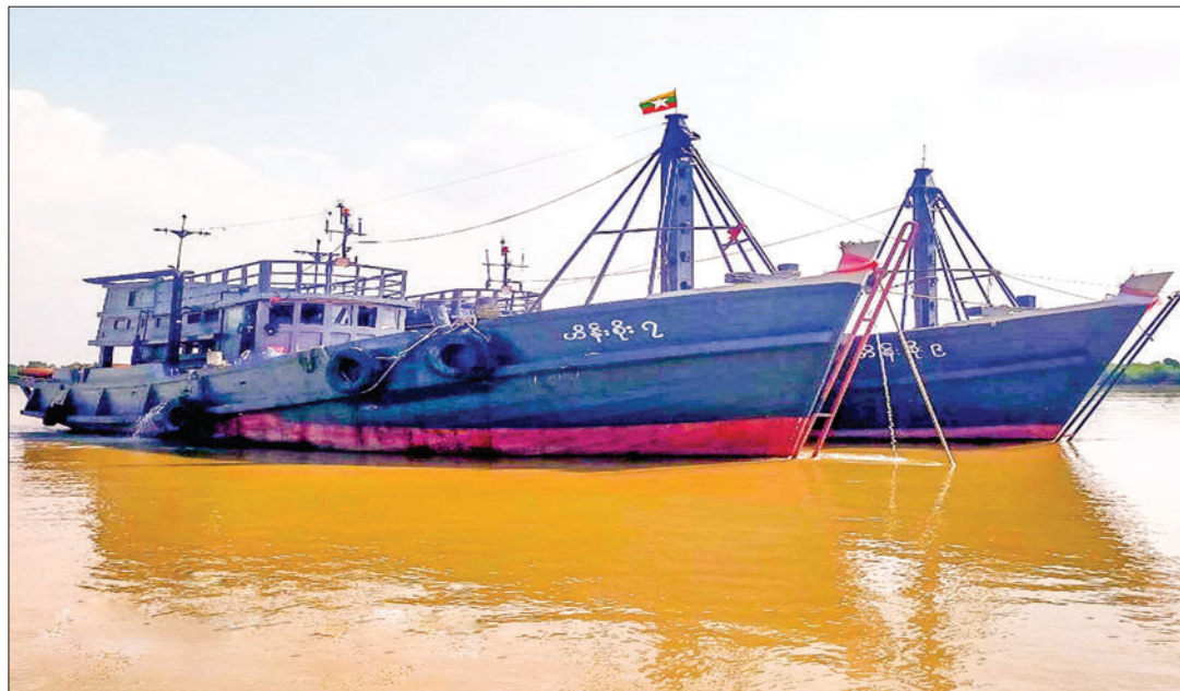
Confiscated boats seen in Twantay Canal.

Six arrests were made on three consecutive days from 19 to 21 December, with an estimated value of K892,932,020, as reported by the Illegal Trade Eradication Steering Committee. — MNA/MKKS