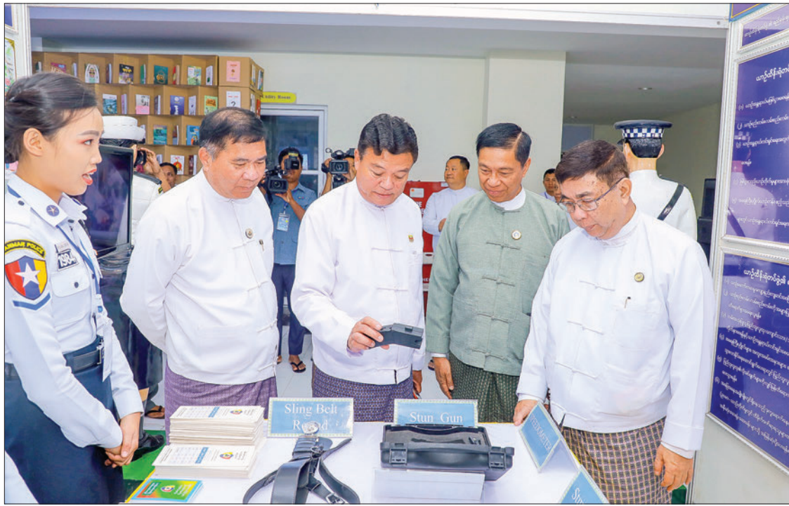
Union ministers view round the exhibition of 16 ministries at the 76 th Independence Day Youth and Literary Fine Arts Festival yesterday.

The Youth and Literary Fine Arts Festival is to be held in high esteem by all citizens to make them aware of the history of Independence Day and the