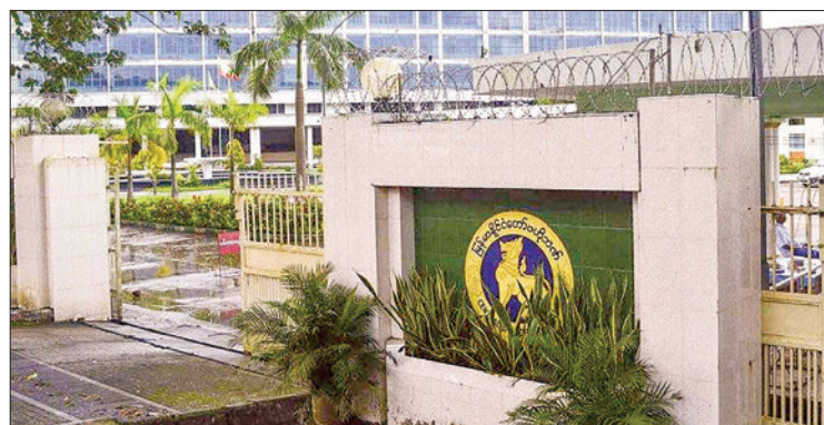
The office building of the Central Bank of Myanmar (CBM).

The committee is inspecting the petrol stations to see whether