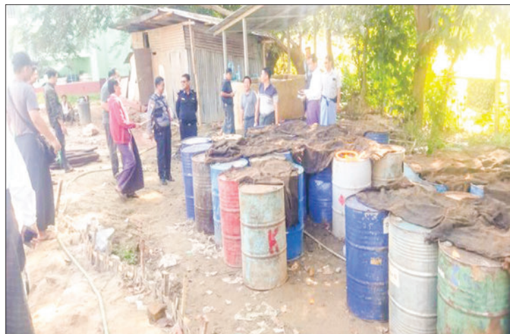
Officials confiscate illegal storage and sale of fuel oil in Hmawby Township.

limited time, and illegal petrol vendors were temporarily closed.