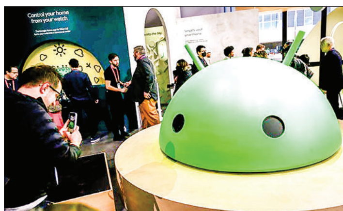
As part of the settlement, Alphabet will make changes to its Google Play app store to reduce competition barriers for developers.

GOOGLE parent Alphabet has agreed to pay $700 million as part of an antitrust settlement made public on Monday,