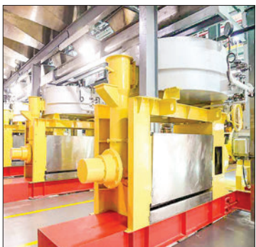
Oil milling machines are seen at a mill in Magway Region.

The ministry called for a loan proposal for the first time