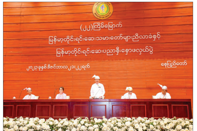
The 22 nd Myanmar Traditional Medicine Conference and Seminar in progress yesterday in Nay Pyi Taw.