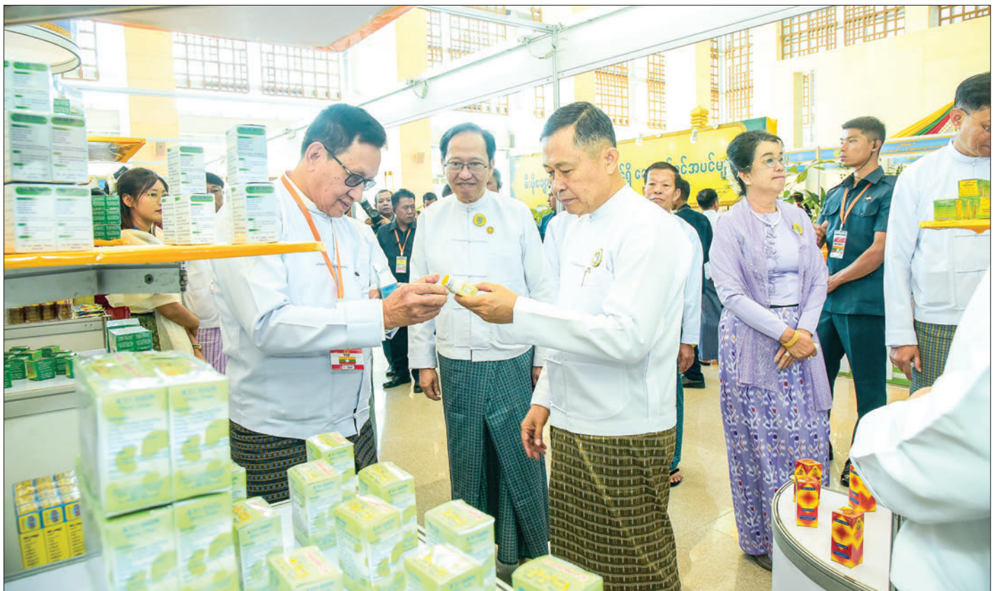
State Administration Council Vice-Chairman Deputy Prime Minister Vice-Senior General Soe Win views round the exhibits at the event yesterday in Nay Pyi Taw.

At the conference, he highlighted that experienced traditional medicine practitioners will have the chance to exchange experiences and knowledge on Myanmar traditional medicine with new generations.