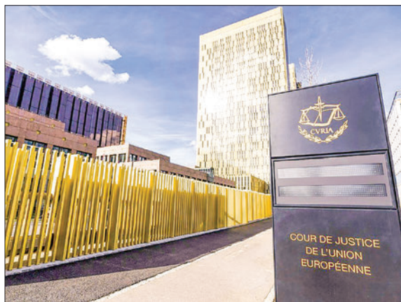
The ruling by the European Court of Justice was based on UEFA rules prior to the changing of them in 2022.

UEFA stated that Thursday's ruling by the top European court, which found both UEFA and FIFA guilty of breaking EU law to hinder the formation of a rival Super League, does not imply support or approval for the breakaway competition.