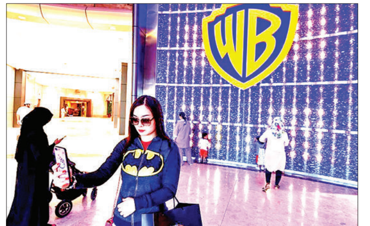
While far from certain, a merger between Warner Brothers Discovery and Paramount Global could spark further consolidation in the media and entertainment industry.

company, about the potential for a deal, Axios reported. — AFP