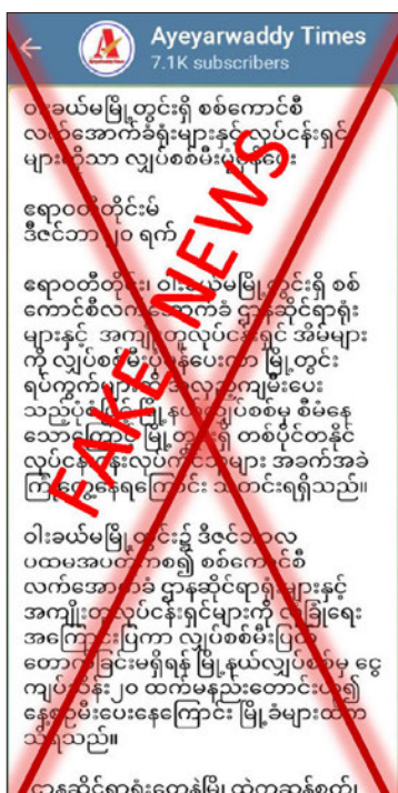
Screenshot validates wrong reports.

AYEYARWADDY Times has spread false information on social networking sites that only departmental offices and business operators in Wakema, Ayeyarwady Region, receive electricity regularly, while other urban areas are supplied with electricity alternately.