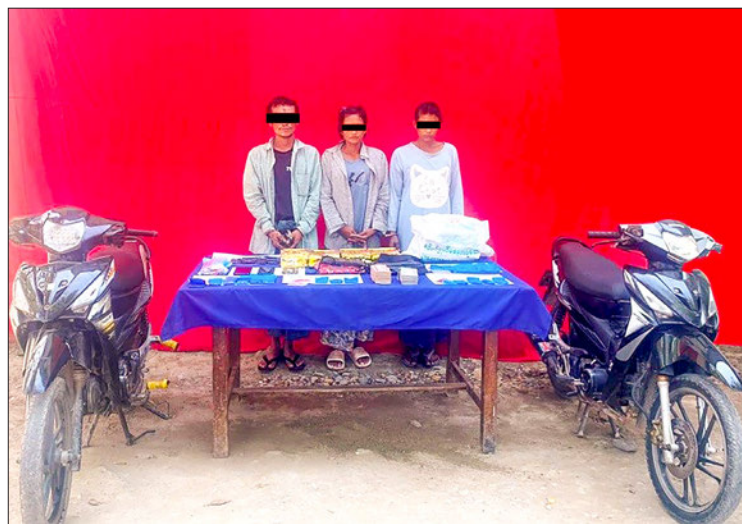
Three offenders seen alongside seized drugs and motorbikes.

THE Myanmar Police Force reported the seizure of over K10.28 billion worth of illegal substances, including Ice (methamphetamine), stimulant tablets, and heroin in Chanmyathazi township of Mandalay Region.