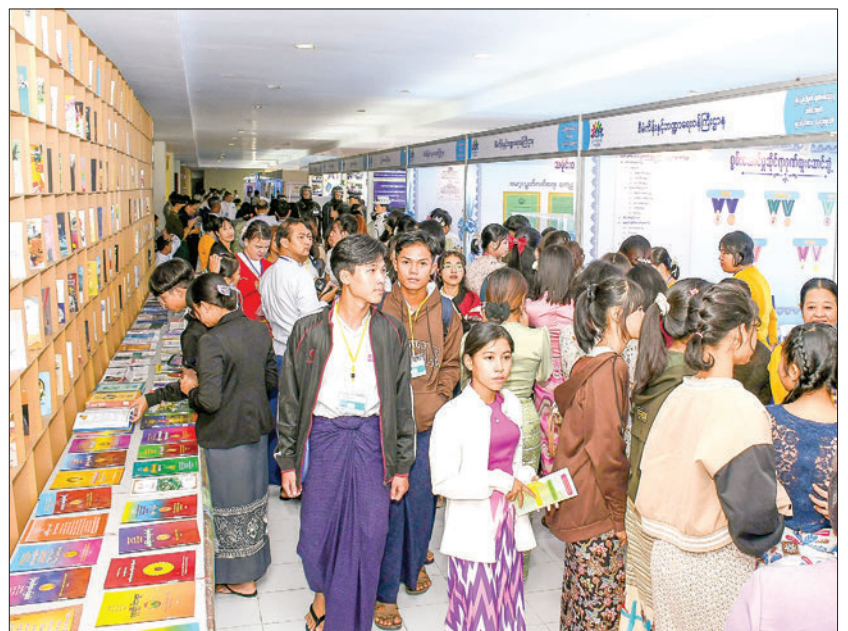
Visitors through the exhibition yesterday.

More than 10,000 people, including students, visited on the second day of the festival, whereas the bookshops sold over K2.7 million of books, and the ethnic food stalls earned over K14 million. — Than Min Aung/Aung Ye Thwin/KTZH