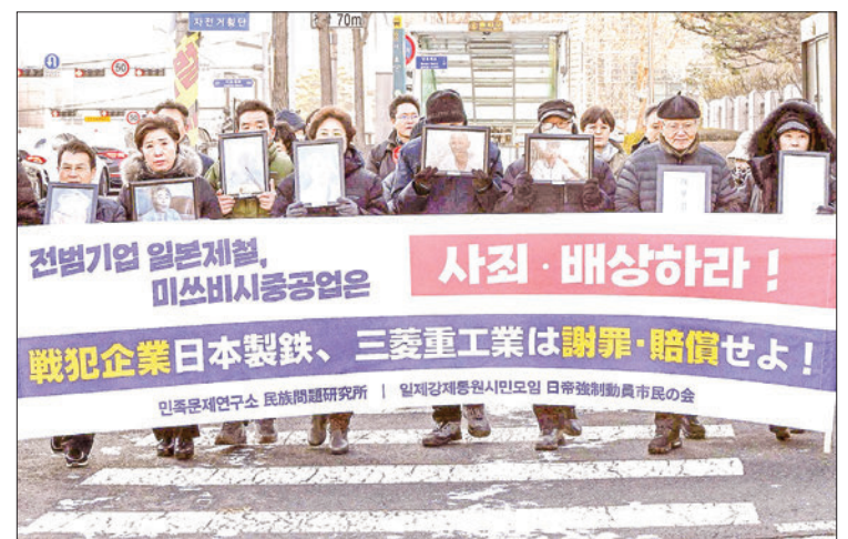
Families of deceased plaintiffs in lawsuits over wartime forced labour during Japan's colonial rule hold up a banner outside South Korea's Supreme Court in Seoul on 21 December 2023.

In a bid to improve bilateral ties that had deteriorated after the 2018 rulings, Seoul said in March plaintiffs who have won lawsuits over forced labour during Japan's 1910-1945 colonial rule would receive compensation from a South Korean government-backed foundation rather than the sued firms. — Kyodo